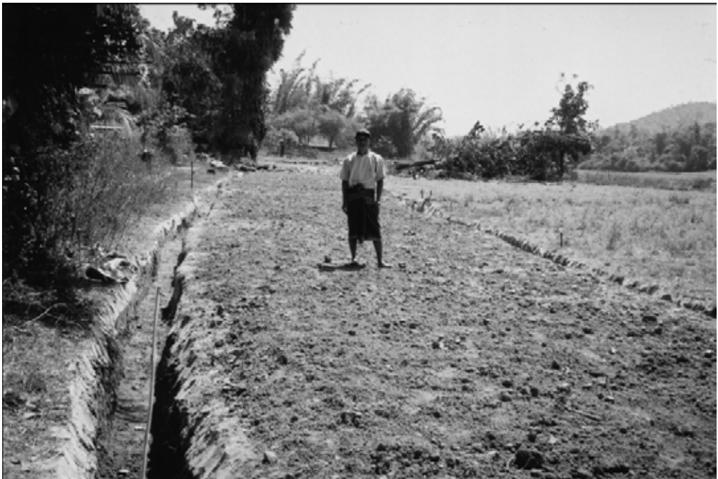
A section of the Kyaik Khaw - Ka Ma Maung road which villagers are being forced to build from Thaton District to southern Papun District, shown here in late February 2006. This segment lies between T'Kaw Bo and Meh Bpu villages. The photo below shows villagers doing forced labour digging a drainage ditch which will run alongside the road; women, men and children have all been forced to do this work to meet deadlines set by the SPDC.