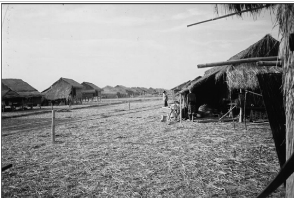
The barren landscape of Plaw Law Bler relocation site, Nyaunglebin District where soldiers forcibly relocated villagers in April 2006. Villagers interned at Plaw Law Bler have complained about the scarcity of water, lack of arable land and movement restrictions imposed on them which prevented them from returning to cultivate their former rice fields.

Relocation orders are sometimes delivered orally at meetings with village leaders, and sometimes written and sent to village leaders or tacked to a tree in the village. In areas where villagers routinely flee any contact with the Army, no notice is given, the village is simply attacked and any villagers caught are either killed or force-marched to the relocation site. In relocation order documents, military officers threaten retaliation against those who fail to move by the specified deadline, using phrases such as 'anyone found in the village after this date will be considered as enemy'. Despite such threats, most villagers are aware of the conditions of exploitation prevalent at relocation sites and are averse to any relocation that entails a loss of both their land and their freedom, so they often resist eviction through various forms of negotiations and payments. If these strategies prove ineffective in placating the officers involved, many villagers choose to move with their communities into the surrounding forest or further to refugee camps in neighbouring Thailand.