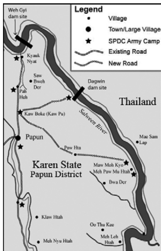
Map of eastern Papun District with new roads the SPDC has been constructing in support of the planned Weh Gyi and Dagwin dams. The route of these roads runs indiscriminately through the farm fields of local villagers. [Map: KHRG]

In eastern Papun District, the rampant construction since 2006 of new roads and military camps throughout areas previously outside SPDC control appears to be motivated at least in part by the need to secure the area around the sites of the proposed Weh Gyi and Dagwin hydroelectric dams to be built by the SPDC on the Salween River in partnership with Thailand. In December 2006, SPDC IB #8, following the orders of the Operations Commander based at Papun town began arranging for the construction of three new roads linking Kaw Boke (Kaw Pu) to the dam sites along the Salween. The first of these ran north along a pre-existing route to Kyauk Nyat, the site of the proposed Wei Gyi dam. The second road ran northeast to an SPDC camp located along the Salween at the site of the proposed Dagwin dam. The third roadway ran southeast through Paw Hta village and on to the SPDC camp at Maw Moh Kyo along the Salween. At a meeting at Kaw Pu army camp to which the village heads of Paw Hta, Oh Kaw and Hto Mo Pwa Der were summoned, an officer from IB #8 informed the villagers of the impending road construction. At this time one of the village heads replied, " Commander, if you build this road some of our paddy