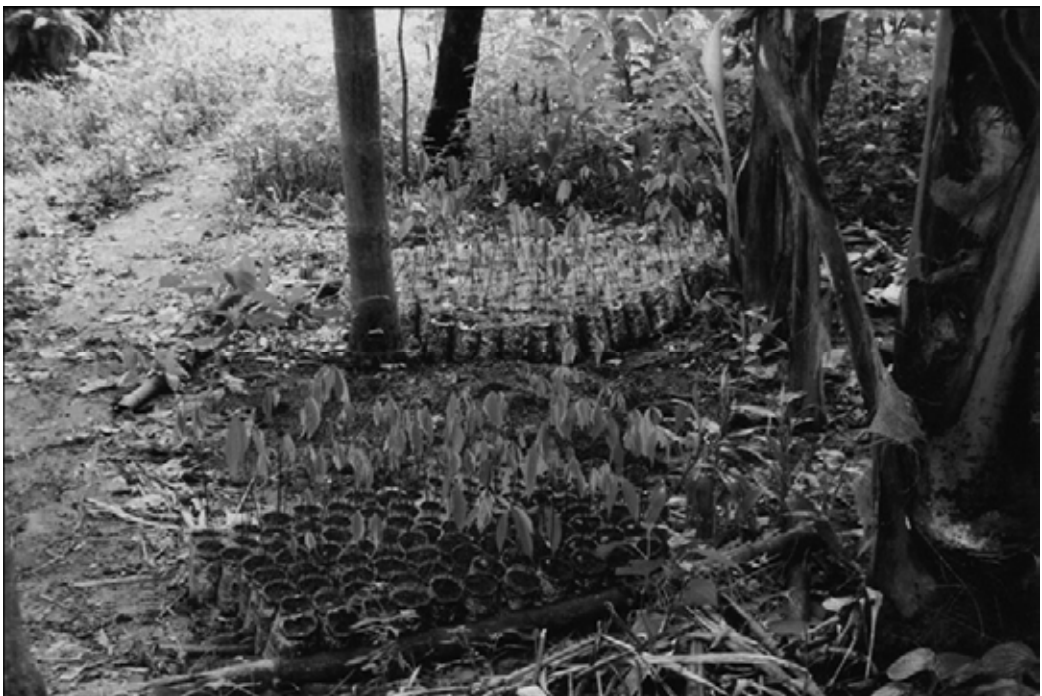
A collection of young castor plants near the roadside in Dt'Nay Hsah township, Pa'an District, where the SPDC has forced villagers to plant them.

In expectation of the purported uses of castor the SPDC has been forcing villagers throughout military-controlled areas of Karen State to purchase the unfamiliar seeds and plant them on any and all available land, even to the extent of replacing their traditional crops. Having demanded that villagers attend meetings where they are told they must plant castor, local SPDC officials then force them to pay arbitrary prices for the purchase of the seeds.