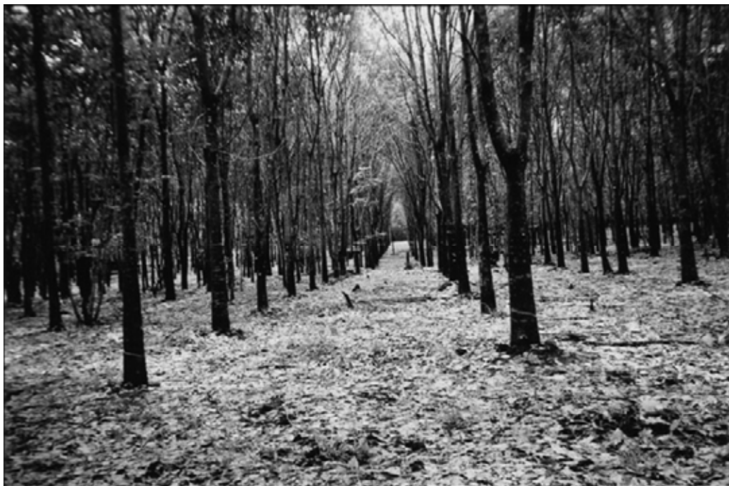
An SPDC rubber plantation in Dt'Nay Hsah township, Pa'an District. The SPDC regularly forces local villagers to weed the land, clear brush and cut back branches without pay.