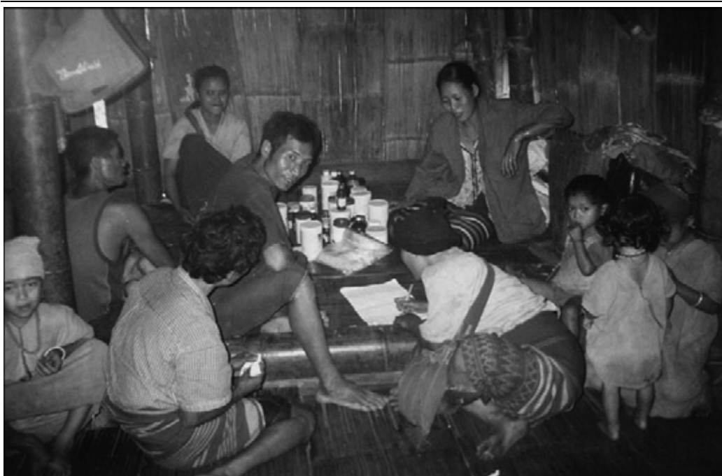
Medics from a Karen relief organisation visit villagers in Lu Thaw township to whom they can provide a limited amount of medicine and treatment.

Beyond primary treatment these groups also provide training for traditional birth attendants (TBAs) and medics. As those trained are local villagers, their increased knowledge and abilities strengthen community control over health and welfare. Although the SPDC has also conducted trainings for TBAs and medics, these trainings are forced and villagers must cover all costs on top of the initial fees demanded.