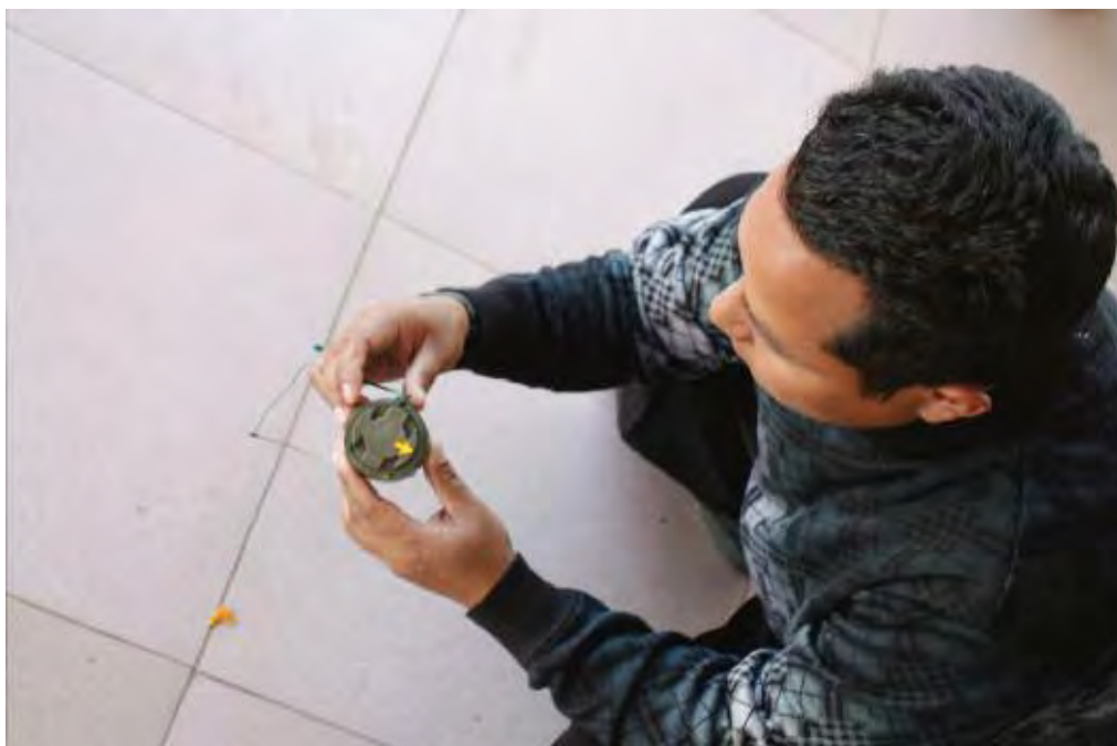
A Kachin medical doctor treating civilian and military victims of antipersonnel mines in the KIA's eastern division holds a Burmese army landmine. He told Human Rights Watch that mine-related casualties are on the rise: "The difference between Kachin and Burmese landmines is that the KIO mine blasts shrapnel inside the body, whereas the Burmese one is not shrapnel, but a blunt force explosion, usually taking an entire limb."