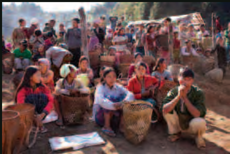
Displaced Kachin civilians living in temporary shelter in KIA-controlled territory in eastern Kachin State, wait for rations of rice and cooking oil, January 26, 2012. Over 1,000 civilians have fled their homes to this area to escape the fighting between the Burmese army and the KIA.

Human Rights Watch calls on the Burmese government to support an independent international mechanism to investigate violations of international human rights and humanitarian law by all parties to Burma’s ethnic armed conflicts. The government should also provide United Nations and humanitarian agencies unhindered access to all internally displaced populations, and make a long-term commitment with humanitarian agencies to authorize relief to populations in need.