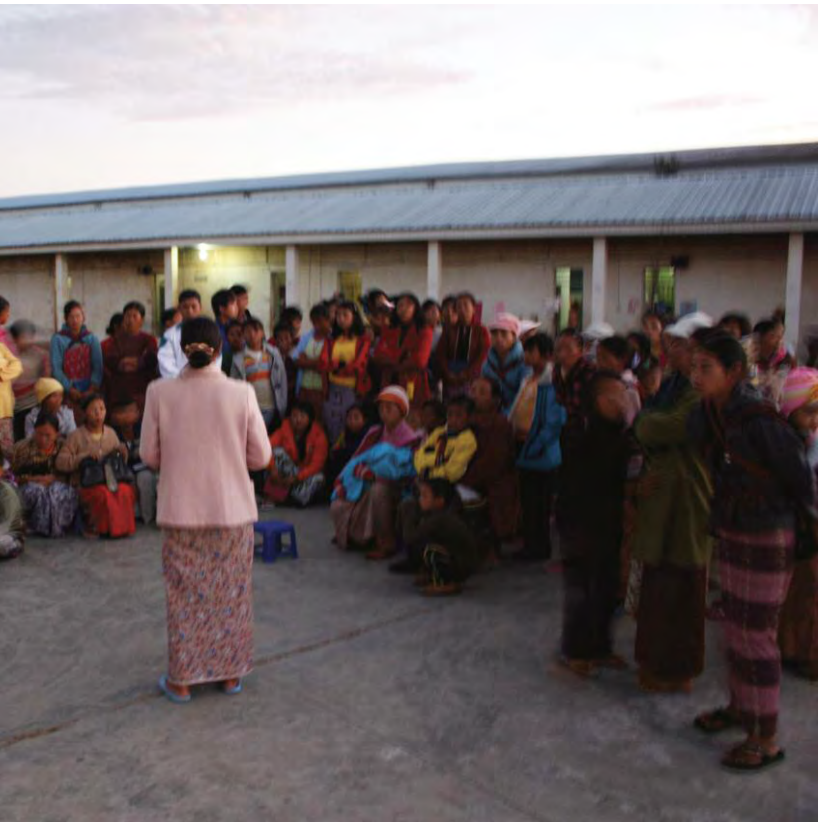
A female Kachin minister leads a group of displaced persons in prayer outside a makeshift IDP camp in Maijayang in the KIA's eastern division.