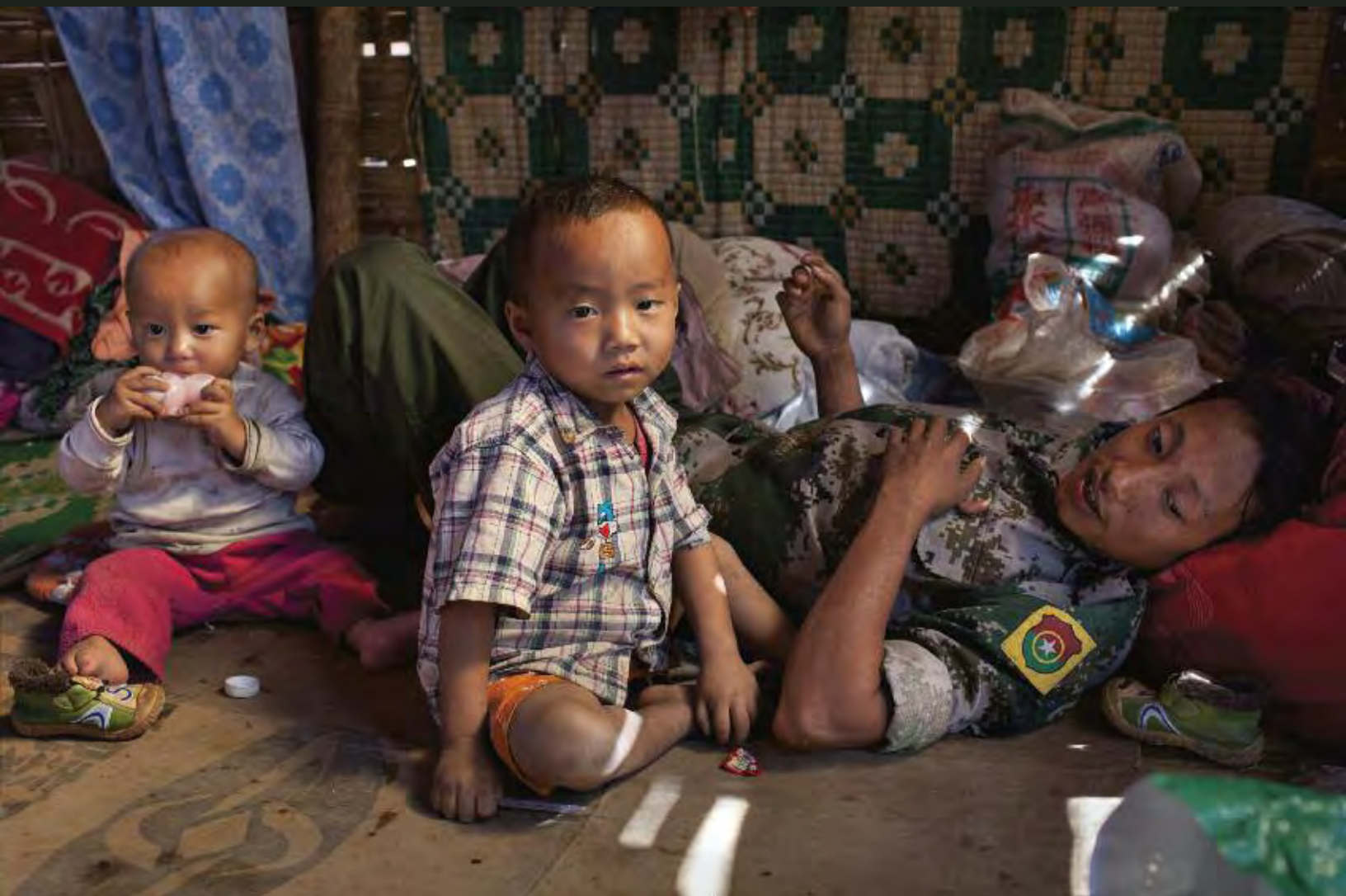
A KIA officer visits his displaced family at their temporary shelter outside Laiza, Kachin State, January 29, 2012.