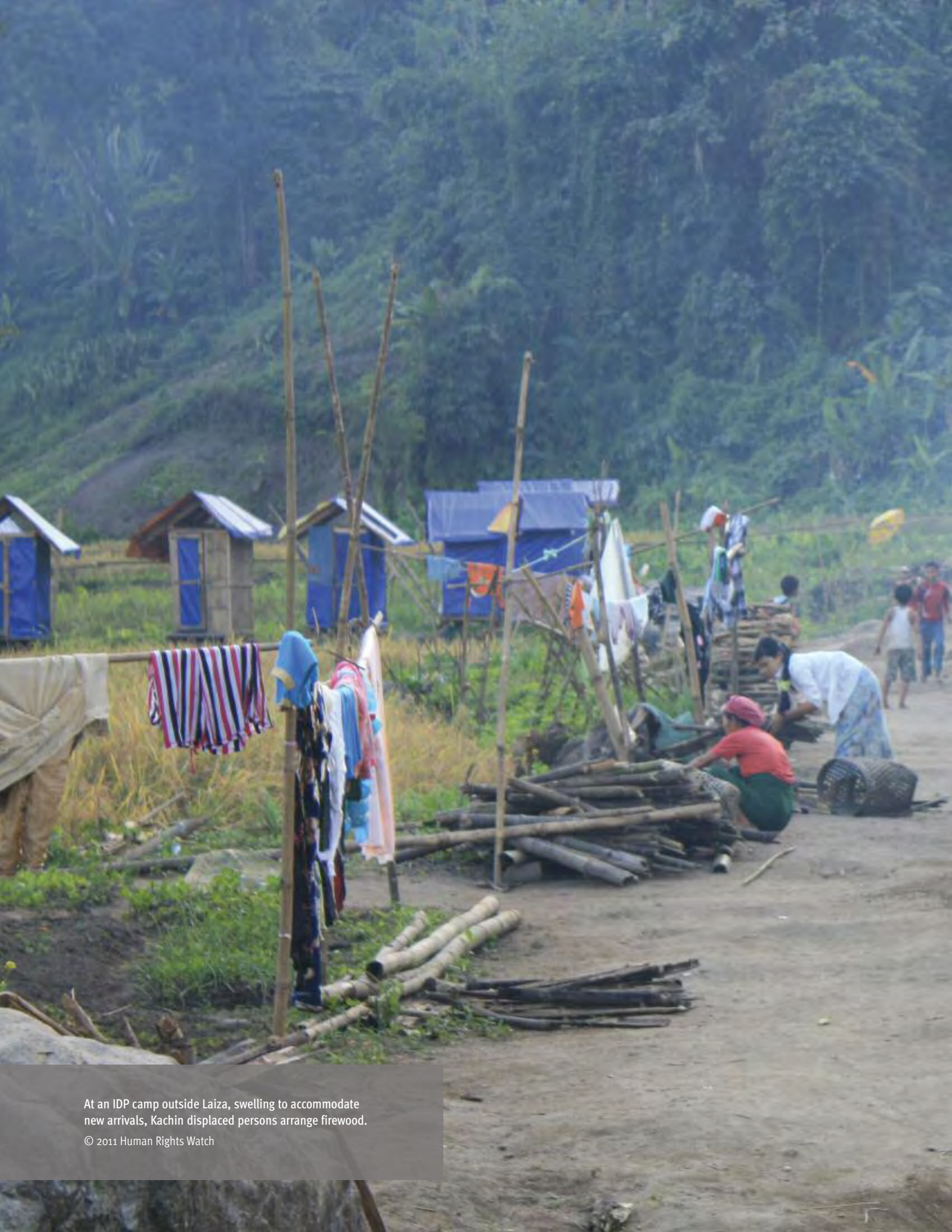
At an IDP camp outside Laiza, swelling to accommodate new arrivals, Kachin displaced persons arrange firewood.