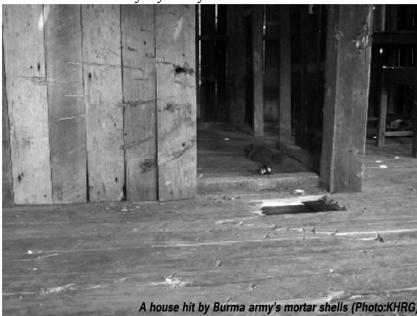
A house hit by Burma army's mortar shells