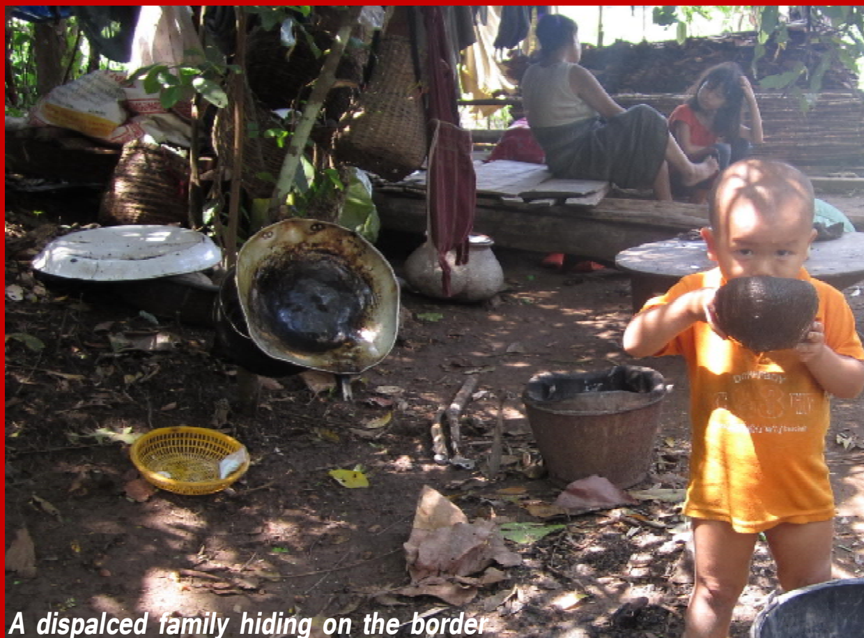
A displaced family hiding on the border