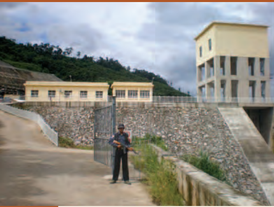
Burmese police guard Shweli Dam 1

Burma Army battalions are increasing patrols around dam sites, committing grave human rights violations.