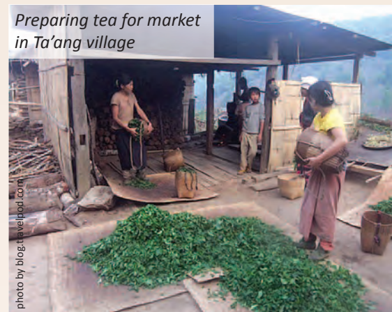
Preparing tea for market in Ta'ang village