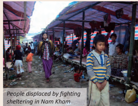
People displaced by fighting sheltering in Nam Kham