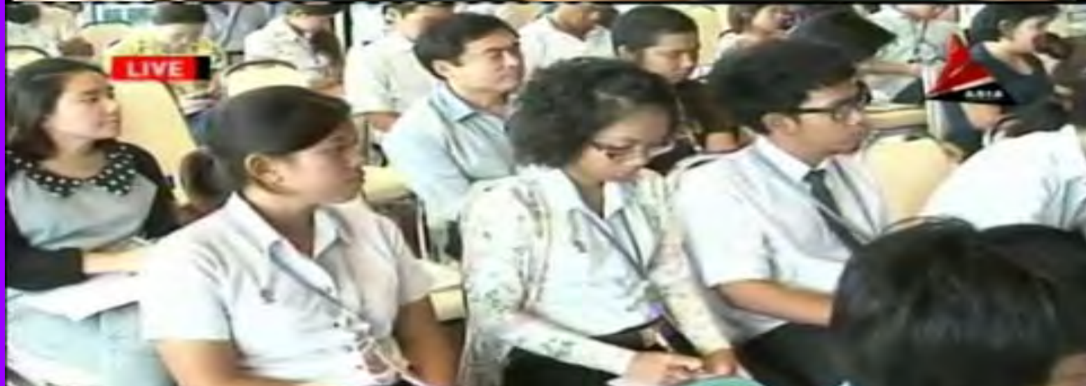
Thais participants in the NHRC's Seminar held on 24 April 2012 in Bangkok, Thailand