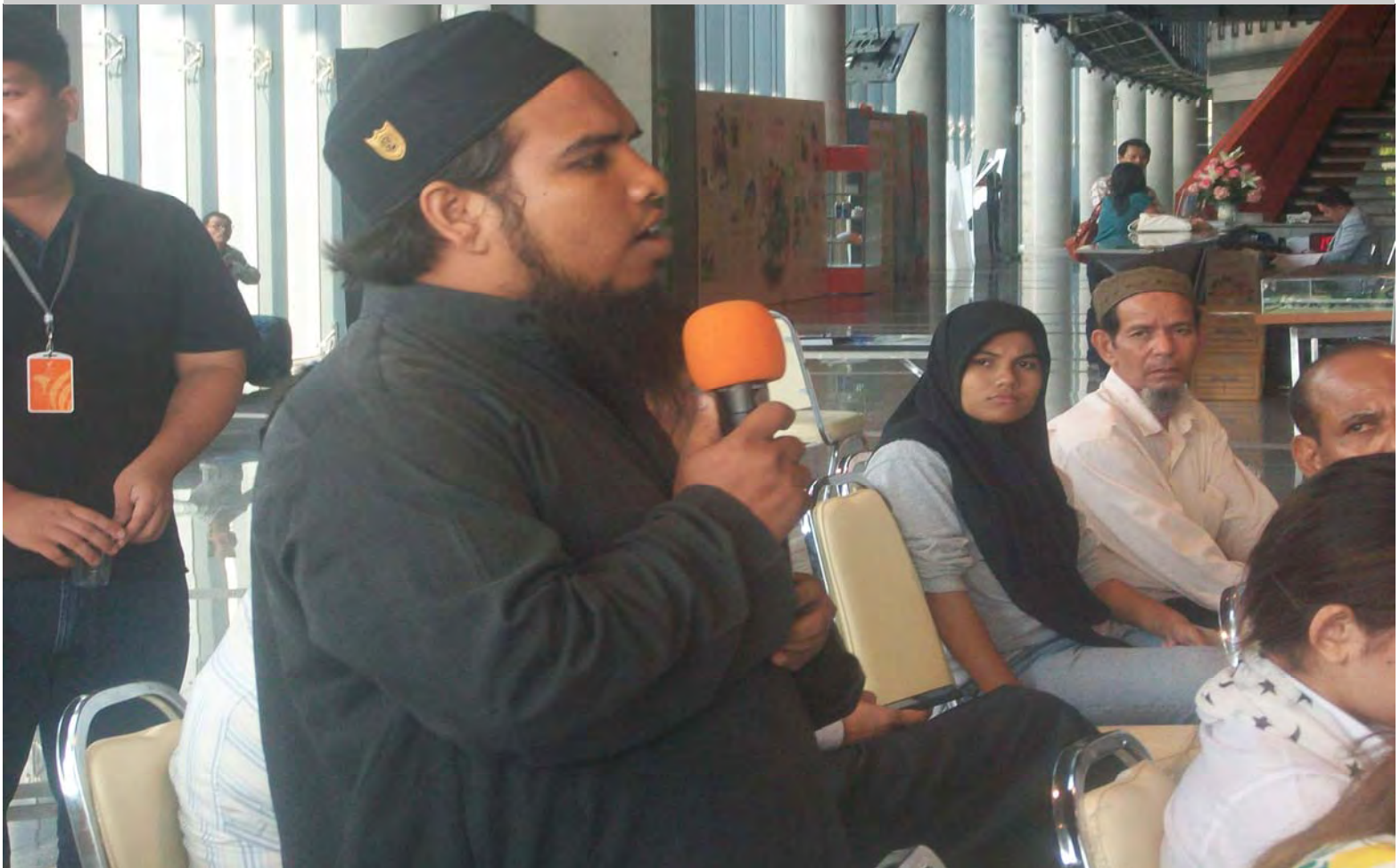
One of the Rohingya participants asking question during the question and answer session in the Seminar