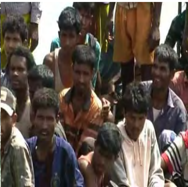
ROHINGYA BOAT PEOPLE SCOTING TO THE THAILAND DETENTION CENTRE