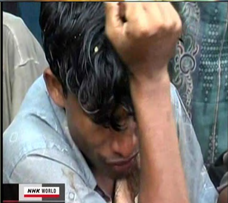
Rohingya Boat People in Thailand's detention Centre