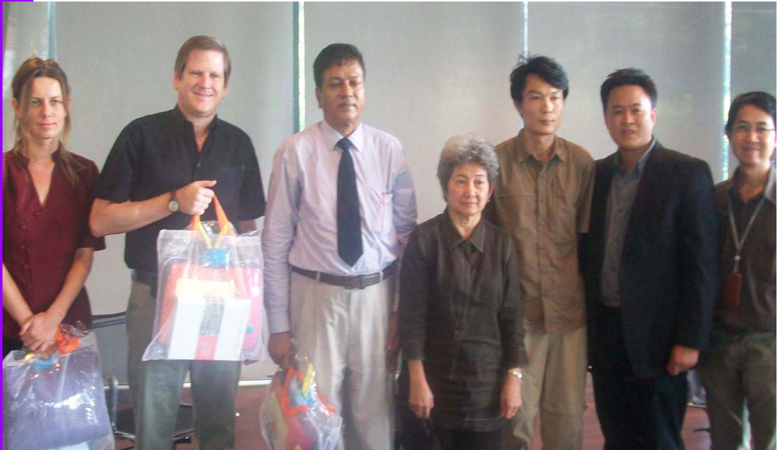
Panel of speakers in the NHRC's Seminar held on 24 April 2012 in Bangkok , Thailand