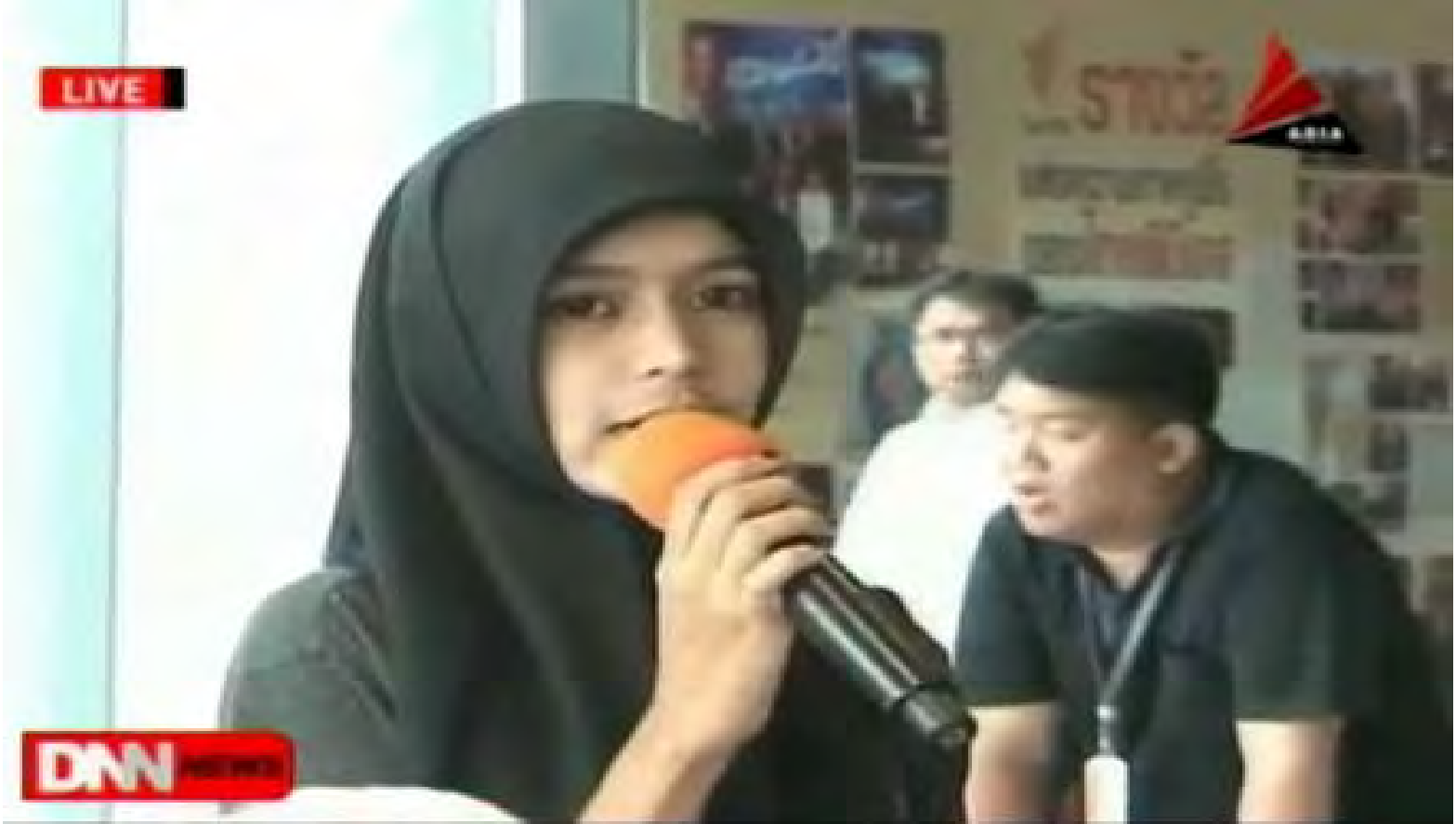
One Rohingya participant (above) and a Rohingya Female student asking question during the question and answer session in the Seminar