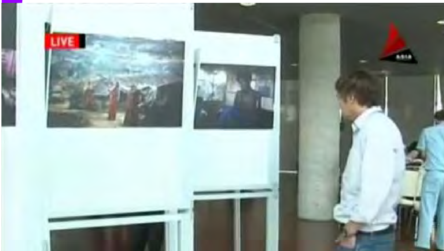
Rohingya Forced Labour still exist in Northern Arakan (above) and a visitor seeing the photo Exhibition