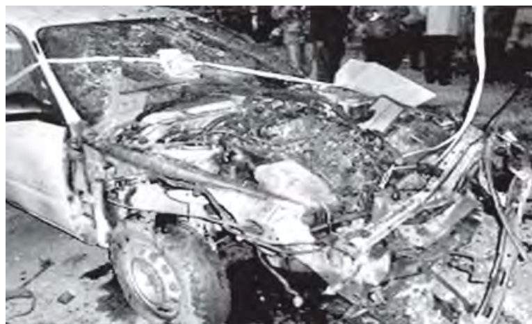
Photo shows destroyed vehicle due to bomb blast in Tatkon Ward in Myitkyina.