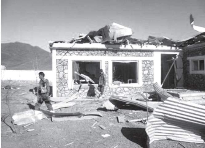
Afghan police officers walk past the outside of a clinic, damaged by an explosion in Mohammad Agha, Logar south of Kabul, Afghanistan, on 2 Dec, 2011. Afghan and NATO officials say a suicide bomber detonated a truck full of explosives outside a combat outpost in eastern Afghanistan, killing one person and wounding five people.