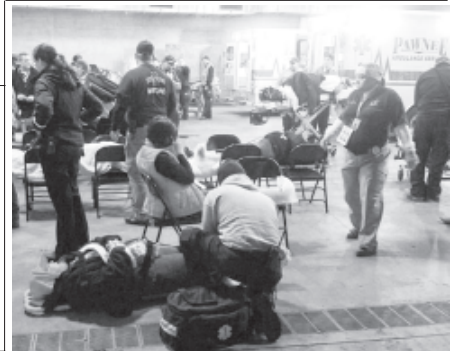
Emergency medical personnel tend to injured fans under Boone Pickens Stadium following Oklahoma State’s 44-10 win over rival Oklahoma in an NCAA college football game in Stillwater, Okla, on 3 Dec, 2011. Fans were injured during the course of celebrating, which included running onto the field and tearing down goal posts.