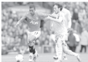
Manchester rivals United and City have 10 players between them on the shortlist.

The nominations are made in a secret ballot by the 50,000 professional