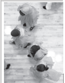
Participants in red ponchos walk out of a basketball arena to a field before attempting to assemble the world's largest human AIDS ribbon on World AIDS Day at Coppin State University in Baltimore, on 1 Dec, 2011. Organizers estimated that 1,000 people participated in the event, short of their goal of 4,000.