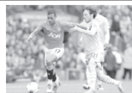
Manchester rivals United and City have 10 players between them on the shortlist.