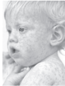
Measles is usually a mild illness - but can be fatal. — INTERNET

Among the top five mobile phone brands in the US market, Apple is the only one that saw its market share increase in the quarter, according to the survey. Samsung was still the top handset manufacturer with 25.5 percent of US mobile subscribers, followed by LG and Motorola taking the second and third place with 20.6 percent and 13.6 percent of share respectively. Research in Motion (RIM), maker of BlackBerry, ranked No. 5 with a share of 6.6 percent. —Internet