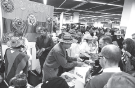
Visitors shop at the stand of Colombia during the International Charity Bazaar, which is organized by United Nations Women Guild Vienna, in Austrian capital Vienna on 3 Dec, 2011.