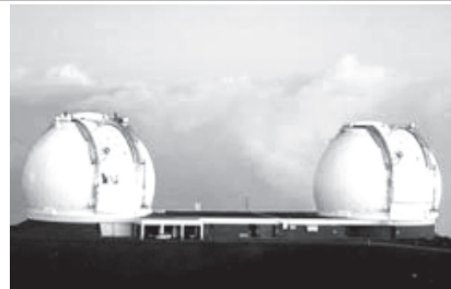
The twin telescopes at Keck Observatory in Hawaii. The astronomers used Keck to discover 18 new Jupiter-like planets orbiting massive stars.—INTERNET

few months after a different team of researchers announced the discovery of 50 newfound alien worlds, including one rocky planet that could be a good candidate for life. The list of known alien planets is now well over 700 and climbing fast.—INTERNET