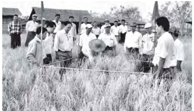
Officials seen at preparations for harvesting paddy on model plot in Mawlamyinegyun Township.—MYANMA ALIN

In measuring production of paddy per acre on model plots for Hsinthwelat paddy plantations, paddy farm of U Tun Myint of