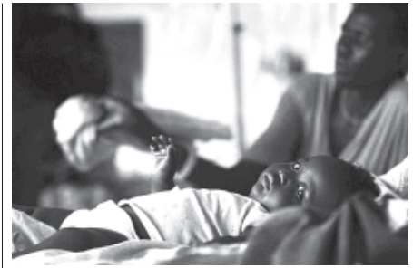
A malaria-infected baby lies in the main hospital in Juba, South Sudan. European scientists say they have identified a new way by which the malaria parasite survives in human blood, a finding that marks the latest laboratory advance against the disease.