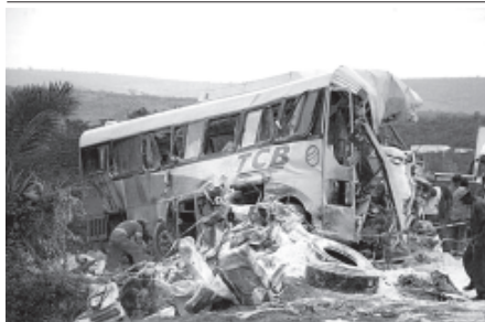
Workers check the rubble of a bus after an accident in Milagres, Brazil's Bahia state, on 3 Dec, 2011. Brazilian authorities said a tractor-trailer slammed into the bus carrying sugarcane cutters, killing at least 33 people and injuring 13 after the truck driver lost control as he was rounding a corner and heading down a hill early Saturday.