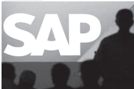
Shareholders arrive for the German software group SAP general shareholder assembly in Mannheim, 25 May, 2011.

BERLIN, 4 Dec— Germany's SAP announced a $3.4 billion cash deal to buy US web-based software company SuccessFactors, joining the scramble among technology firms to offer cloud-computing services to businesses.