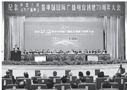
The Assembly Marking the 70 th Anniversary of the Establishment of CRI (China Radio International) is held in Beijing, capital of China, on 3 Dec, 2011.

Committee of the China (CPC) Central Political Bureau of the Committee, praised CRI's 70 years of service