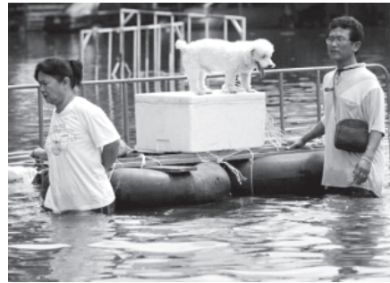
Local residents are seen here salvaging their belongings as their dog sits on top of the improvised float, in suburban Bangkok, in October.