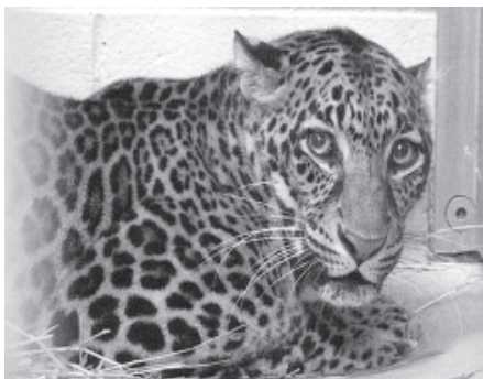
This file photo was previously provided by the Columbus Zoo and Aquarium and shows one of three leopards that were captured by authorities last month, a day after their owner released dozens of wild animals and then killed himself near Zanesville, Ohio.