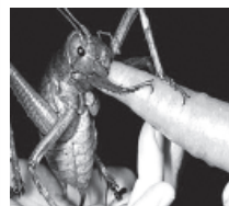
The world's largest insect

This is not good news for entomophobia sufferers. A former park ranger traveling in New Zealand has stumbled across the world's largest insect, a Weta Bug, with a wing span of seven inches and the weight of three mice.