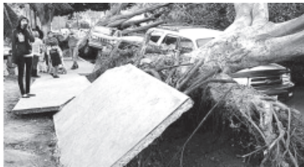
Residents look at slabs of the broken concrete pavement and uprooted eucalyptus trees after a heavy wind storm in the morning at Highland Park in Los Angeles, California on 1 December, 2011.