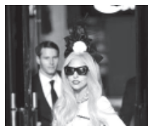
Lady Gaga arrives to promote the Gaga Workshop containing Lady Gaga-themed holiday gifts at Barneys in New York City on 21 Nov, 2011.