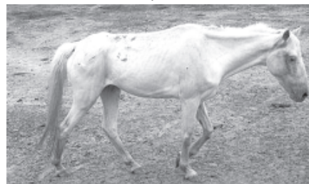
This undated handout image, obtained by Reuters on 3 Dec, 2011, shows an abandoned, malnourished horse in Texas at the Safe Equine Rescue in Gilmer, Texas.

“The price of hay and feed today is at levels we have never experienced before because of the drought,” Sigler said. “In addition to that, pastures are short, and folks who have horses on pasture have no grass for their horses. There is just no market for horses this year.”— Reuters