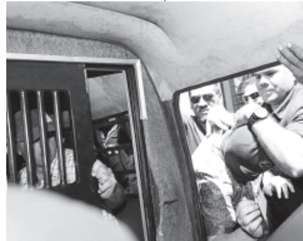
Australian teenager, seen here (wearing balaclava) being escorted by security personnel as his father (L) waits inside a holding cell of a car after his trial at Denpasar court in Bali, on 25 Nov.