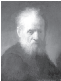
The self-portrait is hidden under this image of an old man, attributed to Rembrandt.