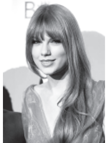
Woman of the Year award honouree singer Taylor Swift attends the 6th annual Billboard Women In Music event at Capitale on 2 Dec, 2011 in New York.

"I got three nominations. I was just so excited," she said Friday, before she was honoured as Billboard's "Woman of the Year." Among the Swift achievements that led to her Billboard honour was the best-selling performance of her third album