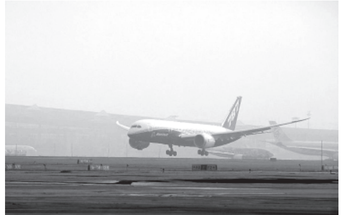
A Boeing 787 Dreamliner lands on the Beijing Capital International Airport, Beijing, China, on 4 Dec, 2011. The Boeing 787 Dreamliner arrived here Sunday, kicking off its six-month tour exhibition worldwide.

The Chinese's government is now fully aware that China must develop its economy in a green way, and is striving to nurture green industries, Wang added.—Xinhua