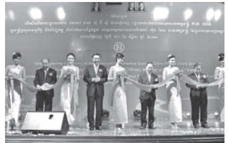
Guests attend a ribbon-cutting ceremony marking the opening of a branch office of the Industrial and Commercial Bank of China (ICBC), in Phnom Penh, Capital of Cambodia, on 30 Nov, 2011. China's Industrial and Commercial Bank of China (ICBC), on Wednesday officially opened its branch in Phnom Penh, aimed at cementing Sino-Cambodian economic and trade cooperation.

The latest strain of bird flu virus was detected in a slum along the Manahara river bank in Bhaktapur on Monday. To prevent the virus from spreading, all the poultry birds in the area were killed. However, consumers are still fearing that the disease may spread out.