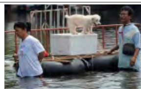
Local residents are seen here salvaging their belongings as their dog sits on top of the improvised float, in suburban Bangkok, in October.