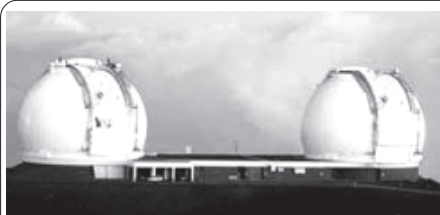
The twin telescopes at Keck Observatory in Hawaii.