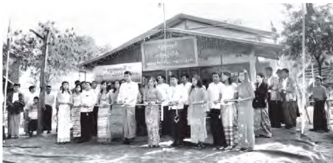
Self-reliant Ngwelayaung Library was opened in Shwedah Nyaunghtauk Village in Yamethin Township on 19 November. Departmental officials formally open the 28 feet long, 17 feet wide and 15 feet high library.—MYANMA ALIN

In the evening, he met departmental officials and local people at Chindwin Myittha Hall in Kalewa.—MNA