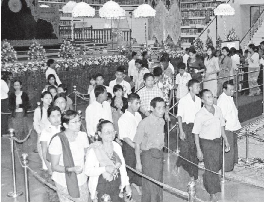
Pilgrims in the queue to pay homage to the Buddha Tooth Relic.

YANGON, 4 Dec—The Buddha Tooth Relic from the People's Republic of China has been kept for the 13 th day today in Maha Pasana Cave here, packed with pilgrims including members of the Sangha.