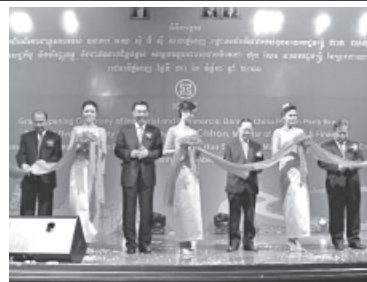
Opening of Industrial and Commercial Bank of China (ICBC) in Phnom Penh, Cambodia, on 30 Nov, 2011.