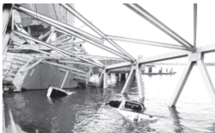
Rescuers hunted for survivors on last Sunday after a busy bridge spanning the Mahakam river in Indonesia's Borneo island collapsed, killing four people and injuring 19 others, according to officials. A public bus, cars and motorcycles plunged into Mahakam river in Kutai Kartanegara District after the 720 m long structure collapsed on last Saturday.