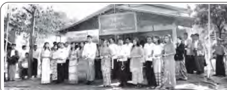
Self-reliant Ngwelayaung Library was opened in Shwedah Nyaunghtauk Village in Yamethin Township on 19 November.