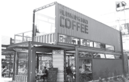
Shoppers rest inside a Shopping Mall built with pop-up shipping containers in central Christchurch, New Zealand, on 3 Dec, 2011. Twenty-seven shops and cafes have been built from 64 converted shipping containers in the mall, which became the first part of the city’s red zone to open for business since the 22 Feb quake which killed 181 people.