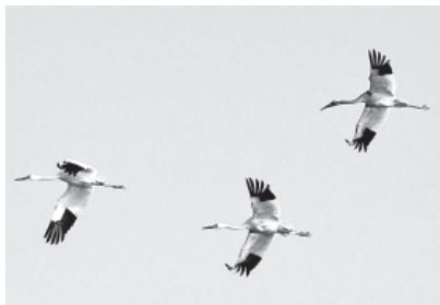
Momoge National Nature Reserve is located in Zhenlai County, Baicheng City, Jilin Province and takes up 144,000 hectares in total, including more than 80% wetland. It is the largest wetland reserve in Jilin Province. It is one of reserves with the most crane species in the nation.

The team has tested 1 1/2-inch spherical capsules containing a blend of paraffin and stearic acid that can be floated on the top of water in a tank.