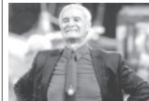
Inter head coach Claudio Ranieri

"A striker lives for a goal and not getting it does