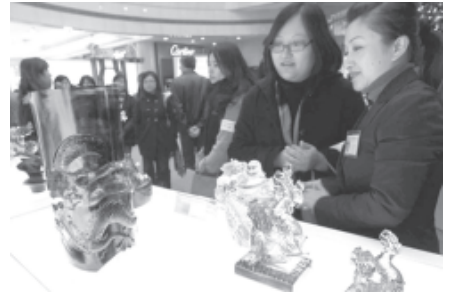
People view crystal glass artworks of dragon at a crystal glass artwork show in Shanghai, east China, on 2 Dec, 2011. The exhibition displayed 40 pieces of crystal glass artworks in the theme of dragon to greet the coming 2012, which is the Year of Dragon in Chinese lunar calendar.