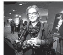
Actress Meryl Streep arrives for the premiere of her movie "The Iron Lady" in Washington, on 29 Nov, 2011.