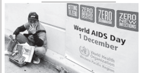
A vendor sits next to a world AIDS day poster displayed in front of the World Health Organization (WHO) regional office in Manila on 1 December.