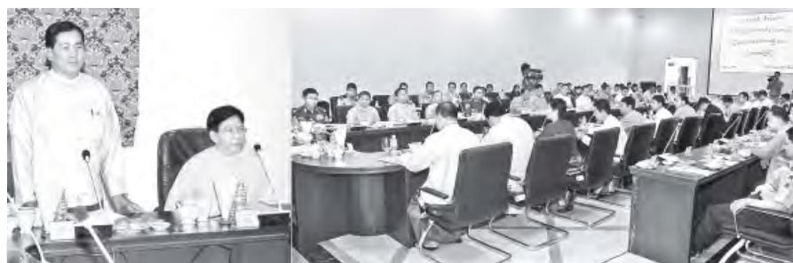
Union Minister for Mines U Thein Htaik addresses first meeting of central committee for organizing Mid-year Myanma Gems Emporium 2011.