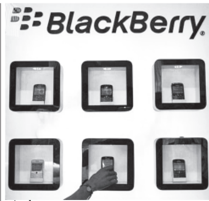
A salesman arranges a BlackBerry mobile phone inside a display box at a showroom in the western Indian City of Ahmedabad 13 October, 2011.