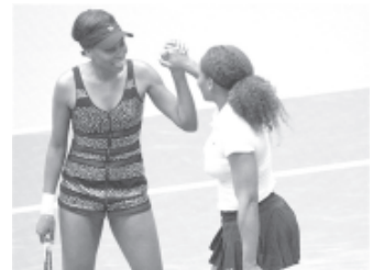
Venus Williams, left, and her sister Serena, of the United States, celebrate after winning a point during an exhibition doubles tennis match against Italy's Flavia Pennetta and Francesca Schiavone, in Milan, Italy, on Saturday.