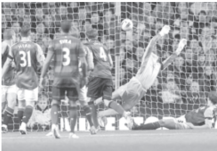
Man Utd's Phil Jones scores his first Barclays Premier League goal to secure victory.