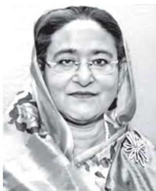
Bangla- deshi Prime Minister Sheikh Hasina. MNA

Sheikh Hasina, Prime Minister of Bangladesh, was born on 28 September, 1947 at Tungipara under Gopalganj district. She is the eldest of five children of the Father of the Nation Bangabandhu Sheikh Mujibur Rahman, the founder of independent Bangladesh.