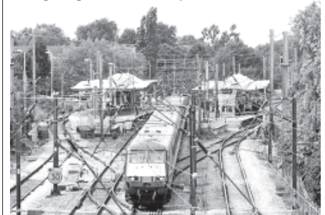
A train passes through Potters Bar rail station at Potters Bar in south east England on 13 May, 2011.

The government's proposal is for a new Y-shaped high-speed rail network. The initial phase would connect London and Birmingham by 2026, reducing journey times to 49 minutes from 84. Lines to Manchester and Leeds would open by 2033.—Internet