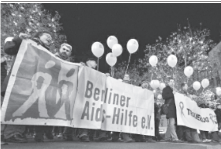
People march along Kurfuerstendamm street during an event to show love and care for HIV and AIDS carriers in Berlin, Germany, on 30 Nov, 2011.—XINHUA