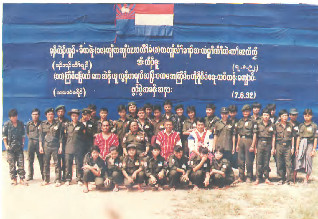
Political trainees from No(7) Brigade.