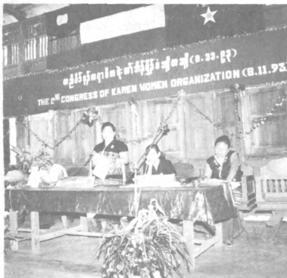
Some K.W.O. leaders at K.W.O. 2 nd congress.