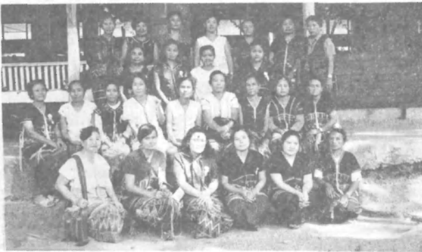
Some K.W.O. leaders at K.W.O. 2 nd congress.