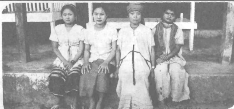
Representatives from Nae Praviillage attending the 2 nd K.W.O.congress.

I am poor. I do not have much, but I gave what I could. I did not expect any money..and I did not get any. A time later after my youngest came down with malaria, the men with guns