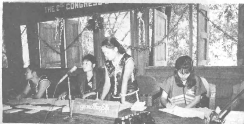
Election committee at 2 nd K.W.O. congress.