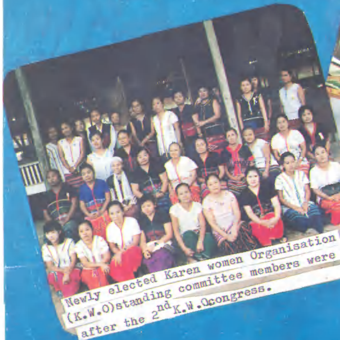
Newly elected Karen women Organisation (K.W.O.) standing committee members were seen after the 2 nd K.W.O. congress.