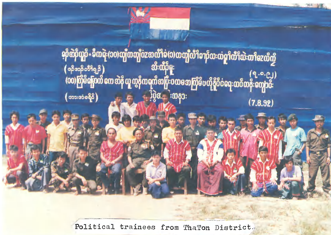
Political trainees from ThaTon District.