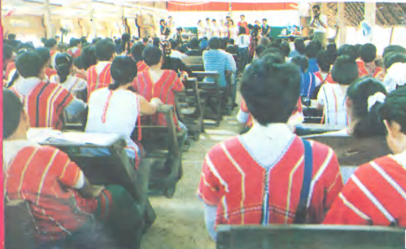
Representatives of national races attending N.Y.C.meeting.