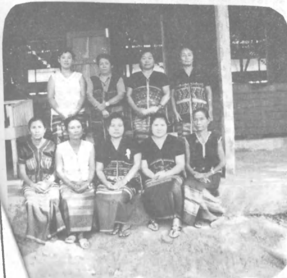
Newly elected executive Committee members are seen after the 2 nd K.W.O. congress.

SLORC's legitimacy literally comes "from the barrel of the gun" and not from the people, yet the SLORC is constantly promoting the idea that its legitimacy comes from United Nations recognition. SLORC propaganda publications and television are constantly smeared with images of foreign diplomats and UN officials meeting SLORC Generals or SLORC delegations attending UN functions. If the international community withdraws its approval of this illegal junta or even debates the credentials of its delegation, the SLORC would be seen as what it is: an army holding the nation hostage. Such a debate could well undermine the junta's credibility even within the Burma Army, which is constantly told that the world approves its rule. The debate would also give weight to the resolutions already passed by the UN, which up until now have been