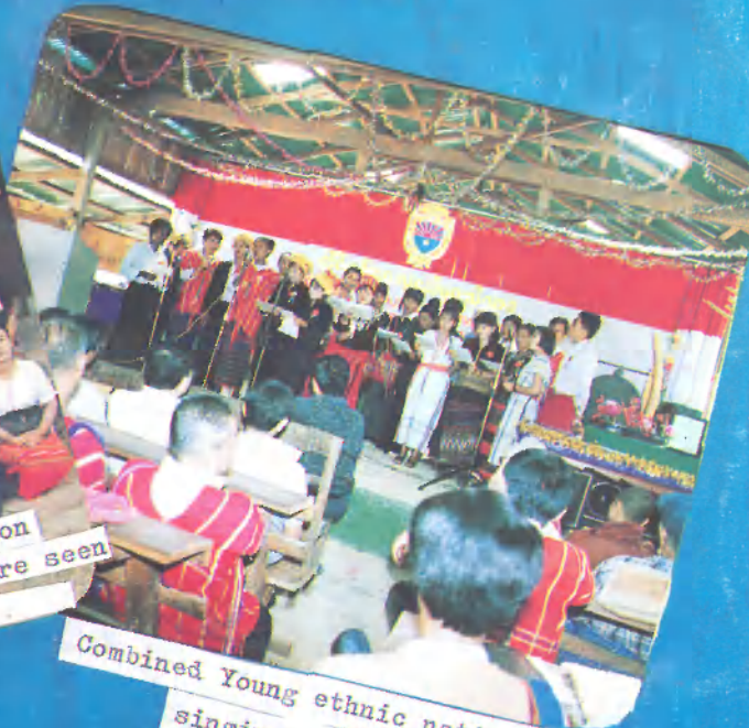
Combined Young ethnic nationalities singing at N.Y.C.