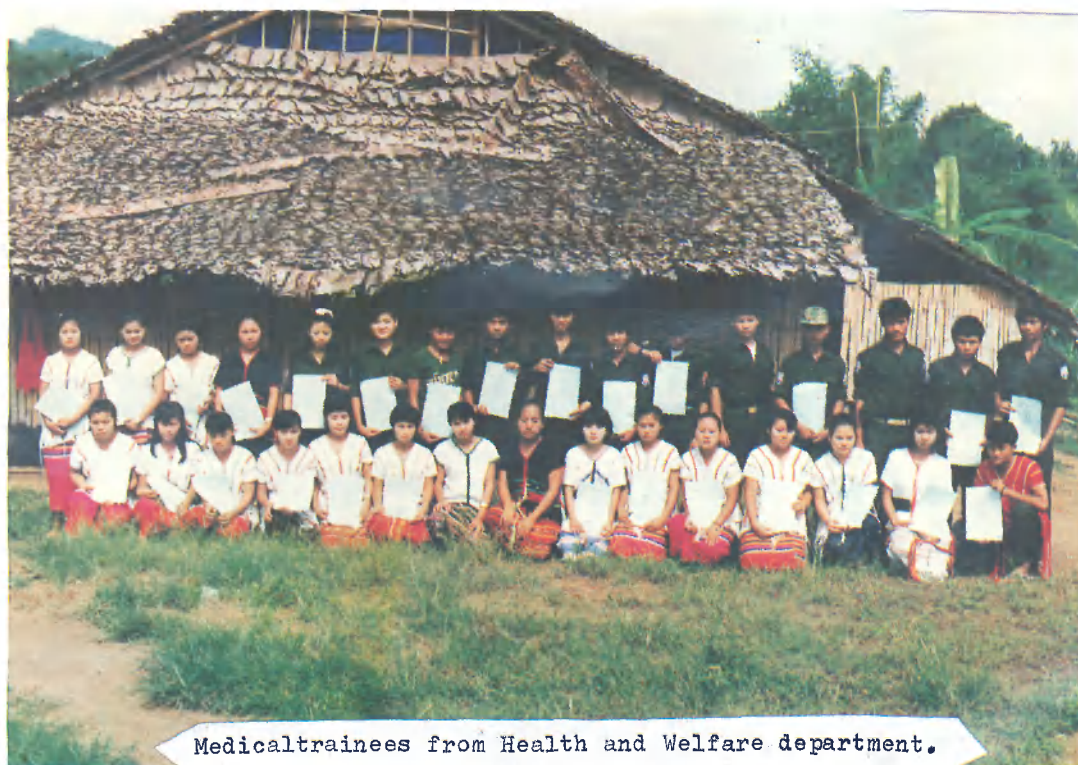
Medical trainees from Health and Welfare department.