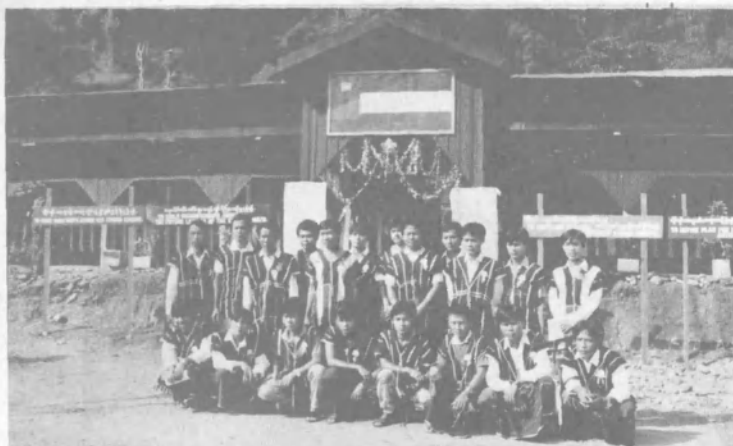
K.Y.O. representatives from districts.