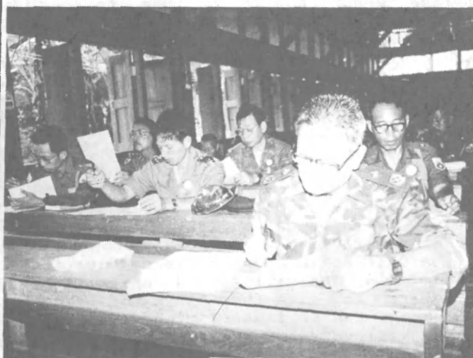
Military officers at K.N.L.A.emergency meeting.