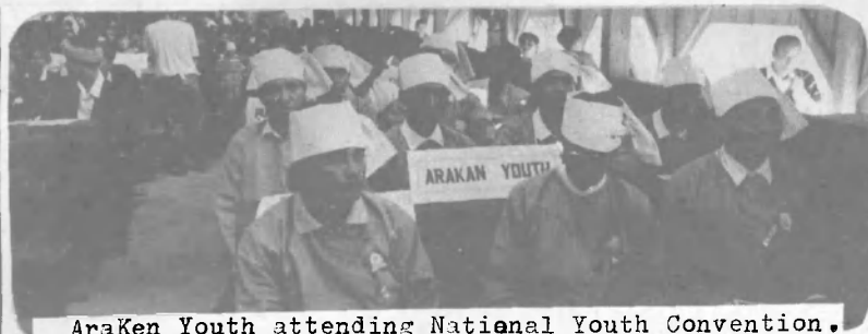
AraKen Youth attending National Youth Convention.