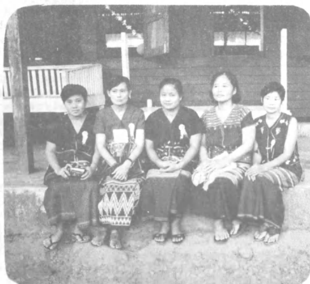
K.W.O. leaders from Mergui/Tavoy District after attending the 2 nd K.W.O. congress.