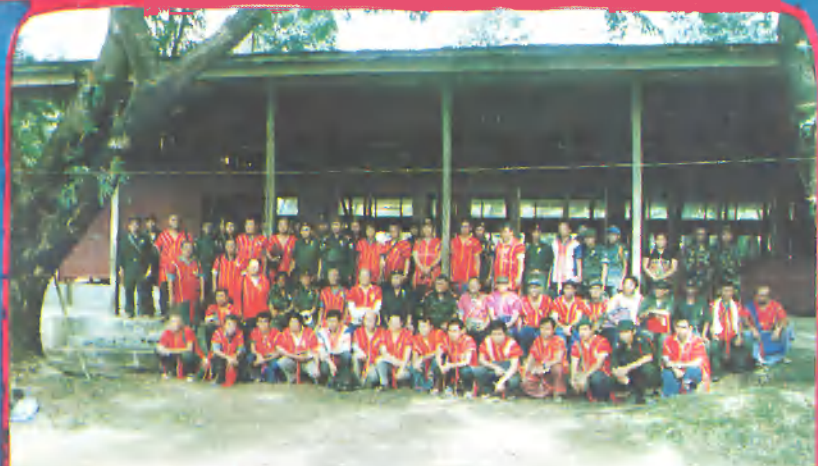
Representatives from various districts attending the emergency meeting of standing committee.