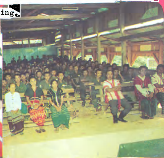
Some leaders attending K.N.D.O.day.