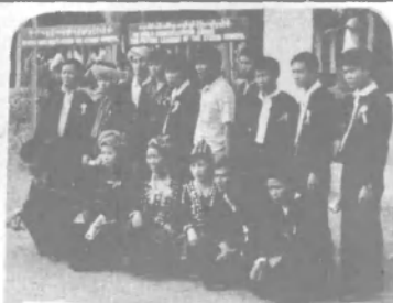
Pa'O Youth at National Youth Convention (N.Y.C.)