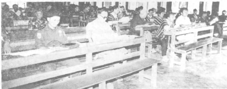
Representatives from various districts attending the emergency meeting committee.

The 1st congress of the Democratic Alliance of Burma (DAB) was successfully held in Manerplaw from the 13th of July until the 29th of July 1993. The organizations present were All Burma Muslim Union (ABMU), All Burma Students' Democratic Front, (ABSDF), All Burma Young Monk Union (ABYMU), Arakan Liberation Party (ALP), Chin National Front, (CNF), Committee for the Restoration of Democracy in Burma (CRDB), Democratic Party for New Society (DPNS), Kachin Independence Organisation (KIO), Karen National Union (KNU), Lahu National Organisation (LNO), Muslim Liberation Organisation (MLO), New Mon State Party (NMSP), National United Front of Arakan (NUFA), Overseas Burmese Liberation Front (OBLF), People's Liberation Front (PLF), People's Patriotic Party (PPP), Wa National Organisation (WNO). In addition, the leaders of the allies of the DAB, the National League for Democracy (Liberated Area) and the Shan National People's Liberation Organization (SNPLO) attended the congress as observers.