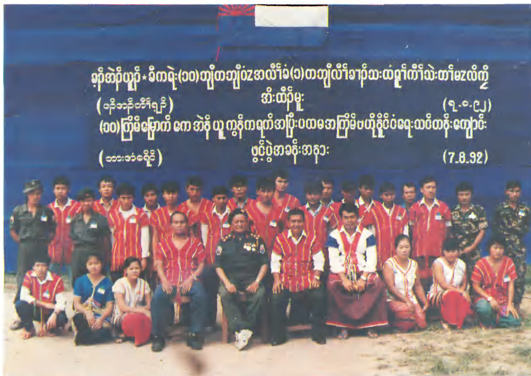
Political trainees from Supreme Head Quarters.