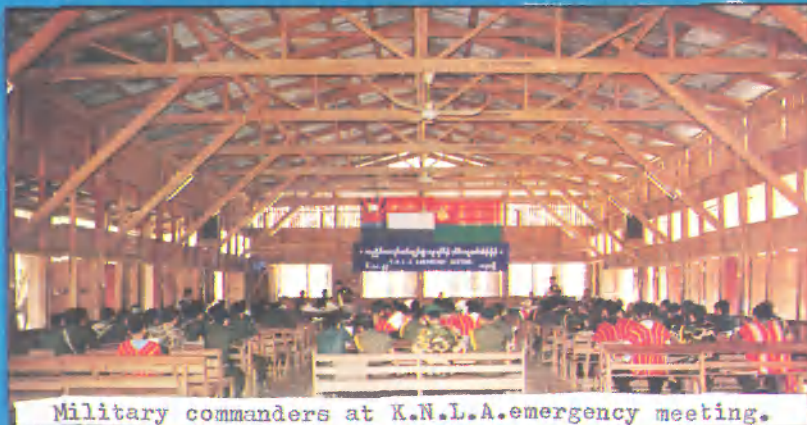
Military commanders at K.N.L.A. emergency meeting.