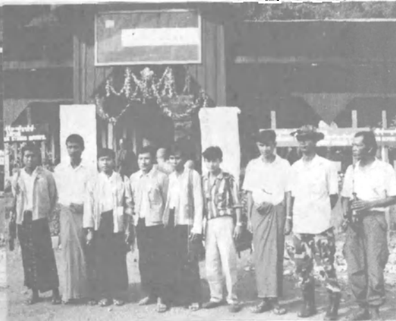
Burmese Youth at National Youth Convention (N.Y.C.)