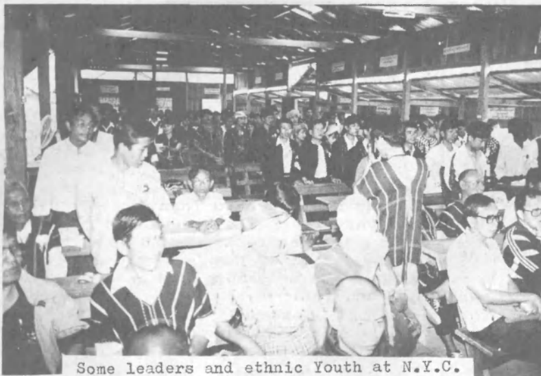
Some leaders and ethnic Youth at N.Y.O.