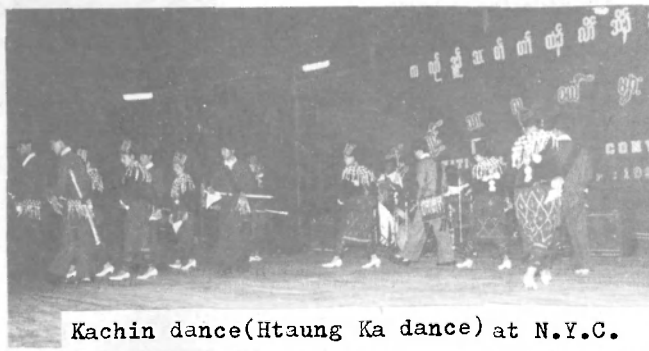
Kachin dance(Htaung Ka dance) at N.Y.C.

On behalf of the suffering Karen people, brother nationalities and the entire people of Burma, we firmly resolve, on this occasion of the anniversary of Karen National Day, to urge the United Nations to intervene at the earliest possible date and address these problems.