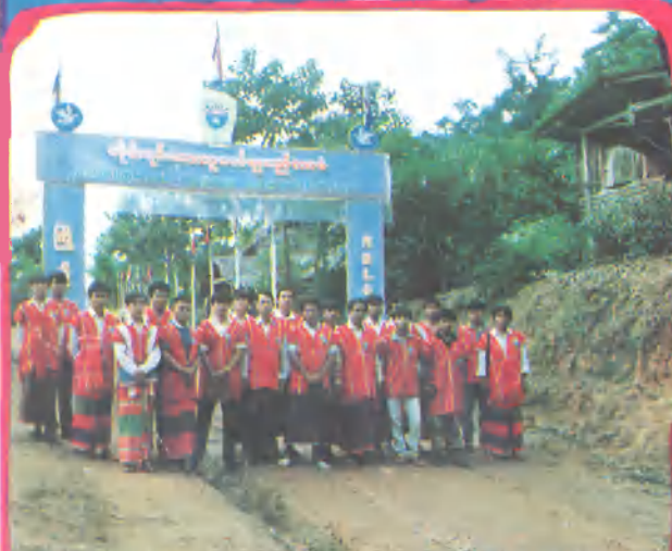
Youth representatives from various districts.