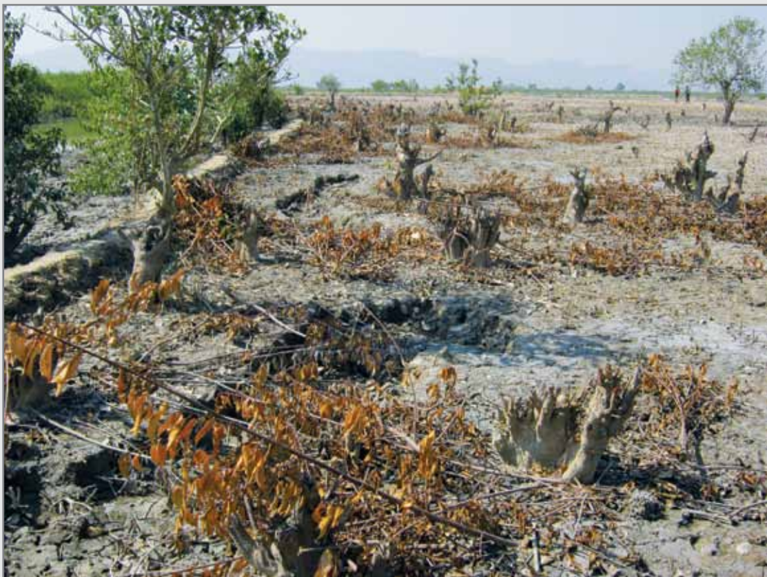
Figure 6 Confiscated land for shrimp farming causing mangroves to die, Rathedaung township, Arakan state.

Along Burma’s Andaman coastline, traditional fishing communities are becoming further entrenched in poverty as their means of livelihood and nourishment is being wiped out. 291