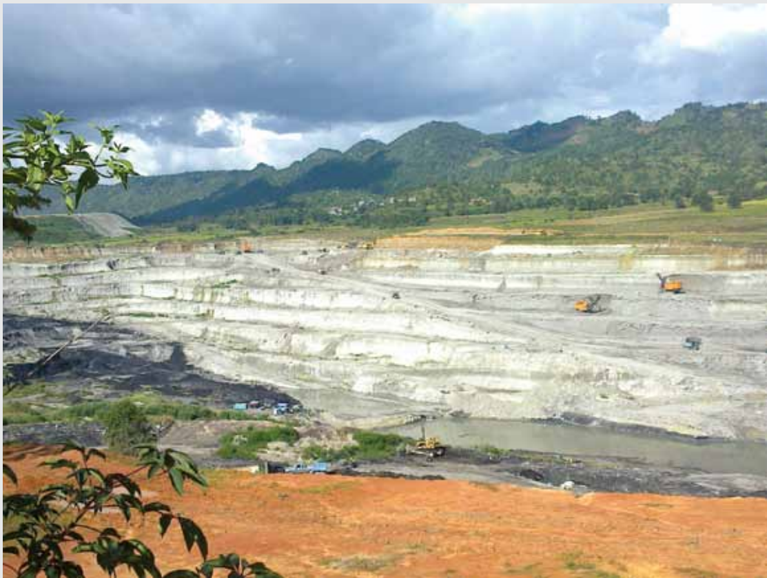
Figure 4 Polluted water from Tigyt coal mine, flowing into upper Balu creek then Inle lake. PYO 2010.

A 250-mile pipeline transferring natural gas to the iron factory has destroyed villagers' farmlands along the route. 244 Hundreds of farmers have lost their land for the Kehsi Mansam coal mine and coal power plant in Tigyt, both in Shan State, which, alongside the natural gas pipeline and a hydropower plant in Keng Tawng will provide energy to operate the factory. 245 Iron ore samples at the site have tested high for arsenic content, raising fears that the mining operations will impact farmers at the foot of the mountain as their fields may be covered with toxic waste soils. Reuters News Agency revealed in July that China's Taiyuan Iron and Steel Group (TISCO) signed an agreement to work together with the China Nonferrous Metal Mining Group (CNMC) in developing a major nickel mining project at Tagaungtaung, Mandalay Division. The cost of the project is estimated at $800 million USD. 246