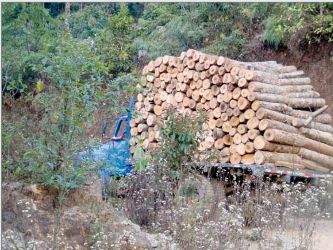
Figure 5 After depletion of the majority of large trees, small trees are being cut down by local business people and exported to China, Kachin state. Local researcher 2010.

Logging business continues in Kachin State with little or no benefit to local people. Recent field research confirmed that a few Chinese businesspeople, some high ranking KIO officials, and some well-connected Kachin and Burmese businesspeople get the most benefit from the logging trade. KIO officials often give concessions, with bribes given to SPDC's area military commanders to facilitate the deals. Chinese businesspeople then facilitate getting the logs to China by working with local villagers and traders to transport the logs across the border. Teak and other highly valuable hardwoods, such as ironwood and rosewood, in Kachin State have all but gone through selective logging for these desired expensive species. Now some local people have started cutting less valuable wood to produce charcoal to supplement their meager income, along with selling big banyan trees which are being replanted along the road in China. As a result, many areas in Kachin State have become