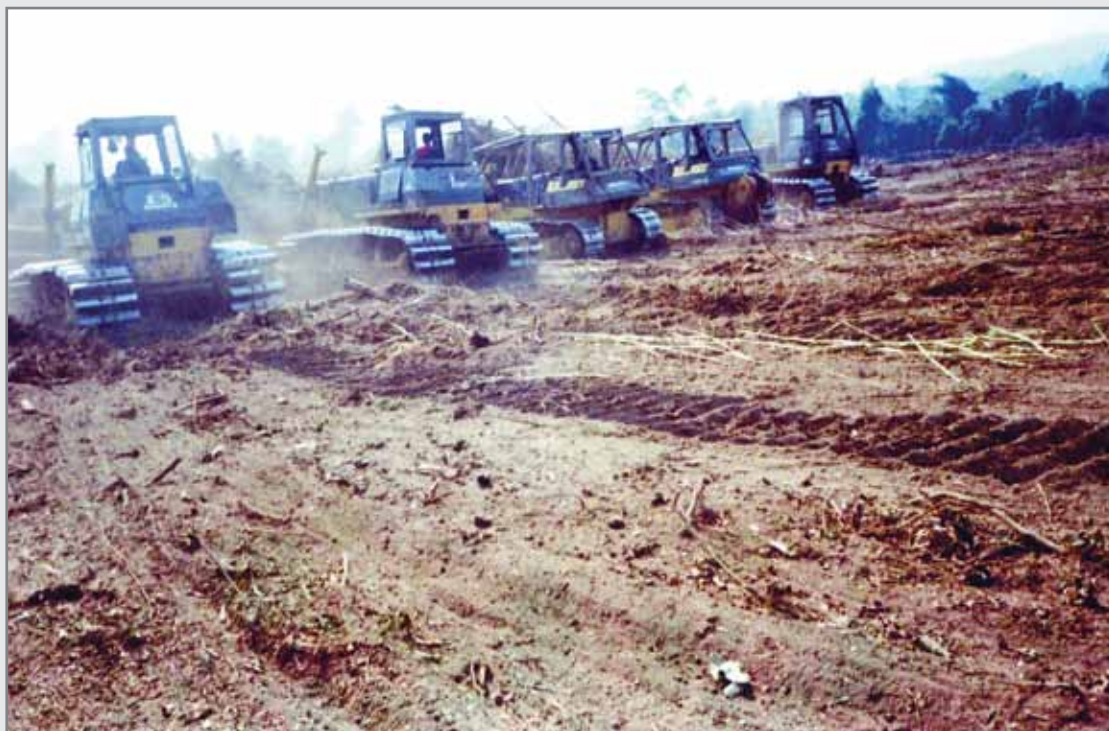
Figure 2 Yuzana company bulldozing land for a cassava mono plantation, Hugawng valley tiger reserve.