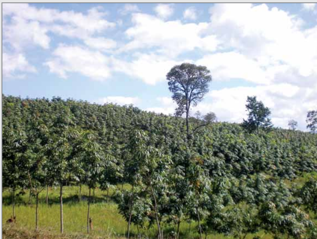
Figure 7 Rubber plantation, near Lashio, northern Shan state. Local researcher, December 2010.

A recent documentary by Kwekalu, a Karen media group, exposed in December 2009 over 250 acres of land were taken in Ler Pa Doh village, Kaserdoh township, Tennasserim Division for a rubber plantation. The documentary reveals that a Burmese company, Bi Pwo Twe, forced villagers to sell the land at a below-market, company price. If villagers didn't sell the land they feared that the land would be taken by force. Consequently, the land was sold under its value and many villagers had their land (which was primarily orchards) taken just when the trees were bearing fruit. One villager explained: "On my land the trees had already bared fruit. They told me if I don't sell the land then I would have to leave. They said they would take and pay for 3 acres but they took more than 3 acres." Another villager complained: "They didn't pay up to the value of my land!" Villagers are now displaced and living in temporary huts on upland farmland near their former orchards. The company plans to confiscate more land, and villagers are concerned they will become refugees as they have no place to go. 317