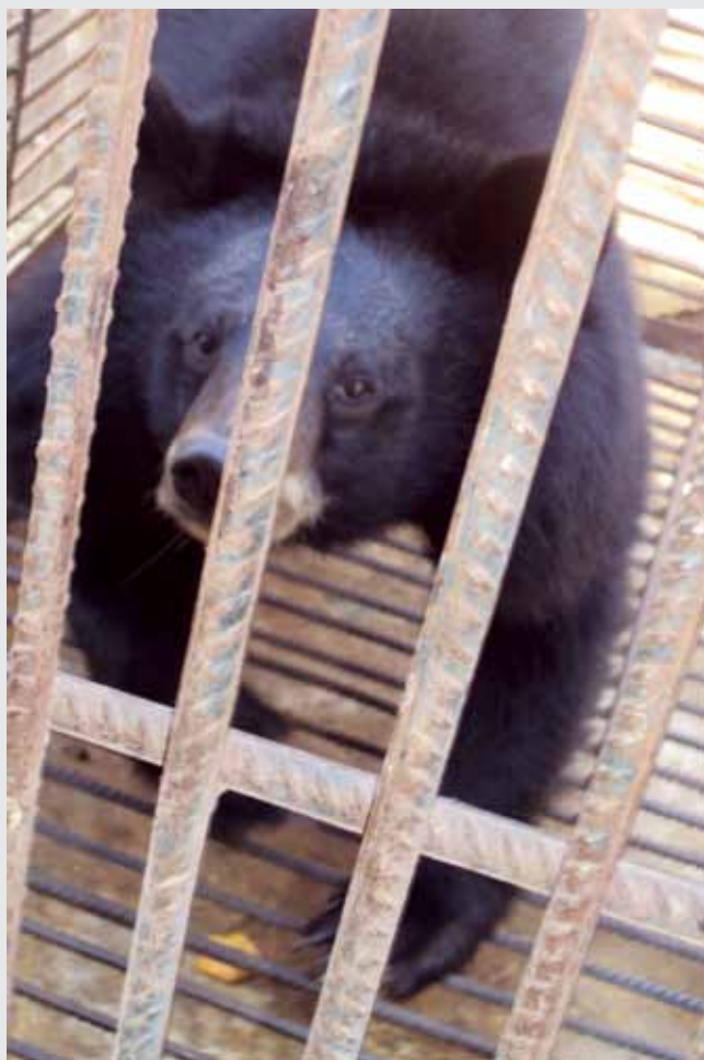
Figure 8 Black Bear being traded at Sop Lwe, Mekong river, Shan State. Wild animals are sold and sent through Lao to China and Vietnam. LND O 2010.

A recent report by the NGO TRAFFIC observes that non-government controlled areas in the north of Burma bordering China, India and Thailand, play a major role in facilitating regional trade in big cats and other endangered species: “Parts and derivatives of big cats and live animals are sourced in Myanmar, Thailand, Lao PDR, Malaysia and India and trafficked across national borders into these non-government controlled areas where they are stored, wholesaled and retailed to local and international buyers” 346 .