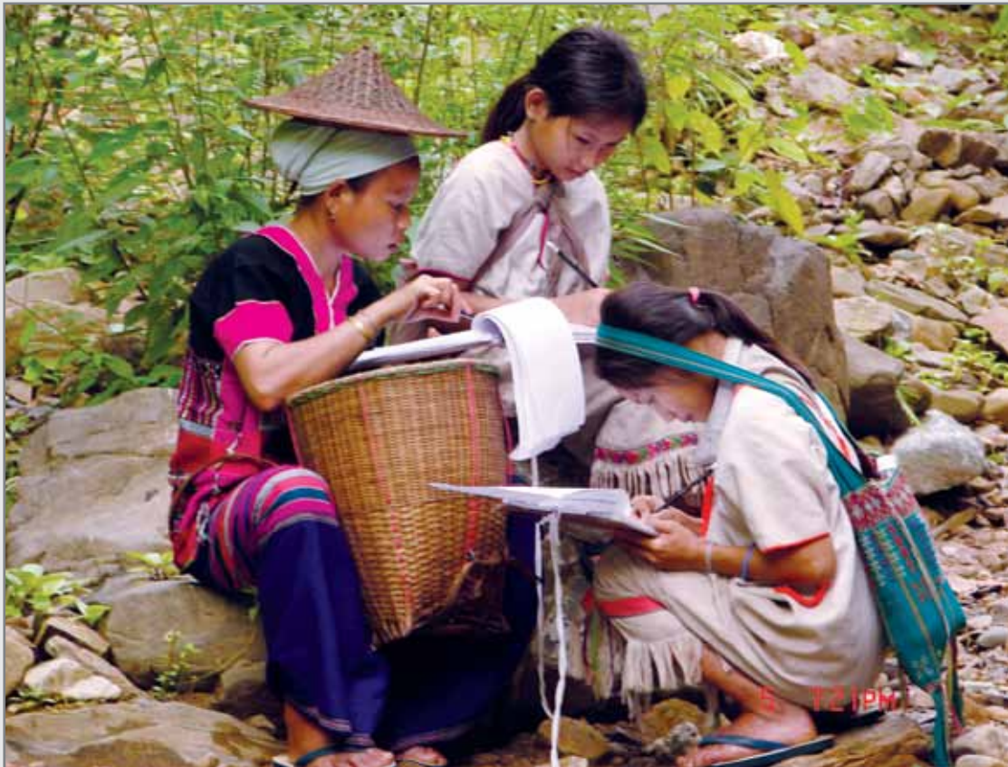
Figure 1 Community forest awareness training, Khoe Kay, Salween River, Karen state. Karen youth learning indigenous knowledge on community forest conservation. KESAN 2009.

Empowerment of communities inside Burma to conserve natural resources and improve livelihood security and sustainability for current and future generations is the central focus in a number of border-based groups' activities. A rights based approach is used to empower communities and local leaders on environment conservation and social development. Projects include the establishment and protection of community forests, support for locally-produced traditional medicines, community-based food and water security initiatives that support local food production and climate change adaptation mechanisms, formal and informal environmental education, and HIV-AIDS education and surveys. Youth development is seen as especially important by many groups and is pursued through internship and education opportunities in within these organizations, youth forums exploring subjects such as the resource curse, and network-building across ethnicities, issues and regions. Groups are increasingly designing community development initiatives that address gender inequality and amplify women's voices and roles.