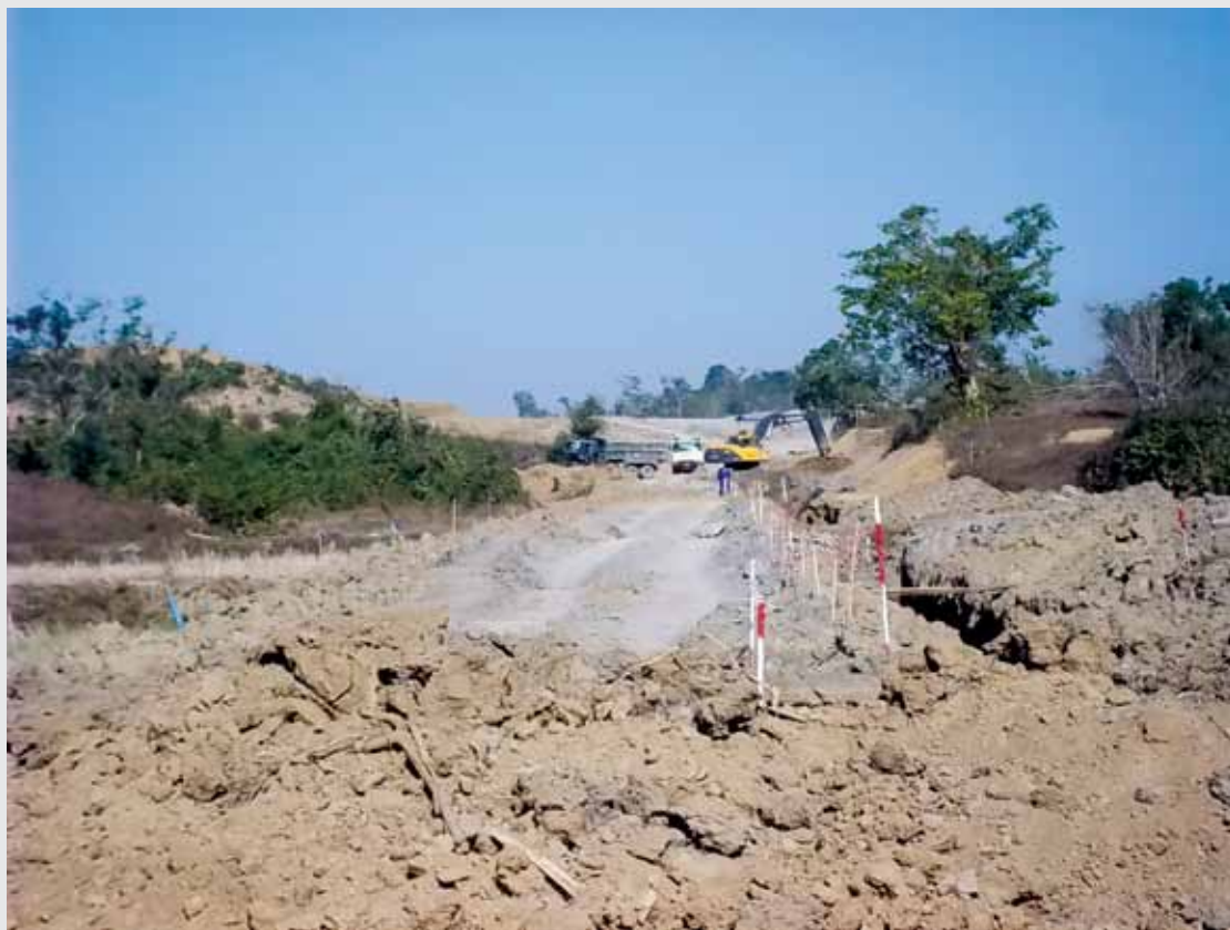
Figure 3 Daewoo clearing pipeline route for the offshore gas terminal, Arakan state. SGM, 2011.

Over 400 million people live in the catchment area of the Bay of Bengal, subsisting at or below the poverty line. These projects are threatening the livelihoods of thousands of local farmers and fishermen and destruction of the environment. Mining operations for seaport construction in late October 2009 around Madaya island killed hundreds of fish and destroyed important local fishing grounds where local people have been fishing for centuries. 218 Oil spills from tanker traffic, and oil exploration and production threaten fisheries and the largely intact ecosystem of the Arakan coast. Natural gas production and transport could result in the leakage of chemicals and potential gas blow outs which cause environmental damage. 219