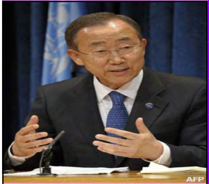
UN Secretary-General Ban Ki-moon has been re-elected to a second five-year term.