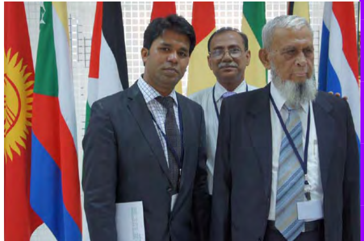
ARNO Sr. Vice President with BROUK President and AHS Sr. Vice President in the Rohingya Convention in Jeddah.

7. Requests the Secretary-General to follow up the implementation of this resolution and report thereon to the Thirty-ninth session of the Council of Foreign Ministers. ##