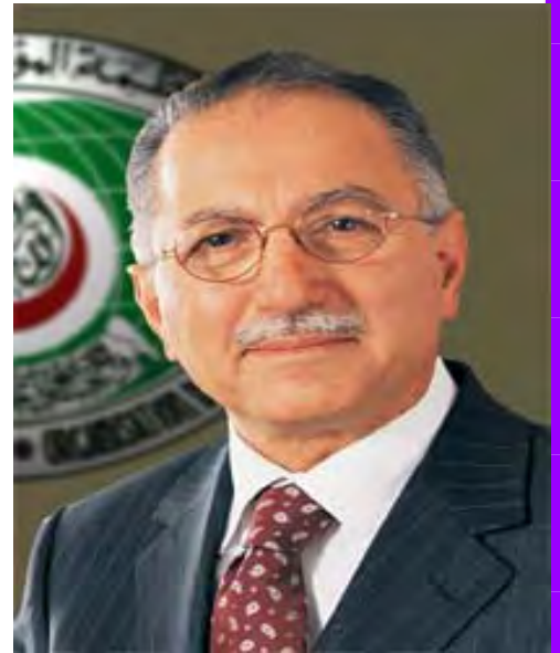
OIC S.G. Prof. Ekmeleddin Ihsanoglu

Ihsanoglu underlined that the meeting stresses on coordinating the work of Rohingya Muslim organizations and uniting their ranks under a united coordination council and calls on OIC to continue these efforts to reclaim Rohingya Muslims' rights. The Secretary General clarified that an agreement was reached in the first meeting on 9th June 2010 which established an organizational and coordination council and calls on OIC to continue these efforts to reclaim Rohingya Muslims' rights. The structure known as the Arakan Rohingya Union (ARU) with