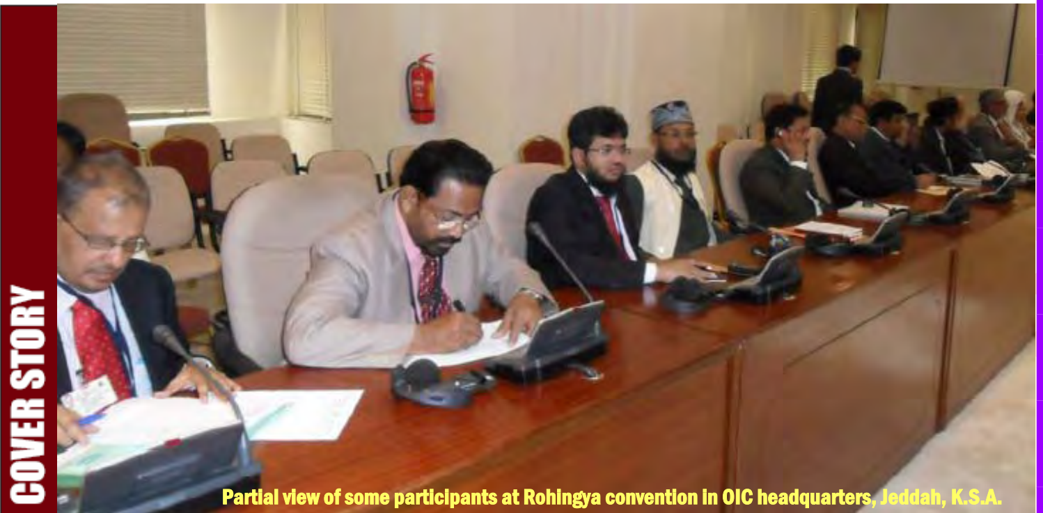
Partial view of some participants at Rohingya convention in OIC headquarters, Jeddah, K.S.A.