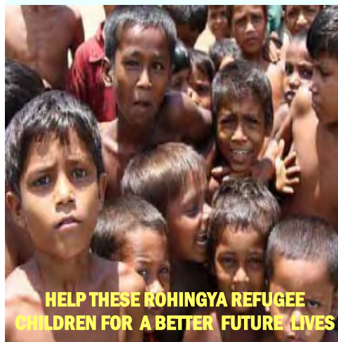
HELP THESE ROHINGYA REFUGEE CHILDREN FOR A BETTER FUTURE LIVES

from Rakhine businessmen who are giving loans against their home or land." "With this system, so many Rohingya people have lost their homes or land and are leaving from town to rural areas." ##