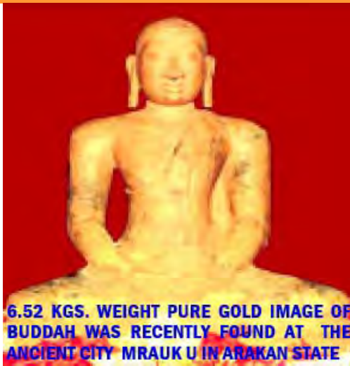
6.52 KGS. WEIGHT PURE GOLD IMAGE OF BUDDHA WAS RECENTLY FOUND AT THE ANCIENT CITY MRAUK U IN ARAKAN STATE