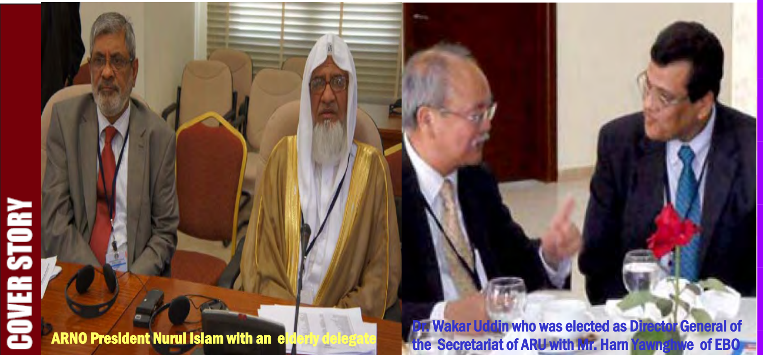
ARNO President Nurul Islam with an elderly delegate

Final Resolution on Rohingya of Arakan , Burma (Myanmar) at The Thirty-eighth Session of the Council of Foreign Ministers (Session of Peace, Cooperation and Development), held in Astana, Republic Kazakhstan of, from 26 to 28 Rajab 1432H, (28 - 30 June 2011), RESOLUTION No. 4/38-MM ON THE MUSLIM COMMUNITY IN MYANMAR ARE : —