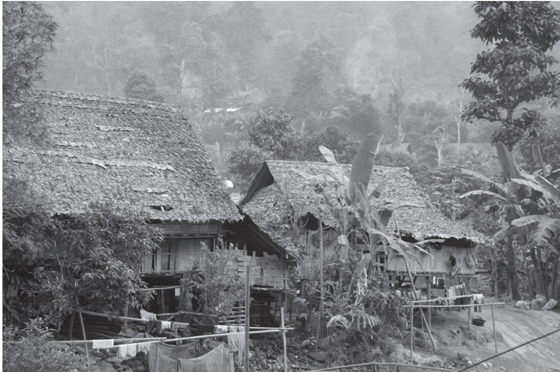
Figure 2: Makeshift Housing in Mae Ra Mu Luang Refugee Camp

Maela camp is the biggest of the camps at the Thai-Burmese border. “Mae La” means cotton field. Maela is well known as a study center; thousands of students come from Karen state to study there. Built in 1984, it has always been very crowded. There were 46,855 people in the shelter in 2009, with a density of 105 persons per acre. The camp is located ca. 65 km from Maesot on the Moi River. Very hot in summer, Maela is very cold in winter and very muddy after rains. Visitors are allowed to enter from 06.00 to 18.00 only and are prohibited from staying overnight. The camp is guarded by ca. 100 border patrol police forces and fenced with barbed wire. It was shelled in 1997 and many compounds were burned by DKBA-forces. The UNHCR, the International Labor Organization and the European Union keep offices in the camps. The people live in simple bamboo houses. They use cheap wood, bamboo, earth and plastic sheets to build houses as they would build them in their villages. Most shelter residents have no income or land to farm, and they have therefore become dependent on aid. The families receive calculated rations of rice, charcoal, oil and drin-