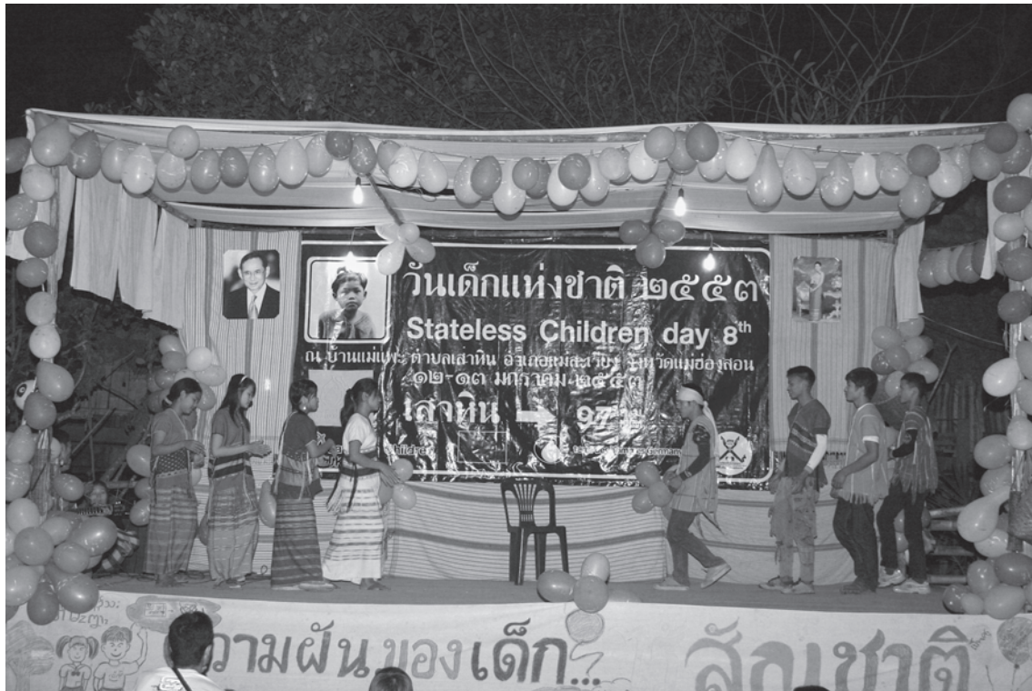
Figure 3: Performance of Karen migrant youth on Stateless Children Day

and joined the Free Burma Rangers. Tilling some land of his wife's family in Huay Nam Nak, he also employs some refugees, and joins the Free Burma Rangers regularly. He employs a friend who prefers to stay in the village and is making a living by raising livestock. This man is a friend of a colonel of the Karen National Union who comes to visit in the village. He left his wife and children in Mae Ra refugee camp, as his children are entitled to free education and food in the camp.