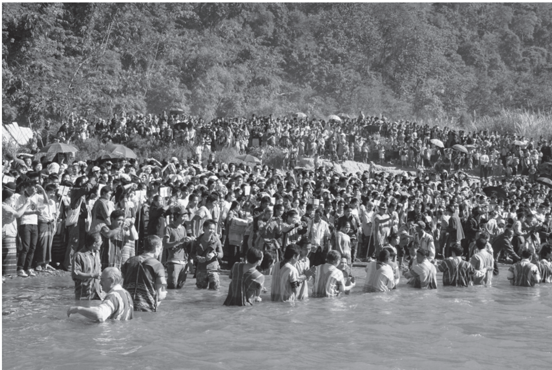
Figure 1: Baptism at Mae Ra Ma Luang Camp