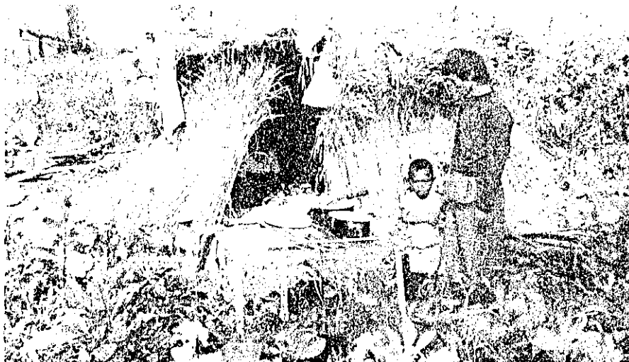
A temporary shelter for the family made out of grass.