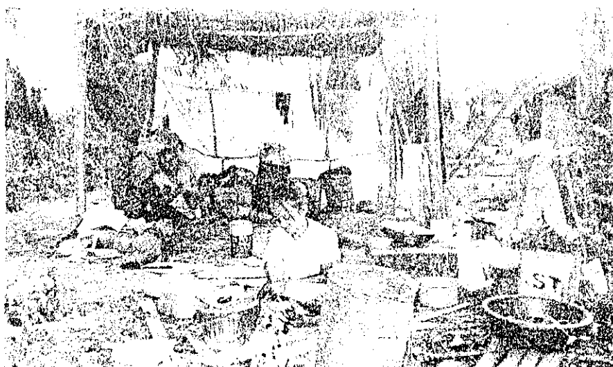
A makeshift shelter out in the open.