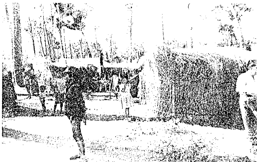
Some typical grasshuts hastily erected for shelter.