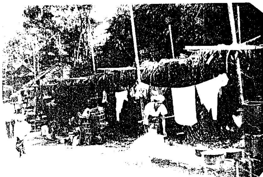
New arrivals at Sho Kio refugee camp.