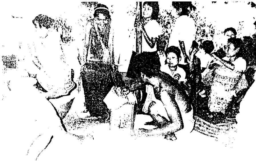
rice distribution at Sho Klo refugee camp.

Many houses were burned down in Kler Day and Mae Sa Rit.