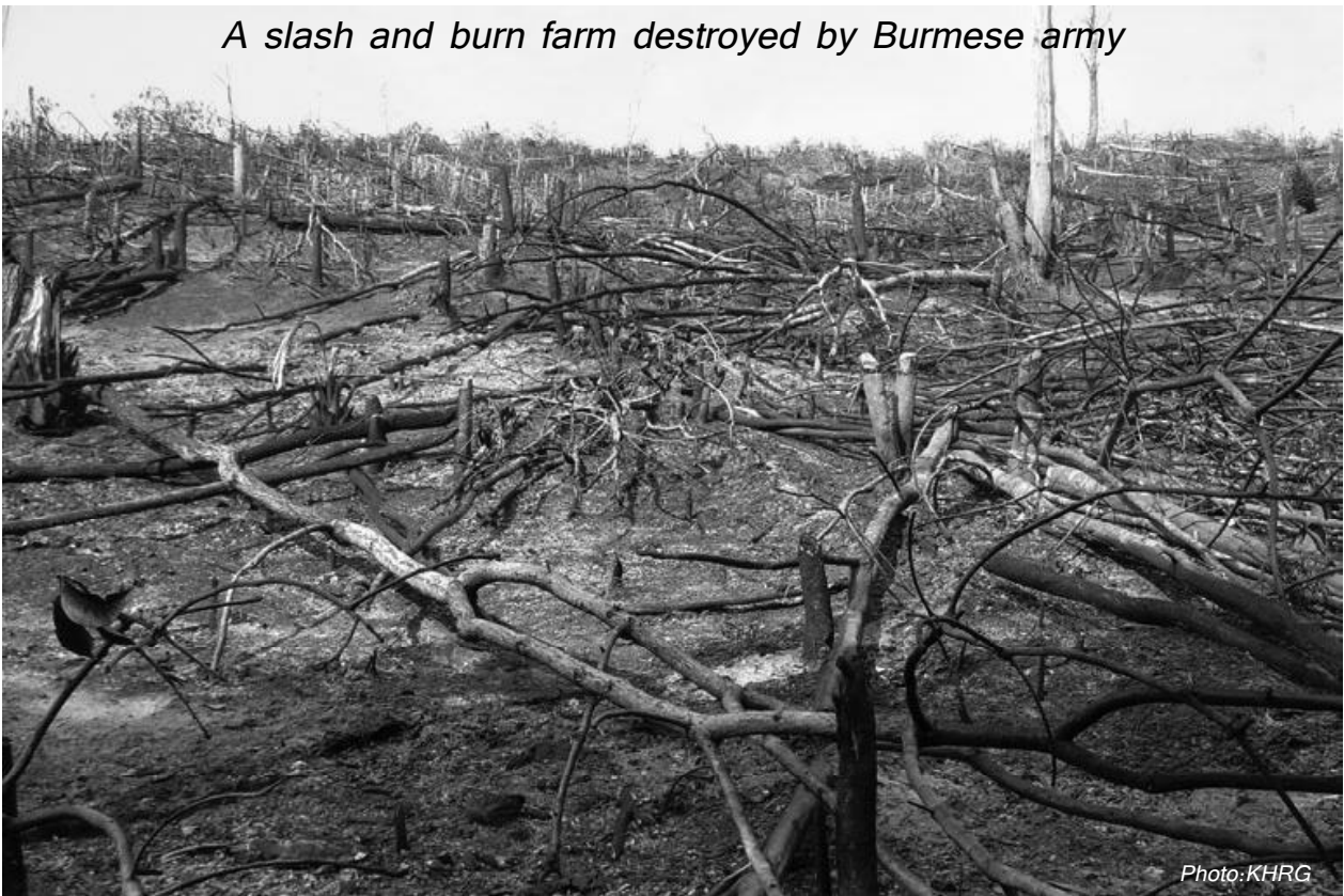
A slash and burn farm destroyed by Burmese army