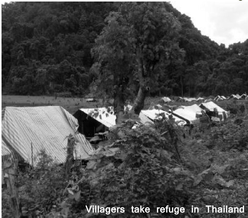
Villagers take refuge in Thailand

"It won't be easy to go back and set up our village. The Burmese army will landmine the village before they leave. If they destroy our food and possessions we won't be able to feed ourselves."