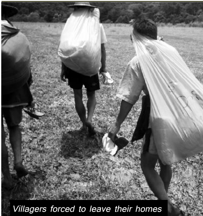
Villagers forced to leave their homes