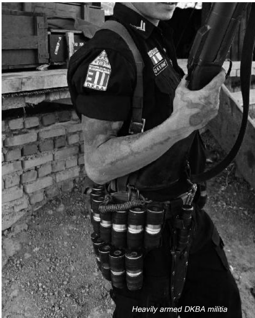
Heavily armed DKBA militia

The Karen Human Rights Group has documented abuses by the DKBA in Pa'an and Dooplaya districts. These abuses include forced labor, forced relocation,