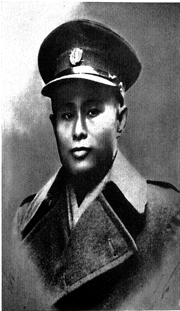
GENERAL AUNG SAN