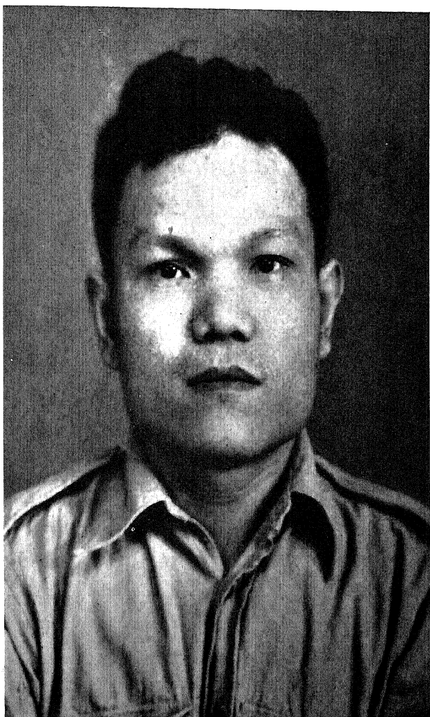
THAKIN THAN TUN