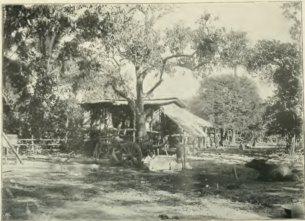
A BURMESE VILLAGE (SÉYWA, THARRAWADY DISTRICT).