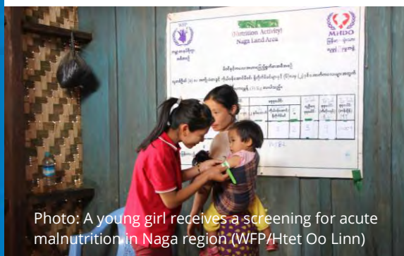
Photo: A young girl receives a screening for acute malnutrition in Naga region (WFP/Htet Oo Linn)