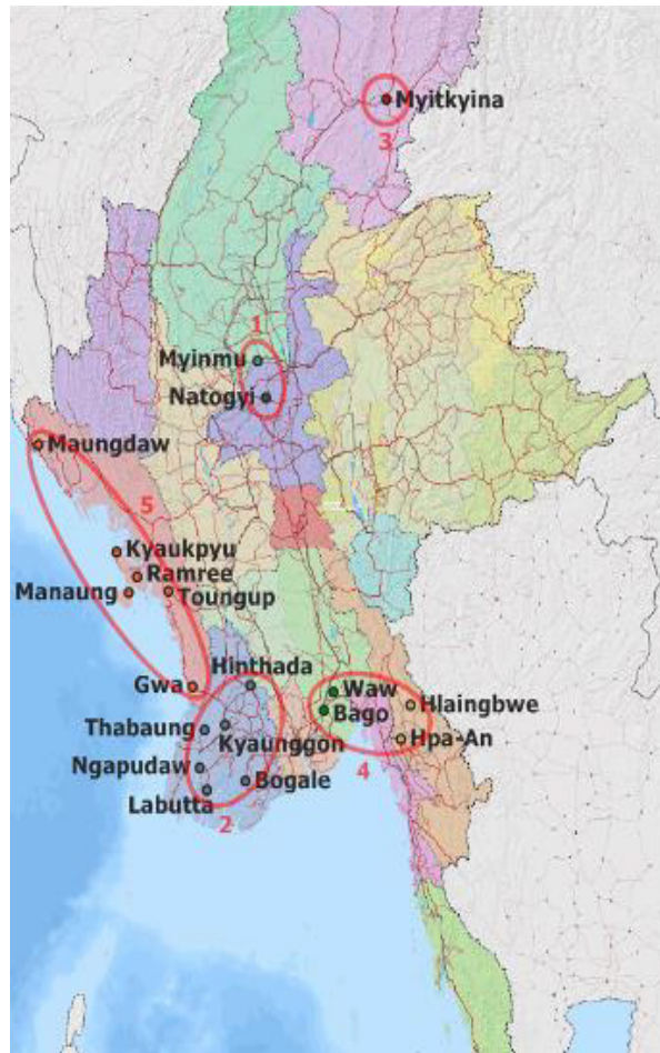
Figure 2: Five clusters formed out of 19 townships suggested at the Initiation Workshop in December 2014.

During this first phase, the MCCA also focused on supporting the Government, through the mobilization of the TWG, for other policy processes, such as formulating the INDC between April and September 2015, for submission to the UNFCCC by 30 September 2015. Although this diverted the focus from the strategy, it was extremely useful to consolidate areas of work and sector thematic groups. It was also useful to increase TWG members' awareness on climate change, which in turn supported the elaboration of the MCCA.