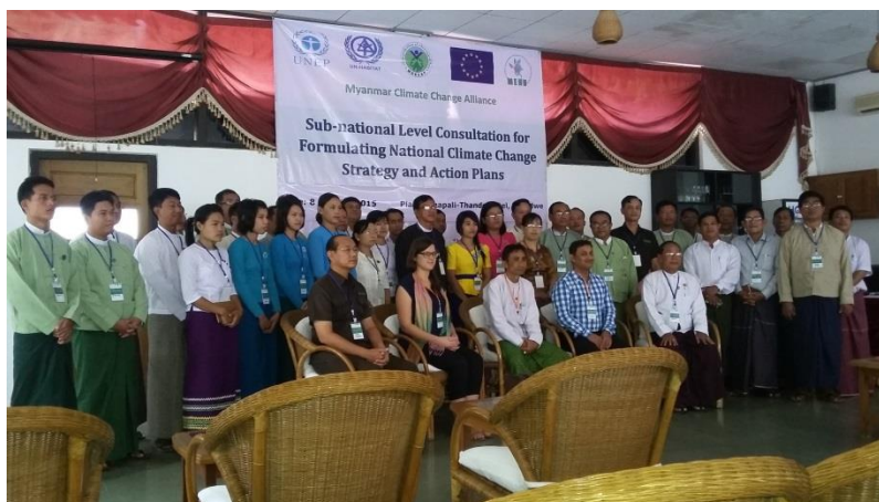
Figure 4: Participants of the local consultations in Thandwe, October 2015