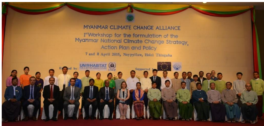
Figure 3: First national workshop for MCCA formulation, April 2015 in Nay Pyi Taw