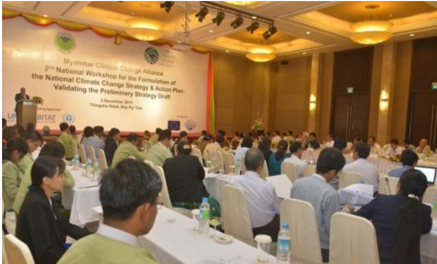
Figure 5: Second national workshop, Nay Pyi Taw, 2 November 2015