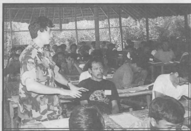
express the views and achieve the solution