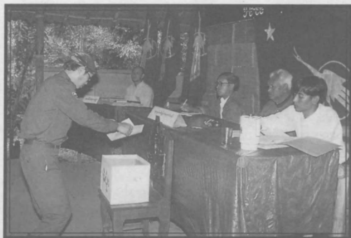
Ballot for the new CEC members of ABSDF