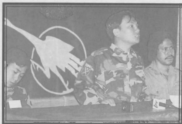
Paying salute for the heroes of 1988 democracy struggle.

We would like to inform the people of Burma that despite the hardships we have endured and the adversities we have faced over the past eight years, we are determined to continue with our struggle.