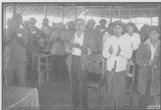
From ABSDF's unity to final victory