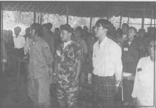
Participants seen at the closing ceremony of reunification