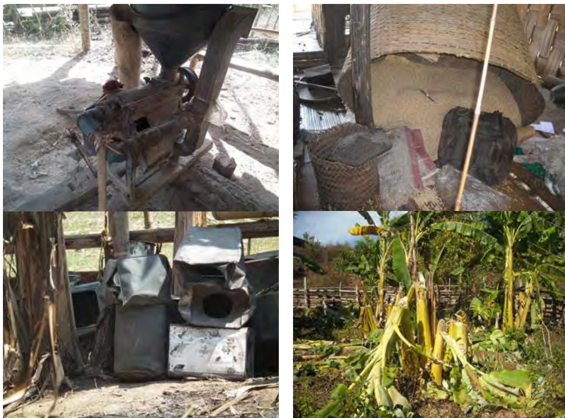
These photos, taken on February 26 th 2011, show damage to the food supply and agricultural and cooking equipment perpetrated by Tatmadaw LIB #252 during the attack on Dteh Neh village, Lu Thaw Township, Papun District. 97

not be clear out of context and without the interviewer's questions. See: "Tenasserim Interview: Saw K---, August 2011," KHRG, September 2011.