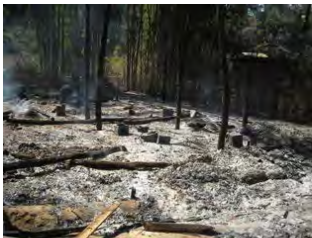
This photo, taken on February 26 th 2011, shows the remains of a home in Dteh Neh village, Lu Thaw Township, Papun District, burned by Tatmadaw troops on February 25 th . Saw L---, the Dteh Neh village head, and villager documenting this incident both reported that one house and two rice barns in the village were burned down in the attack. 56

In the past 20 years, KHRG has consistently documented attacks in violation of the principle of distinction in all seven research areas, including both incidents in which civilians and civilian objects were deliberately attacked, 59 as well as attacks on civilians and civilian objects as a result of indiscriminate military practices. 60