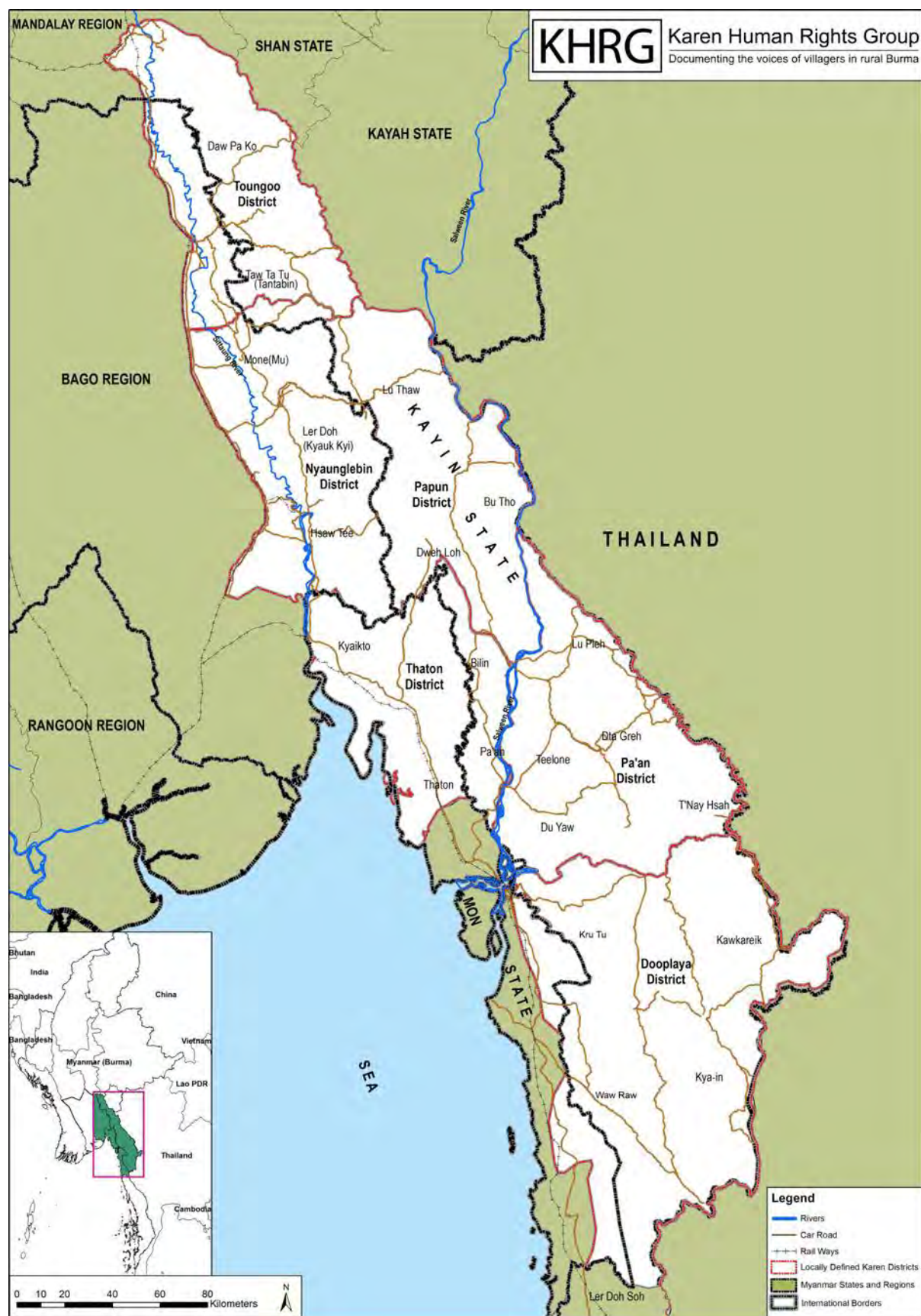
Figure 1: Locally-defined Karen districts (Kayin and Mon states; Bago Region)