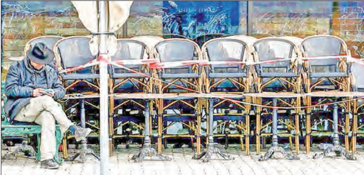
Germany closed bars, restaurants, gyms and cultural centres in November, before adding non-essential shops and schools in December as the country was badly hit by a second Covid-19 wave. GERMAN Chancellor Angela Merkel wants to allow more socializing between households from next week as part of plans to gradually loosen virus curbs in the Covid-weary nation, a draft text showed Tuesday. A draft text seen by AFP

on the eve of crunch talks with regional leaders showed that Merkel plans to propose that two households, not exceeding five adults, be allowed to get together from March 8. Under the current rules, one household may only social-