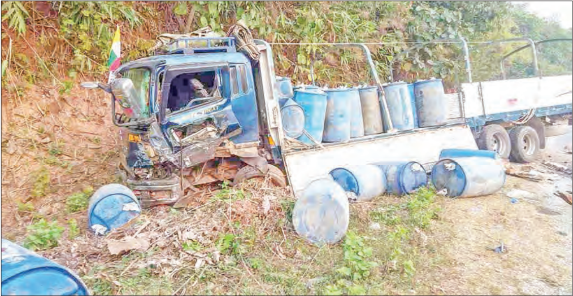
Two men were killed following a head-on car crash in Mong Phyat Township in Tachilek District, Shan State (East) on 1 March evening.

TWO men were killed following a head-on car crash in Mong Phyat Township in Tachilek District, Shan State (East) on 1 March evening. A 47-year-old man and a 45-year-old man lost their lives in the accident. According to the witnesses, the crash happened at approximately 3:45 pm between Soatpan village and Saikgone village on Kengtung-Mong Phyat-Tachilek Pyidaungsu Road. According to the investigation, Vigo, a 12-wheel vehicle, which was en route to Tachilek from Mong Phyat driven by Arr Phar, 37, with U Maw Yar, 47, U Arr Khant, 45, and Ma Arr Par, 18 onboard from Tachilek,