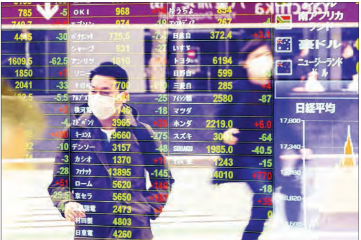
The novel coronavirus has killed at least 2,539,505 people since the outbreak emerged in China in December 2019.

THE novel coronavirus has killed at least 2,539,505 people since the outbreak emerged in China in December 2019. At least 114,360,550 cases of coronavirus have been registered. The vast majority have recovered, though some have continued to experience symptoms weeks or even months later. These figures are based on daily tolls provided by health authorities in each country and exclude later re-evaluations by statistical organizations, as has happened in Russia, Spain and Britain. On Monday, 6,800 new deaths and 298,141 new cases were recorded worldwide. Based on the latest reports, the countries with the most new deaths were the United States with 1,336 new deaths, followed by Brazil with 778 and Spain with 467. The United States is the worst-affected country with 514,657 deaths from 28,664,448 cases. After the US, the hardest-hit countries are Brazil with 255,720 deaths from 10,587,001 cases, Mexico with 186,152 deaths from 2,089,281 cases, India with 157,248 deaths from 11,124,527