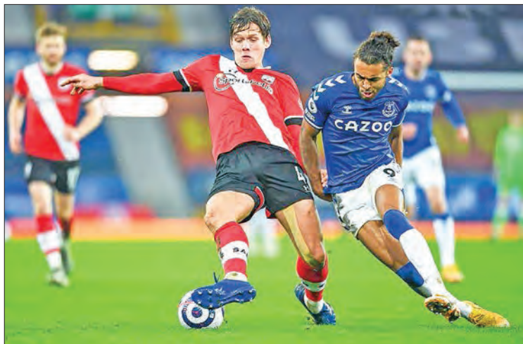
Everton boosted their bid to earn a top-four finish in the Premier League as Richarlison sealed a 1-0 win against struggling Southampton on Monday.

Fresh from beating Liverpool 2-0 to secure their first victory over their Merseyside rivals at Anfield since 1999, Everton are firmly in contention to qualify for the Champions League via a top-four finish.—AFP ■