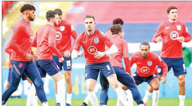
England is ready to host extra matches for this year’s European football championships, British Prime Minister Boris Johnson said in an interview published on Tuesday.

The tabloid said British ministers are holding talks with European football’s governing body UEFA about hosting more games due to rising cases across the continent and the slow roll-out of vaccines.