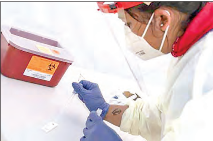
FILE: A health worker process a COVID-19 antibody test after getting the blood from the patient.

cent, of the perpetrators of the violence were civilians, but threats also came from public authorities. In Egypt, health workers who criticized the regime’s handling of the pandemic were arrested by security forces and accused of spreading false information and of belonging to a terrorist group. Insecurity Insight, which developed the interactive map, also recorded 802 attacks in countries at war or on victims of civil conflicts, such as the bombing of hospitals in Yemen and the kidnapping of doctors in Nigeria. “The map shows that violence and intimidation against healthcare was a truly global crisis in 2020, affecting 79 countries,” said Insecurity Insight director Christina Wille in a statement. —AFP ■