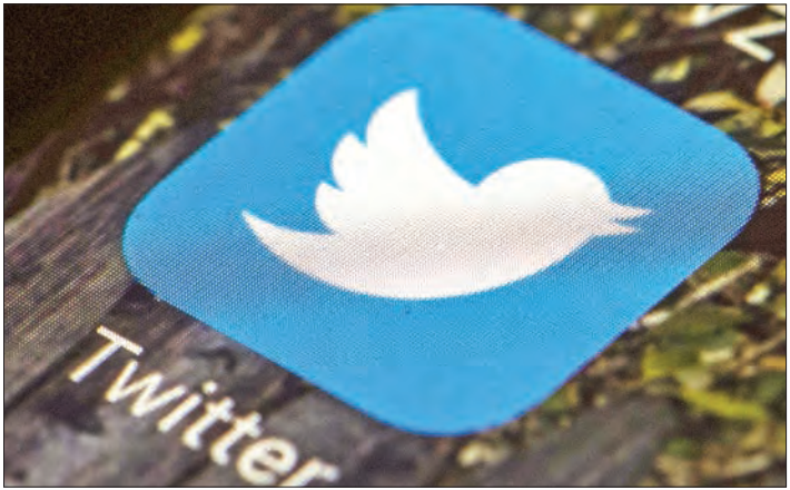
Twitter said Monday it will start labeling misleading tweets about Covid-19 vaccines and boot users who persist in spreading such misinformation.

TWITTER said Monday it will start labelling misleading tweets about Covid-19 vaccines and boot users who persist in spreading such misinformation. The one-to-many messaging service introduced a “strike system” that will gradually escalate to a permanent ban after the fifth offending tweet. Twitter users will be notified when a tweet is labelled as misleading or needs to be removed for breaking the platform’s rules, earning a strike, according to the company. The second and third strikes will each result in the violating account being blocked for 12 hours. With a fourth violation, an account will be sidelined for seven days. A fifth strike will get accounts permanently suspended, Twitter said. Twitter late last year began calling on users to remove dangerously misleading Covid-19 claims, including suggestions that vaccines are used to harm or control people. The service also targeted baseless claims about adverse effects of vaccines or questioning the reality of the pandemic. Since then, Twitter has removed more than 8,400 tweets and notified some 11.5 million accounts worldwide about violations of its Covid-19 information rules. —AFP ■