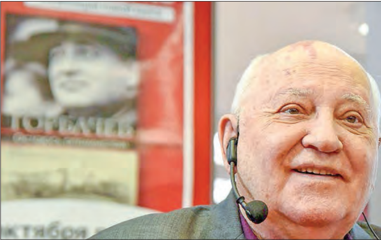
Mikhail Gorbachev, the historic reformer who presided over the collapse of the Soviet Union, marked his 90th birthday in quarantine Tuesday and like everyone else is “tired” of virus restrictions, his spokesman said.