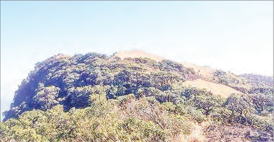
An aerial view of Mount Zinghmuh (Nat Ma Taung).

MOUNT Zinghmuh, the third highest peak in Chin State, located between Haka town and Thantlang town, Falam township in Chin State, will be established as a tourist destination, according to the Directorate of Hotels and Tourism Department in Chin State. Mt Zinghmuh is as beautiful as the highest mountain in Chin State called Nat Ma Taung (Khonnuamthung in the local Chin language). However, it is not a well-known mountain because of low transportation. Now, only the residents can reach those areas. Mt Zinghmuh is attracting more local and foreign visitors. Thus, studies are being carried out to improve the mountain road. “Mt Zinghmuh is close to Lai Ti Li natural lake. The peak of the mountain overlooks the natural scenic beauty. It can bring benefit to the local people if it is developed as a tourist destination. That is the reason why we are establishing the Lai Ti Li natural lake as a tourist destination. Visitors can go from three cities. It is appropriate to develop these places as tourist destinations, said an official from the Directorate of Hotels and Tourism in Chin State. Its peak is 8,414 feet above sea level. When the weather is fine, the visitors could view Chin State (North) Sagaing region and Magway region. The visitors could reach