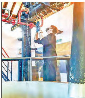
Around 10,000 people are directly employed by the Scottish distilling industry.

IT has survived world wars, Prohibition and The Great Depression but this may very well be the toughest time yet for Scotland's oldest whisky maker.