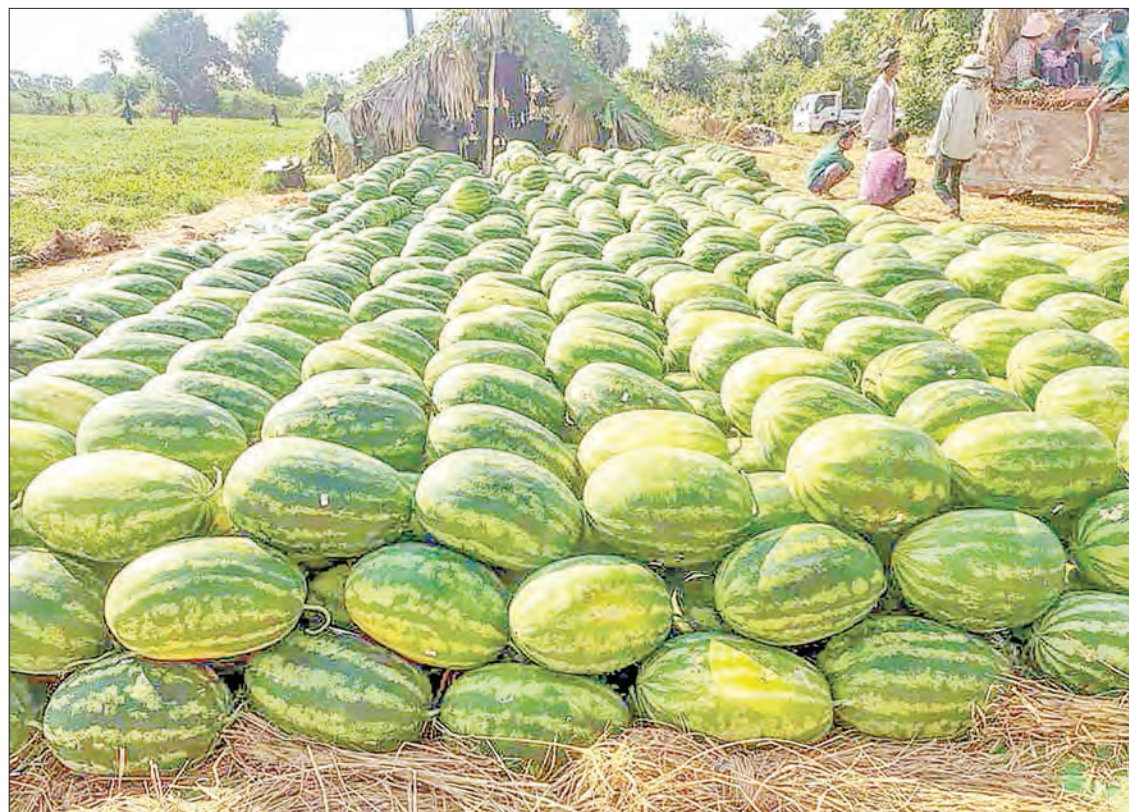
Watermelon and muskmelon will be harvested up to May-end across the country, except Kayah and Chin states.

During the previous financial year, the growers and the traders suffered the loss due to the price instability and trans-