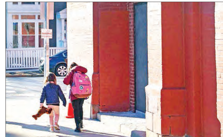
Children leave Hawthorne Scholastic Academy following their first day of in-person learning on March 1, 2021 in Chicago, Illinois.

We will lose the war against the pandemic if we do not ensure children get back to school safely, have access to health services,