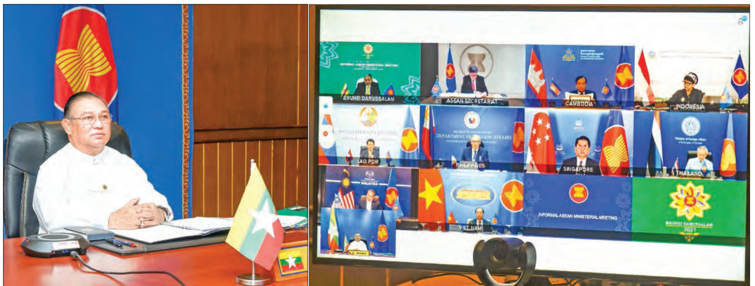
Union Minister U Wunna Maung Lwin joins the Informal ASEAN Ministerial Meeting online from Nay Pyi Taw on 2 March 2021.

The Union Minister for Foreign Affairs later apprised the meeting of the voting irregularities that occurred in the general elections which were held on 8