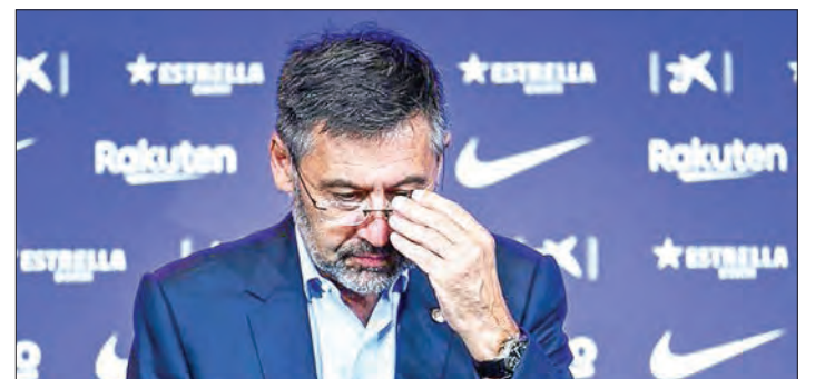
Barca president Josep Maria Bartomeu was detained by police on Monday.