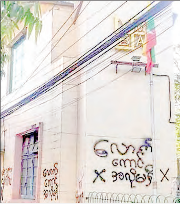
About 20 suspects attempted to destroy the YMBA building yesterday.

SOME unscrupulous persons deliberately destroyed the YMBA (Young Men's Buddhist Association) building located on Yay Kyaw street in Pazundaung Township of Yangan Region. About 20 unidentified suspects attempted to enter by destroying the fence of the building at about 8 pm on 1 March but to no avail. Therefore, they destroyed the YBMA signboard, glasses used in windows and three air conditioners. They also painted curse words on the walls and attempted to destroy the State Flag and Sasana Flag. Moreover, some protesters shouted out slangs in front of the building on the evening of 28 February. Therefore, YBMA also released a statement that such doings seemed to defame the YMBA that fought for Myanmar's Independence and led the national liberation movement, and show disrespect for Myanmar's history, country and Buddha Sasana. A case was opened against the suspects at Pazundaung Myoma police station.--MNA