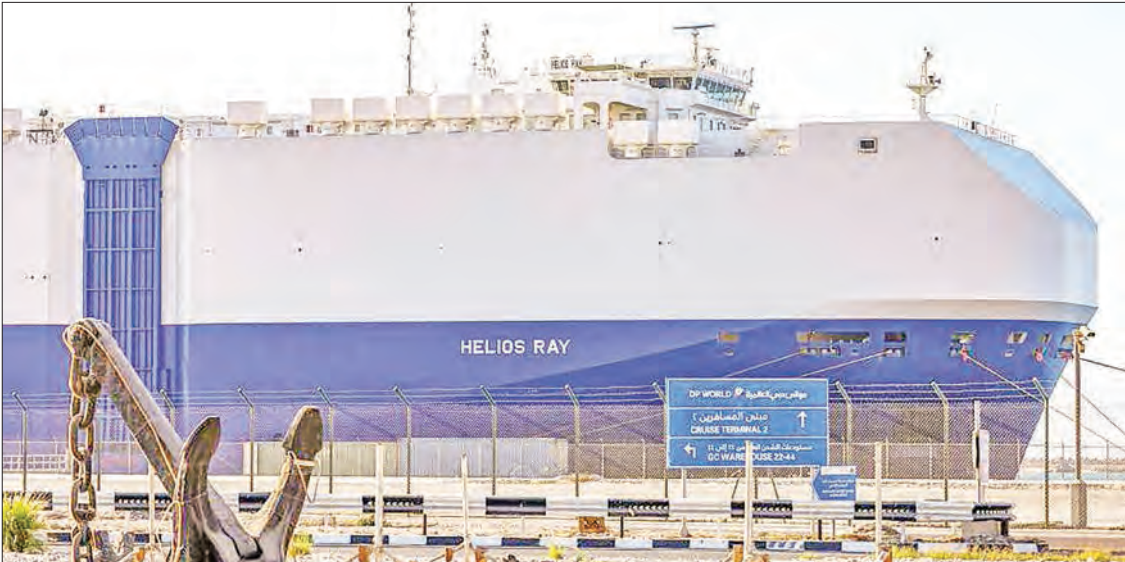
The MV Helios Ray vehicle carrier is owned by HELIOS Ltd, an Israeli company registered in the Isle of Man.