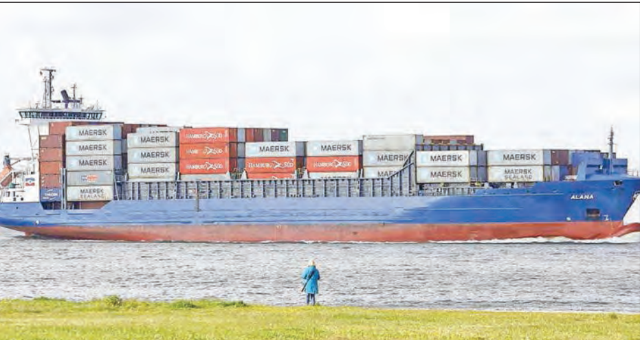
A container ship passing by the northern German port of Cuxhaven.

GERMANY exported 30 per cent less goods to Britain in January compared to a year ago, official estimates showed on Tuesday, with demand hurt both by Brexit and the coronavirus pandemic. Federal statistics agency Destatis said German exports to Britain have been declining since 2016, the year when the UK voted in a referendum to leave the European Union. But the drop in demand has sharply accelerated over the last year.