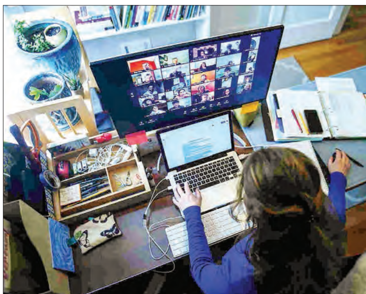
Millions of people are using Zoom to communicate.

One possible reason for the reaction is that number of companies anteing up for Zoom's subscription version of its service isn't rising as rapidly as during the pandemic's early stages. Zoom ended its latest quarter with 433,700 customers with at least 10 employees, an increase of 63,500 customers from July. In each of the previous two quarters, Zoom had added more than 100,000 customers with at least 10 em-