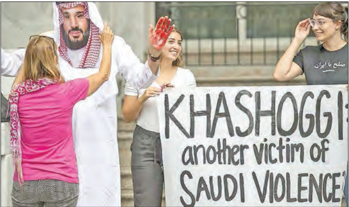
In this AFP file photo taken on October 10, 2018, a demonstrator dressed as Saudi Arabian Crown Prince Mohammed bin Salman (C) with blood on his hands protests with others outside the Saudi Embassy in Washington, DC, demanding justice for missing Saudi journalist Jamal Khashoggi.

gence report that found that Prince Mohammed ordered the 2018 killing of Khashoggi, a US-based contributor to The Washington Post who was lured into the Saudi consulate in Istanbul. The report found that seven of the 15 members of the hit squad that flew to Istanbul came from the Rapid Intelligence Force, which it said “exists to defend the crown prince” and “answers only to him.” The Treasury Department imposed sanctions on the force -- meaning any US transactions with it will be a crime -- but the administration stopped short of personally targeting the powerful crown prince. Price, following up on Friday’s release of the report, vowed that the Biden administration would put a higher priority on human rights following former president Donald Trump’s chummy relationship with the Saudis. “We have made crystal clear and will continue to do so that the brutal killing of Jamal Khashoggi 28 months ago remains unacceptable conduct,” Price said. —AFP ■