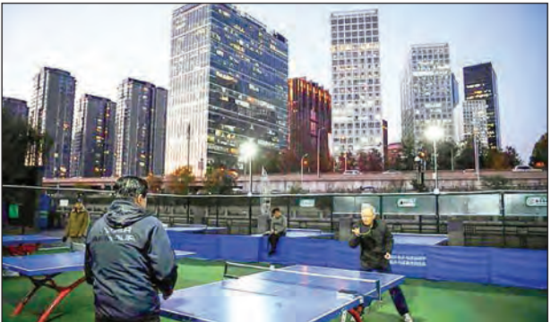
Beijing is top of the list with the world's most billionaires for the sixth year in a row.

MORE than 200 billionaires were created in China last year as booming stock markets and a flood of new listings offset the ravages of the virus pandemic, according to a global tally released Tuesday. The size of China's exclusive billionaire's club has almost doubled in the past five years as the world's number two economy continued to outpace most others, and its ability to mostly avoid the worst of the coronavirus meant it was one of the few to expand in 2020. And the Hurun Global Rich List showed 259 people breaking into the billion-dollar bracket – more than the rest of the world combined – taking China total to 1,058, the first country to break the 1,000 mark. In comparison, second best performer the United States saw 70 new billionaires created, taking its total to 696. Leading the Chinese pack was Zhong Shanshan of bottled water giant Nongfu, who entered the list for the first time with an $85 billion fortune, putting him number one in Asia and into Hurun's global top 10. Zhong, a former construction worker, made his cash following a $1.1 billion initial public offering in Hong Kong last year. However, a clampdown on ecommerce giant Alibaba saw tycoon Jack Ma fall down the pecking order. The one-time darling of China's entrepreneurs has come under pressure from regulators, who have reigned in Alibaba and fintech arm Ant Group on anti-trust issues. —AFP ■