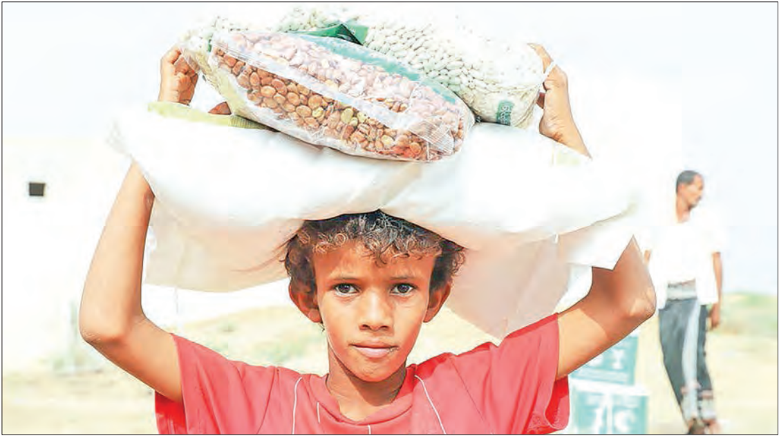
Photo taken on Feb. 14, 2021 shows a boy carrying the food donated by a charity group in Hajjah Province, north Yemen.

The entire UN system must efficiently and effectively carry out humanitarian operations, and strengthen coordination with regional countries and organizations. All parties to the