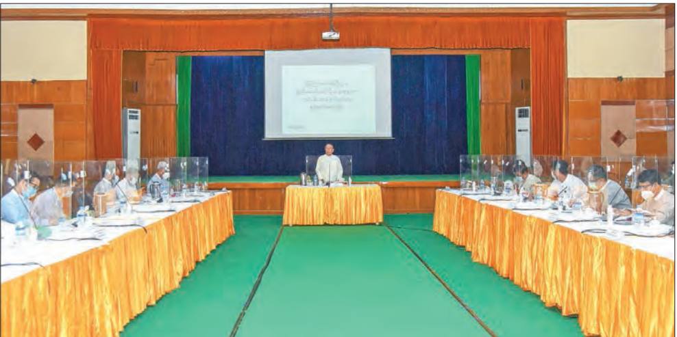
Union Minister U Chitt Naing presides over the MoI coordination meeting on 1 March 2021 in Nay Pyi Taw.

tion serve the country with good spirits, good discipline and enthusiasm, ingenuity and loyalty to their country and people although they are being deployed to the remote areas. He also urged to continue to be dutiful. The Deputy Minister and the departmental officials reviewed the activities in February and discussed the plans for March.—MNA