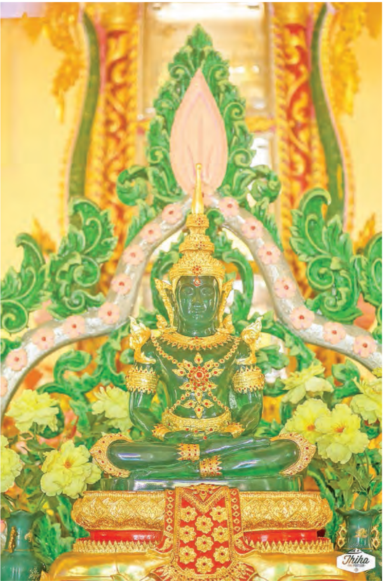
The Buddha statues made of gems are seen in the compound of Thar Taw Myanmar pagoda