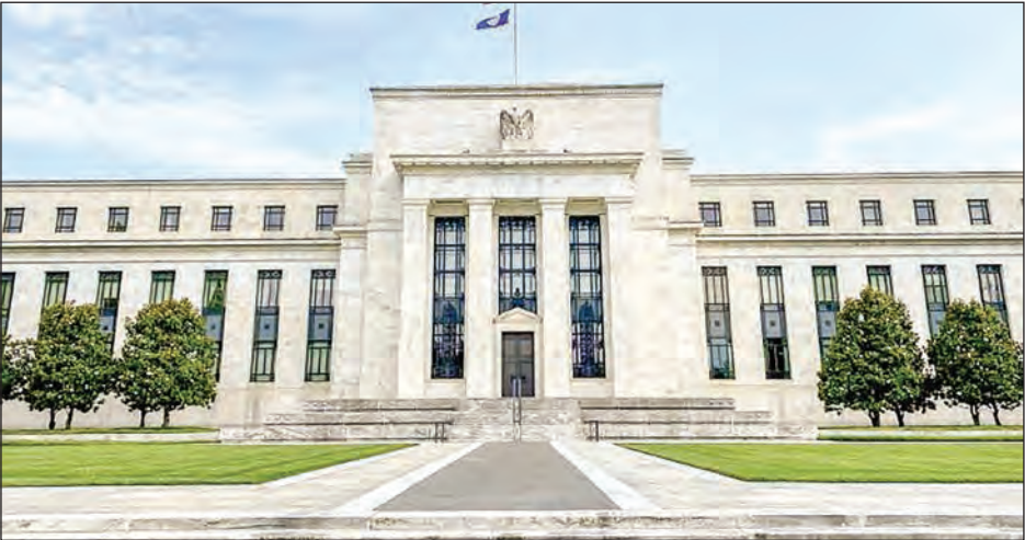
The US Federal Reserve is in the hot seat as investors are edgy about an earlier rise to interest rates than the central bank has indicated.

INVESTORS are watching inflation carefully, worried that a boiling over of prices will ruin the expected strong pandemic recovery although analysts believe Europe faces much less of a risk than the United States. Fears that US President Biden’s $1.9 trillion stimulus plan -- which was passed by the House of Representatives on Saturday -- will stoke up the economy too much have unnerved investors in recent weeks. A rise in yields on 10-year US Treasury bonds -- a key indicator of expectations -- shows the markets believe prices are set to rise much more sharply than last year’s gain of 1.4 percent, which could force the US Federal Reserve to hike interest rates earlier than it says it plans to do. Bond yields have risen elsewhere too, with 10-year French government bonds turning positive on Thursday for the first time in months while the benchmark 10-year German Bund has also risen although it remains negative. European inflation data for January showed a jump in prices of 0.9 percent compared to a minus 0.3 percent reading in December, as increased costs of raw materials fed through into services and industrial goods.—AFP