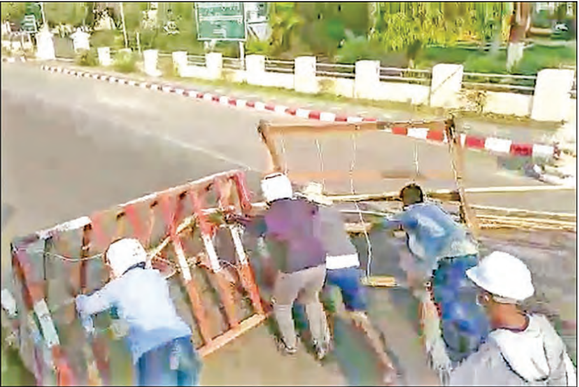
Rioters put blockage on a road in Dawei, Taninthayi Region.

Although the State Administration Council is not willing to take action against the civilians under the existing law, the council released announcements for the public to know the criminal procedures and not to follow the incitement that harm the stability of the state. Therefore, it is requested to the people not to follow the negative incitement of NLD politicians, and to continue to focus on livelihoods.—MNA