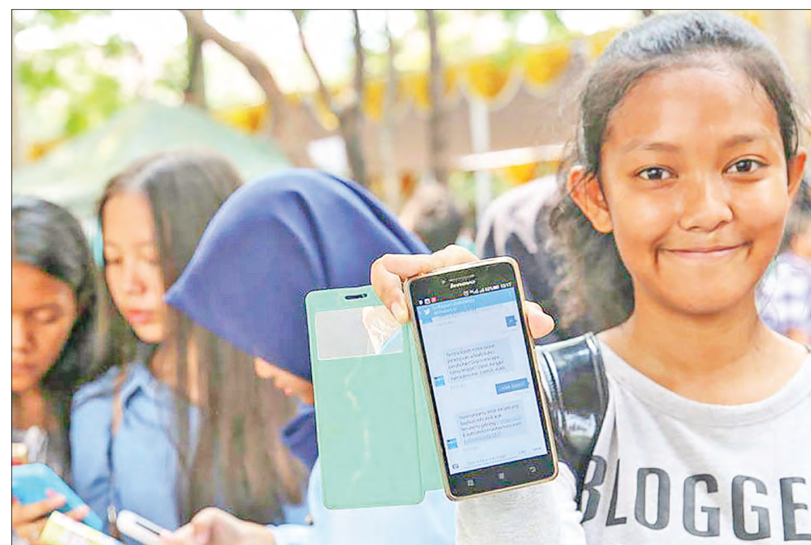
Indonesian adolescent girls use their smartphones.

in developing countries plus the demographic trends will not create economic incentives to replace labour in manufacturing - not yet.”