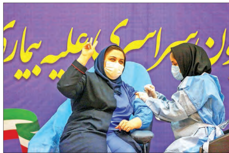
A health official receives a dose of Russia’s Sputnik V vaccine in Tehran, Iran on February 09, 2021.

“In the recent couple of days we read and heard a lot about Chinese vaccines going overseas and being embraced by many developing countries,” Foreign Ministry spokeswoman Hua Chunying said at a press conference on Feb. 19. “Some media reports said the vaccines became Spring Festi-