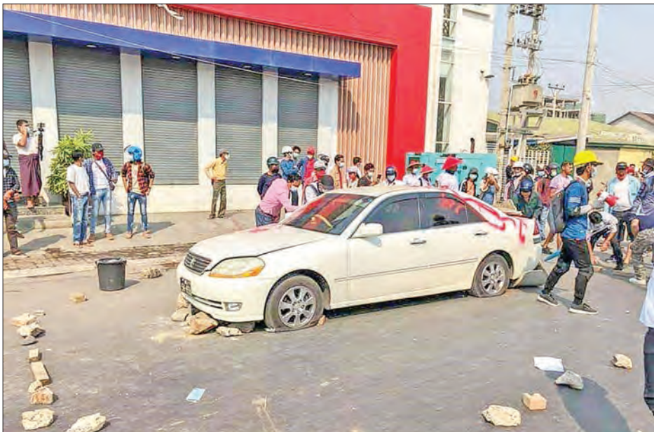
A car damaged by rioters in Chanmyathazi Township.