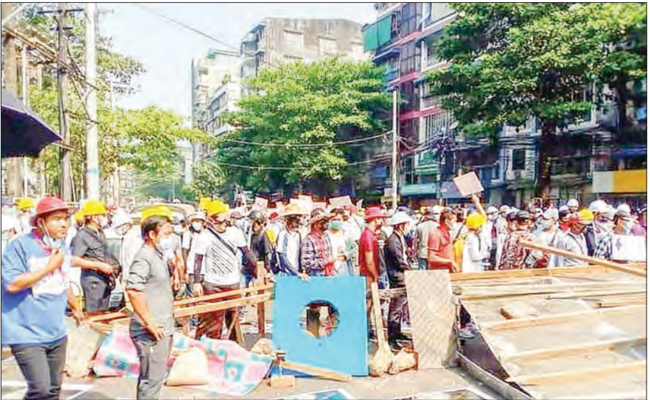
Bloekage made by rioters in Yangon.