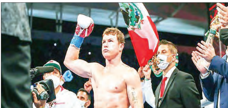
Saul "Canelo" Alvarez celebrates after crushing Turkey's Avni Yildirim in three rounds at Miami's Hard Rock Stadium on Saturday.

The outclassed Yildirim then failed to emerge from his corner for the fourth round as Alvarez once again demonstrated why he is regarded as the