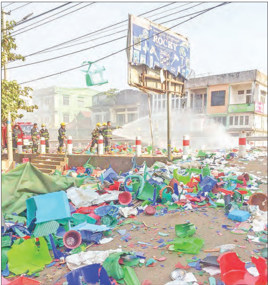
Properties destroyed by rioters in bago.

Moreover, the police used sound bombs, .12V gun and tear gas canisters