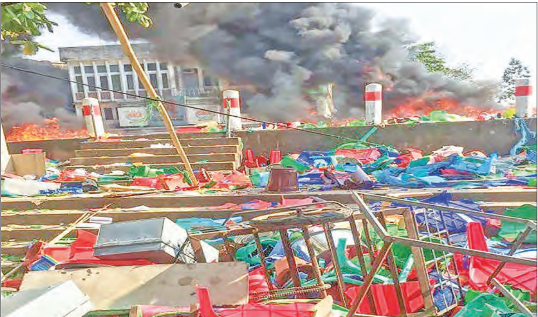
Debris are seen on a road in Bago after rioters destroy a shop.

As the State Administration Council is not willing to take action against the people under the existing laws, the council has issued orders and notifications to the people to understand the criminal laws to ensure that they can avoid from incitement for riots. Hence, the people are requested not to accept the incitement of NLD politicians and to focus on livelihoods.—MNA