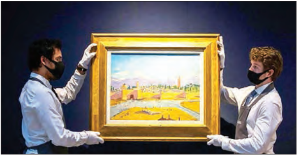
Gallery workers pose with Winston Churchill's 'Tower of Koutoubia Mosque' during a photocall at Christie's auction house in central London.

HOLLYWOOD'S Angelina Jolie and Britain's iconic wartime prime minister Sir Winston Churchill, a keen artist who took inspiration from the Moroccan city of Marrakesh, are combining for a March 1 date at Christie's auction house in London.