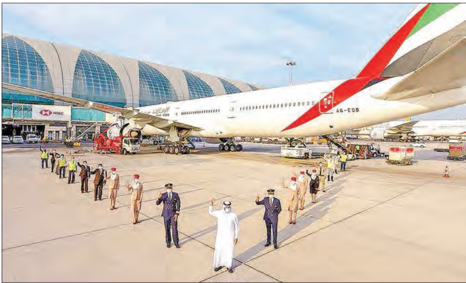
Emirates has become among the first airline in the world to operate a flight with fully-vaccinated frontline teams.

Also supporting the flight's operations were fully-vaccinated aircraft appearance, loading and special handling teams from dnata, as well as