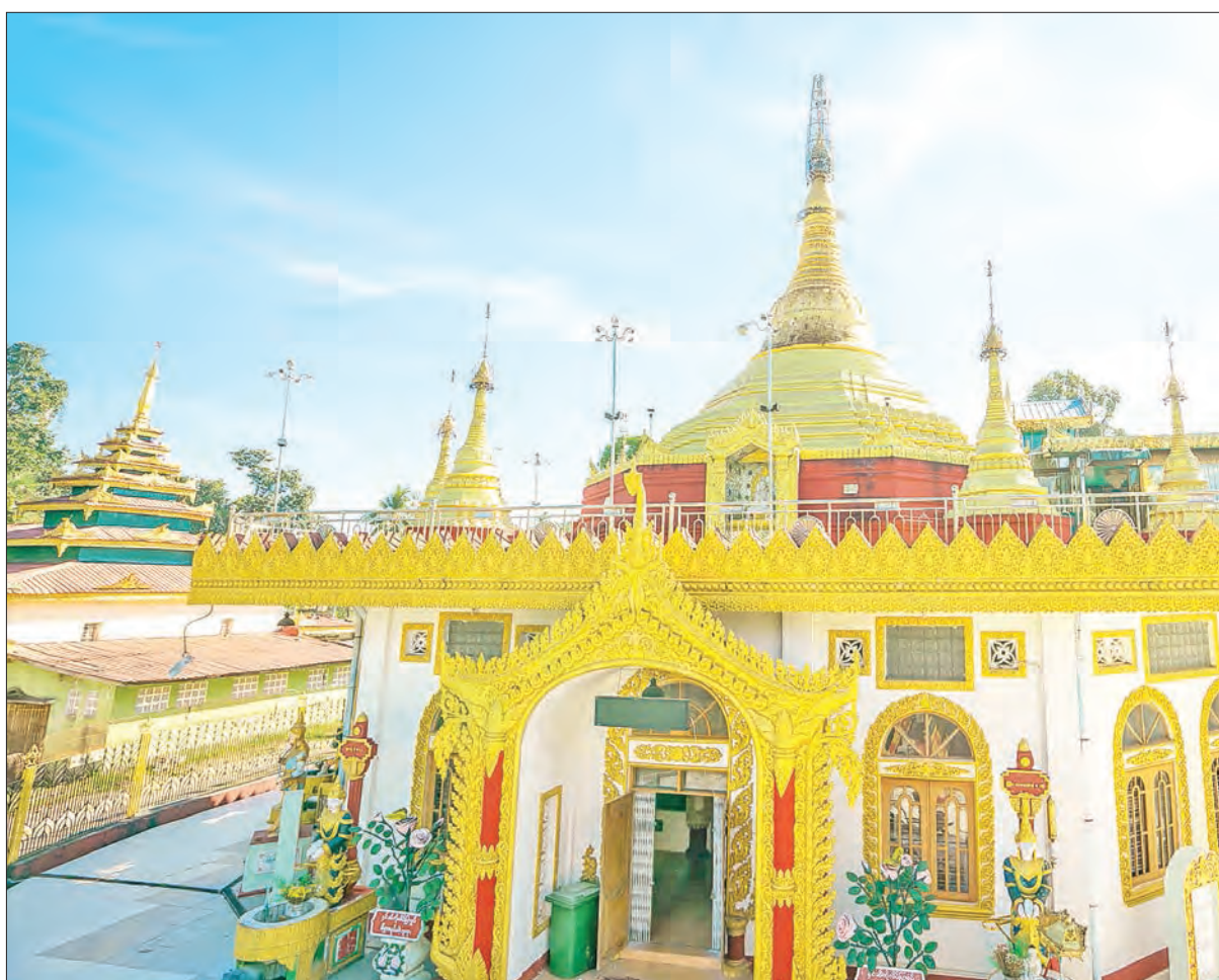
Thar Taw Myar pagoda

wide enough for two cars. There is also cliff. Therefore, walking is the best to get there. If you cannot walk, you can hire motorcycles at K5,000 for a round trip. Although it is not a fair price, you should support the residents. You have to go down to reach the waterfall. There is a small shop and you can order food. The road to waterfall is slippery when it rains. You can slip and fall even this season. The waste issue becomes worse. The visitors easily throw their waste. They even throw the masks which are new waste. If the shop owners and motorcycle taxi drivers collectively collect the garbage or put the dustbins, the environment will be better than before. The visitors also should keep their waste or throw into the dustbins.