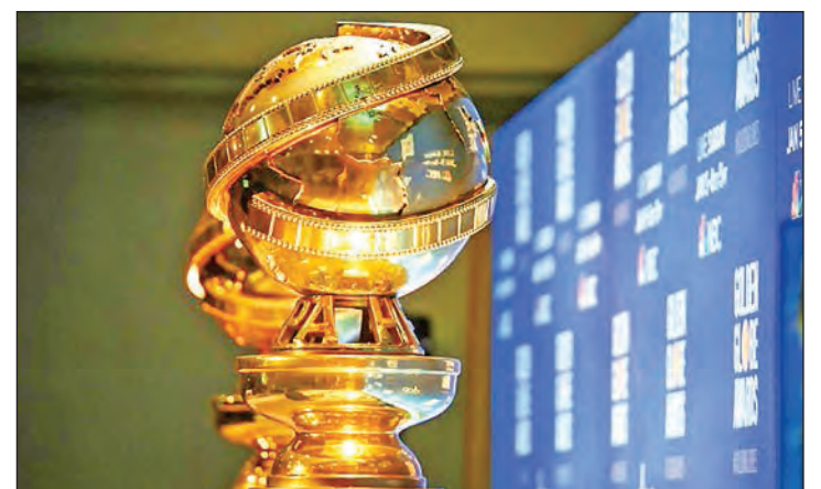
Hollywood's award season kicks off Sunday at a very different Golden Globes, with a mainly virtual ceremony set to boost or dash the Oscars hopes of early frontrunners like "Nomadland" and "The Trial of the Chicago 7." PHOTO: AFP

"Nomadland," Chloe Zhao's paean to a marginalized, older generation of Americans roaming the West in rundown vans, has long been viewed as a frontrunner for the Globes' top prize. —AFP ■