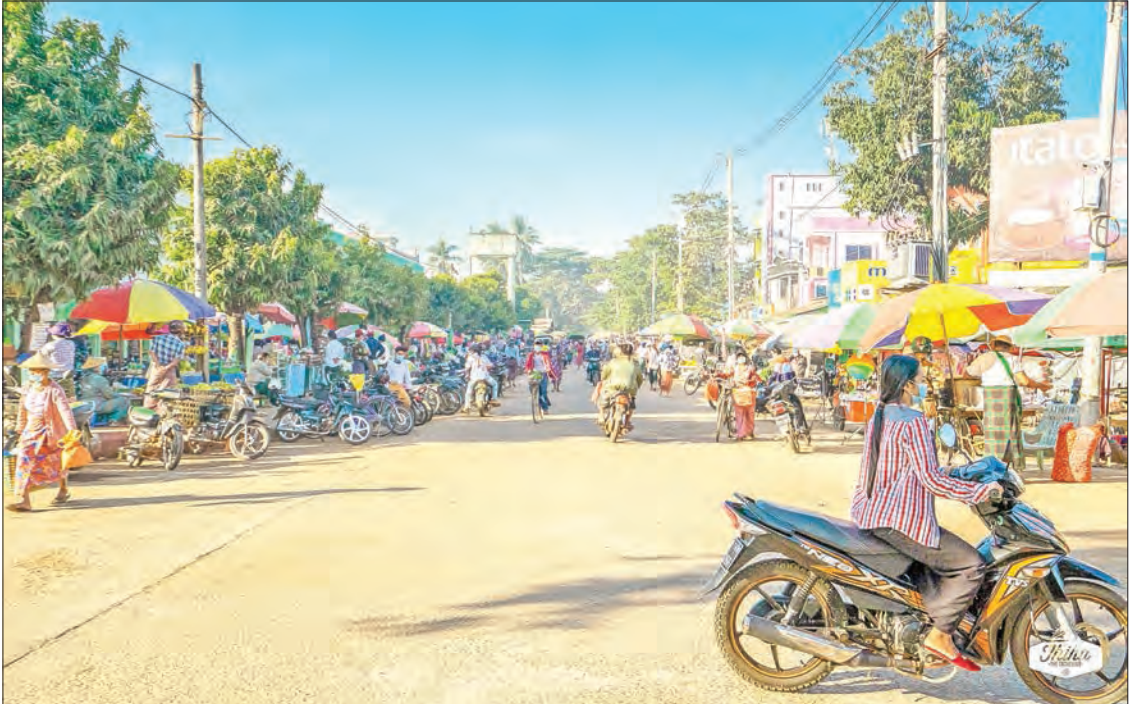
The market is crowded with buyers and vendors in early morning

a trip with Gold Tripper. Those who are tiring of living in the Yangon cities can make a short day trip to Taikkyi. May all you have a safe trip!