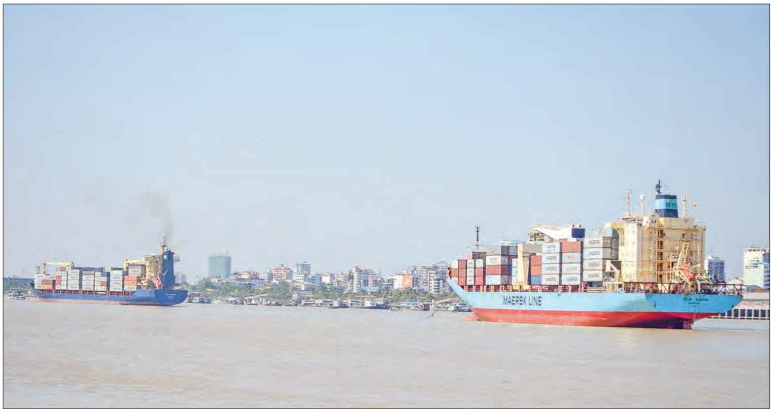
Myanmar's sea trade generated $26 billion from an overall trade value of $36 billion in the last FY2019-2020, the Ministry of Commerce's statistics indicated.

the Myanmar Mercantile Marine Development Association, some ocean liners suspended cargo transport from Myanmar.