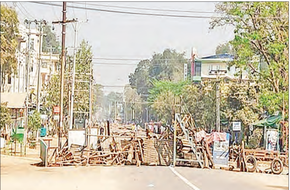
Blockage are seen on a road in Pakokku.