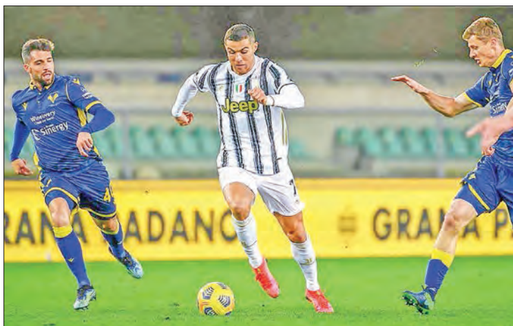
Cristiano Ronaldo scored his 19th goal this campaign but champions Juventus settled for a 1-1 draw at Hellas Verona in Serie A on Saturday.

Cristiano Ronaldo scored his 19th goal this campaign but champions Juventus had to settle for a 1-1 draw at Hellas Verona in Serie A on Saturday.