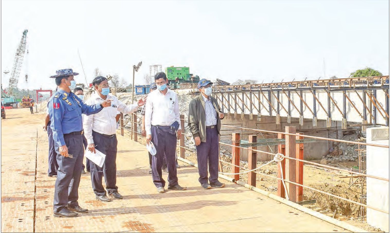
Union Minister Admiral Tin Aung San inspects Yangon-Toungoo Railway section which is being upgraded.

UNION Minister for Transport and Communications Admiral Tin Aung San inspected the Yangon – Mandalay Railway Improvement Project Phase 1- upgrade processes of Yangon-Toungoo railway section yesterday. Firstly, the Union Minister met the respective Myanmar Railways officers of region (5) and (6) at Ottwin, and the project engineers presented the completed and ongoing processes. Then, the Union Minister discussed the importance of railways in transportation sector and role of railways staff for the country. He emphasized the detailed study and draft of long-term plan for the development of transportation sector based on the findings, quality infrastructure, technical and investment of local private entrepreneurs in implementing the projects, duties of officials to timely complete the projects implemented with foreign loans and occupational safety. He also highlighted the effective use of budget, chances to learn the techniques of foreign countries, dutiful manners in respective sectors, efforts to run