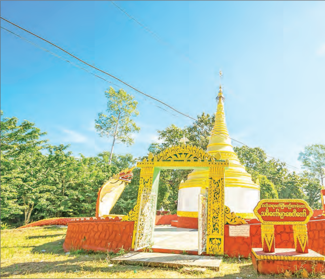
Thamee Taw Myar Pagoda

are monastery and school, the people pay a visit to the pagoda on the mountain. The pagoda is located on the mountain and so the Yangonites will enjoy such mountaineering. The mountain is not too high and the scene from the mountain is very picturesque. You can also enjoy the beauty of river, greenish view and rubber tree forest. It will take about 45minutes form the Toll Gate of Taikkyi. You can also see the gardens along the way. The road is not rough. It will take you a little longer to Pan