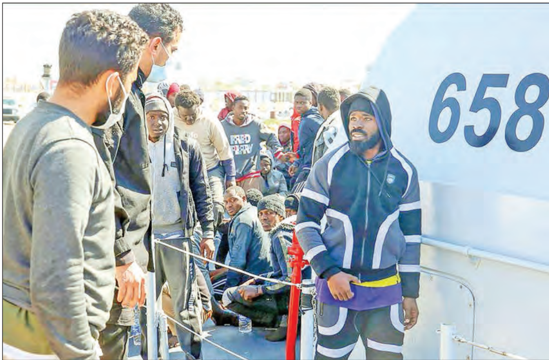
Almost 100 migrants were rescued off Libya's west coast on Sunday as they made failed attempts to reach Europe, while around 20 were missing, AFP reporters and the coastguard said.

ALMOST 100 migrants were rescued off Libya's west coast on Sunday as they made failed attempts to reach Europe, while around 20 were missing, AFP reporters and the coastguard said.