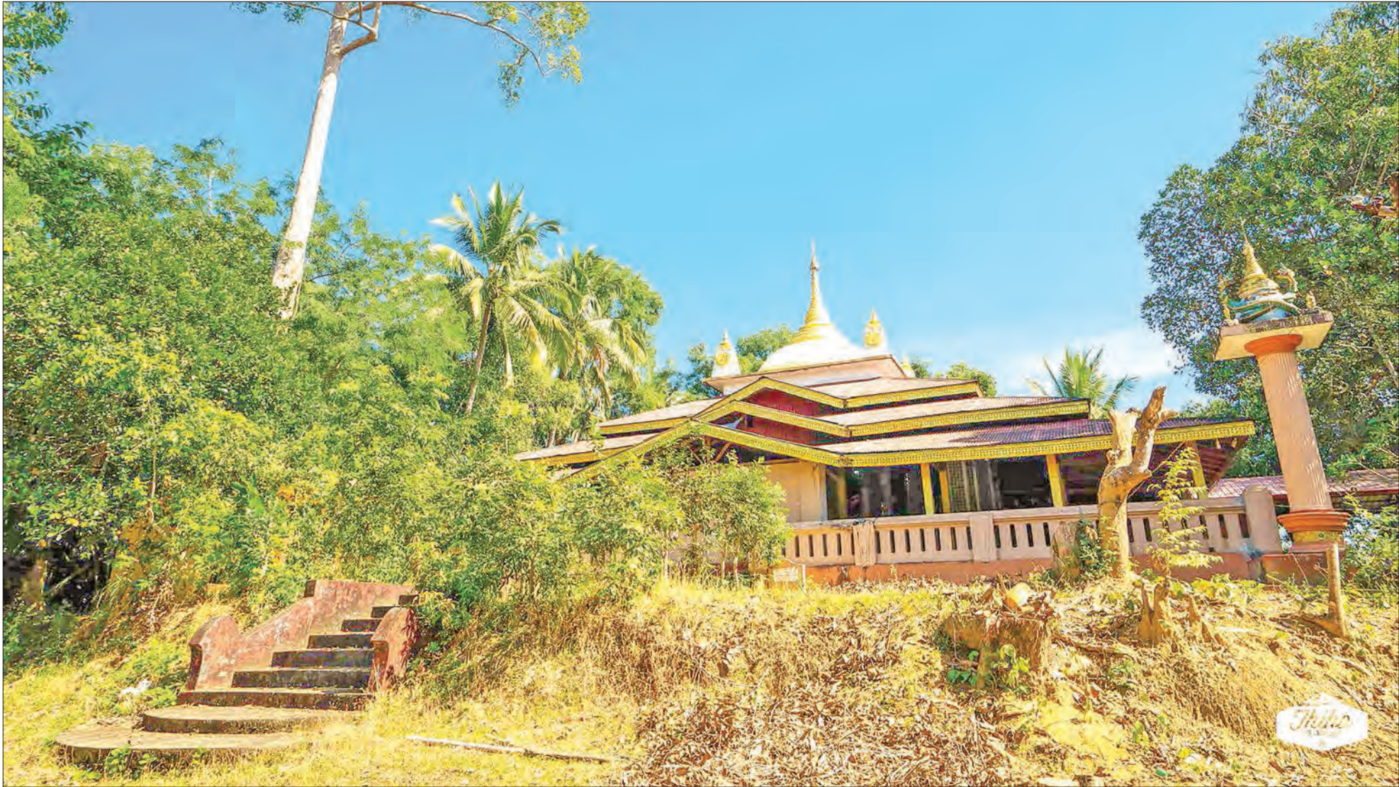
Sal Taung Pyae pagoda