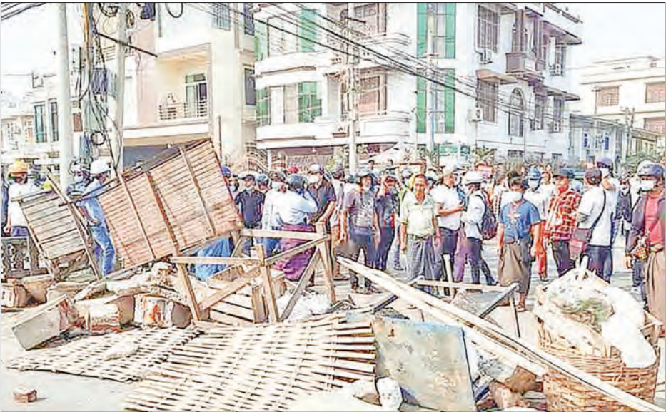
Blockage made by rioters in Mandalay.