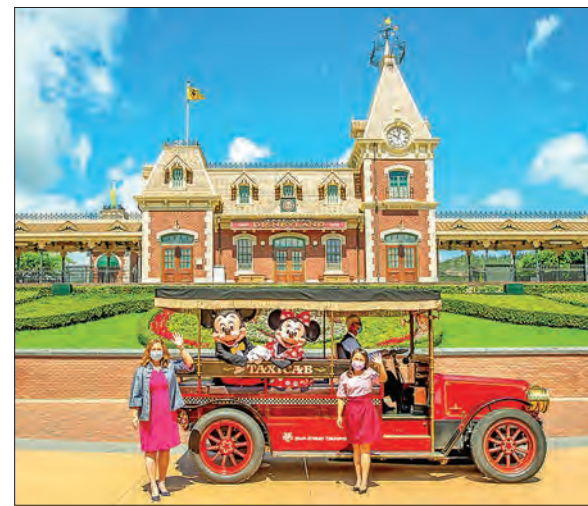
Hong Kong Disneyland reopened Friday with the territory's government lifting some social distancing measures to fight the spread of the coronavirus as the pandemic eases.

The closures came after the park saw a declining number of visitors. Full-year attendance through September 2019 dropped 4 per cent from a year earlier to 6.5 million visitors, according to company figures. — Kyodo News ■