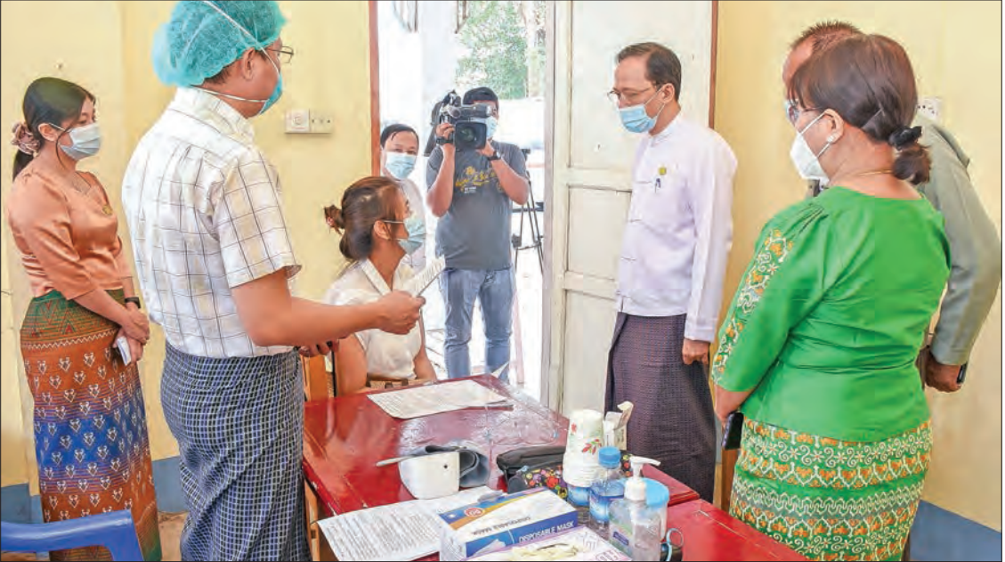
The Union Minister, Deputy Minister and party are encouraging the monks, civil services personnel and people over 65 on 20 February.