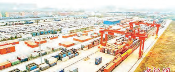
A distribution center for the China-Europe Railway Express in Zhengzhou.

FREIGHT trains along the China-Europe route continued to deliver a wide variety of goods and products from countries along the Belt and Road to their final destination in China during the Spring Festival, providing consumers with more choices during the country’s most important traditional festival, Chinanews.com reported on Feb.17. In recent days, the freight trains have transported foreign commodities, including pure milk, chocolate, and cold-chain foods all the way to Zhengzhou, capital city of central China’s Henan province. Transporting these foreign products to China’s market amid a worldwide pandemic is a difficult task. “We must strengthen epidemic control measures throughout the whole procedure, while keeping the products fresh,” stated Li Ming, deputy station-master of Putian Station on the Zhengzhou section operated by China Railway Zhengzhou Bureau Group Co., Ltd. — Xinhua ■