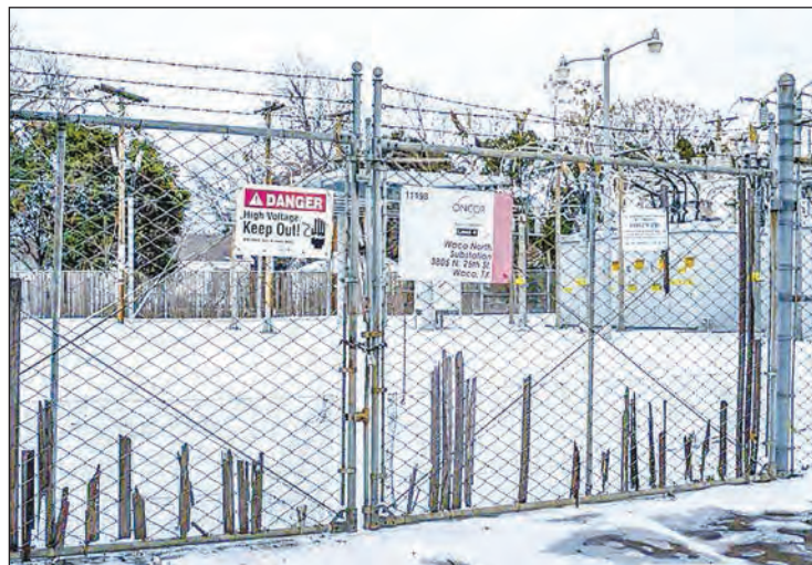
Electric power disruptions in Texas resulting from deadly winter storms has also forced the closure of semiconductor plants, worsening a global chip shortage.

said last week it was assessing immediate steps to address the semiconductor shortage and planned an executive order to shore up critical supply chain items.