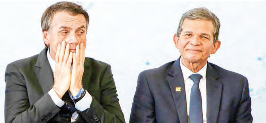
In this file photo taken on December 14, 2018, then-President-elect Jair Bolsonaro (L) and General Joaquim Silva e Luna attend a ceremony at a navy base in Itaguaí city, Rio de Janeiro state.

BRAZIL’S far-right president, Jair Bolsonaro, appointed an army reserve general to lead state-owned energy giant Petrobras, after criticizing several successive increases in the price of fuel. “The government decided to appoint Joaquim Silva e Luna to fulfill a new mission, as... president of Petrobras, after closing the cycle, exceeding two years, of the current president Roberto Castello Branco,” said a brief note from the Ministry of Mines and Energy, published by the president on his Facebook account. Silva e Luna, formerly the defense minister under president Michel Temer, had been serving as general director of the Itaipu Binacional dam.