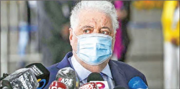
Health Minister Gines Gonzalez Garcia was asked to step down after it emerged that people close to him had skipped the line for a Covid-19 vaccination. ARGENTINA’S President Alberto Fernandez asked his health minister to resign Friday after it emerged that friends of his had skipped the line for a Covid-19 vaccination.

after a 71-year-old journalist, Horacio Verbitsky, announced on the radio that, owing to his longstanding friendship with Health Minister Gines Gonzalez Garcia, he had already been able to get vaccinated in his office. Local media reported that other people close to the government were also vaccinated at the health ministry. Fernandez, who is in his 60s and was vaccinated in front of cameras to encourage Argentinians to sign up, ordered his chief of staff to ask for the minister’s resignation, officials said. Argentina, with 44 million inhabitants, has recorded some two million Covid-19 cases and suffered more than 50,000 deaths. —AFP ■