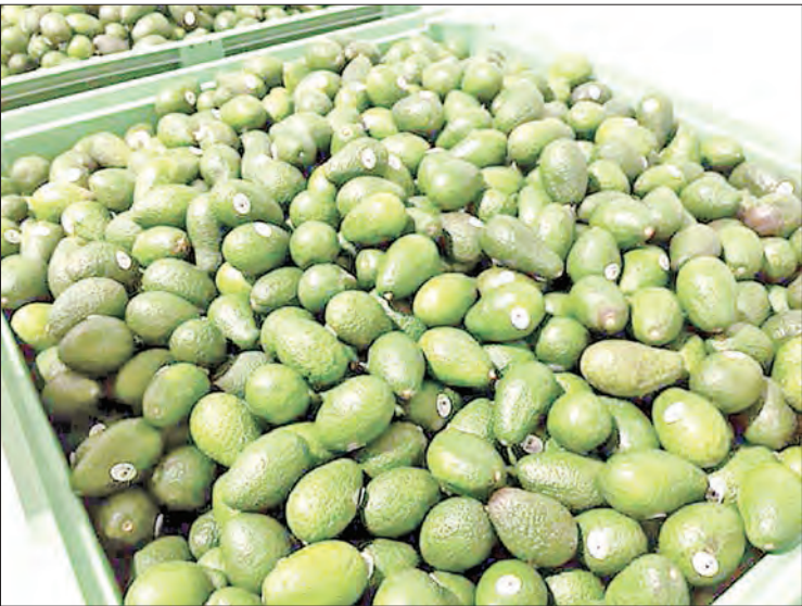
The avocado farmers grow good avocado varieties to export and the foreign countries make an offer between 1,000 and 2,000 tonnes of avocado.

“We received an offer to export avocado in the coming year. The avocado received good results in the British market. Singapore and Thailand also offered to import Myanmar avocado,” he said.