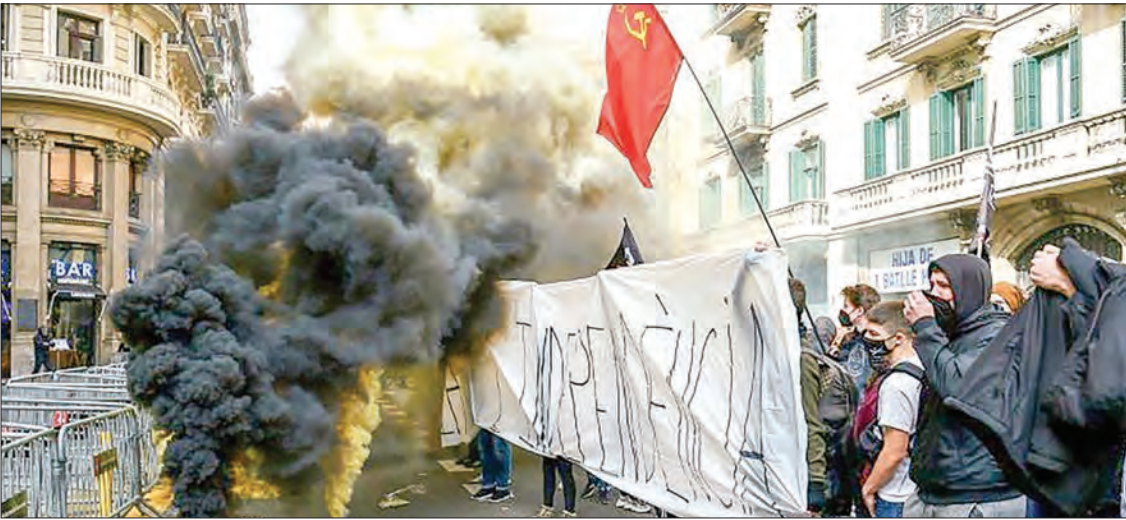
Protests that began in Catalonia have now spread to other cities, including Madrid.

SPAIN’S government will confront all forms of violence, Prime Minister Pedro Sanchez said Friday as violent protests over the jailing of a rapper for controversial tweets ran into a fourth night.