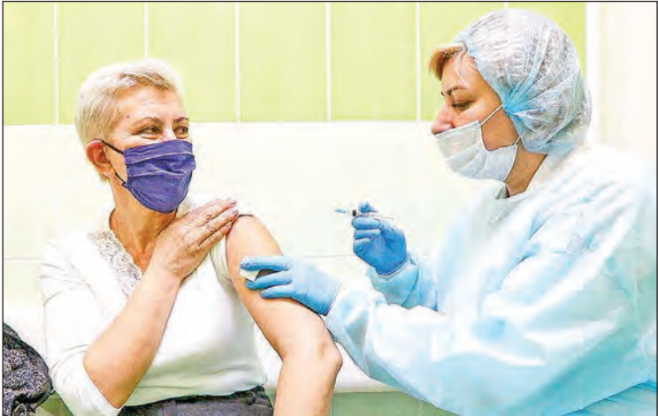
Russia has registered its third coronavirus vaccine named CoviVac developed by the Federal Scientific Centre for Research and Development of Immune and Biological Products. health officials had said would enter mass production this month. Mishustin said Saturday that

tributed within the civilian circulation,” he told the cabinet. First greeted with scepticism, the effectiveness of Sputnik V was confirmed by the Lancet medical journal earlier this month. Moscow relied on the nationwide rollout of the vaccine to stave off the impact of a second wave of infections that battered the country late last year. But mortality data released recently revealed that Russia’s death rate was still one of the highest in the world. President Vladimir Putin announced in October that the country had registered its second vaccine, EpiVacCorona, which