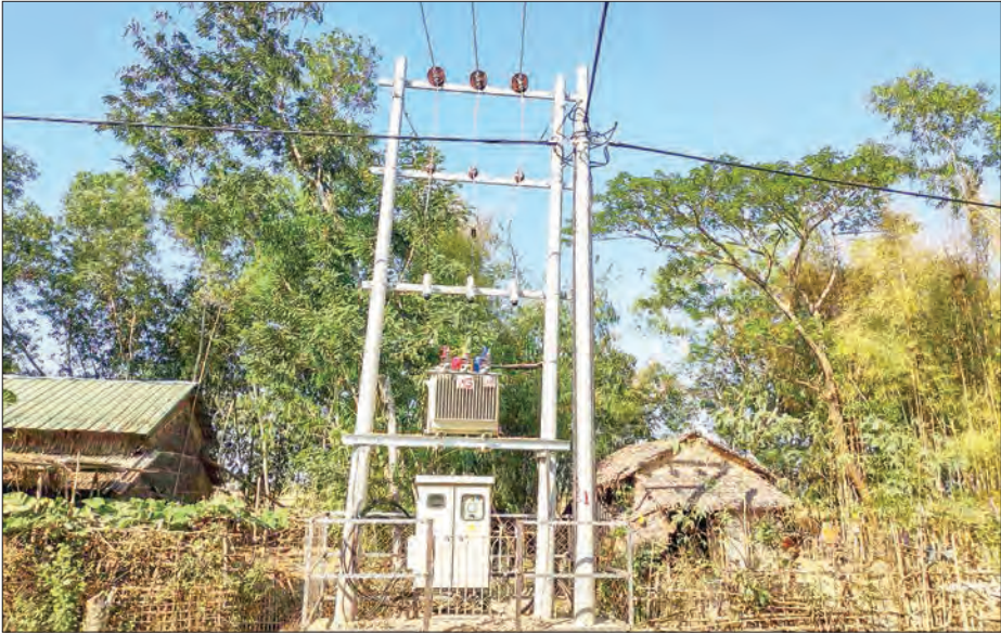
According to the Township Electricity Manger's Office, only six villages remain to have access to electricity.

ABOUT 90 per cent of the rural areas in Dala township can now access electricity. According to the Township Electricity Manger's Office, only six villages remain to have access to electricity. There are 54 villages in 23 village-tracts of Dala township in the Yangon region. Only six villages need to access electricity. Therefore, all the villages will have access to electricity very soon. "In 2020-2021, only six villages are left to install electricity. These villages are Kyutawyo village, Chaw Lae Wa village, Wae Gyi village, Thayaw Than village, Thayargone village and Nyaung Laybin village. The 400-volt power lines and 11 kV power lines have also been installed. The electricity could be supplied