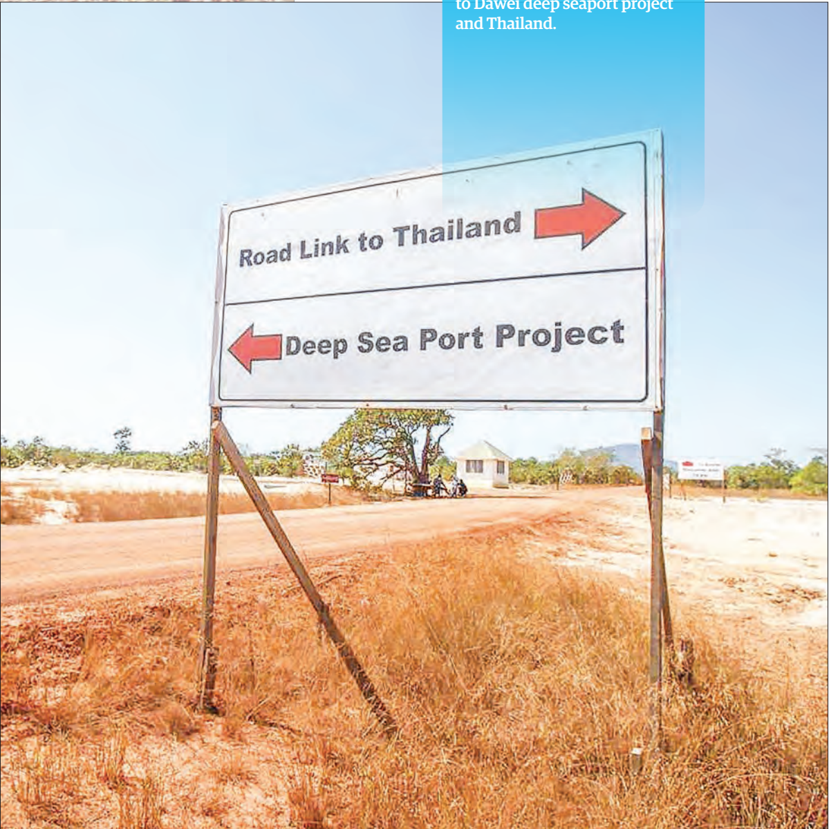
The photo shows a road sign to Dawei deep seaport project and Thailand.

area of 2,000 hectares, including the jetty and industries. Upon completion, it will be the largest economic zone in the South-east Asian region, quoted the officials from the Ministry of Investment and Foreign Economic Relations in their review as saying. Myanmar accepted the proposal from Japan to be a part of Dawei Special Economic Zone, according to the official release from the Ministry of Investment and Foreign Economic Relations. The project of Dawei Special Economic Zone is divided into two parts—primary project and a main project. Italian-Thailand Company has already got permission to implement the primary project, and it will carry out nine projects, including Dawei-Hteekhee road project, small jetties and LNG port. Japan will undertake the main project of the Dawei Special Economic Zone. The plan to upgrade Dawei-Hteekhee road project will begin in June or July in 2021. Once Dawei-Hteekhee road upgrading project has been finished, anyone will be able to go to Thailand by land besides an extension of trade area to Southeast Asian countries through Thailand.