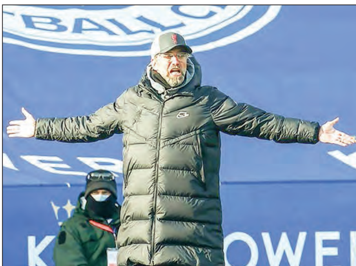
Liverpool manager Jurgen Klopp.

LONDON — Jurgen Klopp says Liverpool won't focus on catching Manchester City when he reviews what went wrong in their disastrous Premier