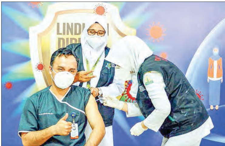
A man gives a thumbs up as he receives a COVID-19 vaccine in Bandah Aceh, Indonesia.

MORE than 200 million coronavirus vaccine doses have been administered in at least 107 countries and territories, according to an AFP count based on official sources Saturday.