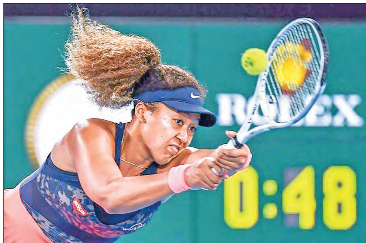
Osaka has won her fourth major title.

JAPAN'S Naomi Osaka dismissed Jennifer Brady in straight sets to win the Australian Open and underline her growing hold on women's tennis on Saturday.