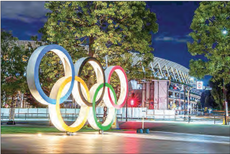
This photo taken on Nov. 10, 2020 shows the illuminated Olympic rings outside Tokyo’s National Stadium, the main venue for the Tokyo Olympic and Paralympic Games.

the meeting, “I was able to gain support from all the leaders. It was so encouraging.”