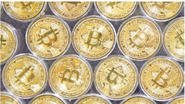
The price of a bitcoin has rise by nearly 90 per cent since the start of this year.

THE total value of all bitcoin topped $1.0 trillion on Friday, capping a spectacular record-breaking week for the world’s most popular cryptocurrency. At about 1930 GMT, bitcoin zoomed to its latest all-time pinnacle at $55.155 after a string of corporate giants embraced the digital unit. With more than 18.6 million bitcoins created since the digital currency was launched in 2009, the entire market is now worth $1.015 trillion, according to data provider Coinmarketcap.com. “This is certainly big news for the industry and this would not have been possible without the involvement of smart money,” said AvaTrade analyst Naeem Aslam. “The reason that one trillion dollar market cap is significant because not many believed that bitcoin can achieve this. Now, we have a real number which is massive in size and we are going to get more investors joining this rally,” he added. Bitcoin has set a blistering record pace, blasting past $50,000 on Tuesday, a week after Tesla revealed it had invested $1.5 billion in the unit. —AFP ■