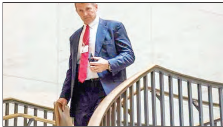
Erik Prince, founder of private military contractor Blackwater USA, violated a UN arms embargo on Libya, a confidential report has reportedly found.

PRIVATE security contractor and ally of former US President Trump Erik Prince violated a United Nations arms embargo on Libya, UN investigators have found in a report detailed by US media on Friday.