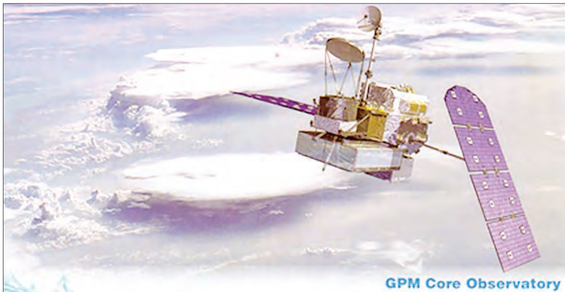
The Global Precipitation Measurement (GPM) Core Observatory

Today, scientists can measure precipitation directly- using ground-based instruments such as rain gauges-or indirectly-us-