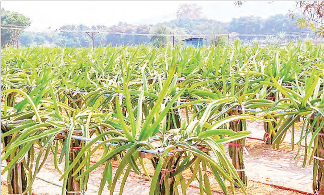
Now, dragon fruits are being grown across the country. There are three types of dragon fruit species -- white, yellow and red.

After one year, the fruits can be started to pick up. One box of dragon fruits contains 28 fruits if it is a big one and 32 fruits if it is a small one, which is priced between K12,000 or 15,000. If the plants have cared well, they can be harvested and sold for up to 17 years.