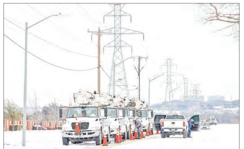
The winter storm spawned at least four tornadoes, according to Atlanta-based weather.com.

Los Angeles has postponed more COVID-19 vaccination appointments originally scheduled for Saturday as vaccine shipments remain mired in transit. Local officials pushed back 12,500 appointments scheduled Friday because of supply disruptions. — Xinhua ■