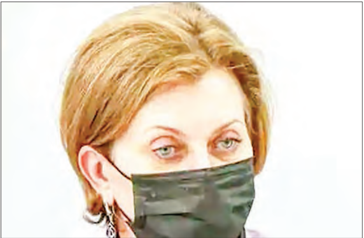
Anna Popova,praised “the important scientific discovery,” saying “time will tell” if the virus can further mutate.

While the highly contagious strain H5N8 is lethal for birds it has never before been reported to have spread to humans. —AFP ■