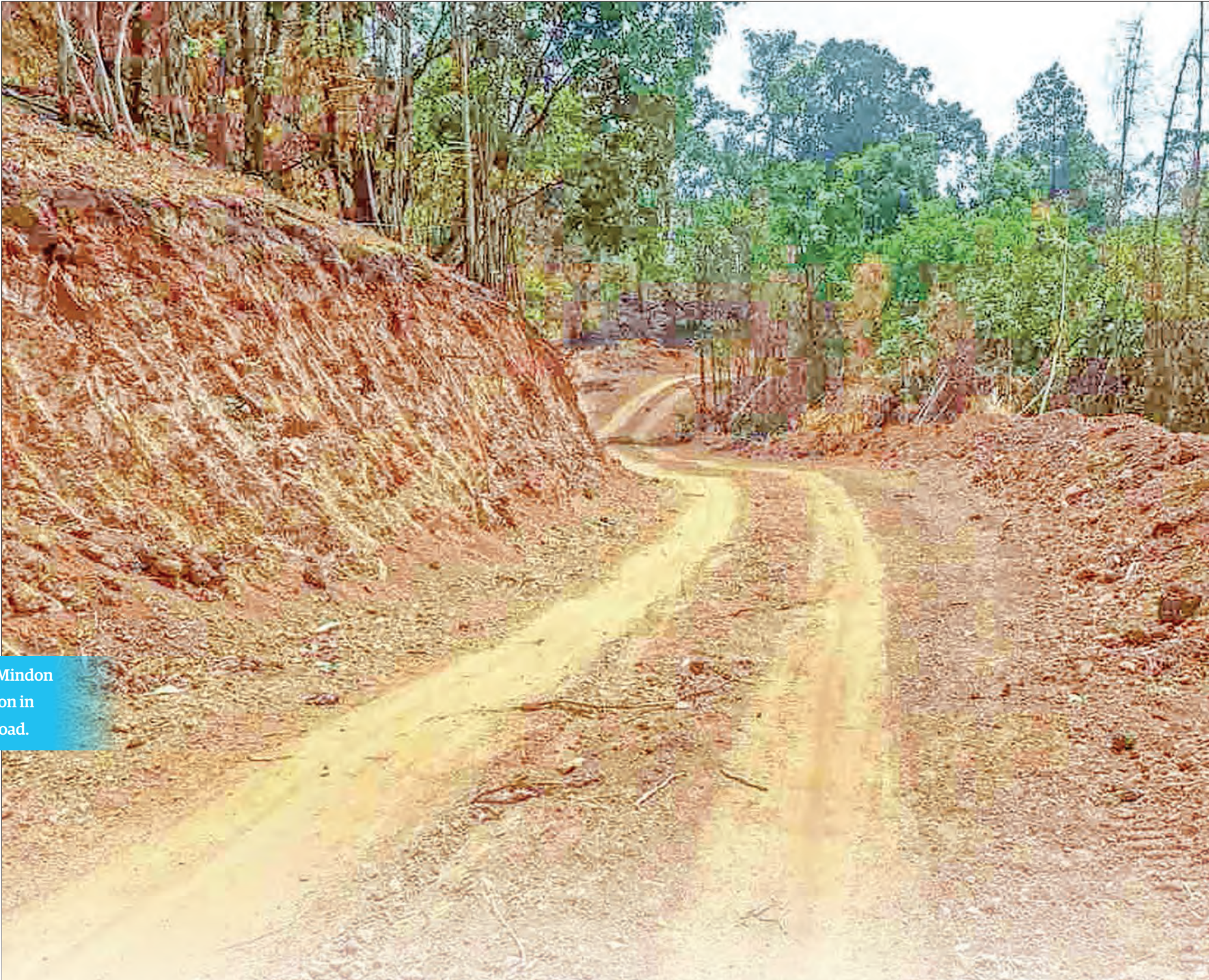
The photo shows Mindon earthen road section in Dawei-Hteekhee road.