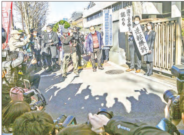
Plaintiffs' lawyers hold banners in front of the Tokyo High Court on Feb. 19, 2021, that say they have won a damages suit against the government and Tokyo Electric Power Company Holdings Inc. over the 2011 Fukushima Daiichi nuclear accident.

A Japanese high court on Friday overturned a lower court decision that dismissed the state's responsibility in the 2011 nuclear crisis, ordering