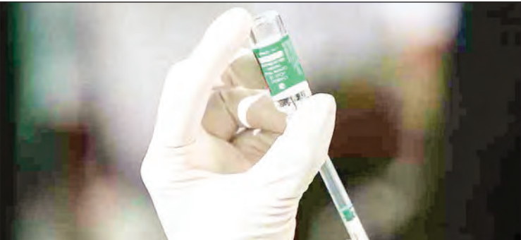
A three-month interval between doses of the Oxford COVID-19 vaccine results in higher vaccine efficacy than a six-week gap, according to a new study which says the first dose can offer up to 76 per cent protection in the months between the two jabs.

Mr Pollard believes policies of initially vaccinating more people with a single dose may provide greater immediate population protection than immunising half the number of people with two doses, especially in places where the Oxford vaccine is in limited supply. —ANI ■