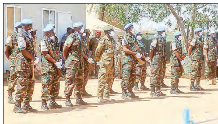
The peace process has drifted as South Sudan reels from economic crisis, brutal ethnic violence, an armed insurgency, and its worst hunger crisis since declaring independence from Sudan in 2011.

ON the eve of its first anniversary, South Sudan's unity government is in trouble, with the country's fragile peace process in doubt and old rivalries again threatening a return to war.