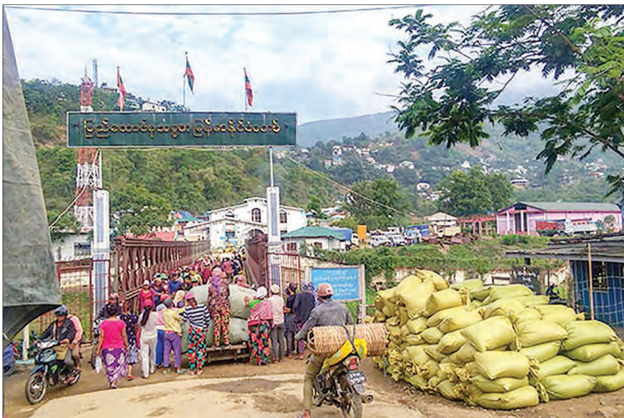
File photo shows: Myanmar - India friendship bridge between Myanmar and India.

THE bilateral border trade between Myanmar and India totalled US$115.4 million as of 12 February in the financial year 2020-21, an increase by $59.23 million compared to the same period last year, according to the Ministry of Commerce.