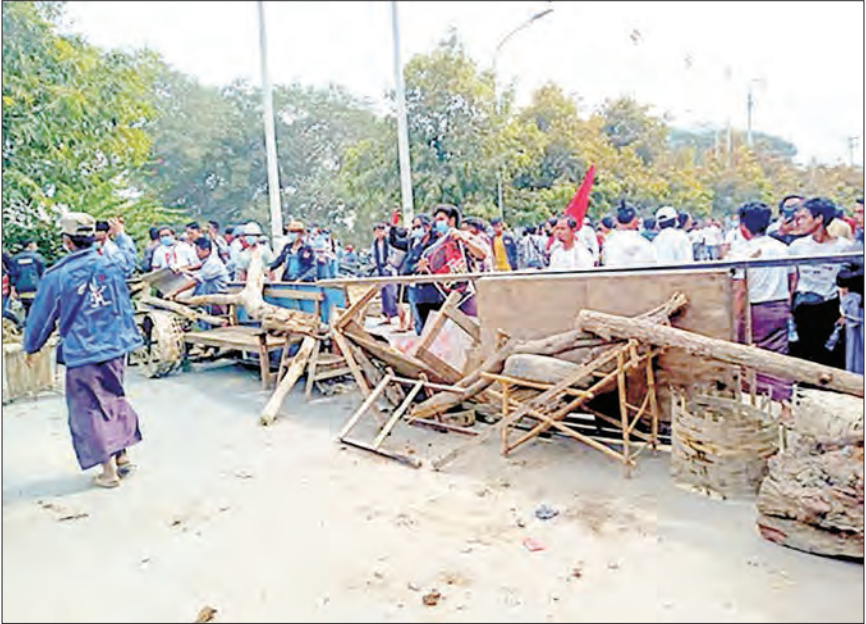
Many protestors are seen blocking the Strand road in Mandalay aggressively.

Tatmadaw members and 8 police were injured and five vehicles destroyed. The security force softly dispersed the crowds in accordance with the prescribed crowd dispersal methods and law to save the members blocked by the crowd. The crowd dispersed in the evening. The officials detained the leaders of the protest and will take action in accordance with the law. Some of the aggressive protestors were also injured due to the security measures conducted by the security force in accordance with the law. —MNA