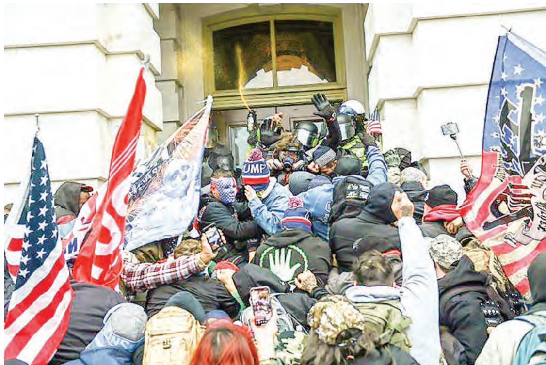
Trump supporters clash with police and security forces as they storm the US Capitol hoping to reverse his loss in the presidential election.