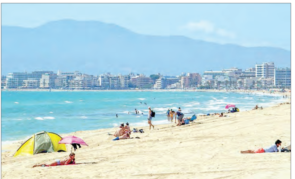
Spain's Mallorca island is a popular destination for digital nomads.