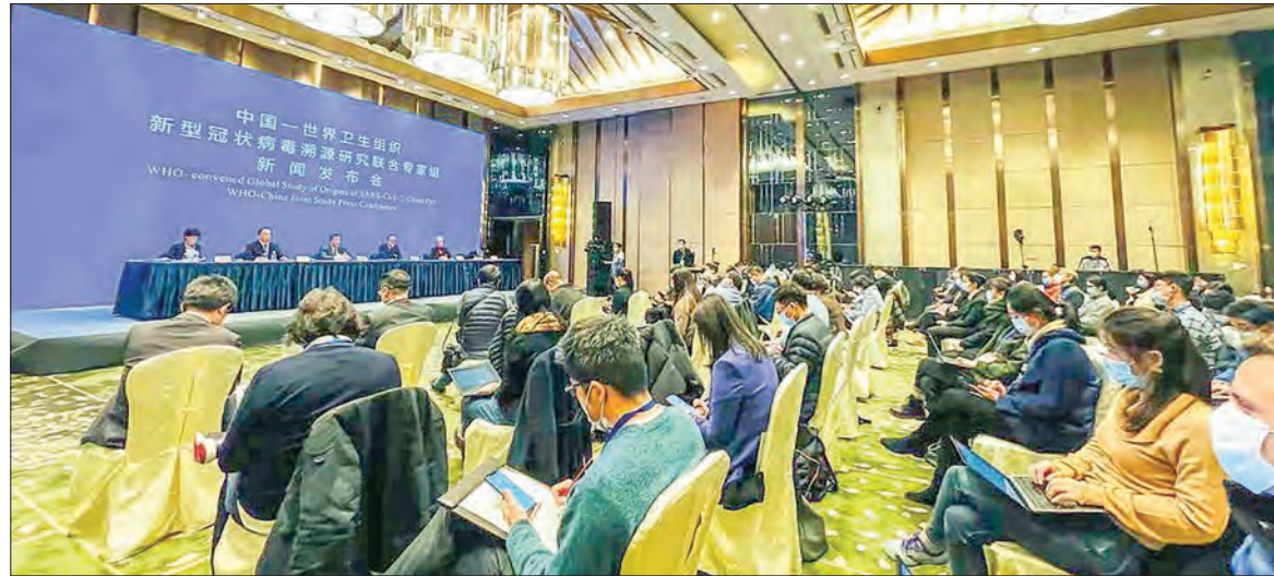
World Health Organization scientists speak at a press conference in Wuhan, China.

“So, there is the potential to continue to follow this lead and further look at the supply chain and animals that were supplied to the markets in frozen and other processed and semi-processed form, or raw