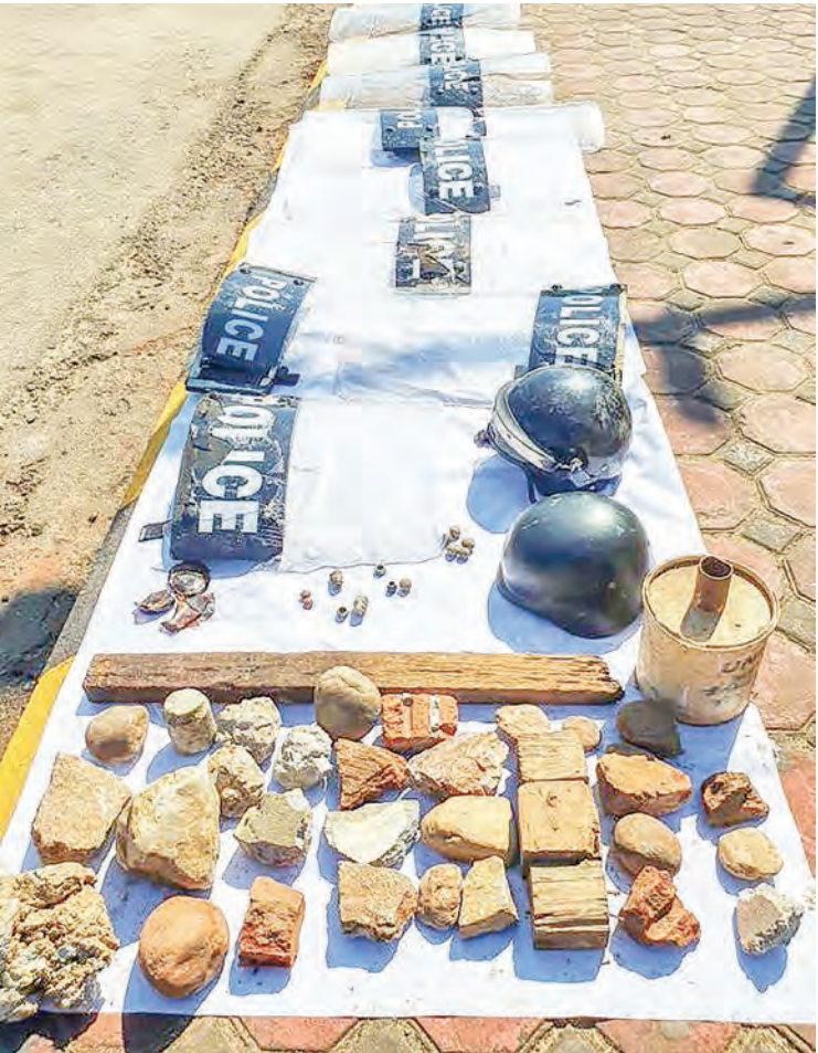
Pieces of brick and stone used by the protestors during the riots and police materials are seen.