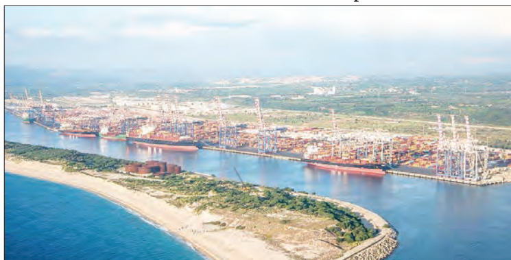
The port of Gioia Tauro. Police used scanners to detect the drugs. PHOTO: AFP

The 'Ndrangheta, which is based in the southern region of Calabria but whose tentacles reach internationally, is now considered Italy's most powerful organized crime group by anti-mafia prosecutors.—AFP