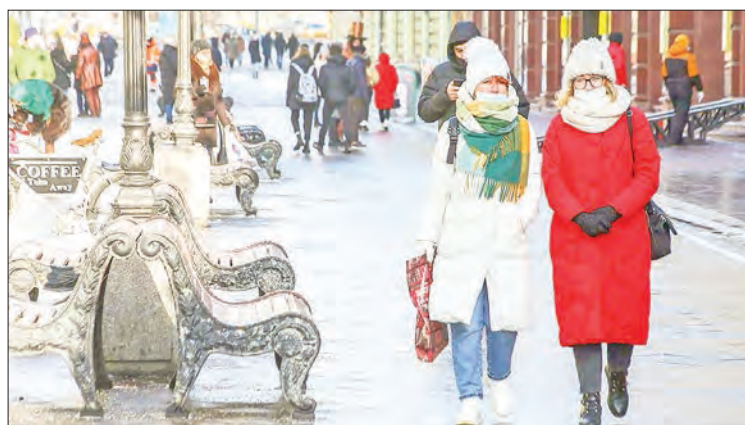
Russia officially surpassed four million coronavirus infections Wednesday, days after the country dramatically revised upwards its fatality rate, cementing its place as one of the world's worst-hit nations.

Russia has frequently come under fire for downplaying the impact of the pandemic and only counting fatalities where coronavirus was found to be the