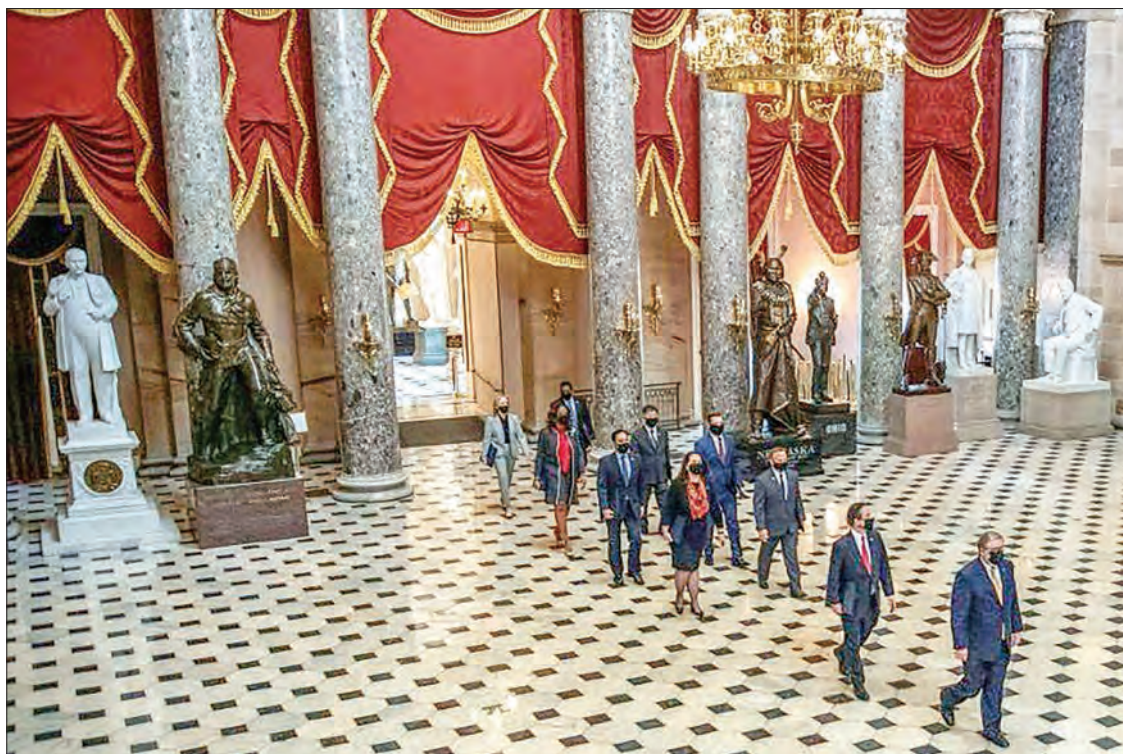
Democratic impeachment managers head to the Senate where former president Donald Trump is on trial.

Impeachment managers, the equivalent of prosecutors in a regular trial, are expected to