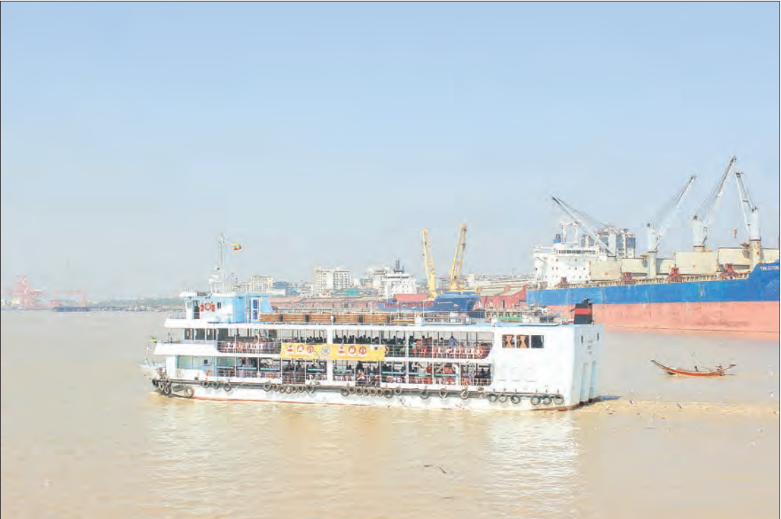
Pansodan-Dala ferry "Cherry" is seen in the Yangon River. PHOTO: NAING LIN KYAW (DALA)

At present, the ferries are running from 5:30 am to 7 pm with 35 runs on weekdays and from 6 am to 7 pm with 22 runs on weekends. —Naing Lin Kyaw (Dala)/GNLM