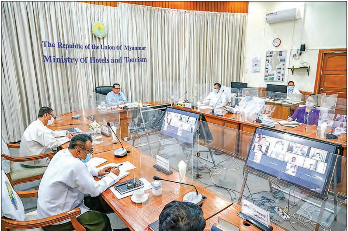
Union Minister U Maung Maung Ohn presides over the online meeting with the Myanmar Tourism Federation and its 11 associated organizations in Nay Pyi Taw on 10 February 2021.

Yangon river cruise, participation in digital marketing tenders for tourism promotions. He added the mutual trust and respect are the keys in co-operating with each other and he called on the Myanmar Tourism Federation and its 11 associated member organizations to explain the misunderstanding and cooperate in tourism promotion activities. The chairmen and the secretaries attended the online meeting discussed plans for short-term tourism development, the support and interest-free loans by the State to the low-income organizations and staff, the reopening of restaurants in accordance with the rules and regulations issued by the Ministry of Health and Sports, the funding requirements of the federation, holding jewellery exhibition, the negotiation with the bank for loan application and tax payment and work implementation by