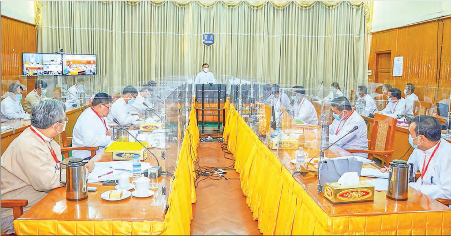
Union Minister U Aung Than Oo chairs the coordination meeting over the ongoing works of the Ministry of Electricity and Energy in Nay Pyi Taw on 10 February 2021.