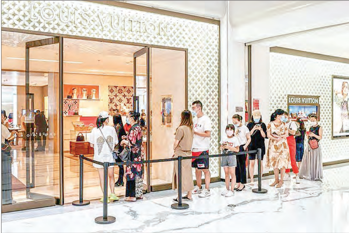
Consumer prices in China fell in January after a brief improvement at the end of last year.

FACTORY prices rose in China for the first time in a year last month as the country's vast industrial sector leads a recovery from the virus pandemic, with analysts hailing the data as a turning point for the world's number two economy.