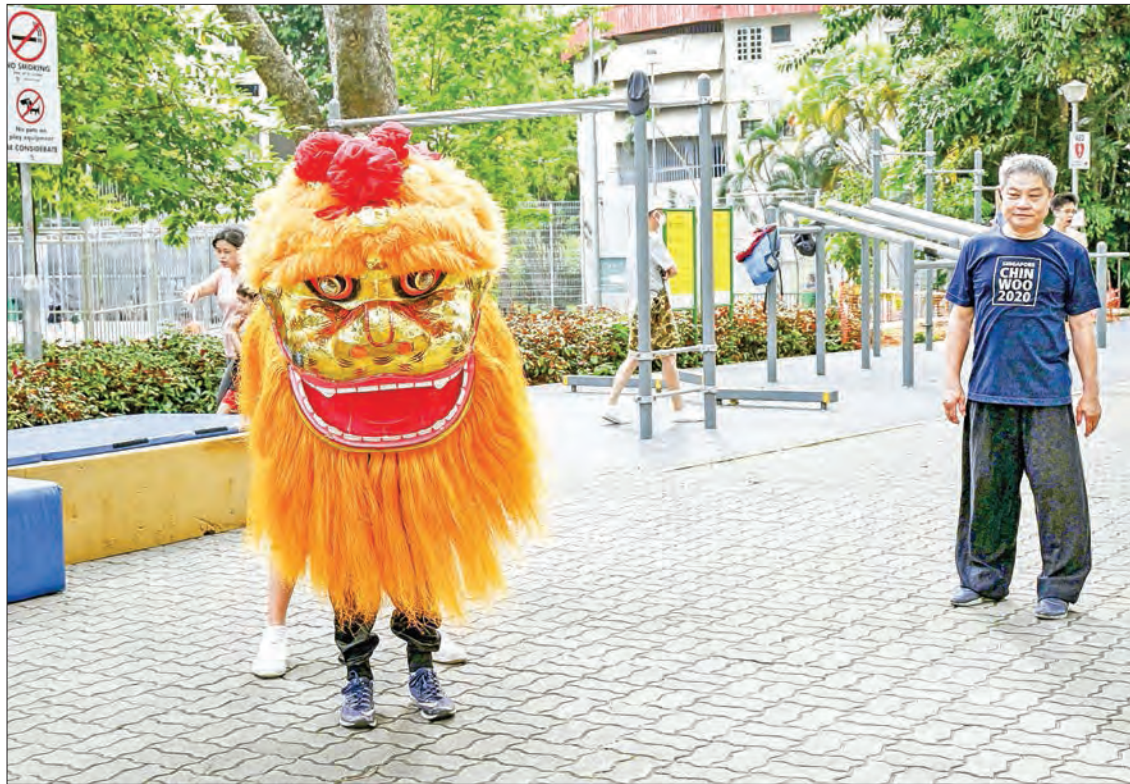
Members of the Singapore Chin Woo (Athletic) Association practise lion dance in a park in Singapore on Jan. 24, 2021.

Restaurants cannot have more than eight diners occupying a table and intermingling between tables is forbidden, with restaurants ordered by the authorities to make sure that large groups of people from different households do not gather at the same restaurant, occupying more than one table and mingling with each other.—Kyodo