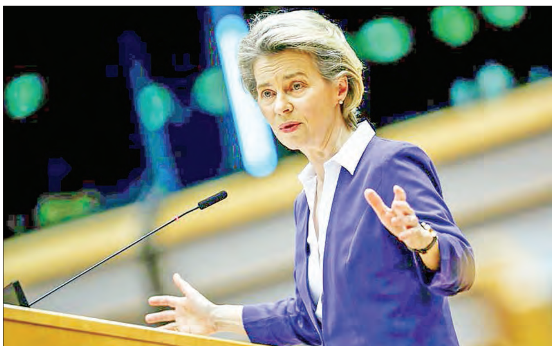
Europe's race to manufacture Covid-19 vaccines must accelerate to catch up to scientific breakthroughs and outpace emerging variants, European Commission chief Ursula von der Leyen said on Wednesday.

"Industry must adapt to the pace of science," she said, noting that vaccines can contain as many as 400 ingredients and manufacturing involve as many as 100 companies. A vaccine production task force under internal market commissioner Thierry Breton was charged with that mission, she said.