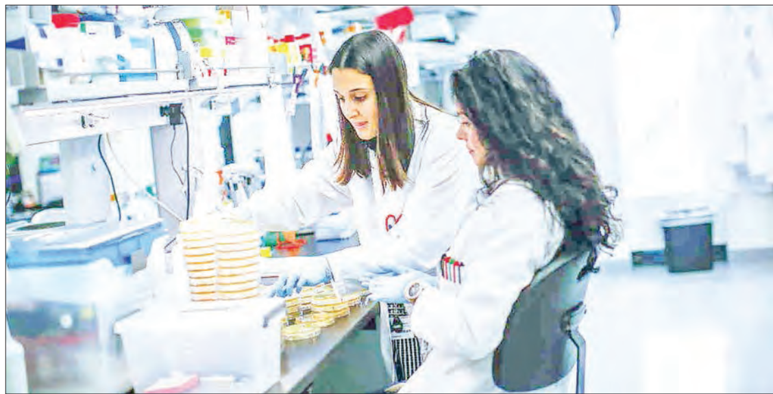
Researchers work in a lab that is developing testing for the COVID-19 coronavirus at the Hackensack Meridian Health Centre on 28 February, 2020 in Nutley, New Jersey.

THE World Health Organization called Tuesday for greater research, recognition and rehabilitation for Long Covid sufferers as it brought experts together to share insights into the little-understood condition.