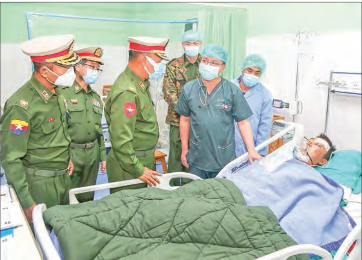
Relevant regional commanders are seen comforting the injured police member in PyinOoLwin on 9 February.

sectors. The Union Minister expressed words of thanks for the discussion of the Myanmar Tourism Federation and its 11 associated member organizations and said to organize the programmes for the short-term tourism development, and he said he would coordinate with the relevant ministries for the presentation.— MNA / GNLM