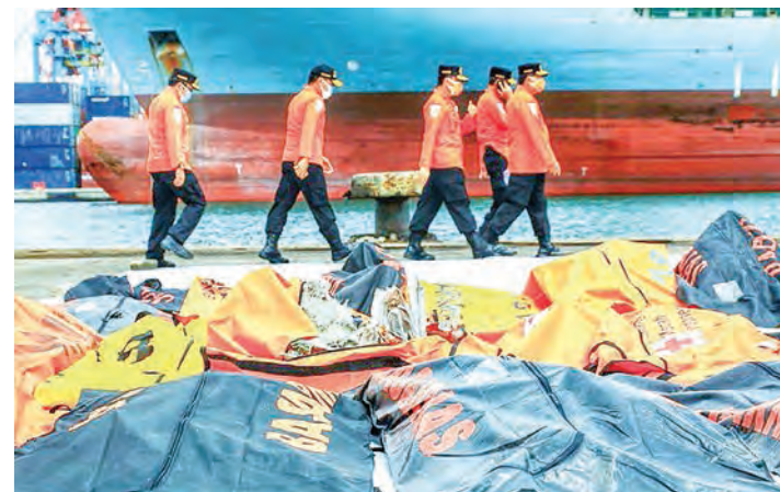
Sriwijaya Air flight SJ182 came down just four minutes after setting off from Jakarta last month.

“The left (engine throttle) was moving backward too far while the right one was not moving at all -- it was stuck,” said National Transportation Safety Committee investigator Nurcahyo Utomo.— AFP