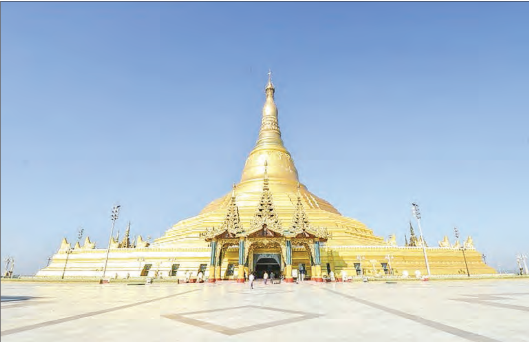
The Uppatasanti Pagoda in Nay Pyi Taw.

FAMOUS pagodas across the nation have reopened to public starting 8 February under the COVID-19 rules. Pilgrims and visitors including monks and nuns visit the Shwedagon and Botahtaung pagodas of Yangon Region, Maha Muni Pagoda of Mandalay Region and Uppatasanti Pagoda of Nay Pyi Taw Council Area and other pagodas of regions and states accordance with the COVID-19 rules. — MNA/GNLM