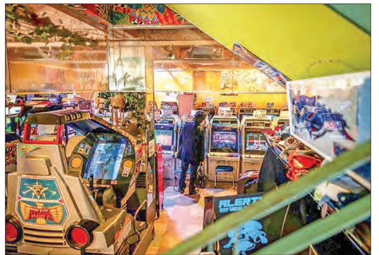
Unlike bars and restaurants, Japan's arcades do not receive government cash as compensation for income lost during the virus-curtailed opening hours.

Several arcades went bust following Japan's first state of emergency last year, which saw most of them close completely for two months, and those that survived are now struggling.—AFP