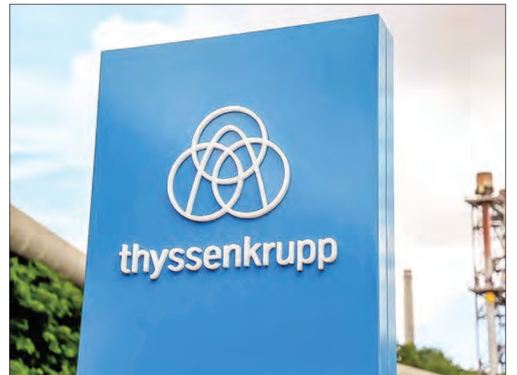
Troubled German industrial giant Thyssenkrupp said Wednesday it narrowed losses in the first quarter, buoyed by a "recovery" in demand for steel and car parts after the initial hit from the pandemic.

TROUBLED German industrial giant Thyssenkrupp said Wednesday it narrowed losses in the first quarter, buoyed by a "recovery" in demand for steel and car parts after the initial hit from the pandemic.