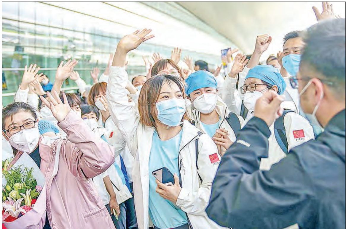
Medics from north China’s Tianjin Municipality wave goodbye before their departure in Wuhan, central China’s Hubei Province, March 17, 2020.

that (reservoir), it might take some time... but it will be out there without a doubt,” he told