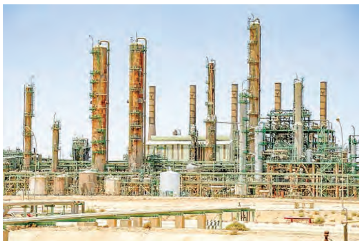
Big oil reserves were first discovered in 1959 in Libya when it was still among the world’s poorest nations.

After the last upsurge in fighting from 2019-2020, and amid the Covid pandemic, the already struggling economy plummeted by 66.7 per cent last year, initial IMF estimates show.— AFP