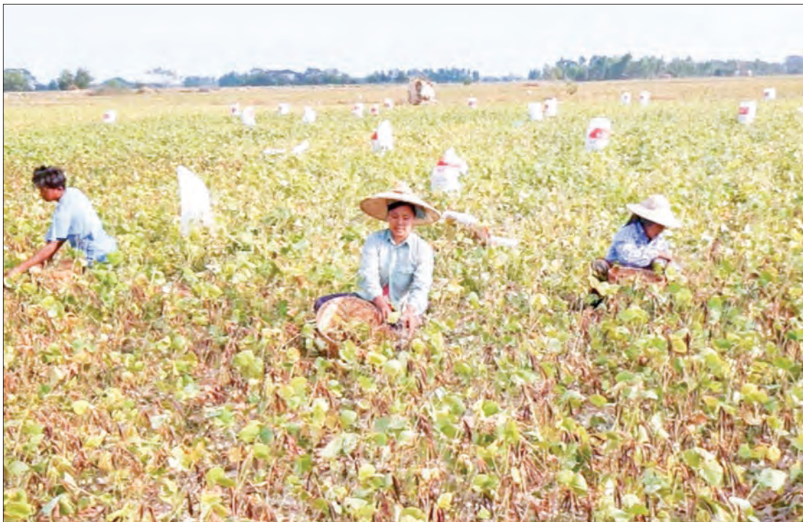
The green grams are also grown on about 323 acres of land in Bagan Htaung village and about 109 acres in Bawt Thabyay Kan village under Good Agricultural Practices (GAP) system. PHOTO: THET KHAING (THANLYIN)

The green grams are started to harvest in the first week of February. An acre of green gram yields nearly 16 baskets. The harvested beans are priced K 46,000 for 20 visses. The green grams are selling well this year than last year, according to the local bean growers.— Thet Khaing (Thanlyin)/GNLM