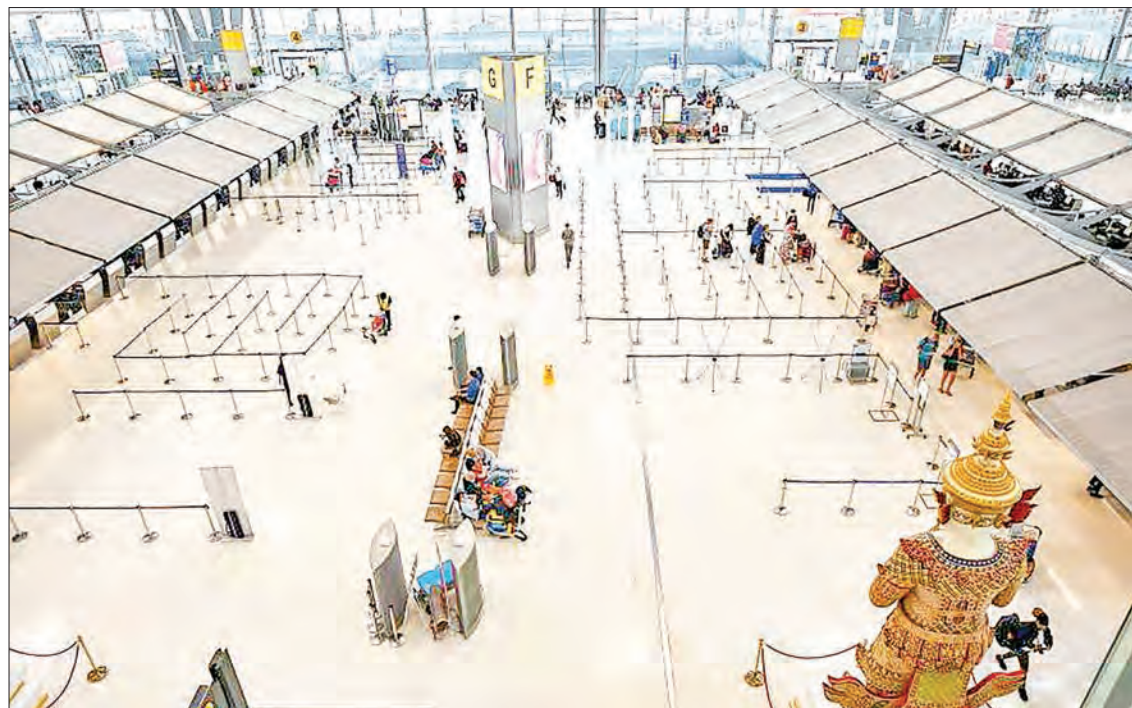
A general view of the almost empty departure hall of Suvarnabhumi Airport in Bangkok on Tuesday, as visitor numbers have plummeted in the region over the spread of the Covid-19 coronavirus.

QUEEN ELIZABETH II's eldest son and heir Prince Charles, who contracted Covid-19 last year, has received a first vaccine dose, his office said on Wednesday.