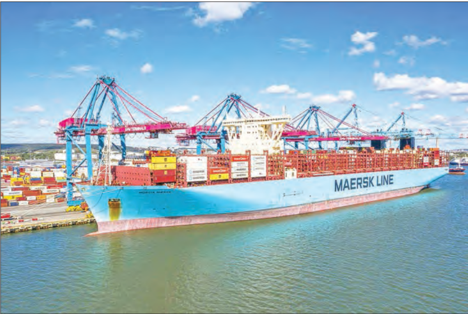
The company operates in 130 countries and employs 80,000 people worldwide.

DANISH shipping giant AP Moller-Maersk on Wednesday posted a near six-fold increase in net profit for 2020, as demand during the coronavirus pandemic rebounded strongly from an initial slump, sending freight rates soaring. A shortage of available containers in Asia during the pandemic has led to a surge in freight rates. For the full-year 2020, Maersk recorded a net profit of $2.9 billion (€2.4bn) in its ongoing operations. Revenue grew 2.2 per cent to $39.7 billion, slightly more than analysts’