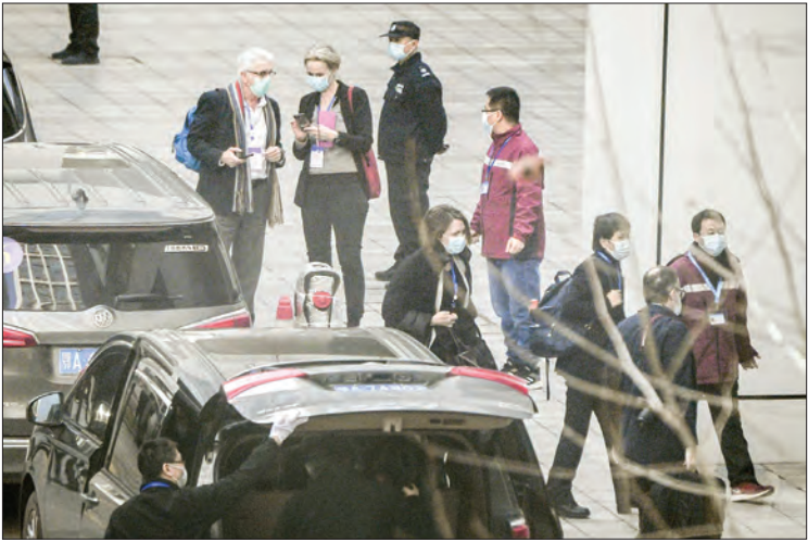
Members of the World Health Organization's team investigating the origins of the coronavirus pandemic arrive at an infectious disease prevention centre in Wuhan, China, on 1 February 2021.

The WHO team had initially planned to visit China early last month, but its arrival was delayed after it took the experts longer to gain permission to enter the country.