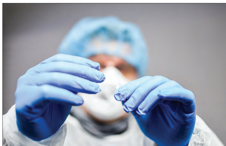
A medical assistant wearing protective mask, gloves and garment processes a sample from a rapid antigen test for the novel coronavirus (Covid-19) at the reception of the nursing home for seniors 'Schmallenbach Haus' in Froendenberg, western Germany, on 22 January 2021.

PHARMACEUTICAL giants scrambled Monday to announce ramped-up production and deliveries of vaccines hours ahead of talks called by German Chancellor