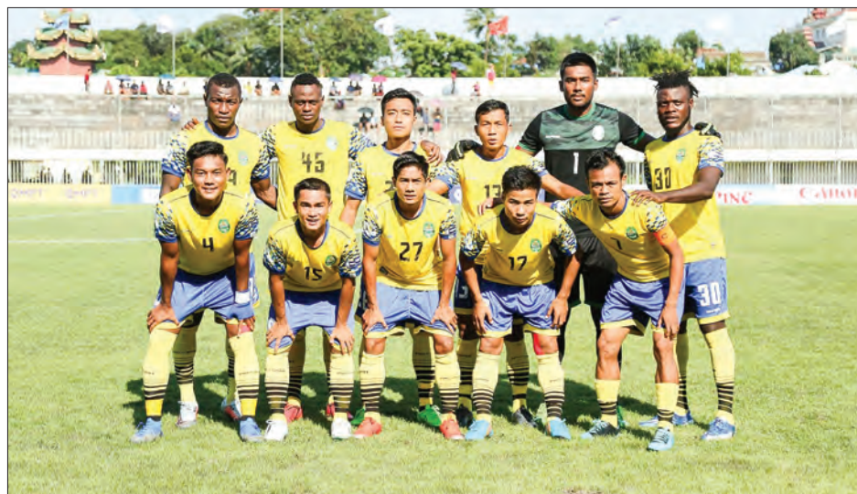
Dagon Football club players pose for a group photo before a 2020 season match of Myanmar National League.