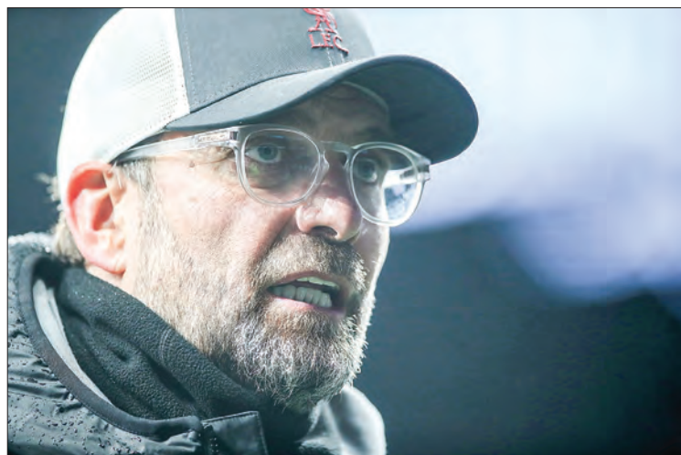
Liverpool's German manager Jurgen Klopp speaks to the media during the English Premier League football match between Tottenham Hotspur and Liverpool at Tottenham Hotspur Stadium in London, on 28 January 2021.