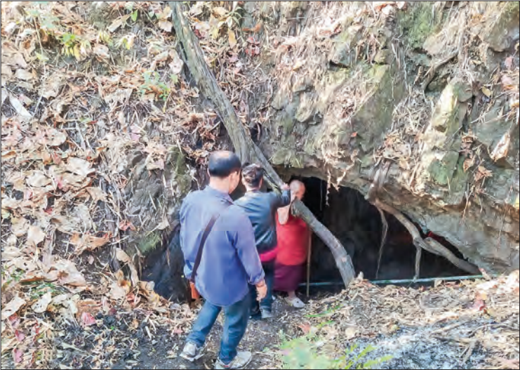
Travellers are seen at the entrance of the Htan Pyinnyar Cave in Nawnghkio, Shan State.

That natural cave is located six miles away from Nawnghkio Township. The opening of the cave is 15 feet wide. The cave