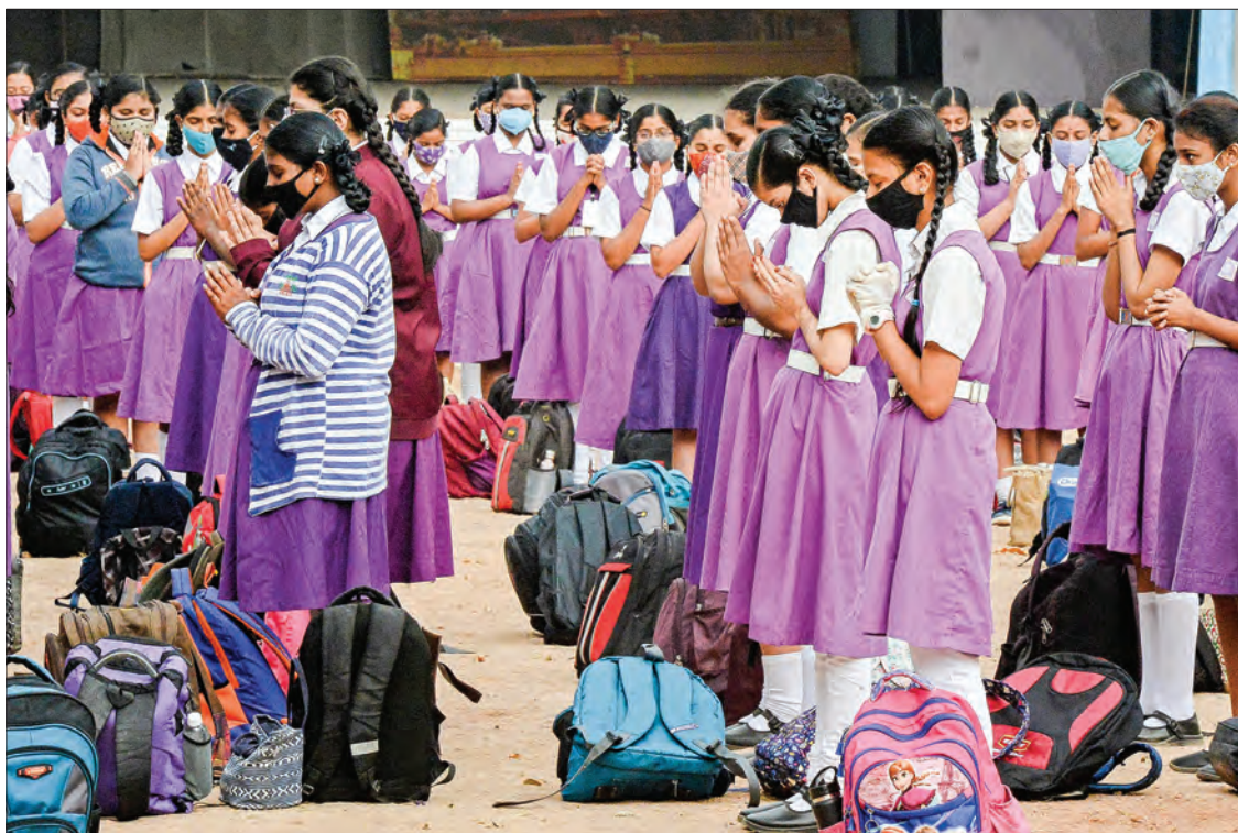
Students wearing facemasks attend their assembly prayer after the schools for classes 9th and 10th reopened nearly ten months after the spread of the Covid-19 coronavirus in Hyderabad on February 1, 2021.

The World Health Organization is meeting to study "long Covid" at a seminar that aims to define the condition and launch standardised data collection methods for monitoring patients.