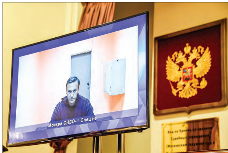
(FILES) In this file photo opposition leader Alexei Navalny appears on a screen set up at a hall of the Moscow Regional Court via a video link from Moscow's penal detention centre Number 1 (known as Matrosskaya Tishina) during a court hearing of an appeal against his arrest, in Krasnogorsk outside Moscow on January 28, 2021.

EU foreign policy chief Josep Borrell is expected to press the Kremlin to free Navalny when he