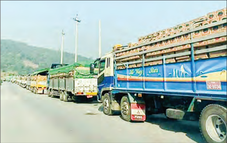
Trucks seen at the 105-mile trade zone in Muse, northern Shan State.

About 500 trucks of watermelons are stuck in border areas amidst trade suspension.