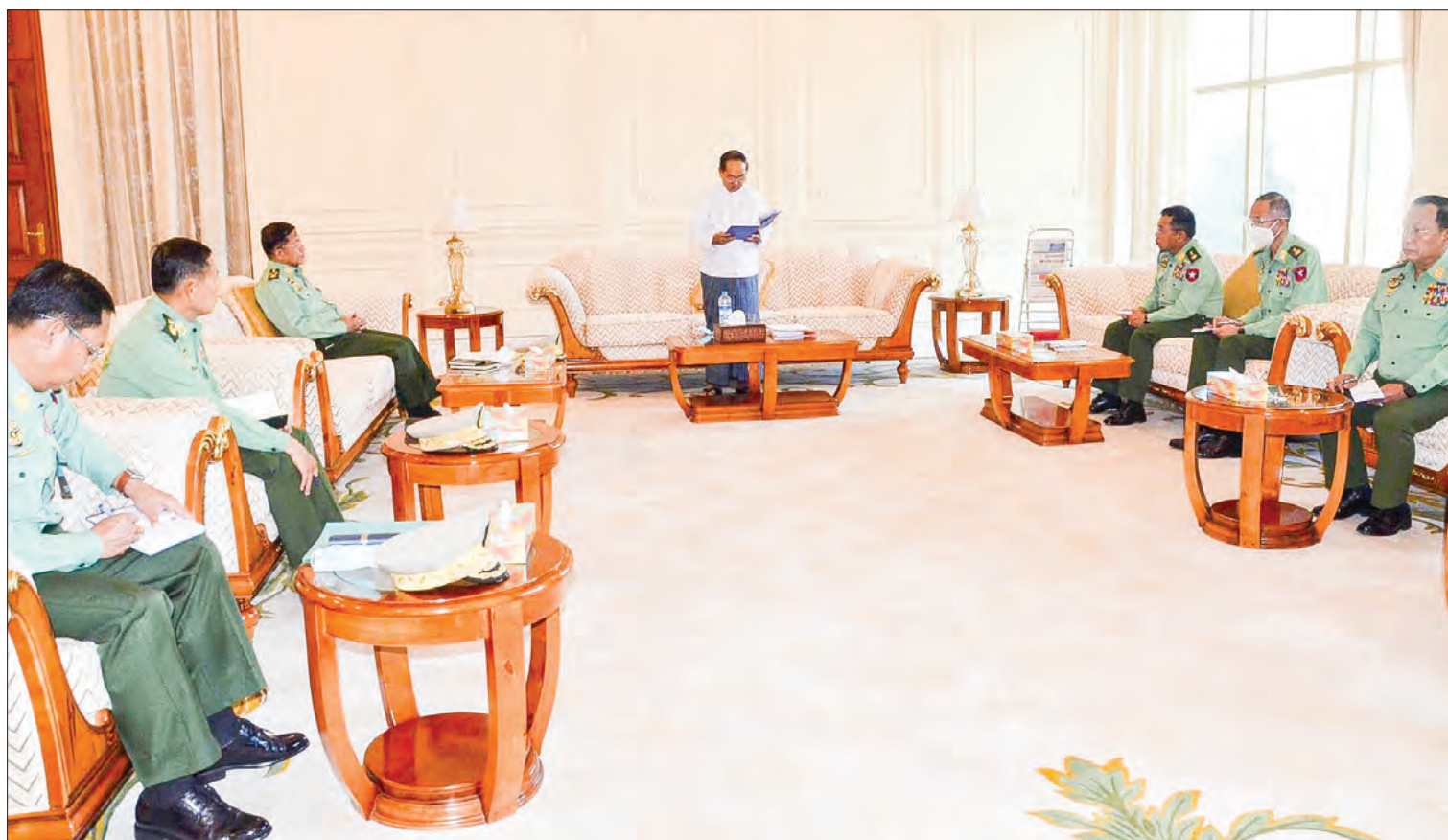
Acting President U Myint Swe declares the State of Emergency and hands over legislative, executive and judicial powers of the State to the Commander-in-Chief of Defence Services on 1 February 2021.

The Commander-in-Chief of Defence Services had repeatedly dealt with the matter of ensuring a free and fair election which is the foundation of multiparty democracy and an open political process before the election. The decision to certify a “free and fair election” cannot be made in a day. It must be rechecked whether there was freeness and fairness and cleanness during the canvassing period, election period and post-election peri-