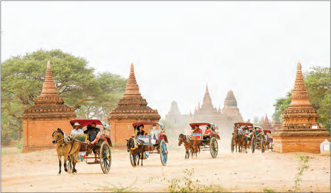
Tourists ride horse-carts in Bagan.