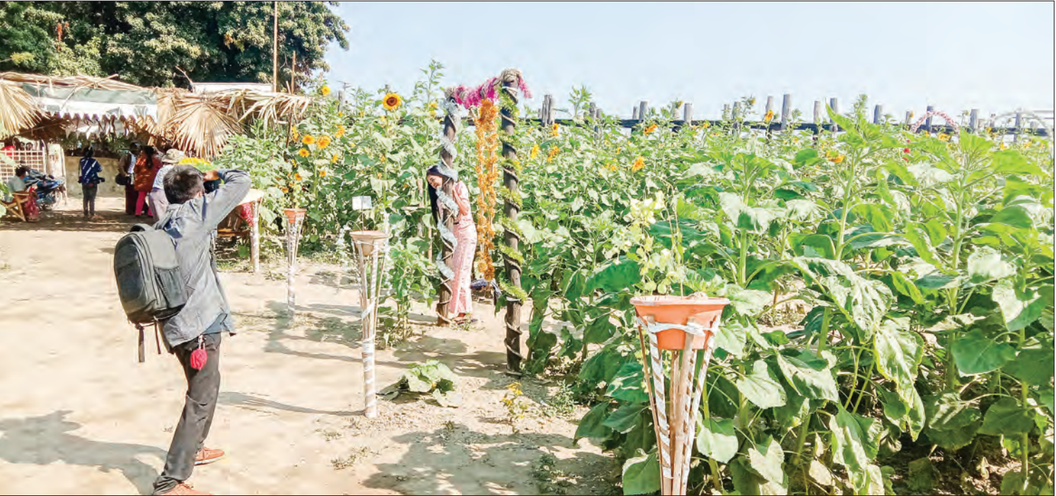
Professional photographers at U Bein bridge.

LOCAL professional photographers at U Bein bridge in Amrapura Township of Mandalay Region have returned to their works as many visitors are flocking to the historical bridge since early January this year. The scenic view on the