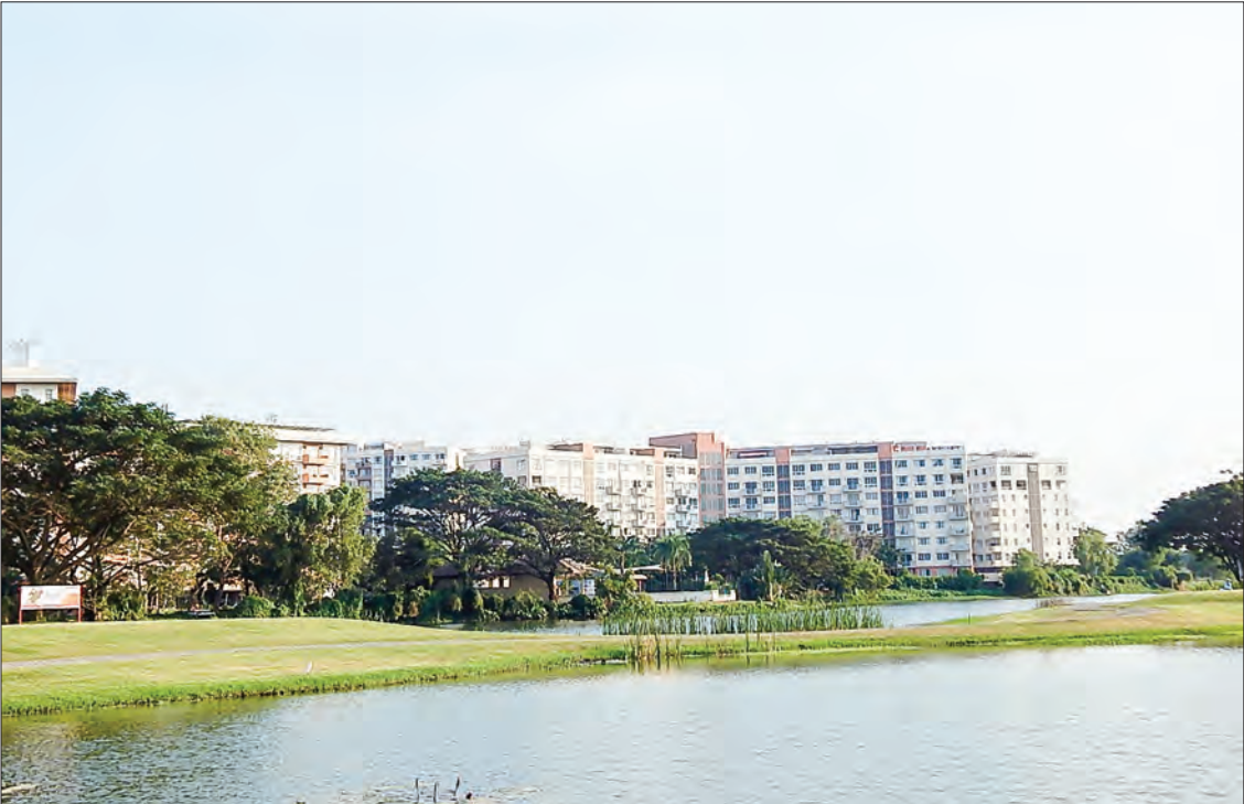
Picture shows the condominium in Thanlyin Township, Yangon Region.