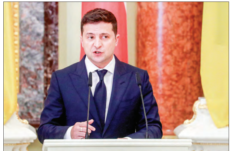
Ukrainian President Volodymyr Zelenskiy holds a joint news briefing with his Polish counterpart as part of their meeting in Kiev on 12 October 2020.

Zelensky told HBO he would like Ukraine and the United