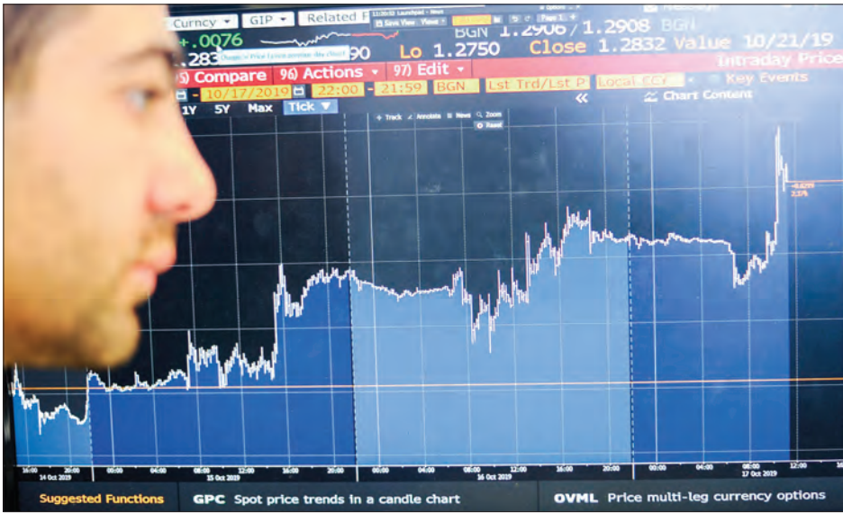
A journalist poses while looking at a computer screen with the Bloomberg display showing a three-day view showing the rise and fall in the value of the pound sterling against the US dollar in London on October 17, 2019 with a spike (R) at the moment of the announcement of a draft Brexit deal.

“European stock markets were broadly higher ... as investors try to arrest a decline over the last fortnight,” said Markets.com analyst Neil Wilson. Dealers remain on edge as surging infections and a stuttering vaccination rollout offset long-term hopes for the economic recovery. Worries about online retail investors’ attack on Wall Street short traders