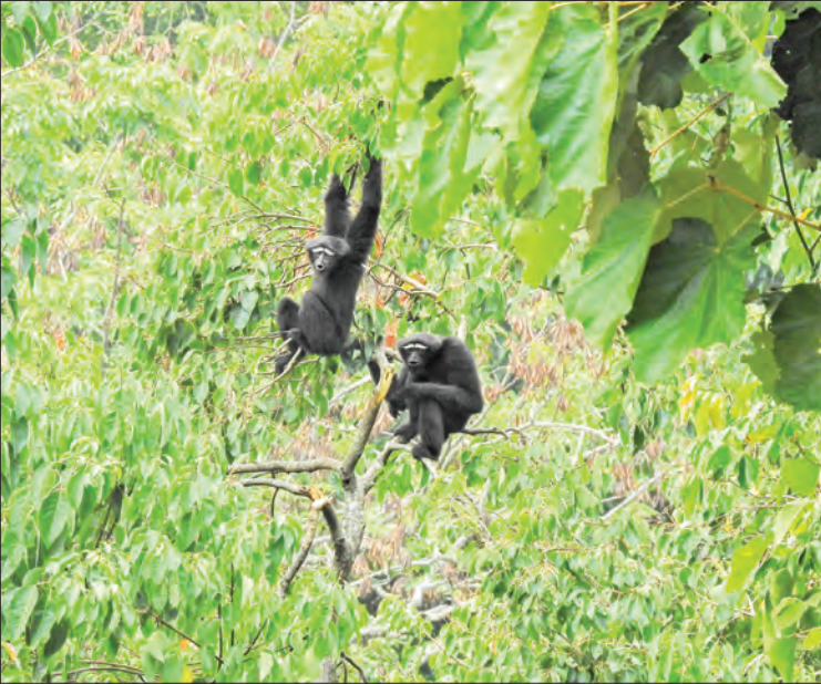
Out of the 20 gibbon species in the world, its four species are found in Myanmar.