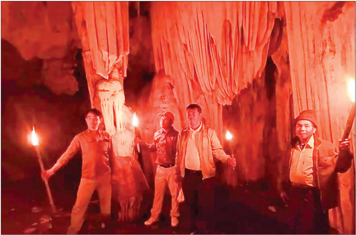
Travellers holding the sticks of fire are seen inside the Htan Pyinnyar Cave in Nawnghkio Township, Shan State.

is 200 feet wide and about 700 feet long. The team studied the cave with torches. The cave has enough oxygen, and it is free from wild animals. The natural cave is boasted with stalactite