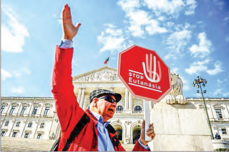
The bill was opposed by the Catholic Church in Portugal.

The bill was adopted in parliament by 136 votes to 78 with four abstentions — thanks largely