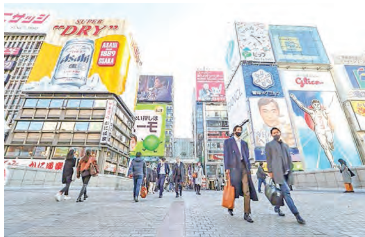
Large parts of Japan including Tokyo and the western city of Osaka are under a state of emergency to tackle a spike in coronavirus cases.

Japanese Prime Minister Yoshihide Suga vowed Friday that the Olympics would be held this summer "as a symbol of global unity" to "bring hope and