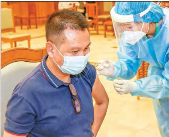
Amyotha Hluttaw MPs receive the vaccination against COVID-19 in Nay Pyi Taw on 30 January 2021.

AMYOTHA Hluttaw Deputy Speaker U Aye Tha Aung and members of the Hluttaw who will attend the first regular session of the third Hluttaw were Covishield vaccinated by the health workers yesterday in Nay Pyi Taw. A total of 110 Tatmadaw Pyithu Hluttaw members and 56 Tatmadaw