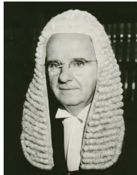
Justice Edward McTiernan of Australian High Court

that President Barack Obama after his re-election in 2012 gently hinted to the late Justice Ruth Bader Ginsburg perhaps to retire while the United States Senate was (till around October 2014 before that year US mid-term elections) in the Democrats' control so that her replacement can be approved by the US Senate.