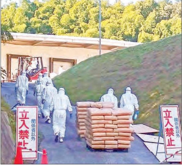
Most of the poultry farms in Japan hit by avian flu since last year had flaws in preventing access of wildlife to poultry houses, government officials said Saturday.

MOST of the poultry farms in Japan hit by avian flu since last year had flaws in preventing access of wildlife to poultry houses, government officials said Saturday. The farm ministry's inspection of affected chicken farms found that 90 per cent of the surveyed farms had defects in keeping poultry separated from wild birds and other animals such as holes in roofs and walls of chicken houses.