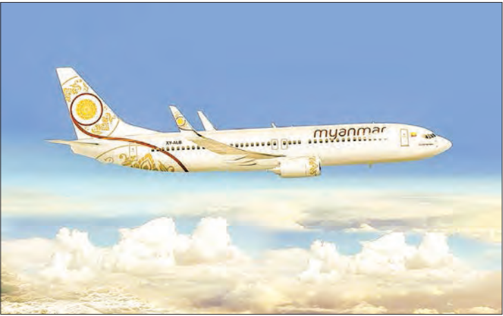
Picture shows an airplane of Myanmar National Airlines flying above the clouds. PHOTO: MYINT MAUNG will provide the gift vouchers to the passengers who will board the plane from Yangon airport and Mandalay airport.

WITH the resumption of domestic flights by Myanmar National Airlines (MNA) for the people’s convenience in the pandemic period, MNA will give 25-per cent discount gift vouchers to Yangon and Mandalay flight passengers on 3 February, according to the MNA statement. MNA will offer a 25-per cent discount voucher on 3 February at Yangon and Mandalay check-in counters with limitations by the first-come-first-served system. “On 3 February, our MNA