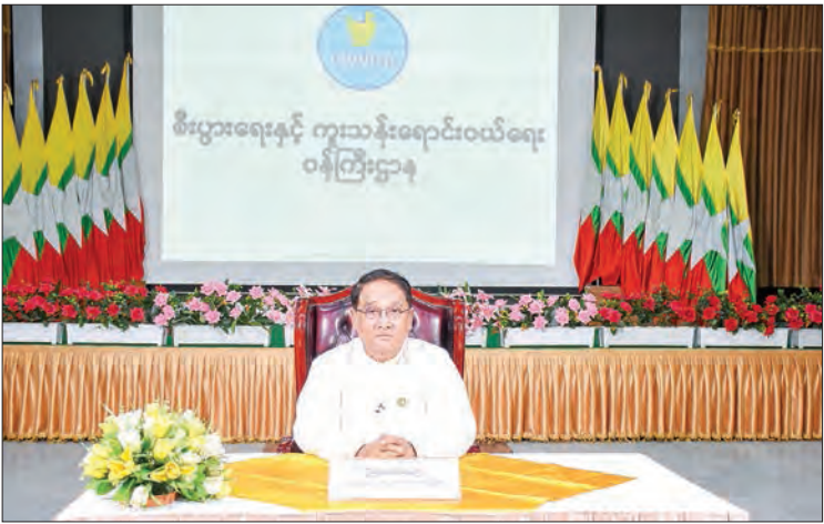
Union Minister Dr Than Myint delivers video message to the ceremony of World Pulses Day 2021 and 1 st annual meeting of Myanmar Digital Economy Association on 30 January 2021.

According to the data of 2019, Myanmar exported beans and pulses to 60 countries. The most