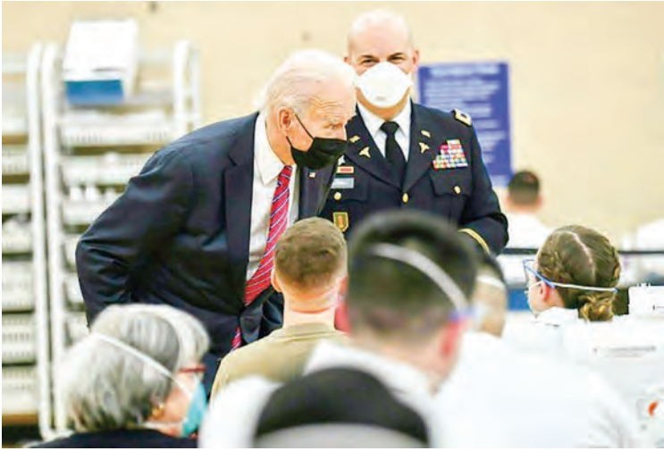
US President Joe Biden visits a Covid-19 vaccine site at Walter Reed National Military Medical Centre in Bethesda, Maryland, on January 29, 2021.

THE trend line is now unmistakable: the US Covid outbreak is easing, with new cases and hospitalizations down two weeks in a row, even though the overall numbers still remain far higher than prior to the fall-winter surge.