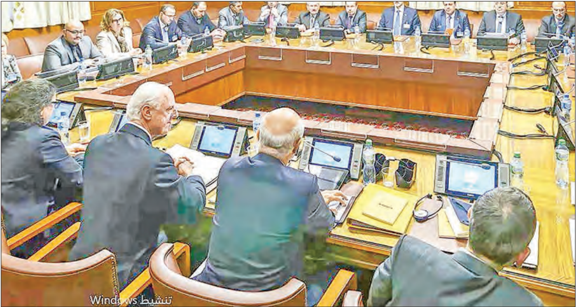
First session of the fourth round of the Select Committee for amending the Syrian constitution.

He told reporters that the delegates even could not reach an agreement on several important things of the methodology of how to continue the meeting, and the meeting actually started on Monday without an agreed common ground. “I explained that we need the two Co-Chairs to work better together, via me — or they sit down and discuss. And we need to produce then a work plan for how