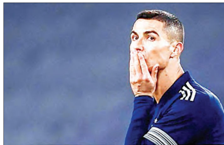
Juventus' Portuguese forward Cristiano Ronaldo.

"We want to see swifter removal of offensive messages and improved identification and banning of offenders."—AFP ■