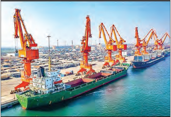
Aerial photo taken on Aug. 27, 2019 shows cargo ships at a wharf of Wenfeng port in the China (Hebei) Pilot Free Trade Zone Caofeidian area in north China's Hebei Province.

The export of anti-epidemic products saw a major rise last year, with surges in the exports of masks, protective suits and gloves, and pharmaceuticals, said Guan