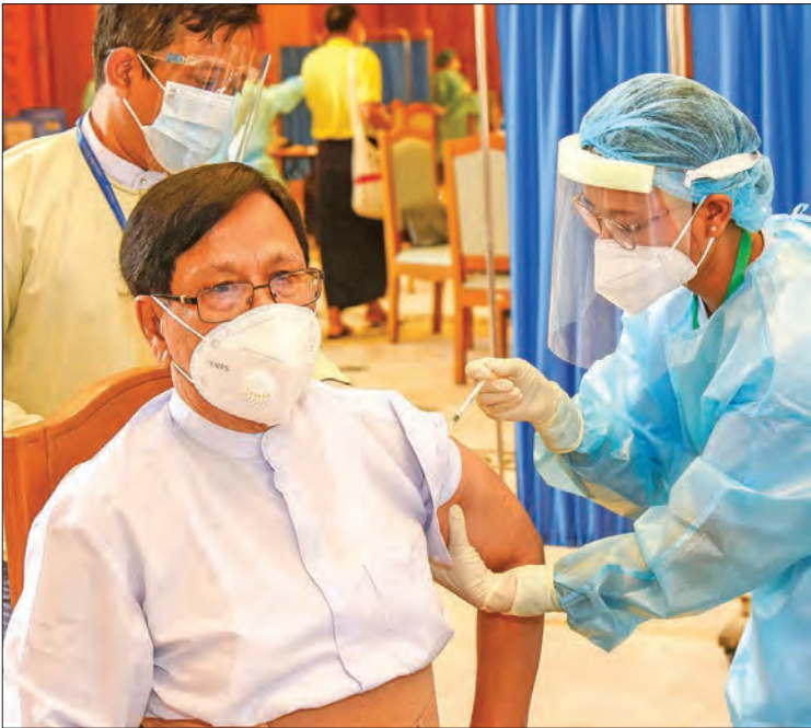
Amyotha Hluttaw Deputy Speaker U Aye Tha Aung receives the COVID-19 vaccine in Nay Pyi Taw on 30 January 2021.

AMYOTHA Hluttaw Deputy Speaker U Aye Tha Aung and members of the Hluttaw who will attend the first regular session of the third Hluttaw were Covishield vaccinated by the health workers yesterday in Nay Pyi Taw. A total of 110 Tatmadaw Pyithu Hluttaw members and 56 Tatmadaw