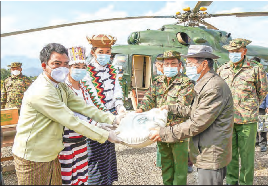
Vice-President U Myint Swe provides rice bags for the locals in Pannandin Town, Kachin State on 30 January 2021. (NEWS ON PAGE-1)