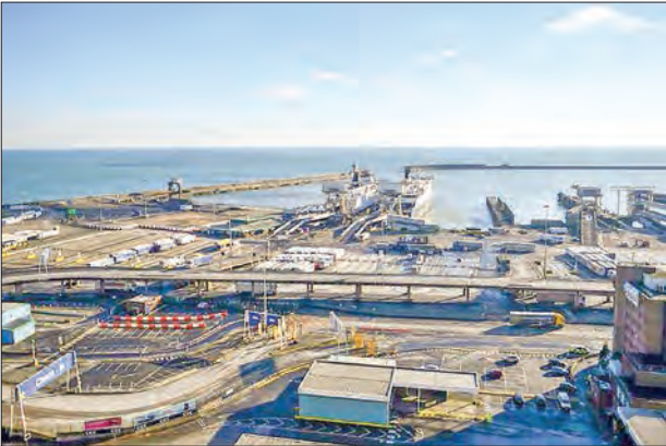
Shipping between Britain and the EU through ports like Dover has got more expensive in both directions with new charges and red tape.

British customers purchasing goods from the EU with a sale price of