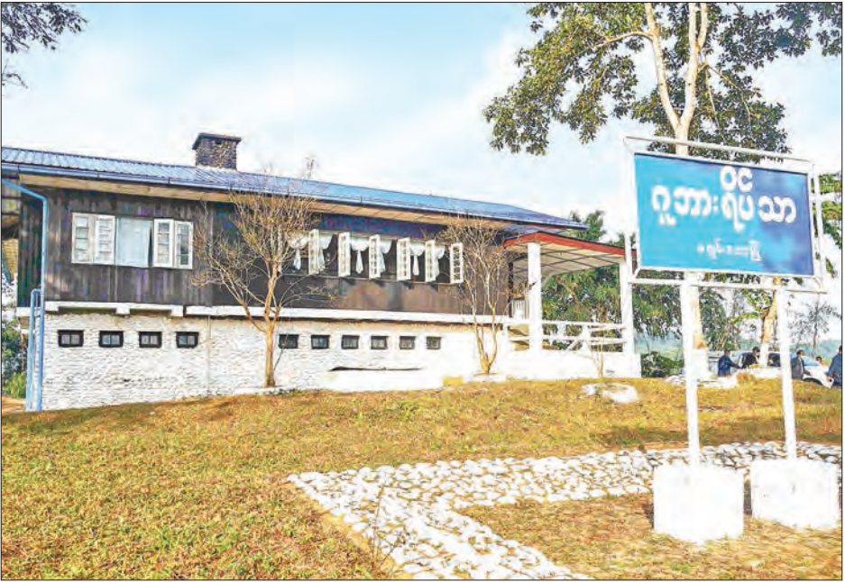
Picture taken on 30 January 2021 shows the Gubar Yeiktha in Machanbaw Township, Kachin State. (NEWS ON PAGE-1)