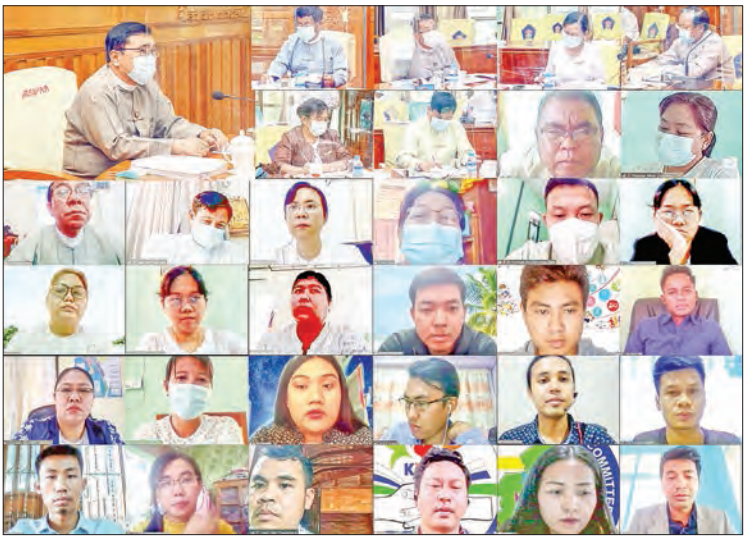
Union Minister Dr Win Myat Aye holds meeting on the implementation of the National Strategic Plan for Youth Policy 2020-2024 on 29 January 2021.

Regarding the education sector which is an important sector for youth, he said the Ministry of Education is formulating the National Education Strategic Plan (2021-2030) and will include opportunities for youth participation and will be