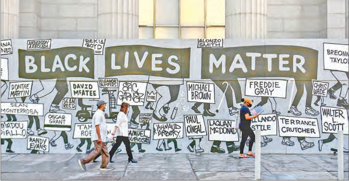
People walk past a "Black Lives Matter" mural at Union Square on June 12, 2020 in New York City. - Demonstrations are being held across the US following the death of George Floyd on May 25, 2020, while being arrested in Minneapolis, Minnesota.