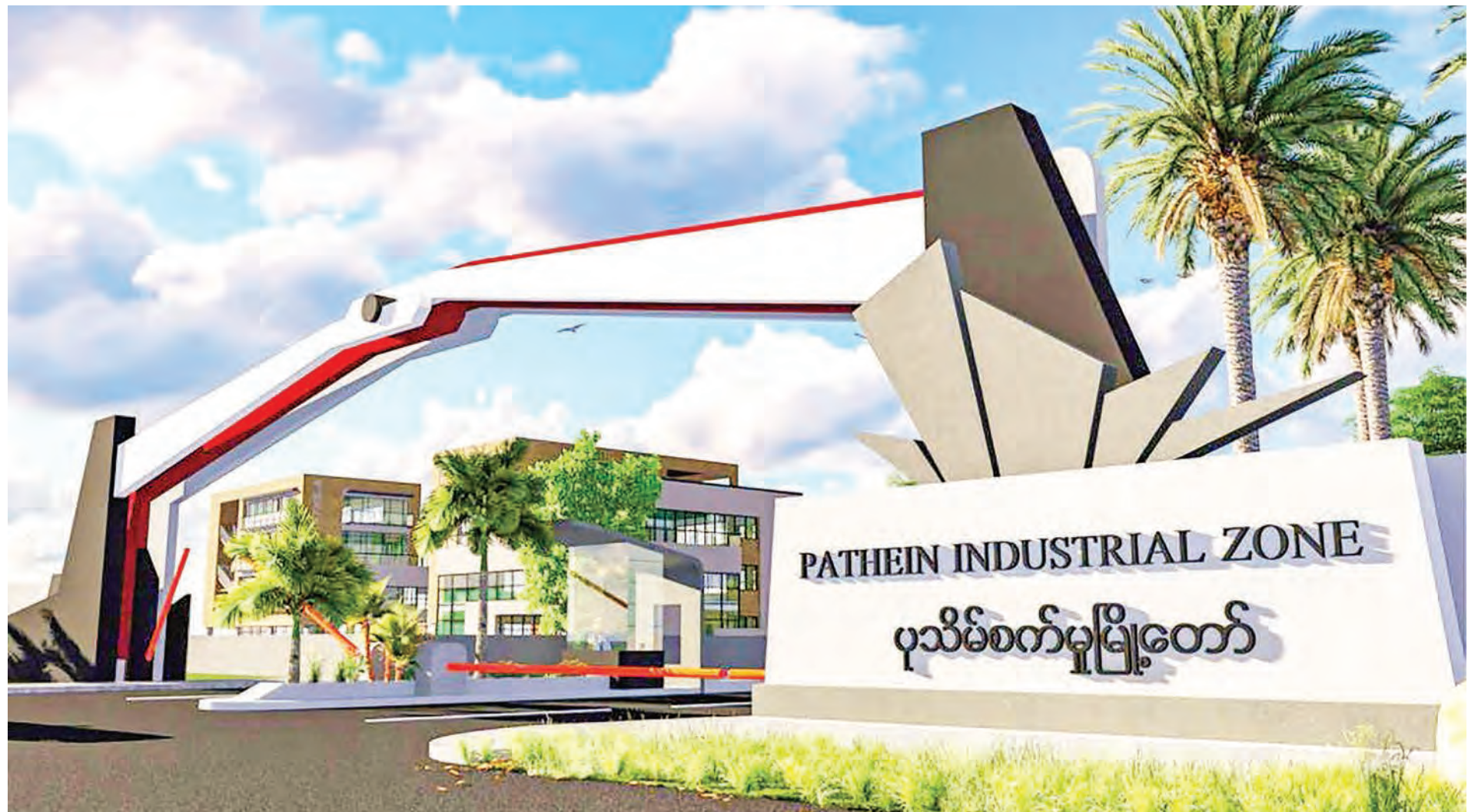
The Pathein Industrial City (PIC) project is being implemented on 6,700 acres of land in Pathein, with an investment of US$500 million.

been finished. The construction of garment factories that can employ 3,000 to 5,000 workers has been completed. Four more factories are expected to be completed before the rainy season. A special garment zone is being built, and about 50 acres for rice production is being researched by China in the project area,” he added.