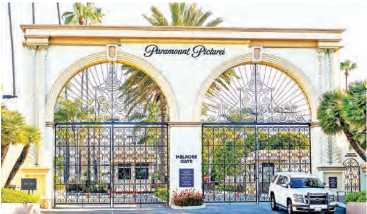
In this file photo taken on April 15, 2020, the closed Paramount Studio is seen amid the coronavirus pandemic in Los Angeles, California.

With the arrival of new platforms such as Disney+, Apple TV+, HBO Max and Peacock between November 2019 and July 2020, a swarm of new series has invaded the small screens in recent months. But the coronavirus pandemic has paralyzed