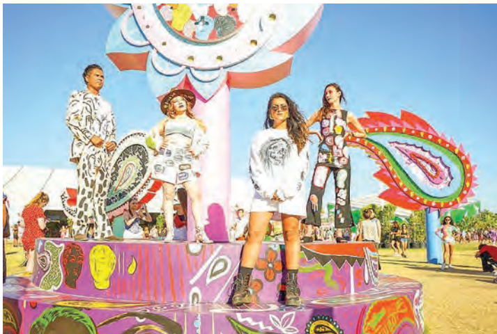
Festival goers attend the 2019 Coachella Valley Music And Arts Festival - Weekend 2 on April 21, 2019 in Indio, California.