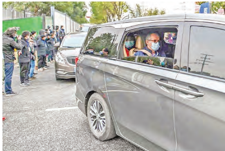
Members of the WHO team leave Jinyintan Hospital.

THE team of World Health Organization experts investigating the origins of the coronavirus met staff Saturday at the Wuhan hospital which received the first