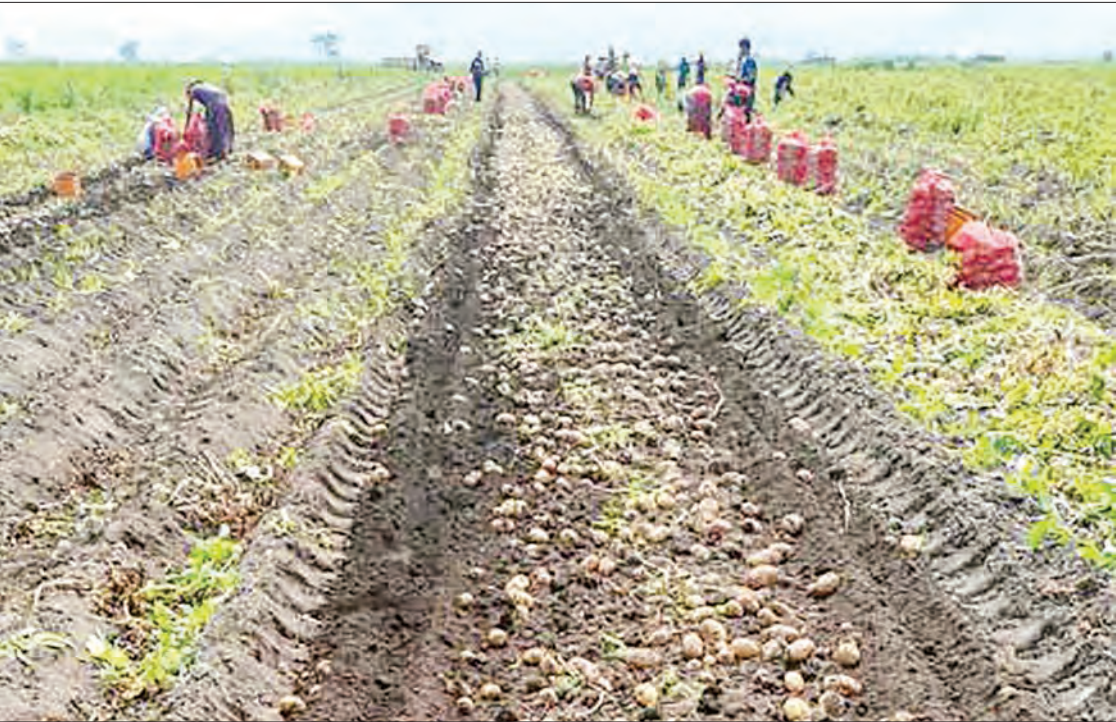
Farmers harvest potatoes at a farm in Naungtayar, Pinlaung Township, southern Shan State.

We appreciate your feedback and contributions. If you have any comments or would like to submit editorials, analyses or reports please email aungthuya@gnlm.com.mm with your name and title. Due to limitation of space we are only able to publish “ Letter to the Editor ” that do not exceed 500 words. Should you submit a text longer than 500 words please be aware that your letter will be edited.