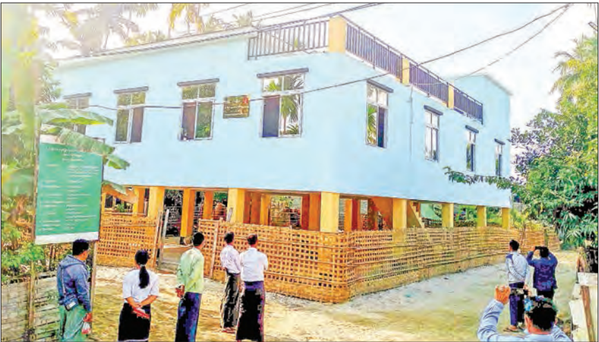
Picture shows the newly-opened coastal fisheries project office in Pyinphyumaw Village in Kyaukpyu Township, Rakhine State.

The meeting was attended by the Deputy Minister, the Permanent Secretary, Director-General, officials from the Ministry, Social Welfare officers from Nay Pyi Taw Council and respective regions and states and youth representatives from the Youth Affairs Committee.—MNA (Translated by Ei Phyu Phyu Aung)