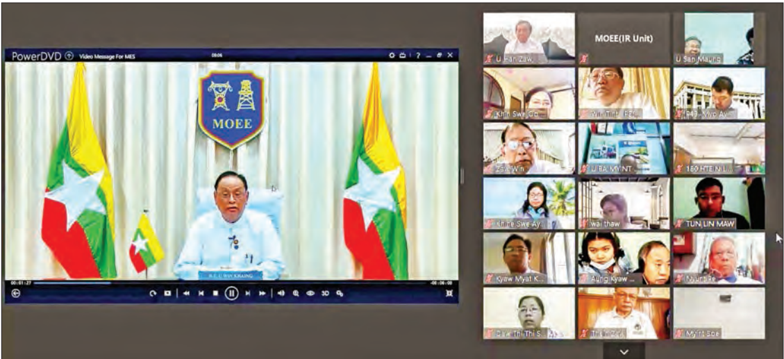
Union Minister U Win Khaing participates in the Annual Meeting of Federation of Myanmar Engineering Societies via videoconferencing on 30 January 2021.

FEDERATION of Myanmar Engineering Societies held annual meeting virtually yesterday. Union Minister for Electricity and Energy U Win Khaing, Patron of the federation sent his video message to the meeting. The Union Minister said the federation was established in December 1995 and it reached its Silver Jubilee in 2020 with a large number of members. He then discussed the co-operation work of the federation with Myanmar Engineering Council and enactment of Myanmar Engineering Council Law in 2013 by aiming to develop the ethics of Myanmar engineers as well as technology and to support the state's development. He highlighted the crucial role of engineers for infrastructural development in developing countries, significant develop-