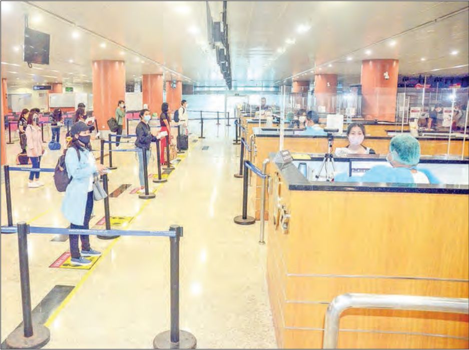
Myanmar returnees are seen at the Yangon International Airport on 30 January 2021.

A total of 263 Myanmar citizens who were stranded in foreign countries because of the suspension of commercial flights returned home by relief flights yesterday.