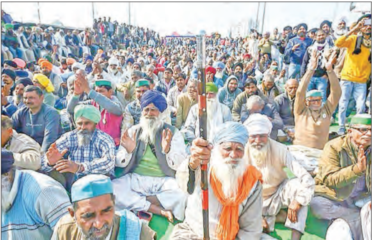
At least 10,000 additional protesters have arrived this week to boost numbers inside the camps.