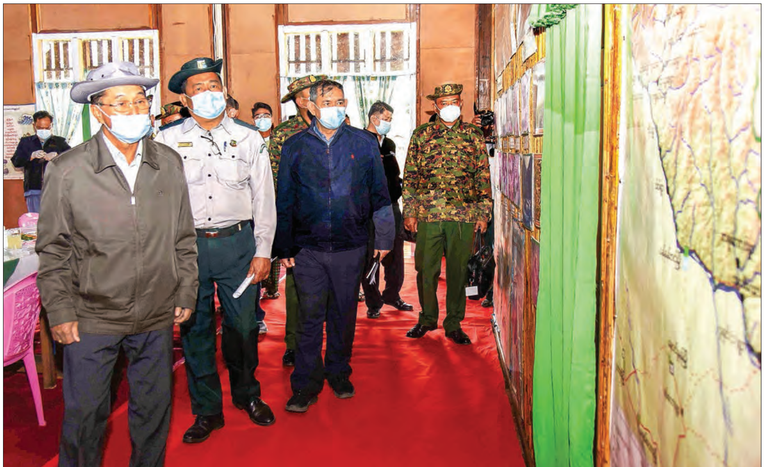
Vice-President U Myint Swe inspects the Hkakaborazi Biodiversity Research Office (frontline) in Nagmon Town, Kachin State on 30 January 2021.

Next, he inspected the construction works at the Machanbaw Town Hall, and an official from the Taw Win Myitkyina Co., Ltd. gave a briefing about the project.