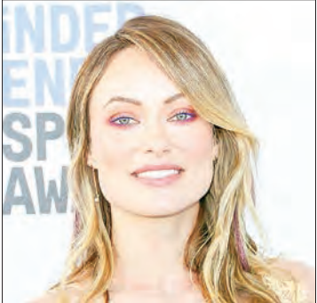
Olivia Wilde is among the famous faces who pop up for socially-distanced conversations during "How It Ends" -- many shot outside the A-listers' real-life homes.

"I had a slightly hysterical episode about one week into the lockdown... I needed to calm down and part of the calming