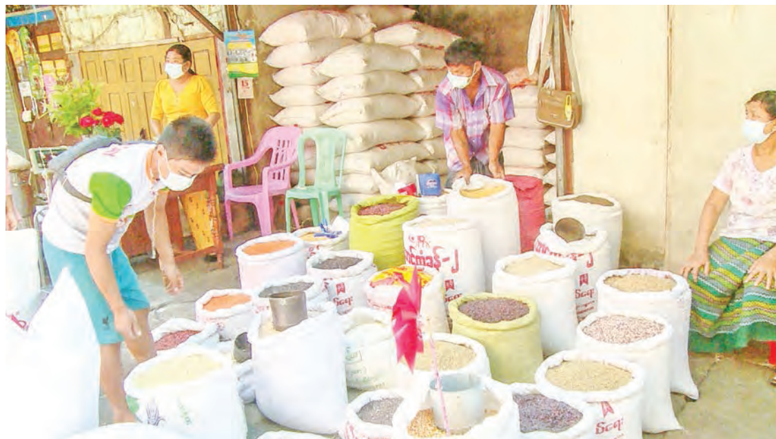
Beans and pulses are displayed in bags at a shop in Mandalay.