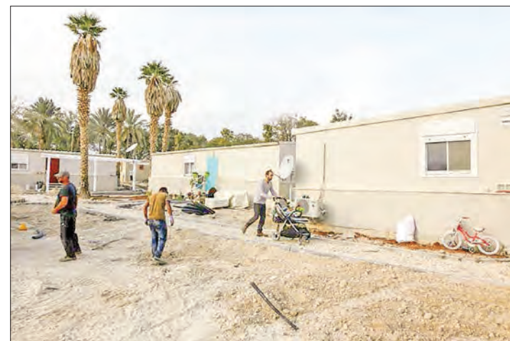
Work only started on the Jordan Valley settlement outpost of Kedem Arava in 2017, around the time US president Donald Trump took power. Four years on, it is home to some 40 families.