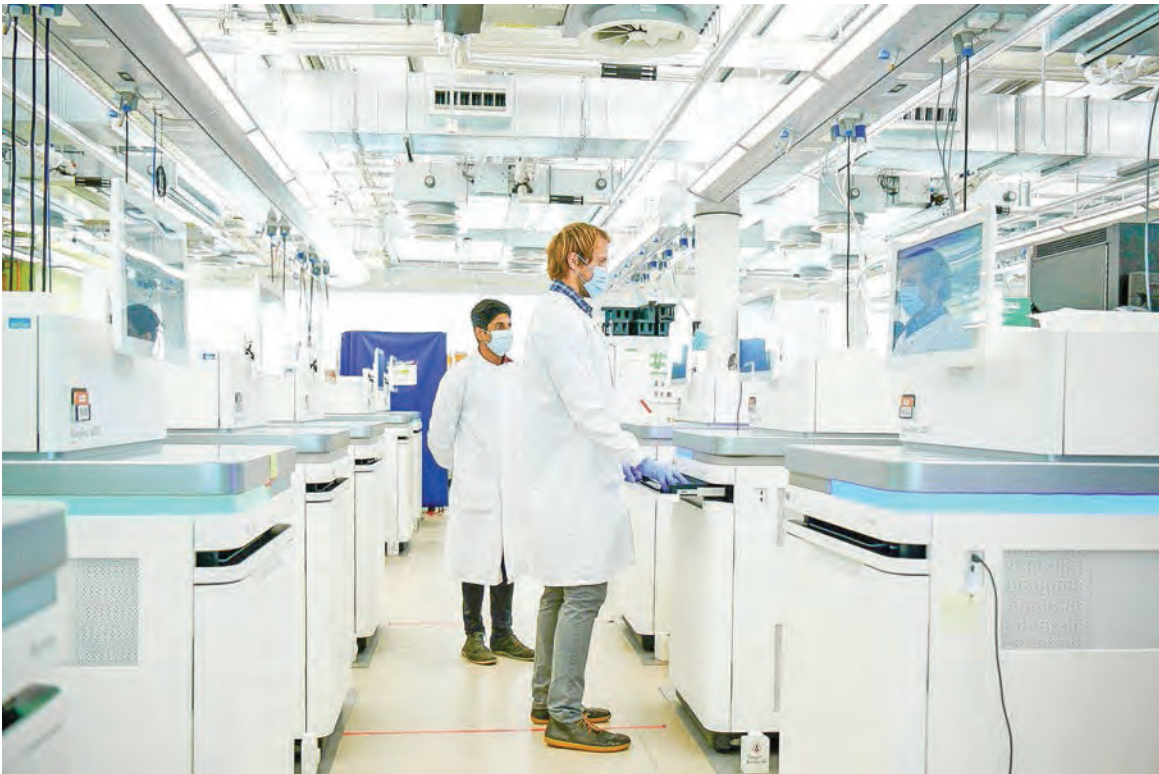
Two scientists prepare a sequencing machine at the Wellcome Sanger Institute, in Hinxton, England, last August.

In a statement, the two companies said these preliminary findings "do not indicate the need for a new vaccine to address the