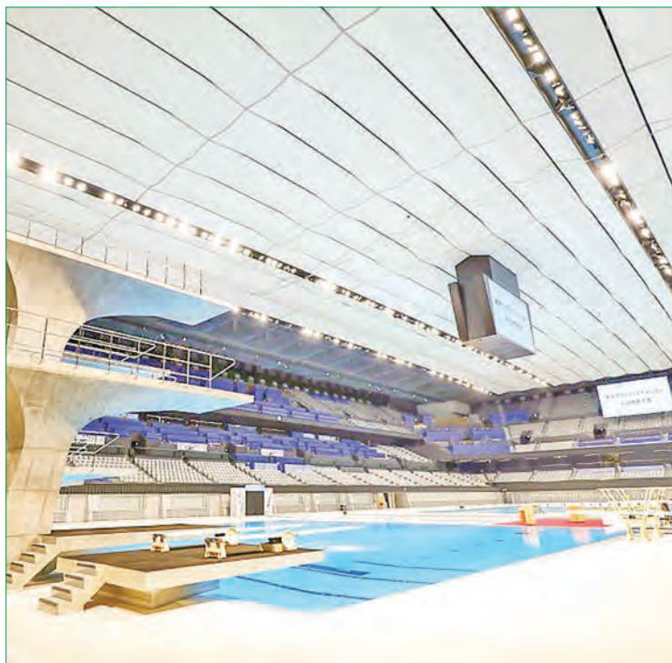
An artistic swimming qualifier that was to be the first Tokyo Olympic test event of 2021 has been postponed because of virus restrictions. Tokyo Aquatics Centre pictured on Oct. 24, 2020.

TOKYO—The first Tokyo Olympics test event of 2021 has been postponed because of travel restrictions under Japan's coro-