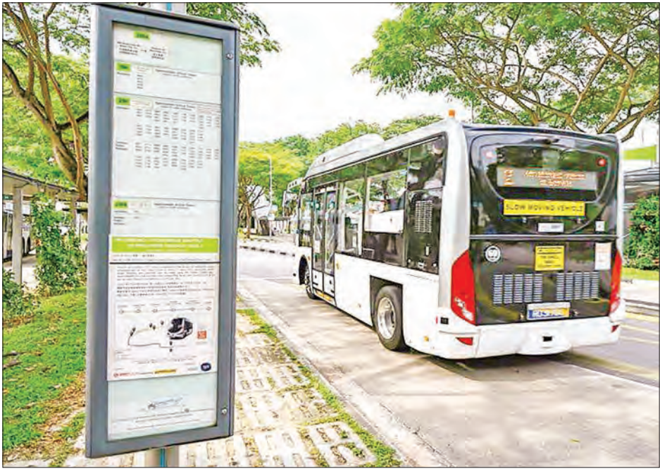
Singapore has become a testbed for self-driving vehicles.

Singapore's first trial of self-driving buses came in 2015, while a trial of driverless road sweepers was launched earlier this year.