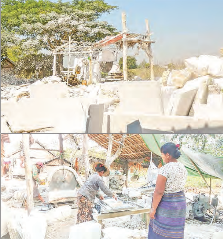
Marble stones are carved to make marble sculptures.

THE marble entrepreneurs association will be organized to fix the same marble prices in the post-COVID-19 period, said U Soe Win, marble businessperson of Sagyin Village in Madaya Township of Mandalay Region. The entrepreneurs discussed to form the association containing at least 20 members who have licences. The marble can be sold at the same prices after forming such an association. “We will organize marble entrepreneurs association to designate the same prices in the post-COVID-19 period. Currently, the transaction goes online. Although the sale is good, there are still difficulties in some orders. If we form the association, such issues can be solved. The members must have licences, and we will not accept the non-licence holders. Currently, there