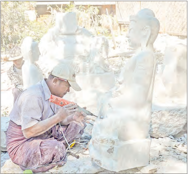
A man is making a marble Buddha statue.

are more than 60 licence holders. There are also more than 300 small marble businesses which produce marble Buddha statues in our Sagyin Village. The business people need to apply for licences,” he said. The association will also cooperate with the officials of the tourism sector to improve