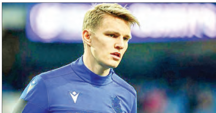
New Gunner: Martin Odegaard has joined Arsenal on loan from Real Madrid.

Ozil had long since been cast aside by manager Mikel Arteta. The 32-year-old had not played since March despite being one of the highest earners at the club on a reported £350,000 a week. ■