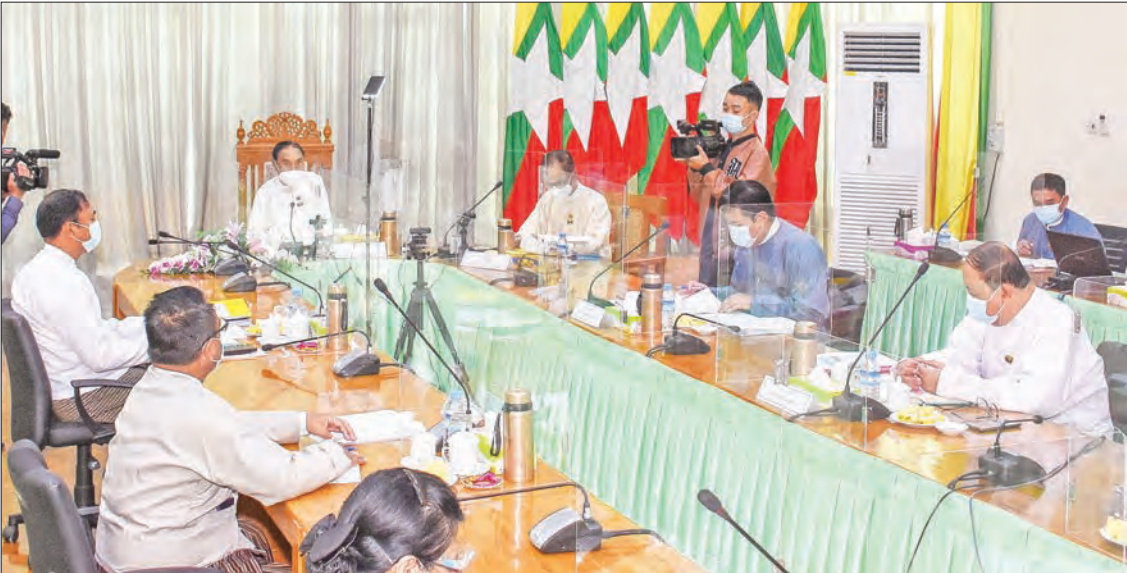
Union Minister Nai Thet Lwin attends the meeting on virtual celebration of Ethnic Culture Festival 2021 in Nay Pyi Taw on 28 January 2021.

THE Ministry of Ethnic Affairs held a coordination meeting on the successful holding of the 3rd Ethnic Culture Festival 2021 to promote ethnics culture and tourism industry in Nay Pyi Taw according to the COVID-19 health guidelines yesterday.