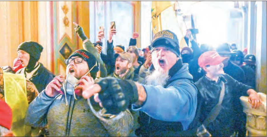
More than 150 people, including members of armed extremist groups, have been arrested since Trump supporters stormed the US Capitol on January 6, 2021.

THE US Department of Homeland Security declared a nationwide terrorism alert Wednesday, citing the potential threat from domestic anti-government extremists opposed to Democrat Joe Biden as president. Extremists "emboldened" by the deadly January 6 assault on Congress by angry supporters of former president Donald Trump could undertake attacks against elected officials and government facilities, the alert said.