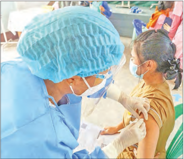
Monghkat Township.