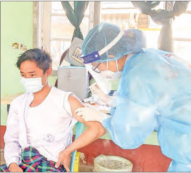
Chipwe Township.