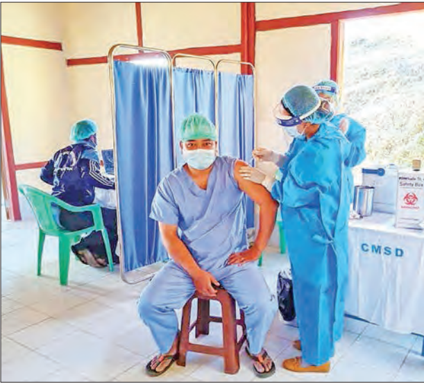
Sumprabum Township.