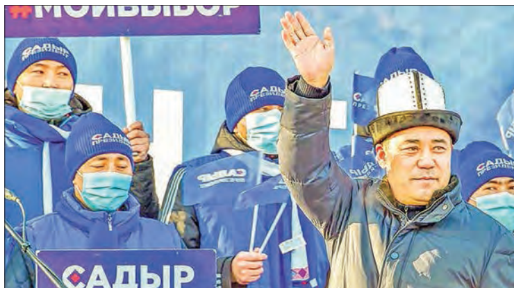
Sadyr Japarov wearing the national Kalpak felt hat waves to supporters during a rally in Bishkek on January 8.

He won a January 10 presidential election by a landslide with close to 80 per cent of the vote. Japarov on Thursday swore to “preserve the integrity of the people and the security of the country” as he placed his hand on the Kyrgyz constitution, which is set to be overhauled in the coming months. Voters chose a presidential form of government over a parliamentary model in a referendum held in parallel to the presidential vote. A Kyrgyz cab-