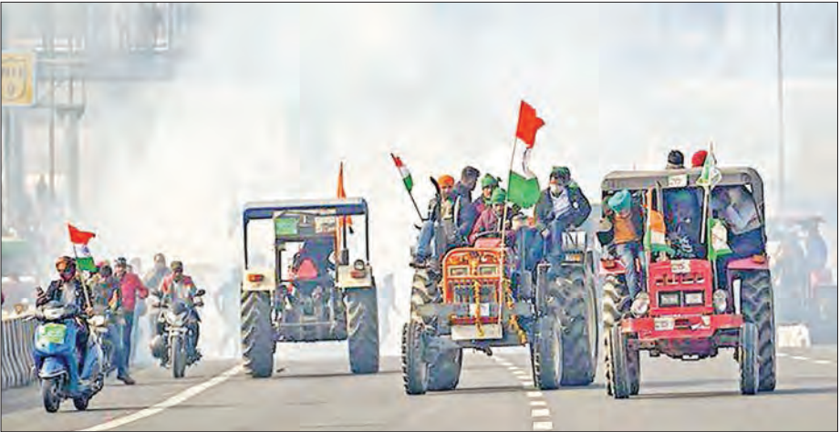
Thousands of Indian farmers, many on tractors, breached police barricades to launch a protest march in Delhi.