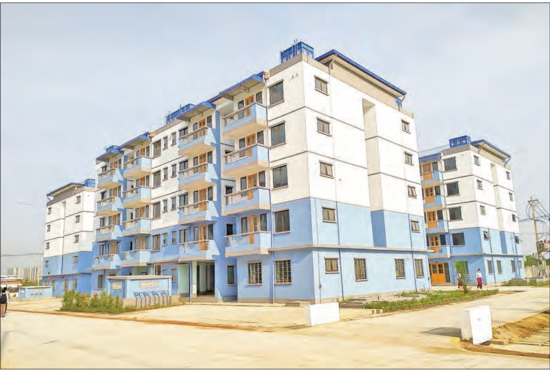
Picture shows the buildings at Mya Nandar Government Employee Housing in Dagon Myothit (Seikkan) Township, Yangon Region.

THE opening ceremony of Mya Nandar government employee housing was held in the morning of 28 January at its housing compound. The government employee housing contains 476 apartments which are intended to be provided for in-service government employees. It is located in Ward 73, Dagon Myothit Seikkan Township, Yangon Region. At the opening ceremony, the Yangon Region Chief Minister U Phyo Min Thein and Regional Hluttaw Speaker U Tin Maung Tun formally opened the ceremony, pressing the button to unveil the signboard. Then, the Chief Minister gave a thankful speech regarding the opening ceremony of the housing. The rental housing project was implemented in the 2018-2019 financial year by the Department of Urban and Housing Development, Ministry of Construction under the supervision of the Yangon region government. "The rental housing was constructed to provide affordable housing for in-service civil servants staff in Yangon region. We will rent the housing apartment for them. The staff who are still in service have to apply for the apartments through their re-