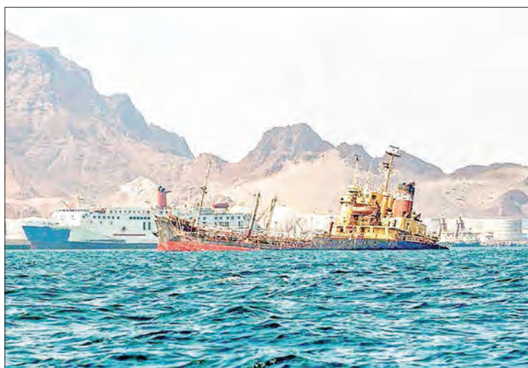
Oil tanker threatens to explode or spill more than a million barrels of oil in the Red Sea.

In November, Yemen’s Huthi rebels confirmed they had given the green light for a mission to assess the FSO Safer fuel tanker,