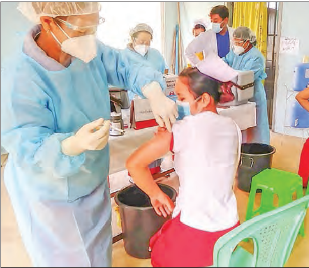
Nawngkhio Township.