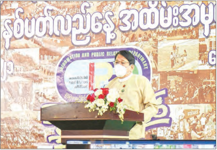
Union Minister Dr Pe Myint speaks at the 30th anniversary event of the Information and Public Relations Department in Nay Pyi Taw on 28 January 2021.

It is necessary to be more careful about having good impacts in serving with positive intention, he added. He highlighted the children's literature festival and Youth All-round Development Festival organized by the department, stressing the important role of libraries and librarians in public services, including public talks. He appreciated IPRD for its participation in the successful celebration of 100th anniversary of Myanmar film industry by cooperating with the relevant