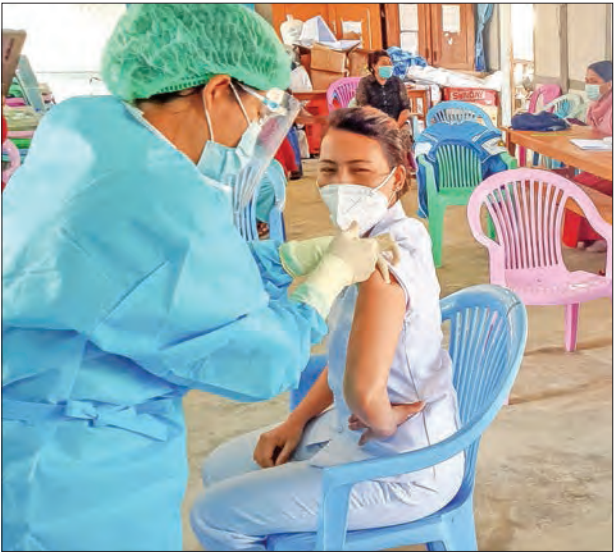
Tanai Township.