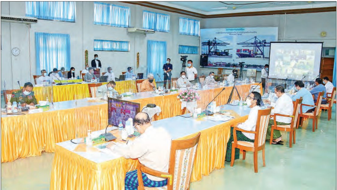
Vice-President U Henry Van Thio speaks during the Meeting of National Water Resources Committee at the Ministry of Transport and Communications in Nay Pyi Taw on 28 January 2021.

the 8th World Water Forum that took place in Brazil in March 2018.