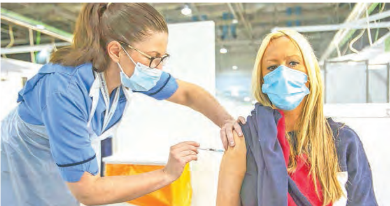
A nurse administers the Pfizer/BioNTech COVID-19 vaccine at the NHS Louisa Jordan temporary hospital in Glasgow, Scotland on 23 January, 2021.

Many vaccination centres in France have not received low dead space syringes and are find-