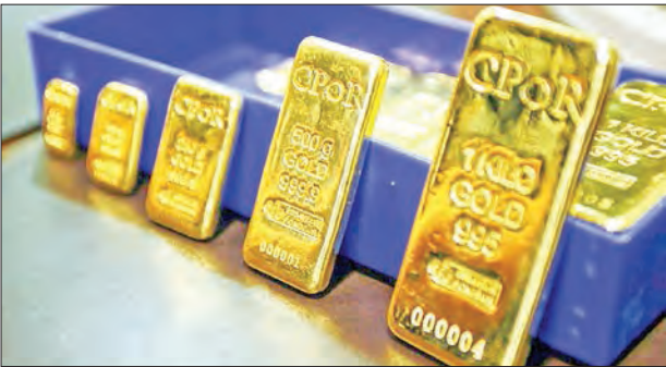
Gold prices struck a record high last year, but demand plugged as jewellery sales were impacted by lockdowns and economic uncertainty.

THE fate of the US economy depends on the course of the pandemic and the Covid-19 vaccine rollout, but the outlook is nonetheless “highly uncertain”, Federal Reserve Chair Jerome Powell said Wednesday. “A resurgence in recent months of Covid-19 cases, hospitalizations and deaths is causing great hardship for millions of Americans and weighing on economic activity and job creation,” the central bank chief said. He said government spending programs have helped support the economy, but the United States needs to recover at least nine million jobs to reach the goal of full employment. SOURCE: AFP