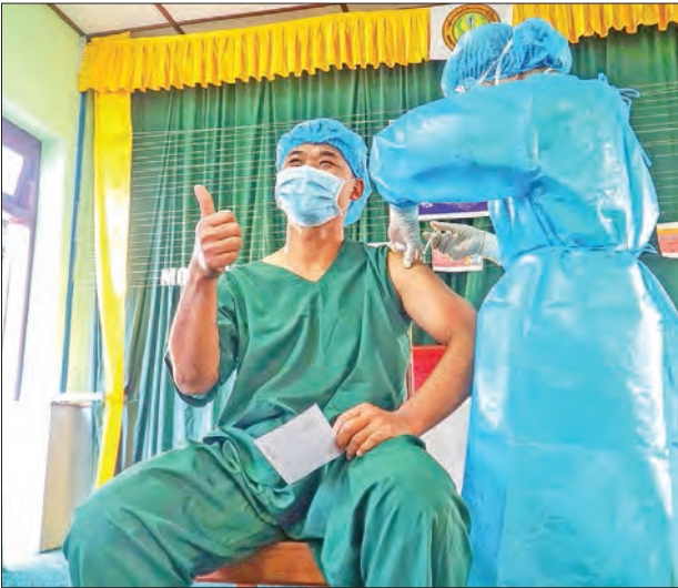
Mongpan Township.