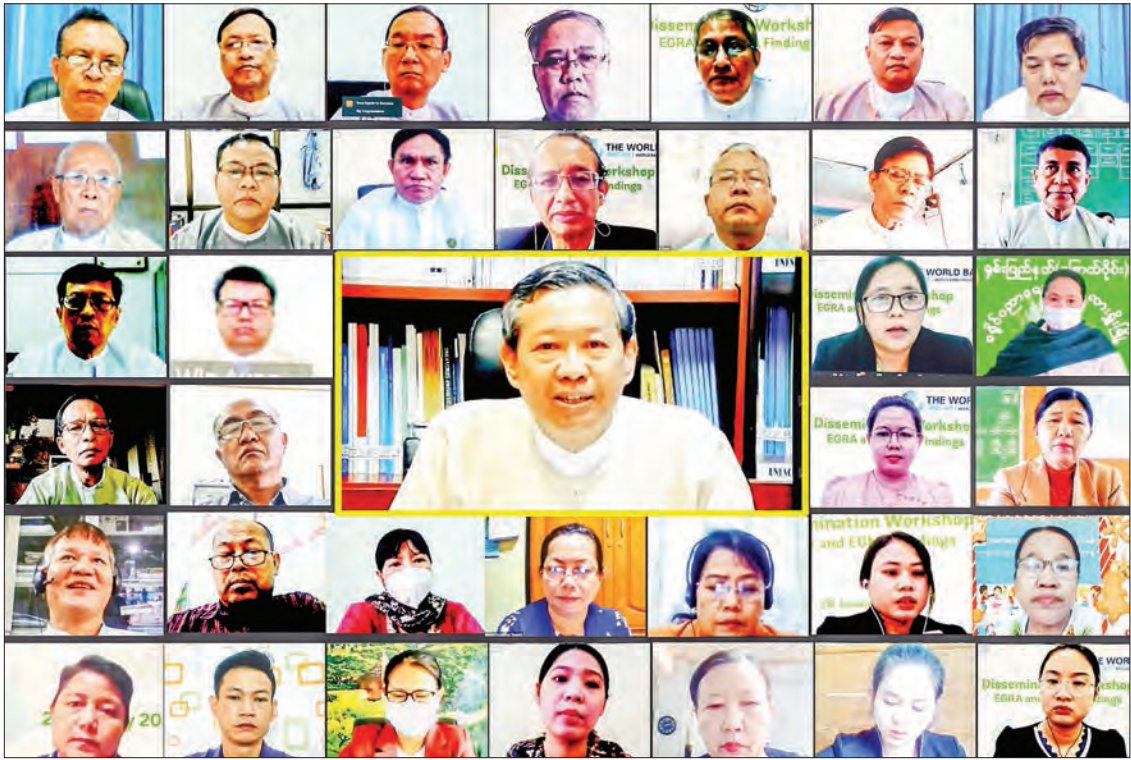
Union Minister Dr Myo Thein Gyi participates in the virtual meeting on Early Grade Mathematics Assessment and Reading Assessment on 28 January 2021.

UNION MINISTER for Education Dr Myo Thein Gyi participated in the virtual meeting over presenting the findings and ongoing work plans of Early Grade Mathematics Assessment and Reading Assessment (EGRA/EGMA) yesterday. The Union Minister said all should participate in EGRA/EGMA to improve the reading, writing and mathematics skills of primary level children. Only such a move can be sure for the children to gain the chance for lifelong learning and 21st-century skills. He also discussed the importance of EGRA/EGMA in improving the 21st-century skills in addition to science and basic computer skills, financial, culture and civics. According to the annual result, the reading ability of children can be known, and there are also children who cannot even read, and so it is important to