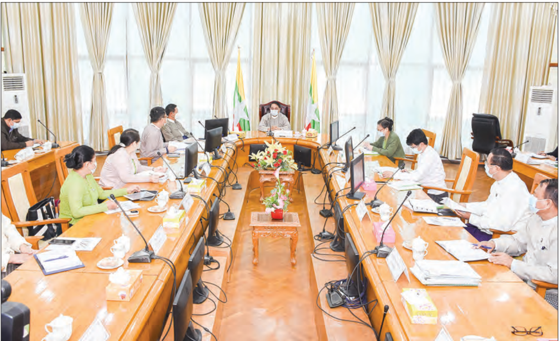
Union Minister Dr Than Myint chairs the inter-ministerial meeting on Trade Policy Review preparations on 26 January 2021.

Officials from relevant departments and organizations based in Nay Pyi Taw will participate together in the upcoming meeting from the Kempinski Hotel in Nay Pyi Taw. Other relevant officials will participate in the meeting via online.