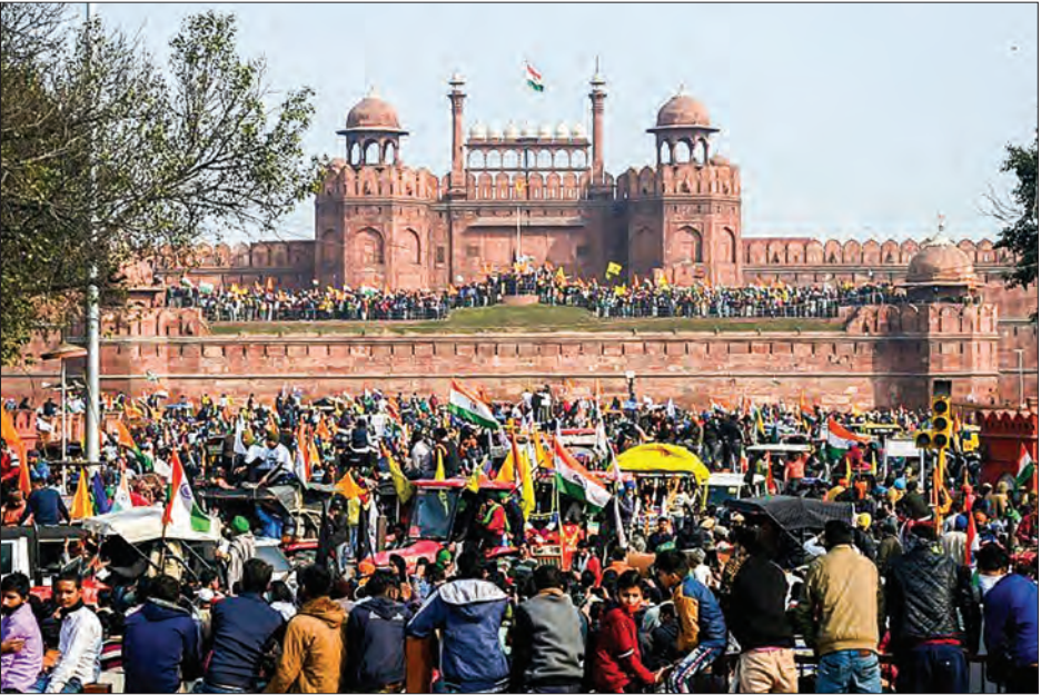
Protesting farmers gathered at the Red Fort in the heart of the capital. PHOTO: AFP

nationalist government since it came to power six years ago. The government had opposed the rally saying it would be a "national embarrassment" at a time when it should be celebrating Republic Day. SOURCE: AFP