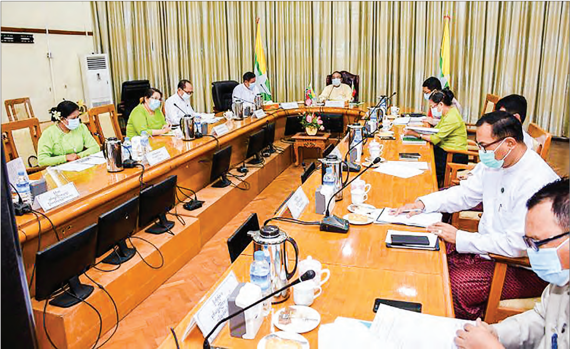
Union Minister Dr Than Myint participates in the “soft opening” ceremony for application of trademark registration online on 1 October 2020.