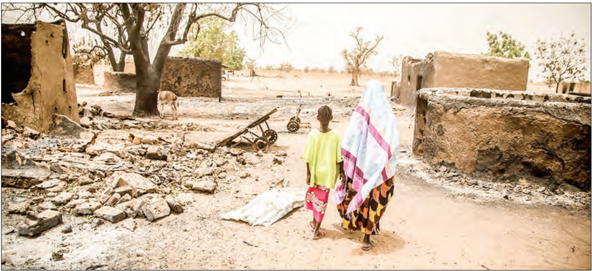
A woman and her daughter walk past the remains of destroyed homes during the March 2019 attack on Ogossagou village by armed Dogon men in which over 150 civilians were killed.

In pointing to the momentum generated by the global ceasefire so nations can focus instead on fighting COVID-19, Ms DiCarlo cited Libya as an example of how sustained political engagement, more unified support from the international community and commitment by the parties can lead to tangible progress.