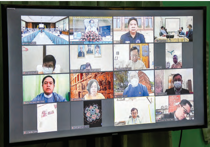
Vice-President chairs the online 5 th coordination meeting on the completion of renovation works of Bagan, Nyaung-U temples, yesterday.

FROM PAGE-1 works. Chief Minister of Mandalay Region Government Dr Zaw Myint Maung discussed tourism