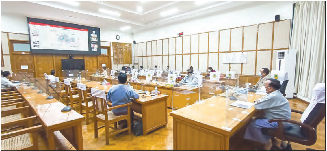
Union Minister U Han Zaw chairs the online coordination meeting on public rental housing construction projects, on 26 January 2021.

the three entrepreneur associations (MCEF, MLCA and MDA) have been implementing the project and 25 per cent of the building and infrastructure work is completed at present.—MNA (Translated by Ei Phyu Phyu Aung)