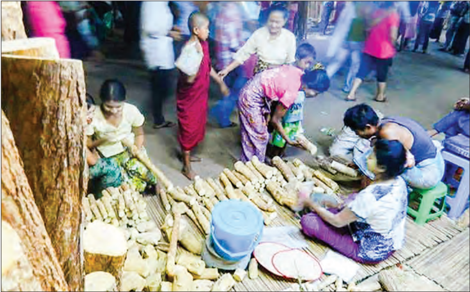
Myanma Thanaka is being sold at a marketplace.