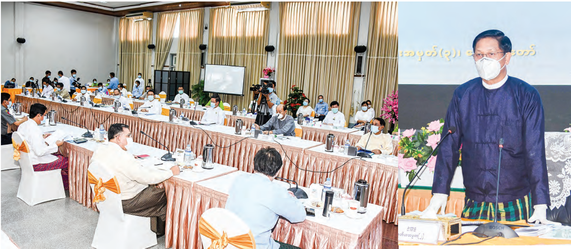
Vice-President U Henry Van Thio, chairman of the Central Committee of Intellectual Property (CCIP), delivered a speech at the first meeting of the CCIP since its formation under Section 4(a) of the Industrial Design Law, Trademark Law, Patent Law, and Literature and Art Copyright Law.