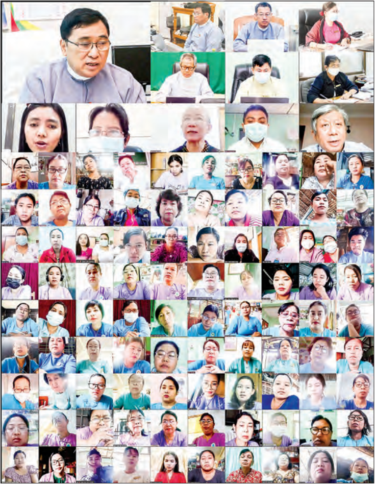
Union Minister Dr Win Myat Aye joins the online training for CCV in Yangon yesterday.

THE Ministry of Social Welfare, Relief and Resettlement held online training for Community COVID Volunteer (CCV) to involve in the community-based COVID-19 prevention and control activities of Yangon Region yesterday. Union Minister Dr Win Myat Aye, in his capacity as the Secretary of the National Volunteer Leading Body, said the country has been facing the second wave of COVID-19 since August 2020. Although the infection and death rates in regions and states, including Yangon Region decline, the virus outbreak is still occurring. All should make protections not to occur the third wave after the second one. The Union Minister also discussed COVID-19 vaccination plans and cooperation work between the government and public to carry out the protective activities in the long run. He also stressed the need to cooperate with the youth committee members from respective wards/villages, women committee members, Red Cross Society and volunteering groups, as well as to conduct training