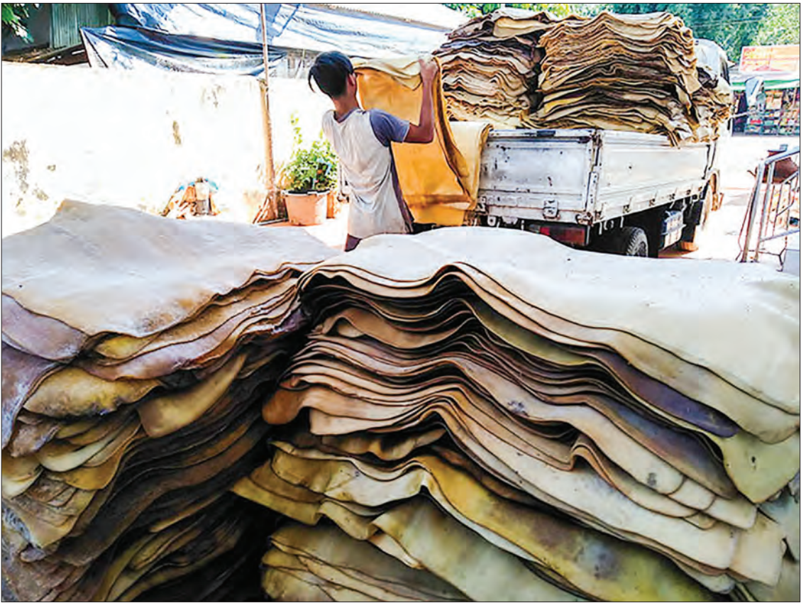
A worker loading smoked rubber sheets to a truck at a rubber market.

“Rubber price is directly related to the coronavirus situ-