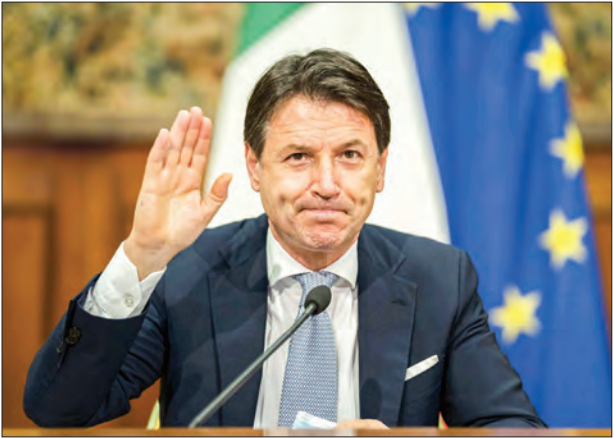
Italian Prime Minister Giuseppe Conte waves during a videoconference with members of the European Council on the EU response to the COVID-19 pandemic, Rome, Italy, Nov. 19, 2020. PHOTO: AFP/FILE

ID-19 pandemic and has since suffered badly, with the economy plunged into recession and deaths still rising by around 400 a day. Parts of the country remain under partial lockdown, the vaccination programme has slowed and a deadline is looming to agree plans to spend billions of euros in European Union recovery funds. SOURCE: AFP