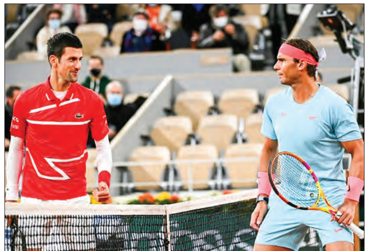
Rafael Nadal and Novak Djokovic have been quarantining in Adelaide.