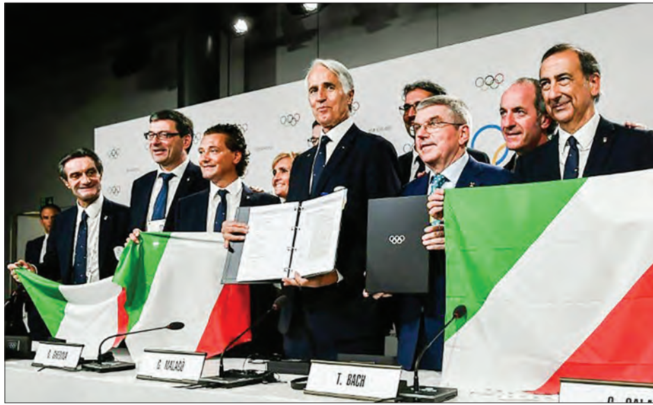
Italy risk suspension from the Olympic movement.

It had previously been managed directly by the IOC.—AFP ■