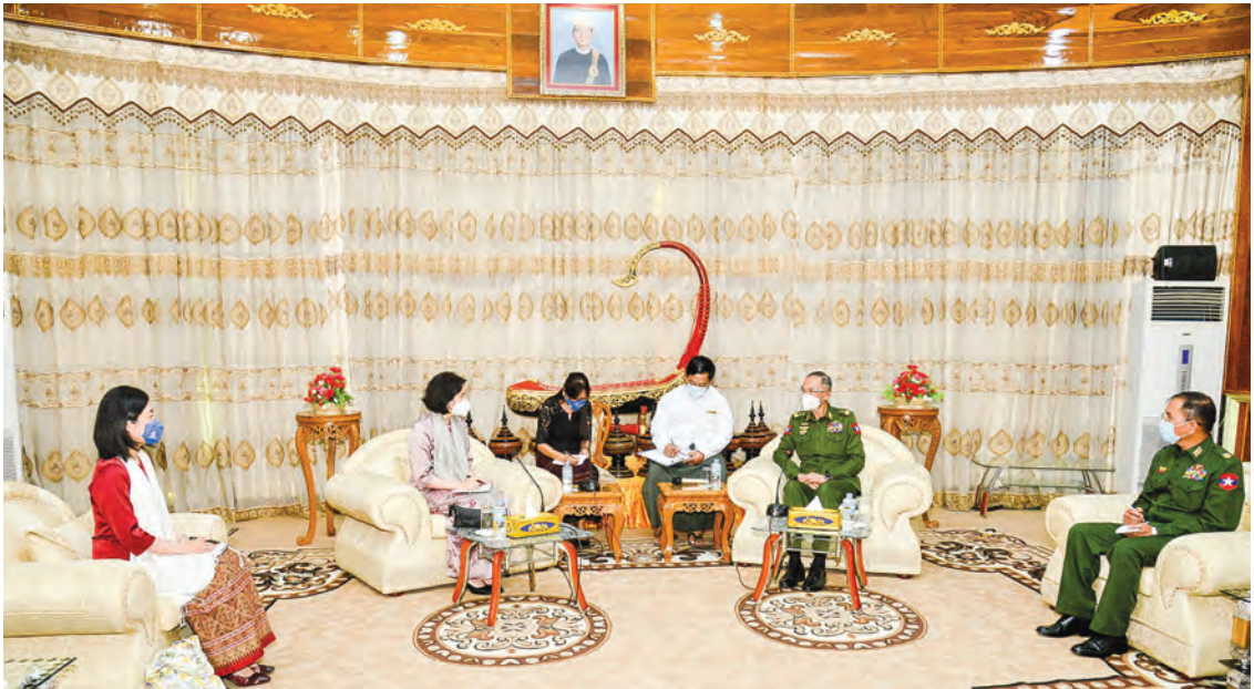
Union Minister for Defence Lt-Gen Sein Win receives UNHCR Representative Ms Hai Kyung Jun at the former's office in Nay Pyi Taw yesterday. UNION Minister for Defence Services Lt-Gen Sein Win received UNHCR Representative Ms Hai Kyung Jun at his office in Nay Pyi Taw yesterday afternoon. At the meeting, they discussed the relief assistance of UN agency for Rakhine State and other areas of the country.—MNA (Translated by Aung Khin)

THE 41 st relief flight of Myanmar Airways International (MAI) organized by the Myanmar Embassy in Seoul landed at Yangon International Airport bringing back a total of 85 Myanmar nationals after they were stranded in the Republic of Korea yesterday evening. Among them, 67 people were from the RoK, 4 from the USA, 4 from Italy, 1 from Switzerland, 1 from Egypt, 4 from Norway, 3 from Germany and 1 from Brazil. The Ministry of Labour, Immigration and Population, the Ministry of Health and Sports and the Yangon Region government arranged 14-day quarantine at specific places or designated hotels, followed by the 7-day home quarantine. To bring back the Myanmar citizens and Myanmar seamen who are stranded in foreign countries by relief flights and chartered flights in accordance with the instructions from National-Level Central Committee on Coronavirus Disease 2019 (COVID-19), the Ministry of Foreign Affairs cooperated with the relevant ministries and Myanmar embassies from respective countries.—MNA (Translated by Ei Phyu Phyu Aung)