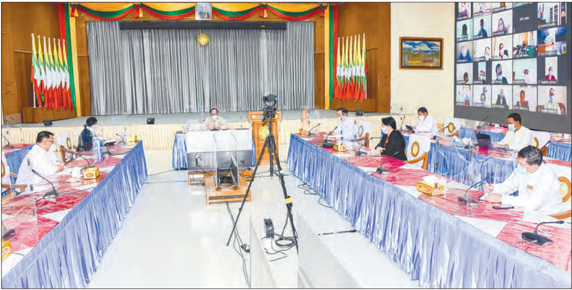
Union Minister Dr Myint Htwe holds talks on COVID vaccination plan with the state/regional medical departmental heads on 26 January 2021.

UNION Minister for Health and Sports Dr Myint Htwe discussed COVID-19 vaccination plan with the heads of regions/states Public Health and Medical Services Department online yesterday. During the meeting, the