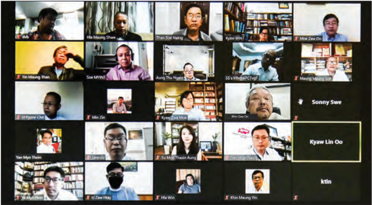
Government representatives and stakeholders hold an online meeting on peace process, on 26 January 2021.