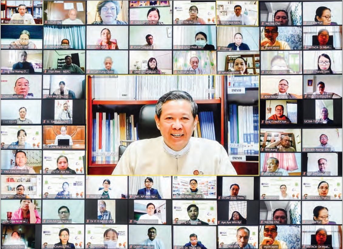
Union Minister Dr Myo Thein Gyi joins the online ‘University Challenges’ workshop on 26 January 2021.