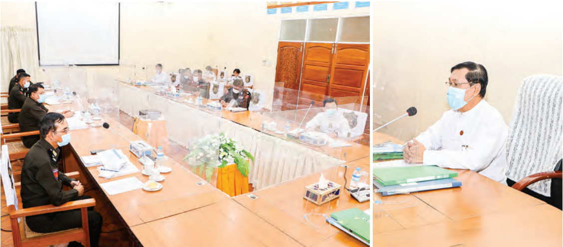
Union Minister U Thein Swe joins the meeting on the progress in the e-ID registration for population, yesterday.

In his concluding remark, the Union Minister gave advice on future plans for developing an e-ID law that can relate to other laws.—MNA (Translated by Aung Khin)