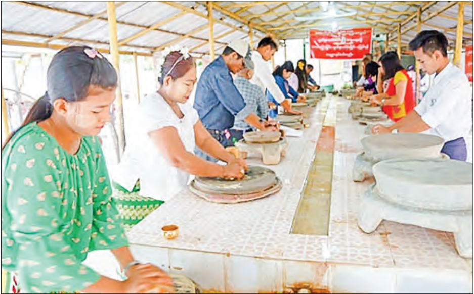
Myanmar women and men are seen grinding the thanaka on Kyauk Pyin(stone slabs).