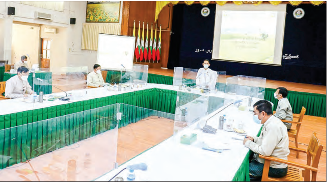
Union Minister Dr Aung Thu participates in the 32 nd meeting of the Central Committee on Administration of Vacant, Fallow and Virgin Lands on 26 January.

nic people's customary land and lands for religious affairs, social, education, health and transportation. Then, Secretary U Thet Naing Oo of the committee briefed the facts related to the vacant, fallow and virgin lands management and the attendees coordinated the discussion. The meeting also focused on the applications for the use of vacant, fallow and virgin lands, reviews on the performance of the committee, comments of relevant ministries during this government term, special investigating team for the inspection on the use of lands and complaint reports on applications for the