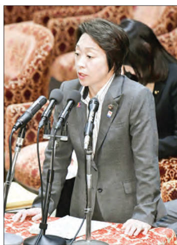
Japan's Olympics minister Seiko Hashimoto.

And in parliament on Tuesday, Olympic Minister Seiko Hashimoto said the government was still committed to