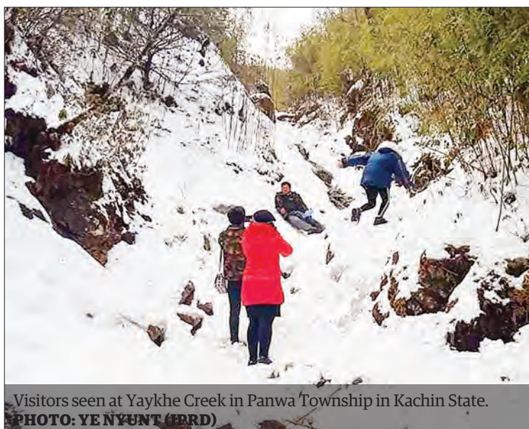
Visitors seen at Yaykhe Creek in Panwa Township in Kachin State.

In winter, Panwa is usually covered with ice and snow because of snowfalls.—Ye Nyunt (IPRD) (Translated by Maung Maung Swe)