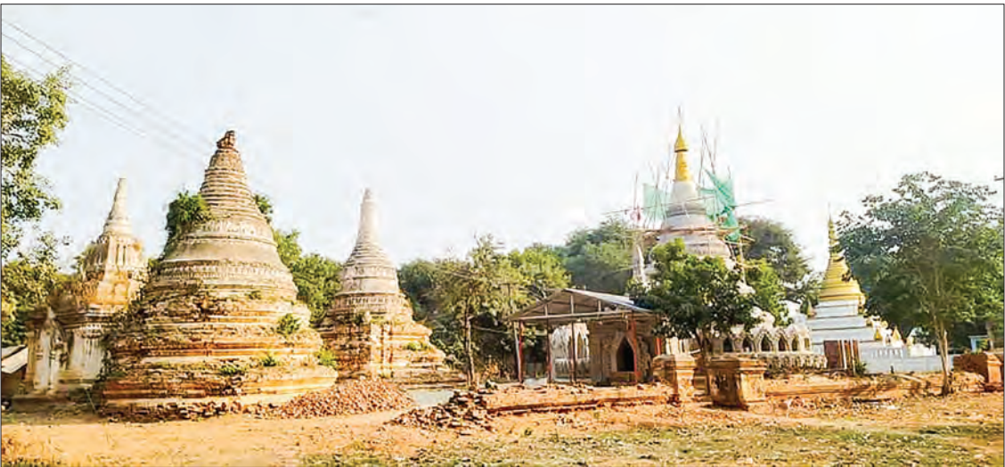
Ancient pagodas in Paleik area of Singaing Township.

SOME of the residents in Paleik want the ancient cultural area in Singaing Township to be systematically managed to become a