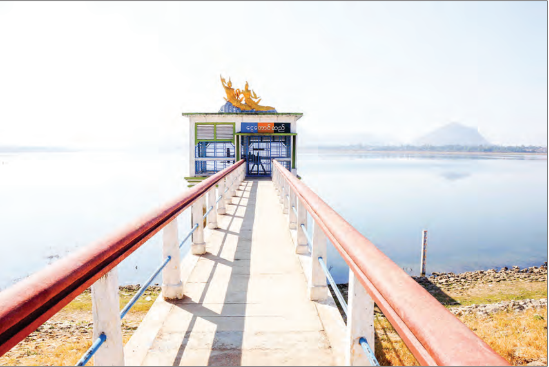
Ngwe Taung Dam in Dimawhso Township of Kayah State.

"The water storage amount of the Ngwe Taung Dam has reached its lowest level in 20 years, according to U Hla Thein. Every month, more than 1.2 million gallons of water