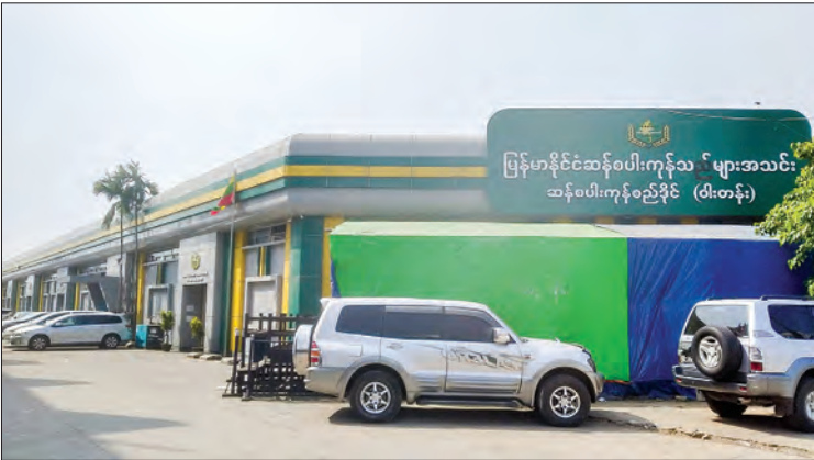
Picture shows the office of Myanmar Rice and Paddy Traders Association in Wahdan Street, Yangon.

clined by one-third as restaurants, and retail shops were closed during the pandemic.” “Rice price, however, increases around the end of each month due to higher demand by consumers,” he added. The wholesale centre is opened five days each week since 18 December as the COVID-19 infection rate has declined although it was run only three days during the second wave of pandemic.—Thant Zin Win