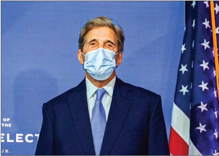
Nominated Special Presidential Envoy for Climate John Kerry participates as US President-elect Joe Biden speaks during a cabinet announcement event in Wilmington, Delaware, on 24 November 2020.

NEW US climate envoy John Kerry said he regretted his country’s absence from the fight against climate change under Donald Trump, at an online summit of world leaders on Monday. President Joe Biden’s pointman on the issue committed the United States to efforts to make communities more resilient to the effects of climate change, the focus of the meeting hosted by the Netherlands. German Chancellor Angela