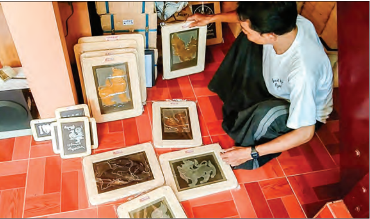
The traditional blackboard slates makers in Mu Doon village of Chaungzon Township try to revive the business with creative designs.

THE traditional blackboard slates makers in the Mu Doon village of Chaungzon Township in Mon State tried to revive the business with creative designs. Yet, pandemic-induced demand slumps stopped production, coupled with travel restrictions. Nowadays, the blackboard slates are rarely seen as a teaching tool as technology changed clay tablets to digital boards. However, that did not stop makers following design trends. They are trying to maintain the traditional business with creative