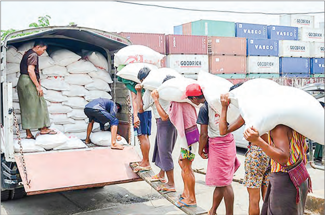
Workers carrying sacks of rice at the Botahtaung Jetty in Yangon.

Bangladesh signed a Memorandum of Understanding with Myanmar for its self-sufficiency of foodstuffs and cooperation in the rice sector in 2017. Myanmar exported 100,000 tonnes of rice to Bangladesh in the 2017-2018 financial year. Later, Bangladesh stopped importing rice from external markets as they do not have staple food. However, Bangladesh's government called for a tender to purchase rice again to control the market's rise amid the COVID-19 pandemic. The two countries' counterparts are under negotiations for the purchase of 100,000 tonnes of rice, he continued.