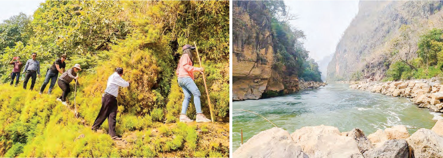
Tourism Committee secretary and team visited along Dotthawadi River to explore new tourism sites in northern Shan State.

We appreciate your feedback and contributions. If you have any comments or would like to submit editorials, analyses or reports please email aungthuya@gnlm.com.mm with your name and title. Due to limitation of space we are only able to publish “ Letter to the Editor ” that do not exceed 500 words. Should you submit a text longer than 500 words please be aware that your letter will be edited.