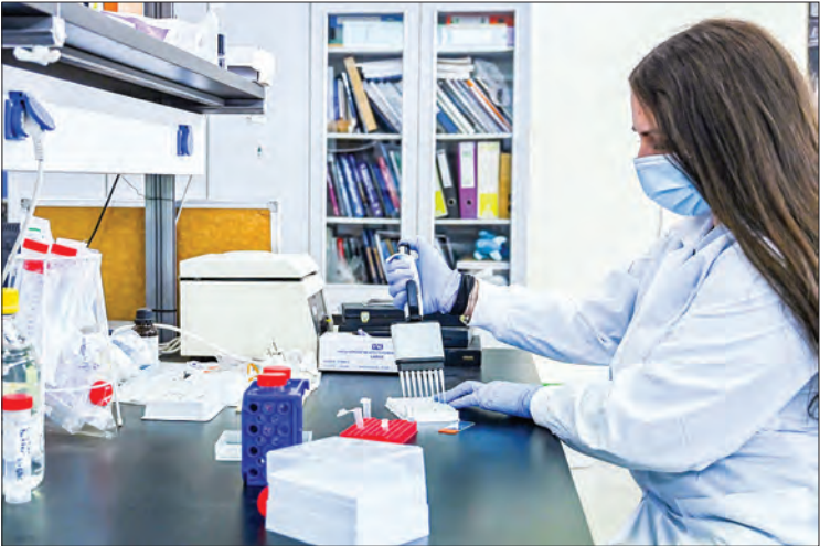
A scientist works on samples at a laboratory in Athens, on January 18, 2021.

A major clinical trial in Canada shows an inexpensive anti-inflammatory drug called colchicine can reduce the risk of complications and death from the virus.