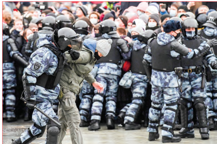
Police detain a protester during a rally in support of jailed opposition leader Alexei Navalny in downtown Moscow on January 23, 2021.