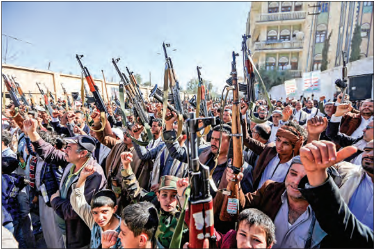
Supporters of Yemen’s Huthi movement gesture as they chant slogans during a demonstration against the outgoing US administration’s decision to designate the Iran-backed rebels as terrorists, in the capital Sanaa on January 20, 2021.

The Iran-aligned Huthis seized the capital Sanaa in 2014 and much of northern Yemen, sparking a Saudi-led intervention the following year to prop