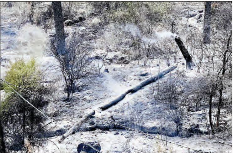
A fallen electricity pole is pictured in a residential area following a fire amidst extreme heat wave in the village of Mevo Modi'im, in central Israel on May 24, 2019. PHOTO: AFP nerable countries face particularly great challenges in dealing with the consequences of extreme weather events,” said co-author David Eckstein. “They urgently need financial and technical assistance.” SOURCE: AFP

since 2000, with Puerto Rico, Myanmar and Haiti the worst hit countries, it said. Under the 2015 Paris climate deal, wealthier nations are supposed to provide $100 billion every year to help poorer states mitigate temperature rises and adapt to the changing climate. But recent research suggests the true amount of funding available to developing countries for climate action is vastly lower. Germanwatch’s Global Climate Index examined the impact of two decades of extreme weather events, particularly the 2019 storm season, which produced hurricanes and cyclones that devastated parts of the Caribbean, east Africa and south Asia. “This shows that poor vul-