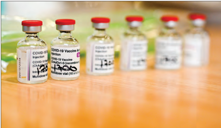
Vials of the Oxford-AstraZeneca Covid-19 vaccine are pictured ahead of doses being given to residents at the Belong Wigan care home in Wigan, northwest England, on January 21, 2021.

US biotechnology firm Moderna on Monday said lab studies showed its Covid-19 vaccine would remain protective against variants of the coronavirus first identified in the United Kingdom and South Africa.