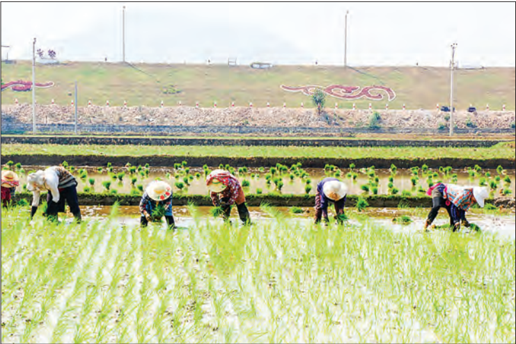
Cultivation of paddy plants near Ngwe Taung Dam.

from the Ngwe Taung Dam is distributed to the paddy fields and residents in the township for their daily uses," said U Hla Thein. The construction works for the Ngwe Taung Dam were started in 1962 with the aim of irrigating more than 6,000