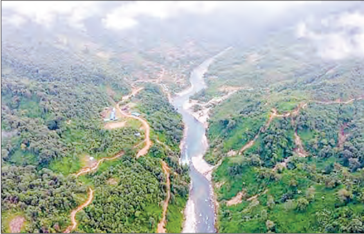
Aerial picture shows Khakaborazi area in the northernmost part of Myanmar.

THE Ministry of Border Affairs is constructing an earth road in Khakaborazi area in the northernmost part of Myanmar.