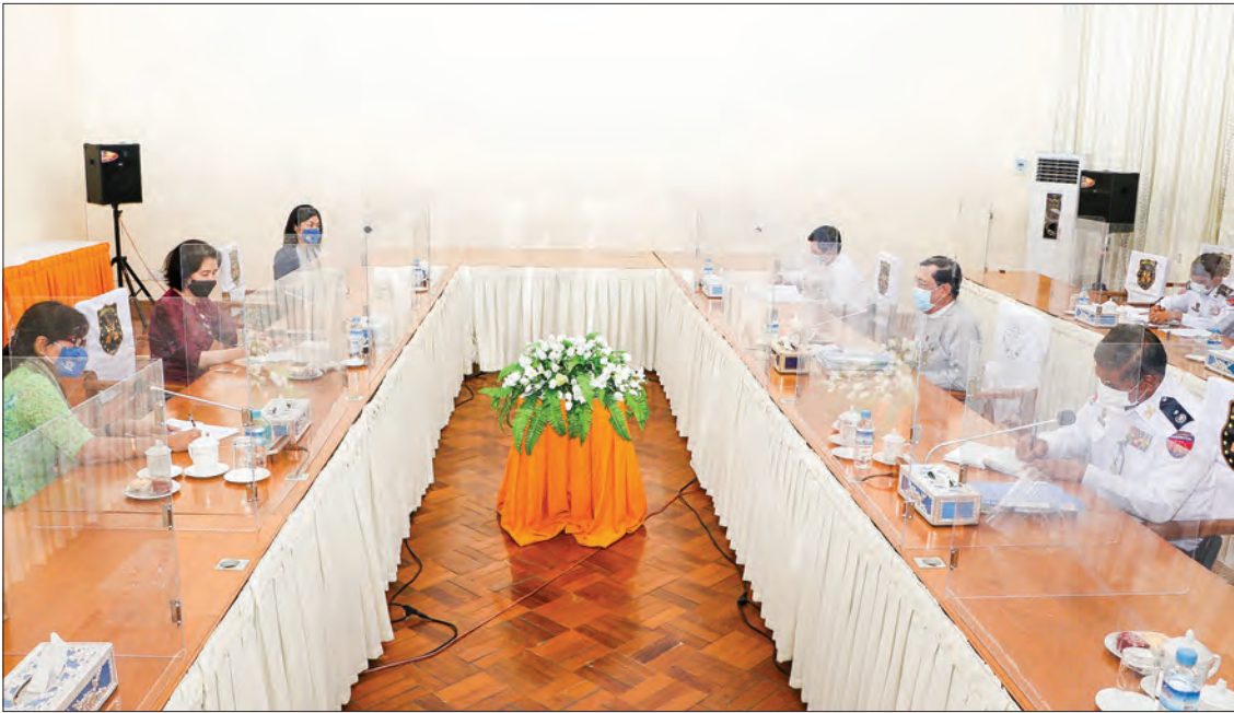
Union Minister U Thein Swe holds talks with the UN representatives about Rakhine State development in Nay Pyi Taw on 25 January 2021.

UNION Minister for Labour, Immigration and Population U Thein Swe received Resident Representative of United Nations High Commissioner for