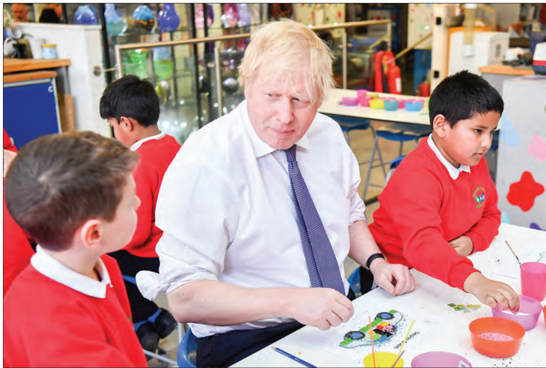
(FILES) Britain's Prime Minister Boris Johnson (C) participates in a workshop with children from the Richard Avenue Primary School prior to chairing a cabinet meeting at the National Glass Centre at the University of Sunderland, in Sunderland, northeast England on January 31, 2020.

However, Halfon's bid to force a government statement on the issue in parliament Monday failed after House of Commons Speaker Lindsay Hoyle opted