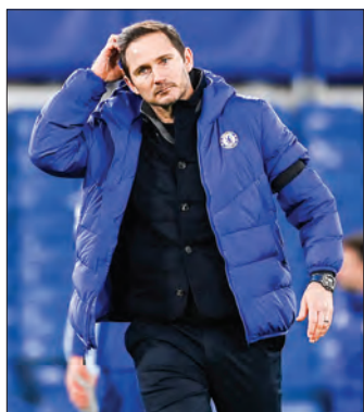
(FILES) In this file photo taken on January 03, 2021 Chelsea's English head coach Frank Lampard reacts to their defeat on the pitch after the English Premier League football match between Chelsea and Manchester City at Stamford Bridge in London.

Chelsea are struggling in ninth place in the Premier League