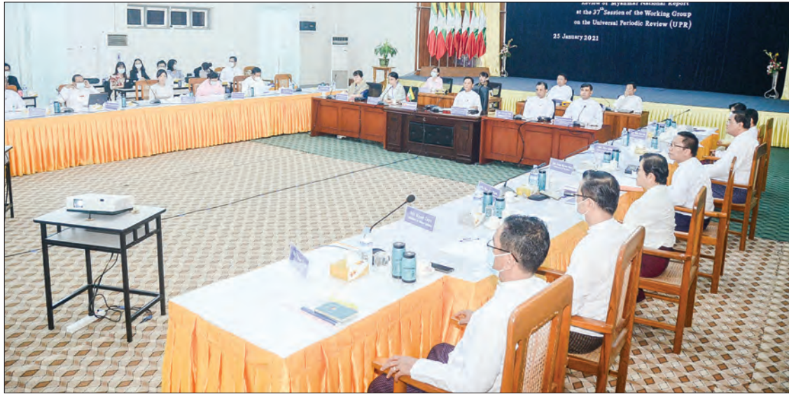
Union Attorney-General U Tun Tun Oo and Myanmar officials taking part in 37 th Session of Work Group on UPR via video conferencing to review Myanmar's third-cycle report on human rights issue on 25 January.

In making discussions, the Union Attorney-General discussed the focus of Myanmar on human rights issue in establishing a Democracy Federal Union, fundamental needs of peace, socio-economic development, the rule of law and human rights in working for the genuine democratic system, signing the Nationwide Ceasefire Agreement with the ethnic armed organizations to end the 70-year internal armed conflicts of the country, the successful holding of the 4 th session of the Union Peace Conference—21 st Century Panglong, amendment, cancellation and enactment of 185 laws in the five-year term, carrying out the Myanmar Sustainable Development Plan, the COVID-19 Economic Relief Plan of Myanmar aimed not to leave anyone behind across the country, adopting judiciary sector reform strategy and the leading role of the Union Auditor-General Office and