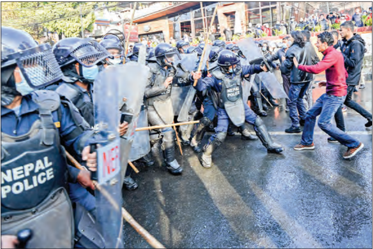
Protesters from the civil society and police clash during a demonstration against the dissolution of the country’s parliament in Kathmandu on January 25, 2021.

POLICE used batons and water cannon Monday to disperse hundreds of people protesting in