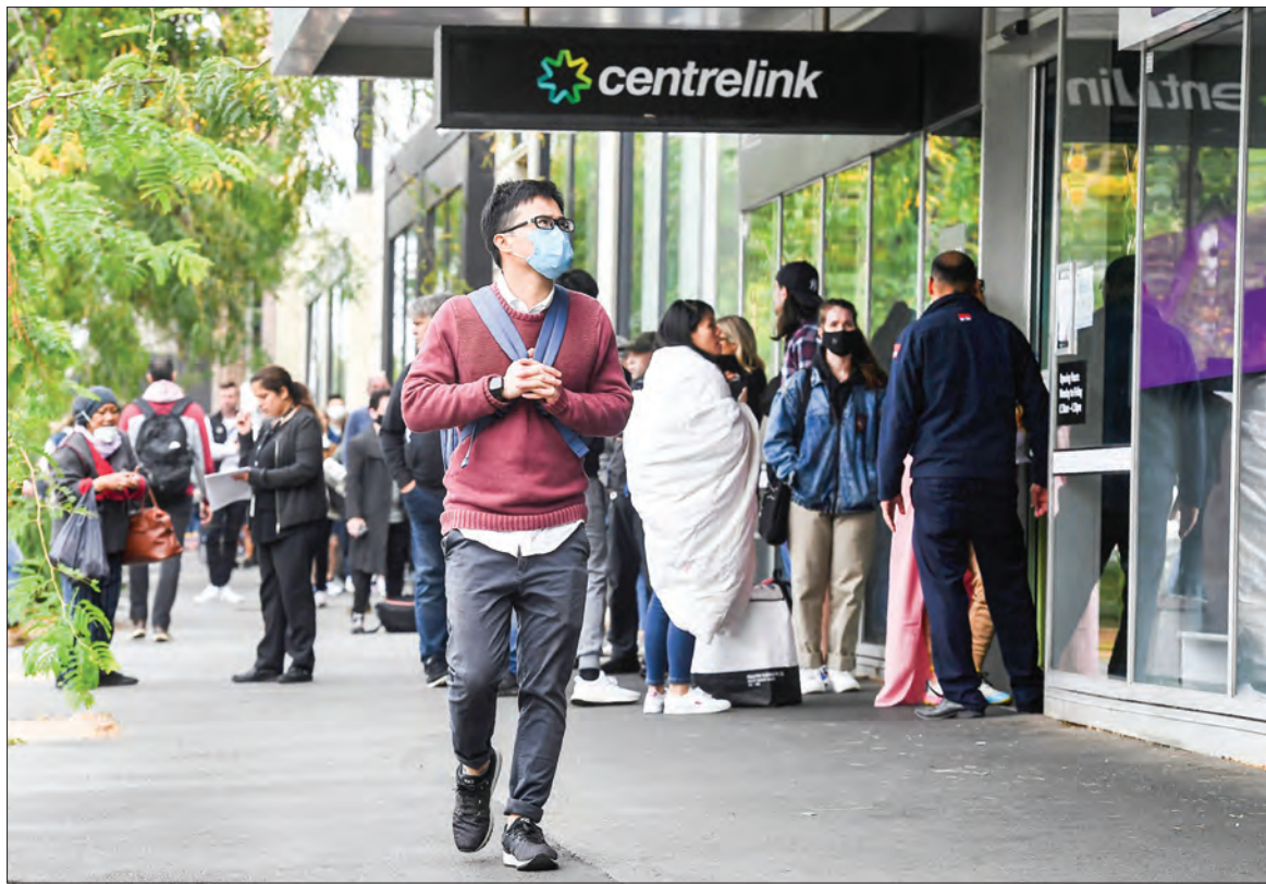
Hundreds of people queue outside an Australian government welfare centre, Centrelink, in Melbourne on March 23, 2020, as jobless Australians flooded unemployment offices around the country after Prime Minister Scott Morrison warned the coronavirus pandemic would cause an economic crisis akin to the Great Depression.

But the world also saw "unprecedented levels of employment loss" last year, it said.