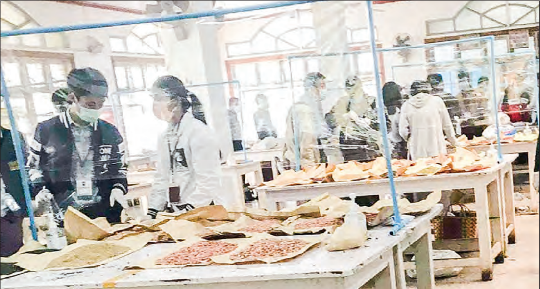
Traders are seen evaluating pulses and beans at the Mandalay pulses and beans market in line with health guidelines.

The peanuts from Nay Pyi Taw, Tatkon, Pyinmana, Myinmu and Pakokku areas are abundantly flowing into Mandalay market in the recent days. Mandalay wholesale centre, which has been suspended for four months due to the COVID-19 resurgence, was reopened starting from 21 January 2021, in line with health guidelines on coronavirus issued by the Ministry of Health and Sports.—Min Htet Aung (Man Sub-Printing House) (Translated by Ei Myat Mon)