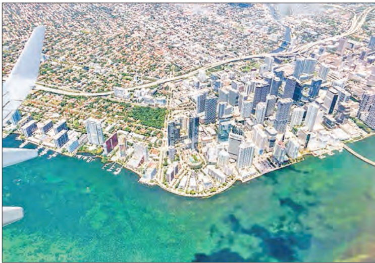
This file photo from May 22, 2019, shows an aerial view of Miami; the Florida metropolis, already a financial hub, is striving to become a leading technology hub as well.

THE city of Miami, with a growing reputation as a financial services center enhanced by its balmy climate and low taxes, is now making a concerted and increasingly successful push to attract hi-tech firms from Silicon Valley and New York.