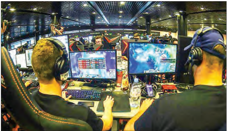
Gamers streaming their play on the Twitch platform helped boost the popularity of Among Us.

No adversaries or competition in “Animal Crossing: New Horizons” which came out in March for Nintendo’s Switch console. Instead players ex-