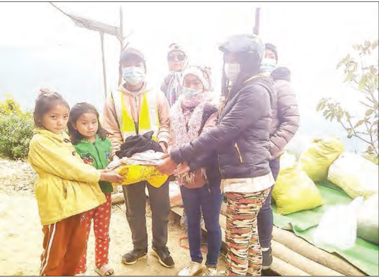
Naga children (left) accept the winter clothing from donors (right) at a village in Naga Hills, Sagaing Region.