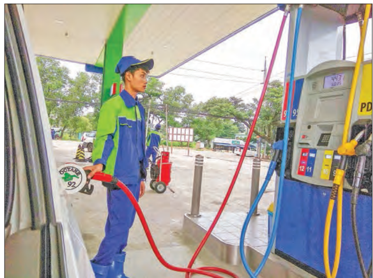
(FILE) A man fills a car with fuel at a petrol station in Yangon before coronavirus outbreak occurred in Myanmar.

THE domestic fuel oil price has now risen to 30-50 per cent per litre compared to April 2019, as the vaccine optimism grew, and some businesses resume their operations, the market data indicated.