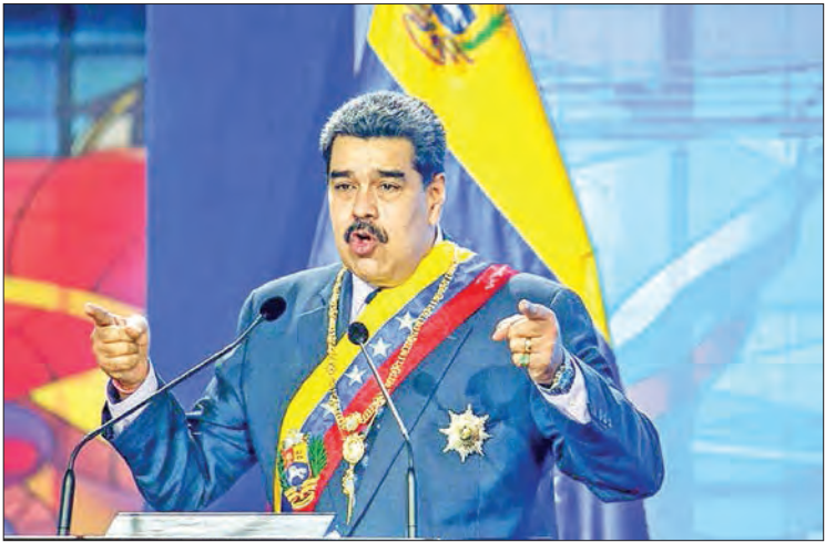
Venezuelan President Nicolas Maduro, pictured here delivering a speech on January 22, 2021, says he “is willing to turn the page” with the new US administration of President Joe Biden.

Analysts believe the Biden administration will take a more moderate stance on Venezuela and will support international