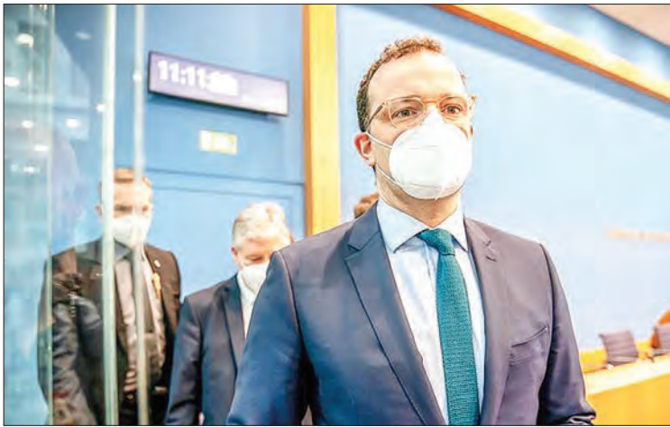
German Health Minister Jens Spahn.

The so-called monoclonal antibody cocktails will be deployed to university hospitals in the coming week, he said, adding that Germany was “the first country in the EU” to use them in the fight against the