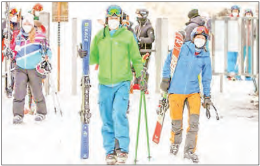
Skiers have to wear masks and keep their distance.

He has instead turned to day trips to some of the country’s 250 ski resorts, always equipped with the FFP2 mask now mandatory on lifts.