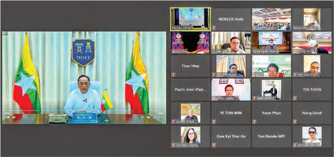
Union Minister U Win Khaing joins Myanmar Oil and Gas Services Society virtual meeting yesterday.

He continued that in 2021-2022, crude oil prices may gradually rise again. He pointed out that the global supplies and