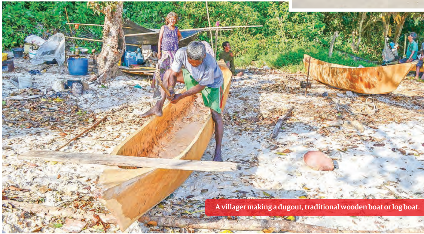
A villager making a dugout, traditional wooden boat or log boat.

The Salon people go and search fish, squid, snail, oyster, pearl, sea cucumber, hard corals, Ambergris, turtle eggs, bird nest and honey in the fine weather especially in winter and then they dry them to sell for their keeps. The Salon people do not accept to make love affairs before the marriage. If the boy and girl are in love, they let their parents know and seek permission to allow their marriage. The bridegroom has to secure the permission of the parents of their bride-to-be fronting presents or clothings. Then, they hold wedding ceremony successfully. Some elope when the parents do not agree their relationship.