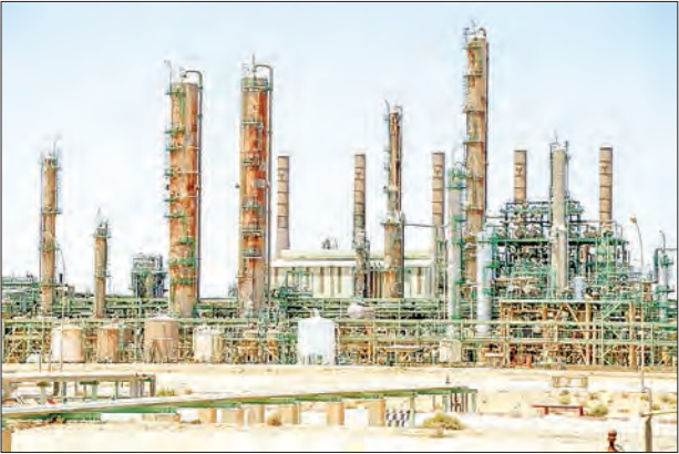
Oil refinery in Libya's northern town of Ras Lanuf. PHOTO: AFP/FILE

open for business and shoppers will open their wallets, improving the economy’s prospects. SOURCE: AFP