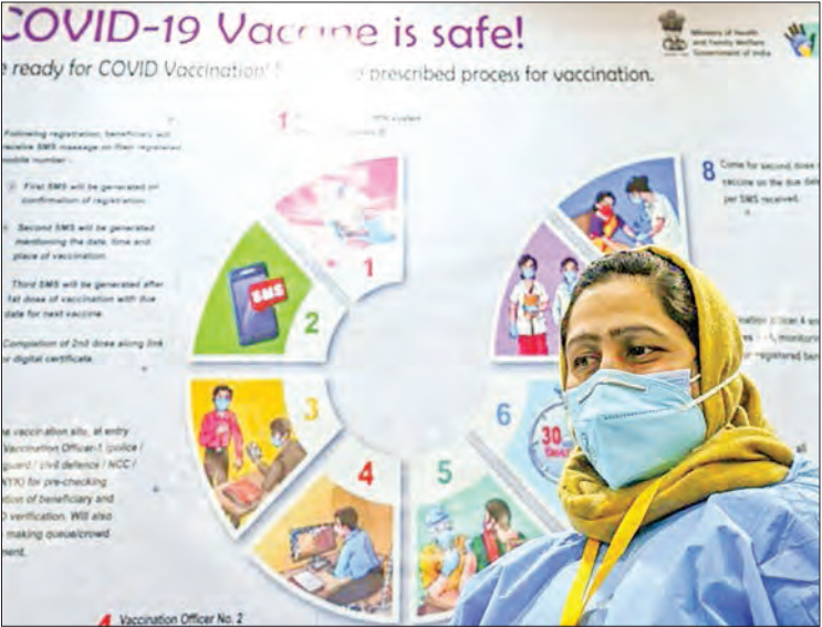
India’s huge coronavirus vaccination drive is behind schedule, hampered by technical glitches and safety fears.

In a dog training centre built inside a shipping container located in a Czech mountain village, Renda, Cap and Laky are being put to the test.