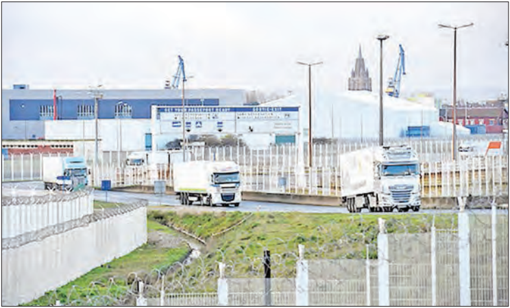
The port of Calais, the main ferry crossing point between England and France.

But stubbornly high new rates for infections, hospitalisations and Covid deaths fuelled fears France may need another full lockdown, which would be the third, inflicting yet more devastation on businesses and daily lives. Starting Sunday, arrivals to France from European Union countries by air or sea must be