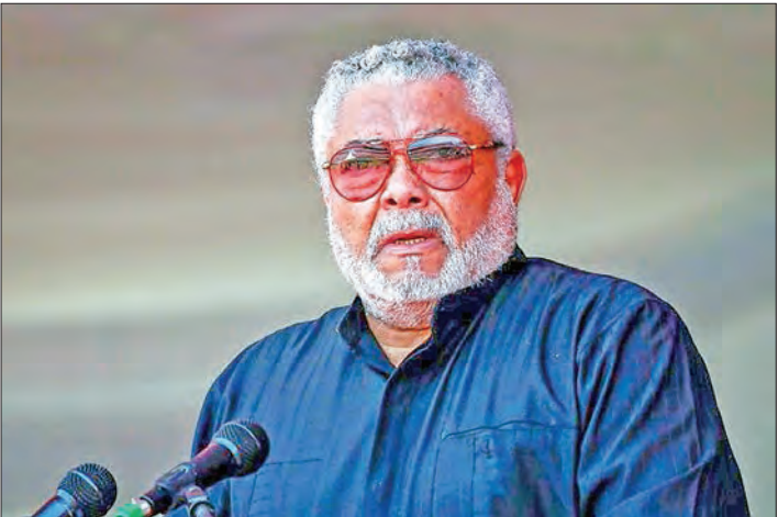
Former Ghana President Jerry Rawlings will be buried, finally, on Wednesday.

AS Ghana prepares for the funeral of former president Jerry Rawlings, the two main political parties are squabbling over his legacy.