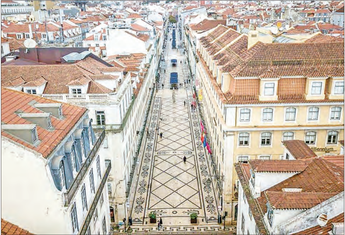
Lisbon streets have been almost empty during a second coronavirus lockdown ahead of the presidential election. PHOTO: AFP

More than 80,000 infections were reported in the past week to Friday, the highest rate worldwide in proportion to its 10.8 million people, according to an AFP tally based on government figures. SOURCE: AFP