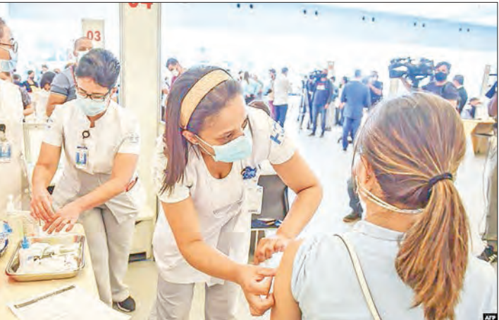
A health worker is inoculated with a COVID vaccine at the Clinicas Hospital in Sao Paulo, Brazil, Jan. 18, 2021.