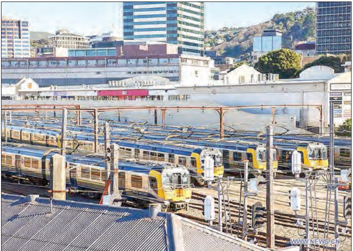
A commuter train pulls into a station in Wellington, New Zealand, June 9, 2020.