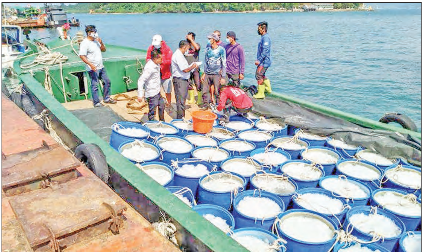
White prawns produced from the farms in Thahtay Island are exported to Thailand during coronavirus.