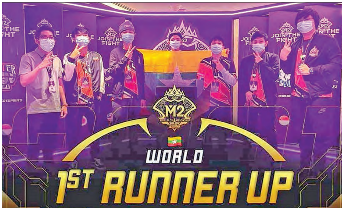
Myanmar's Esport Team, Burmese Ghouls seen after securing the 1st Runner Up title of the M2 World Championship in Singapore on 24 January, 2021.

Tennis Australia said in a statement the tournament build-up had been revamped after "extensive consultation" to help give the 72 affected players "the best possible preparation and training opportunities".