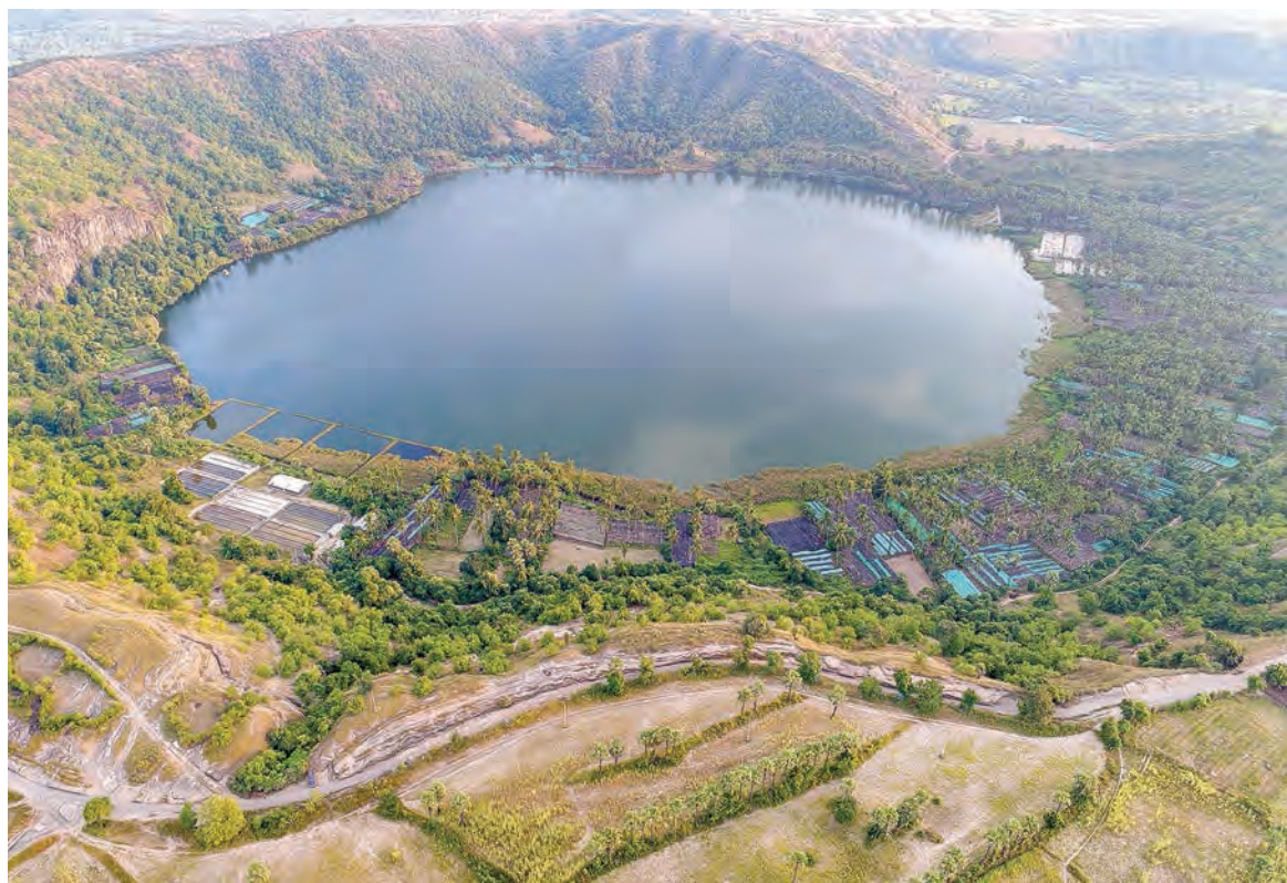
Monywa Twintaung Geopark.

In using brain and intelligence, there appear social and