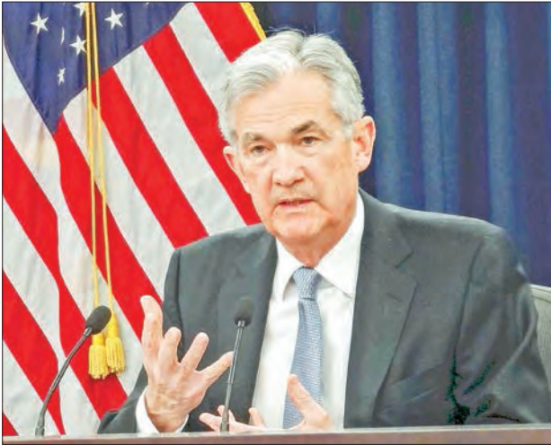
Former US president Donald Trump used to regularly attack Fed Chair Jerome Powell (pictured) on Twitter, but those days are likely over.

political pressures, the outlook is daunting. The initial rollout of Covid-19 vaccines has raised hopes companies will be able to