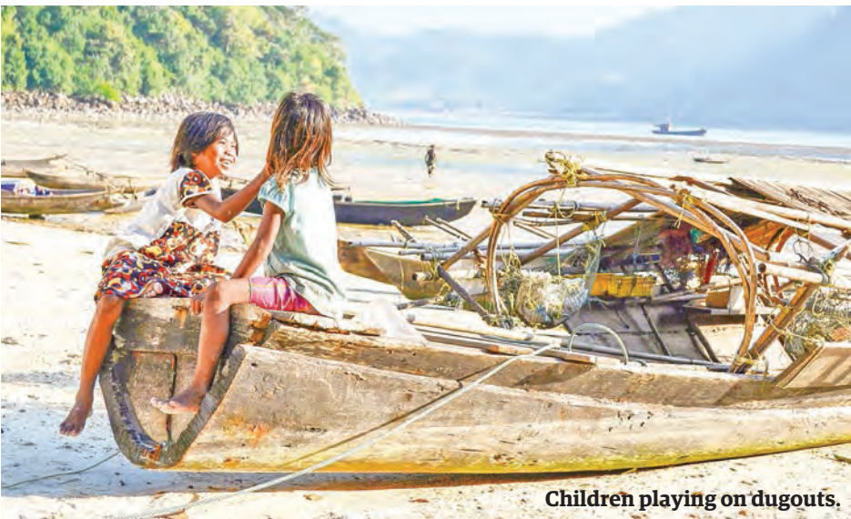
Children playing on dugouts.

weaving and amelioration in marriage. The Salon people have no specific clothes and they usually wrap longyi and htamein around their waist. In the cold season, they just put another longyi and htamein on their body. The Salon women used to leave their upper bodies bare in the past and now they wear the clothes in accordance with the trend. They prop their child on the hip while they are working. They like wearing the shells of sea snails.