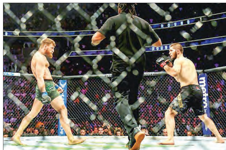
A rematch between Khabib Nurmagomedov of Russia (right) and Conor McGregor looks remote after the Irishman's shock defeat in Abu Dhabi on Sunday to Dustin Poirier.

a straight right dropping McGregor to the floor moments before the fight was stopped at 2min 32sec of the second round.—AFP ■