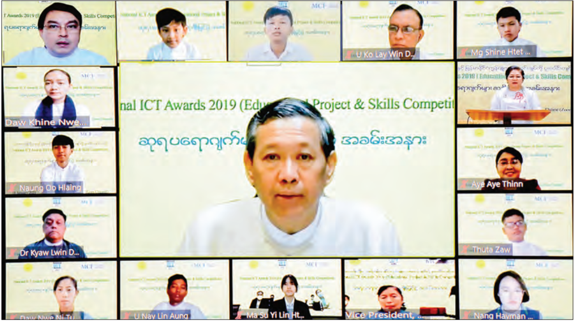
Union Minister Dr Myo Thein Gyi participates in the National ICT Awards 2019 (Educational Project & Skills Competitions) Award Ceremony on 18 January 2021.

During the ceremony, a documentary featuring the National ICT Awards 2019 (Educational Project & Skills Competition) was shown, and the winners were awarded online. During the event, the MCF's Capacity Building Committee Chairperson Daw Aye Aye Thin explained the competitions, and Director-General U Ko Lay Win from the Department of Basic Education expressed thanks to all stakeholders.—MNA (Translated by Maung Maung Swe)