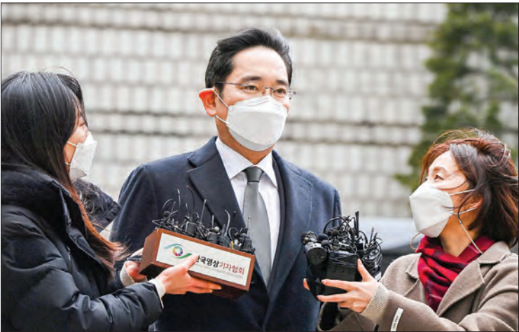
Lee Jae-yong (C), vice-chairman of Samsung Electronics, arrives at a court for a trial in his bribery scandal involving former South Korean president Park Geun-hye in Seoul on 18 January 2021.

THE de facto chief of South Korea’s Samsung business empire was convicted Monday over a huge corruption scandal and jailed for two and a half years, in a ruling that deprives the tech giant of its top decision-maker.