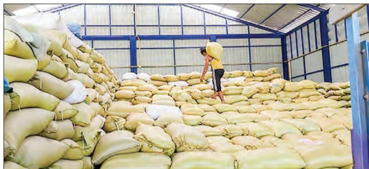
A worker piles sacks of corn at a commodities warehouse in Myawady.

“At present, Myanmar’s corns are primarily shipped to India. It is also sent to Viet Nam and Laos. The illegal outflow of corns to China via northern Shan State is also reported. As a result of this, the corn export volume of Thailand market is directly related to the market price.