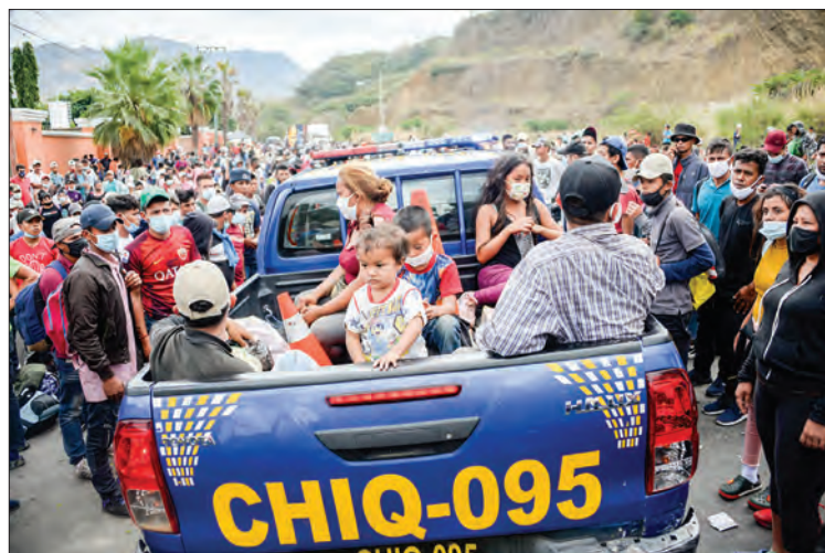
Honduran migrants travel on a police patrol to voluntarily return to Honduras, in Vado Hondo, Guatemala on January 17, 2021.