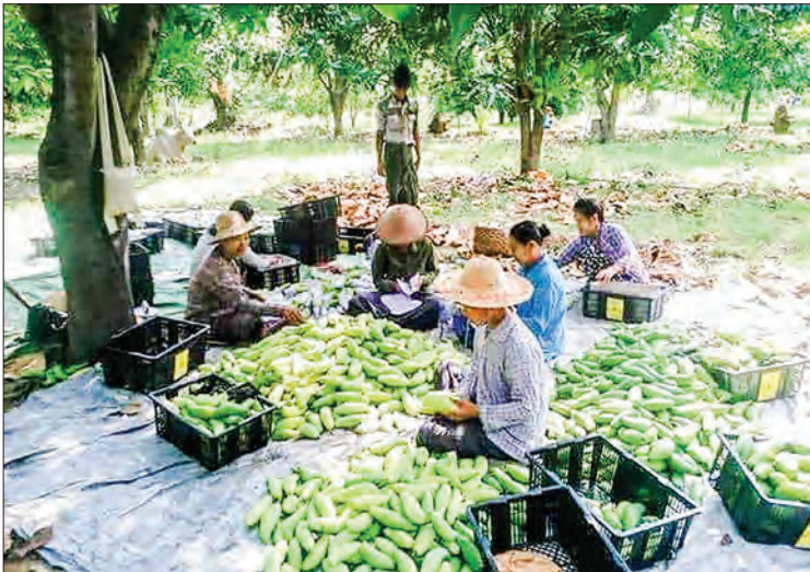
Labourers are packing mangoes in the farm.