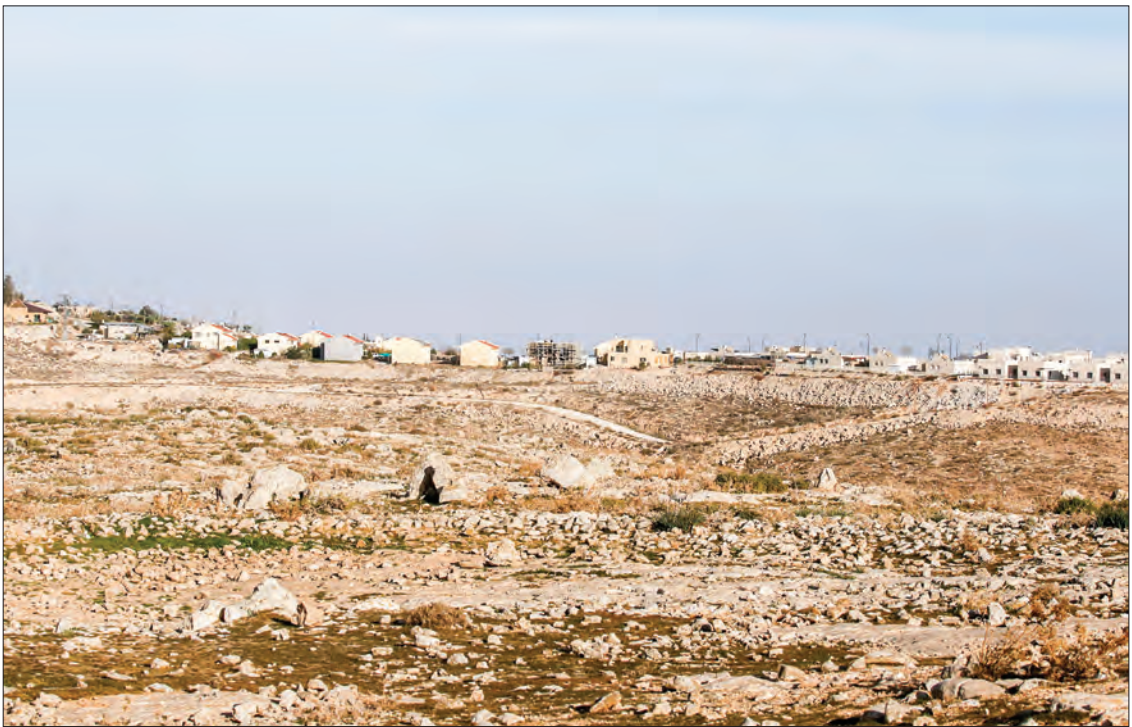
(FILES) Labourers work on the roof of a building under construction in the Israeli settlement of Karmel in the southern area of Hebron city in the occupied West Bank, on January 12, 2021. the White House. During his four years in office, the US president was viewed as a particularly close Netanyahu ally. Peace Now has said the expansion of construction puts Israel on a “collision course” with the incoming administration of Joe Biden. Biden, who will be sworn on Wednesday, has indicated that his administration will restore Washington’s pre-Trump policy of opposing settlement expansion.

the two state solution. “We call for the construction of these in East Jerusalem and elsewhere in the West Bank to cease immediately.” The UK and much of the international community have decried ongoing construction of settlement homes in areas claimed by Palestinians for a potential future state. However, in 2019 the administration of outgoing President Donald Trump broke with decades of US foreign policy declaring that Washington no longer considered settlements construction broke international law. Britain’s position closely follows that of the European Union, which said Israel’s actions “further undermines the prospects of a viable two-state solution”. In 2018, the Trump administration also broke with allies like Britain and the EU when it decided to move the US embassy to Jerusalem. The approval of new settlement units comes days before Trump’s departure from