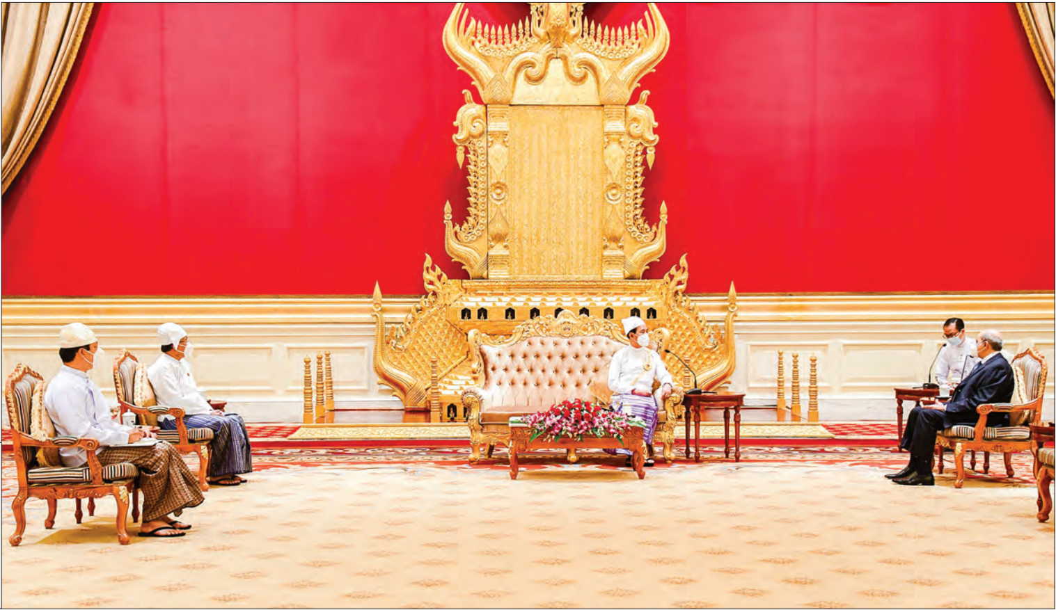
President U Win Myint receives Ambassador of the Arab Republic of Egypt Mr Sherif Salah Eldin Elleithy on 18 January.

Those present on the occasion were Union Minister for International Cooperation U Kyaw Tin and Director-General of the Protocol Department of the Ministry of Foreign Affairs U Wunna Han.—MNA