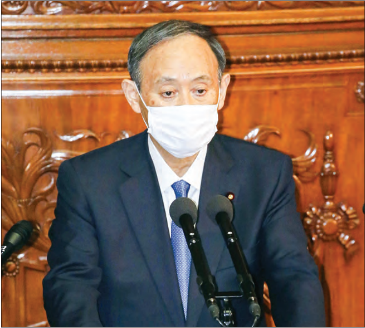
Prime Minister Yoshihide Suga delivers a policy speech at a House of Representatives plenary session on 18 January 2021.

His Cabinet’s approval ratings have plummeted amid widespread dissatisfaction with his pandemic response, narrowing his options for when to dissolve the House of Representatives for a general election.