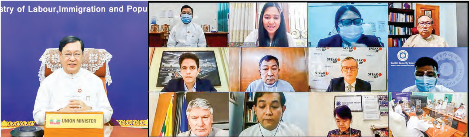
Union Minister U Thein Swe chairs the online meeting on the EU Myan Ku Fund for garment sector and its future plans on 18 January.

UNION Minister for Labour, Immigration and Population U Thein Swe presided over the meeting via videoconferencing to conduct the year-end review on the EU Myan Ku Fund for garment sector in relation to COVID-19 and the future plans yesterday. The meeting was also taken part by Deputy Minister U My-