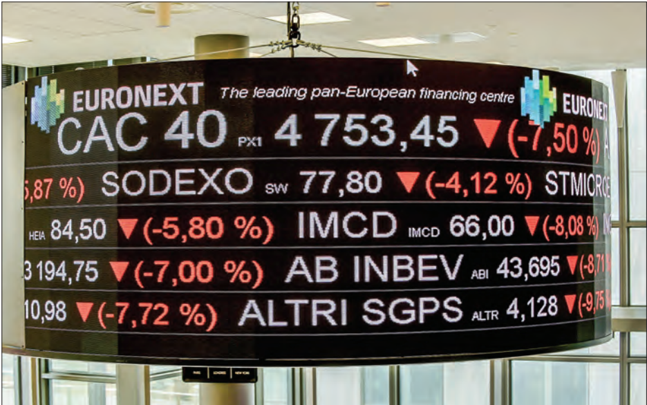
(FILES) A screen displays the CAC 40 amongst stock tickers displayed at the headquarters of the Pan-European stock exchange Euronext, in La Defense district, near Paris, on 9 March 2020.

The dollar traded mixed, Bitcoin held steady