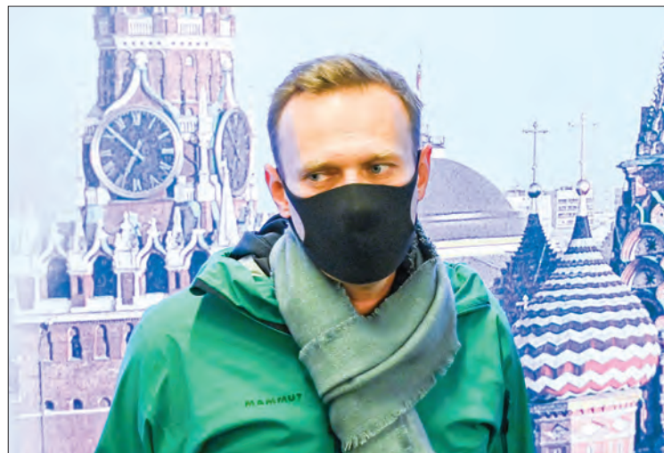
Russian opposition leader Alexei Navalny is seen at Moscow’s Sheremetyevo airport upon the arrival from Berlin on 17 January 2021.

He has repeatedly led large-scale street protests against Putin, most recently in the summer of 2019, and was gearing up for another challenge to authorities