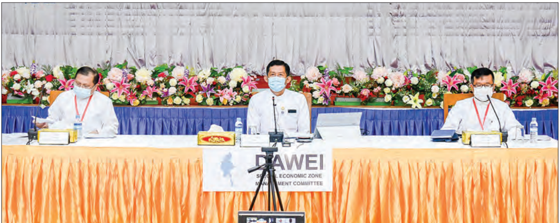
Dawei SEZ Management Committee holds the press conference on the contract termination with the Italian-Thai Company on 18 January.