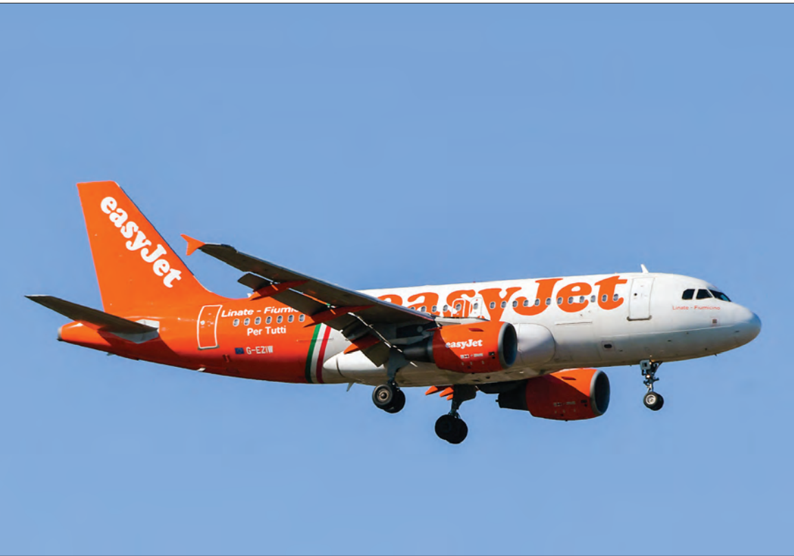
(FILES) This photo taken on August 27, 2018 shows an Airbus A319 of EasyJet as it flies above Toulouse, southern France.

With the wide-scale lockdown measures, border closures, and travel restrictions being set out around the world, by April the overall number of passengers had fallen 92 per cent from 2019 levels, an average of the 98 per cent drop-off