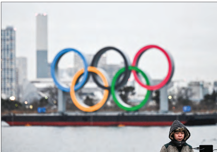
A person stands in front of the Olympic rings on display at the Odaiba waterfront in Tokyo on 15 January 2021.

World number one Novak Djokovic — who arrived on a virus-free flight and is being allowed to train in a bio-secure bubble — reportedly sent a list of demands to tournament organizers that included allowing players to move to private homes with tennis courts.—AFP ■