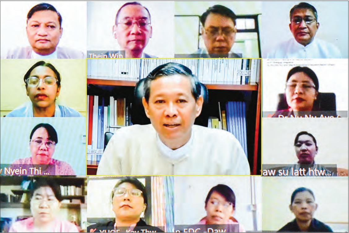
Union Minister Dr Myo Thein Gyi delivers an opening remark at the opening ceremony of batch 2 of Certificate in Educational Management online course via videoconferencing on 18 January.

UNION Minister for Education Dr Myo Thein Gyi joined the opening ceremony of batch 2 of Certificate in Educational Management online course via videoconferencing yesterday afternoon. The batch 1 of CEM online course was conducted for 8 weeks. In his opening remark, the Union Minister said that the second course would include basic educational concepts, human resource management, research and planning, reform management and communication skill. He continued to say that the course will be helpful for the trainee officers in practical management. The Union Minister also explained the importance of responsibility and accountability with collective strength to ensure quality education that meets with 21 st -Century situations, and that supports the establishment of a Democratic Federal Union for all-inclusive education in ethnic areas, while the government is working for the appointment of more teachers in line with the guidelines