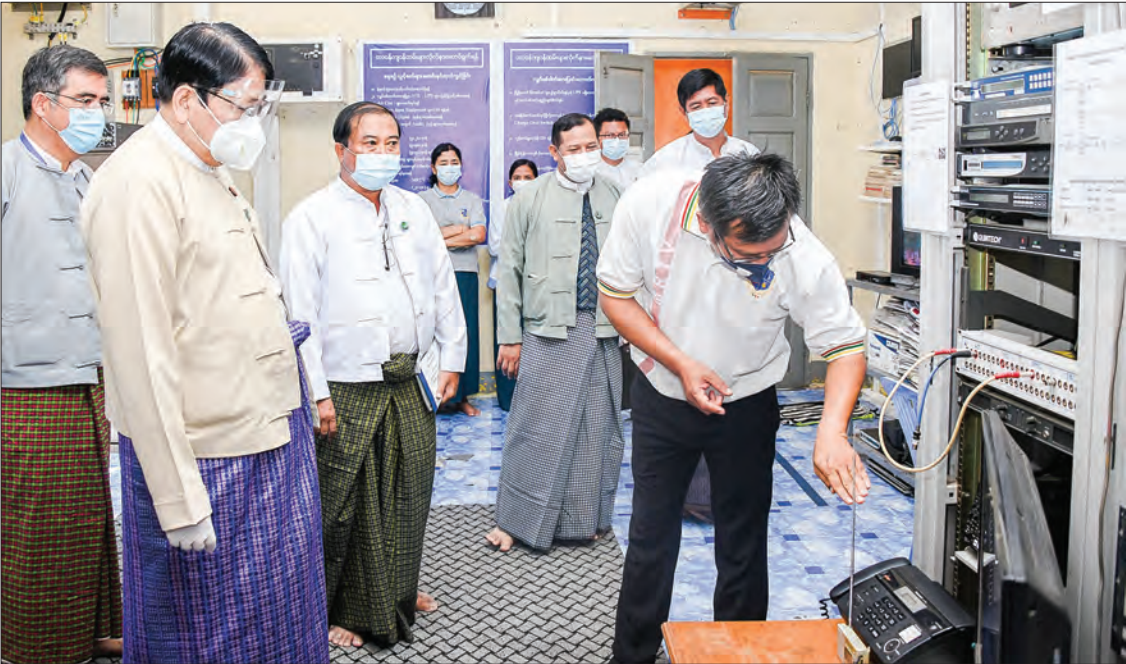
Union Minister Dr Pe Myint inspects MRTV Retransmission Station (Thabyaytaung) in Pyinmana on 18 January 2021.

UNION Minister for Information Dr Pe Myint inspected the broadcasting process of the MRTV Retransmission Station (Thabyaytaung), installation of equipment and duty assignments of the staff members in Pyinmana Township. During the Union Minister's visit, at the Transmission Room