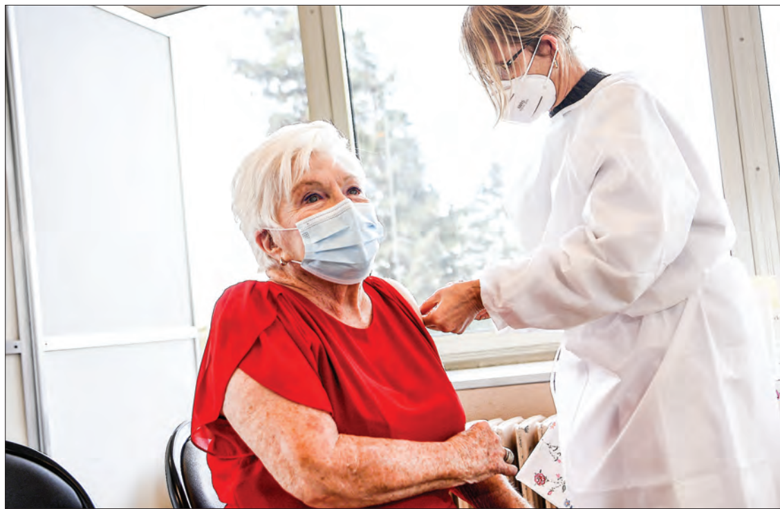
French singer and actress Line Renaud (L) receives an injection of a vaccine against the Covid-19 coronavirus at a vaccination centre in Rueil-Malmaison west of Paris on January 18, 2021

HERE are the latest developments in the coronavirus crisis: