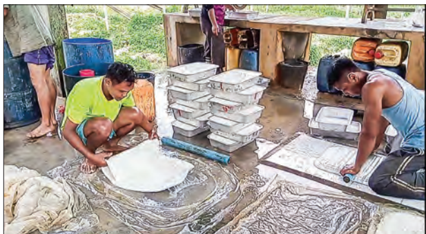
Rubber is primarily produced in Mon and Kayin states and Taninthayi, Bago, and Yangon regions in Myanmar.

Rubber is primarily produced in Mon and Kayin states and Taninthayi, Bago, and Yangon regions in Myanmar. As per 2018-2019 rubber season’s data, there are over 1.628 million acres of rubber plantations in Myanmar, with Mon State accounting for 497,153 acres, followed by Taninthayi Region 348,344 acres and Kayin State with 270,760 acres. About 300,000 tonnes of rubber is produced annually across the country. Seventy per cent of rubber made in Myanmar goes to China. It is also shipped to Singapore, Indonesia, Malaysia, Viet Nam, the Republic of Korea, India, Japan, and other countries, according to the MRPPA. Myanmar has exported about 200,000 tonnes of rubber worth around US$240 million in the last FY2019-2020. The export volume is possible to reach below 200,000 tonnes amid the COVID-19 impacts, MRPPA guessed. —Nant Lay Lay (Khamaukgyi IPRD)/ Ko Khant (Translated by Ei Myat Mon)