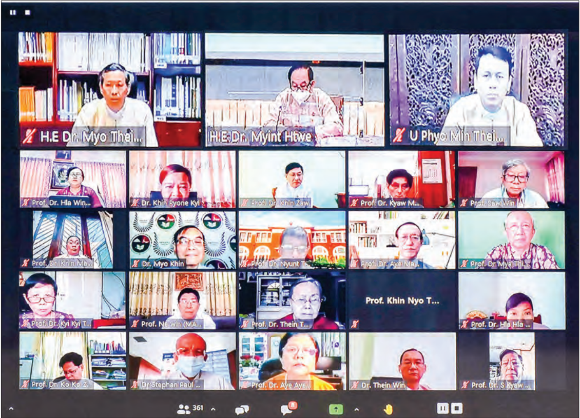
Union Ministers Dr Myo Thein Gyi and Dr Myint Htwe, Yangon Region Chief Minister U Phyo Min Thein join the 49 th Myanmar Health Research Congress on 18 January 2021.

at the congress will be given the awards of K1 million, K800,000 and K600,000.—MNA (Translated by Aung Khin)