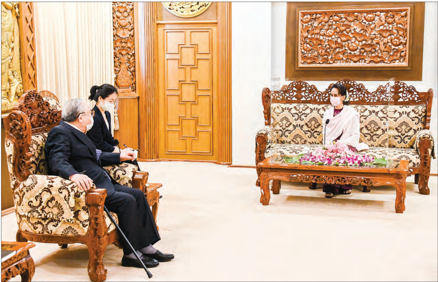
State Counsellor Daw Aung San Suu Kyi receives Mr Watanabe Hideo, Chairman of the Japan-Myanmar Association and former Member of the House of Councilors of Japan at the Ministry of Foreign Affairs in Nay Pyi Taw on 18 January.

The meeting was also attended by U Kyaw Tin, Union Minister for International Co-operation and senior officials of the Ministry of Foreign Affairs. —MNA