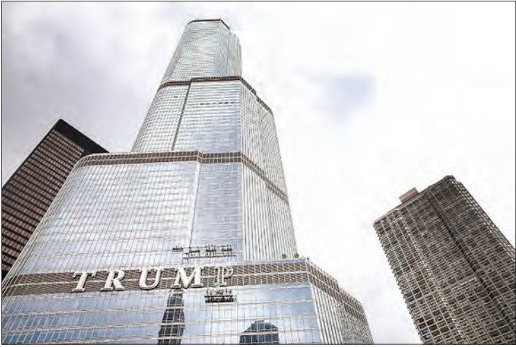
Trump Tower in Chicago is emblazoned with President Donald Trump's name, but many companies are cutting ties with the leader in an 11th-hour stampede.