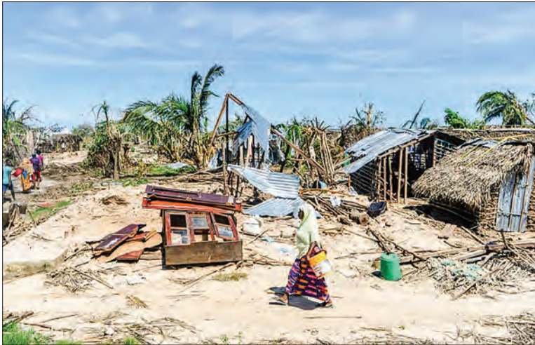
Adaptation – reducing the fall out among communities and increasing their capacity to deal with climate-related disasters such as floods and drought – is a key pillar of the landmark 2015 accord.

since the start of the industrial era, Earth is already experiencing more intense and frequent extreme weather such as droughts and flooding, as well as storms