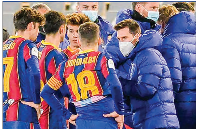
Lionel Messi (R) watched the Spanish Super Cup semi-final against Real Sociedad from the stands

Messi was pictured with strapping on his left thigh as he watched the semi-final from the stands in Cordoba. Barca won 3-2