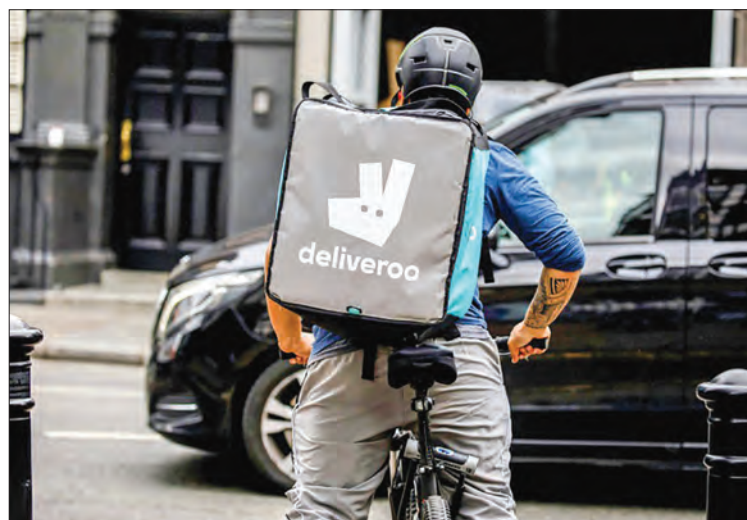
London-based Deliveroo works with 140,000 restaurants in 800 cities to deliver meals to customers' homes, and has seen demand soar in line with other home-delivery companies as much of the world has been subject to lockdowns to tackle the pandemic.

BRITISH meals delivery company Deliveroo, boosted by demand during the coronavirus pandemic, said Sunday it was targeting a stock market listing after a fund-raising round valued the company at more than $7.0 billion.