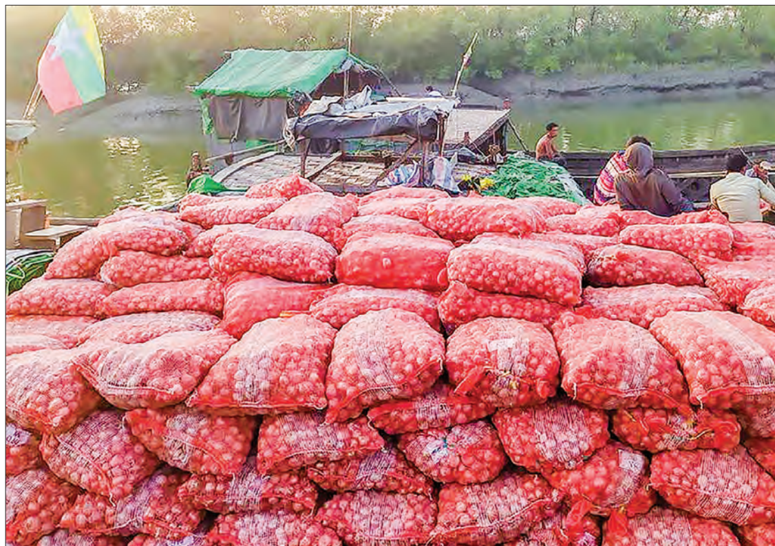
Onion price declines because of the bulk supply and the closure of the western border.

The prices of onions sharply dropped owing to the bulk supply and the closure of the western border amid the coronavirus im-