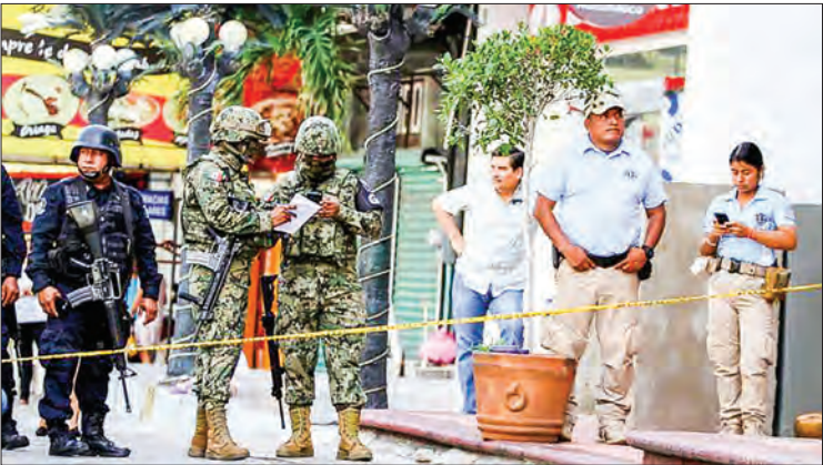
Five people were shot dead in central Mexico City, the local security secretariat said Saturday, a rare attack in the capital and likely linked to organized crime. PHOTO: AFP FIVE people were shot dead in central Mexico City, the local security secretariat said Saturday, a rare attack in the capital and likely linked to organized crime, according to local media. The attack occurred late Friday at the town hall in Miguel Hidalgo, one of the most prosperous districts of Mexico City. Police responding to an alert found "five people on the ground with gunshot wounds," according to a statement. Medical services certified three men dead at the scene while the other two were transferred to a nearby hospital where they later died due to the seriousness of their injuries, the security secretariat said. Local media reports said one of the victims was a member of the local Union Tepito cartel but city authorities have not confirmed this. Despite growing drug cartel violence in Mexico over the last decade, shootings and multiple killings are rare in the capital compared to other areas of the country. However, the city was shocked by an attack in June last year on its security chief, Omar Garcia Harfuch, by heavily armed gunmen who killed two of his bodyguards and a passerby. Garcia Harfuch, who was wounded, blamed the attack on the powerful Jalisco New Generation drug cartel.— SOURCE: AFP

ter a mob of President Donald Trump's supporters stormed the Capitol on January 6. Five people died in the assault, including a police officer. Security officials have warned that armed pro-Trump extremists, possibly carrying explosives, pose a threat to Washington as well as state capitals over the coming week. Thousands of National Guard troops have been deployed in Washington and streets have been blocked off downtown with concrete barriers. The National Mall, which is normally packed with people every four years for presidential inaugurations, has been declared off-limits at the request of the Secret Service, which ensures the security of the president. SOURCE: AFP