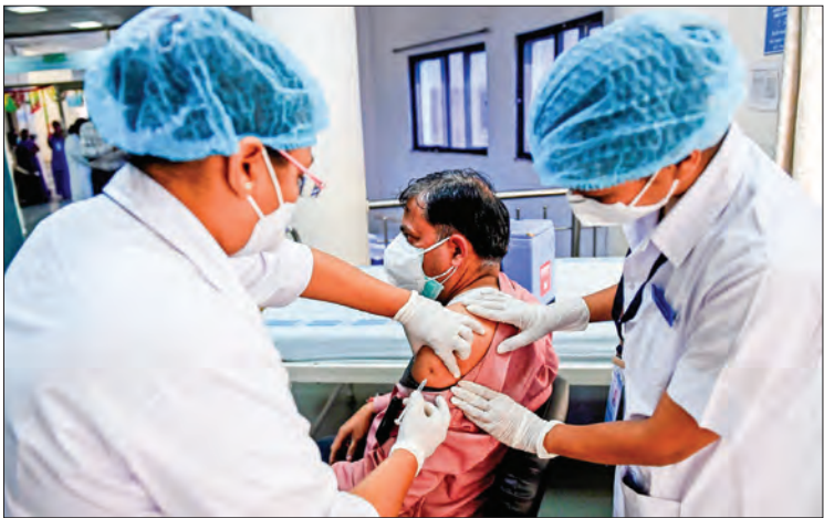
Until vaccines are fully rolled out, countries have few options but to rely on lockdown restrictions to curb the spread of the virus. PHOTO: SAM PANTHAKY AFP/FILE

distancing to control the spread of the virus. Switzerland and Italy are tightening their restrictions from Monday and Britain will require all arrivals to quarantine and show negative tests. Newspaper reports suggested the UK could try to emulate countries such as Australia and New Zealand in requiring travellers to self-isolate in hotels at their own expense. Foreign minister Dominic Raab said such a system could be difficult to manage but “we need to look at that very carefully based on the experience of other countries”. SOURCE: AFP