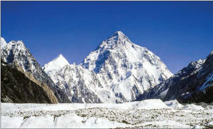
K2, the world's second-highest mountain, is pictured in 2003 in Pakistan.

A team of Nepalese mountaineers on Saturday became the world's first to scale K2, the world's second-highest mountain, in winter, a Pakistani alpine group said.