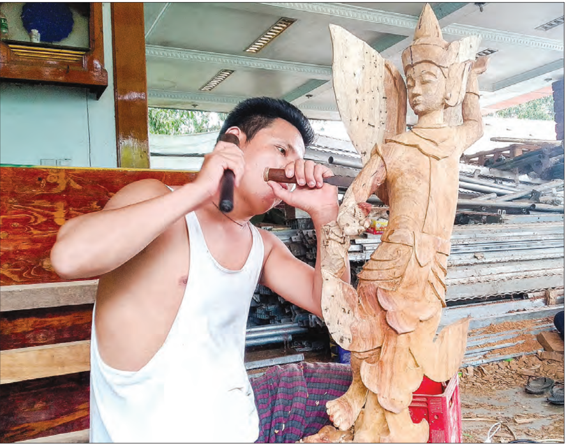
An artist puts finishing touches an a sculpture.

We appreciate your feedback and contributions. If you have any comments or would like to submit editorials, analyses or reports please email aungthuya@gnlm.com.mm with your name and title. Due to limitation of space we are only able to publish “ Letter to the Editor ” that do not exceed 500 words. Should you submit a text longer than 500 words please be aware that your letter will be edited.