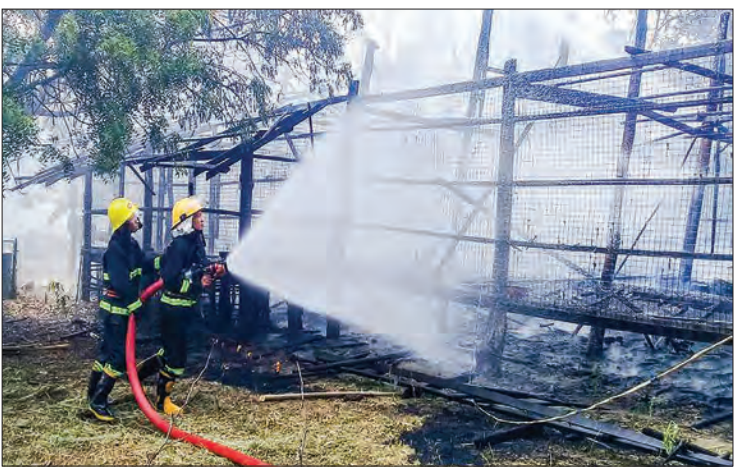
Firefighters extinguish fire.

lion) and two lightning strikes (K200,000). Sagaing District had 25 fires while Monywa District was recorded 45 cases, Yinmarpin District 29, Shwebo District 49, Kantbalu District 16, Kawlin District 10, Katha District 17, Kalay District eight, Tamu District 10, Mawlaik District one, and Khamti 16, the department stated.—Win Oo (Zeyartine) (Translated by Ei Myat Mon)