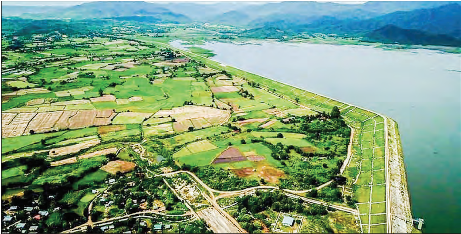
A total of 865 acres of summer crops are to get irrigation water from the Marle Nattaung Dam this financial year.