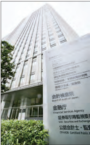
File photo shows the building that houses the Financial Services Agency in Tokyo.

THE Financial Services Agency has launched an office to help foreign financial firms with all the regulatory processes needed to enter Japan -- from pre-application consultation to supervision and inspection after registration -- with all communication available in English. The launch of the Financial Market Entry Office is intended to expand Japan's role as an