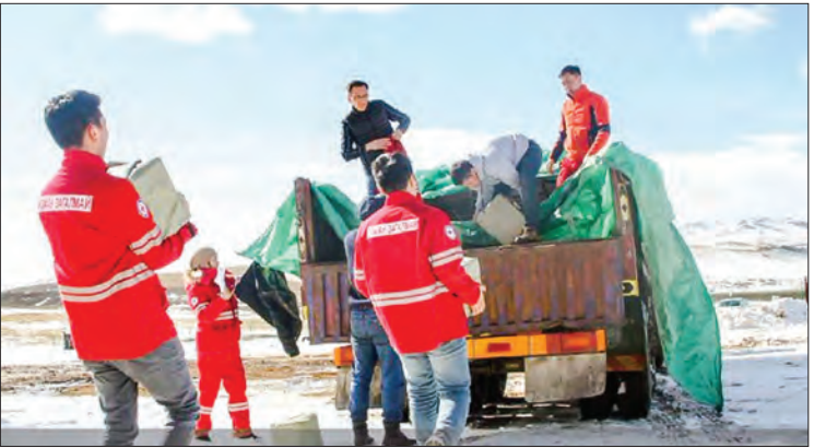
Red Cross respond as Mongolian herders struggle to survive winter Dzud amidst rising livestock deaths. PHOTO: XINHUA

better grasslands elsewhere. At least six of all 21 Mongolian provinces are likely to experience a dzud or near-dzud this winter, according to the country's Food and Agriculture Ministry. SOURCE: Xinhua