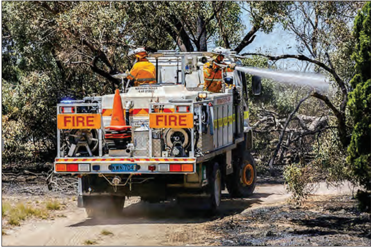
Australian firefighters said they expect to battle an out-of-control bushfire well into the night on Saturday, as the blaze threatens lives and homes in the west coast city of Perth.

The death toll from Friday's 6.2 magnitude earthquake on Indonesia's Sulawesi Island has risen to 73 with over 700 others injured, authorities said Sunday as search and rescue efforts continued.