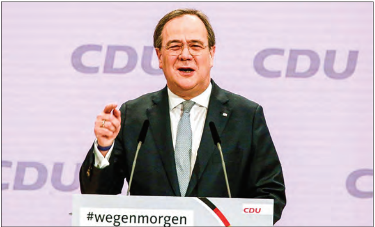
Armin Laschet speaks during a CDU party virtual party congress in Berlin.

But Laschet’s poor standing in national polls has prompted speculation that someone other