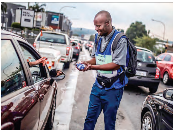
A young man walks among cars selling hand sanitizers amid the outbreak of COVID-19, in Johannesburg, South Africa, 11 March 2020.

est-affected African country in terms of COVID-19-inflicted deaths, with 36,851 deaths.