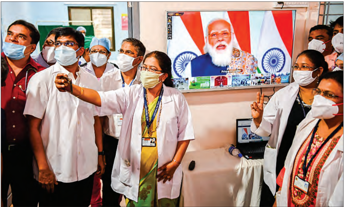
Doctors from the Rajawadi Hospital pose for a selfie as a television broadcasts a live address by Prime Minister Modi before the start of the Covid-19 vaccination drive in Mumbai on Saturday.

Cases of adverse effects are reported in Indian media. According to a report by the India Today, one health worker was admitted in the Intensive Care