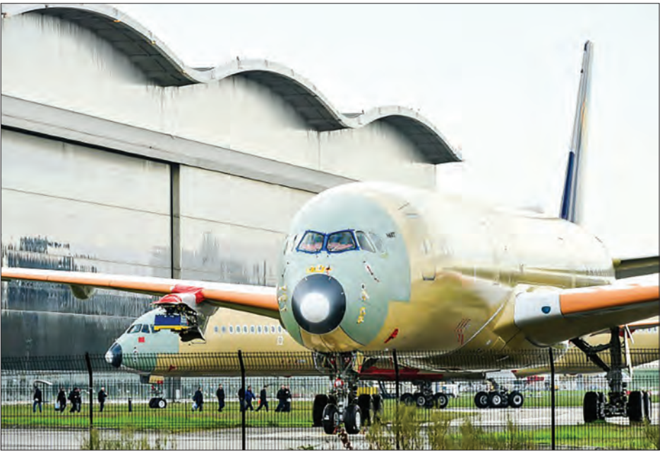
A long-running US-EU spat over aircraft subsidies turned increasingly sour under the Trump administration.

THE European Union and the US should "pause" a long-running tariff disagreement to allow the issue to be resolved, France's foreign minister suggested Sunday. A 16-year spat over aircraft subsidies has turned increasingly sour under the Donald Trump administration, expanding to other products and sectors, and France's suggestion comes ahead of President-elect Joe Biden's inauguration in the coming week. "The issue that poisons everyone is that of the price increases and taxes on steel, digital technology, Airbus and particularly our wine sector," said foreign minister Jean-Yves Le Drian in an interview with the Journal du Dimanche. "If we could quickly find a method to settle this dispute with Europe and