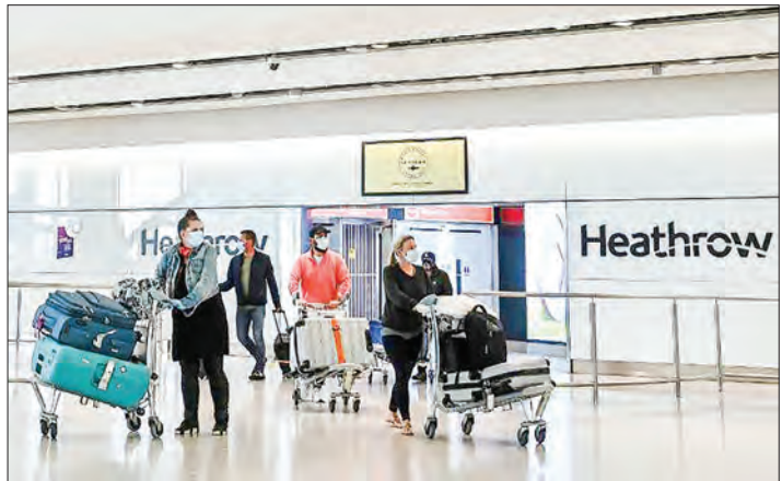
Britain's government said on Sunday it is looking at requiring all incoming travellers to isolate in hotels, expanding on new coronavirus restrictions entering into force in the coming hours.

BRITAIN'S government said on Sunday it is looking at requiring all incoming travellers to isolate in hotels, expanding on new coronavirus restrictions entering into force in the coming hours. All arrivals to the UK will have to quarantine and show negative tests for COVID-19 from Monday at 0400 GMT, after the government scrapped “travel corridors” from countries with lower caseloads following the emergence of new strains. The Sunday Times said the government planned to go further, emulating countries such as Australia and New Zealand in requiring travellers