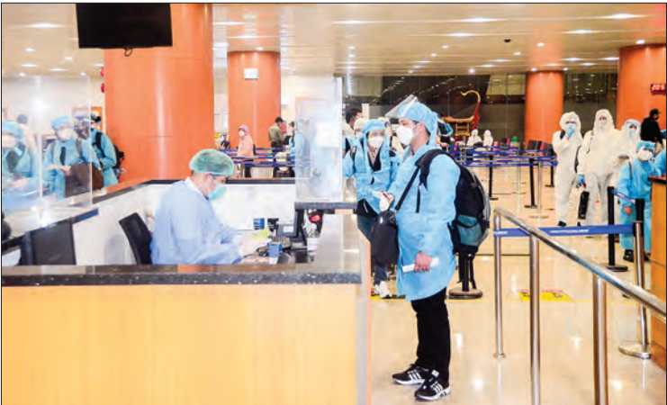
Myanmar returnees are seen at the Yangon International Airport on 17 January 2021.

concerned to bring back citizens and seamen stranded abroad due to the suspension of international commercial flights, in accordance with the guidance of the National-Level Central Committee on Prevention, Control and Treatment of COVID-19. Until now a total of 11 relief flights were organized from the Incheon International Airport to repatriate the Myanmar citizens stranded in the United States. — MNA (Translated by Kyaw Zin Tun)