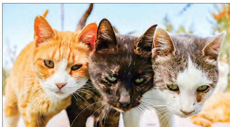
Here's looking at you: three cats who fell on hard times but were lucky enough to find sanctuary at the Tala Cats rescue centre near Paphos in Cyprus.