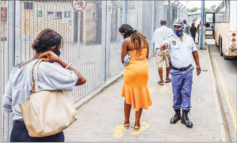
A South African Police Service (SAPS) officer asks travellers to respect social distance at the South African side of the Beitbridge border between South Africa and Zimbabwe near Musina.