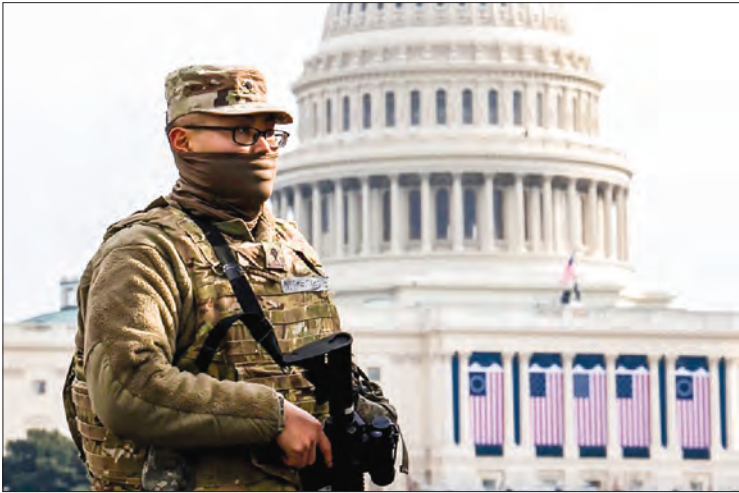
A National Guard stands at the US Capitol before the inauguration in Washington, DC.

PRESIDENT-ELECT Joe Biden will sign executive orders on Inauguration Day to address the pandemic, the ailing US