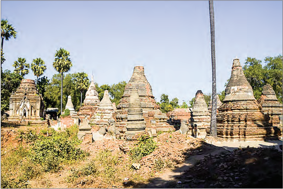
Almost 50 Inwa-era pagodas are yet to be restored in Kyaukpadaung Township.