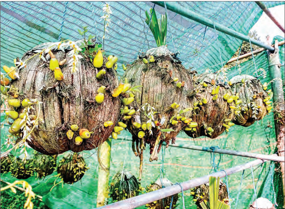
Most of Myanmar women regard Thazin as a royal flower.

for an online platform in selling the flowers. “During the huge bloom of flowers in the cold season, we could sell around 200 shoots each day and earn about K200,000,” said U Than Hlaing, a commercial producer of Thazin flower in Kyaukpyu Township in Rakhine State. The price of Thazin flower has decreased from K1,000 per shoot to K7,00 this season, and new markets are being searched for the flowers in nearby townships of Taungup and Yambye. Thazin is an orchid species, and it usually blooms in Nadaw and Pyatho months. Myanmar regards it as a royal flower. It is donated to Buddha image, and women love to put Thazin flowers on their hair.—Tin Tun OO, Phyo Wai Lin (IPRD)