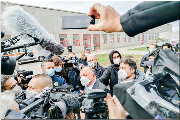
Italian anti-mafia prosecutor Nicola Gratteri arrives for the opening of the trial.

In Italy, so-called “maxi-trials,” which include scores of defendants and countless charg-