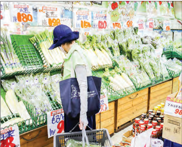
Japan's expanded state of emergency over the novel coronavirus pandemic is expected to dent consumer spending by more than 2 trillion yen ($19.3 billion) as the declaration could lift unemployment and cut sales at eateries and retailers. File photo taken Aug. 4, 2020, shows the vegetable section at a supermarket store in Tokyo. PHOTO: KYODO Toshihiro Nagahama, chief economist at the Dai-ichi Life Research Institute, said the Japanese economy will shrink by 2.5 trillion yen, or 0.4 per cent of its annual GDP, and up to 131,000 people will lose their jobs with the unemployment rate rising by 0.2 percentage point, due in part to the expanded emergency declaration. SOURCE: KYODO

the capital and the other 10 prefectures including Osaka, Aichi and Fukuoka accounting for 60.6 per cent of the country's economy, Kiuchi said. In the 11 prefectures, residents are asked to stay at home, restaurants are requested to close by 8 pm and firms are encouraged to have employees work from home or stagger their shifts until Feb. 7. Under the second state of emergency, declared nine months after the first, some service providers such as department stores and some entertainment facilities are also likely to cut their operating hours. The expanded emergency "will increase the number of unemployed people by 373,000, and raise the jobless rate by 0.55 percentage point," Kiuchi said.