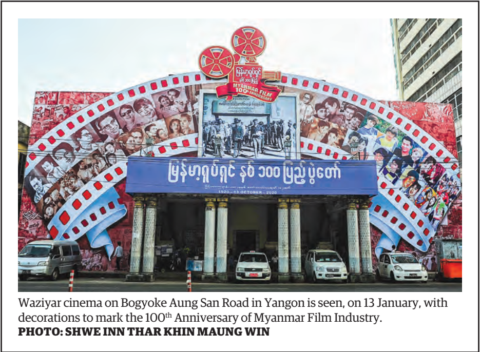
Waziyar cinema on Bogyoke Aung San Road in Yangon is seen, on 13 January, with decorations to mark the 100 th Anniversary of Myanmar Film Industry.