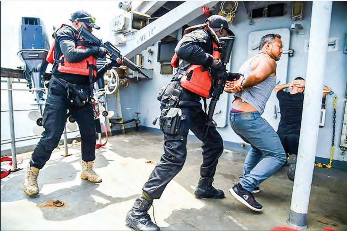
The Gulf of Guinea is considered among the world’s most dangerous waters for piracy.

PIRATE attacks on ships worldwide jumped 20 per cent last year driven by a record spate of kidnappings off West Africa, a maritime watchdog said Wednesday,