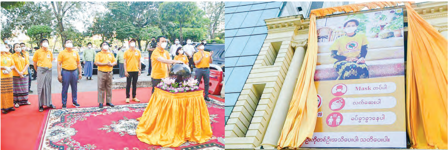
Yangon Region Chief Minister U Phyo Min Thein unveils the ‘Stop COVID-19 Yellow Campaign poster on 13 January. the Public Health and Medical Services Department of Yangon Region, Secretary of YCDC Daw Hlaing Maw Oo and Joint-Secretary U Than and committee members and YRTA officials. The campaign aims to urge the public to wear masks, social distancing and reminding each other about the risk of pandemic.—Soe Myint Aung (Translated by Aung Khin)

The Stop COVID-19 Yellow Campaign was conducted in front of Tourist Burma building on Sule Pagoda Road in Yangon, erecting a poster to raise public awareness on COVID-19 disease, yesterday. Under the theme ‘New Normal, New Living, New Yangon’, the campaign was jointly organized by the Yangon Region government, the Yangon Region Transport Authority, and the Public Health Department of Yangon Region. Those present at the event were Yangon Chief Minister U Phyo Min Thein, Minister for Social Affairs U Naing Ngan Lin and officials, officers from