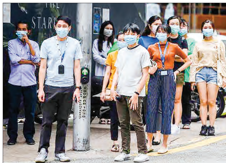
Pedestrians wait to cross a street in Malaysian capital Kuala Lumpur on Oct. 7.