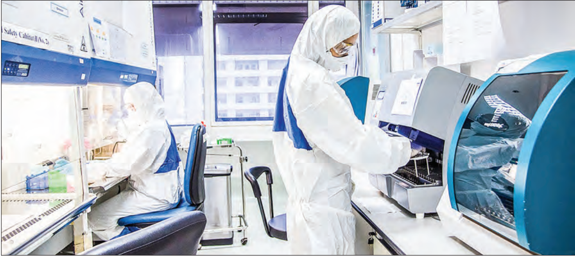
Laboratory technicians work at a viral zoonoses research centre in Bangkok, Thailand.

She was speaking at a virtual meeting of scientists from around