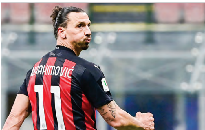
AC Milan forward Zlatan Ibrahimovic got his first start after 51 days since injury.

The 18-year-old is already capped four times by Spain and Eto'o believes he is the man who can succeed Messi.—AFP ■