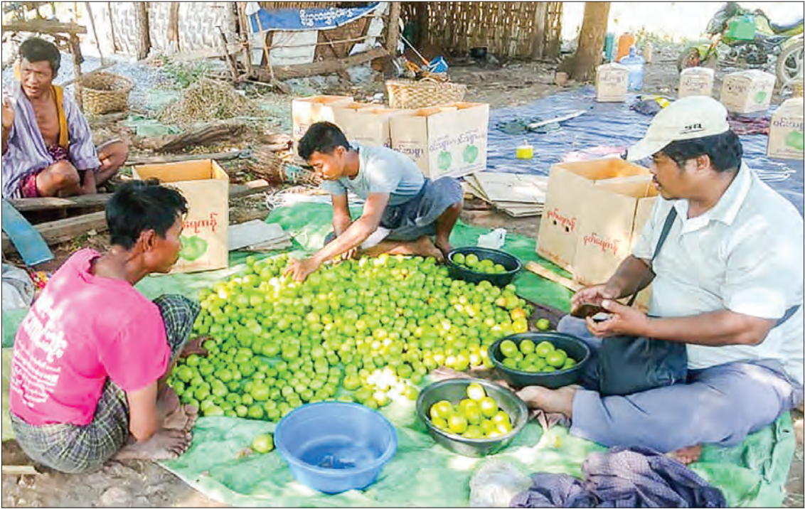
Myanmar’s local product plums are mainly exported to China. Additionally, it is sold to local retailers and jam businesses.

plums are mainly exported to China. Additionally, it is sold to local retailers and jam businesses. The growers also expect more export market potentials. The plums are mainly delivered to lower Myanmar, including Yangon. The prevailing price is K6,000-7,000 per box, Naymahtiaung plum trading business in Singaing Township stated. Earlier, plum growers heavily relied on festivals and religious events. This year, they turn to the retail market instead. The COVID-19 pandemic shut down Shwesettaw Pagoda festival and other events such as Nat Pwe (spiritual rituals), said growers from Minbu area. The retail sales of plums from Laybin village in Minbu town are pretty good due to its taste.