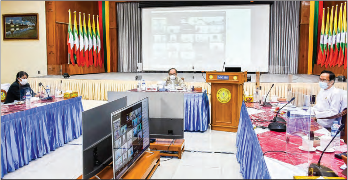
Union Minister Dr Myint Htwe coordinates the discussions to conduct pieces of training for health workers in COVID vaccination, on 13 January.

UNION Minister for Health and Sports Dr Myint Htwe led the first 'tabletop exercise' on 12 January, with the discussion about preparations for the countrywide COVID-19 vaccination programme in Myanmar. At the meeting, the Union Minister explained the reason for this exercise which is crucial for any major programme in public healthcare.