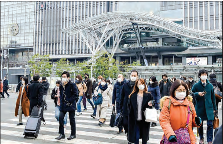
Commuters wearing masks near Hakata Station in Fukuoka City, Fukuoka Prefecture, on January 13, 2021. The government plans to add Osaka, Kyoto, Hyogo Aichi, Gifu, Fukuoka and Tochigi prefectures to the current state of emergency.

gions including the major cities of Osaka and Kyoto, as infections surge nationwide.