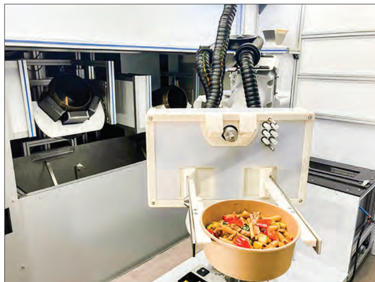
An automated kitchen developed by the startup RoboEatz and launching at the 2021 Consumer Electronics Show prepares, cooks and serves an array of hot and cold food dishes from soups to salads to meal bowls.