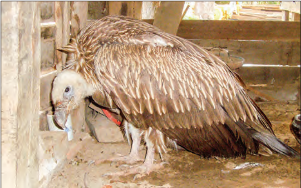
A Himalayan Griffon vulture, a winter migratory species, is being looked after.