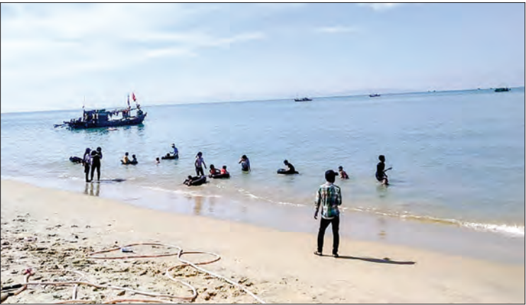
Visitors are seen enjoying at the Kimmon Chone Beach.