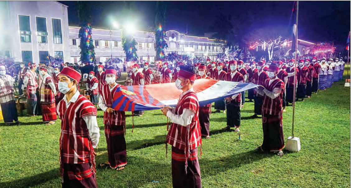
The 2760 Kayin New Year was celebrated at the Kayin State government office in Hpa-an on 13 January.

flag, and the master of the ceremony explained the history of the symbolic Kayin national flag. At the new year celebration ceremony, the attendees saluted the flag of the Republic of the Union of Myanmar, and they paid tribute to General Aung San and the fallen martyr leaders. After the reading of the messages from the State Counsellor and the Kayin State Chief Minister, the Kayin youths presented the origin of the Kayin National New Year in both Po Kayin, Sakaw Kayin and Myanmar languages and sang the song "Unity is