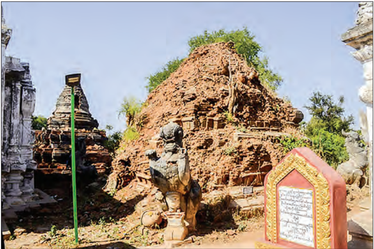
Inwa-era pagodas are under restoration.

cient pagodas. If donors want to repair the ancient pagodas, they have to seek permission from the Department of Archeology and