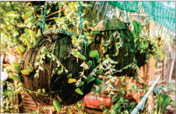
Thazin is an orchid species, and it usually blooms in Nadaw and Pyatho months.

AS the market demand of Myanmar orchids (Thazin flower) is declining due to the lack of ceremonial events amid COVID-19 pandemic, the commercial producers have opted