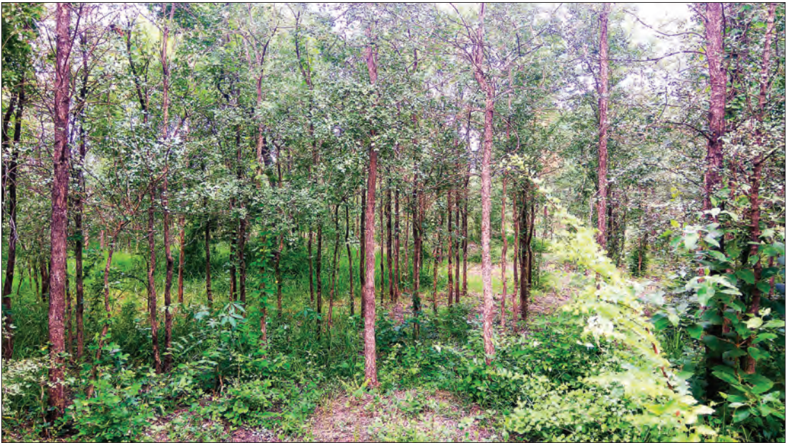
The plants are grown in Ayartaw township with more than 100,000 acres and the township boasts 75 percent of Thanaka plantation of the country.

Thanaka can protect the human body from heat-related problems. Those working under direct sunlight can use Thanaka as sun protection. The fragrance of Thanaka can also cure the headache, dull pain, neck pain and nasal congestion. If the women suffer from the menses, they can apply Thanaka with the turmeric. If they have high body temperature, they can take liquid Thanaka with the nectar of Mesua