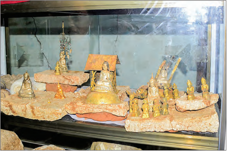
Inwa-era Buddha images are seen.