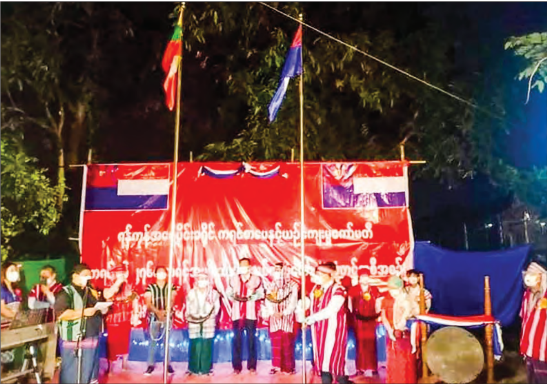
The Kayin National Flag Hoisting Ceremony was held to commemorate the Kayin New Year Day on 13 January 2021.