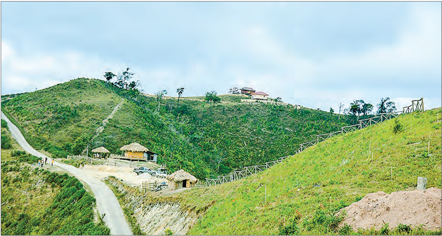
Development plan is underway to make Khuepra (local name) or Shwe Taungtan area 'tourist attraction'.

Vol. VII, No. 273, 2 nd Waxing of Pyatho 1382 ME www.gnlnm.com.mm, www.globalnewlightofmyanmar.com Thursday, 14 January 2021