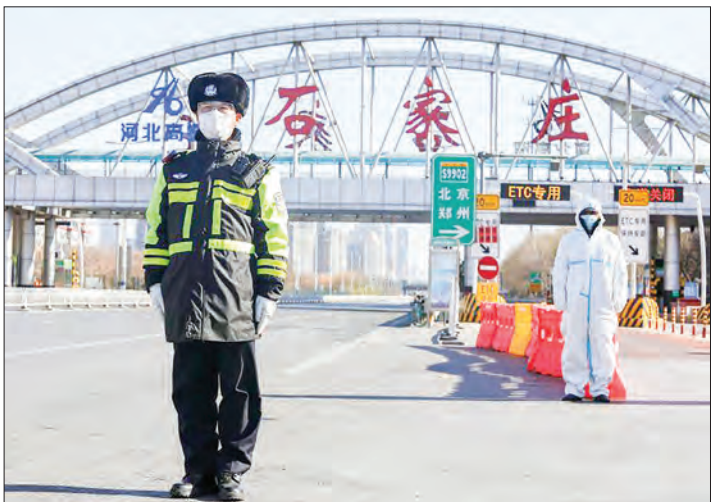
A police officer stands guard at an entrance to the expressway in Shijiazhuang, capital of north China's Hebei Province, Jan. 7, 2021. Shijiazhuang started to conduct citywide nucleic acid tests covering all residents on Wednesday. The city has set up 5,011 sites to collect swab samples for the tests.

CHINESE authorities sealed off a city of almost five million people and imposed strict travel restrictions on several others on Tuesday as they worked to quash a number of Covid-19 clusters near Beijing.