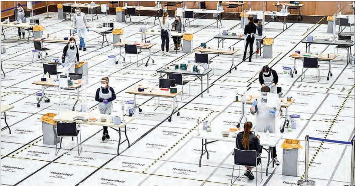
Students at Hull University take swabs for lateral flow COVID-19 tests at the campus sports facilities on 4 January, 2021, as they return to the university. The University of Hull is a public research university in Kingston upon Hull, a city in the East Riding of Yorkshire, England

Test results showed the age and sex distribution was similar to that of other circulating variants, while contact tracing data revealed “higher transmissibility (secondary attack rates) where