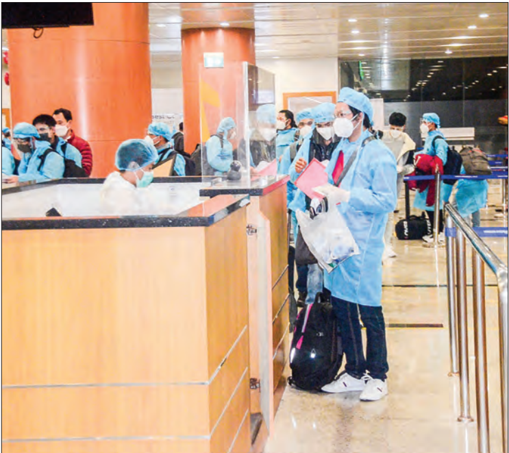
Returnees go through immigration process at the Yangon International Airport yesterday.

citizens and Myanmar seamen who are stranded in foreign countries by relief flights and chartered flights in accordance with the instructions from National-Level Central Committee on Coronavirus Disease 2019 (COVID-19), the Ministry of Foreign Affairs cooperated with the relevant ministries and Myanmar embassies from respective countries and shipping companies.—MNA (Translated by Ei Phyu Phyu Aung)