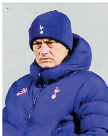
Tottenham boss Jose Mourinho.

The Fulham boss criticised the decision, with their game