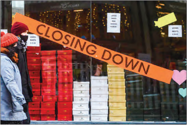
A couple wearing face masks walks past shop windows with ‘Closing Down’ stickers in Dublin, Ireland.

The FSB, meanwhile, said that Britain’s financial support measures