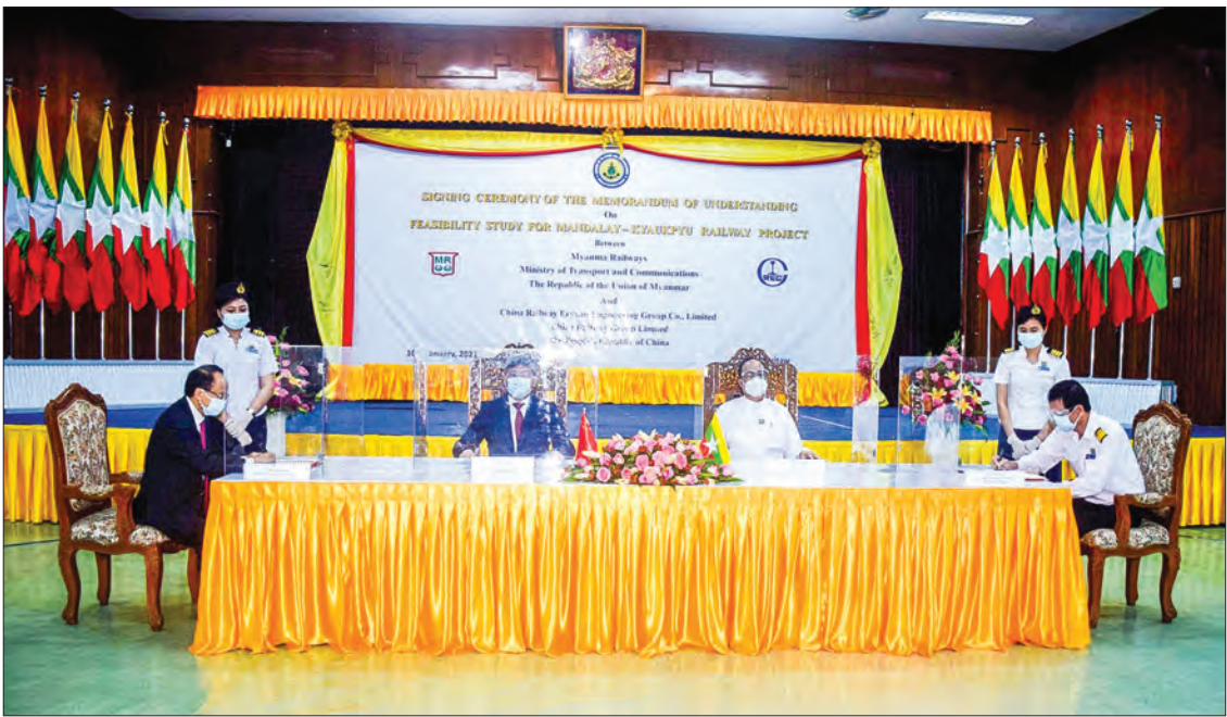
The Myanma Railways acting Managing Director and the Chief Representative of the CREEC Myanmar sign and exchange the MoU to conduct a feasibility study of Mandalay-Kyaukpyu Railway on 10 Jan 2021.