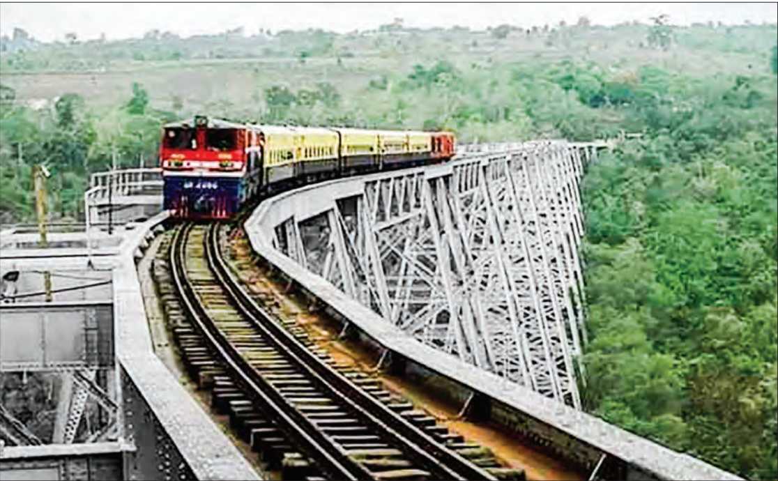
The Goteik viaduct was constructed in 1899 and opened in 1900 which is the highest bridge in Myanmar.

We appreciate your feedback and contributions. If you have any comments or would like to submit editorials, analyses or reports please email aungthuya@gnlm.com.mm with your name and title. Due to limitation of space we are only able to publish “ Letter to the Editor ” that do not exceed 500 words. Should you submit a text longer than 500 words please be aware that your letter will be edited.