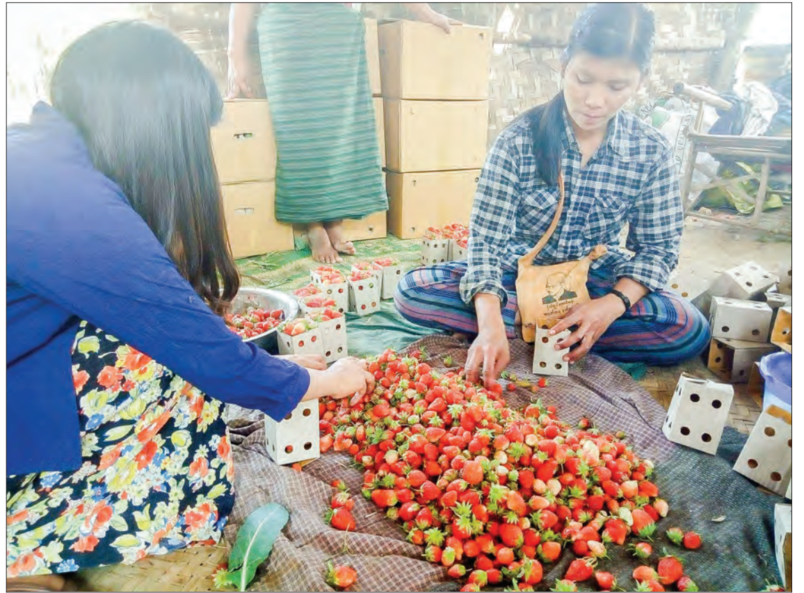
Women are seen sorting and packing strawberries.

"When we looked back the previous years, the price of strawberries plunged to K1,200 in March, and it climbed up