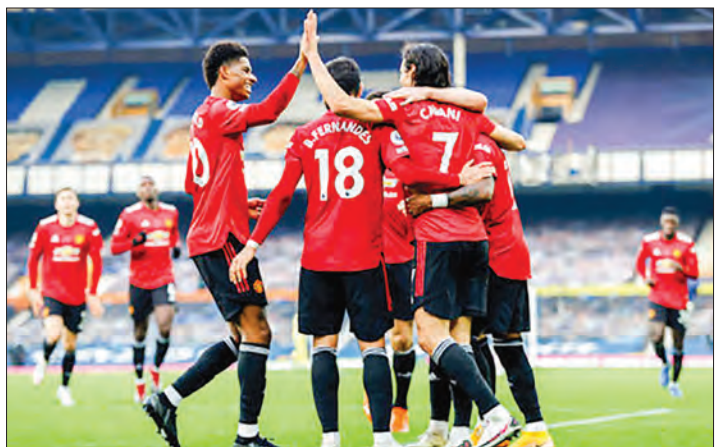
FILE: Manchester United striker Edinson Cavani celebrates scoring his team's third goal with teammates during the English Premier League football match between Everton and Manchester United at Goodison Park in Liverpool, north-west England on 7 November 2020.

The fourth round ties will be played across the weekend of 22 to 25 January with the fifth round taking place between 9 to 11 February.—AFP ■