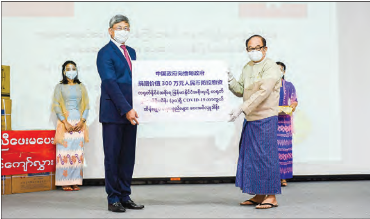
Union Minister accepts the donation of medical devices from the People's Republic of China on 12 January 2021.

THE People's Republic of China donated yuan250,000 worth of COVID-19 medical supplies to the Ministry of Health and Sports