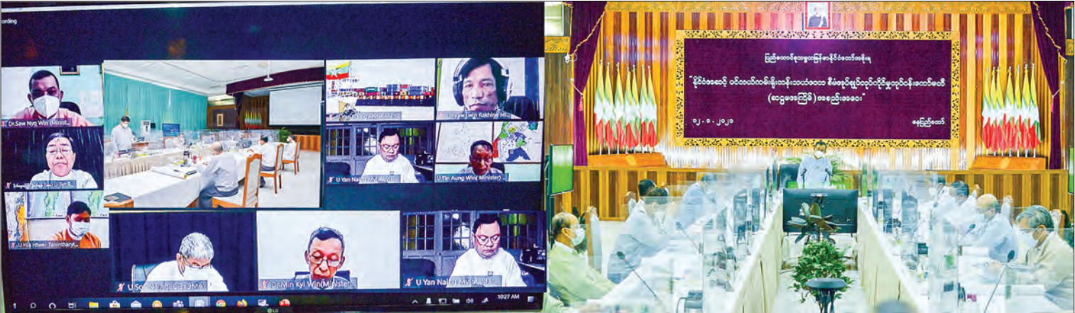
MNREC Union Minister presides over the sixth meeting of the National-level Management on Coastal Resources Work Committee on 12 January 2021.

THE National-level Management on Coastal Resources Work Committee held its 6 th meeting yesterday to discuss conservation of natural resources and ecosystem along the Myanmar coastal areas. Union Minister for Natural