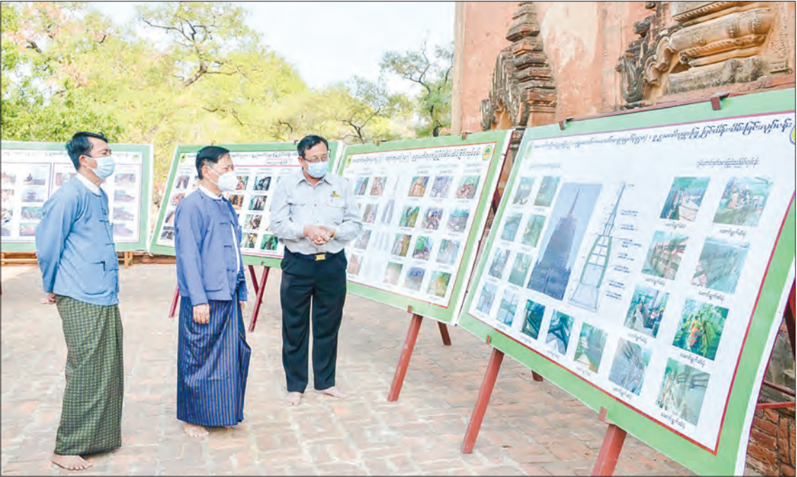
Union Minister Thura U Aung Ko inspects the maintenance and renovation works at Bagan temples on 12 January 2021. UNION Minister for Religious Affairs and Culture Thura U Aung Ko, along with Directors-General for Department of Religious Affairs and the Department of Archaeology and National Museum,

inspected the maintenance and renovation at the Bagan temples damaged by an earthquake. The earthquake destroyed 389 pagodas on 24 August 2016, and 388 pagodas have been completely renovated until now by the Department of Archaeology and National Museum and the Ministry of Construction under a four-year plan. The Thatbyinnyu Pagoda, the only one left to be finished, is under the nine-year long-term maintenance work by the Cultural Heritage Administration of the People's Republic of China. Besides, according to the field study, 110 ancient pagodas that required renovation were also renovated, bringing a total number of pagodas to 498 during the four-year project period. The earthquake measuring 6.8 on the Richter scale occurred about 10 miles west of Chauk Township, destroying more than 600 pagodas across the country - 389 ancient pagodas in Bagan-NyaungU area, 93 pagodas in Kyaukpadaung Township and 6 pagodas in MraukU, Rakhine State. For the damages of pagodas in Bagan, donations from the people, organizations and international donors amounted to K6799.11 million and US$1.1 million. In addition, 224 pagodas that were slightly damaged were donated by the original donors of the pagodas. The Ministry has fully repaired the earthquake damage during the first term of the current government, and conducting a final report on the renovation work of the earthquake-resistant pagodas by the four-year project.—MNA (Translated by Ei Phyu Phyu Aung)