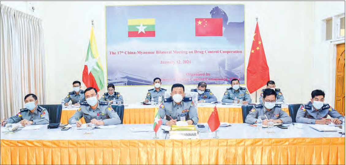
Myanmar and China hold the 17 th bilateral meeting on drug control cooperation through videoconferencing on 12 January 2021.