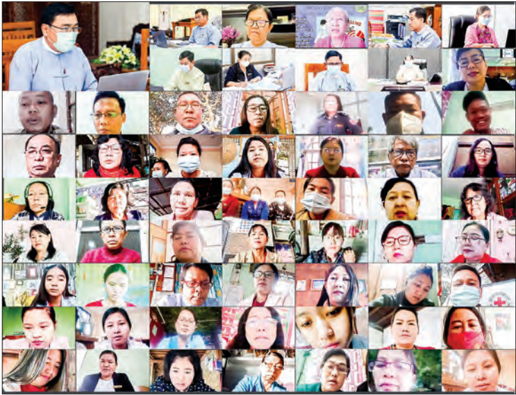
Union Minister Dr Win Myat Aye presides over online training programme for Community COVID Volunteers on 12 January. MINISTRY of Social Welfare, Relief and Resettlement held an online training programme for Community COVID Volun- teers (CCVs) to be involved in the community-based COVID-19 Prevention and Control activities in Mandalay Region yesterday

ed to 617 persons out of 705 foreign citizen applicants in accordance with the laws and rules. The applicants need the approval of the central committee after passing the scrutiny of the work committee. The meeting passed the permanent residency to an expert, 3 investors, 30 former Myanmar nationals, 15 foreigners who are related to Myanmar nationals, and 21 family members of them, totally 70. Face-to-face interviews will be held depending on the situations of COVID-19 pandemic. —MNA (Translated by Maung Maung Swe)