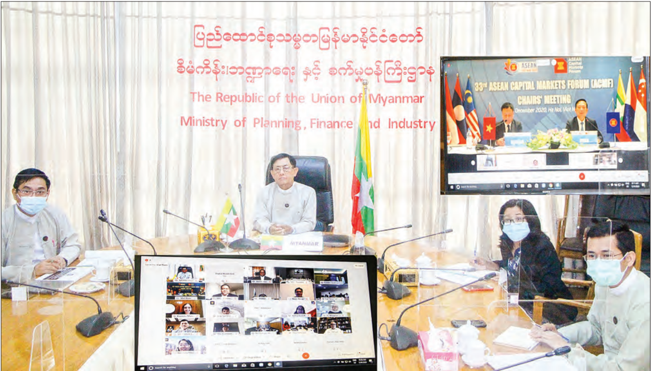
Deputy Minister U Maung Maung Win participates in the 33rd Chairs' Meeting of ACMF on 9 December via videoconference.

The Securities and Exchange Commission of Myanmar