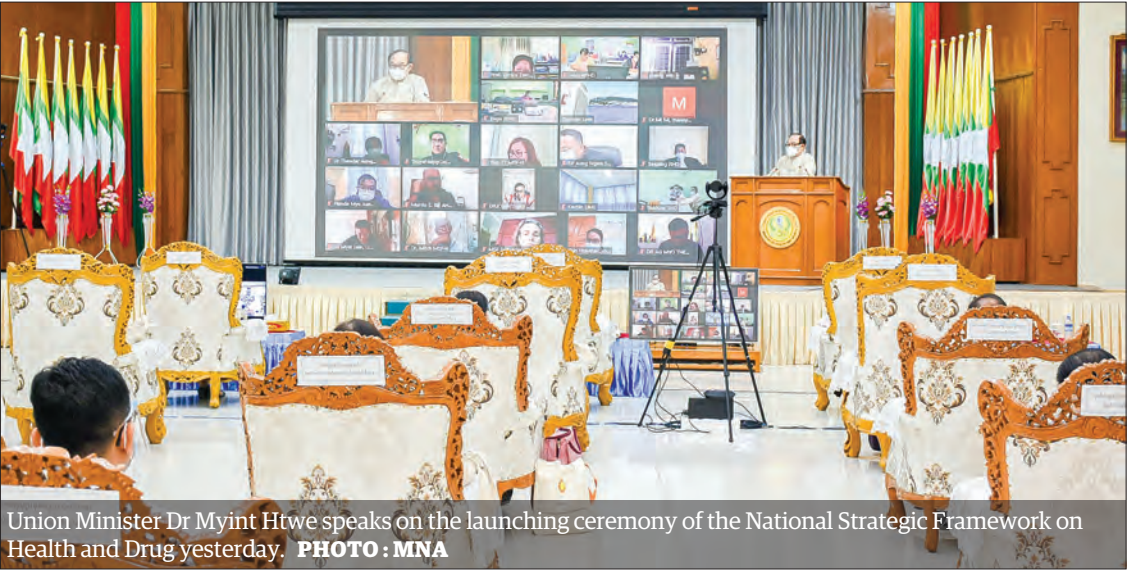
Union Minister Dr Myint Htwe speaks on the launching ceremony of the National Strategic Framework on Health and Drug yesterday.