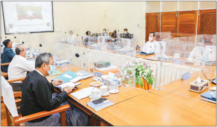
Union Minister U Thein Swe chairs meeting of Permanent Residency Implementation Central Committee on 12 January. about effective management of central committee in the process of issuing permanent residency in line with the existing laws and international standards. On 18 November, 2014, the

A coordination meeting of the Permanent Residency Implementation Central Committee was held at the Ministry of Labour, Immigration and Population in Nay Pyi Taw yesterday morning. Union Minister for Labour, Immigration and Population U Thein Swe, in his capacity as the committee chairperson, took part in the meeting, together with Deputy Minister U Myint Kyaing, permanent secretaries and directors-general who are committee members, and relevant officials. During the meeting, Union Minister U Thein Swe talked