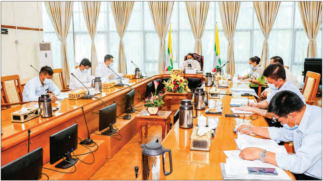
Union Minister Dr Than Myint chairs the first meeting 2021 of Motor Vehicles Importing Supervisory Committee on 12 January 2021.

private vehicles with non-commercial purpose. In the import of passengers vehicles, it should be the vehicle manufactured within 5 years and the import of fire engine and ambulance includes the vehicles manufactured within 10 years. As for the import for heavy machineries, the vehicles manufactured in the last 15 years are allowed to import. A total of 123 civil servants were allowed to import vehicles from abroad from 18 December, 2020 to 7 January, 2021 and the Union Minister said to help those people in buying automobiles