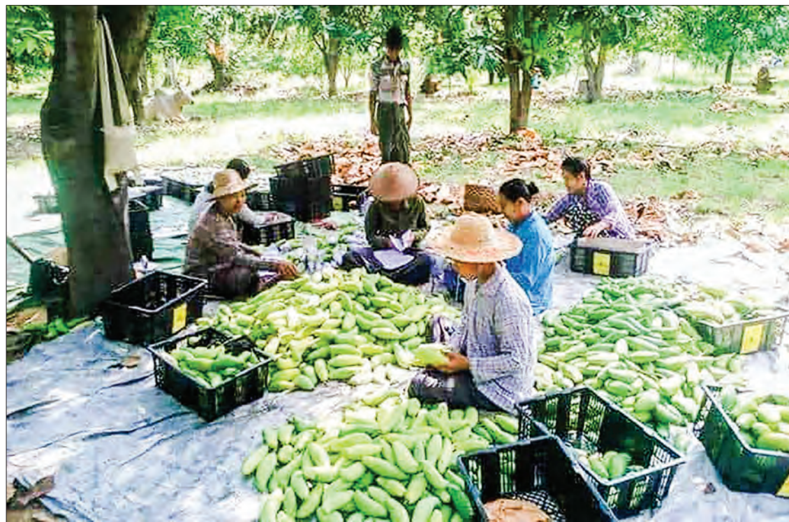
Workers are seen sorting mangoes at a mango farm.