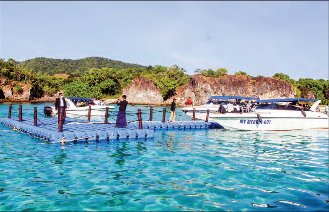
Smart Island is open for the development of community based tourism in Myeik Archipelago.

Due to limitation of space we are only able to publish "Letter to the Editor" that do not exceed 500 words. Should you submit a text longer than 500 words please be aware that your letter will be edited.