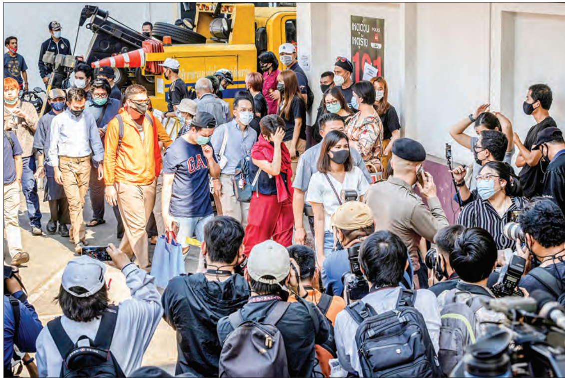
Thai activists who were demanding reforms to the monarchy, arrive at a police station in Bangkok on January 7, 2021, to face charges involving section 112, the kingdom's tough royal defamation law.

THAI authorities on Monday charged four democracy activists with royal defamation, with the protest movement rocking the kingdom put on hold because of a spike in coronavirus cases.