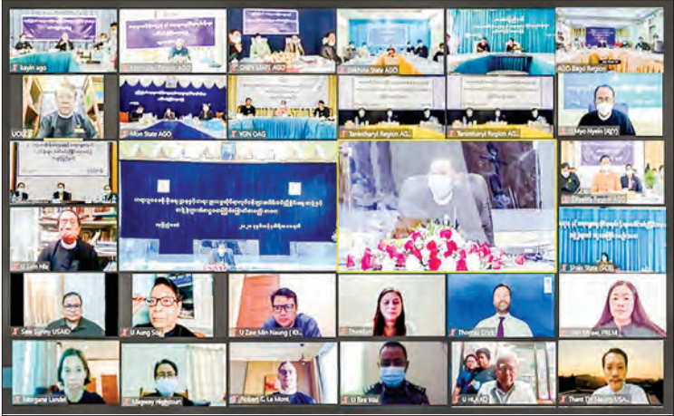
Union Attorney-General U Tun Tun Oo participates in the virtual meeting of the Rule of Law Centre and Justice Sector Coordinating Body on 11 January 2021.