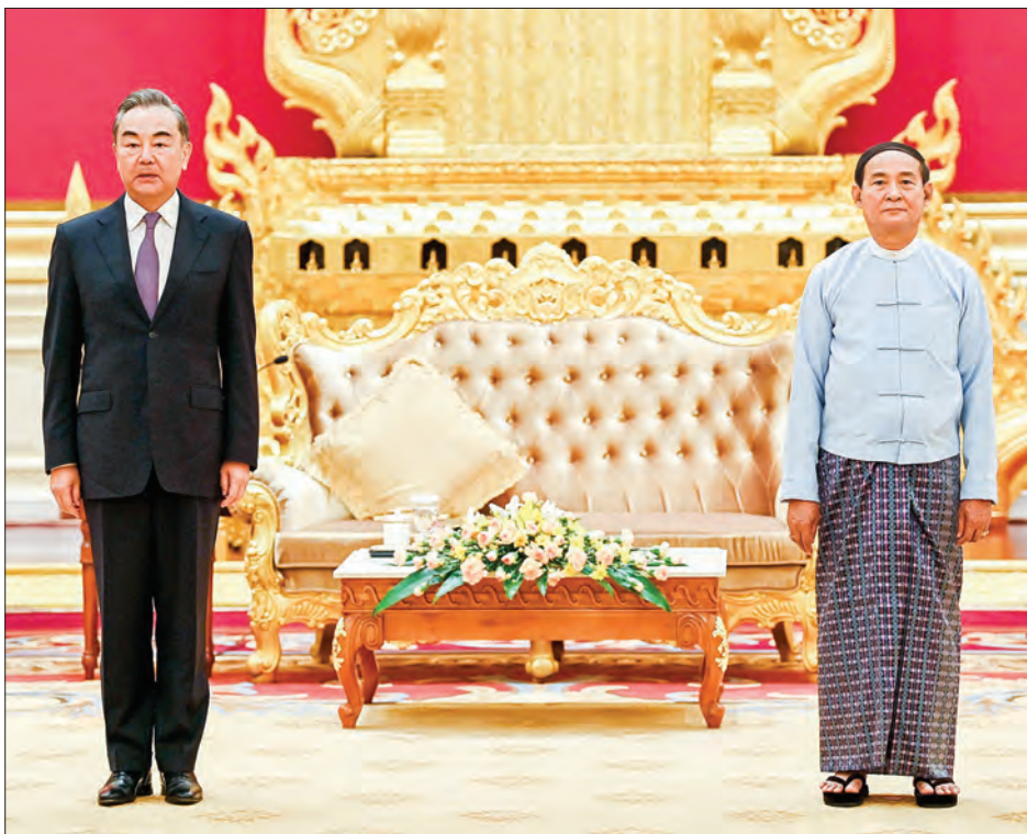
President U Win Myint receives the Chinese delegation led by State Councilor and Foreign Minister Mr Wang Yi at the Hall for Envoys of the Presidential Palace in Nay Pyi Taw.

P RESIDENT U Win Myint received the Chinese delegation led by State Councilor and Foreign Minister Mr Wang Yi at the Hall for Envoys of the Presidential Palace in Nay Pyi Taw yesterday afternoon.