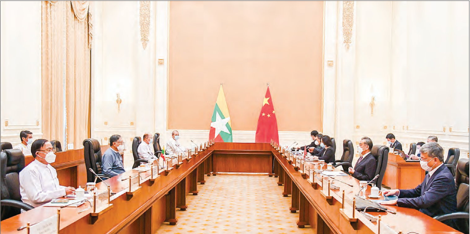
Union Minister U Kyaw Tint Swe holds talks with State Councilor and Foreign Minister Mr Wang Yi at the Hall for Envoys of the Presidential Palace in Nay Pyi Taw on 11 January 2021.

UNION Minister for the Office of State Counsellor U Kyaw Tint Swe had discussions with State Councilor and Foreign Minister Mr Wang Yi at the Hall for Envoys of the Presidential Palace in Nay Pyi Taw at 5:15 pm yesterday. At the meeting, they discussed fostering friendly and bilateral relations, works for security, peace and stability at the border areas, continuous constructive support towards Myanmar’s peace process, and matters related to IDPs in Rakhine State and development of the state. They also exchanged views on closer collaboration between the two countries in regional and multilateral fora, including the United Nations. The meeting was also par-