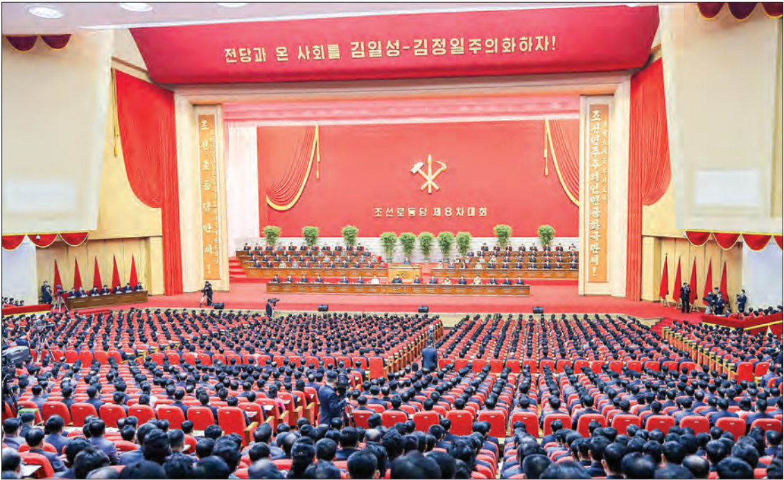
This picture taken on January 10, 2021 released from North Korea’s official Korean Central News Agency (KCNA) on January 11, 2021 shows North Korean leader Kim Jong Un (C) attending the 8th Congress of the Workers’ Party of Korea (WPK) in Pyongyang.

The last such gathering five years ago had named Kim as party chairman in what was largely seen as a formal corona-