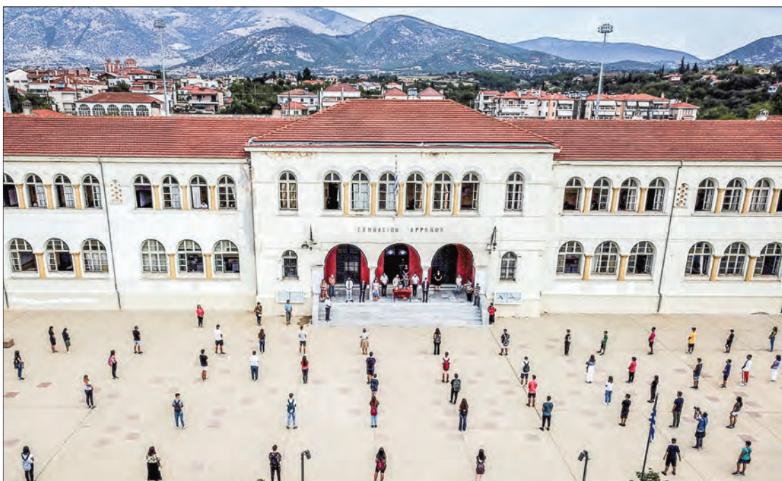
(FILES) High school students keep social distances on the first day of class of the new academic year in Drama, on 14 September 2020, amid the crisis linked with the covid-19 pandemic caused by the novel coronavirus.