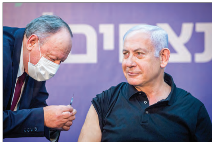
Israeli Prime Minister Minister Benjamin Netanyahu receives the second dose of the coronavirus disease (COVID-19) vaccine at Sheba Medical Centre in Ramat Gan, near the coastal city of Tel Aviv, on January 9, 2021.