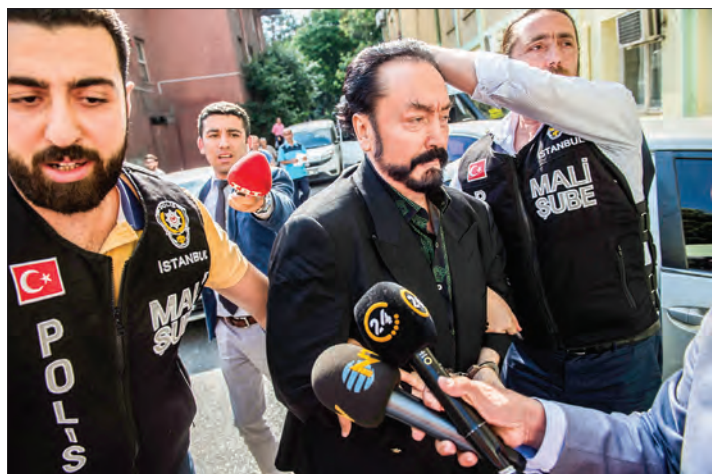
Turkish police officers escort televangelist and leader of a sect, Adnan Oktar (C) on July 11, 2018, in Istanbul, as he is arrested on fraud charges.