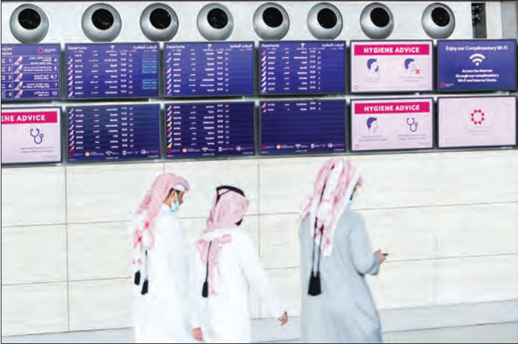
Three men walk past the announcement boards at the departure hall of Qatar’s Hamad International Airport near Doha on January 11, 2021.

A sumo wrestler in Japan said he had “no choice” but to quit the sport after his request to skip a tournament for fear of catching coronavirus was rejected.