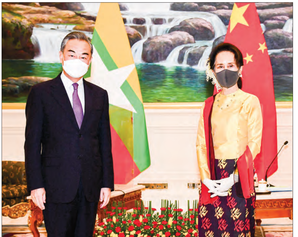
State Counsellor Daw Aung San Suu Kyi receives State Councilor and Foreign Minister Mr Wang Yi at the Hall for Envoys of the Presidential Palace in Nay Pyi Taw.

S TATE Counsellor Daw Aung San Suu Kyi received Chinese State Councilor and Foreign Minister Mr Wang Yi at the Hall for Envoys of the Presidential Palace in Nay Pyi Taw yesterday afternoon.