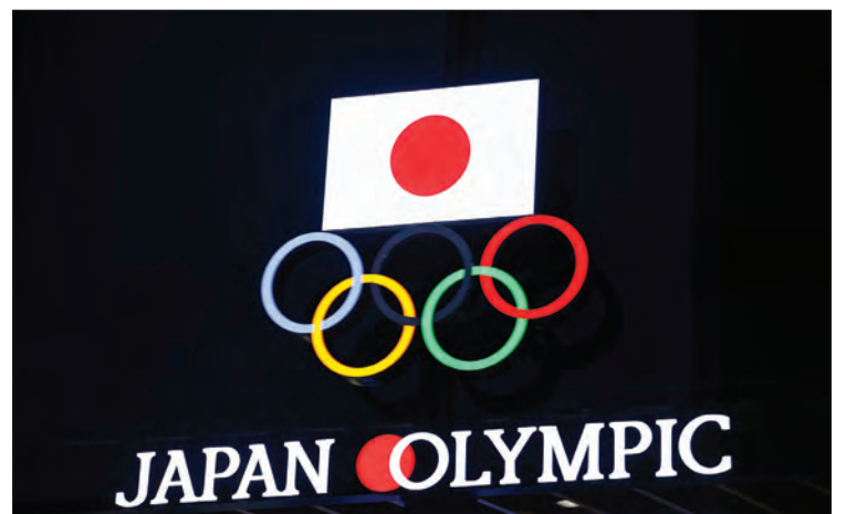
Olympic Rings and a Japan flag are seen on the Japan Olympic Museum building in Tokyo on January 8, 2021, as Tokyo Olympics organizers insisted that the coronavirus-postponed Games will still go ahead despite Japan declaring a state of emergency less than 200 days before the opening ceremony.

The government previously declared a state of emergency covering Tokyo and six other prefectures in early April last year and expanded it to the country's 47 prefectures later that month. It was lifted in steps in May as coronavirus cases subsided.—AFP ■