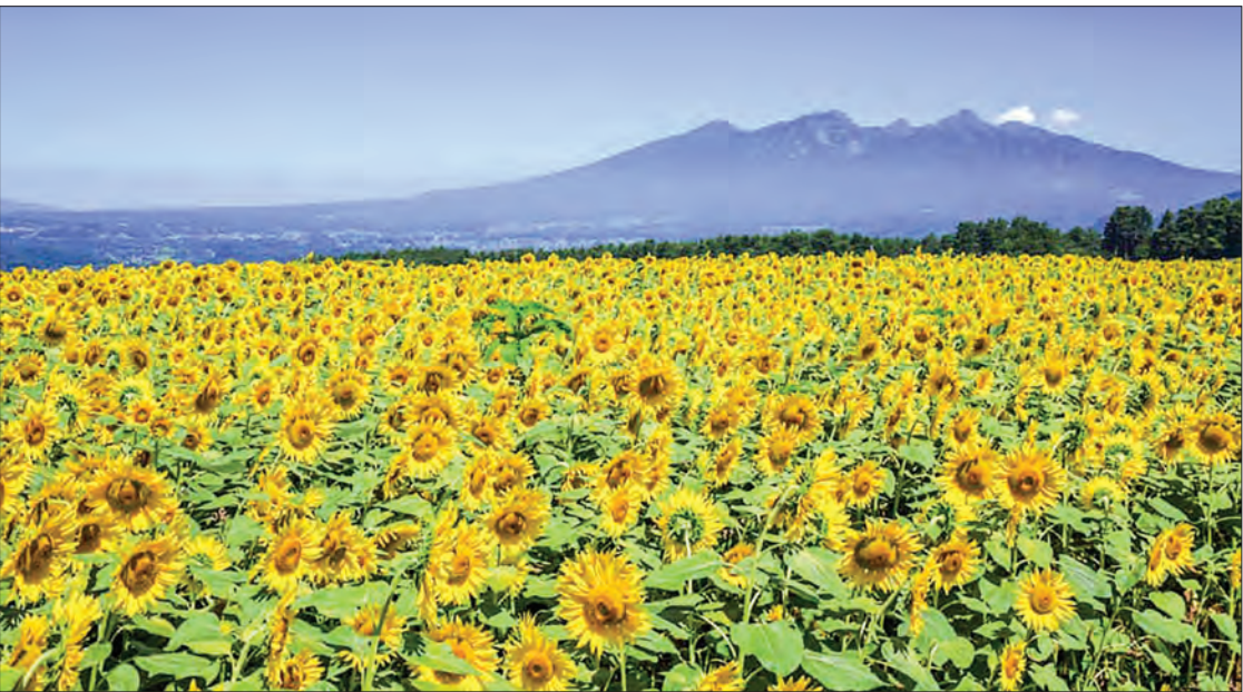
Picture shows sunflower plantation in Mandalay.

and party inspected the infrastructure in Smart Island and looked around the sandy beach and pebble beach. Then, they left for Donenyaunghmai village with speed boats from Smart Islands and formally opened the CBT site in the village. The regional Chief Minister delivered the opening remark that the Taninthayi Region has rich natural resources to create tourism destinations. The region is boasted with its realistic scenic view and aquatic resources. The CBT site in Donenyaunghmai village is aimed at assisting in the government's poverty alleviation project. I hope it will become the most successful CBT site in the region. The regional government is endeavouring to become a significant tourism spot like Yangon, Mandalay, Inle and Bagan. Now, it has marked a milestone for the efforts. Later, Director U Nyo Aye of the Region Directorate of Hotels and Tourism explained CBT and treasurer of CBT site gave a thankful speech. Regional Chief Minister handed over the honour certificates to the donors and chair of village CBT presented commemorative presents to regional Chief Minister and ministers at the event. —Khaing Htoo (Myeik IPRD) (Translated by Ei Myat Mon)