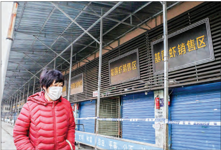
(FILES) This file photoshows a woman walking in front of the closed Huanan wholesale seafood market in the city of Wuhan, Hubei province in China.