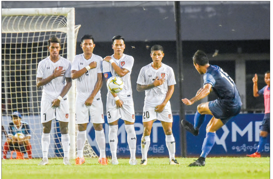
Myanmar national team players (in white) attempt to block the free kick during an international friendly match against Nepal at Mandalay Thiri Stadium in Mandalay on 7 November 2019.