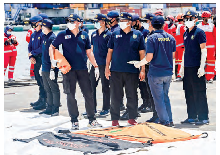
Indonesian police stand by a body bag containing the remains of a victim at Tanjung Priok port, north of Jakarta, on January 11, 2021, during search and rescue operations off the coast for the Sriwijaya Air flight SJ182 Boeing 737-500 passenger jet which crashed into the Java Sea minutes after takeoff on January 9.