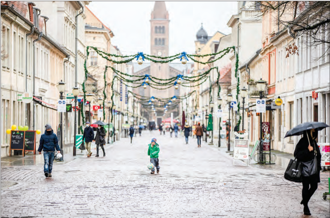
A child plays football as people walk past closed stores on the Brandenburger Strasse pedestrian area in the centre of Potsdam, eastern Germany on January 6, 2021 amid the ongoing novel coronavirus / COVID-19 pandemic.

The pandemic has killed more than 1.9 million people worldwide, according to a tally compiled by AFP using official sources and information from