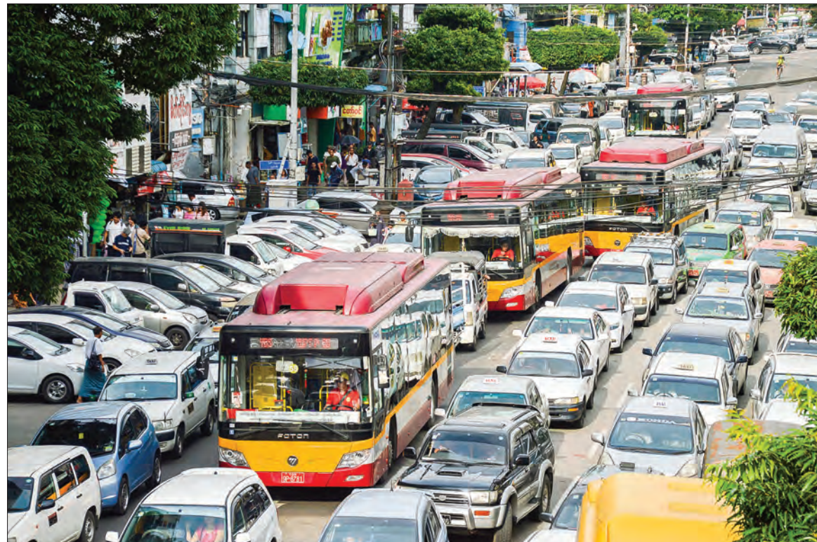
A traffic congestion in Yangon in 2019.

In quite a number of large cities around the World, the "taxes" on owning and operating a private vehicle can be high. This is of course a deterrent to owning private cars. Another is to improve public transportation so that it would be more convenient to travel in the city