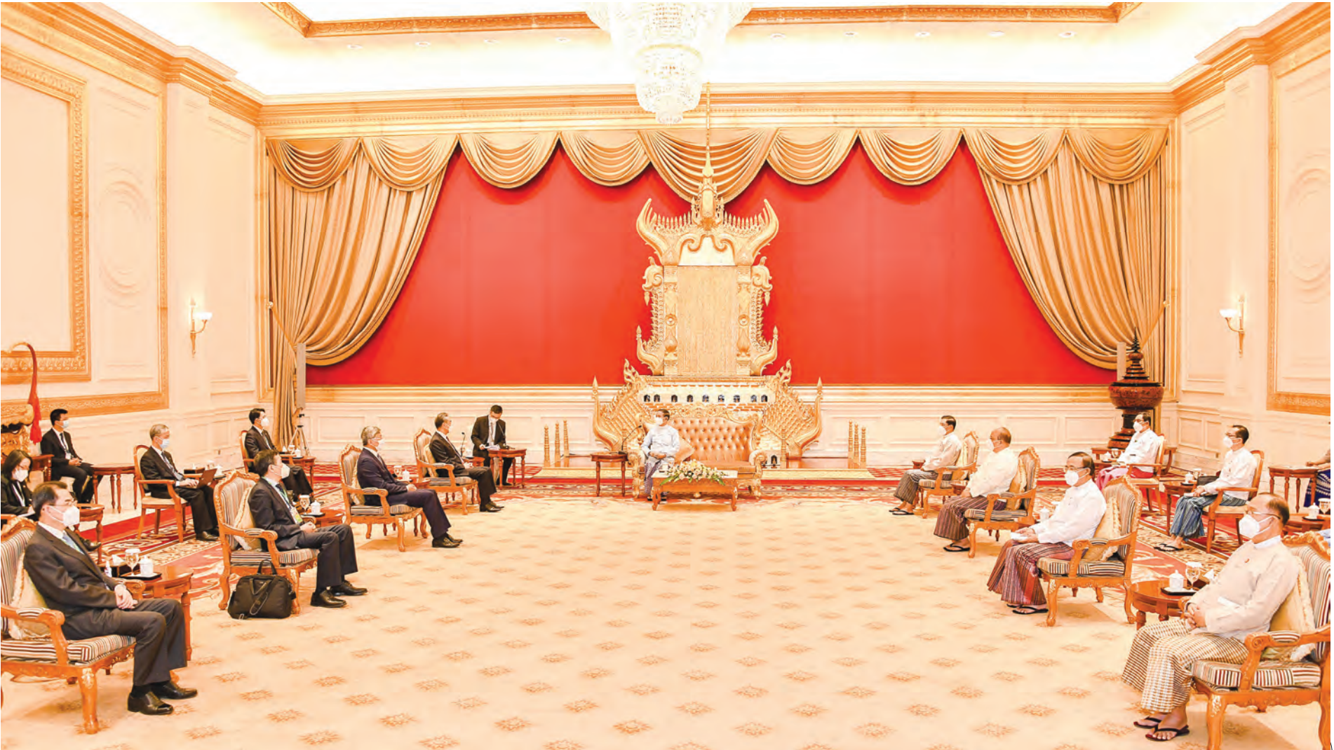
President U Win Myint receives the Chinese delegation led by State Councilor and Foreign Minister Mr Wang Yi at the Hall for Envoys of the Presidential Palace in Nay Pyi Taw.

FROM PAGE-1 projects. The call was also attended by Union Ministers U Min Thu, U Thaung Tun, U Kyaw Tin, U Thant Sin Maung, government officials, Chinese Ambassador to Myanmar Mr Chen Hai and senior Chinese officials.—MNA and maintaining the momentum of ongoing bilateral (Translated by Aung Khin)