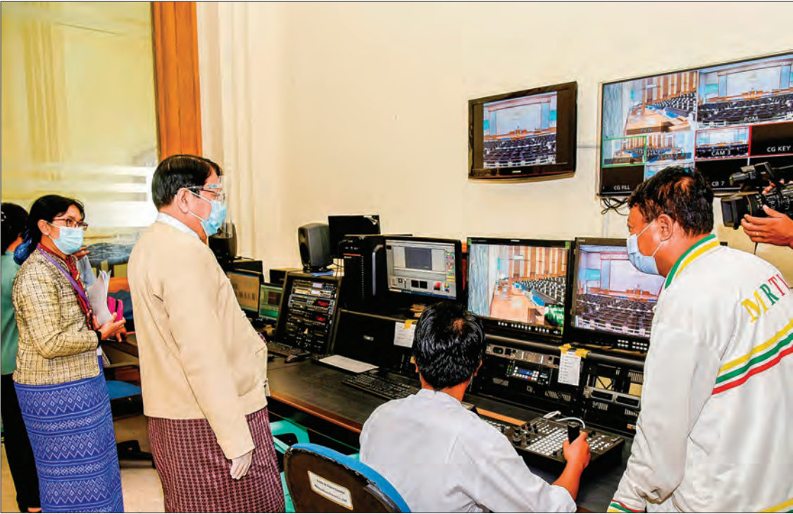
Union Minister Dr Pe Myint inspects the installation of broadcast equipment, control rooms and media corners at the buildings of Amyotha Hluttaw, Pyidaungsu Hluttaw and Pyithu Hluttaw in Nay Pyi Taw on 11 January 2021.

UNION Minister for Information Dr Pe Myint inspected preparations for the broadcast of first session meetings of Union-level third Hluttaws yesterday afternoon. The Union Minister looked around the installation of broadcast equipment, control rooms and media corners at the buildings of Amyotha Hluttaw, Pyidaungsu Hluttaw and Pyithu Hluttaw. Director-General U Ye Naing from Myanmar Radio and Television and officials reported on the preparations for the live broadcast of Hluttaw television channels, production, equipment, broadcast system and reserved systems for any faults. The Union Minister and party also inspected the rooms for technical and production crews of MRTV at the Information and Communications Technology unit in the Hluttaw compound. —MNA (Translated by Aung Khin)