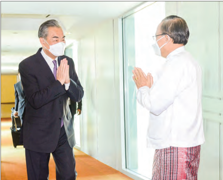
CHINESE State Councilor and Foreign Minister Mr Wang Yi made an official visit to Myanmar by a special flight yesterday afternoon. At Nay Pyi Taw International Airport, Mr Wang Yi and party were welcomed by Union Minister for International Cooperation U Kyaw Tin, Chinese Ambassador to Myanmar Mr Chen Hai and officials from Ministry of Foreign Affairs.—MNA (Translated by Aung Khin)