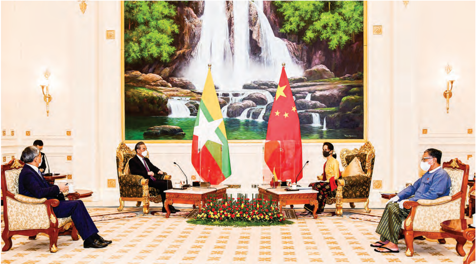
State Counsellor Daw Aung San Suu Kyi receives State Councilor and Foreign Minister Mr Wang Yi and party at the Hall for Envoys of the Presidential Palace in Nay Pyi Taw.