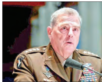
Mark Alexander Milley, a United States Army general and the 20 th chairman of the Joint Chiefs of Staff.