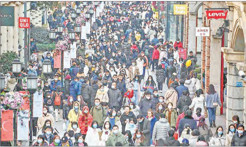
China’s economy is projected to expand by 7.9 per cent in 2021 following 1.9 per cent growth in 2020. PHOTO: AFP

U.S. employers slashed 140,000 jobs in December, the first monthly decline in employment since April 2020, as recent COVID-19 spikes stall labor market recovery, the Labour Department reported Friday. “The decline in payroll employment reflects the recent increase in coronavirus (COVID-19) cases and efforts to contain the pandemic,” the department’s Bureau of Labour Statistics (BLS) said in its monthly employment report. SOURCE: Xinhua