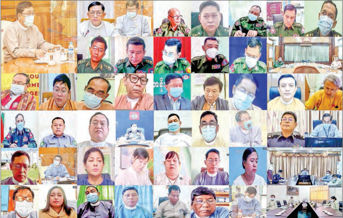
National Disaster Management Working Committee and Fundraising Working Committee hold the coordination meeting 1/2021 via videoconferencing on 8 January 2021.