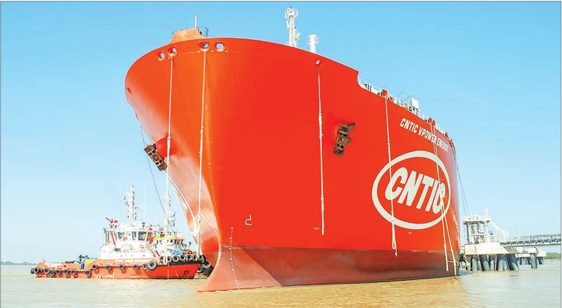
MV CNTIC VPower Energy capable of carrying 120,000m3 LNG is berthed at the Dolphin Jetty in Thilawa.