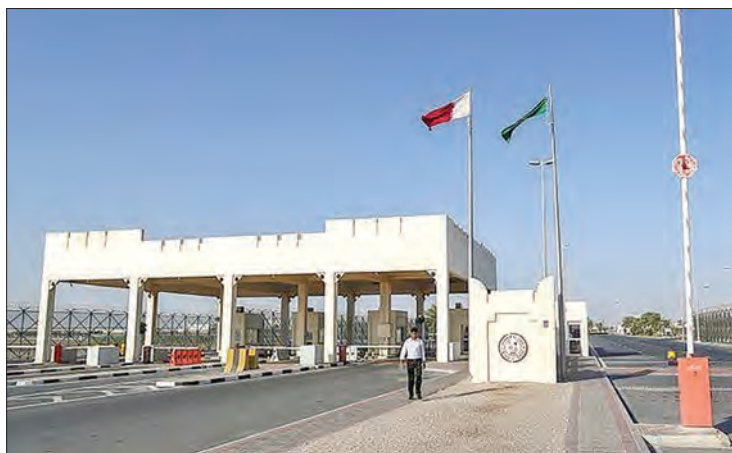
A file photo taken on June 23, 2017, shows a general view of the Qatari side of the Abu Samrah border crossing with Saudi Arabia.

On January 4, Kuwaiti Foreign Minister Ahmad Nasser Al-Sabah announced on state television that a deal had been agreed to "open the airspace and land and sea borders between the Kingdom of Saudi Arabia and the State of Qatar".