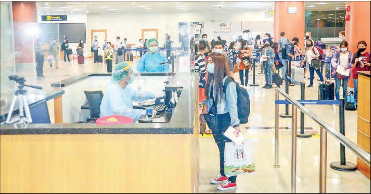
Myanmar returnees from Singapore are seen at the Yangon International Airport on 9 January 2021.