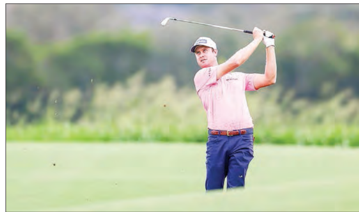
Harris English of the United States plays a shot on the seventh hole during the second round of the Sentry Tournament Of Champions at the Kapalua Plantation Course on January 08, 2021 in Kapalua, Hawaii.

World number one Dustin Johnson, in his return after winning the Masters in November, was among seven on 136 ahead of the weekend shootout. "You've got to go low out here," English said. "I'm going to try to make as many birdies as I can. I've got to keep the pedal down." —AFP ■