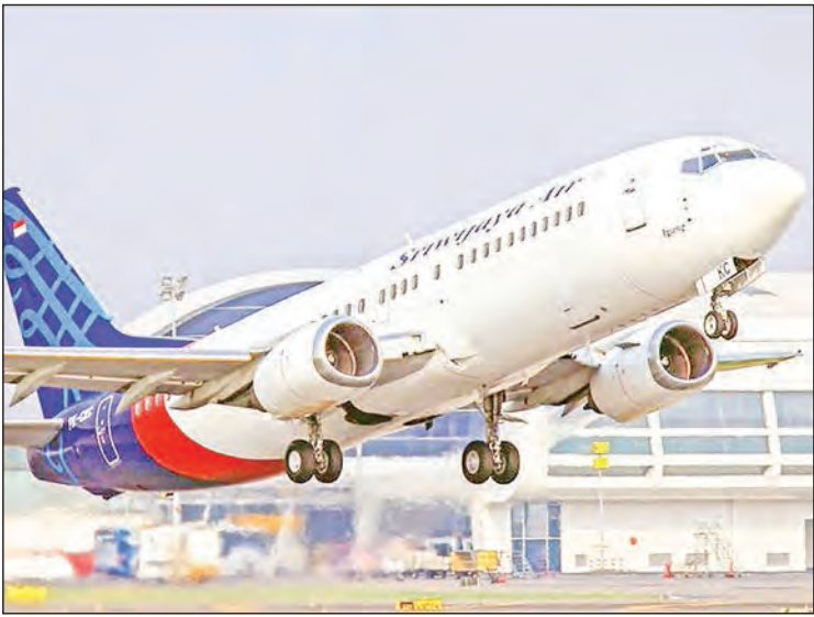
Indonesia’s Sriwijaya Air lost contact with one of its passenger planes shortly after take-off from the capital Jakarta, the country’s transport ministry said Saturday.

AN Indonesian budget airline plane with 62 people on board is suspected to have crashed into the sea shortly after the Boeing 737 took off from Jakarta airport on Saturday, authorities said. Flight tracking data showed the Sriwijaya Air Boeing 737-500 plunged into a steep dive about four minutes after it left Soekarno-Hatta international airport. Sixty-two passengers and crew were on board, including 10 children, the nation’s transport minister, Budi Karya Sumadi, told reporters. The suspected crash site is near tourist islands just off the coast of Indonesia’s sprawling capital. The plane took off on Saturday afternoon and a search and rescue operation began with no official results available on Saturday night.