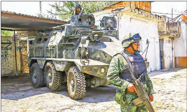
Mexico deployed the military in the war on drugs in 2006 but the move failed to rein in powerful cartels.

PRESIDENT-ELECT Joe Biden’s arrival in the White House is expected to bring a shake-up of US-Mexican cooperation in a bloody war on drugs that has failed to rein in powerful cartels, experts say. Mexico has seen more than 300,000 murders since deploying the military in