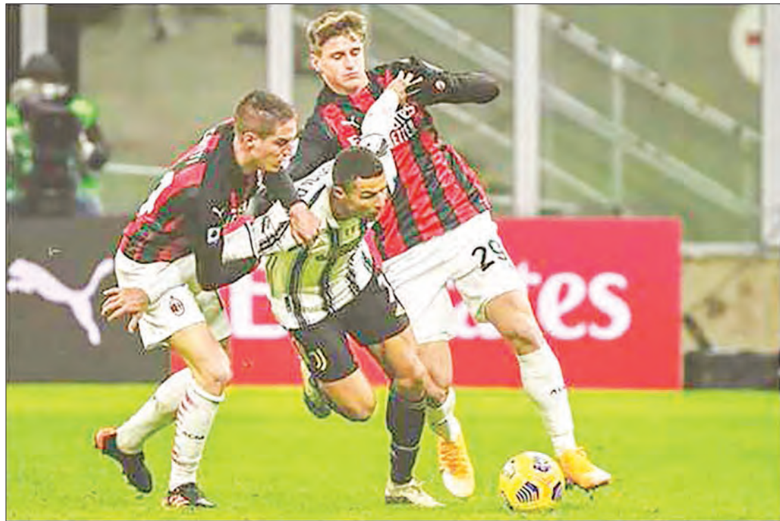
AC Milan remain one point ahead of second-placed Inter Milan despite Juventus ending their 27-match unbeaten league run last week.

MILAN—Reeling after mid-week defeats, both Milan clubs look to get back on track in Serie A this weekend to hold off their rivals as champions Juventus and Roma close the gap on the leaders. Milan remain one point ahead of second-placed Inter despite Juventus ending their