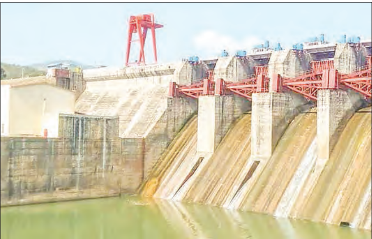
Picture shows Hsedawgyi Dam in Madaya Township, Mandalay Region.

MANDALAY Region Irrigation and Water Utilization Management Department will provide sufficient irrigated water from Hsedawgyi Dam for the local farmers who will grow summer paddy and summer sesame on 67,348 acres of land starting from the first week of February. Now, the Hsedawgyi Dam has entirely stored the water. At the end of December, the Hsedawgyi dam has 358,260 acres of remaining water level with 84,000 acres of dead water level and 274,260 acres of usable water. Depending upon the remaining water level, the department targeted to provide full water to 67,053 acres of summer paddy and 295 acres of summer sesame for the