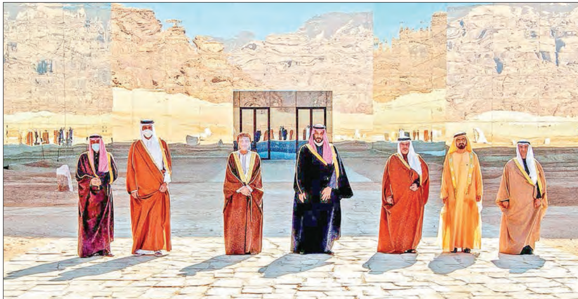
The Gulf states will restore travel, trade and transport links with Qatar within a week, the UAE said Thursday, after a landmark deal to normalize ties ended a damaging rift.

"The practical measures will be within a week... includ-