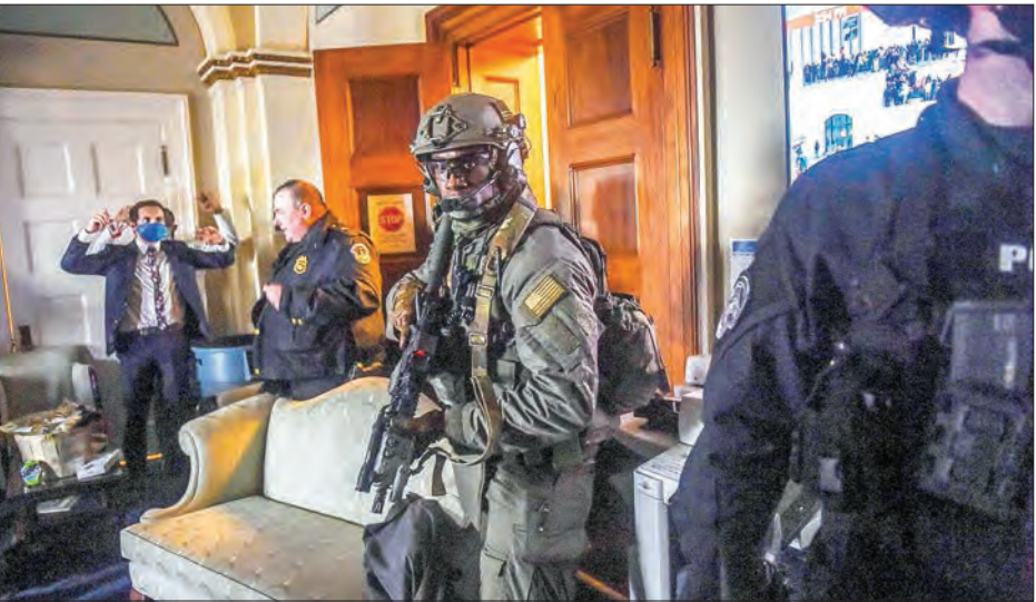
A congressional staffer holds his hands up while police secure the Capitol on Wednesday.

MAJOR US corporations and businesses groups on Wednesday condemned the occupation of the US Capitol by rioters angry at President Donald Trump's election defeat, with one organization raising the possibility of the president being removed from office. The statements came on a shocking day for the United States, which saw mobs overrun Congress after a rally by Trump, who had sought to thwart the process of lawmakers certifying election results. That was the final administrative step before Democratic President-elect Joe Biden enters