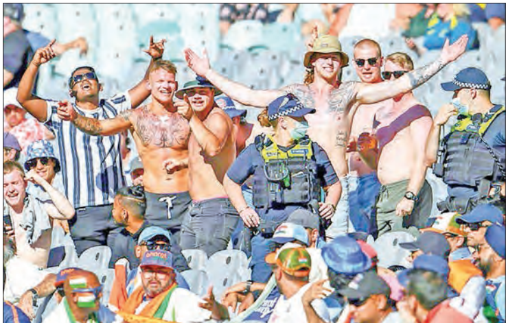
Fans chant at the Melbourne Cricket Ground last month. A spectator who was at the showpiece Boxing Day Australia-India Test has tested positive for coronavirus and fans seated nearby have been urged to get Covid tested and isolate.

“The MCG is being investigated as a potential source for the infection,” Victoria’s Depart-