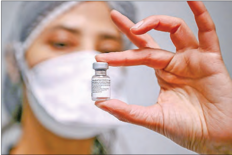
A health worker holds a vial containing the Pfizer/BioNTech Covid-19 vaccine in Aulnay-sous-Bois, France.

By comparison, flu vaccines cause about 1.3 anaphylaxis