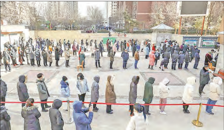
Residents wait in line for nucleic acid tests at a community in Qiaoxi District of Shijiazhuang, capital of north China’s Hebei Province, Jan. 6, 2021.

TRAVEL has been restricted to a northern Chinese city of 11 million people and schools closed as authorities Wednesday moved to snuff out a cluster of Covid-19 after dozens were infected.