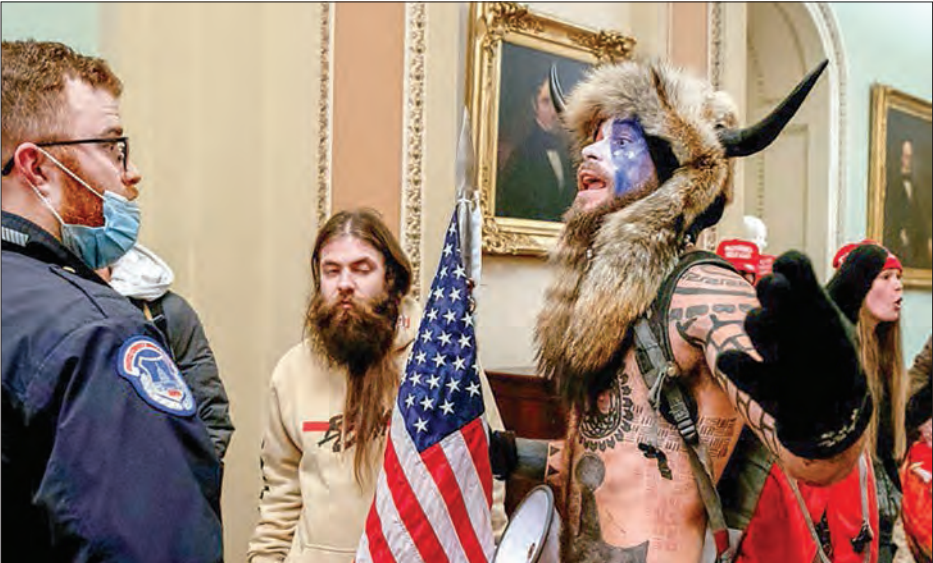
Supporters of outgoing US President Donald Trump stormed the US Capitol delaying certification of the presidential election.