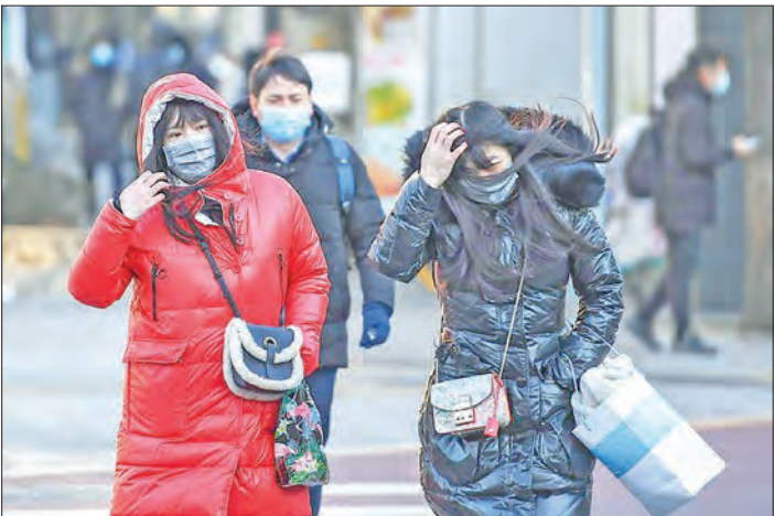
People walk on a street in Chaoyang District, Beijing, capital of China, Jan. 6, 2021.

TEMPERATURES in the Chinese capital plunged to their lowest for more than five decades on Thursday, as Beijing was hit by gale-force winds and bitter conditions.