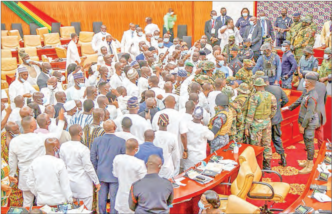
The mayhem erupted after a ruling party deputy tried to seize the ballot box during the vote for Ghana's parliament speaker.

GHANAIAN soldiers intervened in parliament to quell a clash between opposing parties in chaotic scenes overnight ahead of the body's swearing-in on Thursday.