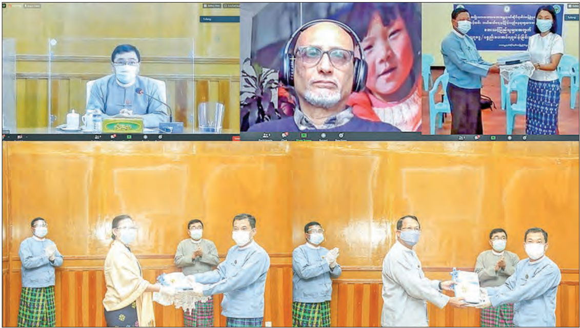
Union Minister Dr Win Myat Aye participates in the handover ceremony of communication tools for visually impaired and hearing impaired persons via videoconferencing on 7 January 2021. risks of natural and human-made hazards in rehabilitation pro- grammes.

PLAN International Myanmar transferred braille and sign language video files about nine disasters for the persons with visual or hearing impairments yesterday. The tools for PWDs were presented at the Ministry of Social Welfare, Relief and Resettlement, and Country Director of Plan International Myanmar Mr Haider Yaqub firstly briefed the donation. Union Minister Dr Win Myat Aye said the ministry is making efforts for the children, youths, women and elderly people to get their individual rights in full in addition to the development. The preventive measures and responses are also being carried out to overcome the