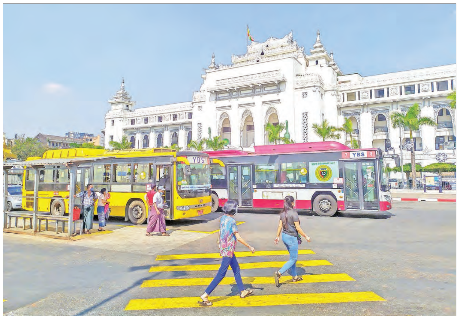
YBS buses are seen in downtown Yangon during the second wave of coronavirus outbreak in Myanmar.

Moreover, YRTA also provided the masks, the stickers to remind the people to wear the