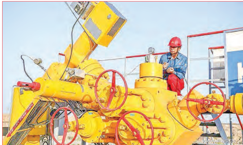
A staff member works at Kela-2 gas field of the Tarim Oilfield in Aksu, northwest China's Xinjiang Uygur Autonomous Region, July 8, 2017.

THE Tarim oilfield branch of PetroChina, China's largest oil and gas producer, said it has supplied over 270 billion cubic metres of natural gas to 15 provincial-level regions in China via the country's West-to-East gas pipeline.