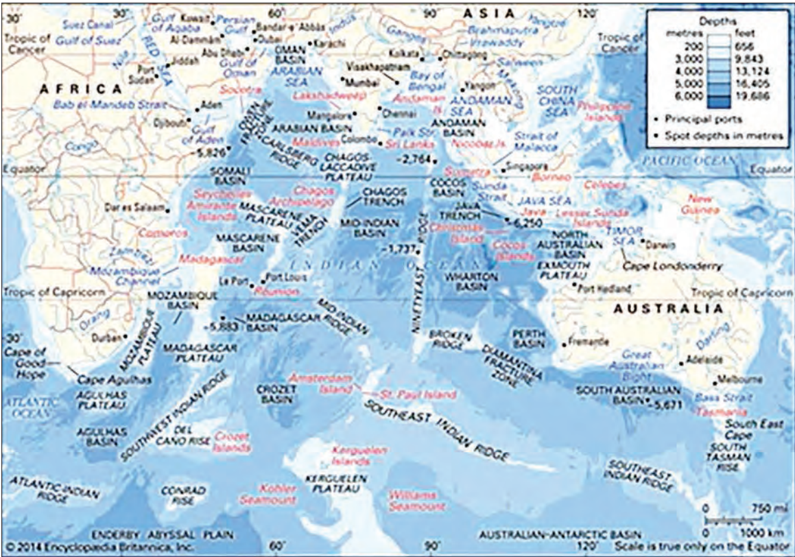
The Indian Ocean, with depth contours and undersea features.