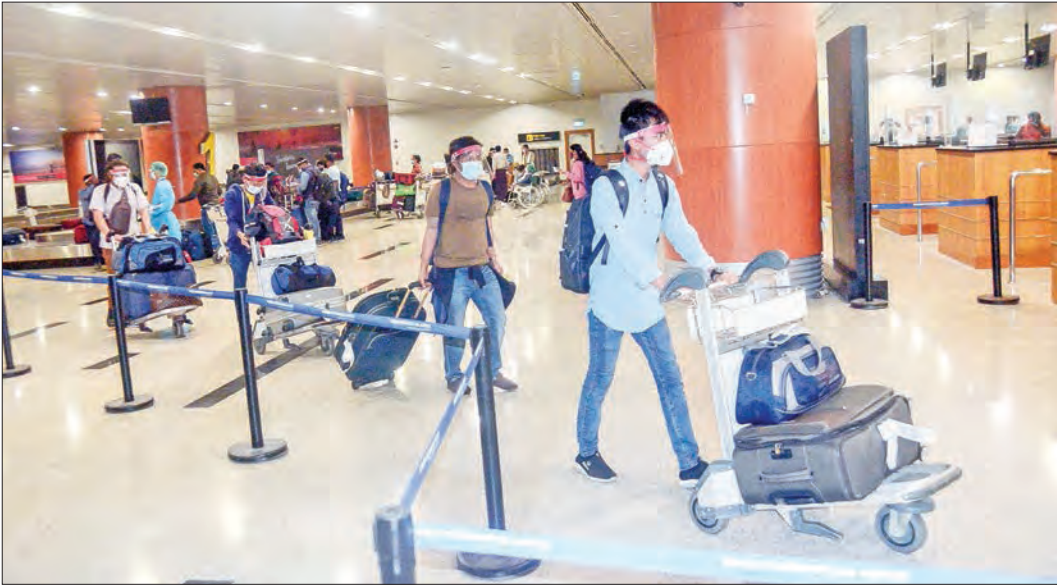
Myanmar returnees are seen at the Yangon International Airport on 7 January 2021.

ON behalf of the Government of the Republic of Bulgaria and on my own behalf, I extend most sincere congratulations on the occasion of the National Day of the Republic of the Union of Myanmar – the Independence Day. I avail myself of this pleasant opportunity to express my confidence that the friendly relations between Bulgaria and Myanmar will continue to develop and expand in all spheres of mutual interest. Please accept, Your Excellency, the assurances of my highest consideration.