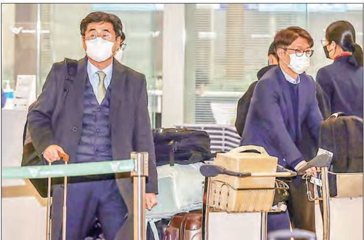
The South Korean delegation led by Koh Kyung-sok (L) is heading to Iran to negotiate the release of an oil tanker and its crew seized in strategic Gulf waters.

"I plan to meet my counterpart at the Iranian foreign ministry and will meet others through various routes if it will help efforts to resolve the issue of the ship's seizure," said Koh Kyung-sok, the chief delegate, before boarding