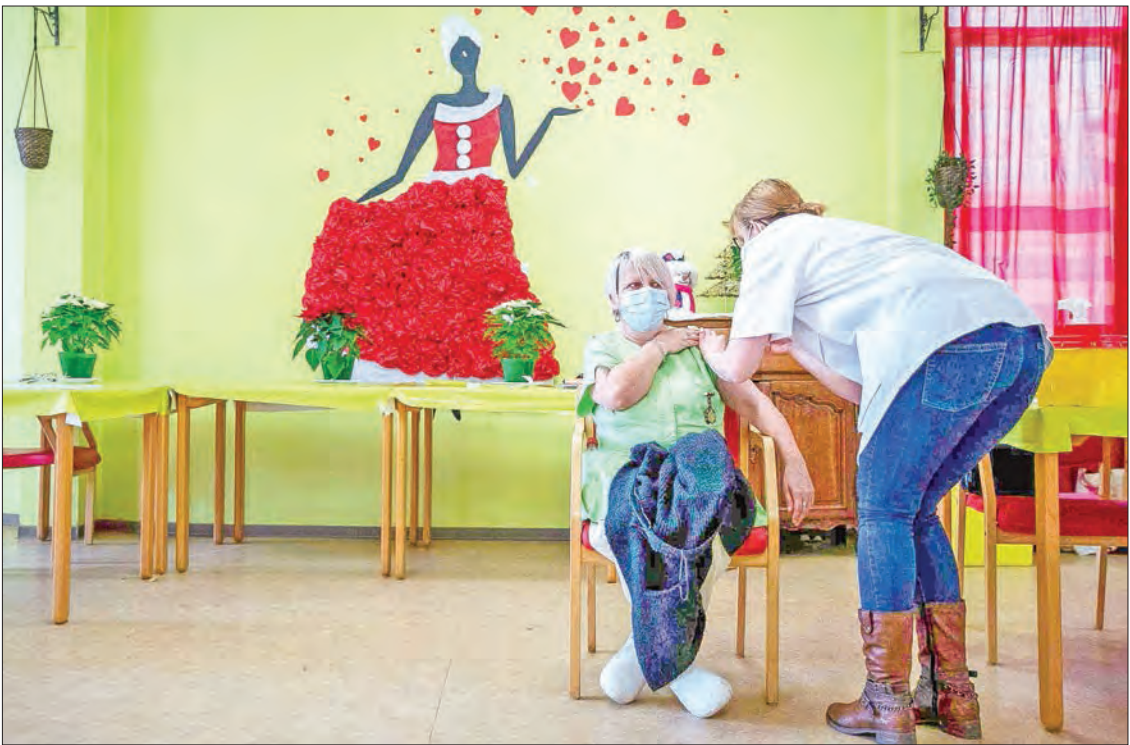
The Belgian government says it is updating its COVID-19 vaccination roll-out plan which has been widely criticized for being slow.

By negotiating on behalf of - and in coordination with - the EU’s 27 member countries, “it reduces cost and it gives us a