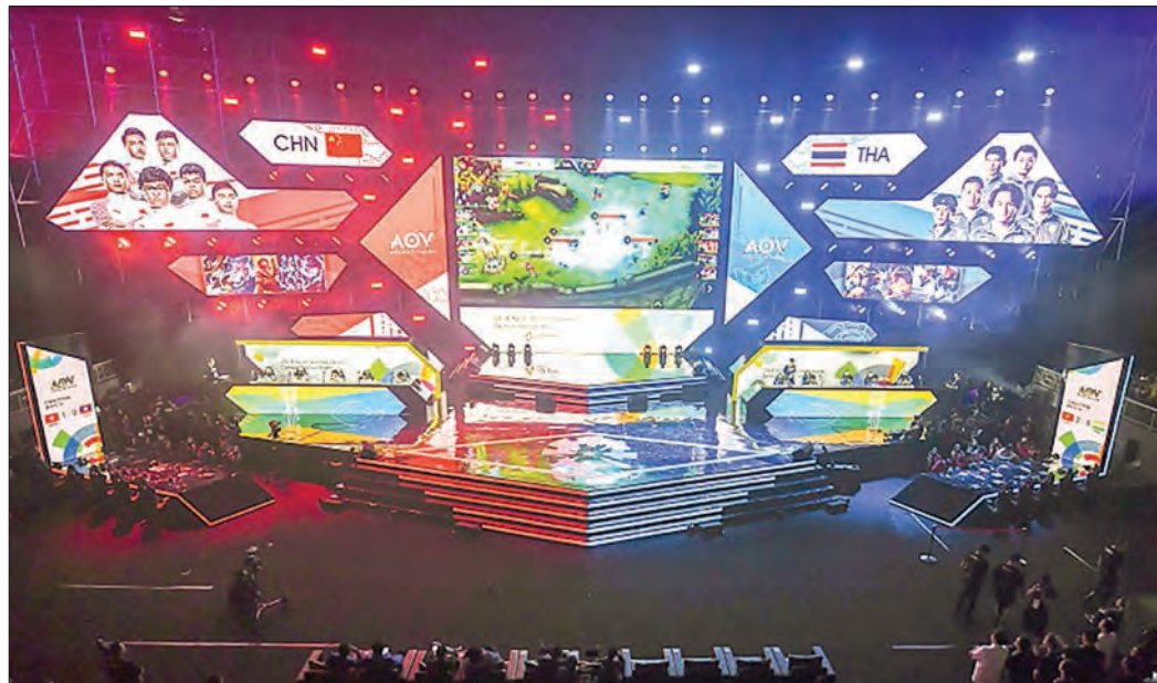
The Chinese e-sports team battles the Thai team at Arena of Valour, one of the six e-sports demonstration events at the 2018 Asian Games, in Jakarta, Indonesia, on August 26, 2018.

SHANGHAI—China has begun building a US$900 million ($1.18 billion) facility it hopes will be the envy of e-sports and seal its push to make Shanghai the global capital of the fast-growing professional gaming industry.