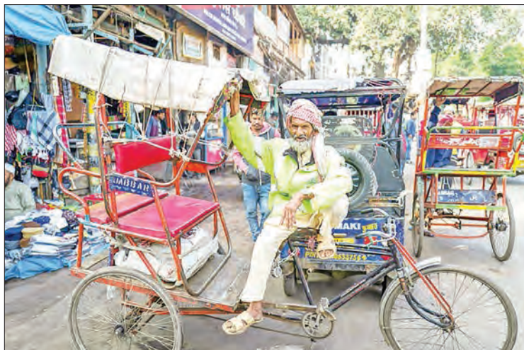
Modi's government is struggling to kickstart what was once the world's fastest growing major economy.

"The growth in real GDP during 2020-21 is estimated at -7.7 per cent as compared to the growth rate of 4.2 per cent in 2019-20," reads a statement released by the National Statistical Office (NSO) of India's federal ministry of statistics and programme implementa-