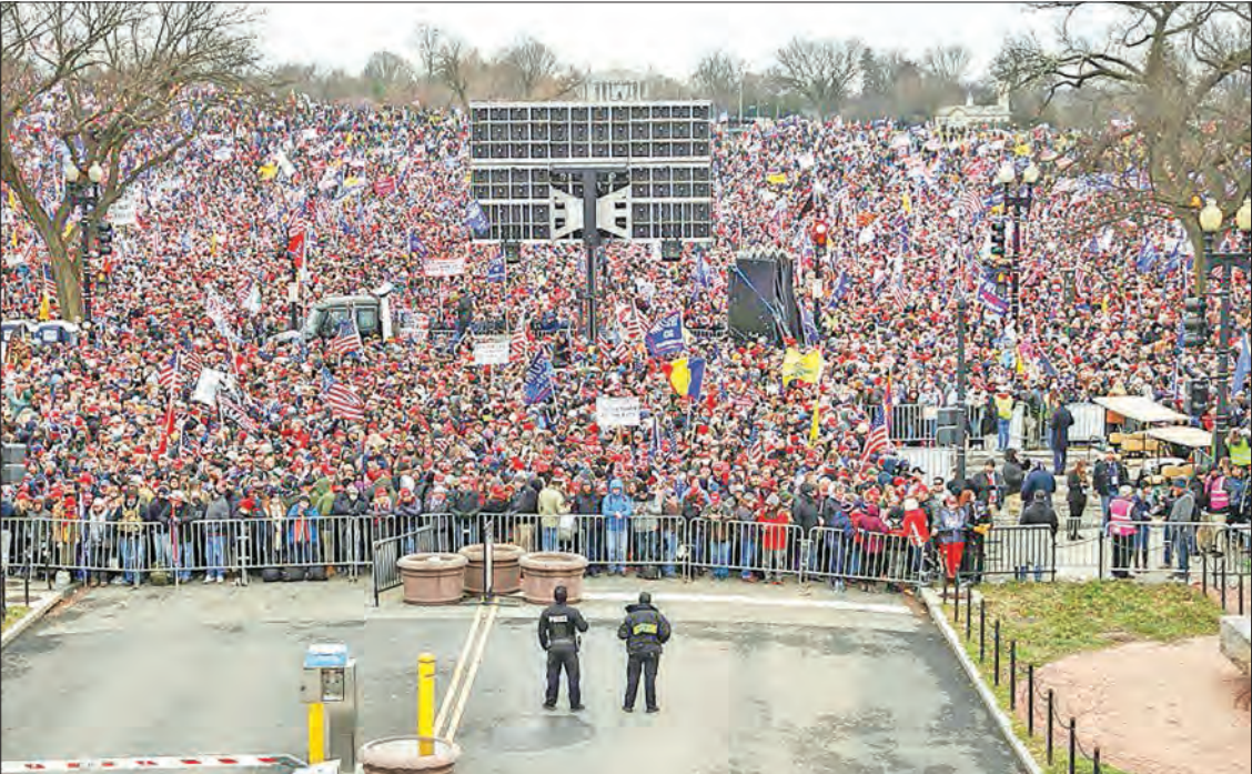
Crowds arrive for the “Stop the Steal” rally on Jan. 6, 2021 in Washington, DC. Trump supporters gather in the nation’s capital to protest the ratification of President-elect Joe Biden’s Electoral College victory over President Trump in the 2020 election.

Through slavery and segregation, Civil War and Cold War, US presidents have often hailed their democracy as exceptional, what Ronald Reagan called the