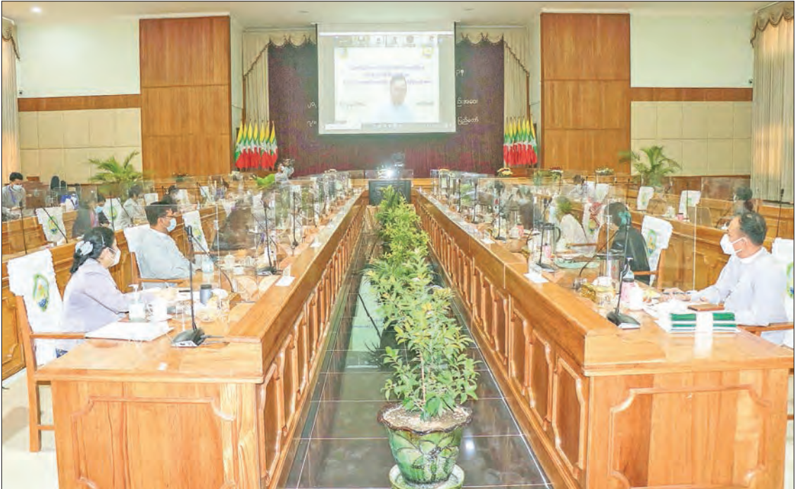
Union Minister U Ohn Win speaks at the virtual meeting of the Environmental Conservation Department on 7 January 2021. Township offices. The national environmental policy, climate change policy, strategy and main function, waste strategy, and main function were released during this period. Implementations of the related sectors based on the policies, strategy, and main function have somewhat achievements. Additional 43 district offices and 194 township offices

UNION MINISTER for Natural Resources and Environmental Conservation U Ohn Win presided over the first coordination meeting of the Department of Environmental Conservation for 2020-2021FY via videoconferencing at its office in Nay Pyi Taw yesterday. The Union Minister said that the department was first established over eight years ago for the environmental conservation in all sectors. Policies and strategies, laws and by-laws and rules and regulations relating to the environment were laid down to work for the clean environment and healthy ecosystem in successive generations of the country. The department was established in 2012-2013FY, it is now being operated with 1,411 staff with 15 Region/State offices, 45 District offices, and 7