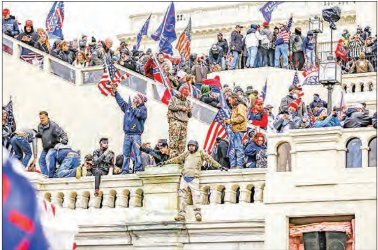
Pro-Trump supporters storm the U.S. Capitol following a rally with President Donald Trump on Jan. 6, 2021 in Washington, D.C. Trump supporters gather in the nation’s capital to protest the ratification of President-elect Joe Biden’s Electoral College victory over President Trump in the 2020 election.

Lawmakers later resumed the counting of the electoral votes that was halted for hours due to the chaos. They completed early Thursday the country’s final step to affirm Biden as the winner of the November presidential election, and he will be sworn in on Jan. 20. But the scenes of protesters smashing windows and vandalizing offices in the Capitol seem to have tarnished the image of the United States, which has championed democracy around the world, putting Trump in the hot seat over his role in inflaming his supporters through unsubstantiated claims aimed at