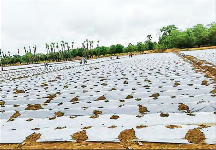
Watermelon plantation in Sagaing Region.