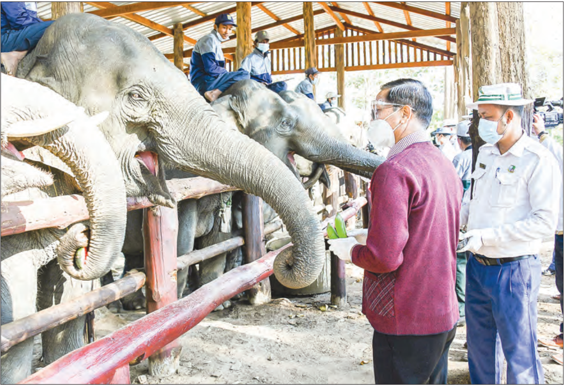
Vice-President U Henry Van Thio feeds the elephants at the Ngalaik Sakanthar elephant camp on 5 January 2021.

for the recreation place of staff members in Nay Pyi Taw and the nearby public. The Vice-President instructed to promote the recreation site into a destination with full safety standards for local and foreign visitors. He also discussed creating a clean environment at the forest resort and training for the more attractive elephants' performances for the camp visitors. The Vice-President and party grew conifer plants and rode motorboats in Ngalaik dam to have scenic views.—MNA (Translated by Aung Khin)