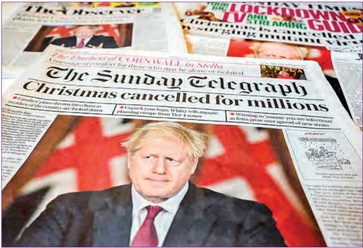
Britain’s Prime Minister Boris Johnson looks on during a news conference in response to the ongoing situation with the coronavirus disease (COVID-19) pandemic, inside 10 Downing Street, London, Britain, on 19 December, 2020. January 26, shortly after the UK left the European Union’s single market and as it seeks new trade

ing urgent action was needed to prevent spiralling numbers of cases overwhelming health services. “The prime minister said that it was important for him to remain in the UK so he can focus on the domestic response to the virus,” Downing Street said Johnson had told his Indian counterpart. Johnson still hopes to visit India in the first half of 2021, before Modi is due to attend a G7 summit in Britain later this year. The British leader was due to be a guest at India’s annual Republic Day celebrations on