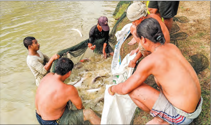
Thaton hatchery sells over 1 million fingerlings to a licenced pond in Thaton Township, Mon State.

We appreciate your feedback and contributions. If you have any comments or would like to submit editorials, analyses or reports please email aungthuya@gnlm.com.mm with your name and title. Due to limitation of space we are only able to publish "Letter to the Editor" that do not exceed 500 words. Should you submit a text longer than 500 words please be aware that your letter will be edited.