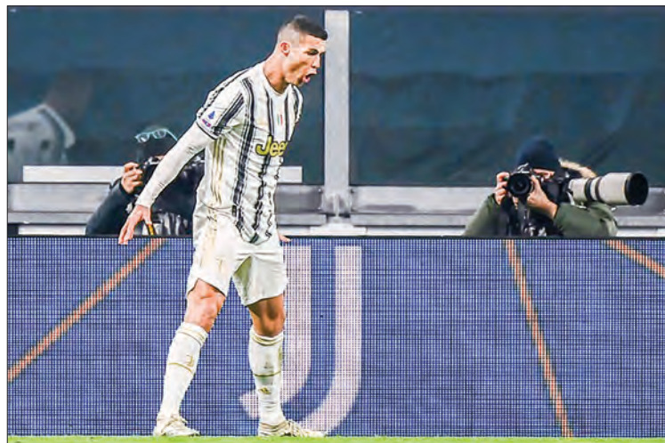
Cristiano Ronaldo has scored 14 of Juventus's 29 league goals this season.

The 39-year-old Swede scored 10 goals in six games played before picking up a muscle problem. —AFP ■