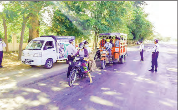
No 96 Traffic Police Force (Meiktila) is carrying out the traffic awareness campaign and taking action against the disobedient drivers every Sunday in the crowded areas to reduce the traffic accidents.

A total of 86 people were killed with 388 others injured in connection with 260 road accidents in Meiktila in 2020, according to a statement of No. 96 Traffic Police Force (Meiktila).