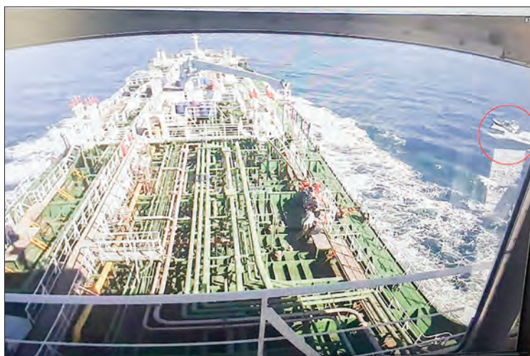
CCTV footage of the Hankuk Chemi, a South Korean-flagged oil tanker, shows a boat from Iran's Revolutionary Guards in a red circle. The footage was shown at tanker owner DM Shipping's offices in Busan on January 4, 2021.

SOUTH Korea will send a delegation to Iran to negotiate the release of a seized oil tanker and its crew, Seoul said Tuesday, as an anti-piracy unit arrived in waters near the Strait of Hormuz.