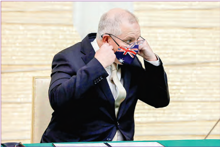
Australian PM Scott Morrison suggested virus-ravaged countries like Britain had been forced to take risks with emergency approvals. PHOTO: POOL/AFP UNDER mounting pressure to speed up coronavirus vaccinations, Australian Prime Minister Scott Morrison on Tuesday said he would not take “unnecessary risks” and emulate Britain’s emergency drug approval. While vaccinations are already well underway in many countries, Australia’s pharma-

deals around the world, particularly in fast-growing Asia. SOURCE: AFP