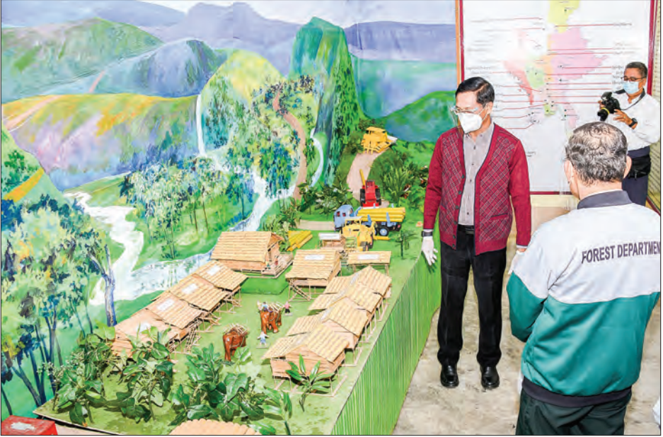
The Vice-President views the miniature of the recreation site for local and foreign visitors on 5 January 2021.