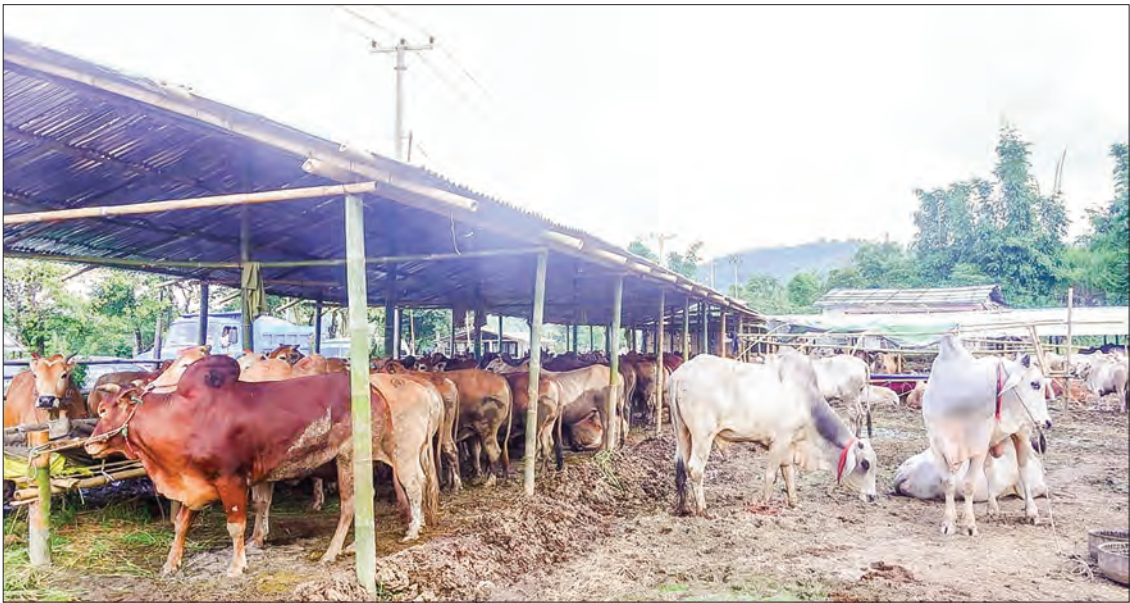
Live cattle export was allowed in late 2017, to eradicate illegal exports, creating more opportunities for breeders and promoting their interests.

"In the meantime, we are concerned about possible market manipulation when the supply is surpassing the demand. Additionally, Myanmar's live cat-