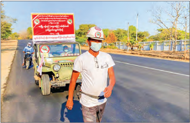
A long-journey walker is walking to honour COVID front-liners, healthcare workers and volunteers.

A 48-year-old man continued his over 1,000-mile journey walking in honour of COVID-19 front-liners, including medical workers and volunteers, as he left Meiktila Township in central Myanmar yesterday morning.