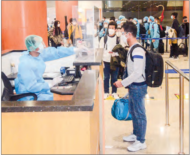
Myanmar returnees are going through immigration process at the Yangon International Airport yesterday.

with the relevant ministries, Myanmar embassies from respective countries, shipping companies and the relevant organizations.—MNA