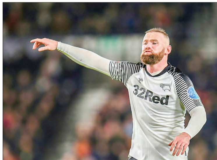
Derby County, with Wayne Rooney in interim charge, have closed their training ground after a coronavirus outbreak.