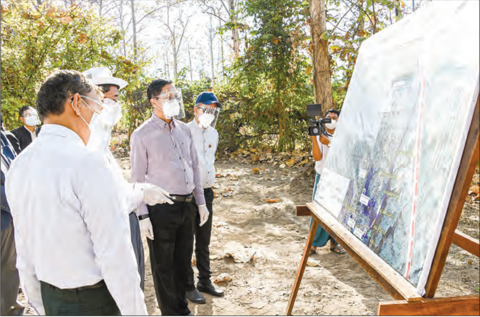
Vice-President U Henry Van Thio inspects the development project near Nay Pyi Taw on 5 January 2021.

for the recreation place of staff members in Nay Pyi Taw and the nearby public. The Vice-President instructed to promote the recreation site into a destination with full safety standards for local and foreign visitors. He also discussed creating a clean environment at the forest resort and training for the more attractive elephants' performances for the camp visitors. The Vice-President and party grew conifer plants and rode motorboats in Ngalaik dam to have scenic views.—MNA (Translated by Aung Khin)