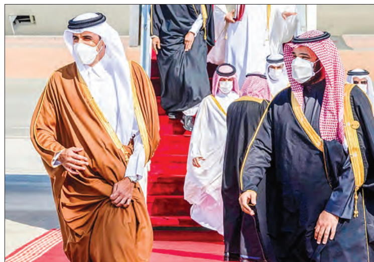
Qatar's ruler Sheikh Tamim bin Hamad Al-Thani is given a warm welcome by Saudi Crown Prince Mohammed bin Salman on his first visit after three and a half years of broken relations, fueling hopes of rapprochement at a Gulf summit.