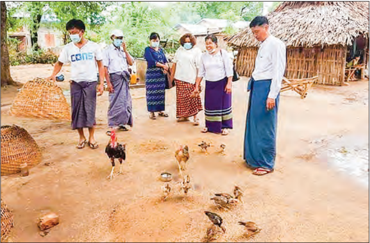
The FSP will provide K500,000 per farm to the breeders of native breeds in three townships in Mandalay Region in the current financial year 2020-2021, to ensure food safety.