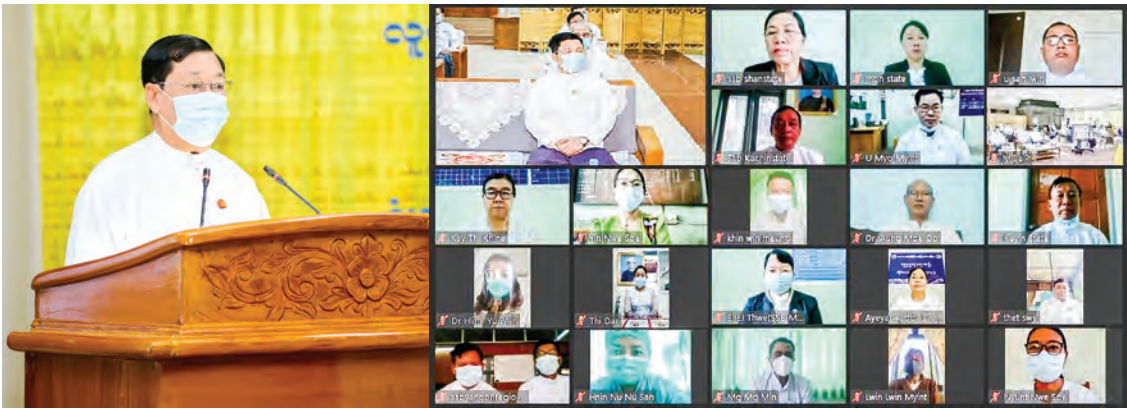
MoLIP Minister addresses the online ToT refresher course in HR development on 5 January 2021.

THE Social Security Board under the Ministry of Labour, Immigration and Population held the opening ceremony of a refresher course on trainers for human resource development under the social welfare project via videoconferencing in Nay Pyi Taw yesterday morning. Union Minister U Thein Swe, Deputy Minister U Myint Kyaing, directors-general and deputy directors-general, departmental officials and social welfare officers from the respec-