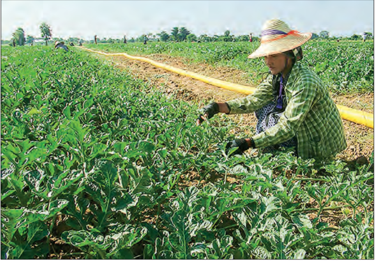
A farmer works in a watermelon farm in Nay Pyi Taw.