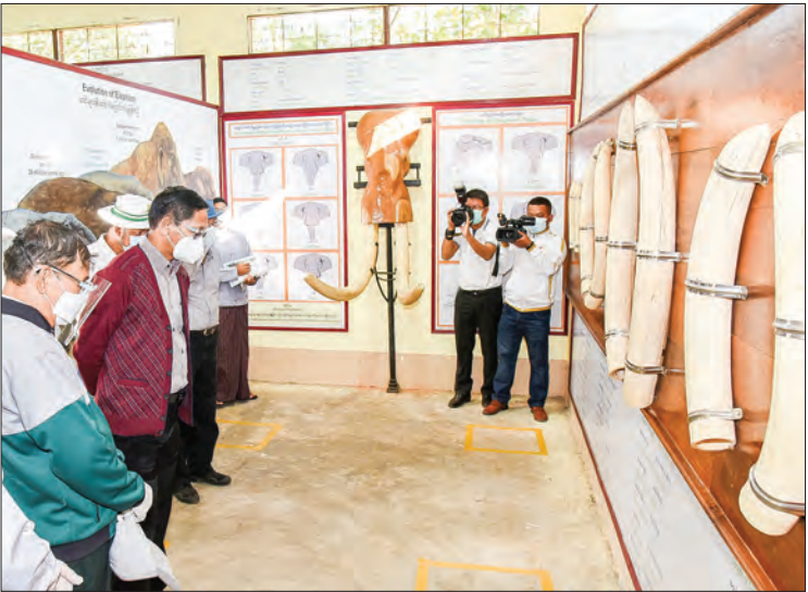
The Vice-President and party look into the displays at the Ngalaik Sakanthar elephant camp yesterday.

has been constructed until now. The Vice-President also arrived at the suspension bridge construction site at the Ngalaik Sakanthar elephant camp. The 70 per cent of the bridge with 170-ft length and 4-ft width has been completed to date. At the Shwe Kyun Taw camp, the Vice-President heard reports on the development project which were first intended