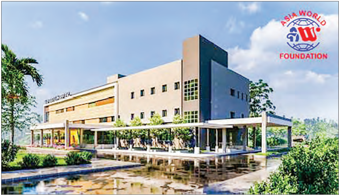
The new 100-bedded Waibargi Hospital's proposed design plan .

of prompt completion of the new hospital this year based on our track record over the years with the construction of a two-lane concrete road (55 km Maungtaw-Angumaw) on the other side of Sittway, Rakhine State, and recently the opening of a two-lane prestressed Reinforced Concrete Cantilever Bridge, spanning over 800 feet in length (elevation of 476 ft) on the Toungoo - Bawgali -Mawchi Road built and donated by Asia World Foundation," said U Htun Myint Naing, Chairman of the Asia World Foundation.—GNLM