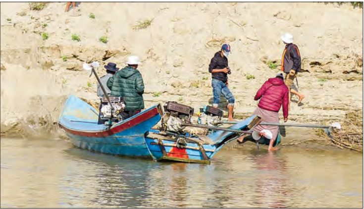
The Fisheries Department conducts the one-year patrolling project on Ayeyawady dolphin conservation to fight illegal electrofishing.

A combined team led by the Fisheries Department conducted a one-year patrolling project on Ayeyawady dolphin conservation to reduce and finally eliminate illegal electrofishing in Ayeyawady River. When the Fisheries Department conducted the patrolling project, it was joined by the Department of Environmental and Endangered Aquatic Species Conservation, Kanbalu township Fisheries Department, Singu township Fisheries Department, Sagaing township Upper Myanmar Fisheries Training Centre, Maritime Police Supervision Division No. 1, the local people from Mandalay Ayeyawady Dolphin Conservation and the Wildlife Conservation Society (WCS) of Myanmar. The patrolling project took 104 hours, and the activities were usually conducted in early mornings, mornings, afternoons, evenings and at nights in an area of 1,140 kilometres. The team completed the patrolling project for 15 days from 16 December to 30 December 2020. Within 15 days, the team confiscated five fishing boats, five batteries and 12 other related equipment used in the illegal