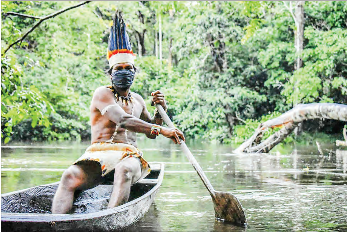
In recent months, the COVID-19 pandemic has reinforced the ills of the Amazon region, the largest tropical forest in the world.

The country has set an ambitious target of vaccinating 300 million of its 1.3 billion people by mid-year.