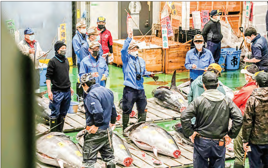
At this year’s auction, no spectators were allowed, and buyers and sellers wore masks and sanitized their hands.

TOKYO’S annual New Year tuna auction ended Tuesday without the usual jaw-dropping bidding war, with the country’s “Tuna King” holding back on gunning for the top fish, citing