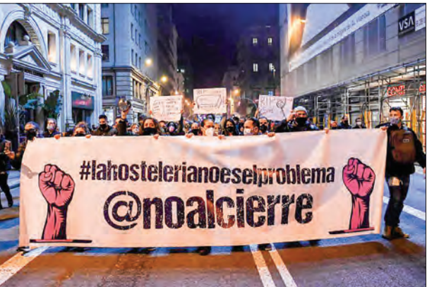
Spanish workers hold a placard reading “Hospitality is not the problem. No to closure”. PHOTO: JOSEP LAGO /AFP

years from the devastation wreaked by the financial crisis of 2008. Heavily dependent on tourism, Spain is expected to show the biggest slump among western economies this year, with the IMF expecting growth to contract by 12.8 per cent. SOURCE: AFP