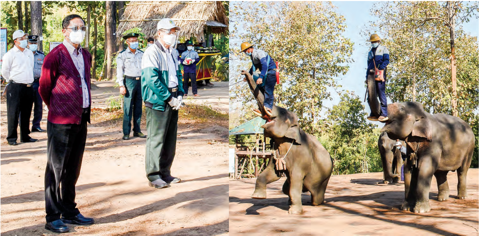
Vice-President U Henry Van Thio and officials are viewing the elephants' shows during his inspection tour near Nay Pyi Taw on 5 January 2021.