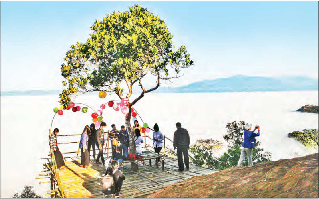
Travellers are seen at the “cloud sea” tourist spot in Mogaung, Kachin State on 4 January 2021.

A new “cloud sea” tourist spot has been set up in Mogaung, Kachin State, and on 4 January, the Independence Day, visitors flocked to Mount Loi Hin Chae and enjoyed the cloud