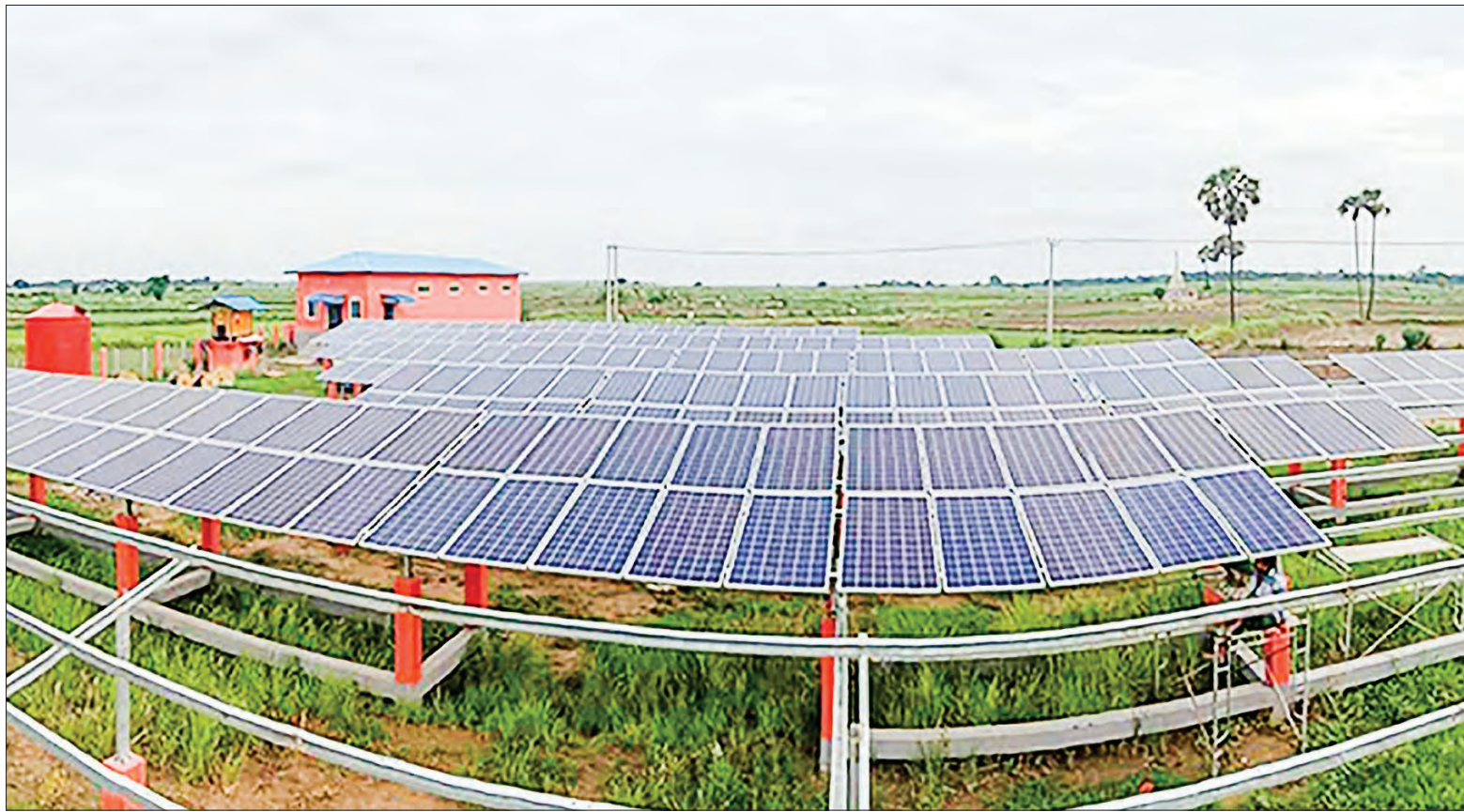
Eight villages between Ayeyawady and Chindwin rivers in Yasagyo Township get access to solar power 2019.

Moreover, amidst an exceptionally challenging year, and despite suffering setbacks, the renewables sector has shown resilience.