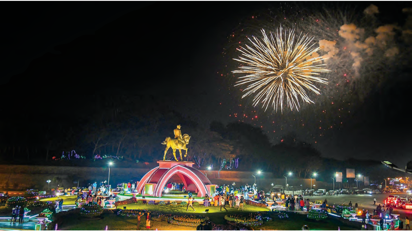
Fireworks set off over the Bogoyoke Aung San Bronze Statue in Nay Pyi Taw to celebrate the 73 rd Independence Day on 4 January 2021.

We appreciate your feedback and contributions. If you have any comments or would like to submit editorials, analyses or reports please email aungthuya@gnlm.com.mm with your name and title. Due to limitation of space we are only able to publish “ Letter to the Editor ” that do not exceed 500 words. Should you submit a text longer than 500 words please be aware that your letter will be edited.