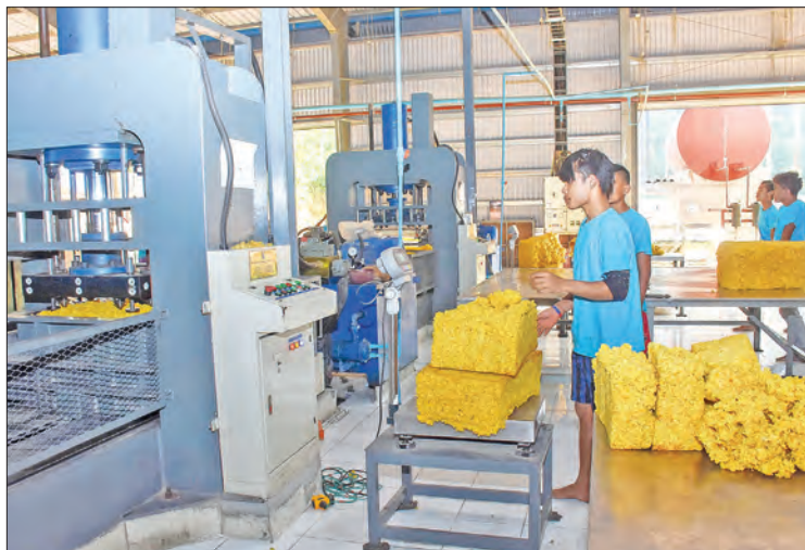
(FILES) Rubber is weighed on a digital scale.

Quality Testing Lab was set up at the Commodity Testing and Quality Management Division (Hlegu Township) of the Consumer Affairs Department under the MOC.