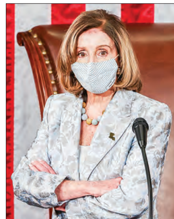
Speaker of the House Nancy Pelosi (D-CA) waits during votes in the first session of the 117th Congress in the House Chamber at the US Capitol on 3 January 2021 in Washington, DC.

One congressman-elect from Louisiana, Luke Letlow, died of complications from Covid-19 last