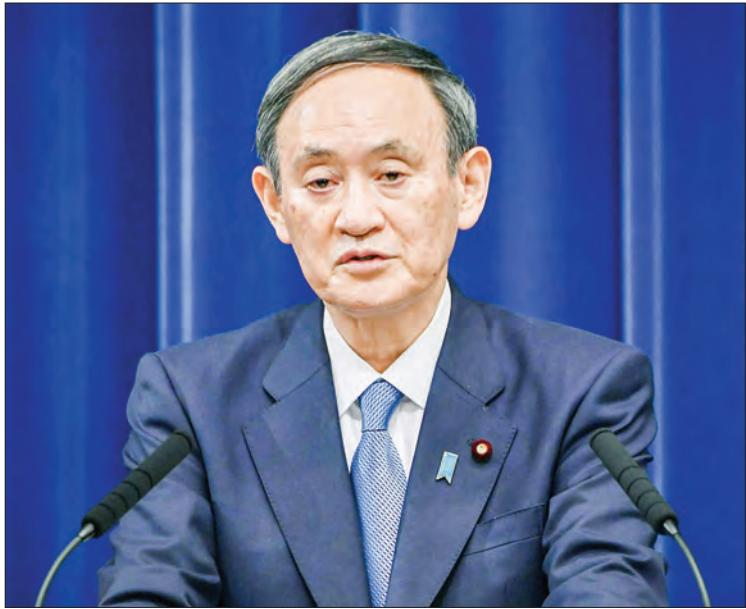
Japanese Prime Minister Yoshihide Suga attends the year's first press conference at his office in Tokyo on 4 January 2021.

he would "set an example" by taking a COVID-19 vaccination.