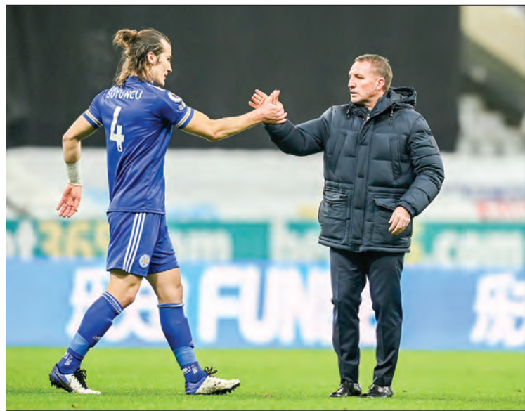
Leicester City's Northern Irish manager Brendan Rodgers (R) shakes hands with Leicester City's Turkish defender Caglar Soyuncu (L) after the English Premier League football match between Newcastle United and Leicester City at St James' Park in Newcastle-upon-Tyne, north east England on January 3, 2021. Leicester won the game 2-1.

LONDON (United Kingdom) — Leicester have the potential to disrupt the dominance of the 'Big Six' in the Premier League, says Foxes manager Brendan Rodgers.