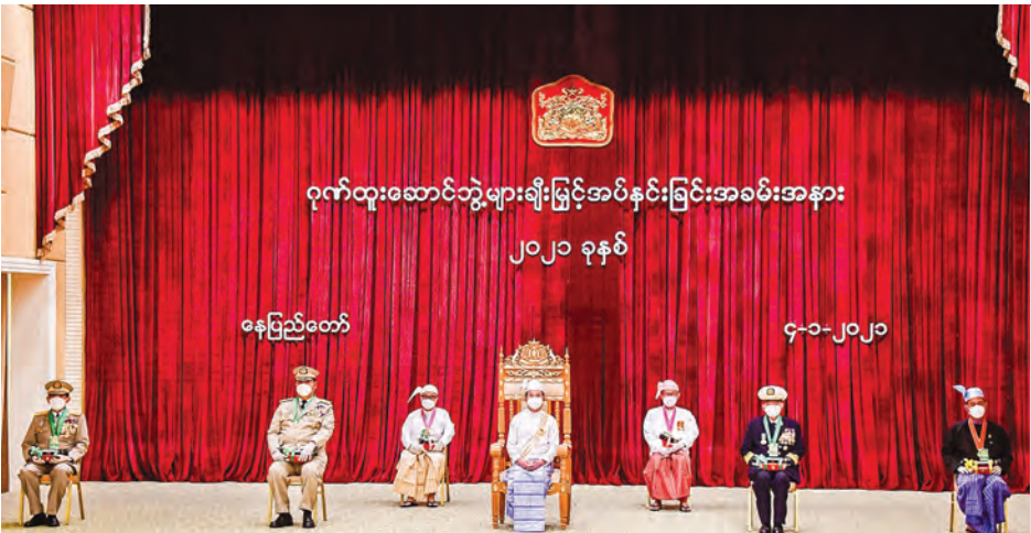
President U Win Myint and honorary title winners pose for a group photo at the ceremony of conferring honorary titles in Nay Pyi Taw on 4 January 2021.

Photo displays of the honorary titles conferring ceremony held in Nay Pyi Taw on the 73 rd Anniversary Independence Day.