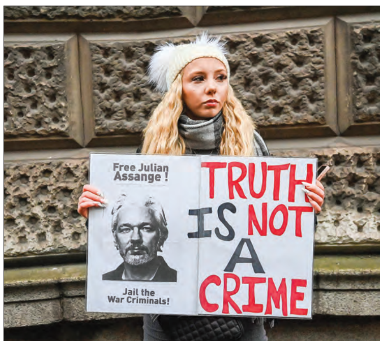
Supporters of Wikileaks founder Julian Assange demonstrate outside the Old Bailey court in central London as the court will rule on his extradition case on 4 January 2021.