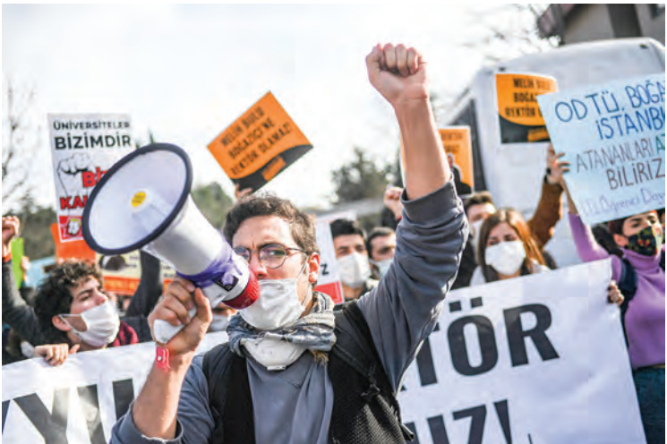
Students chant slogans and hold placards on 4 January 2021 in front of the Bogazici University in Istanbul during a protest against the direct appointment of the new rector to Bogazici university by Turkish President Recep Tayyip Erdogan.