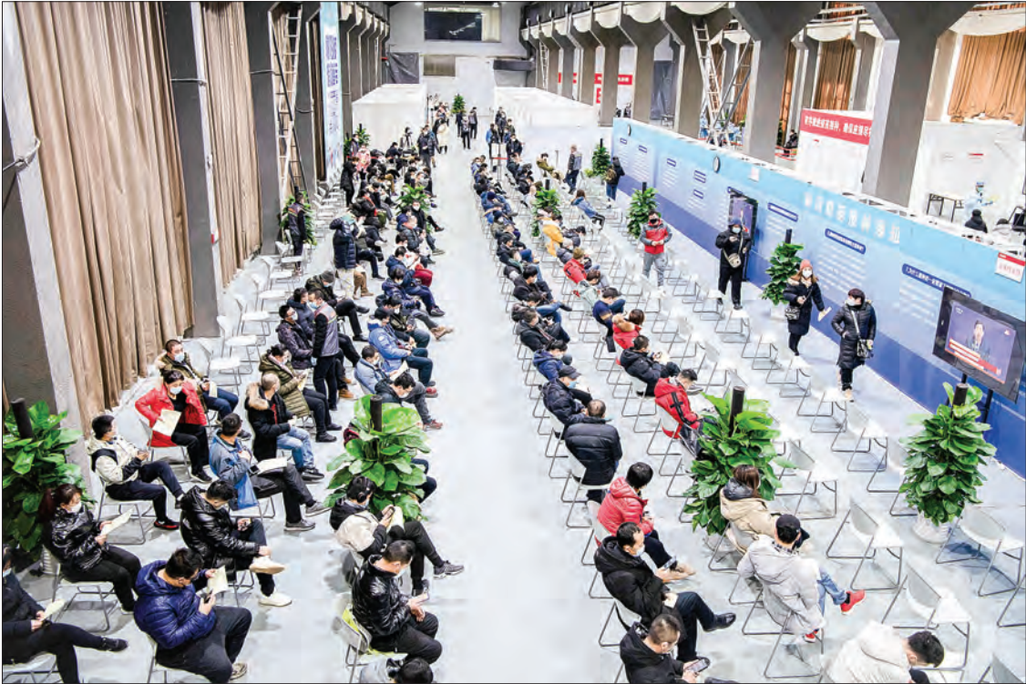
This photo taken on 3 January 2021 shows people waiting to receive COVID-19 coronavirus vaccines at a temporary vaccination centre in Beijing, as China races to inoculate millions before the Chinese New Year mass travel season in February.

THE US military on Monday blamed the Taliban for a spate of assassinations of prominent Afghans, the first time Washington has directly accused the insurgent group of the killings.