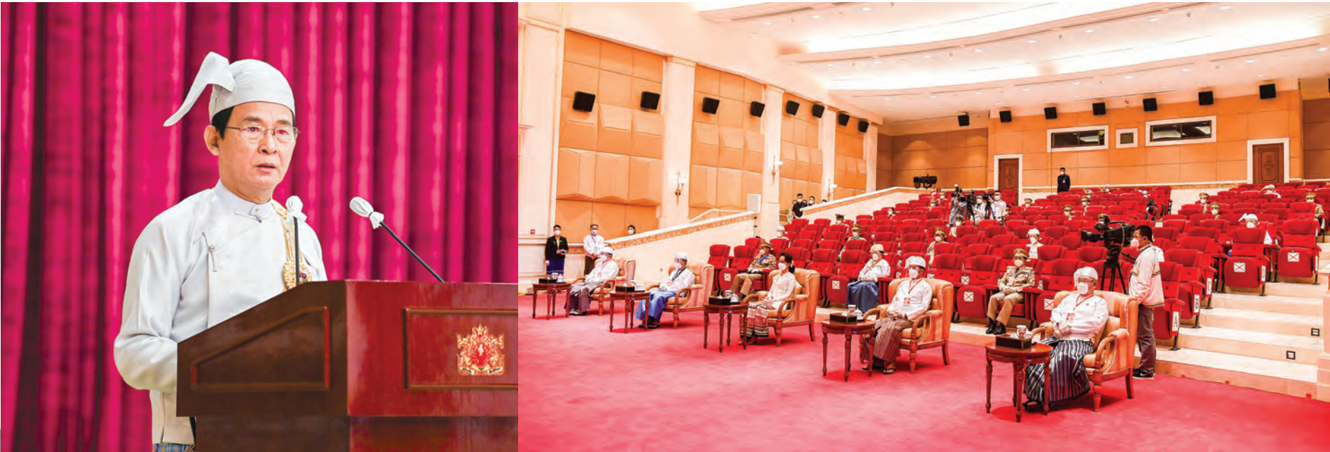
President U Win Myint delivers speech at the ceremony of conferring honorary titles at the Thabin Hall of the Presidential Palace in Nay Pyi Taw on 4 January 2021.