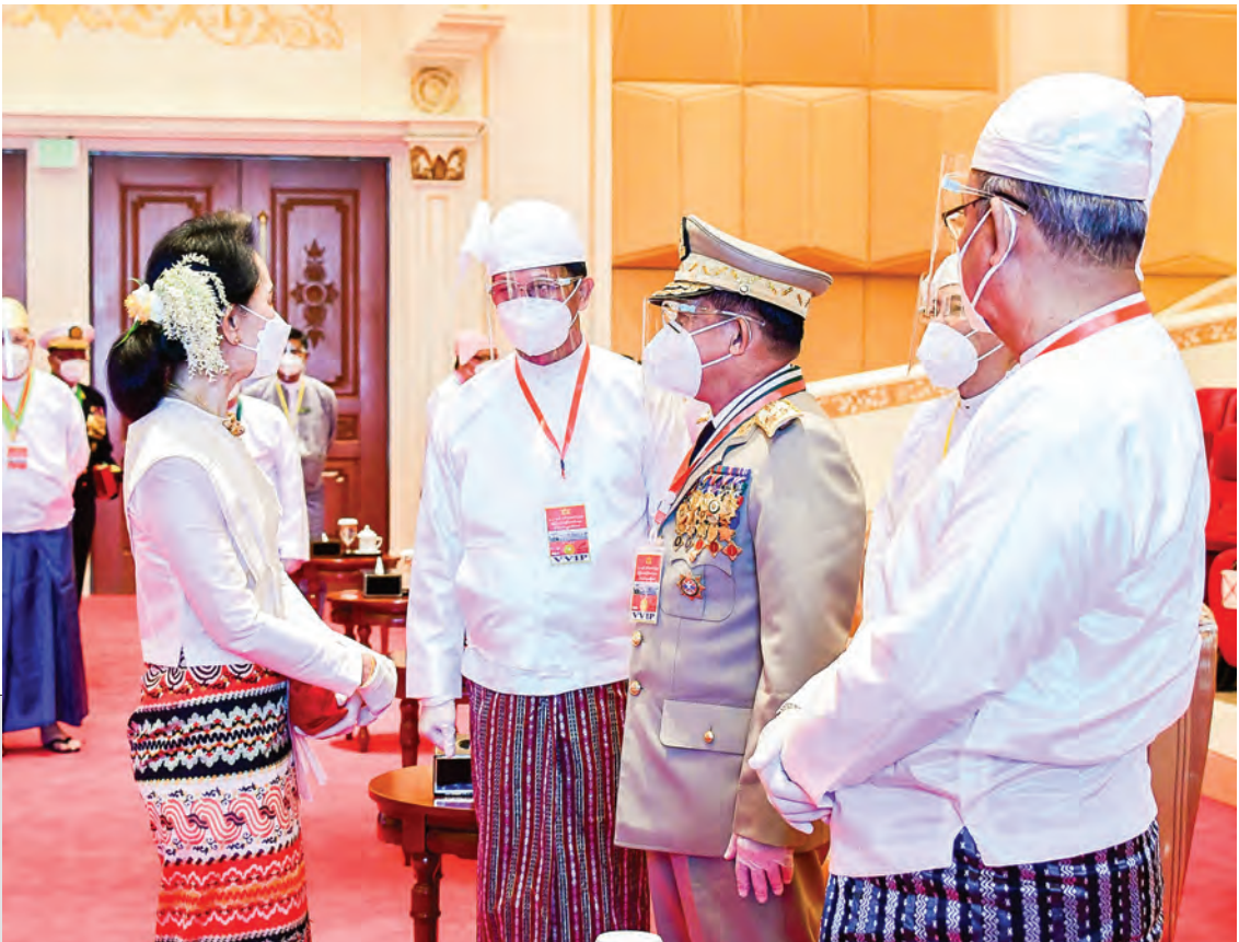
State Counsellor Daw Aung San Suu Kyi greets Senior General Min Aung Hlaing and attendees at the ceremony of conferring honorary titles in Nay Pyi Taw on 4 January 2021.