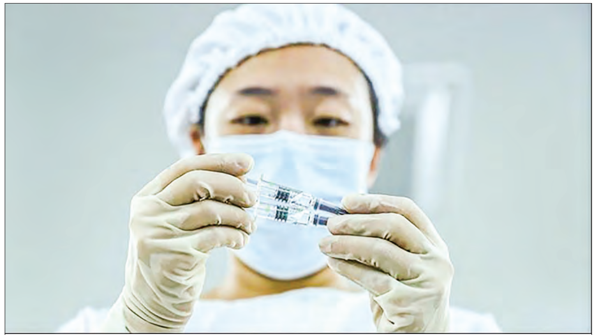
In this Dec 25, 2020 file photo, released by Xinhua News Agency, a staff member inspects syringes of COVID-19 inactivated vaccine products at a packaging plant of the Beijing Biological Products Institute Co Ltd, in Beijing. PHOTO: (ZHANG YUWEI/XINHUA VIA AP)

Although phasing out fossil fuels and transitioning to green economies is a monumental task, Mr Alers assured that "we are ready to rise to the challenge".