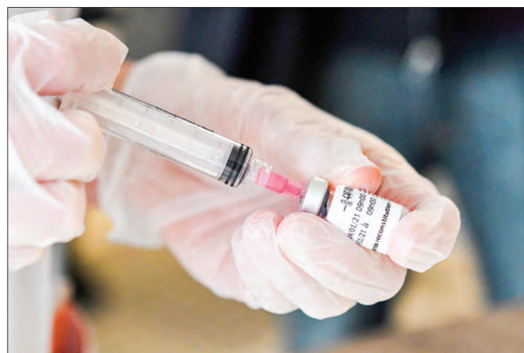
A nurse prepares to administer a dose of the Pfizer coronavirus disease (Covid-19) vaccine to a resident of retirement home, on January 4, 2021 in Saint-Renan, western France.