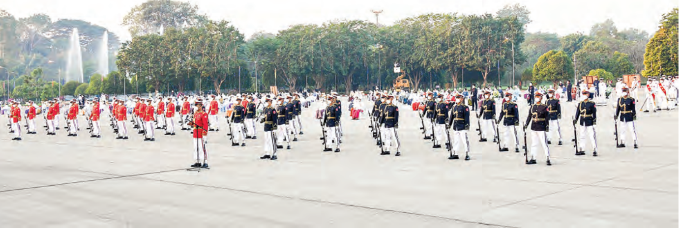
Vice-President U Myint Swe delivers the speech at the ceremony of hoisting and saluting the national flag to mark the 73 rd Independence Day in Nay Pyi Taw on 4 January 2021.