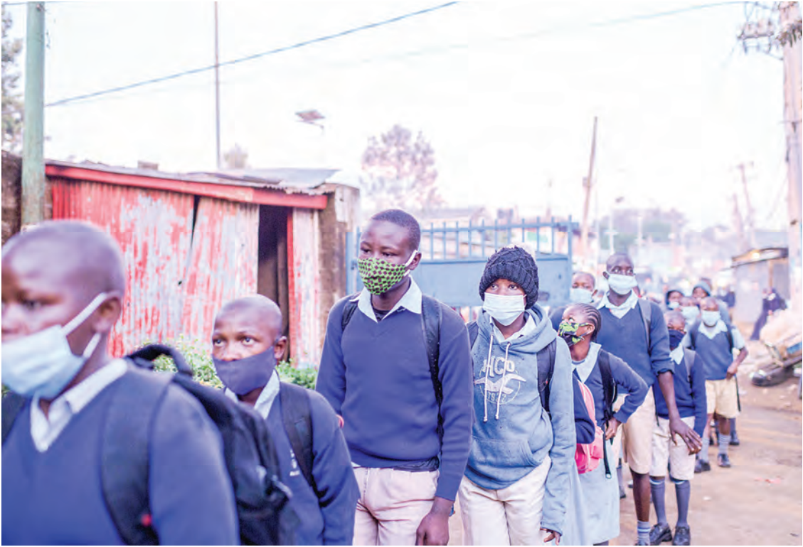
Students of Olympic Primary School wait in a line to have their temperatures measured at the entrance of the school in the early morning of the official re-opening day of public schools on January 4, 2021, in Kibera slum, Kenya, as students return to school following a nine-month closure ordered by the government in March 2020 to curb the spread of the COVID-19 coronavirus.

“We are happy to be back in school, that was a long break,” Mercy Nderi, a pupil at Kasarani