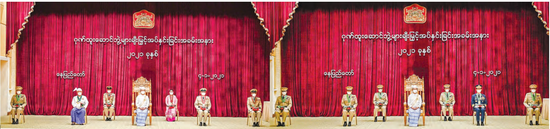
President U Win Myint and honorary title winners pose for documentary photos at the ceremony of conferring honorary titles at the Thabin Hall of the Presidential Palace in Nay Pyi Taw on 4 January 2021.