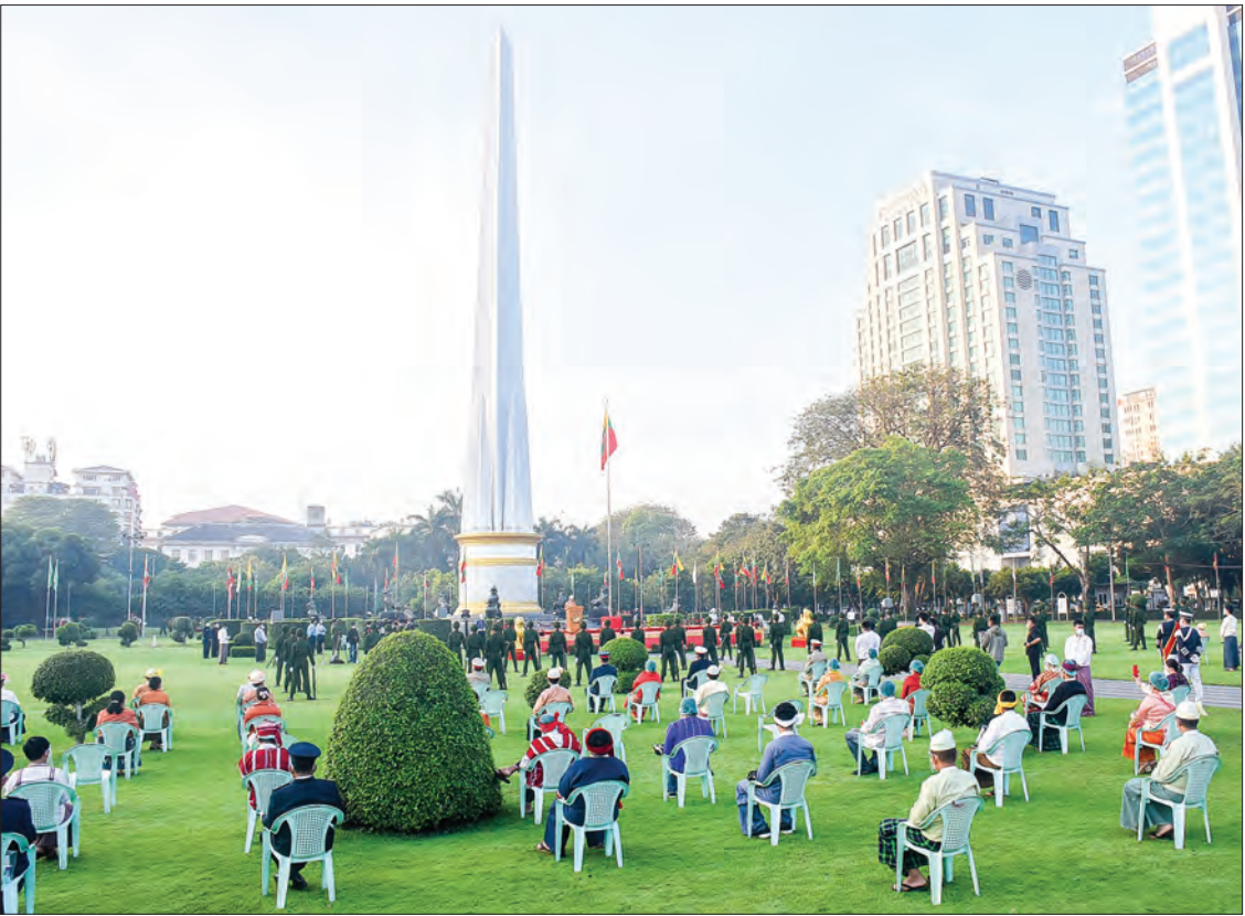
Yangon Region government organizes the flag-hoisting and saluting ceremonies to mark 73 rd Independence Day at Maha Bandoola Park in Yangon on 4 January 2021.

YANGON Government organized the flag-hoisting and saluting ceremonies to mark the 73 rd Independence Day of 2021 yesterday. The ceremonies were held at the Independence Monument in Maha Bandoola Park in line with COVID-19 preventive guidelines. Those presented at the ceremonies were Yangon Region Chief Minister U Phyo Min Thein, Region Hluttaw Speaker U Tin Maug Tun, Commander of Yangon Command Brig-Gen Nyunt Win Swe, Acting Chief Justice of Yangon Region High Court Daw Thin Thin Nwe, Regional Government Ministers, Deputy Speaker of Region Hluttaw, region advocate-general, region auditor-general, senior Tatmadaw officers, region Hluttaw MPs, representatives of national people and departmental officials. The flag hoisting platoon raised the flag at 4:20 am. At 7 am, Chief Minister of Yangon Region U Phyo Min Thein and the attendees saluted the State flag together with the Guard of Honour. The Guard of Honour also saluted the nation's fallen martyrs and soldiers, and took the four-point oath. The President's message for the 73 rd Independence Day was read by the Chief Minister at the event.—MNA (Translated by Aung Khin)