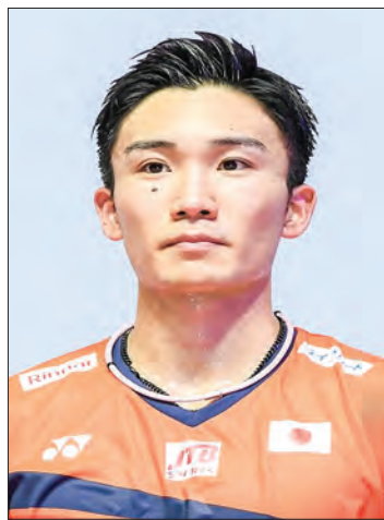
Kento Momota.

laysia Masters. Early the next morning, however, he suffered injuries when the van he was riding in was involved in a fatal crash. He did not return to competition until Japan's national championships in December, when he won his third straight men's singles title. The Yonex Thailand Open was to be his first competition abroad in a year.—Kyodo News ■