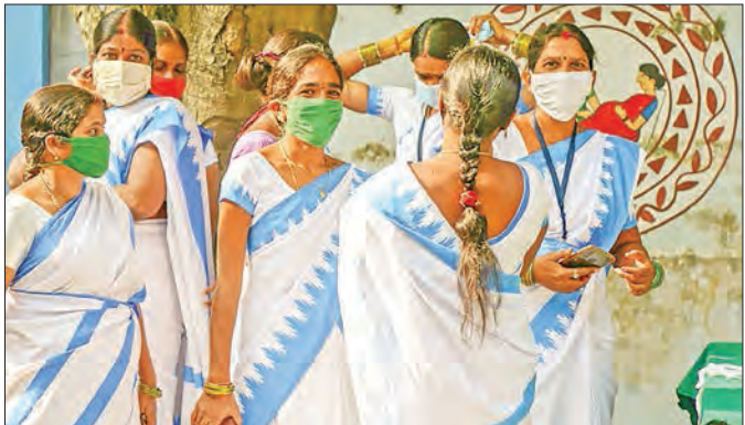
The mock drills are to check for any glitches before rolling out a national inoculation drive.