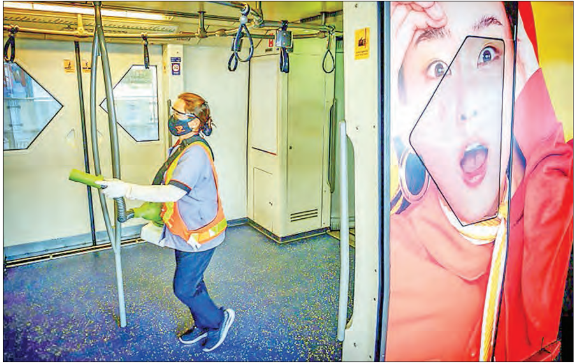
Bangkok on Saturday imposed partial lockdown measures to deal with a recent uptick in Covid-19 coronavirus cases.

Bars and nightclubs, boxing stadiums, cockfighting rings and massage parlours -- as well as