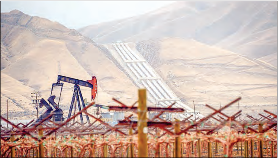
The OPEC+ ministerial meeting comes after oil consumption tanked in 2020 due to the Covid-19 pandemic and a price war between Saudi Arabia and Russia.