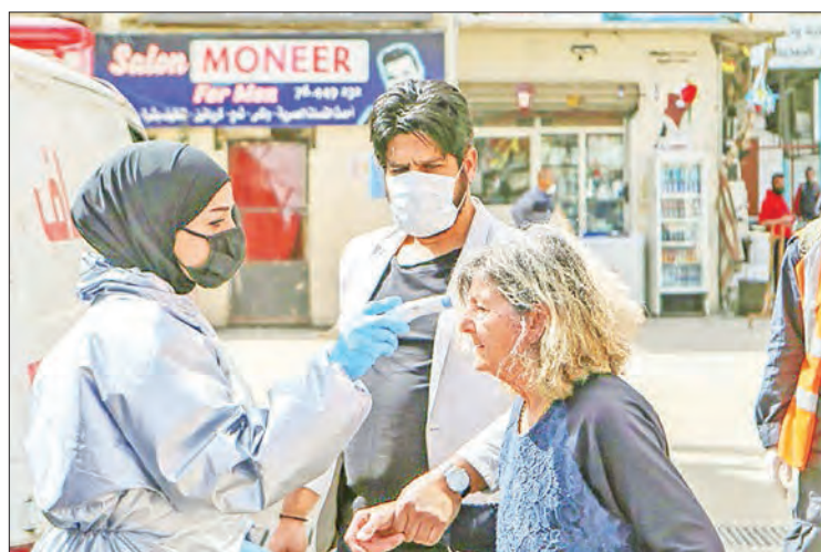
Lebanon, with a population of around six million, has recorded 183,888 coronavirus cases, including 1,466 deaths, since February.