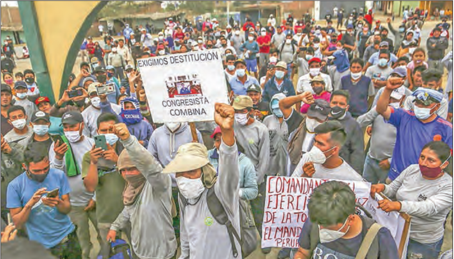
Agricultural workers protest to demand higher incomes in Viru, Peru, 510 kilometres north of the capital, Lima, on December 30, 2020.