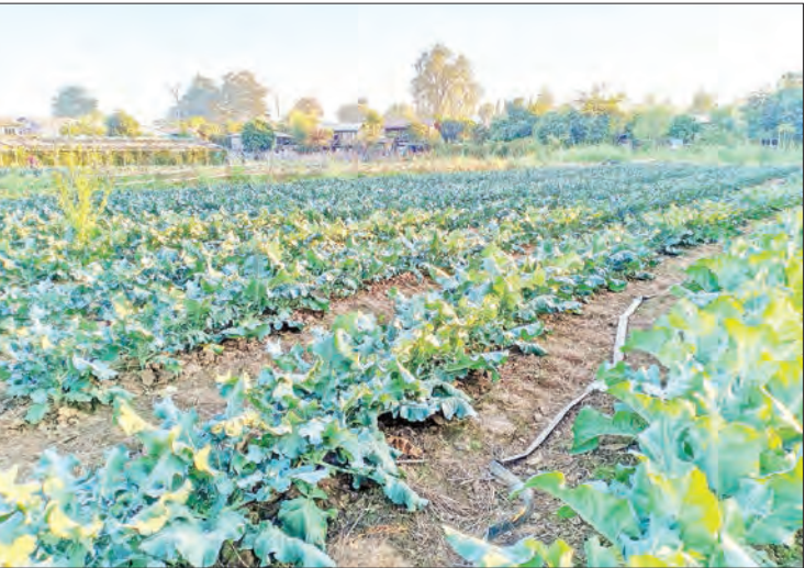
Broccoflower plants seen in Pinlebu Township.

family hired a cowherd to tend the cattle because they are old enough to do so. The cattle are usually tended from 9 am to 4 pm. They have to buy one trailer (Htawlargyi) load of straw for K35,000 when there lacks the cattle feed. The cow dung is usually used for farming as fertilizer. There are seven members in U Nyunt Hsaung's family. They usually sell ten cattle per year to cover their family costs, it is learnt. —Soe Soe Hlaing (Wetlet) (Translated by Hay Mar)