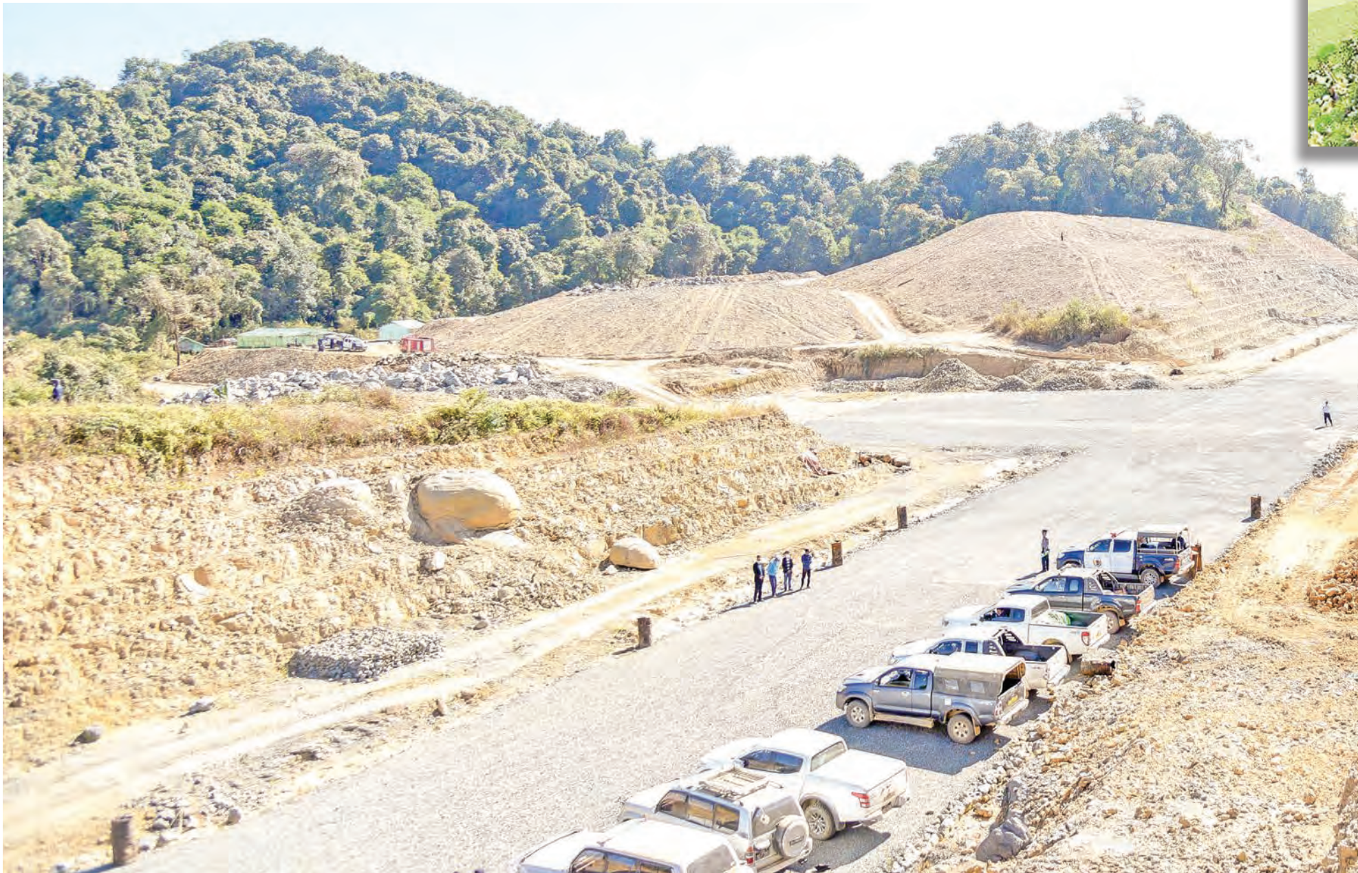
Lailenpi airstrip in Matupi Township is under construction.