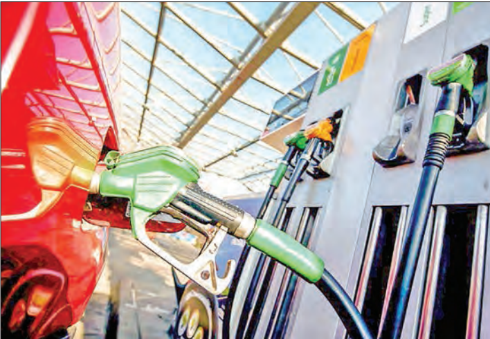
Prices for diesel and petrol are expected to rise in Germany due to the carbon tax. PHOTO: AFP/FILE

Exceptions But the flagship initiatives have drawn criticism. The 25 euro carbon price will not "make the necessary contribution" to helping Germany meet its commitments under the 2015 Paris climate pact, said Christiane Averbeck, director of the environmental group Climate Alliance Germany. SOURCE: AFP