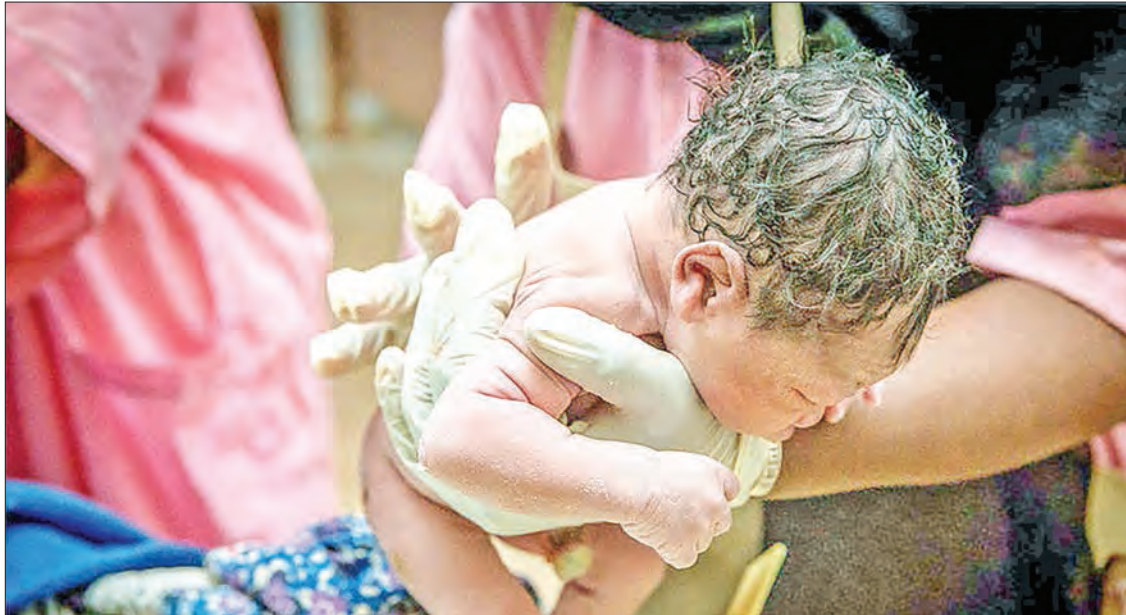
Midwife lifts one of the very first babies born in Mali in 2020 at a Health Centre in Segou, central Mali.

THE UN Children's Fund (UNICEF) said on Thursday that more than 371,500 children would be born on the first day of 2021.