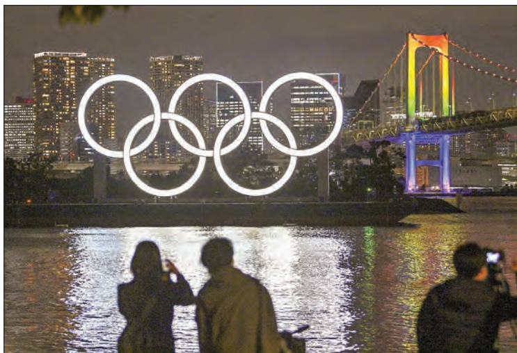
The Olympic rings glow in the dark after being reinstalled in Tokyo Bay off Odaiba Marine Park on Dec. 1, 2020, after they underwent a safety inspection and maintenance. The rings were temporarily removed in August following the Tokyo Summer Games' postponement until 2021 due to the coronavirus pandemic.

TOKYO—The Japanese prime minister and International Olympic Committee chief promised the Tokyo Games will demonstrate the world is winning the