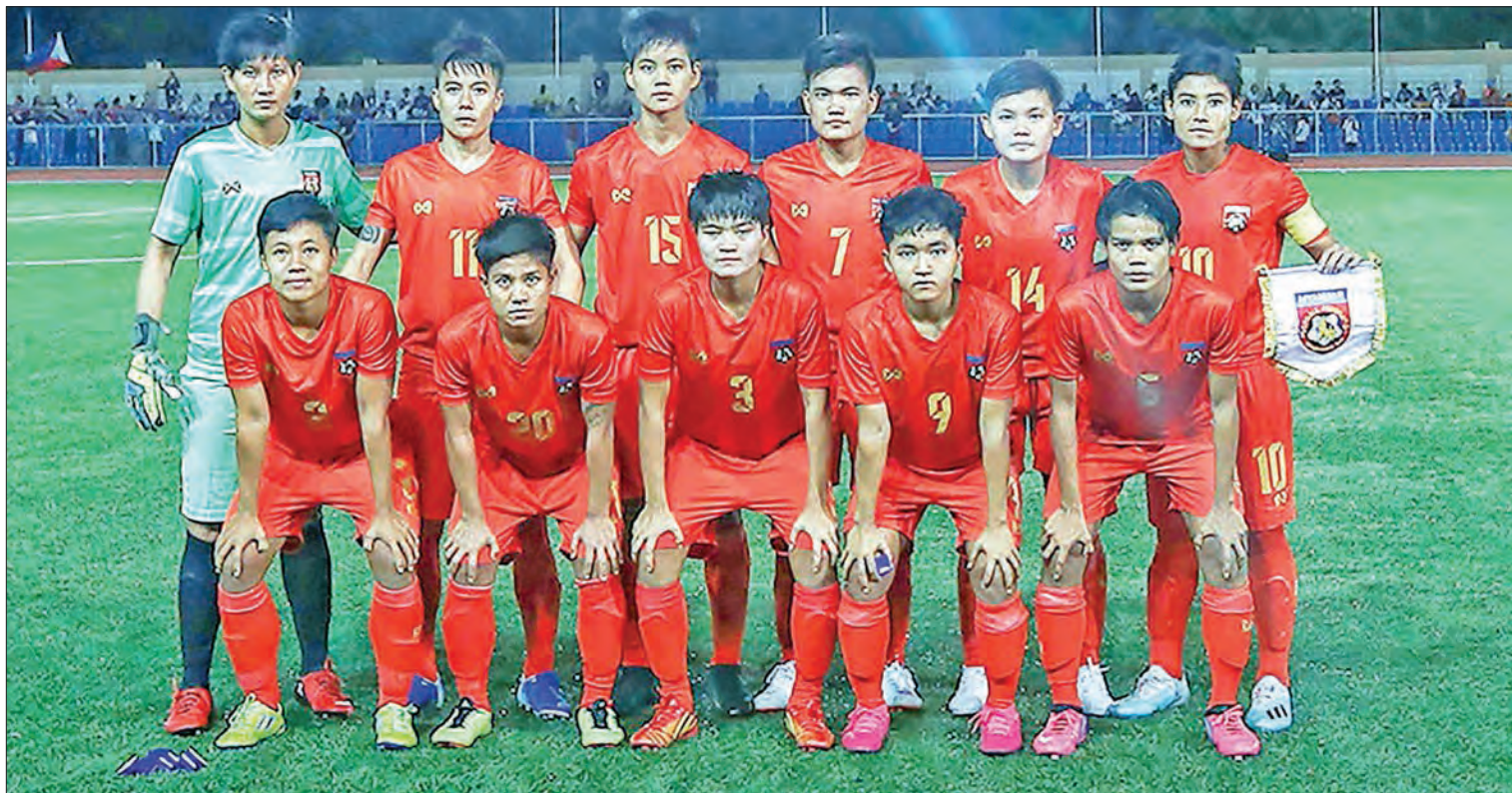
Myanmar national women's football squad seen before an international football match.

THE Myanmar women's national football team is currently among the top ten Asian teams, with standing in the Asian level and garnered 44th position in FIFA world ranking and 1,511 total points earned, according to an updated FIFA statement this month.