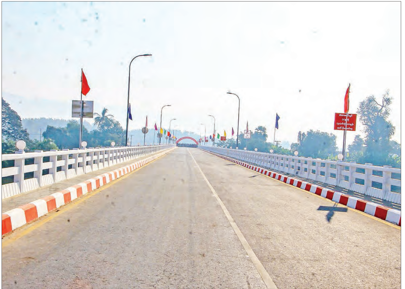
Sittoung River-Crossing Bridge was opened on 2 January 2021 in the commemoration of the 73 rd Independence Day.

The bridge is 800 ft in length, 30 ft in width, 24 ft for roadway and has a three-foot long pedestrian walkway on each side. The waterway clearance of the bridge is 28 metres (92 ft) in width and 3.7 metres (12 ft) in height. The steel truss bridge can accommodate up to HS-25. The bridge can facilitate the transport of people and develop the socio-economic, health and education sectors. The bridge is on Yedashe-Kayinchaung-Leiktoe Road and will connect Taunggoo-Leiktoe-Yardo-Hopong Road via inter-district road No (2).—Tin Soe (Bago) ( Translated by Khine Thazin Han )