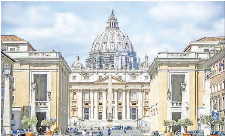
The St. Peter's Basilica (centre) in Vatican city is pictured in this May 6, 2020 photograph.

Thousands of New Year revellers packed into the centre of Wuhan, the Chinese city where Covid-19 was first detected, cheering and releasing balloons to welcome in 2021.