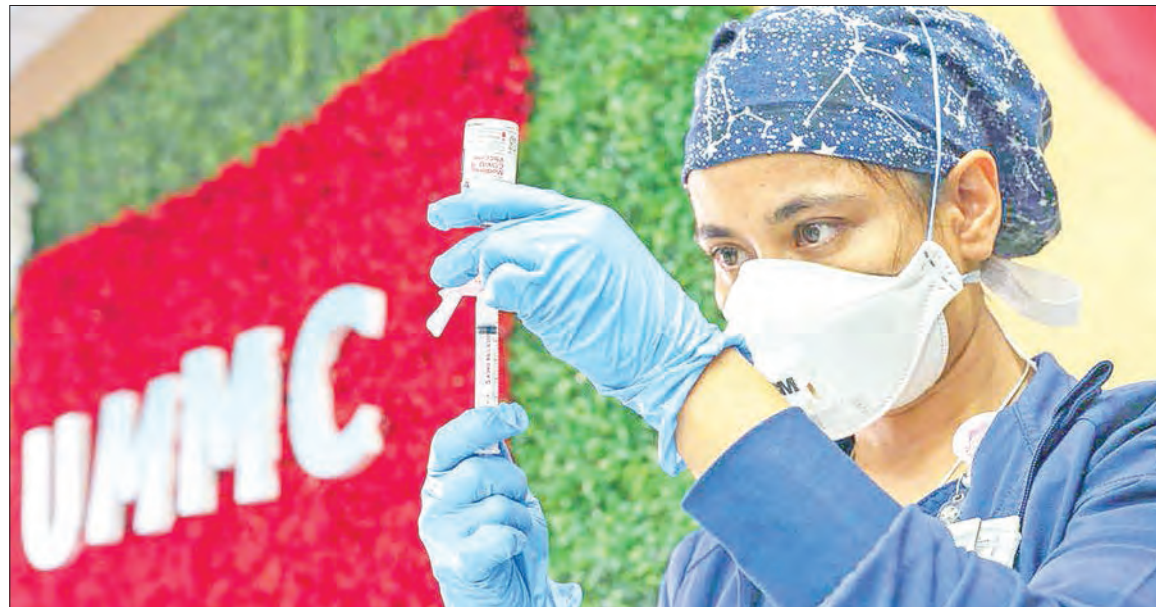
A medical staff prepares to administer the Moderna COVID-19 vaccine at the United Memorial Medical Center on 21 December, 2020 in Houston, Texas.

In the Middle East, the United Arab Emirates were the first to launch their vaccination campaign with doses of China's Sinopharm, on 14 December in the capital Abu Dhabi. Dubai started its vaccinations on 23 December, using doses of Pfizer-BioNTech.