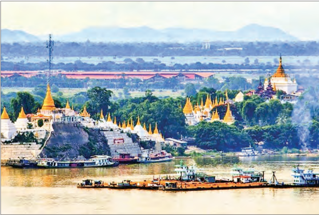
Shwe-Kyet-Yet and Shwe-Kyet-Kya Pagoda.

(Extract from a speech delivered by General Aung San on 11 February 1947 in Panglong at a dinner with Sawbwas)