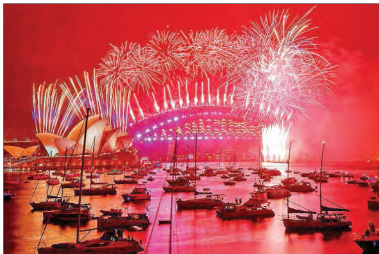
New Year's Eve fireworks erupt over Sydney's iconic Harbour Bridge and Opera House (L) during the fireworks show on 1 January 2021.

According to the latest government figures, 944,539 people in the United Kingdom had received a first dose of the Pfizer/BioNTech