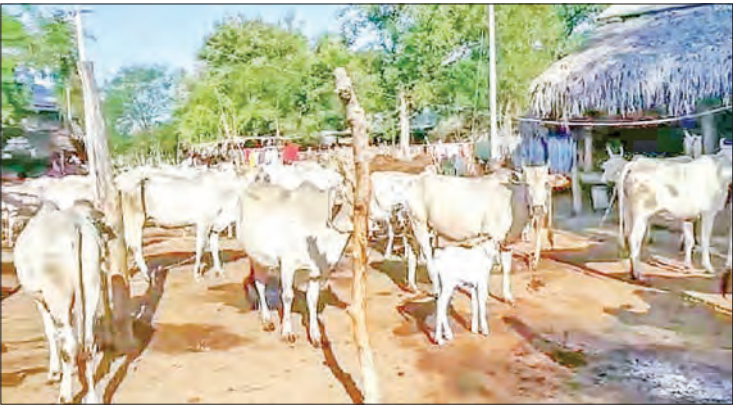
Local breeders from Wetlet Township are earning their family income from manageable scale livestock farming.

LOCAL breeders from Wetlet Township are earning their family income from manageable scale livestock farming. Forty years ago, a family led by U Nyunt Hsaung from Mingon village in Weltlet started a breeding business with milch cows with an initial investment of K1,400. Now, their family possesses 60 cattle with an increase of 10 cattle annually. They sell a small cow for K500,000 and a big one for K1 million for their livelihood. They can profit if they sell a milch cow for K1 million and a male ox for K1.5 million.