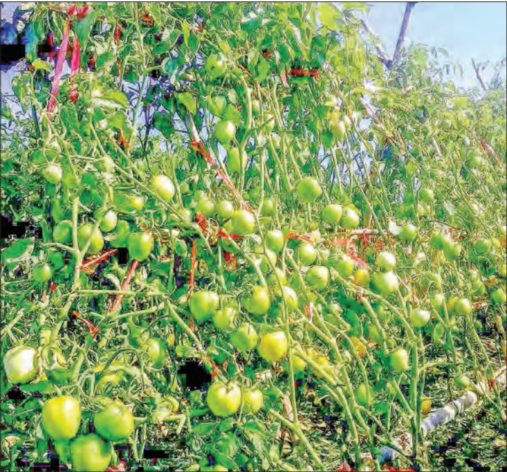
Tomato growers in Pwintbyu Township face difficulties due to the tomatoes price decline.

TAIWAN tomato growers are struggling from lower profit because of the declining price of tomatoes. However, the tomato yield is high in this season, said Ko Kyaw Zin Win, a local Taiwan tomato grower from Thet Man Yin village, Pwintbyu township, Magway region. The local people from villages near Mone Creek in Pwintbyu township are growing vegetables and crops on a commercial scale using Mone Creek water and underground water. This year, the Taiwan tomato cultivation is successful with high yield, and the local growers are picking them up to sell in the market, according to the tomato growers. "Our villagers near Mone Creek are growing the crops and vegetables annually with good use of groundwater and Mone