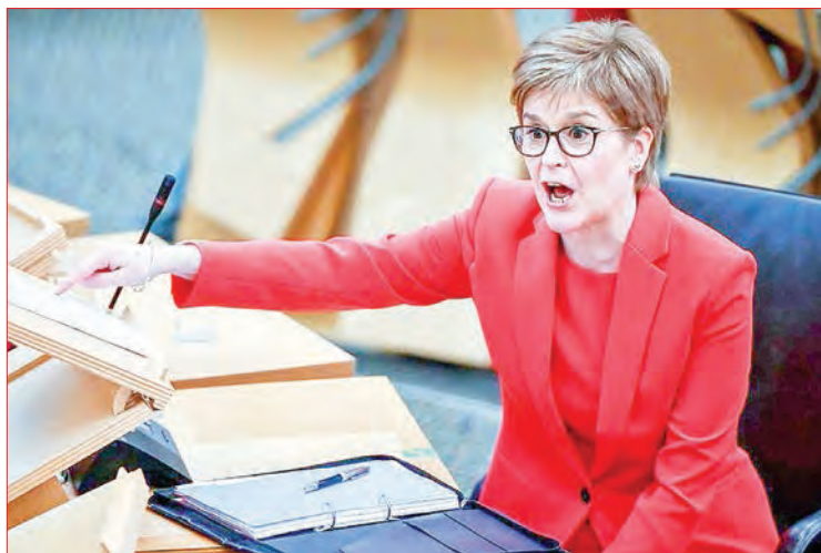
Nicola Sturgeon said 'more and more people' in Scotland favoured independence.

After losing the 2014 independence vote, Scottish National Party (SNP) leader Sturgeon is spearheading the push for another referendum and hopes to rejoin the EU should she fulfil