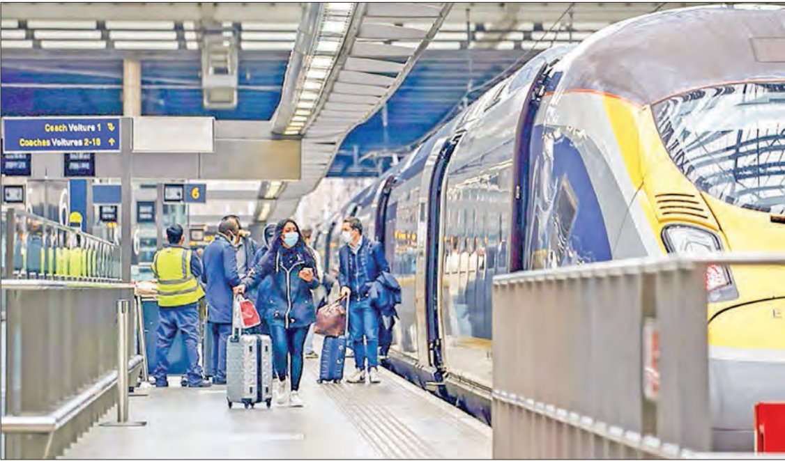
Passengers board a Eurostar train at St Pancras International station in London more than a week ago, in the runup to Britain withdrawing from the Customs union.

TRAVELLERS braving trains between London and Paris on the first day after Britain’s exit from the EU Customs union experienced additional checks