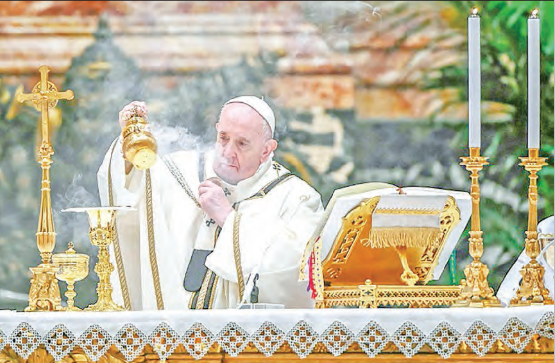
Pope Francis has told of his 'joy' and the 'miracles' of sport.

WITH a ball made from rags and surging adrenaline, the young Jorge Bergoglio and his friends pulled off "miracles" playing football in the street, Pope Francis recalled on Saturday. Now 84, the Argentine pope remembered "the joy, the happiness on everyone's faces", after the 1946 victory of his Buenos Aires team, San Lorenzo, in a 31-page interview about sport published Saturday in Italy's La Gazzetta dello Sport. The first pope from Latin America called Diego Maradona a "poet" on the field, as he weighed in on the joys of sport. Expounding on themes of hard work, sacrifice and camaraderie, Francis shared memories of the makeshift footballs that sufficed to exhilarate him and his boyhood friends. "Leather cost too much and we were poor; rubber wasn't used so much yet, but for us all we needed was a ball of rags to amuse ourselves and to create miracles, almost, playing in the little square near home,"