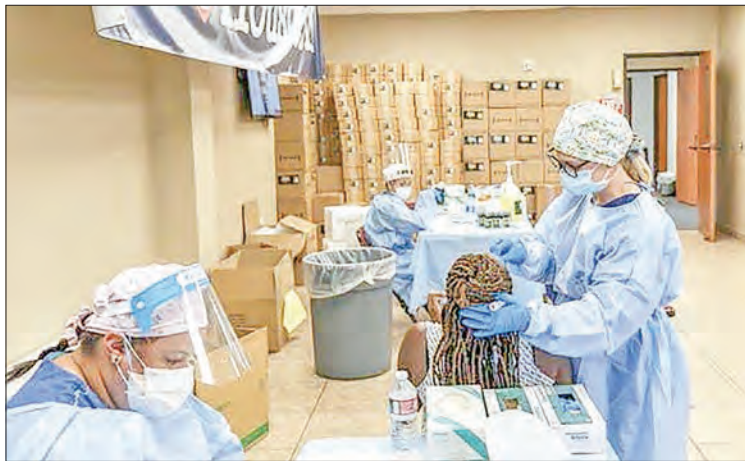
Medical workers test for coronavirus at a church in Texas, US, on July 17, 2020.

Worldwide hopes that Covid-19 vaccines will bring a rapid end to the pandemic in 2021 have been shaken by the slow start to the US vaccination programme, which has been beset by logistical problems and overstretched