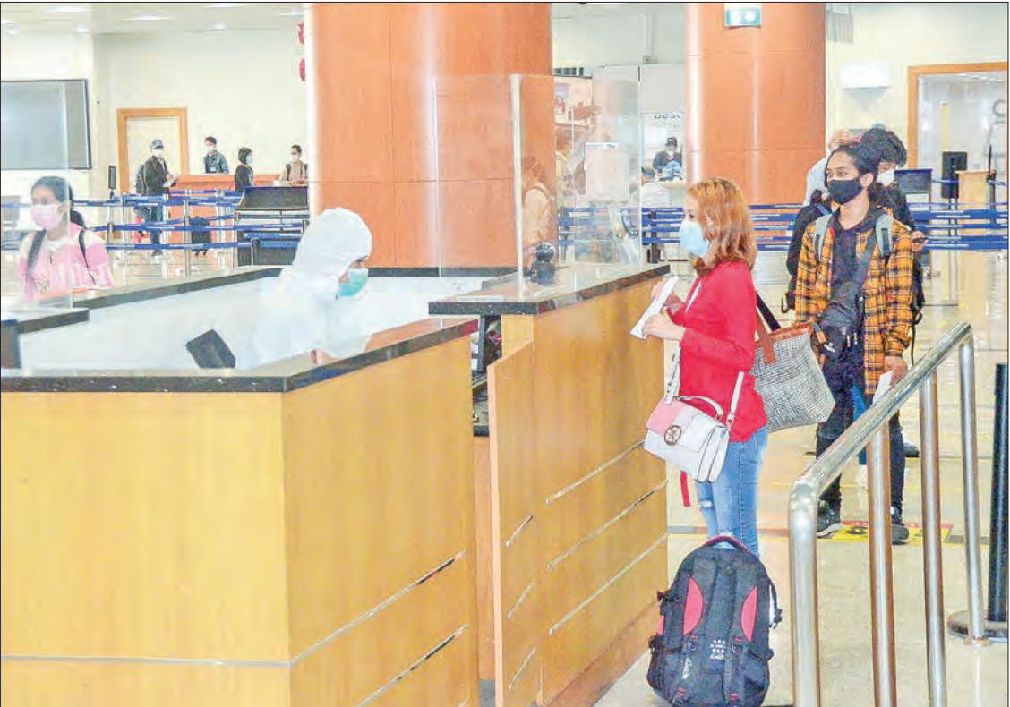
Myanmar returnees are seen at the Yangon International Airport on 2 January 2021.

home quarantine. To bring back the Myanmar citizens and Myanmar seamen who are stranded in foreign countries by relief flights and chartered flights in accordance with the instructions from National-Level Central Committee on Coronavirus Disease 2019 (COVID-19), the Ministry of Foreign Affairs cooperated with the relevant ministries and Myanmar embassies from respective countries and shipping companies. — MNA (Translated by Ei Phyu Phyu Aung)