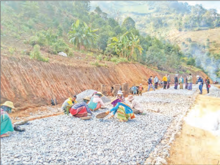
Authorities inspect the progress of Lat Taing-Pan Un road construction near Na Khaik/Na Than Village-Tract, Hsihseng Township.

THE MINISTRY of Border Affairs, Progress of Border Areas and National Races Department have been paving the Lat Taing-Pan Un road near Na Khaik/Na Than Village-Tract, Hsihseng Township, Pa-O Self-Administered Zone, with 191.647 million kyats from the Union Fund for Border Area Development in 2020-2021 financial year and about 60 per cent of the 7-mile long road is now paved. After the road is completed, it will be easier to go to Hopong Township, Pinlaung Township, Taunggyi Township and the entire Hsihseng Township as well as the convenient transportation will provide the regional economy, education, social and health development of more than 5,000 residents in 9 surrounding villages. Farmers in the area will be able to easily export their products to the market in a short period of time, which will increase incomes, improve socio-economic life, and improve urban and rural development in a short time due to the improved transport links.— Nay Min Tun (Hopong) (Translated by Ei Phyu Phyu Aung)