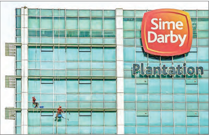
Sime Darby Plantation has faced allegations that its workers on palm oil estates are abused. PHOTO: AFP/FILE

workers on plantations face abuse, and also blame the industry for driving destruction of rainforests to make way for the vast agricultural estates. Announcing the ban late Wednesday, US Customs and Border Protection (CBP) said there was evidence Sime Darby workers face abuses including sexual and physical violence, withholding of wages and restrictions on movement. The ban "demonstrates how essential it is for Americans to research the origins of the everyday products that they purchase," said CBP acting commissioner Mark A. Morgan. SOURCE: AFP