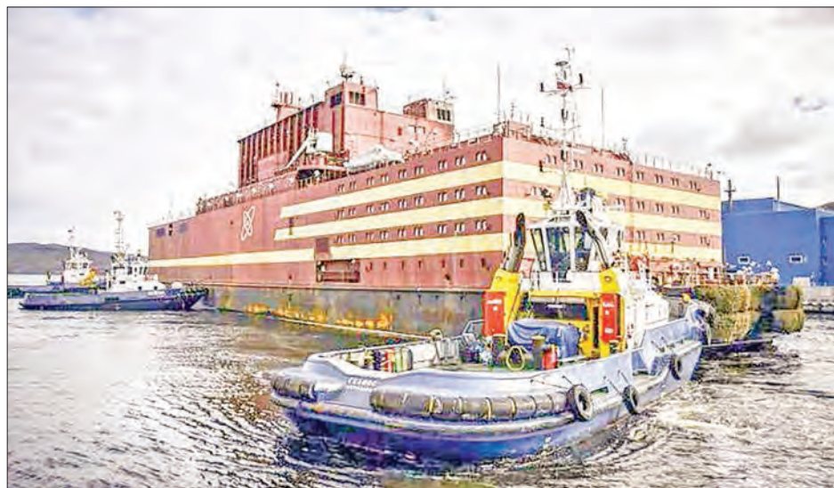
Akademik Lomonosov is a non-self-propelled power barge that operates as the first Russian floating nuclear power station.

RUSSIAN nuclear power plants (NPPs) generated over 215.746 billion kWh of electricity in 2020, an all-time high beating the annual record during the Soviet era, said Russia's sole national operating enterprise of NPPs Rosenergoatom on Friday. The annual output of Soviet NPPs, including those in Ukraine, Lithuania and Armenia, reached its peak in 1988 with 215.669 billion kWh of electricity, Rosenergoatom said.