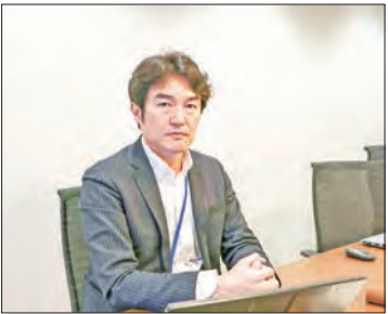
Yasuyuki Shimizu, representative director of the Japan Suicide Countermeasures Promotion Centre, gives an interview in Tokyo on Dec. 9, 2020.

“The anxieties or problems women tend to face have likely worsened during the pandemic,” Shimizu said, with factors such as mental illness, finan-