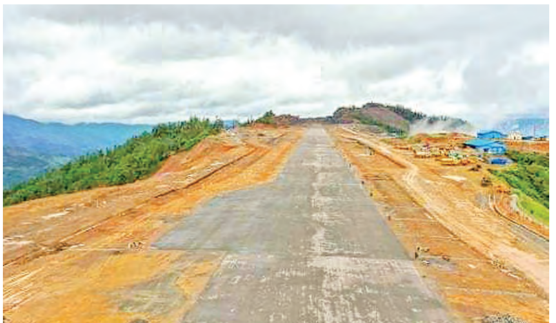
Runway of Lailenpi airstrip.

In fact, Chin State having plentiful of natural beauties is an origin of natural resources which can help develop the tourism