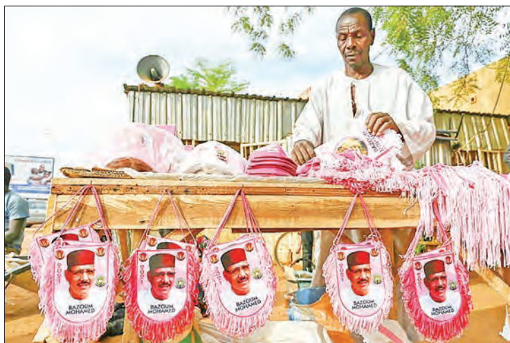
Bazoum campaigned on promises of improved security and education.

Bazoum, who has been both interior and foreign minister, campaigned on promises of improved security and education.