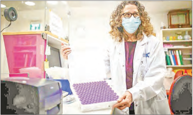
A nurse holds coronavirus vaccine doses as they arrive at Shaare Zedek Medical Centre in Jerusalem on December 19, 2020.