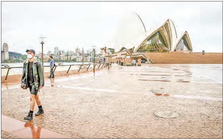
Australia's performing arts industry has been hit hard by the virus, but performances at the Sydney Opera House are due to restart this week.

But even as the performers readied for their opening night, an outbreak in the city forced officials to tighten restrictions -- including a new mandate on mask-wearing on public transport and in many indoor settings from midnight Saturday. The outbreak of over 180 cases first emerged in December in Sydney's northeast but has since sparked other clusters, including in Melbourne. Areas of Sydney remain under lockdown and of-