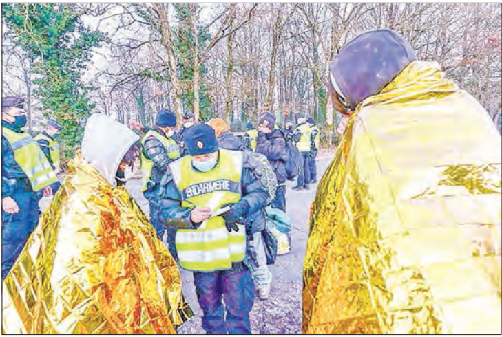
Police were checking all those leaving the site.

REVELLERS early Saturday began leaving an illegal New Year rave in northwestern France that drew some 2,500 people, led to clashes with police