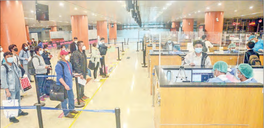
Myanmar returnees are seen at the Yangon International Airport on 31 December 2020.

THE 17th relief flight of All Nippon Airways (ANA) organized by the Myanmar Embassy in Tokyo landed at Yangon International Airport bringing back a total of 155 Myanmar Nationals after they were stranded in Japan due to the suspension of international flights yesterday evening. The Ministry of Labour, Immigration and Population, the Ministry of Health and Sports and the Yangon Region government arranged 7-day quarantine at specific places or designated hotels, followed by the 7-day home quarantine. To bring back the Myanmar citizens and Myanmar seamen who are stranded in foreign countries by relief flights and chartered flights in accordance