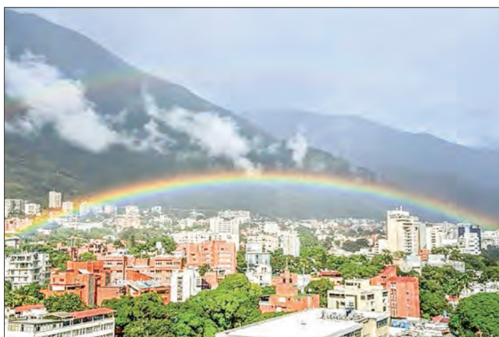
A rainbow is seen on December 22, 2020 over Caracas, where a Venezuelan court has angered the United States by jailing six former oil executives with US nationality or residency.

The two were behind a trial last month in which six former executives from Citgo, the US-based subsidiary of Venezuelan state oil company PDVSA, were handed prison terms.