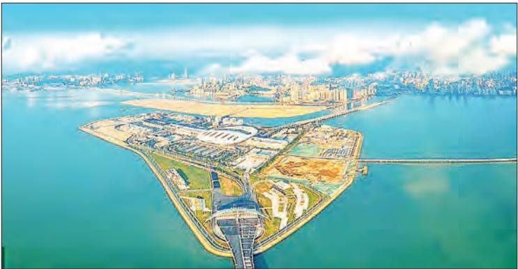
China will build the Greater Bay Area into a habitable, entrepreneur-friendly area and a tourist destination with a flourishing cultural industry. PHOTO: XINHUA CHINA has recently rolled out a comprehensive development plan on the cultural and tourism development for the Guangdong-Hong Kong-Macau Greater Bay Area, said the Ministry of Culture and Tourism. The country will build the Greater Bay Area into a habitable, entrepreneur-friendly area

and a tourist destination with a flourishing cultural industry. The plan projected that by the year 2035, the area’s tourism and cultural sectors will realize high-quality development, and it will boast greater cultural soft power and higher tourism competitiveness. The plan also emphasized the promotion of national history and culture and the need to beef up patriotic education among the youth in the area. The plan was jointly issued by the ministry, the office of the leading group for the development of the Greater Bay Area, and the Guangdong Provincial People’s Government. SOURCE: AFP