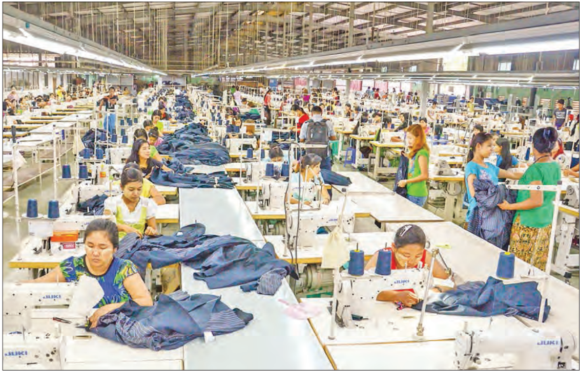
(FILES) Women work on the production line of a garment factory in Hlinethaya Township, Yangon Region, before the coronavirus outbreak in Myanmar.

dollar in the auction market to keep the exchange rate stable. This year, the exchange rate moves in the range of K1,465-1,493 in January, K1,436-1,465 in February, K1,320-1,445 in March, K1,395-1,440 in April, K1,406-1,426 in May, K1,385-1,412 in June, K1,367-1,410 in July and K1,335-1,390 in August. Last year, the rates are pegged at K1,508-1,517 in July, K1,510-1,526 in August, K1,527-1,565 in September, K1,528-1,537 in October, K1,510-1,524 in November and K1,485-1,513 in December. In 2019, the rates are fixed at K1,508-1,517 in July, K1,510-1,526 in August, K1,527-1,565 in September, K1,528-1,537 in October, K1,510-1,524 in November and K1,485-1,513 in December. On 20 September 2018, the dollar exchange rate hit an all-time high of K1,650 in the local currency market. (Translated by Hay Mar)