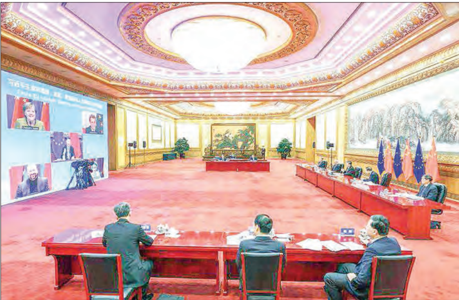
Chinese President Xi Jinping meets German Chancellor Angela Merkel, French President Emmanuel Macron, President of the European Council Charles Michel and President of the European Commission Ursula von der Leyen via video link in Beijing, capital of China, Dec. 30, 2020.

CHINESE President Xi Jinping and European leaders on Wednesday announced that the two sides have completed investment agreement negotiations as