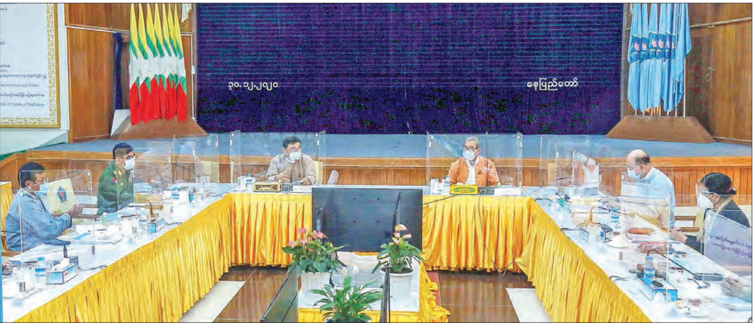
Committee on Implementing the Recommendations on Rakhine State holds meeting over its review report (draft) in Nay Pyi Taw on 31 December 2020 .

We appreciate your feedback and contributions. If you have any comments or would like to submit editorials, analyses or reports please email aungthuya@gnlm.com.mm with your name and title. Due to limitation of space we are only able to publish "Letter to the Editor" that do not exceed 500 words. Should you submit a text longer than 500 words please be aware that your letter will be edited.