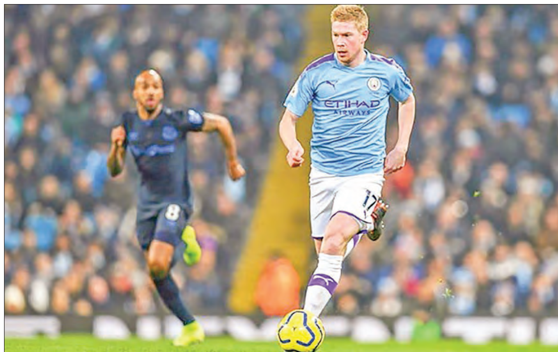
After two fixtures were postponed due to COVID-19, English Premier League (EPL) on Wednesday said they are not planning to pause the season and will play matches as per the scheduled.

The Premier League Board has consulted its medical advisors and the decision to postpone the game has been taken as a precaution and with the health of players and staff as the priority.— ANI ■