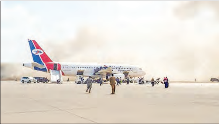
Smoke billows at the Aden Airport on December 30, 2020, after explosions rocked the Yemeni airport shortly after the arrival of a plane carrying members of a new unity government.

Yemen’s new power-sharing government vowed on Thursday to bring stability to the war-torn country, a day after deadly blasts rocked Aden airport in an attack