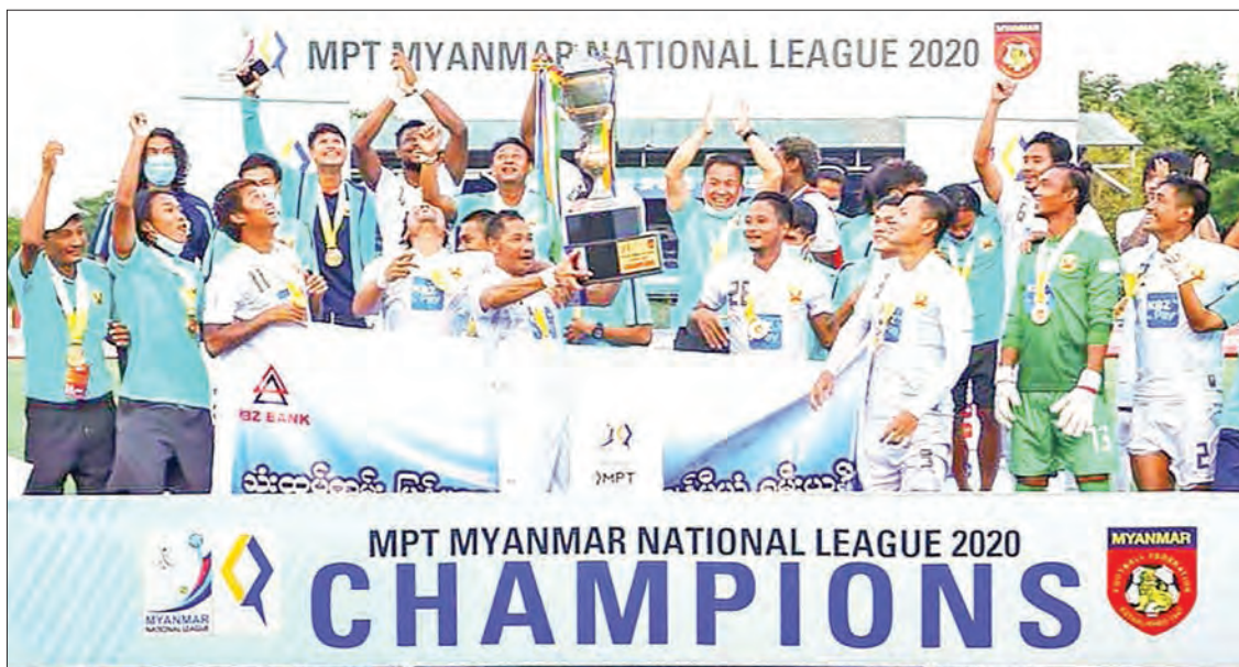
Myanmar possesses 15 licenced clubs including Shan United, the defending champions of the Myanmar National League to compete in the AFC tourneys.

“This record was made possible by the joint efforts of the