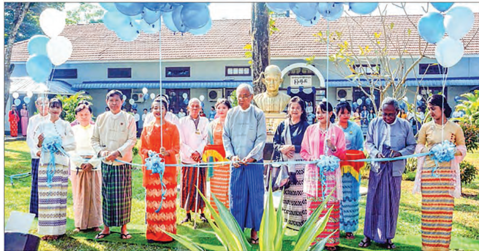
Former President U Htin Kyaw, Union Minister Dr Myo Thein Gyi cut ribbon to open a statue of U Pe Maung Tin at the Yangon University in Yangon on 20 December, 2019.