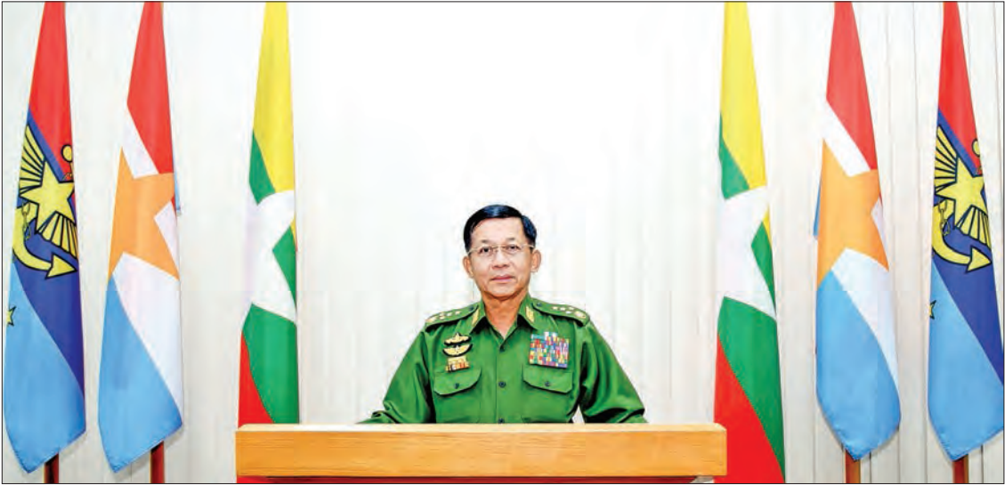
Commander-in-Chief of Defence Services Senior General Min Aung Hlaing

Although the number of COVID-19 cases has declined in the country, constant vigilance is still needed. Strict adherence