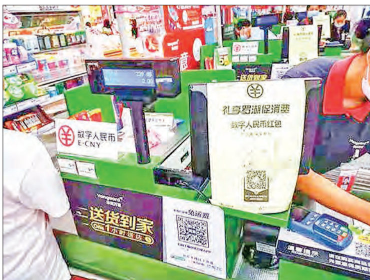
Photo taken on Oct. 12, 2020 shows a sign reminding customers that digital yuan is accepted at a supermarket in Shenzhen, Guangdong Province.

In the eastern Chinese city of Suzhou, a resident surnamed Lu bought some snacks at a basement store in Tianhong Shopping Mall using digital yuan. She transferred 66.6 yuan (about 10.21 U.S. dollars) from her digital wallet to the vendor's account, although both mobile phones were offline. Lu was one of the 100,000 lucky residents of Suzhou