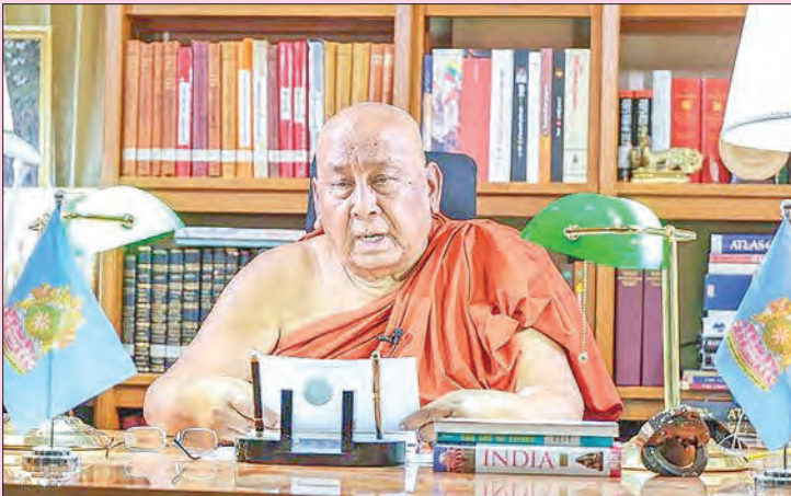
Sitagu Sayadaw Ashin Nyanissara

HOW to live in life, like swim- ming across a sea Life is very wide and deep with full of storms and tidal waves. Life is like a sea. If someone is not in motion or is unable to swim, it is not sure to avoid sinking or floating. • Continuous effort must be made in swimming to reach the shore. • It is needed to know ‘swimology’. • ‘Swimology’ must be learnt. • Swimming skill is required.