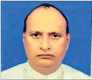
Dr Hla Tun

and to be "the most developed nation in Southeast Asia from the poorest one" after building a democratic system, welcoming the day faiths play a central role in peace and reconciliation processes, and sharing resources with equal and transparent manners.