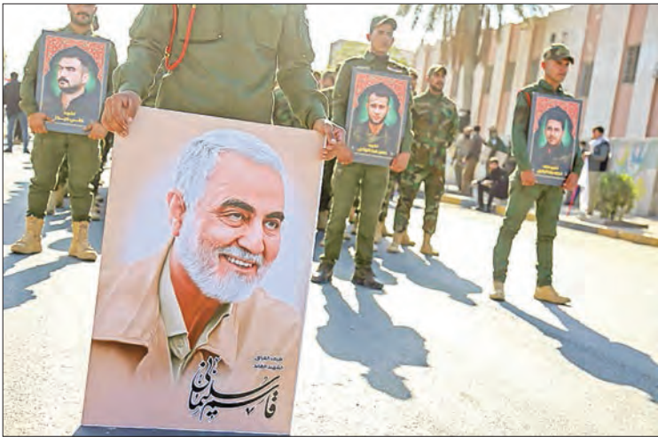
A member of the Hashed al-Shaabi, an Iraqi paramilitary network dominated by Iran-backed factions, carries a portrait of Soleimani.

Iraq’s Prime Minister Mustafa al-Kadhemi, who took office in May, has recently endured blistering threats from the powerful pro-Iranian paramilitary groups which Washington blames for the rocket attacks. Security sources say tensions flared after the arrest