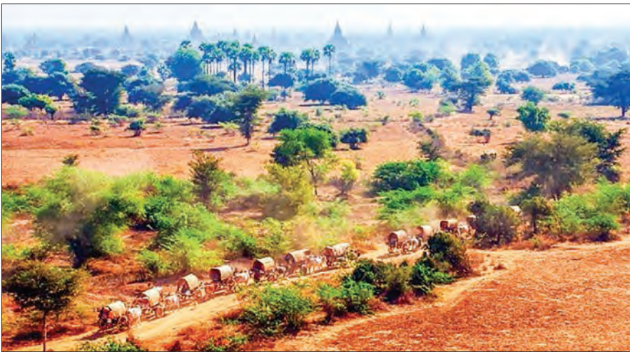
Landscape of Bagan Cultural Heritage Zone.

(Extract from the Message of Greetings sent by President U Win Myint on 4 January 2020 on the occasion of the 72 nd Anniversary of Independence Day.)