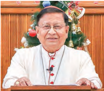
Cardinal Charles Maung Bo

Let us visualize emerge of a peaceful nation after having justice in economic and environmental affairs of Myanmar. Let us visualize that displaced persons return to their natives with dignity. Let us visualize together to be Myanmar "Golden Country"