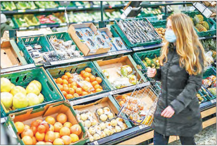
Tesco supermarket said the new administrative costs would hardly raise prices. of the Food and Drink Federation, said “last week’s chaos at Dover and the last-gasp nature of this deal means that there will be significant disruption to supply and some prices will rise”.