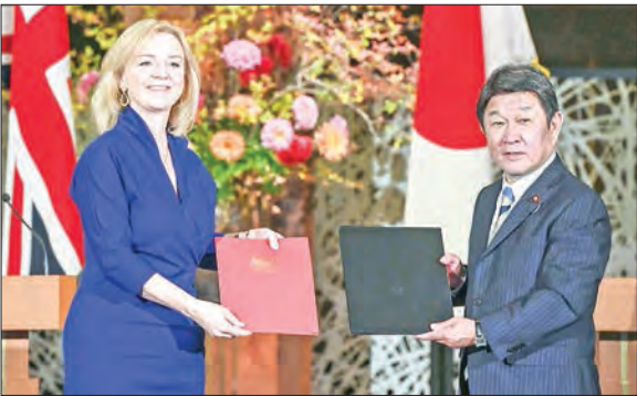
Japan and the United Kingdom signed a post-Brexit bilateral free trade agreement Friday, paving the way for its implementation Jan. 1 2021. Foreign Minister Toshimitsu Motegi (R) and British International Trade Secretary Liz Truss.

BREXIT becomes a reality on Thursday as Britain leaves Europe's customs union and single market, ending nearly half a century of often turbulent ties with its closest neighbours.