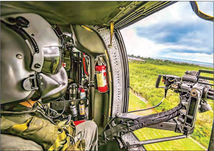
In 2019 1,137 tonnes of cocaine were produced in Colombia.

(AAH), a faction of the Hashed al-Shaabi paramilitary network.