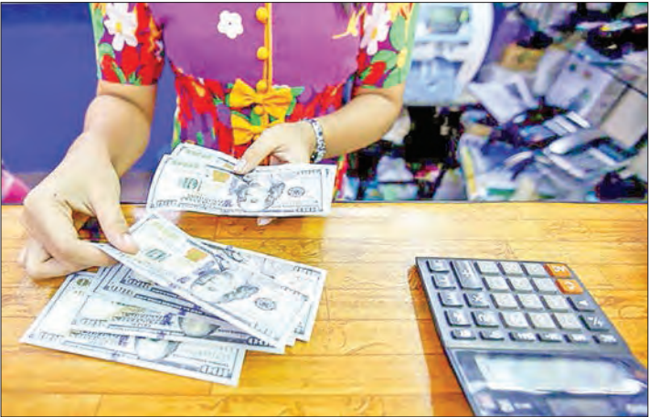
(FILES) A woman counts US dollar.

turing sector, followed by other services, hotels, and tourism sectors. The manufacturing sector has attracted the most foreign investments in Yangon Region, with enterprises engaging in pharmaceuticals, vehicles, container boxes, and garments on a Cutting, Making, and Packing (CMP) basis. To date, foreign investments from China, Singapore, Japan, Hong Kong, the Republic of Korea, Viet Nam, India, China (Taipei), Malaysia, the British Virgin Islands, and Seychelles arrive in the region. To simplify the verification of investment projects, the Myanmar Investment Law allows the region and state Investment Committees to grant permissions for local and foreign proposals if the initial investment does not exceed K6 billion, or $5 million.— GNLM (Translated by Ei Myat Mon)