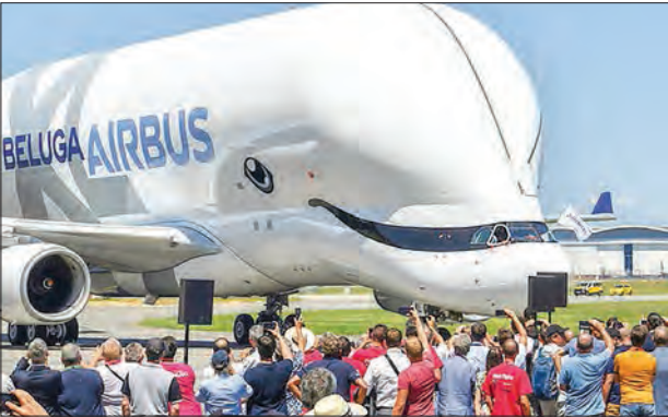
Airbus's massive new cargo plane that looks like a whale.

The tariffs are on "aircraft manufacturing parts from France and Germany, certain non-sparkling wine from France and Germany, and certain cognac and other grape brandies from France and Germany",