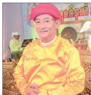
Comedian Oak Aww