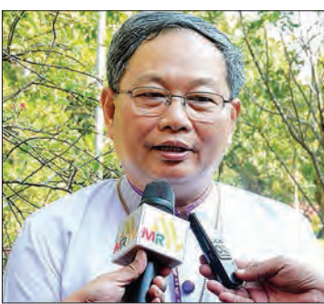
Stephen Than Myint Oo

and to be "the most developed nation in Southeast Asia from the poorest one" after building a democratic system, welcoming the day faiths play a central role in peace and reconciliation processes, and sharing resources with equal and transparent manners.