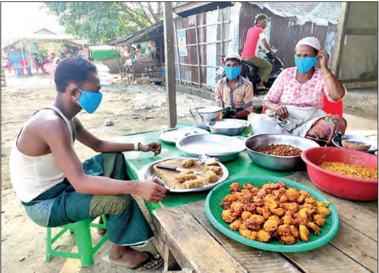
People seen in face masks to prevent COVID-19 in market place in Rakhine.