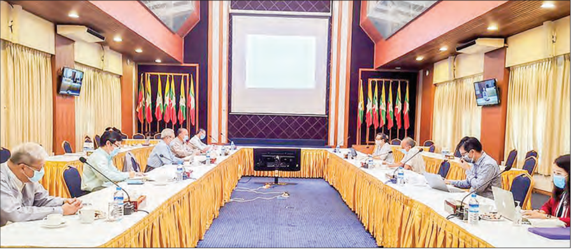
Representatives of government and ethnic armed groups in NCA discuss COVID-19 measure plans.