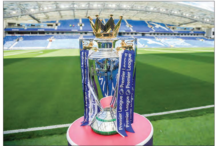
The head of the English PFA has suggested shorter games could limit the physical impact on players if the season can be restarted.

LONDON — The head of the English Professional Footballers' Association (PFA) has raised the possibility of playing shorter matches to lighten the load on players if the season can restart.