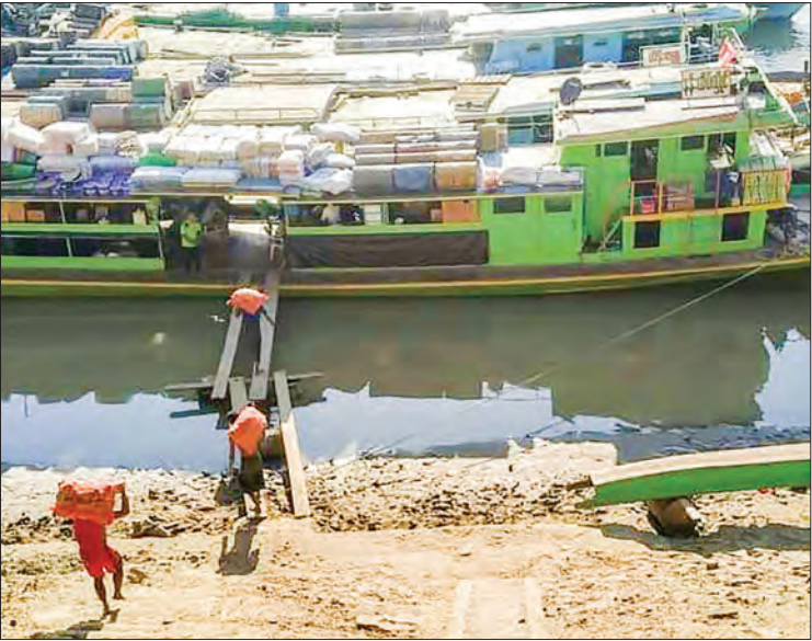
Commodities are being loaded onto a cargo vessel in Chindwin River.

Although the passenger ferries have been suspended temporarily, the cargo vessels have been allowed to operate