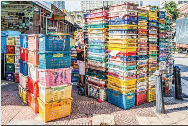
Malaysia’s government is trying to blunt the economic impact of the coronavirus pandemic with billions of dollars in stimulus measures.

Malaysia’s outbreak has been small — it has recorded about 6,000 cases and 100 deaths — but the prime minister has said the curbs have so far cost the economy 63 billion ring-