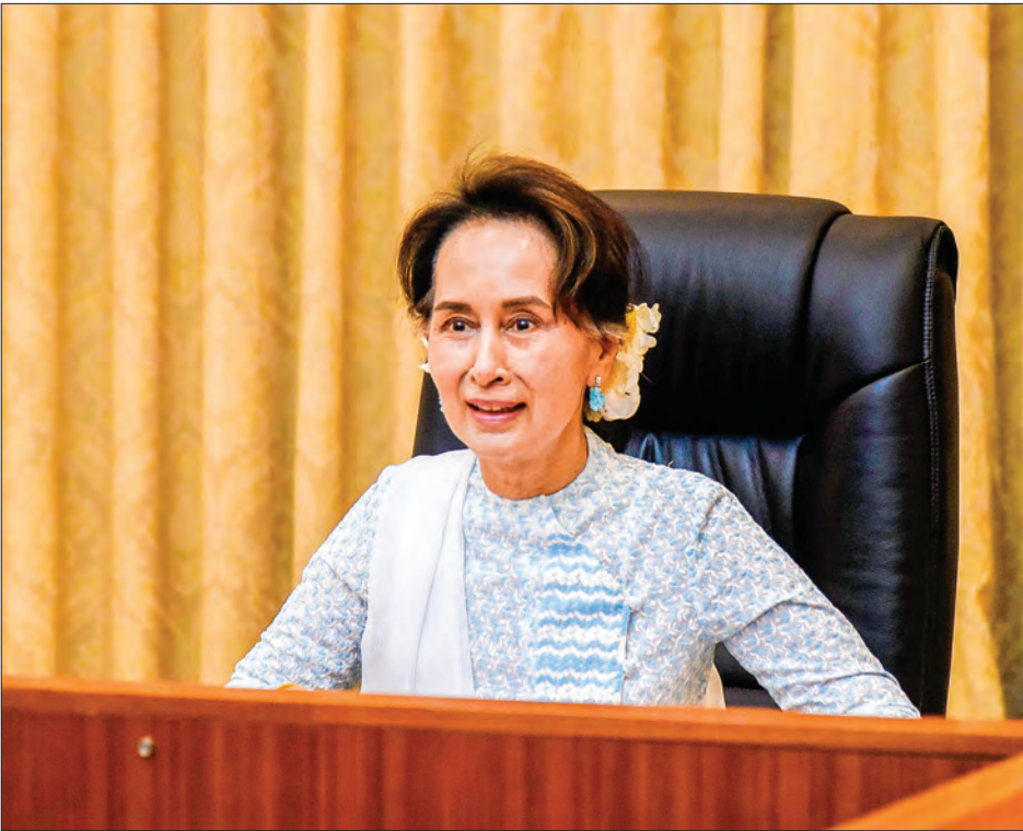
State Counsellor Daw Aung San Suu Kyi holds the video conference with chief ministers from Kayin, Taninthayi and Mon.

S TATE Counsellor Daw Aung San Suu Kyi, in her capacity as Chairperson of the National Central Committee for COVID-19 Prevention, Control and Treatment, held a video conference yesterday from the Presidential Palace in Nay Pyi Taw with chief ministers of Kayin State, Mon State and Taninthayi region. First, the State Counsellor said the aim of the meeting was to discuss the return of Myanmar migrants from the border; some expected the number of returnees would be about 150,000, while others estimated the number to be 70,000 or 80,000; at present migrant workers have not yet returned in bulk, and that it was a relief for the country; communications and cooperation with the Thai government seem to be good; Kayin State plays a crucial role in this programme as most of the migrant workers have come back home through the Myawady border crossing before heading to the respective regions, while some of them returned through the Taninthayi Region. Kayin State's Chief Minister Daw Nann Khin Htway Myint discussed the sit-