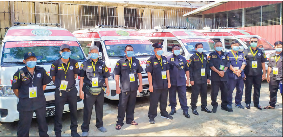
Myanmar Rescue Team seen on stanby to transport COVID-19 patients to Phaung Gyi.

We appreciate your feedback and contributions. If you have any comments or would like to submit editorials, analyses or reports please email ce@globalnewlightofmyanmar.com with your name and title. Due to limitation of space we are only able to publish "Letter to the Editor" that do not exceed 500 words. Should you submit a text longer than 500 words please be aware that your letter will be edited.