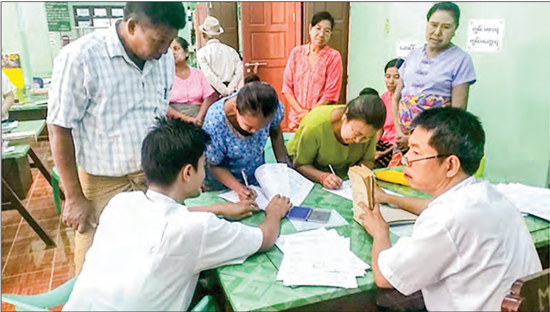
The Myanma Agricultural Development Bank (Amarapura Branch) granting agricultural loans to farmers in 2019.