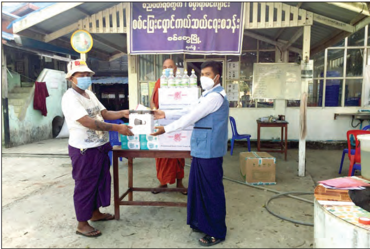
An official presents medical supply to an IDP in Sittway.

programmes for rules and guidelines through hand speakers and loud speakers, distribution of soaps, transfers of suspected patients and closely contact persons and drawing flow charts to the referred places.