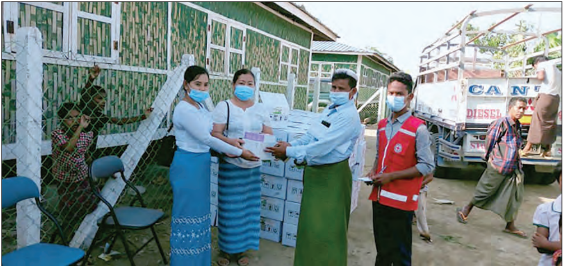
Healthcare items handed over at an IDP camp in Rakhine.