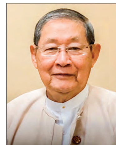
U Soe Win, Union Minister, Ministry of Planning, Finance and Industry

Myanma Economic Bank is providing loans to MSMEs on "Two Step Loan" with (8) per cent interest, while the funds from the public savings have