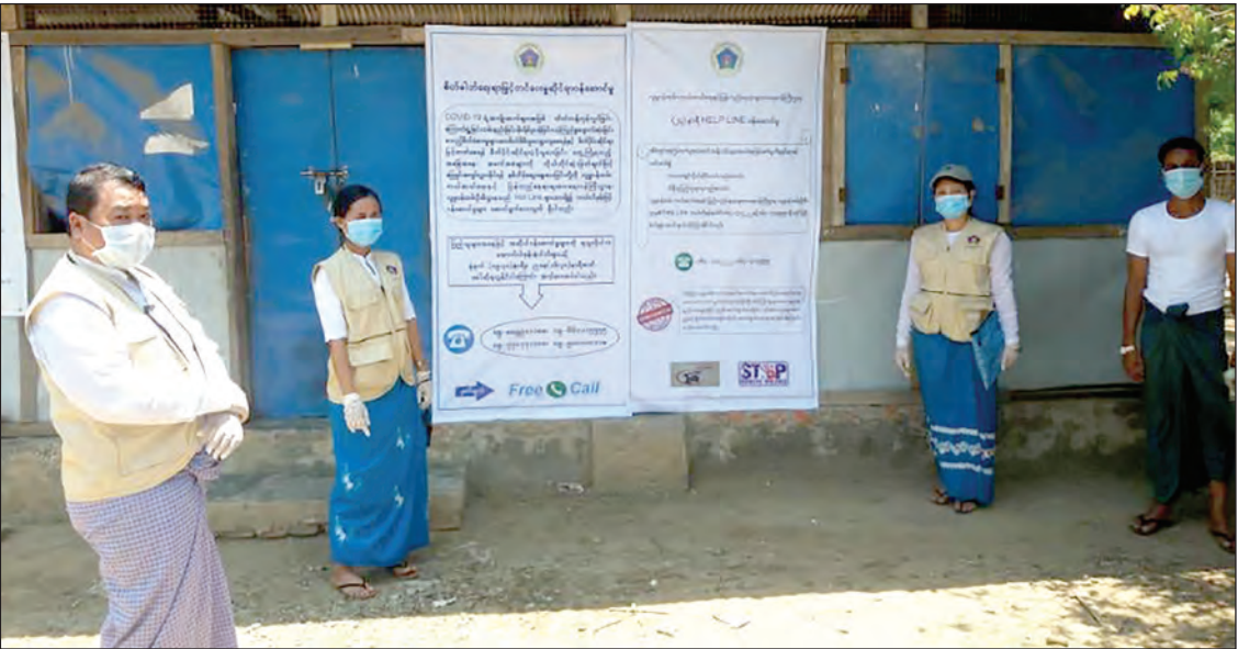
Officials seen with awareness campaign vinyl posters in Rakhine.

The ministry is working together with local governments, relevant ministries, international organizations, local civil societies and well-wishers to provide humanitarian aid to these camps and has adopted preparatory plans to prevent transmission of COVID-19 diseases among the internally displaced persons. In line with the plan, dissemination of information, awareness