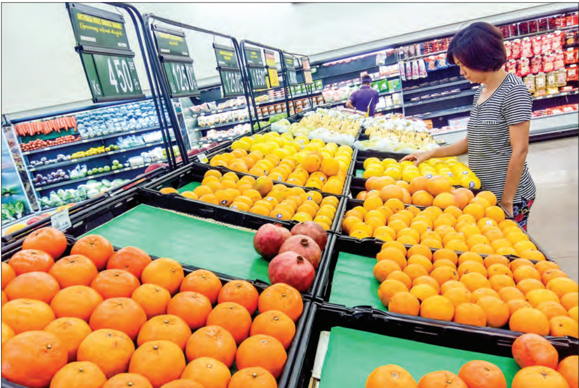
A woman buying fresh fruits in a supermarket.