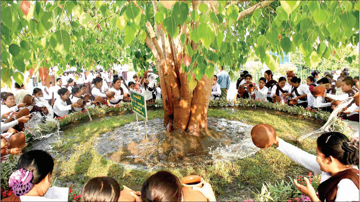
Buddhist devotees water the Bo Tree at Uppatasanti Pagoda in Nay Pyi Taw to mark Buddha Day which falls on the Fullmoon of Kasone.

Fullmoon Day of Kasone [May] is Buddha's Day which is observed and celebrated by all Buddhist countries and Buddhists as Vesak Day. In Myanmar this day is celebrated by communal pouring of water on sacred Bodhi Tree initiated by performant of religious rites by Sanghas [ a group of Buddhist monks] and followed by groups of water pouring people on sacred Bodhi Tree [Bannyan Tree] or Nyaung bin. Bannyan Tree [Nyuaung bin]