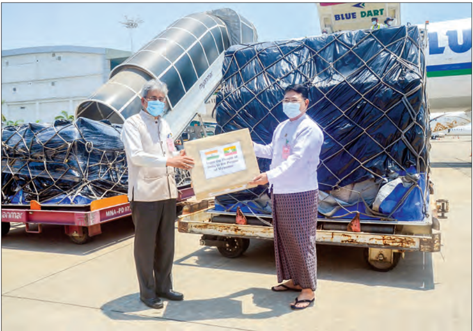
Indian ambassador hands over medical supplies of COVID-19 for Myanmar at Yangon International Airport.