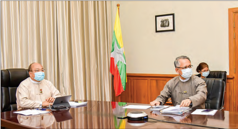
Union Minister for Investment and Foreign Economic Relations U Thaung Tun presides over fourth meeting of the Working Committee yesterday to address the impact of COVID-19 on the country's economy.