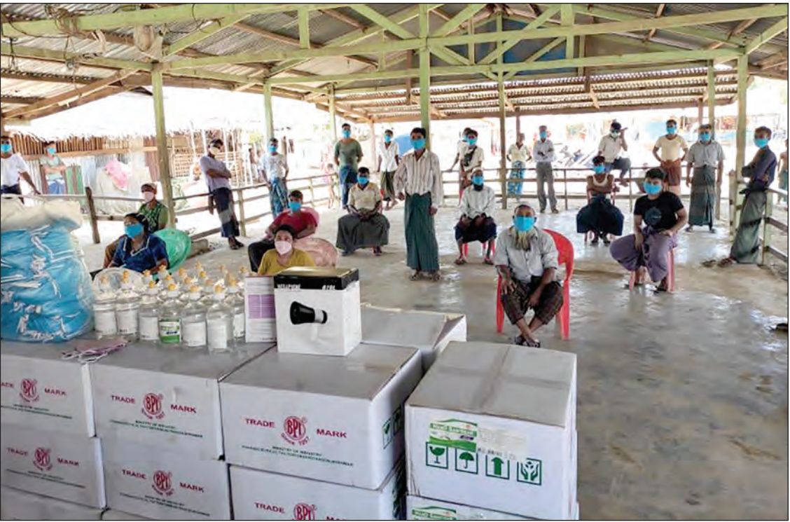
Healthcare items and internally displaced persons seen at an IDP camp in Rakhine.