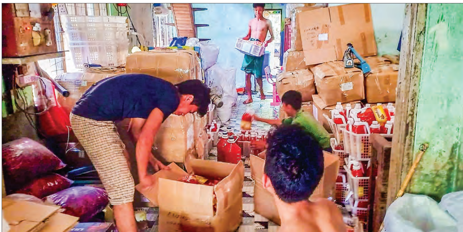
Employees packing paper box containing sauce bottles in Hlinethaya Township.