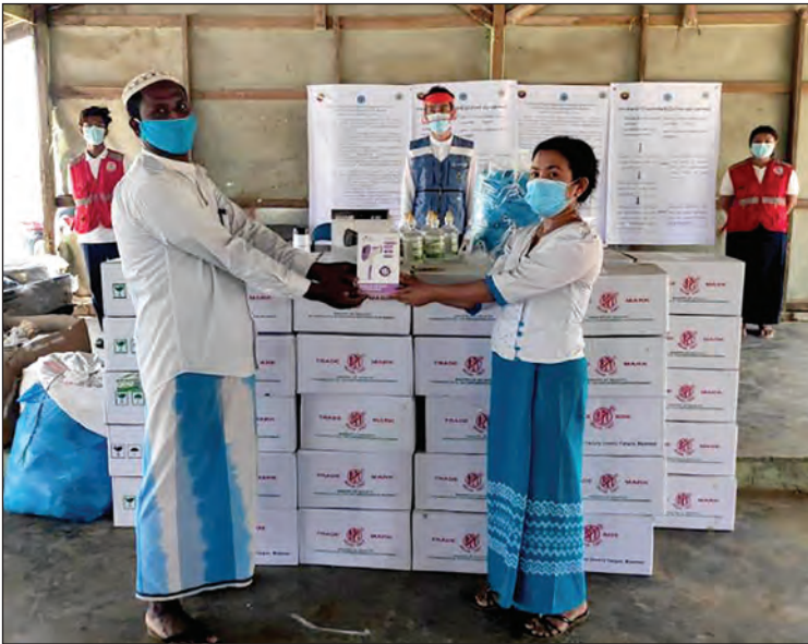
An official presents COVID-19 medical supplies in Rakhine.