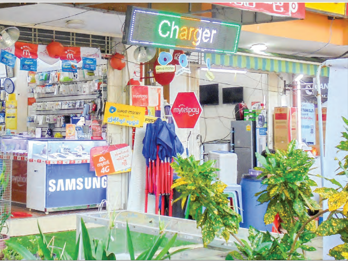
Mobile phone shop also offering sales of accessories and repair works.

are losing their beauties in impacts of unguaranteed cosmetics.