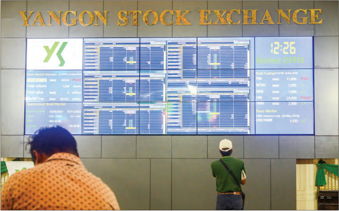
Visitors seen at Yangon Stock Exchange in downtown Yangon.

THE value of shares traded on the Yangon Stock Exchange (YSX) in April touched the lowest of K902 million with 173,808 shares being traded, due to the long market holidays during Thingyan. In January 2020, 196,836 shares worth K1.25 billion were traded on the exchange while 188,919 shares, with an estimated value of K1.48 billion, were traded on the exchange in February and 228,913 shares valued K1.42 billion were traded in March respectively, the exchange's monthly report showed. At present, shares of five listed companies — First Myanmar Investment (FMI), Myanmar Thilawa SEZ Holdings (MTSH), Myanmar Citizens Bank (MCB), First Private Bank (FPB), and TMH Telecom Public Co. Ltd — are being traded on the stock exchange. The sixth public company — Ever Flow River Group Public Co., Ltd. (EFR) — was given green light to be listed on the exchange and the first day of share