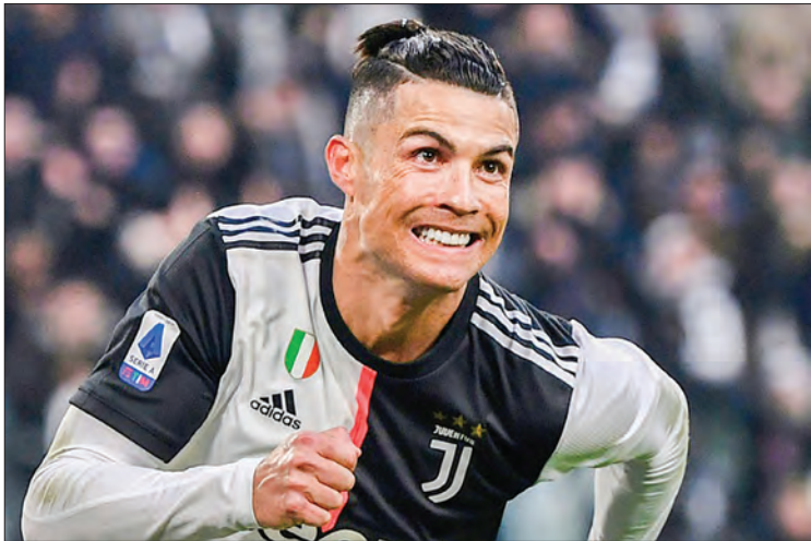
Cristiano Ronaldo last played for Juventus against Inter Milan on March 8.

MILAN — Juventus star Cristiano Ronaldo flew back to Italy on Monday after almost two months in coronavirus lockdown in his native Portugal.