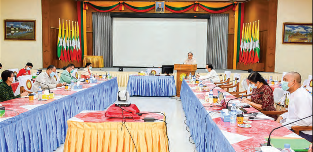
Union Minister Dr Myint Htwe holds the meeting on prevention and precautions of most monsoon common diseases yesterday.

UNION Minister for Health and Sports Dr Myint Htwe presided over a meeting yesterday through video conferencing about prevention and precautions of most monsoon common diseases amid the ministry’s measures against COVID-19. The Union Minister discussed preparations for reduction of death rate from most monsoon common diseases as there were a total of 80,000 dengue fever cases from 2017 to 2019, with the death rate of 450 in total. He added his ministry will carry out prevention and control of dengue fever with the national-level action plan this year as most of the communicable diseases could be prevented through hand-washing, sanitation and personal hygiene. The Union Minister also called for promoting the role of medical research in treatments of most common monsoon diseases, adopting future plans beyond COVID-19 outbreak, holding meetings with partner organizations, local and international NGOs and civil organizations. Senior health officers also discussed prevention of seasonal flu, transmission of COVID-19 among the evacuated persons from natural disasters in monsoon, and other common diseases in monsoon period.—MNA (Translated by Aung Khin)