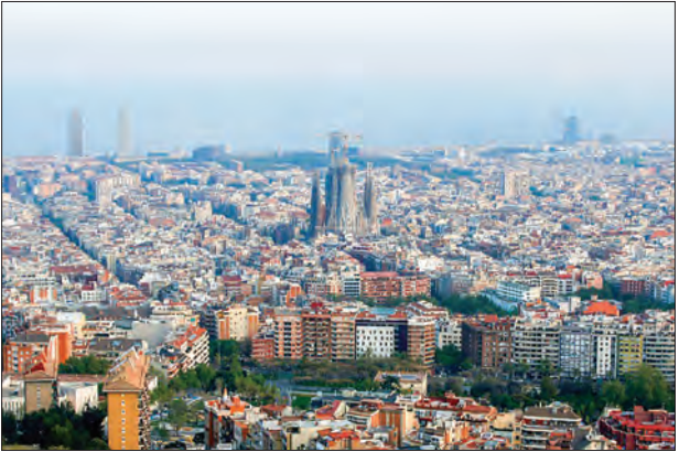
A collapse in tourism has sparked a big rise in jobless figures. PHOTO: AFP

Spain is the second-most popular tourist destination in the world after France. — AFP ■