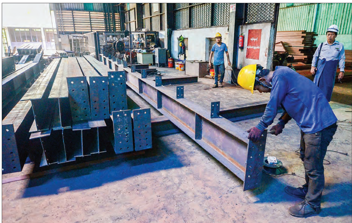
Steel structure H-beam being seen at the manufacturing site.