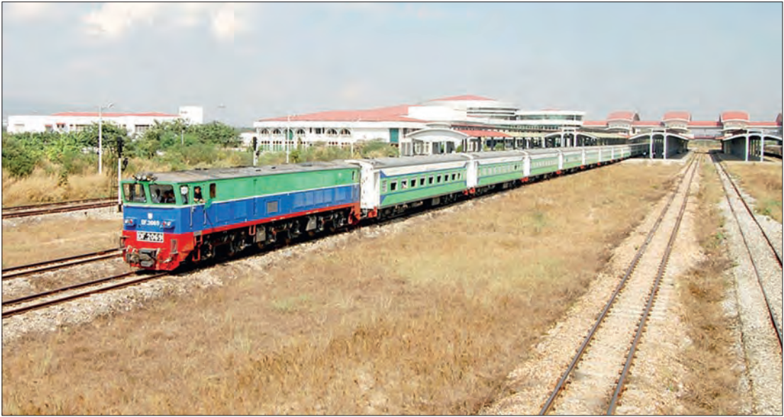
The special trains will be run along Yangon-Mandalay route from 27 to 30 December and along Mandalay-Yangon route from 29 December to 1 January.

The special trains will have eight ordinary class coaches, four upper-class seaters, one upper class sleeper, and one brake van. The special trains will halt at Toe Gyaung Kalay, Bago, Daik-U,