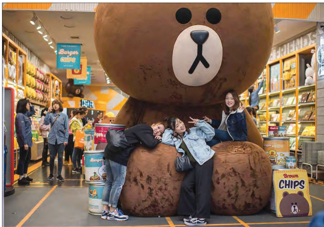
FILE PHOTO: A group of women pose for photos with a giant bear at a 'Line' store in the popular Myeongdong shopping district of Seoul, South Korea.

Revenue of major department stores and discount outlets grew 3.1 per cent and 0.8 per cent