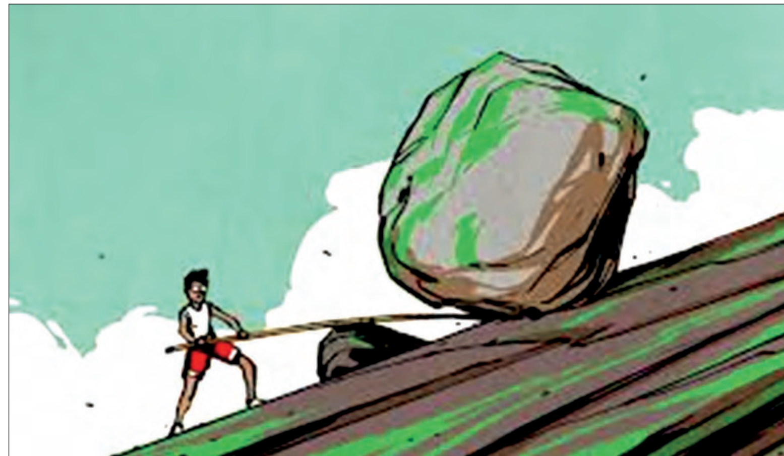
A huge heavy stone that cannot be moved by bare hands can be easily done so by using a Lever is an analogy of effective study.

my lectures about a 'Lever' as an example of Smart study. The mechanism of a Lever is based on the principle of 'Mechanical advantage' in Physic. The fact that, a huge heavy stone that cannot be moved by bare hands can be easily done so by using a Lever is an analogy of effective study.