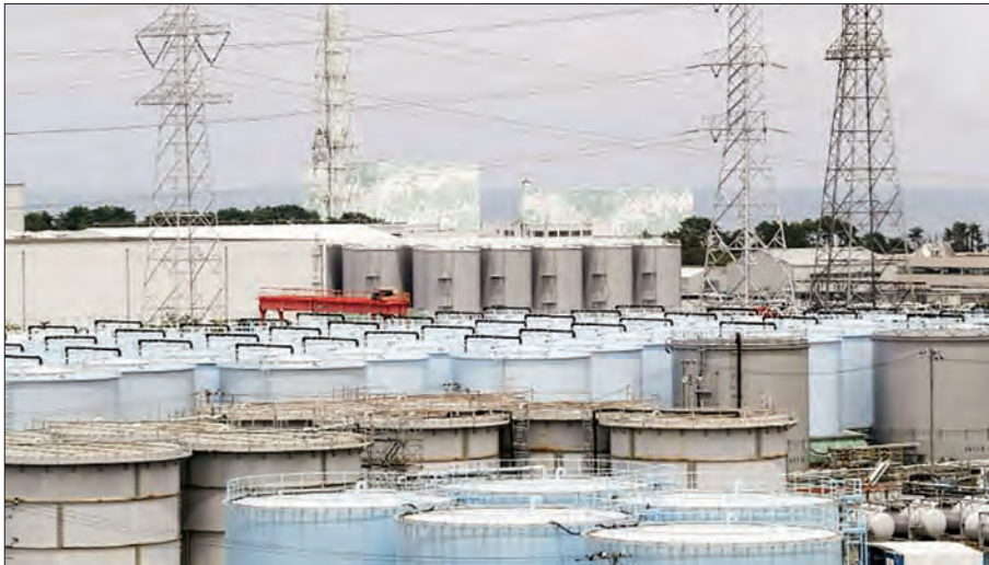
Storage tanks holding radioactive water at Japan's crippled Fukushima power plant.

The government's Agency for Natural Resources and Energy on Monday proposed three ways to deal with the water — releasing it into the sea, into the air using vaporisation or a combination of the two. "There is no option (any longer) of simply storing the water for a long period of time,"