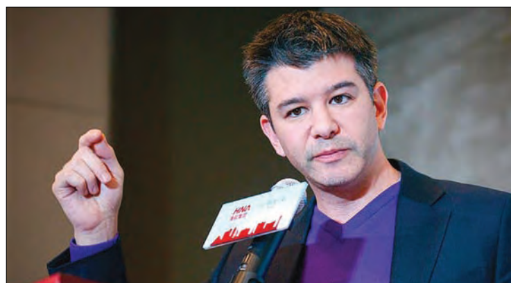
Former chief executive Travis Kalanick will depart Uber's board of directors by the end of the year, the company said on 24 December, 2019.

been the personification of the go-go Silicon Valley disruptor associated with visionary entrepreneurship that upends traditional businesses, accompanies by unfettered growth.