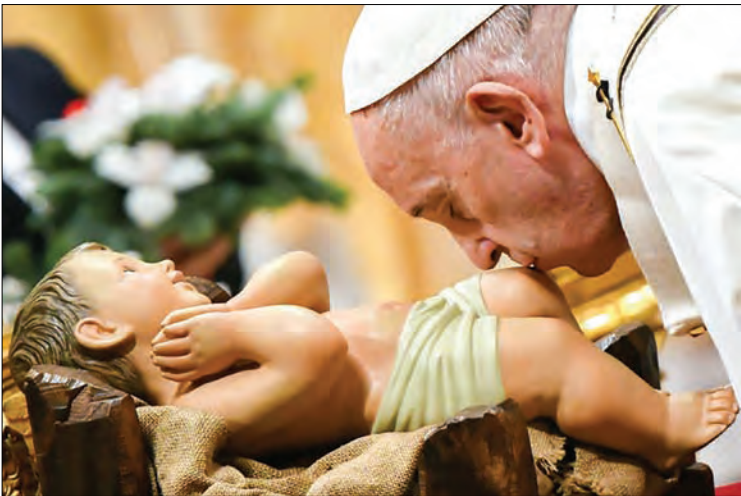
Pope Francis ushered in Christmas at the Vatican with his Christmas Eve Mass.

He used his “Urbi et Orbi” (To the City and the World) speech to call for a resolution to the crisis in Lebanon, where he hoped for