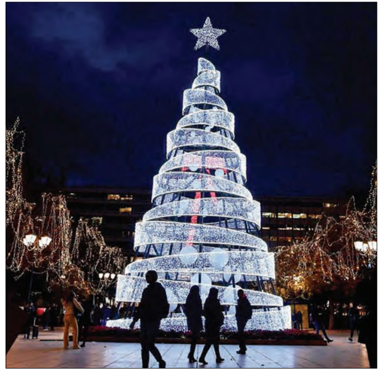
Christmas decorations in Athens.

ket “Varvakeios”. Due to the price hikes in key meat ingredients, the traditional Christmas meal for 6-8 persons which includes meat, salads, fruits, cheese, soft drinks, wine and dessert will cost Greek households this year on average 154.57 euros (170.02 US dollars), up 3.68 per cent compared with last year when the average was estimated at 149.09 euros, the ESEE’s survey found. In order to keep the cost as low as possible, some Greeks are dropping the pork and turkey, or buy small quantities, and shift to more economic ingredients.—ANI ■