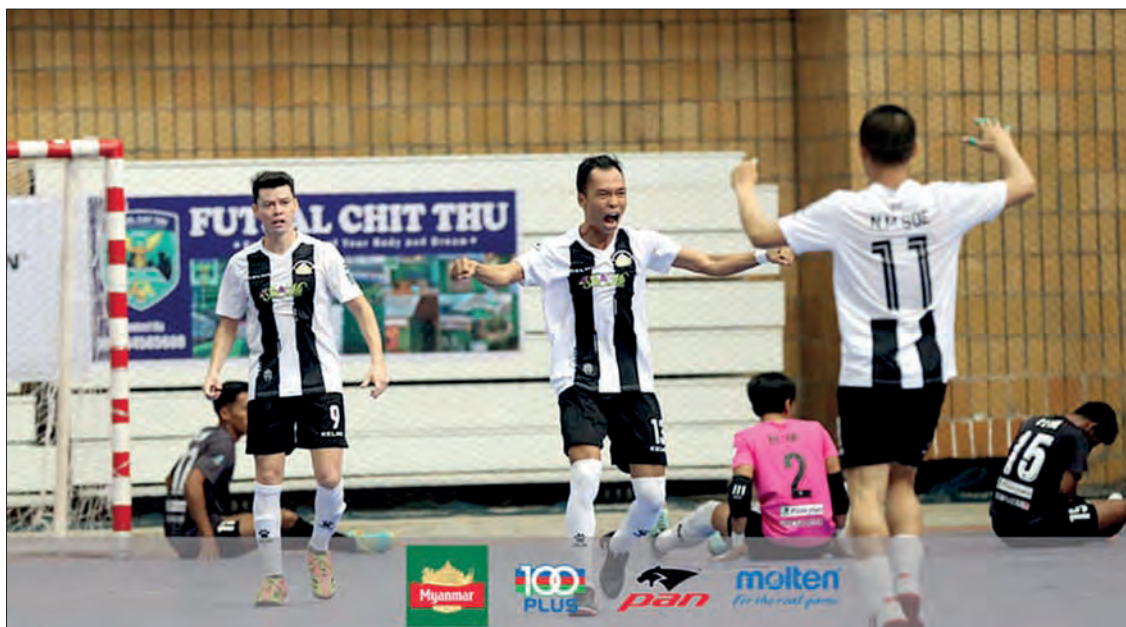
Players from VUC futsal team celebrate their victory over GV FC in the Myanmar Futsal League match yesterday.

After the matches, VUC FC is still leading the table and MIU FC is in the second position with a no-loss result so far in the tourney, while GV FC is in the third place.—Lynn Thit (Tgi)