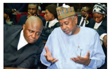
Sambo Dasuki (r) is accused of siphoning money earmarked for the fight against Islamic militant group Boko Haram and allegedly using it to help bankroll former president Goodluck Jonathan’s failed re-election campaign in 2015.

Dasuki is accused of siphoning money earmarked for the fight against Islamic militant group Boko Haram and allegedly using it to help bankroll former president Goodluck Jonathan’s failed re-election campaign in 2015. “He was released Tuesday night and has since reunited with his family in Abuja,” a senior DSS