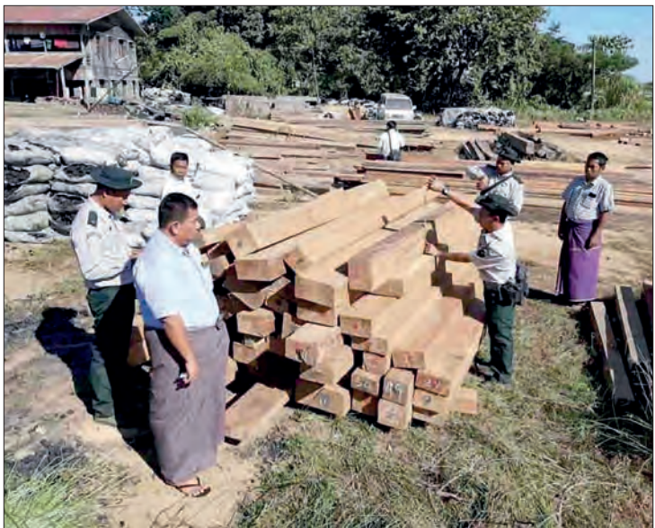
Forest officials check illegally cut teak logs in Kyauktaga Township, Bago Region.

OFFICIALS on Tuesday seized an illegal consignment of teak, weighing over 3 tons, near the Bago Yoma mountain 12 miles village, MyoChaung-Sein Kant Lant road, Kyauktaga Township, Bago Region.