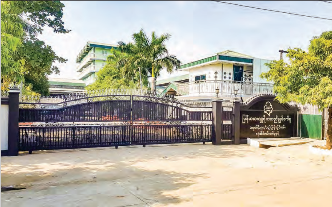
Myanmar Mercury Garment Factory in Dagon Seikkan Industrial Zone.

try's data said. CMP garment exports were valued at $ 850 million in the financial year 2015-2016. Myanmar earned around $ 2 billion from CMP exports in the financial year 2016-2017 and fetched nearly $ 2.5 billion 2017-2018 FY. Being the country's lead-