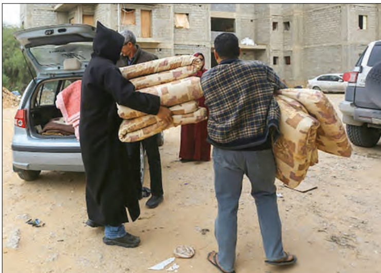
Libyans unload bedding from vehicles to give to displaced fellow countrymen.

In central Tripoli, the grey skeletons of a highrise construction site — abandoned since 2008 due to a property dispute — now host more than 170 families. For some, the high rises in Tarik al-Sekka were “a gift from heaven”, since the alternative was living in the street. But “we live like animals — without running water, electricity, or even sewerage,” said Mohammed, a mother of seven. Her youngest son is sick with a chronic respiratory illness. “The dust will kill him,” Mohammed despaired. “All we want is to live in dignity,” she said. Neighbour Samira crowds her four children into a single room in a nearby building, preferring the greater warmth it affords over any sense of privacy.—AFP ■