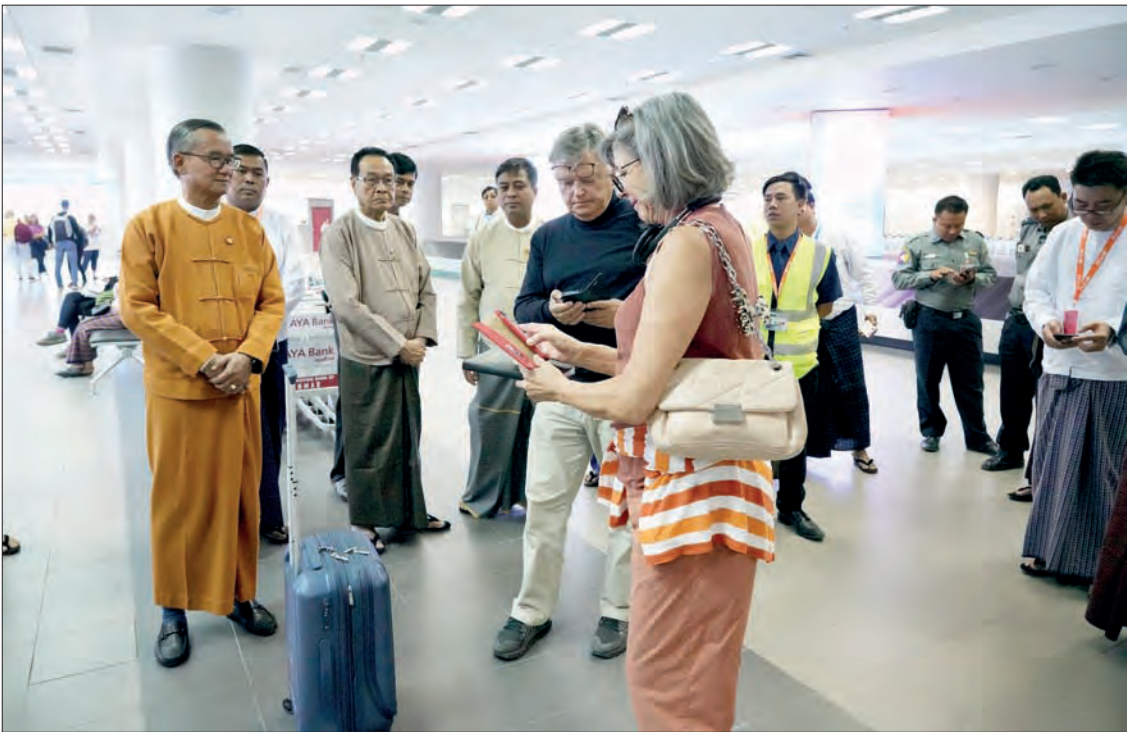
Union Minister U Ohn Maung, Deputy Minister U Tin Latt and officials observe the use of QR code by the tourists at the Mandalay TadaU Airport yesterday.

Office of Commander-in-Chief of Defence Services.—MNA (Translated by Aung Khin)