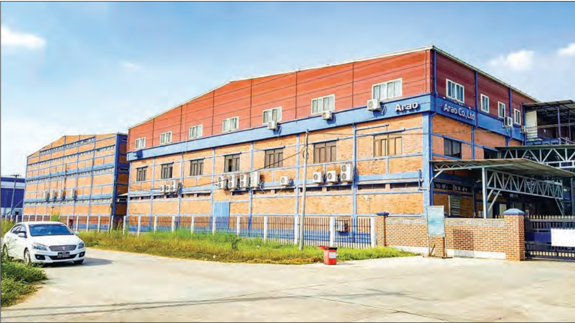
A garment Factory in Dagon Seikkan Industrial Zone.