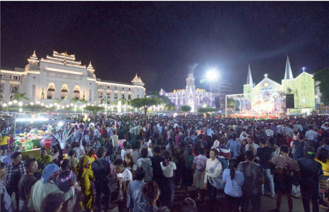
People celebrate the Christmas Day in downtown Yangon on 25 December, 2019.

and challenges by sharing views and having close consultations, looking ahead to a future after the 2020 elections, implementing step by step with pragmatic methods, to create a stable path. I pray that the good and noble traditions, cultures, arts, historical heritages which have been preserved by the ancestors will be maintained and preserved. I also pray that the noble Union spirit will be passed on to the future generations. May this year's Kayin New Year, 2759 provide strong impetus. May all the Kayin ethnic nationals living in Kayin State and other parts of the Union have continued progress and development. May you have abundance of paddy, rice, water and prosperity. These are the sincere good wishes I send to you today. Aung San Suu Kyi State Counsellor