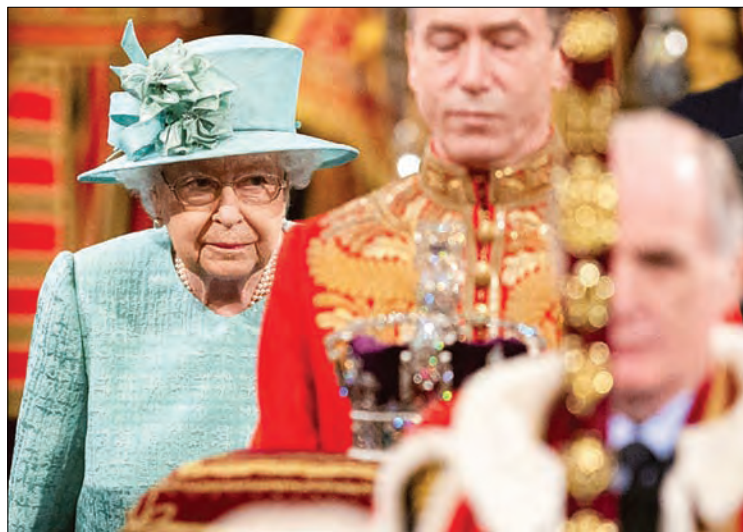
Britain’s Queen Elizabeth II has called the year “bumpy” and may Britons are again questioning the cost of the monarchy.