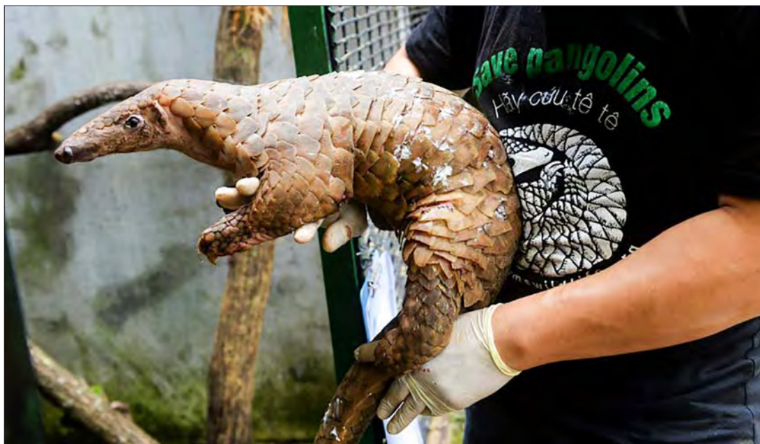
Even though their scales have been scientifically proven to be medically useless, the pangolin has become the world's most trafficked animal.

Vietnam outlawed the ivory trade in 1992, but the illegal market still persists and shops sell items pre-dating the ban for decorative and medicinal purposes.—AFP ■