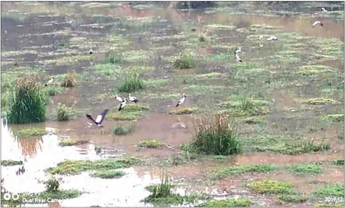
A flock of migratory birds sit along a lake in Taninthayi Region for the winter.

Officials from Forest Department said they will erect educative posters not to catch or kill these beneficial birds which eat harmful snails in the paddy fields. Migratory birds flew from Siberian Plain of Russia, and they normally settled in upper and central areas of Myanmar for winter. —Nan Thar Yi Htein Win (IPRD)