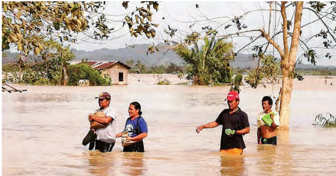
Parts of the central Philippines have been half-submerged by brown-coloured floods.

Though weaker, Phanfone was tracking a similar path to Super Typhoon Haiyan, the country's deadliest cyclone on record