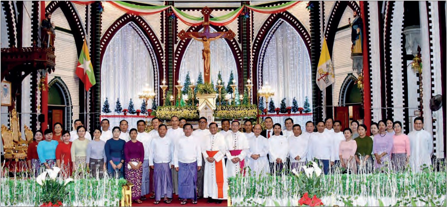
Senior General Min Aung Hlaing, Cardinal Charles Bo, the Archbishop of the Roman Catholic Archdiocese of Myanmar, pose for a photo together with attendees at the Christmas celebration at Saint Mary's Cathedral in Botahtaung Township, Yangon, yesterday.

Senior General Min Aung Hlaing received X'mas gifts from Cardinal Charles Bo, and