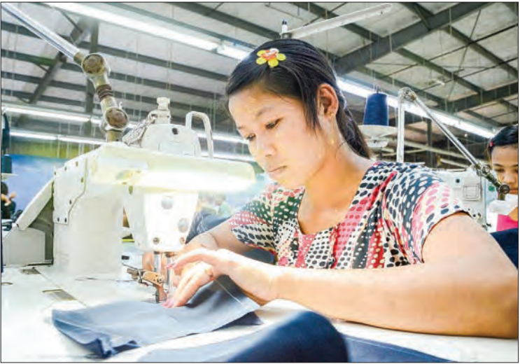
An employee stitches cloth inside a garment in a factory in Yangon.

come from the garment and textile industry has increased threefold, the ministry reported. The total export earnings from Myanmar's garment and textile industry is expected to reach $ 10 billion by 2024, said an official from the Myanmar Garment Entrepreneurs Association. Myanmar's CMP