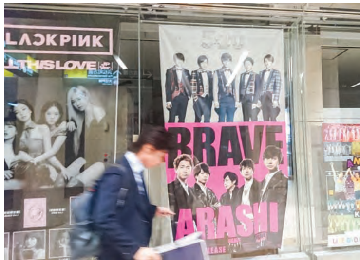
A man passes by banners picturing Japanese all-male idol group Arashi (c) in Tokyo, on 13 November, 2019.

CHENGDU — The Japanese government said Wednesday that it has tapped popular Japanese boy band Arashi as a goodwill ambassador to promote cultural and sports exchanges with China ahead of the 2020 Tokyo Olympics and Paralympics.