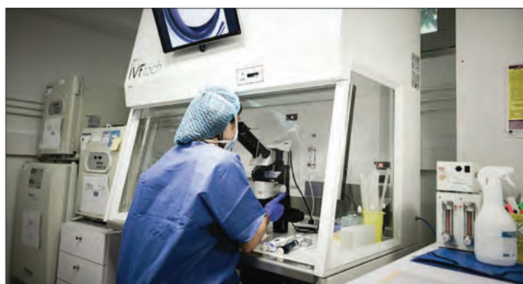
Unmarried women in China are also largely barred from accessing assisted reproductive technologies including in-vitro fertilisation (IVF) treatment or sperm banks.

An HSBC bank in Mong Kok was vandalized, as were some traffic lights and a subway entrance that was set on fire, local media footage showed. Protesters have in online forums called for people to fill shopping malls across the territory to sing Christmas carols and protest songs with the aim of forcing shop closures, and for them to later join a countdown rally at the Clock Tower near the shoreline in Tsim Sha Tsui.—Kyodo News