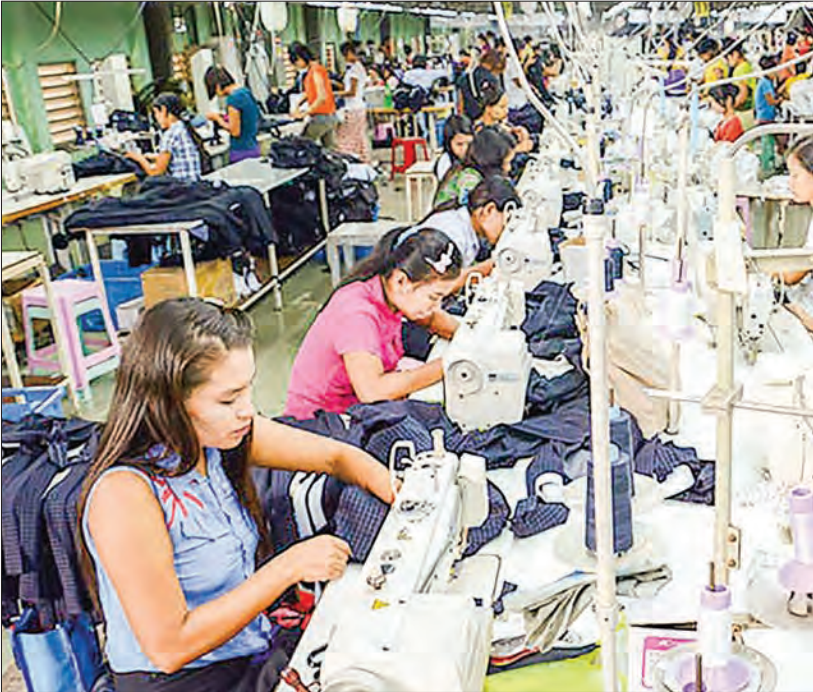
Workers at a production line of a garment factory in Hlinethaya Industrial Zone.