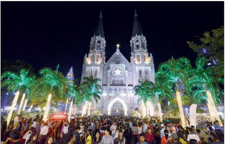
People gather outside the Immanuel Baptist Church in downtown Yangon on 25 December, 2019.

and attendees had a documentary photo taken in the compound of cathedral. The Christmas Festival 2019 in downtown Yangon was joyously held near the City Hall in front of Maha Bandula Park and along Bogyoke Aung San Road in festive mood and decorations from 23 to 25 December.—MNA (Translated by Aung Khin)