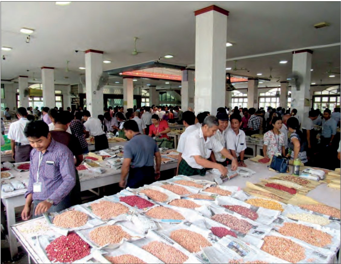
Merchants evaluating various kinds of bean at a brokerage house in Mandalay.

“We have to export mung beans to India by 31 March, which is the ending date of the Indian financial year. We will have to send the mung beans before 15 March so that the mung beans will reach India by 31 March. It remained only two-and-a-half months before