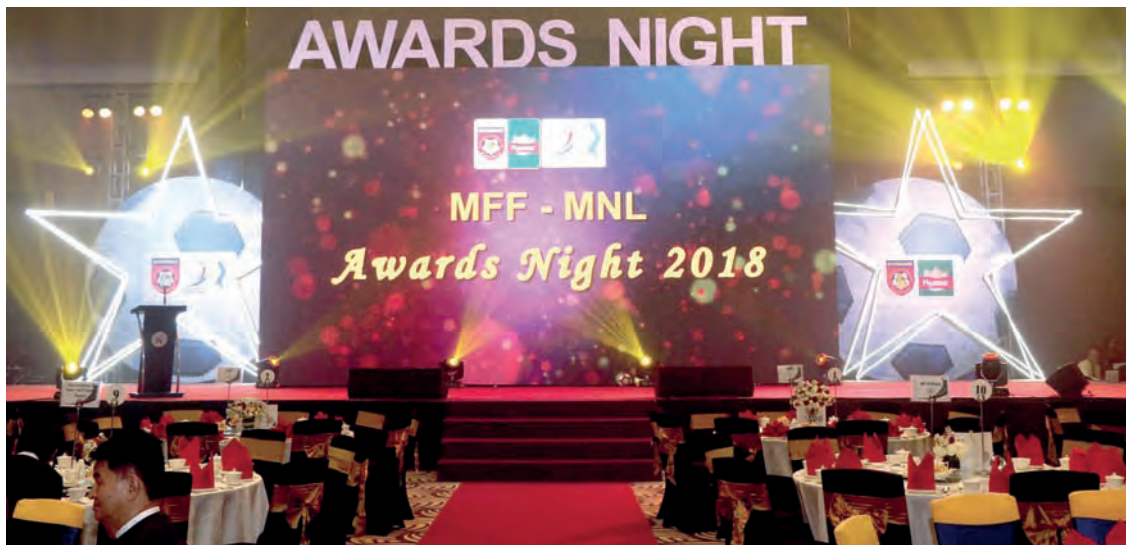
The previous MFF-MNL Awards Night was convened on 27 December, 2018 in Yangon.