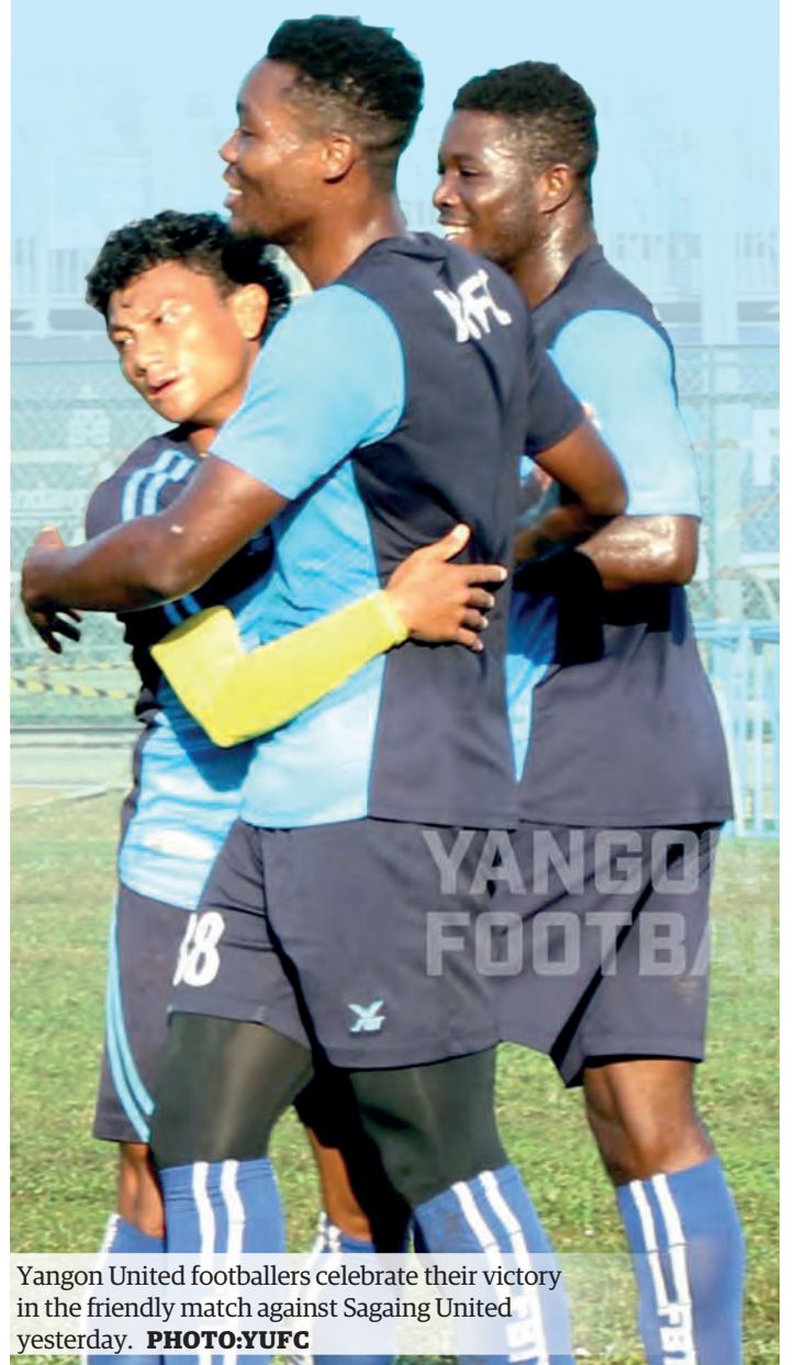
Yangon United footballers celebrate their victory in the friendly match against Sagaing United yesterday.