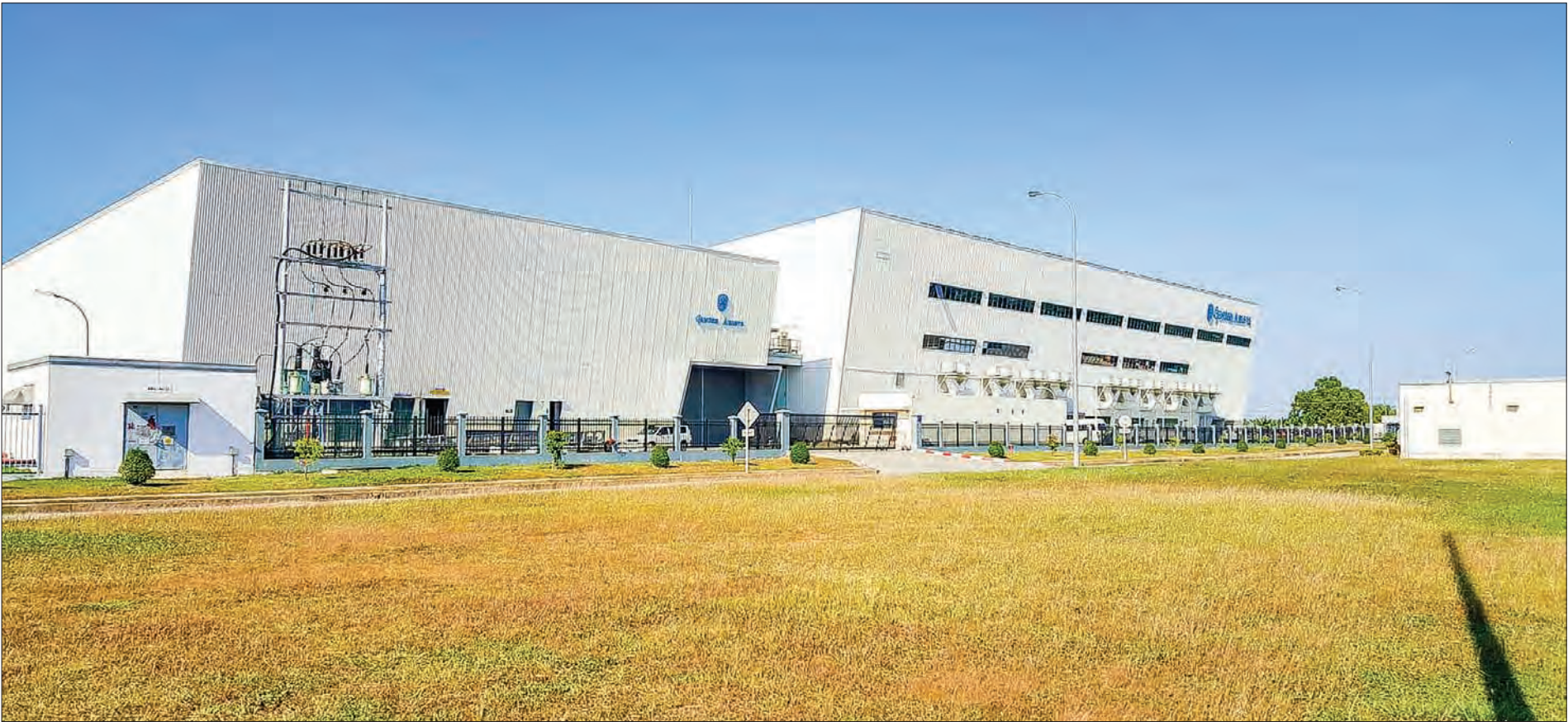
Geuston Amaua, Garment Factory in Thilawa Special Economic Zone.