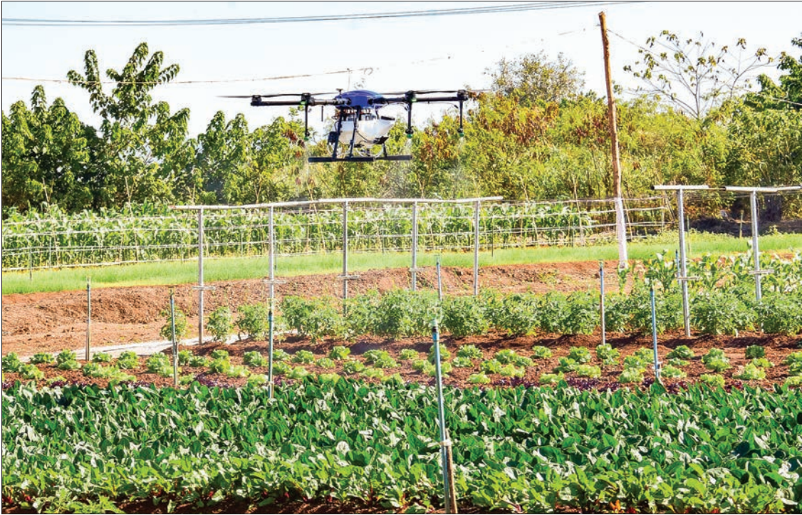
Vice President U Henry Van Thio inspects the farming process assisted by Drone Agriculture Sprayer at Heho Garden in Inkhaung village, Kalaw Township yesterday.