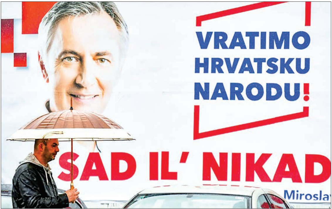
Popular Croatian singer Miroslav Skoro is running as an independent.

ZAGREB—Croatians went to the polls Sunday in a presidential election that could weaken the ruling conservatives just as the country takes the helm of the European Union’s rotating presidency.