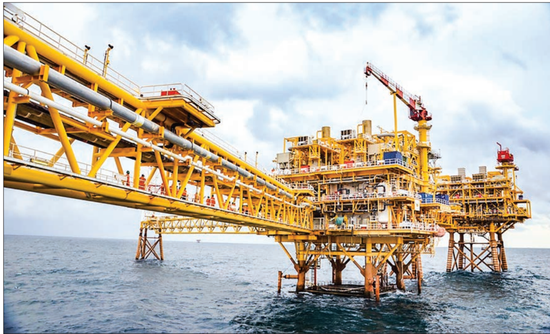
Yadana Off Shore gas field in the Andaman Sea.

of Electricity and Energy, there are over 104 oil and gas blocks in Myanmar: over 51 offshore blocks and 53 inland blocks.