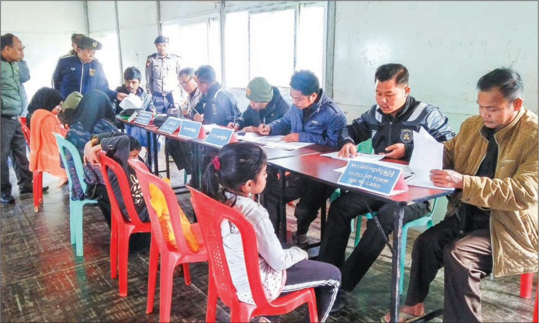
Officials from Taung Pyo Letwe Reception Centre scrutinize and issue National Verification Cards to the children.

A family of seven displaced persons -- four men and three women -- returned to Myanmar of their own volition on Saturday and were received at the Taung Pyo Letwe Reception Centre, Maungdaw District, in Rakhine State. The Taung Pyo Letwe Reception Centre in-charge and officials scrutinized the returnees