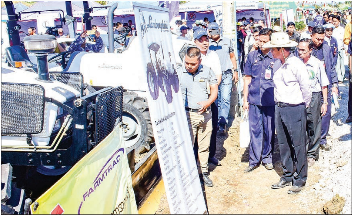
Vice President U Henry Van Thio observes the machines showcased at the Shan State Agriculture Symposium.