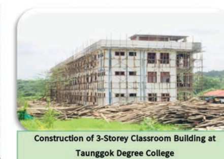
Construction of 3-Storey Classroom Building at Taungkok Degree College