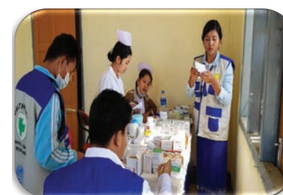
Healthcare Services Being Provided by Mobile Medical Team in Buthitaung Town