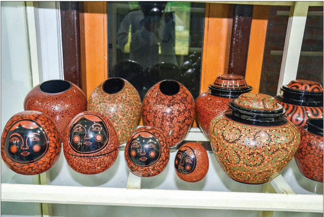
Traditional lacquerware businesses in Bagan are currently relying on domestic visitors.

"Although both local and foreign visitors are coming to Bagan, few tourists purchased lacquerwares, and that we are