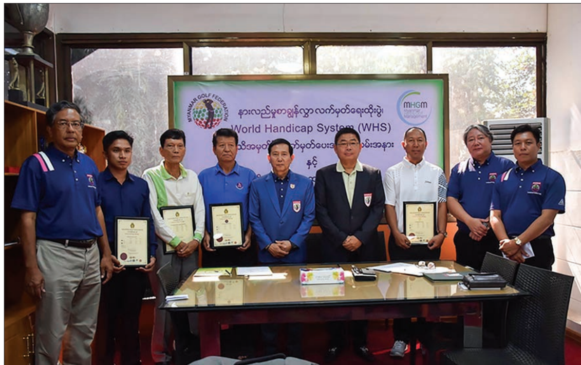
Officials seen at the MoU signing ceremony for the Myanmar Hero's Golf Project and distribution of World Handicap System certificates to Yangon golf clubs.

WITH the aim of grooming a new generation of women golfers in Myanmar, a project titled Myanmar Hero's Golf Project will be launched soon in Myanmar, according to a statement issued by the Myanmar Golf Federation.