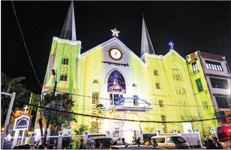
Emmanuel Church in downtown Yangon decorated with Christmas lights.