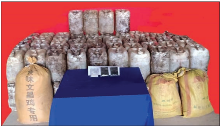
Confiscated drugs and related products.