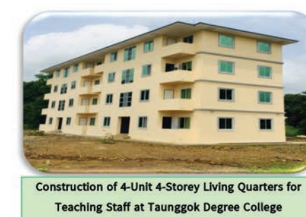
Construction of 4-Unit 4-Storey Living Quarters for Teaching Staff at Taungkok Degree College