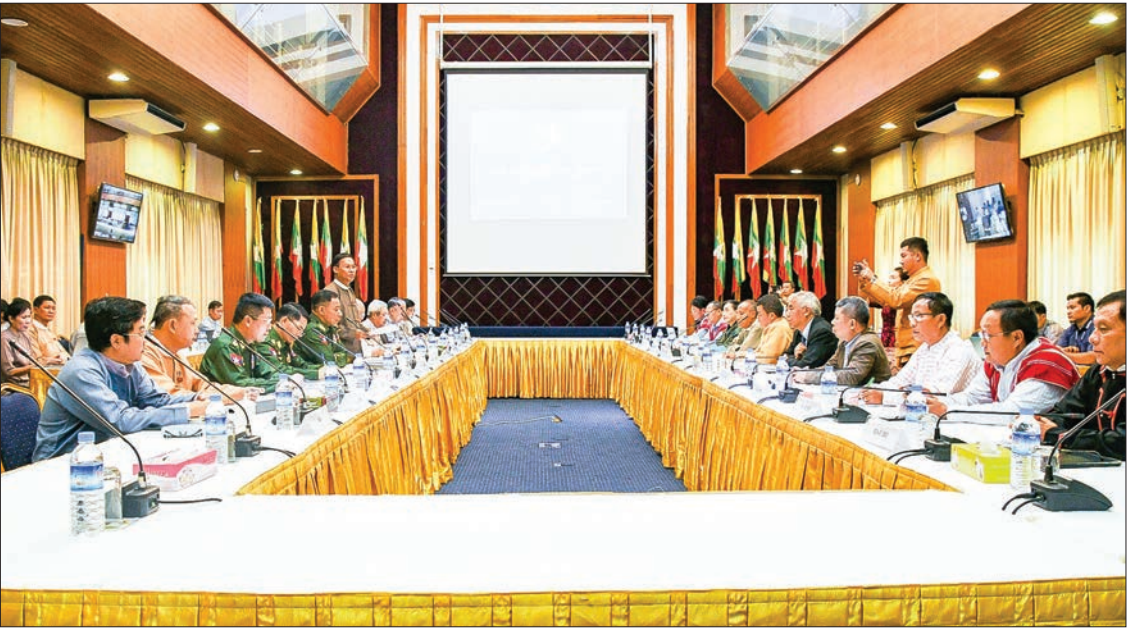
Government delegation and ten Ethnic Armed Organizations hold a preliminary coordination meeting yesterday at the National Reconciliation and Peace Centre in Yangon.