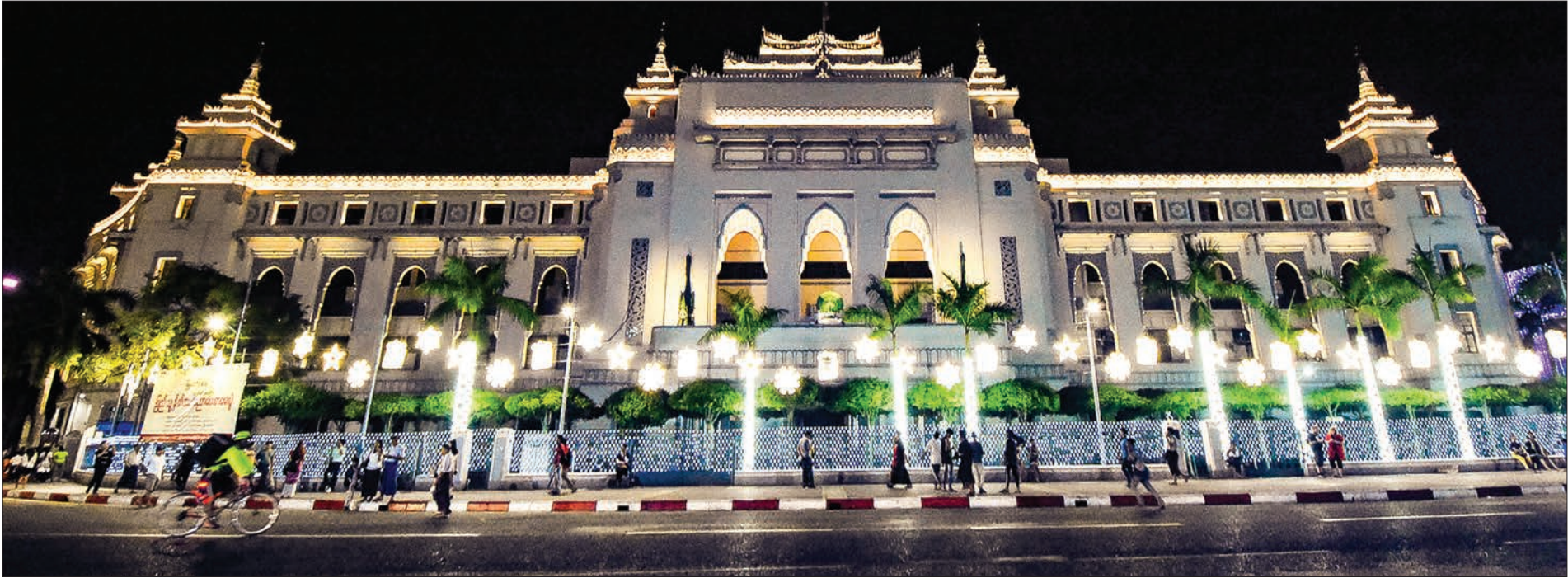
Christmas lights in the shape of moons and stars at the Yangon City Hall in downtown Yangon attract the evening walkers.