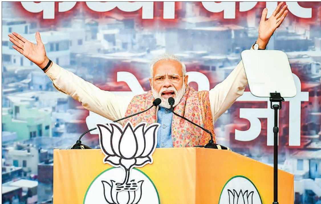
India's Prime Minister Narendra Modi told supporters in New Delhi that Muslims 'don't need to worry at all' about the new citizenship law -- provided they are genuine Indians.

NEW DELHI—Prime Minister Narendra Modi on Sunday expressed concern over the assault on police personnel in anti-citizenship law protests and claimed that 33,000 cops have lost their lives on the line of duty since Independence.