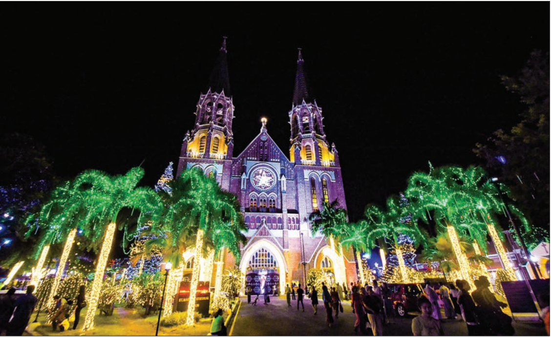
St. Mary's Cathedral located on Bo Aung Kyaw Street in Yangon decorated with colourful Christmas lights.