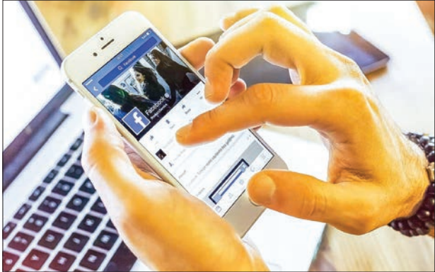
Facebook has said it will be in compliance with the new California Consumer Privacy Act, but some analysts say smaller firms will face high costs.

The statute becomes effective January 1, covering most entities doing business in California, just months after enforcement began for Europe’s General Data Protection Regulation, which affects many US online operations.