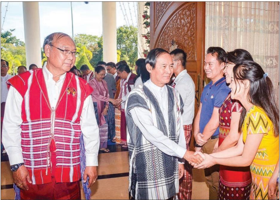
President U Win Myint is welcomed by Speaker U T Khun Myat and Speaker Mahn Win Khaing Than (Left Photo) and by youths (Right Photo) in Nay Pyi Taw yesterday.