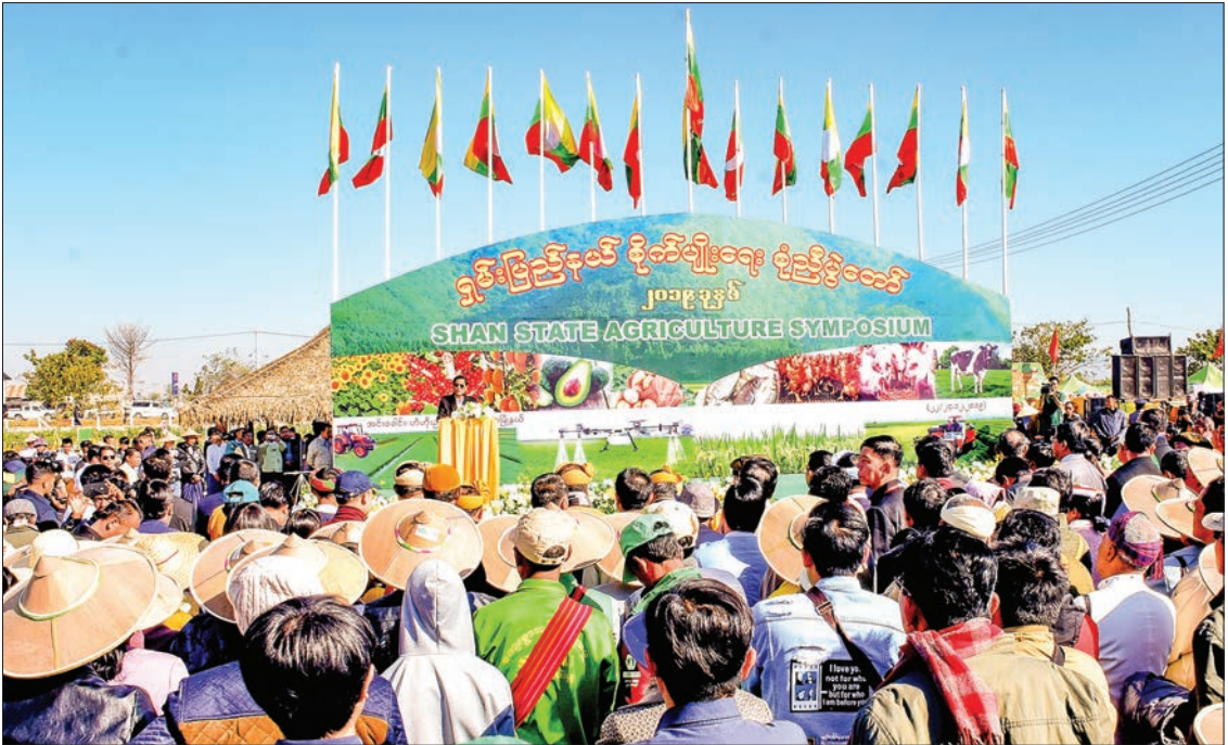
Vice President U Henry Van Thio delivers the speech at the Shan State Agriculture Symposium.