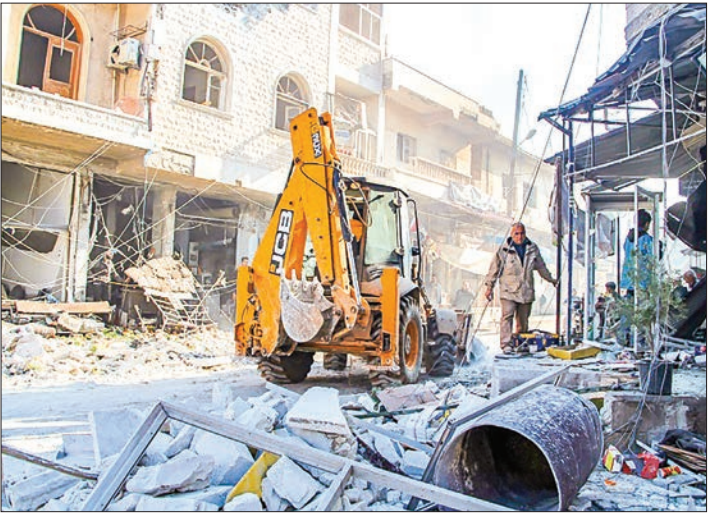
An excavator clears rubble following a reported air strike in the Syrian town of Saraqib in Idlib province on Saturday.

“Nowhere is safe. If we stay inside our homes, or if we flee outside, we will die either way,” said Abu Akram. Damascus loyalists have since Thursday been locked in battles with jihadists and allied rebels, seizing a total of 25 towns and villages from their control, according to the Observatory.—AFP ■