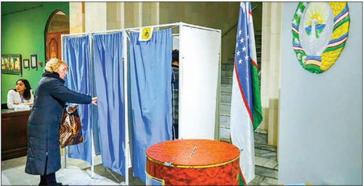
Polling stations opened at 8:00 am (0300 GMT) and will close 12 hours later.

TASHKENT—Voters in Uzbekistan cast their ballots Sunday in the first parliamentary election since a new leader ushered in an era of reform after years of isolation and authoritarian rule. Polling stations in Central Asia’s most populous country opened at 8:00 am (0300 GMT) and will close 12 hours later. President Shavkat Mirziyoyev took charge in 2016 after the death of hardline predecessor and former patron Islam Karimov, who had ruled for almost three decades. Mirziyoyev has been lauded for doing away with many of Karimov’s authoritarian excesses, releasing some political prisoners, battling forced labour and opening up the landlocked state to tourism and foreign investment. But choices on the ballot in the former Soviet republic are few -- all five parties