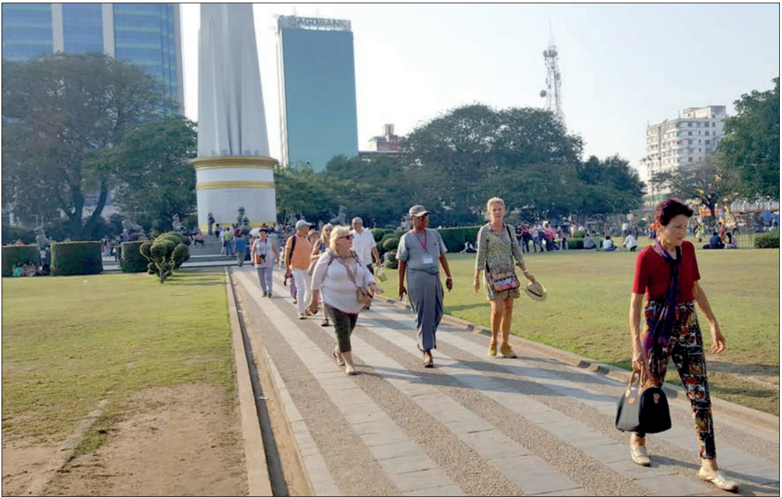
Tourists walk around at Maha Bandoola Park.

Chinese tourist arrivals to Myanmar increased by 161 per cent this year compared to the same period last year, and topped the list of tourists visiting the country, according to the ministry. China is Myanmar's number one source market with nearly 600,000 January to October arrivals. The figure was followed by Thailand with 218,167 tourists during this period and Japan came as third place with 101,996 visitors, while South Korea ranked the fourth with 91,869 tourists. But tourist arrivals from the United States saw a slight increase from 49,705 to 50,771, an increase of 3 per cent compared to the same period last year. The ease of visa restrictions on Asian tourists has significantly prompted the significant increase of tourist arrivals in the first ten months of 2019 to 3.52 million, rose by 436,098 compared with the same pe-