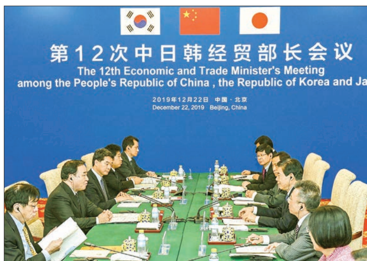
Chinese Commerce Minister Zhong Shan (3 rd from R) and Japanese trade minister Hiroshi Kajiyama (2 nd from L) hold talks in the southwestern Chinese city of Chengdu on Dec. 22, 2019.

There was speculation that the Japanese and South Korean ministers might have formal bilateral talks during their stay in Beijing, but they just chatted for a few minutes, Kajiyama told