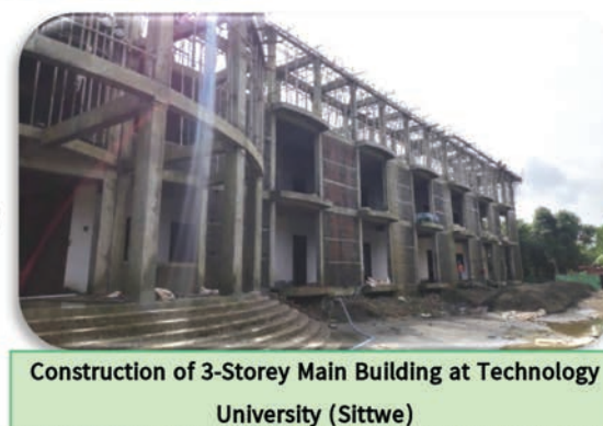
Construction of 3-Storey Main Building at Technology University (Sittwe)