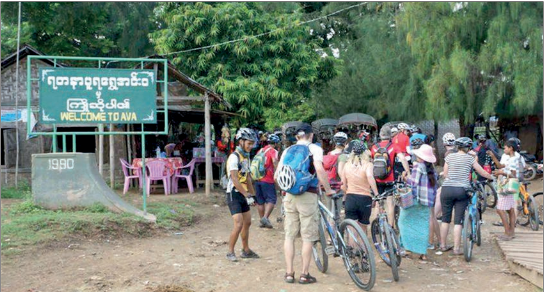
A group of tourists on bicycles visiting Ava, an old city.

Myanmar fetched some US$ 2 billion from 3.55 foreign visitor arrivals in 2018. The Southeast Asian country also earned US$ 1.9 billion from 3.44 million tourist arrivals in 2017 and US$ 2.1 billion from nearly 3 million international visitor arrivals in 2016, according to the government's figures.