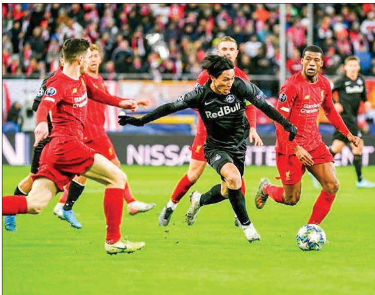
Minamino's move brings an end to his five-year spell with Salzburg, whom he joined from Cerezo Osaka in January 2015.

Liverpool -- whose senior squad are preparing for Saturday's Club World Cup final in Qatar -- activated Minamino's release clause last week.—AFP