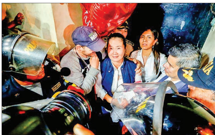
Keiko Fujimori (c) is pictured in November 2019 after her release from pre-trial detention on corruption allegations. PHOTO: AFP

Latin America's largest construction firm has admitted to paying hundreds of millions of dollars in bribes to win juicy contracts in 12 countries.— AFP ■