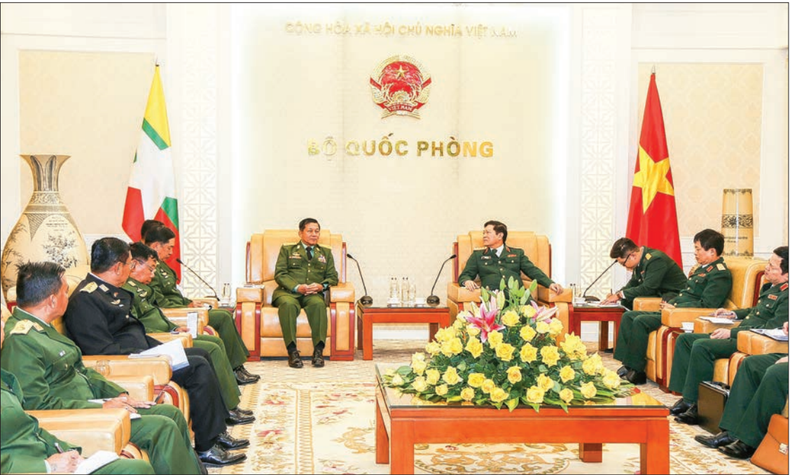
Senior General Min Aung Hlaing holds talks with Chief of General Staff of Vietnam People's Army Senior Lieutenant General Phan Van Giang at the Vietnamese Defence Ministry yesterday.