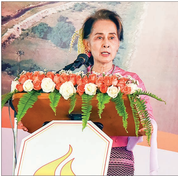
State Counsellor Daw Aung San Suu Kyi.

“We began implementing the Myanmar Sustainable Development Plan (MSDP) in 2018, designed to be coherent with the globally binding Sustainable Development Goals, in order to raise the living standards of our people. It contains