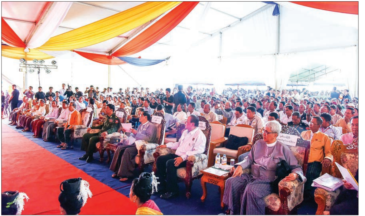
State Counsellor Daw Aung San Suu Kyi delivers the speech at the meeting with local people in Manaung, Rakhine State yesterday.