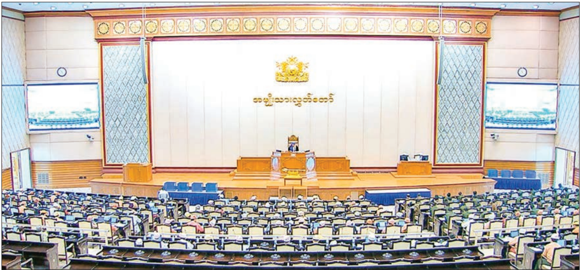
Amyotha Hluttaw is being convened in Nay Pyi Taw.