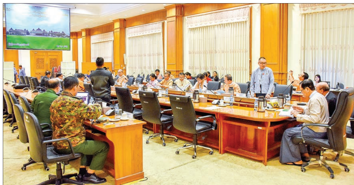
The meeting of the Joint Committee on Amending the 2008 Constitution being held in Nay Pyi Taw yesterday.