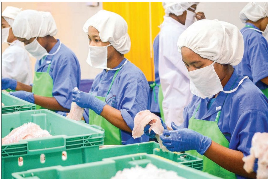
Labourers processing fish for export in a marine product factory.

Saudi Arabia's suspension of fish imports from Myanmar, beginning April last year, has affected rohu fish suppliers. Myanmar keeps only 25 per cent of rohu fish for local consumption and exports the remaining 75 per