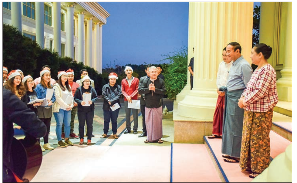
Pre-Christmas choir and prayers singing Christmas songs for President U Win Myint, First Lady Daw Cho Cho and family at the Presidential Palace in Nay Pyi Taw on 17 December.