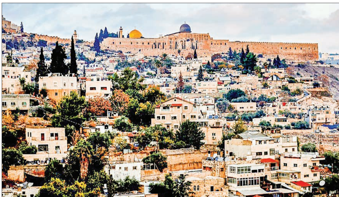
Israel has approved a plan to build a cable car to ferry visitors from western Jerusalem to near the Western Wall.

The Western Wall is directly adjacent to the Al-Aqsa mosque, one of the holiest sites in Islam, but also located on the Temple