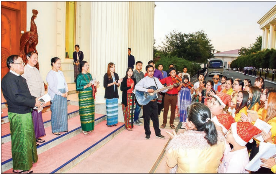
Pre-Christmas and prayers singing Christmas songs for President U Win Myint, First Lady Daw Cho Cho and family at the Presidential Palace in Nay Pyi Taw yesterday.