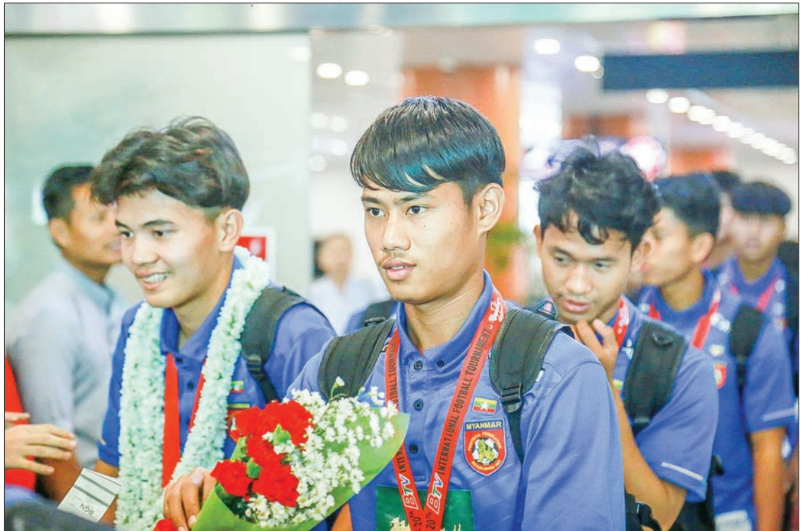
The Myanmar U-20 footballers are welcomed by officials at the Yangon International Airport after winning the bronze medal in Viet Nam's Number One Cup.

In the semifinal stage, team Myanmar lost to Becamex Binh Duong Football Club by a 4-5 penalty play result. Myanmar next faced