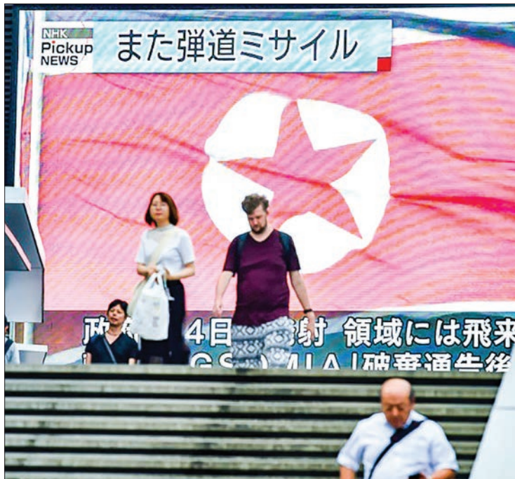
Tensions have risen between Washington and Pyongyang after North Korea carried out a series of rocket launches.

Tuesday’s summit will aim to “have a constructive effect on achieving peace and stability on