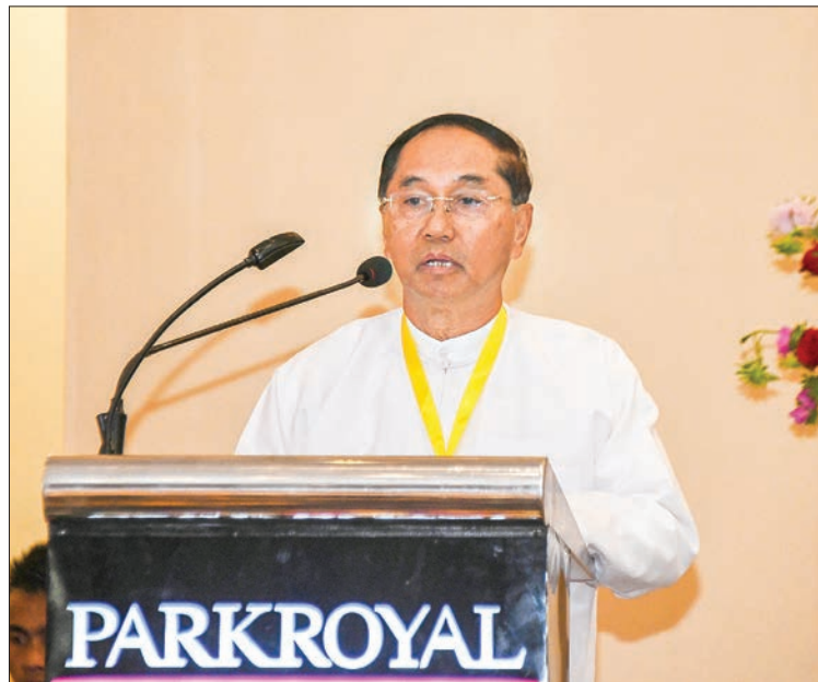
Vice President U Myint Swe delivers the speech at the event for MSME Agency's 1 st annual conference in Nay Pyi Taw yesterday.

THE MSME Agency held its 1 st annual conference and launched the Regional MSME Action Plans for collaboration of the central agency and its regional branches to promote MSME sector.