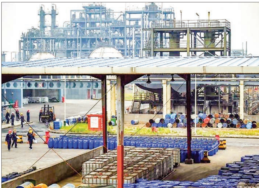
This photo taken on 30 August, 2016 shows Chinese workers walking across the grounds at a chemical factory in Yichang, central China’s Hubei province.

BEIJING — China will exempt some US chemical products from import tariffs, the Finance Ministry said Thursday, a sign of goodwill as the two countries continue efforts at easing their prolonged tit-for-tat tariff war.