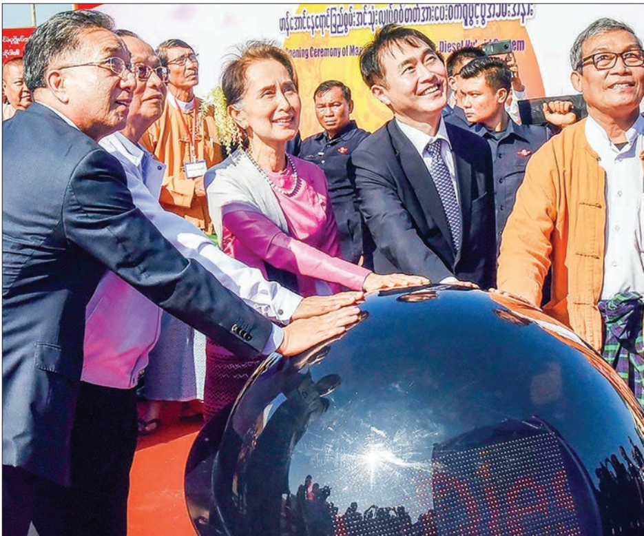
State Counsellor Daw Aung San Suu Kyi formally open the ceremony of the solar power plant in Manaung, Rakhine State yesterday.

CHAIRPERSON of the Border Area and National Races Development Affairs Central Committee State Counsellor Daw Aung San Suu Kyi yesterday attended the opening ceremony of a solar power plant in Manaung, Rakhine State and met with local people.