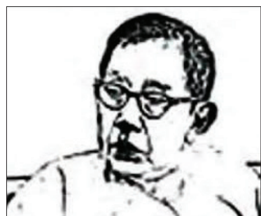
Dr Aung Tun Thet

It was beyond tranquil but the sad thing was the sight of plastic bottles floating along