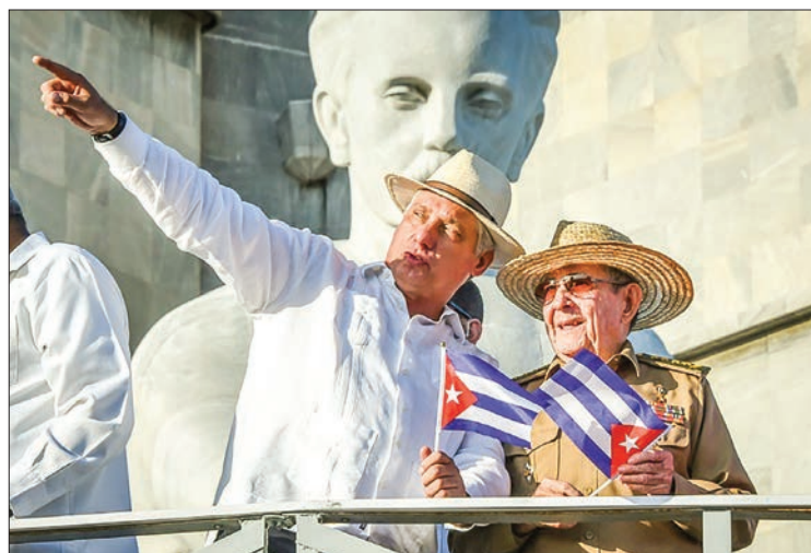
Cuba President Miguel Diaz-Canel (left) and Communist Party First Secretary Raul Castro will be involved in naming a prime minister.