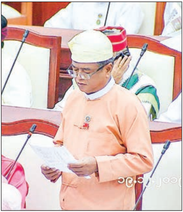
MP U Khin Maung Thein.

Following the asterisk marked question and answer