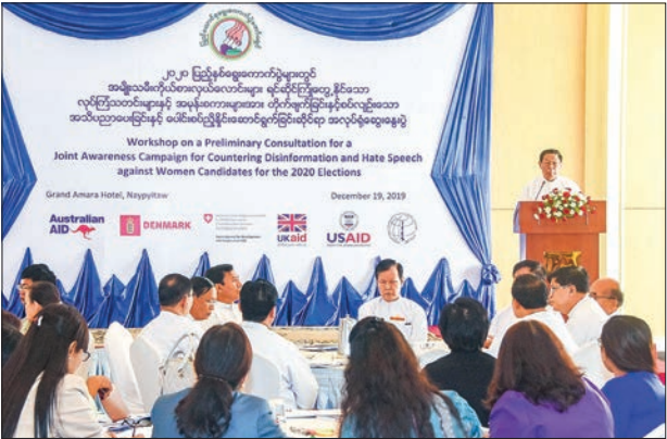
Union Election Commission Chairman U Hla Thein addresses the workshop in Nay Pyi Taw yesterday.

the information team releasing weekly true news.