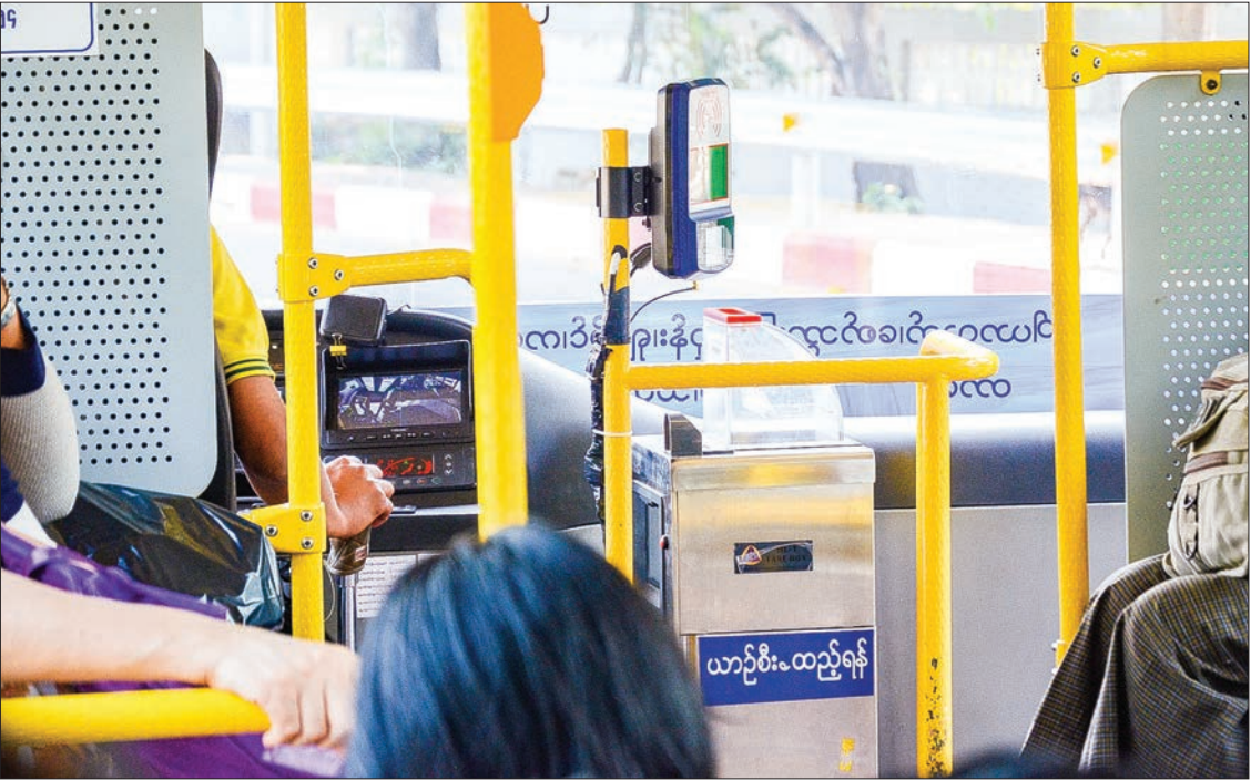
Automated e-ticket machine installed on the YBS bus.

CARD PAYMENT systems have been installed on more than 500 YBS buses to allow passengers to pay bus fares using e-ticketing machines, said U Hla Aung, joint secretary of the Yangon Region Transport Authority (YRTA). “To implement the card payment system, four companies — Yangon Urban Public Transport (YUPT), Yangon Bus Public Company (YBPC), Bandoola Company, and Shwe Taung Paing Company — will install card payment systems on board 1,500 YBS buses. Currently, the systems have been installed on 544 YBS buses. The remaining YBS buses will install this system no later than 27 December,” he added. “We will install the machines. Then, the QC team will inspect the buses. If the buses pass our inspection, we will let them continue. If the buses fail to pass, we will check them again. Our three teams, the related companies, and Asia Starmar are supervising the work in order to ensure systematic and accurate installation of the machines under the