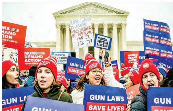
FILE PHOTO: Gun safety advocates rally in front of the US Supreme Court.

“Probably over 3,000 guns have been surrendered over the past seven years, and many of them are assault rifles,” he said.