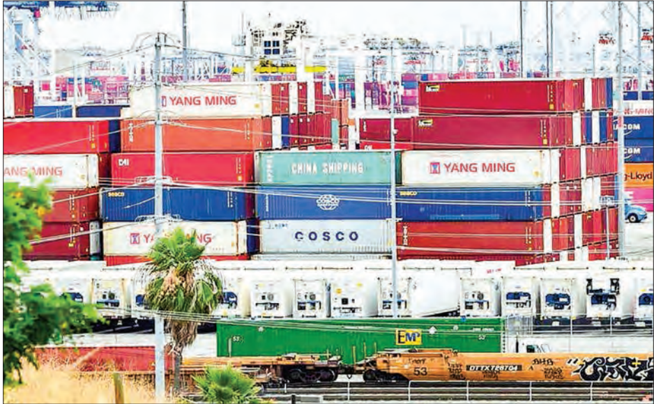
The pared-down ‘phase one’ deal announced Friday includes a reduction in US tariffs on China.

But tussles over the most controversial Chinese trade practices – including steep state subsidies – have been left to future talks. The trade war launched nearly two years ago by President Donald Trump isn’t over, analysts say, as there’s always the risk of Beijing not upholding its