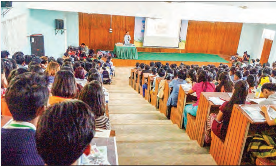
Students attending the literary talks at the Youth All-Round Development Festival in Magway University yesterday.