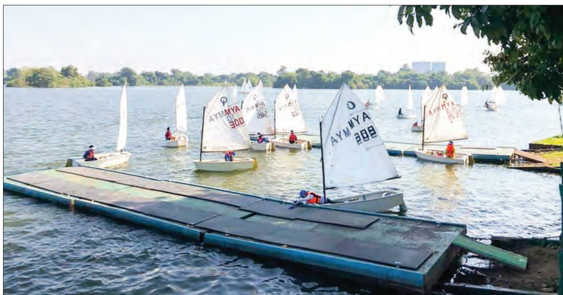
Children participate in a sailing event at the 4 th Myanmar Inter-School Sailing Championship 2019.