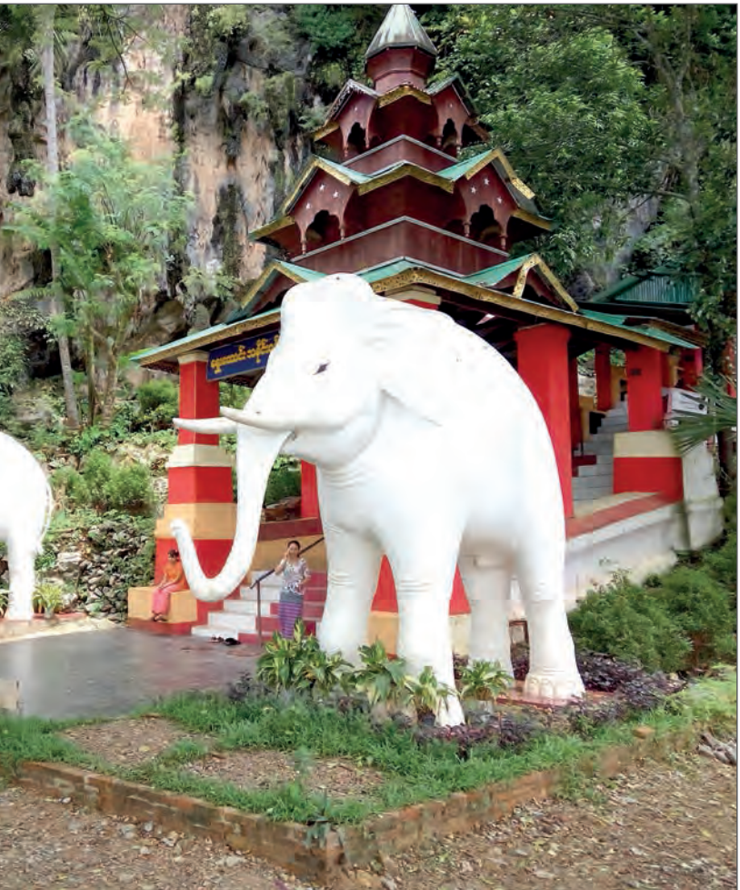
Sadan Cave entrance.

Kawwahsu Village of Kawmuta Village-tract, south of Zwekabin mountain range, 20 miles from Hpa-an. The cave at the foot of the hill is rounded by water in monsoon.