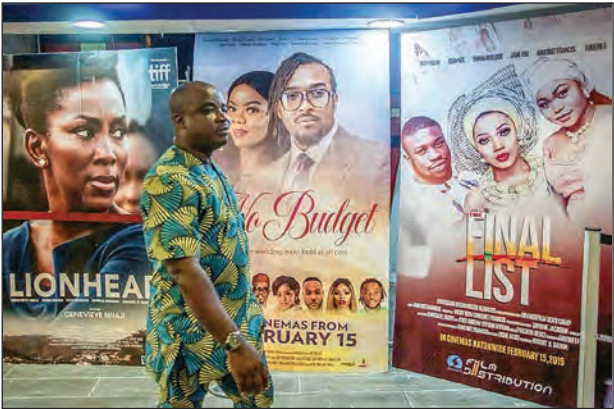
Nigeria has a thriving entertainment industry, but many of its stars and workers struggle to earn money.

LAGOS—Fake eyelashes fluttered, bespoke suits were on display and slick music videos played at the inaugural edition of The Entertainment Fair and Festival in Nigeria’s economic hub Lagos in late November. But behind the glitter, the reality of the film and music sectors in Africa’s most populous nation can often be far less glamorous: wages are low, there are no social protections and copyright law is rarely enforced. That comes despite the country boasting the second most productive film industry in the world and some of Africa’s biggest pop stars. Hits by singers like Burna Boy, Wizkid and Davido play non-stop on stations across the continent and Nollywood churns out some 2,500 movies each year. Despite the successes, revenues from Nigeria’s entertainment and media sector in 2018 lagged well behind that of the continent’s other leading economic powerhouse South Africa at $4.5 billion compared to $9.1 billion, PwC said. —AFP ■