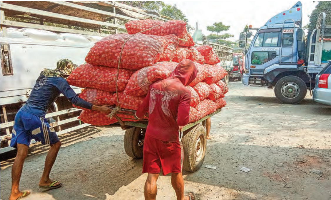
Workers carrying sacks of onion towards the truck parked near a warehouse in Yangon.

MYANMAR exported 366 tons of onions, worth US$262,400, to neighboring Bangladesh through the Sittway border gate between 23 and 29 November, according to news released online by the Ministry of Commerce. Myanmar’s onion exports to Bangladesh were lower in the week ended 29 November compared to the previous week. The local market has witnessed a huge increase in onion prices owing to strong demand from Bangladesh. However, Bangladesh suspended purchase of Myanmar onions in October-end as the price rose dramatically in Dhaka. Meanwhile, 210.455 tons of rohu worth $194,514.6 was exported to Bangladesh through