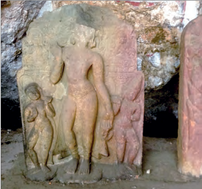
Stone reliefs in kawgun cave.

Religious images were carved in the natural caves. Later, these works became natural heritages as well as historical and cultural heritages. Conservation of natural rocky caves including three significant caves in Kayin, Mon and Shan states can contribute towards geological conditions