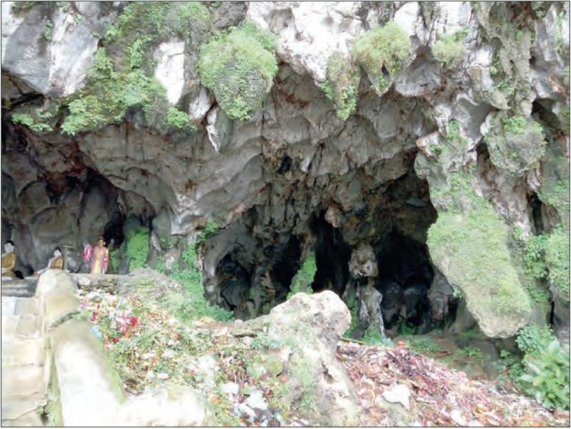
Khayon Cave. PHOTO: MAUNG THA (ARCHAEOLOGY)