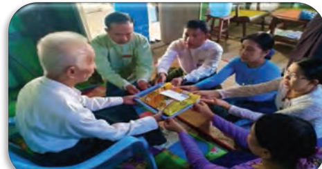
Social Pension Being Provided to the Elderly of 85 Years and Above