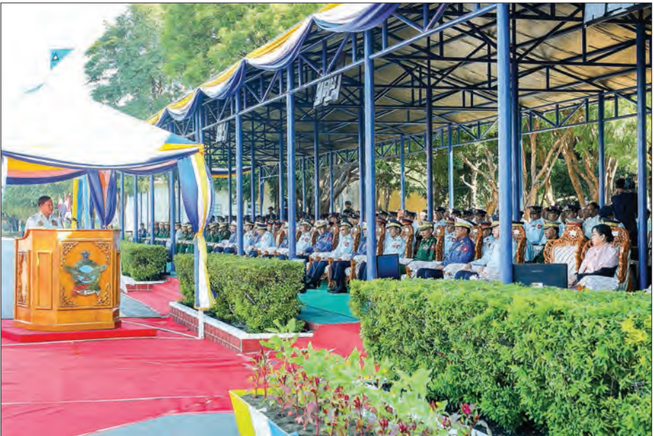
Commander-in-Chief of Defence Services Senior General Min Aung Hlaing delivers the speech at the 72 nd anniversary of Air Force.

“Natural disasters such as fires, storms, floods, thunderstorms, earthquakes, tsunamis, landslides, and drought are also threatening the people, and the Tatmadaw is ready to offer humanitarian assistance and disas-