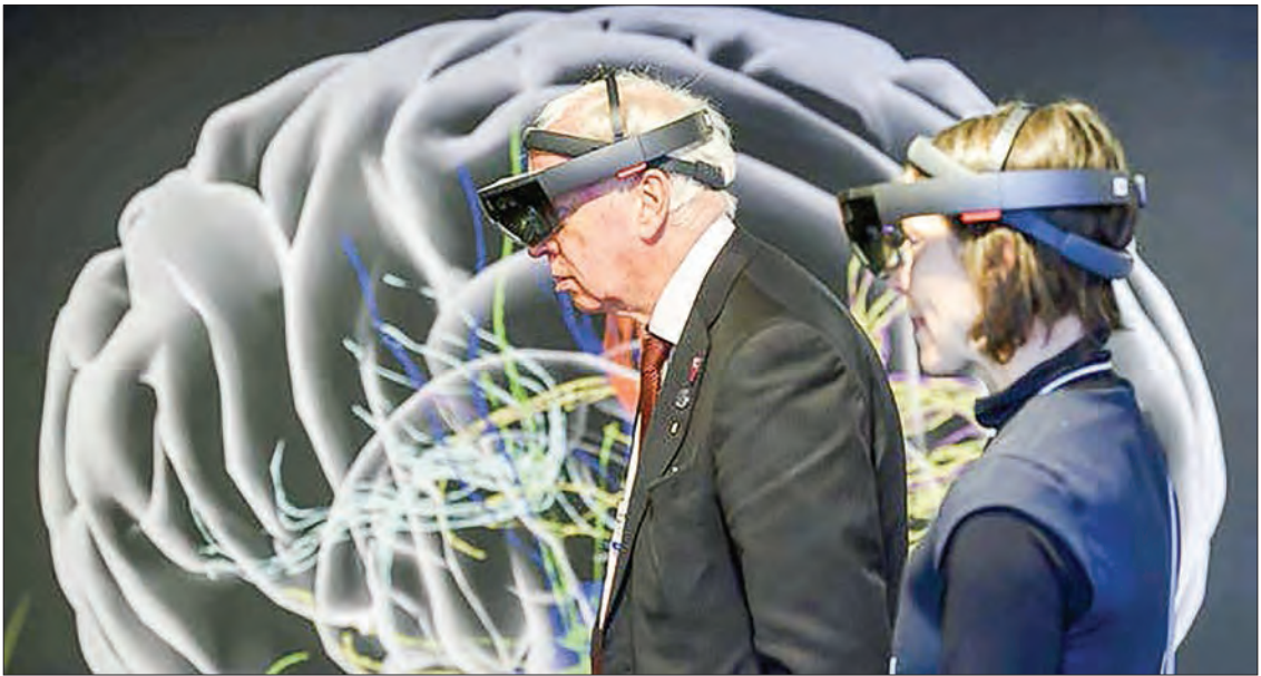
FILE PHOTO: Virtual reality could also help clinical trials of future drugs aimed at slowing down, or even halting, progression of Alzheimer’s disease, the researchers said.