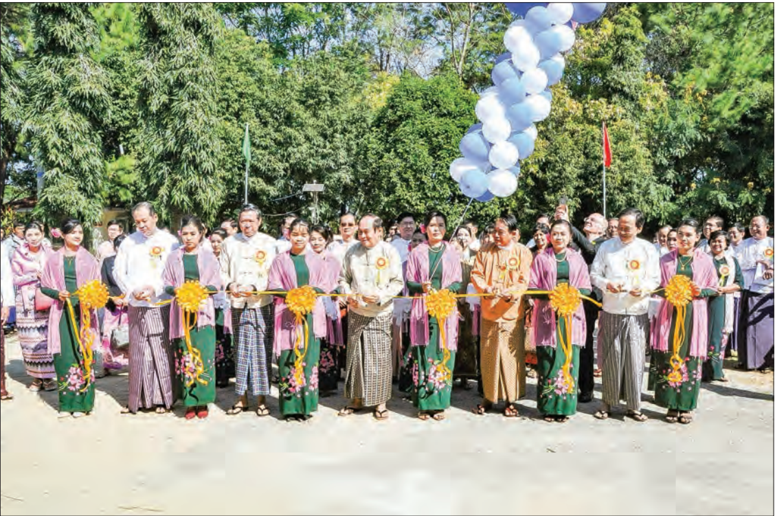
Union Minister Dr Myint Htwe, Union Minister Dr Myo Thein Gyi and officials open the PyinOoLwin branch of the Medical Research Department yesterday.