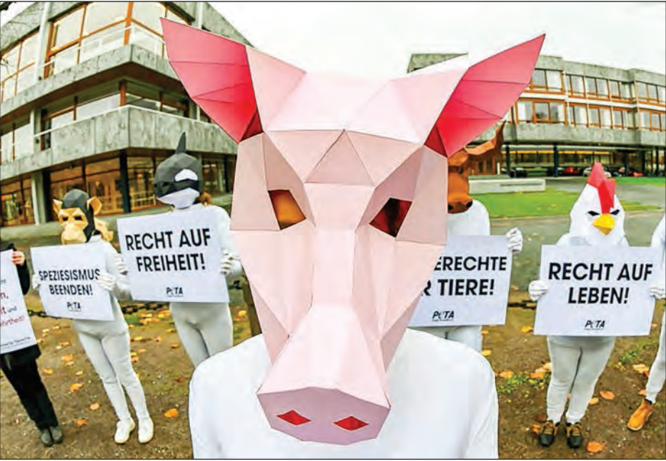
PETA argues that under German law, animals cannot be harmed without reasonable explanation.

TOKYO—Chinese companies have exported artificial intelligence surveillance technology to more than 60 countries including Iran, Myanmar, Venezuela, Zimbabwe and others with dismal human rights records, according to a report by a U.S. think tank. With the technology involving facial recognition systems that the Communist Party uses to crack down on Uyghurs and other Muslim minorities in China’s far western Xinjiang region, the report calls Beijing a global driver of “authoritarian tech.” The Carnegie Endowment for International Peace released the report amid concerns that authoritarian regimes would use the technology to boost their power and data could be sent back to China. —AFP ■