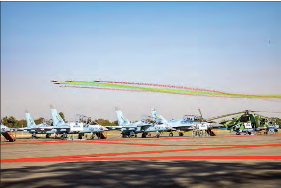
Myanmar Air Force commissions 10 new aircrafts into service to commemorate its 72 nd founding anniversary yesterday.