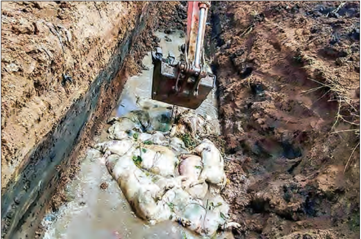
Thousands of pigs have died in more than a dozen regencies across North Sumatra over the past three months, and the pace of deaths is increasing.

predominantly Christian and where pork is an important part of local fare. Last month, more than 1,000 cholera-stricken pigs were buried in the province after their decaying carcasses were plucked from local waterways, as police searched for suspects who discarded them. Previously, lab tests found that the animals died of hog cholera but officials said they are also testing to see if any were infected with African swine fever. Neither are believed to pose a risk to humans. In 2017, a hog cholera outbreak in Indonesia’s East Nusa Tenggara province killed more than 10,000 pigs, causing severe financial losses for local farmers.—AFP ■