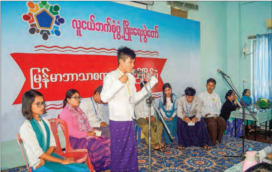
Youths competing in the Myanmar language contest.

filling the display booths. The festival is opened from morning to evening and visitors can freely peruse books at stalls before purchasing, enjoy performances from famous artistes, and participate in the sport competitions held in the university’s campus. —Min Htet Aung (Mahn Sub-printing House) ■ (Translated by Zaw Htet Oo)