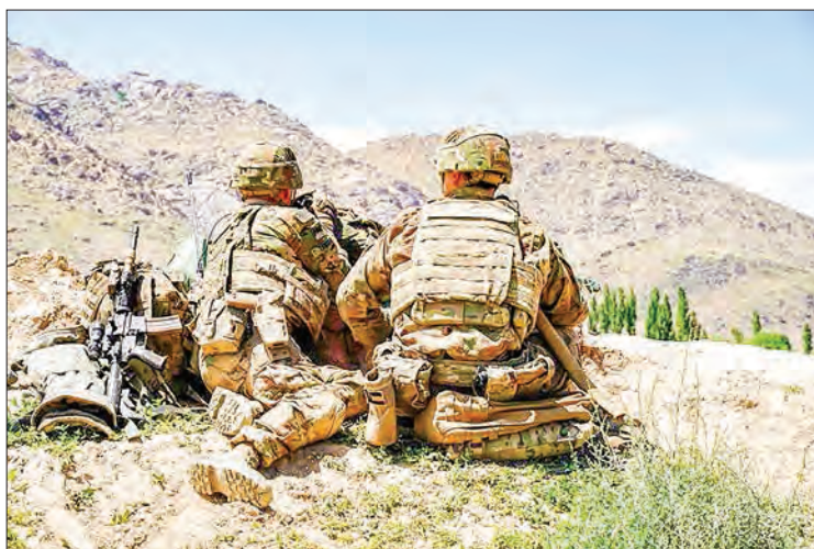
A photo taken on June 6, 2019, shows US soldiers in Afghanistan's Wardak province.

troops would be redeploying early, while others would not be replaced when they end their term.