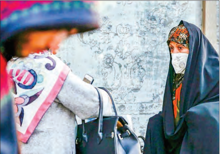
An Iranian woman wearing a breathing mask walks down a street as a blanket of smog covers Tehran.

the disease. But experiments revealing exactly how the compounds work suggested that they were targeting molecular pathways also known to be important in longevity and ageing. “The bottom line was that these two compounds prevent molecular changes that are associated with ageing,” says Maher.—ANI ■