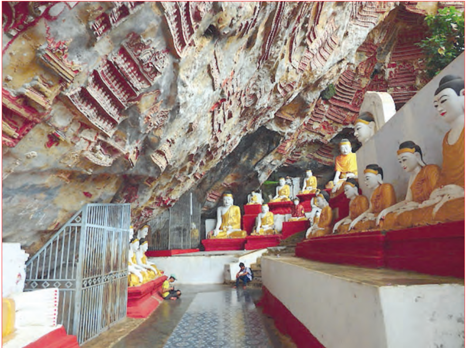
Buddha Statues in Kawgun Cave in Hpa-an.

At present, Hpa-an Township with 41 miles from the east to the west and 76 miles from the north to the south shares border with Hlaingbwe Township in the east, Mawlamyine Township in the south, Bilin and Paung townships in the west and Bilin and Papun townships in the north.