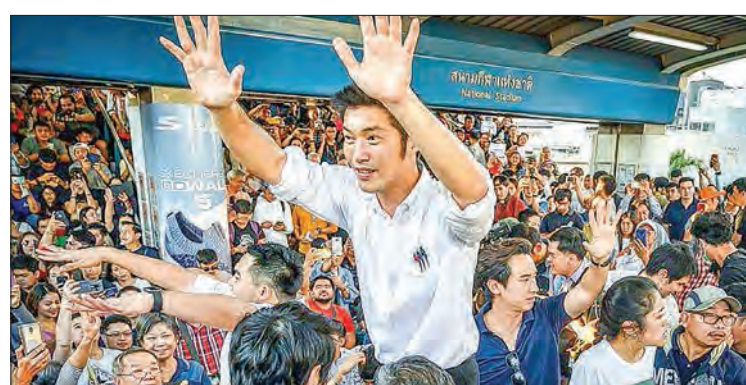
Thai Future Forward Party's leader Thanathorn Juangroongruangkit addressing his supporters during an unauthorised flash mob rally in downtown Bangkok yesterday. It revived memories of the street protests that have roiled Bangkok periodically over the past two decades of turbulent politics.

Some demonstrators held up signs calling for a change of government while others shouted slogans such as “Dictatorship Out! Let Democracy Live!”— ANI ■