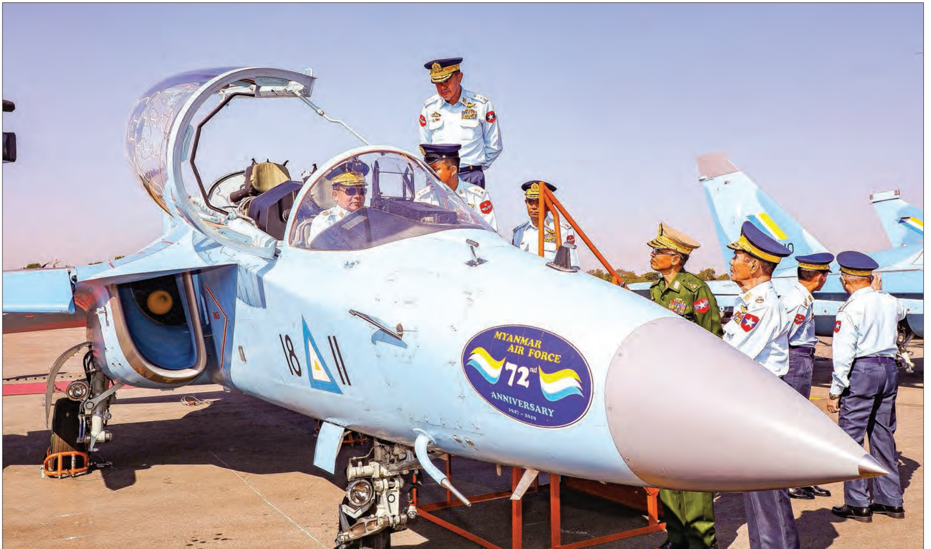
Commander-in-Chief of Defence Services Senior General Min Aung Hlaing inspects a fighter at the 72 nd anniversary of Air Force Day at the Flight Training Base in Meiktila yesterday.

T HE Myanmar Air Force yesterday commissioned 10 new aircrafts into service to commemorate its 72 nd founding anniversary.