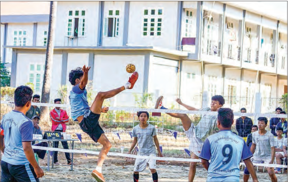
Youths competing in the Sepak takraw competition.