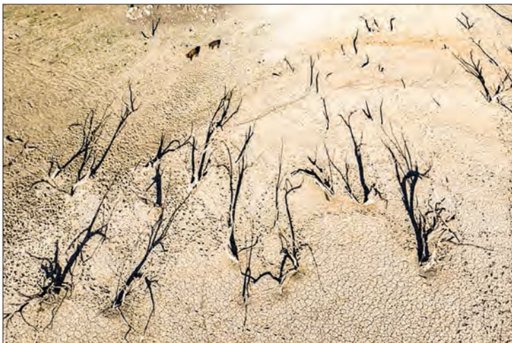
The dry lands: An aerial view of the dam floor.

The satellite program is operated by China's State Key Laboratory of Lunar and Planetary Science, which was approved by the Ministry of Science and Technology and established on Oct. 8, 2018 in Macao University of Science and Technology (MUST).— Xinhua ■