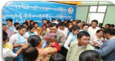
Cash Support Being Provided to Self-Help Pre-Schools, Nurseries and Mother Circle in Taunggok and Ma-Ei Towns