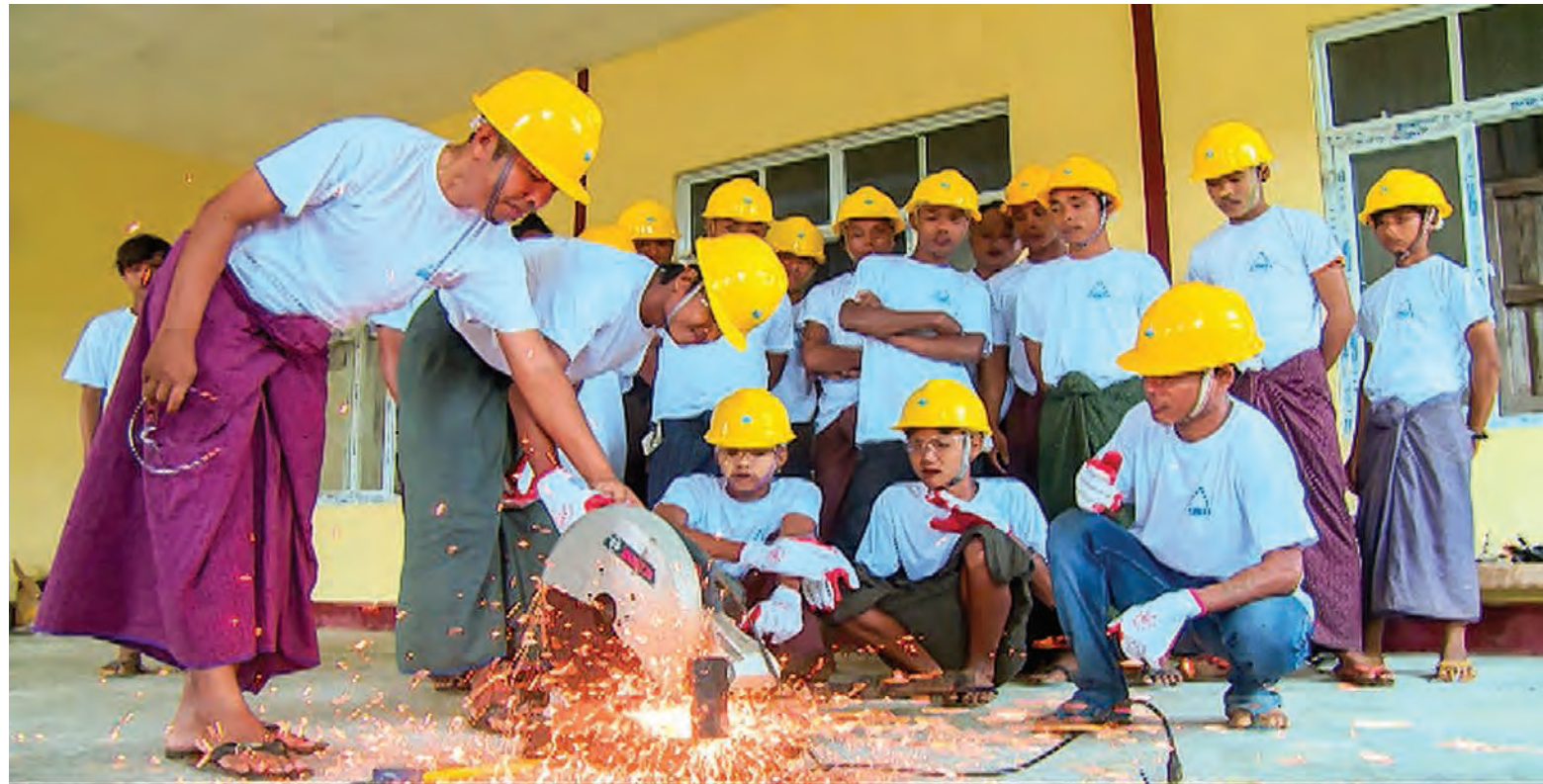
Vocational trainees learning welding techniques during vocational training course in Maungdaw.

cation Law of 2014/2015 includes provisions relating to establishment of private TVET Institutions, a specific TVET law including coverage of private sector TVET Institutions is still in the making. As of now "registration" or "permission" to establish private vocational training centres/ schools, have been made by various authorities according to relevant existing laws.