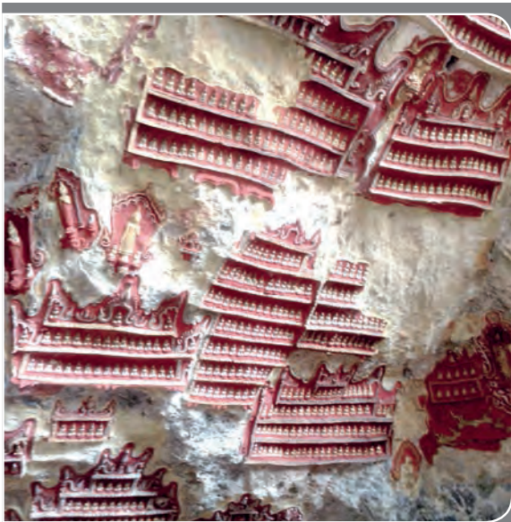
Buddha Statute Stucco on the wall of Kawgun Cave.

Hpa-an Township, at an altitude of 53 feet, is plentiful of hills. Among them, 2,727 feet high Zwegabin Hill, nine miles from Hpa-an, is the most significant. Thanlwin River, Gyaing River, Donthami Creek and Zathabyin Creek are flowing across the township. Before improvement of motor roads, vessels from