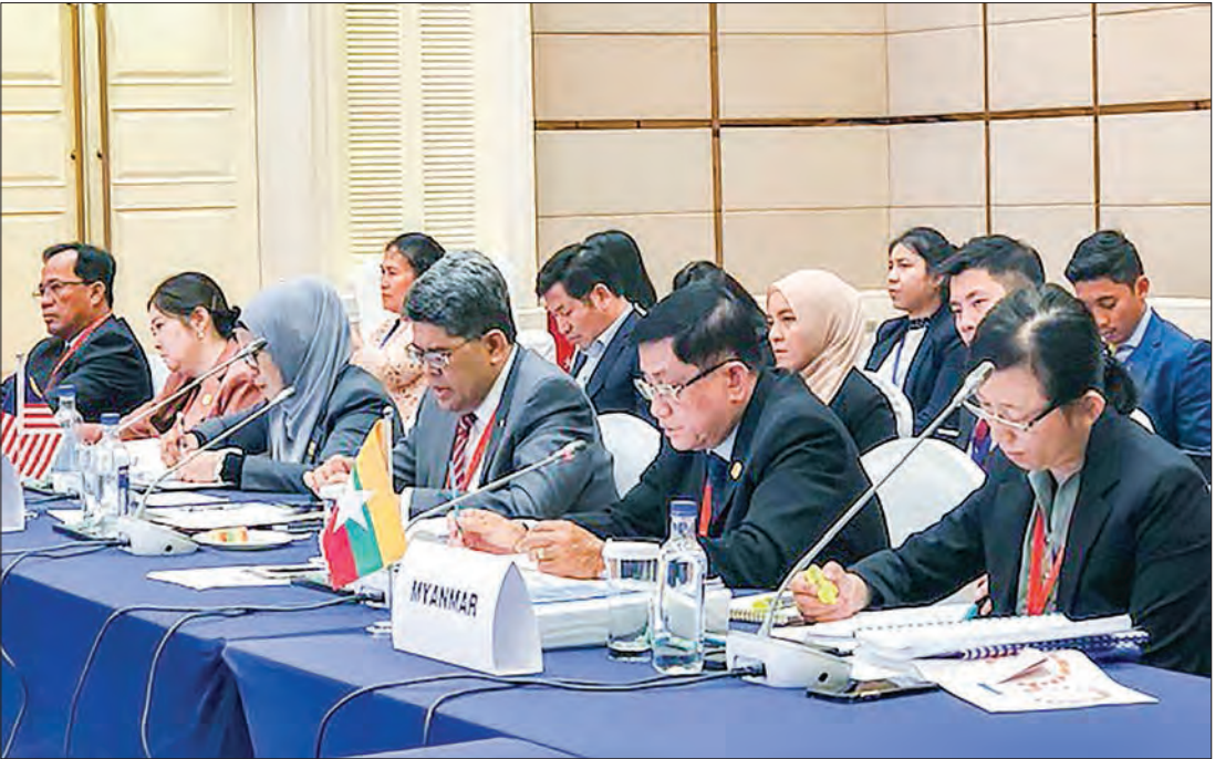
Deputy Minister U Maung Maung Win attends the ASEAN +3 Finance and Central Bank Deputies’ Meeting.

DEPUTY Minister U Maung Maung Win attended the ASEAN+China, Japan, Korea (ASEAN+3) Deputy Finance Ministers and Deputy Central Bank Governors Meeting in Xiamen, China, from 12 to 13 December. In the first day of the meeting, IMF, ADB and AMRO explained the macroeconomic situation of the world and Asian region and future prospects, the effects the free trade agreement