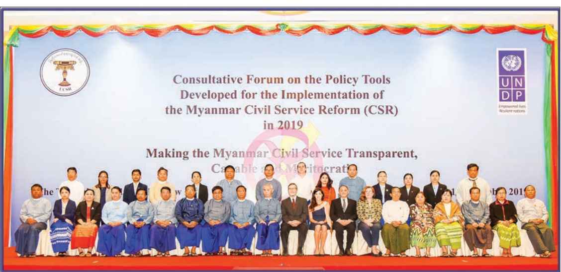
Participants pose for a photo at the “Consultative Forum on the Policy Tools Developed for the Implementation of the Myanmar Civil Service Reform (CSR) in 2019” in Nay Pyi Taw on 13 December.