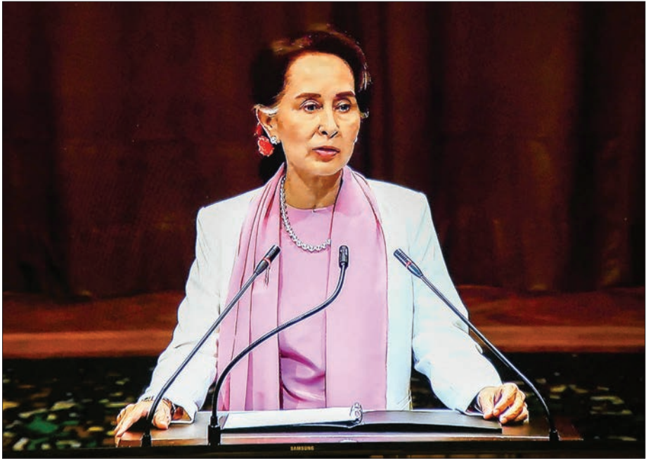
State Counsellor Daw Aung San Suu Kyi delivers the statement at the International Court of Justice (ICJ) at The Hague, the Netherlands.

THE International Court of Justice (ICJ) held the third day of oral hearings on the application submitted by The Gambia. State Counsellor Daw Aung San Suu Kyi, in her capacity as the Union Minister for Foreign Affairs appeared as Agent for Myanmar and delivered the closing oral presentation in the afternoon on 12 December 2019 at The Hague, the Netherlands. The Gambia presented its second round of oral presentations earlier in the day. Daw Aung San Suu Kyi, on behalf of Myanmar, requested the Court to remove the case from its List; or in the alternative to reject the request for the indication of provisional measures submitted by The Gambia. (The full text of the State Counsellor Daw Aung San Suu Kyi's Closing