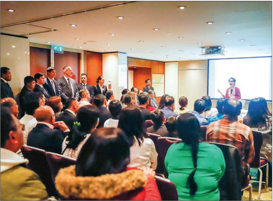
State Counsellor Daw Aung San Suu Kyi meets Myanmar citizens who came to support her at The Hague, the Netherlands.