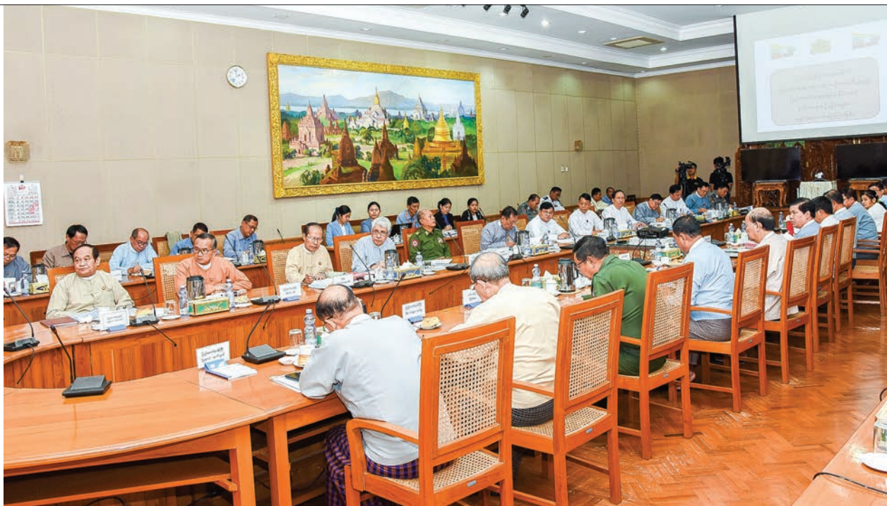
Vice President U Myint Swe addresses the coordination meeting for holding 73 rd Union Day in 2020 at the meeting hall of President's Office in Nay Pyi Taw yesterday.

T HE Central Committee for Convening the 73 rd Union Day in 2020 held a coordination meeting at the meeting hall of the Office of the President in Nay Pyi Taw yesterday, where Central Committee Chairman Vice President U Myint Swe delivered a speech.