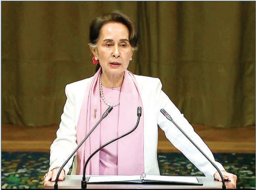
State Counsellor Daw Aung San Suu Kyi delivers statement at the International Court of Justice at The Hague, the Netherlands.

MR. President and Members of the Court, It is not disputed that Myanmar – like the United Kingdom or the United States – has a military justice system. The Constitution of Myanmar cannot and should not be ignored if we are serious about establishing constitutional democracy and rule-of-law in Myanmar. International criminal tribunals take four to eight years to undertake investigations of core international crimes, sometimes longer. Just over two years have passed since the serious internal armed conflict against the ARSA, and the second court-martial is now underway. The Gambia has not challenged the quality of the military justice in the Inn Din case, only the pardon, which many of us regret. The ongoing Gutar Pyin court-martial in Buthidaung Township should be allowed to run its course. I am confident that there will be further