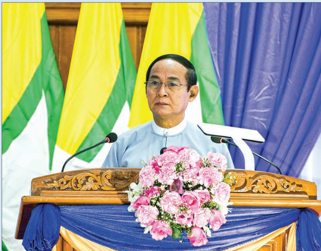
President U Win Myint addresses the ceremony commemorating the achievement of 50% nationwide electrification in Nay Pyi Taw yesterday.

In order to implement the short-term and long-term plans for the development of our country, aiming at the goals of developing the all-inclusive, sustainable economy, as outlined in the Global Sustainable Development Goals (SDGs), providing full labour employment, offering productive, decent jobs, building strong infrastructure, establishing all-inclusive, sustainable industrialization, and giving support to innovations, balancing these goals with others, we have already drawn the Myanmar Sustainable Development Plan (MSDP) 2018-2030. This MSDP had laid down the strategic plan, which covers sustainable development and the construction of the prioritized infrastructures supporting various forms of economic enterprises.