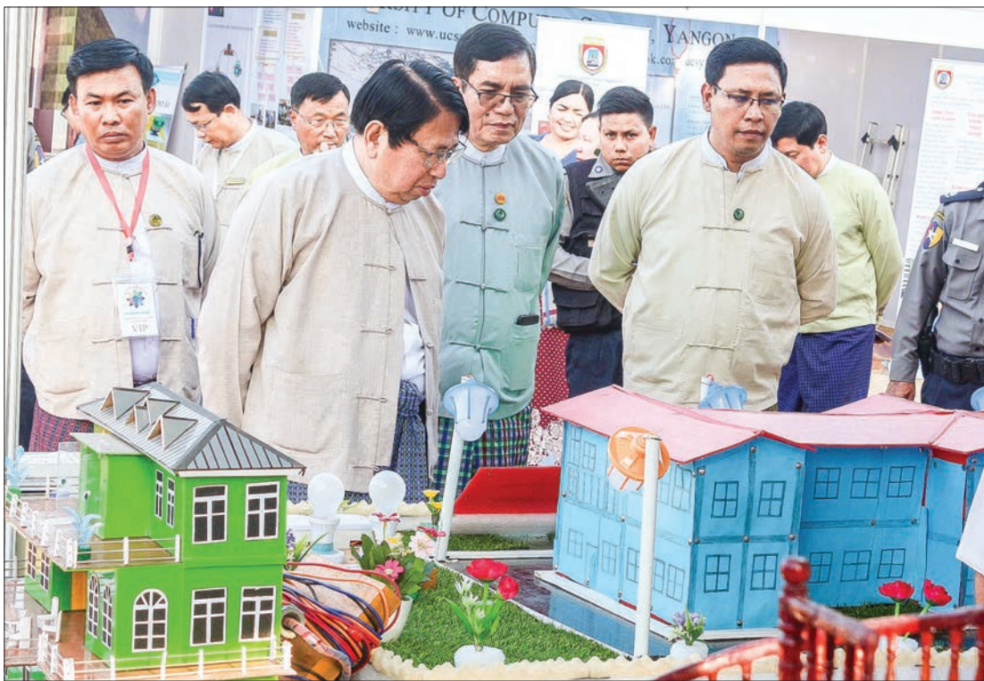
Union Minister Dr Pe Myint inspects the preparations and the layout of the exhibition halls for the All-Round Youth Development Festival (Magway) yesterday.

The All-Round Youth Development Festival (Magway) will be held from today to 16 December with over a hundred exhibition booths focusing on literature, sports, art and information technology movements. There will also be 60 bookstalls and famous artists performing at the festival. Earlier on the same day, Magway Region Chief Minister Dr Aung Moe Nyo, Deputy Minister for Information U Aung Hla Tun, regional cabinet ministers and other officials also inspect-