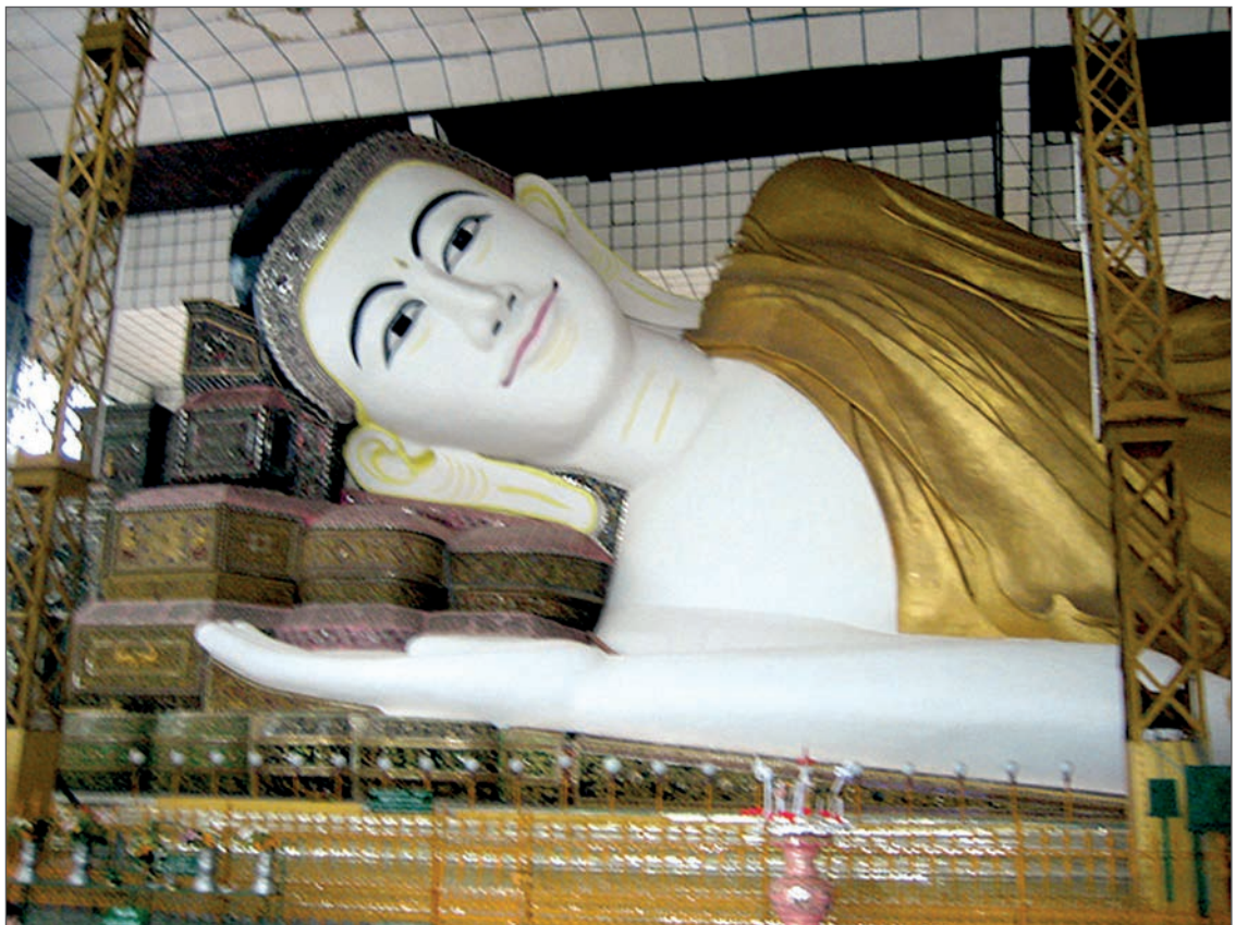
ShweThaLyaung reclining Buddha image.

Ketumati King Tabinshwehti conquered Bago in 1538 AD and