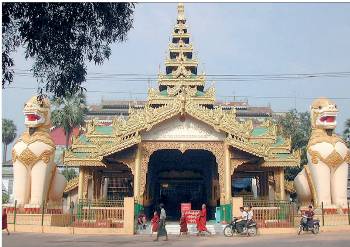
ShweThaLyaun Pagoda in Bago.

moved his throne from Toungoo to Bago. Bayintnaung succeeded to him in Bago in 1551 AD and built Kanbawzathadi Palace in 1553 AD. King Bayintnaung then established the Second Myanmar Empire based on Bago.