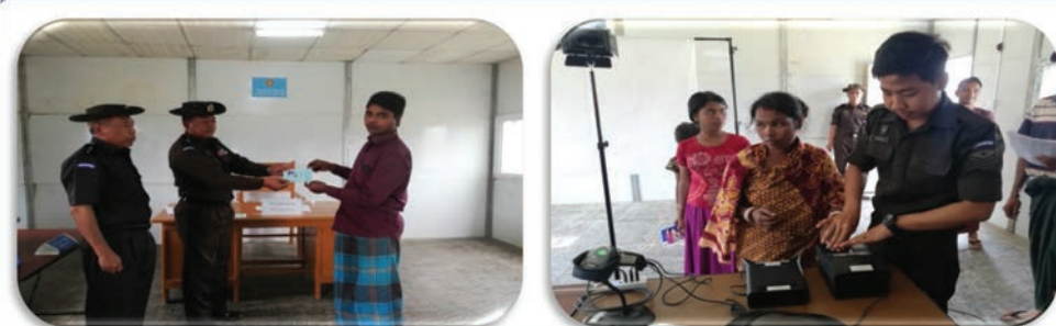
National Verification Cards being issued in Maungdaw District.

The number of persons who were issued Citizenship Scrutiny Cards and National Verification Cards are as follows.