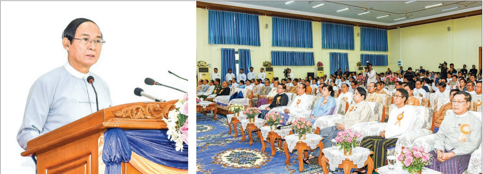
President U Win Myint delivers the opening speech at the ceremony to commemorate the achievement of 50% nationwide electrification in Nay Pyi Taw, yesterday.

Next, the President, both Hluttaw Speakers and Union Minister U Win Khaing unveiled