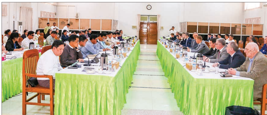
Deputy Minister for Investment and Foreign Economic Relations U Bharat Singh and Deputy Minister for Economic Development of the Russian Federation Mr Timur Maksimov hold a meeting in Nay Pyi Taw yesterday.