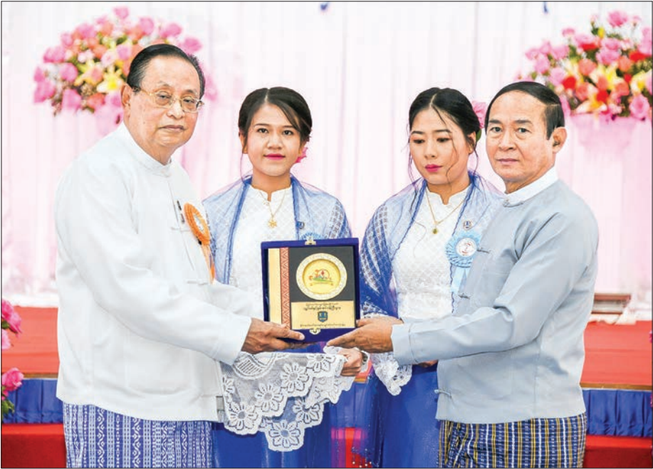
President U Win Myint accepts a gift commemorating the event for the achievement of 50% nationwide electrification from Union Minister U Win Khaing in Nay Pyi Taw.

A CEREMONY to celebrate the achievement of 50% nationwide electrification was held at the Ministry of Electricity and Energy, in Nay Pyi Taw, yesterday. Firstly, President U Win Myint delivered the opening speech at the ceremony which was also attended by Pyithu Hluttaw Speaker U T Khun Myat, Amyotha Hluttaw Speaker Mahn Win Khaing Than, Union Ministers, Union Attorney-General, Nay Pyi Taw Council Chairman, Pyithu Hluttaw Electricity and Energy Development Committee Chairman, Amyotha Hluttaw Construction, Industry, Electricity and Energy Committee Chairman, Deputy Ministers, state/regional cabinet ministers, permanent secretaries, departmental officials, corporation chairmen, chief