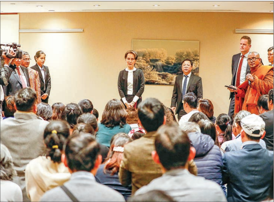
State Counsellor the Daw Aung San Suu Kyi meets Myanmar citizens who came to support her at The Hague, the Netherlands.