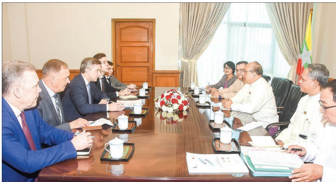
Union Minister U Thaung Tun meets with a business delegation led by Deputy Minister for Economic Development of the Russian Federation Mr. Timur Maksimov in Nay Pyi Taw yesterday.

The Russian business delegation will meet to discuss with the responsible persons from National Economic Coordination Committee, Ministry of Transport and Communications and also Ministry of Natural Resources and Environmental Conservation with the aims to promote investment in Myanmar.—MNA