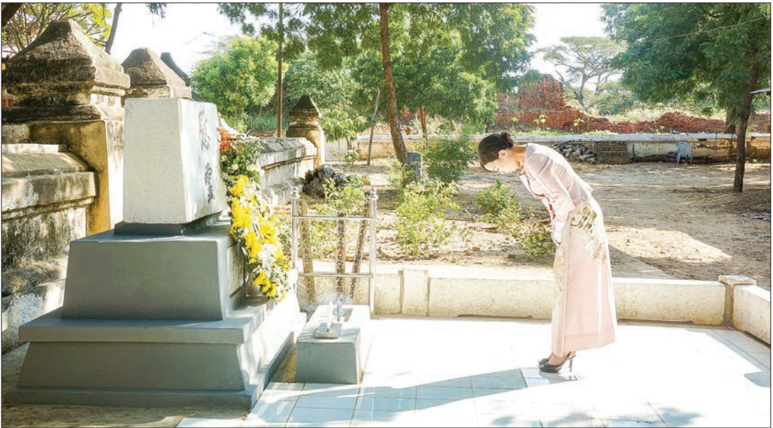
Japanese Princess Yoko Mikasa pays tribute to Japanese soldiers fallen during the WWII near Thatbyinnyu Temple.

DURING her visit to Myanmar, Japanese Princess Yoko Mikasa traveled to Bagan's Heritage Site and visited the Thatbyinnyu Temple, Ananda Temple and Lawkananda Pagoda yesterday. In addition, the Princess and entourage visited the Japanese war cemetery and its peace monument near Thatbyinnyu Temple and laid wreaths for the fallen Japanese soldiers of WWII. Princess Yoko and her entourage returned to Yangon from Bagan-NyaungU later in the evening. — Pe Lain (Bagan) (Translated by Zaw Htet Oo)