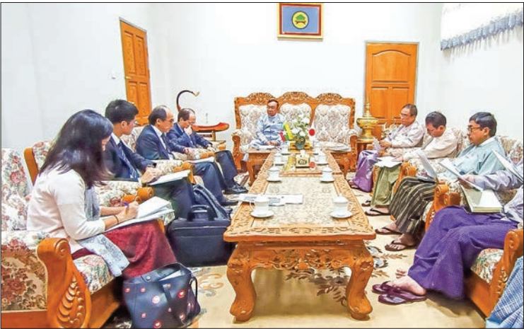
Union Minister U Han Zaw meets with Japanese Ambassador Mr Ichiro Maruyama in Nay Pyi Taw yesterday.

UNION Minister for Construction U Han Zaw received Ambassador of Japan Mr Ichiro Maruyama at the guest hall of the ministry in Nay Pyi Taw yesterday. During the meeting, they discussed Yangon Outer Ring Road project and development of roads and bridges. — MNA (Translated by TTN)