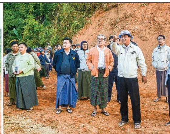
Rakhine State Chief Minister U Nyi Pu inspects the construction site of Kwinlyarshay reservoir in Gwa Township yesterday.