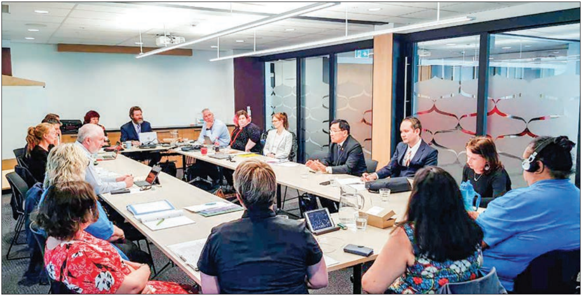
Union Minister Dr Win Myat Aye holds talks with members from disabled supporting networks of New Zealand in Wellington, New Zealand, yesterday.