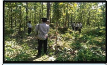
Removing Closely Packed Trees