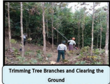
Trimming Tree Branches and Clearing the Ground