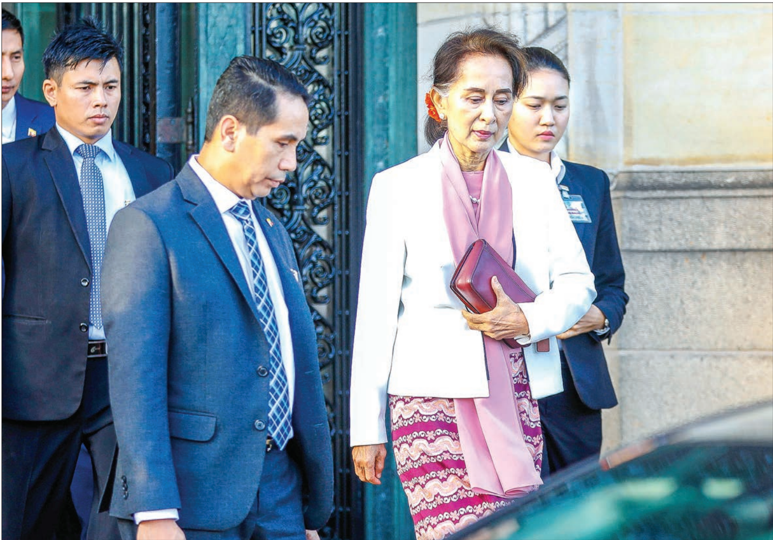
State Counsellor and Union Minister for Foreign Affairs Daw Aung San Suu Kyi leaves the International Court of Justice (ICJ) on the third day of The Gambia against Myanmar at The Hague, The Netherlands.

S TATE Counsellor Daw Aung San Suu Kyi, as the Union Minister for Foreign Affairs and the Agent of Myanmar, attended the second oral proceedings’ first session on the third day of The Gambia against Myanmar at the International Court of Justice at The Hague, Netherlands, at 10 am yesterday morning local time. It was also attended by Union Ministers U Kyaw Tint Swe, and U Kyaw Tin, Myanmar Ambassador to the Netherlands and Belgium U Soe Lin Han and delegation, local and foreign lawyers for the Myanmar government and members of legal support group. The second session of Myanmar’s oral proceedings was also held at 4:30 pm local time. Myanmar expats in the Netherlands and other foreign countries who came to support the State Counsellor cheered and gave her moral support outside the ICJ on the third day of oral proceedings.—MNA