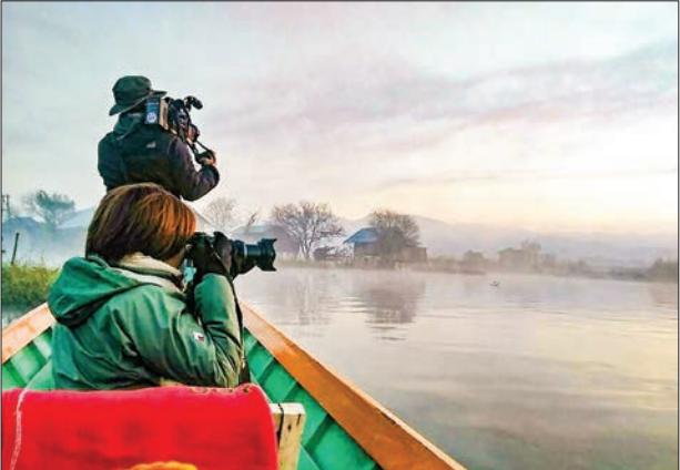
NHK Japanese film crew shooting scenic view of Inle Lake in Nyaungshwe, Shan State.

They will film in this area from 13 to 21 December for the documentary titled ‘Innocent and Simple People’ that will present loving-kindness of Myanmar ethnic people on pets, and it is scheduled to be aired at NHK BS Premium channel in early 2020.—Nyein Ko Ko Tun (FDC) (Translated by Aung Khin)