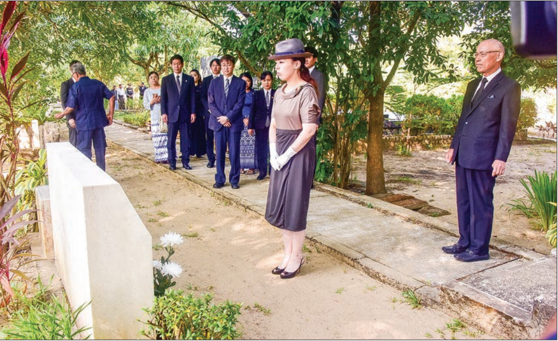
Japanese Princess Yoko Mikasa visits Yeway Japanese Cemetery in Mingaladon Township, Yangon, yesterday.

JAPANESE Princess Yoko Mikasa, who is in Myanmar at the invitation of State Counsellor, and her entourage visited Yeway Japanese War Cemetery in Mingaladon Township, Yangon, yesterday morning. The Princess, her party and officials from the Japanese embassy in Myanmar looked at the peace monument and other memorials in the cemetery. They took a flight to Bagan-NyaungU ancient city and arrived at the