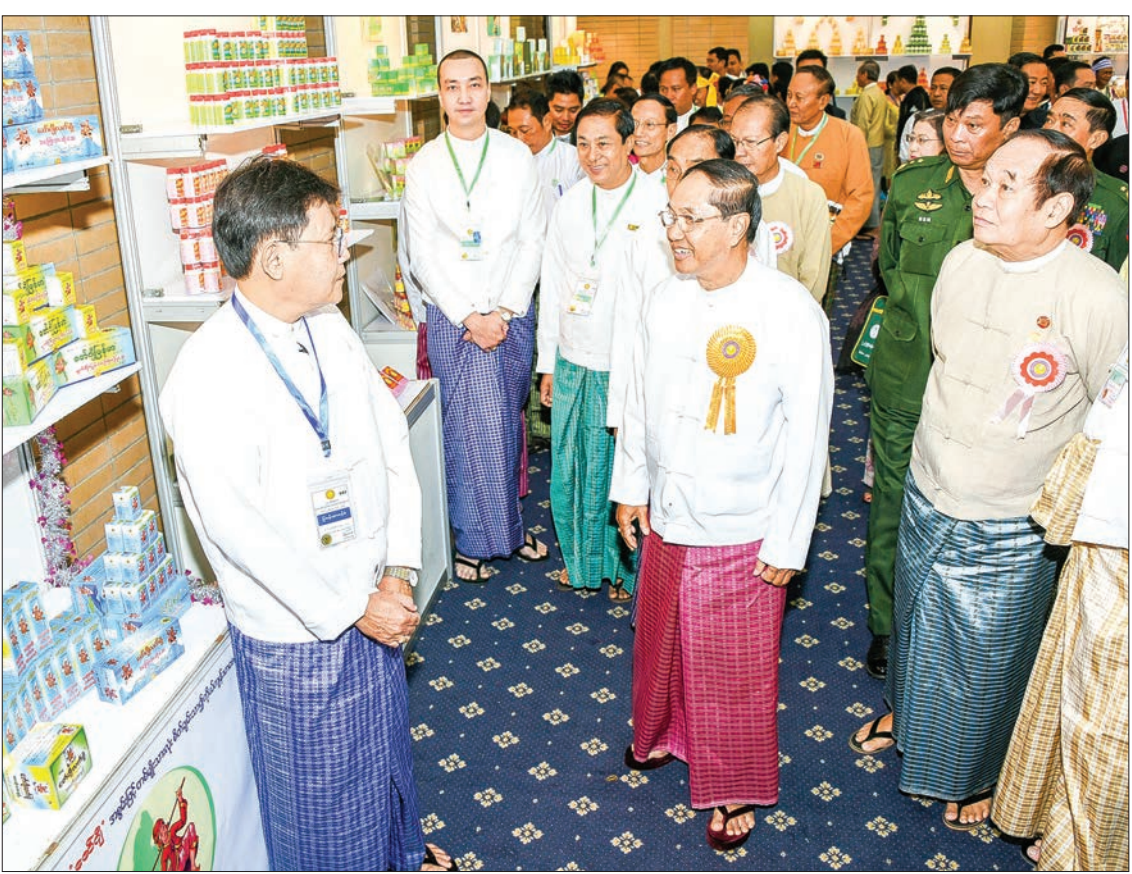
Vice President U Myint Swe observes the booth displayed at the event to mark the 20 th Traditional Medicine Practitioners Conference in Nay Pyi Taw yesterday.