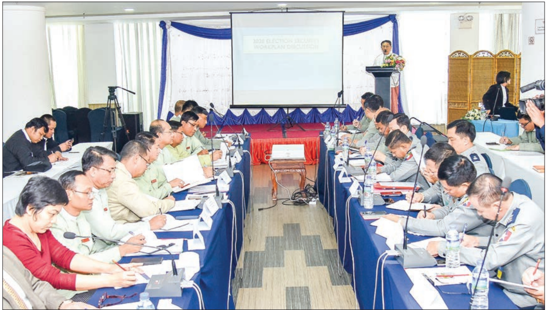
Union Election Commission Chairman U Hla Thein delivers the speech at the 2020 General Election Security Work plan Discussion in Nay Pyi Taw yesterday.

THE Union Election Commission co-organized a meeting with the United States Institute of Peace (USIP) yesterday morning to discuss preparations of security measures for the 2020 General Election. The meeting at the Mingalar Thiri Hotel in Nay Pyi Taw was attended by UEC members, representatives from its State/Region offices, officials from the General Administration Department, officers from Myanmar Police force and responsible persons from the USIP. U Hla Thein, the Chair-