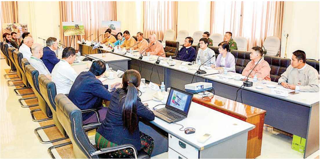
Pyithu Hluttaw's International Relations Committee U Zaw Thein holds talks with Ambassador of Israel Mr Ronen Gilor in Nay Pyi Taw yesterday.

Pyithu Hluttaw's International Relations Committee U Zaw Thein received Ambassador of Israel Mr Ronen Gilor at meeting hall of I-5 Hluttaw Building in Nay Pyi Taw yesterday. During the meeting, they discussed and exchanged views on long-lasting and strong relations of Myanmar and Israel, current relations of Israel and its neighbouring countries, Israel's cooperation in agro-technology and agriculture of Myanmar, sending more trainees from Myanmar for agricultural training in Israel, promoting mutual relations among members of parliaments of the two countries. — MNA (Translated by TTN)