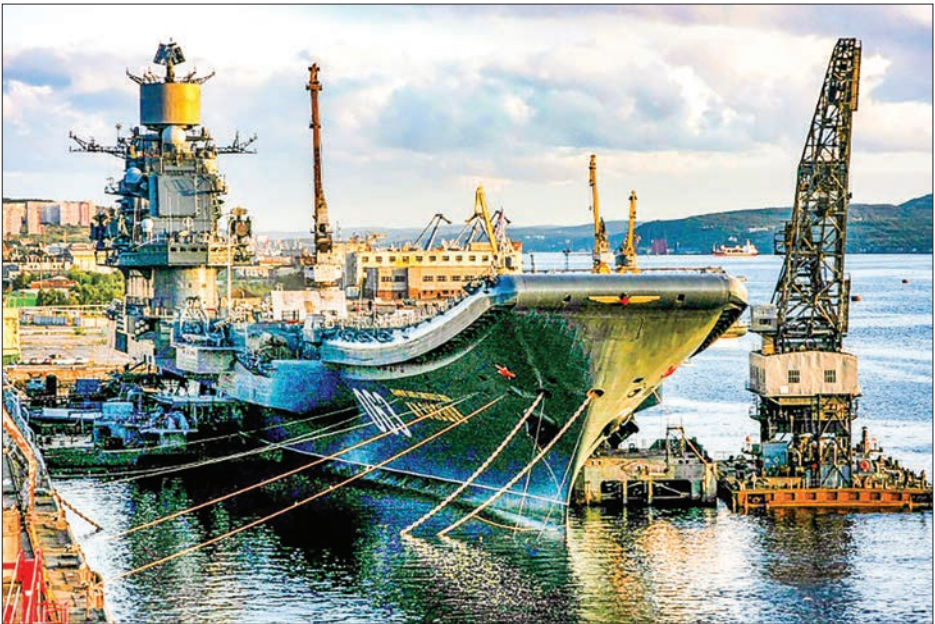
The Admiral Kuznetsov has been undergoing repairs for more than two years.

MOSCOW—A fire broke out Thursday on Russia’s only aircraft carrier as it underwent repairs in an Arctic shipyard, Russian news agencies said, with at least one worker reported missing. The Admiral Kuznetsov has been undergoing repairs for more than two years in Murmansk and suffered previous damage in October 2018 when a crane crashed onto its deck. State news agency RIA Novosti quoted a source in the Zvezdochka shipyard as saying the fire broke out during welding operations. More than 400 people were on board when the fire erupted, state news agency TASS quoted a Zvezdochka spokesman as saying. News agency Interfax reported that the fire had spread over an area of about 600 square metres (6,500 square feet).