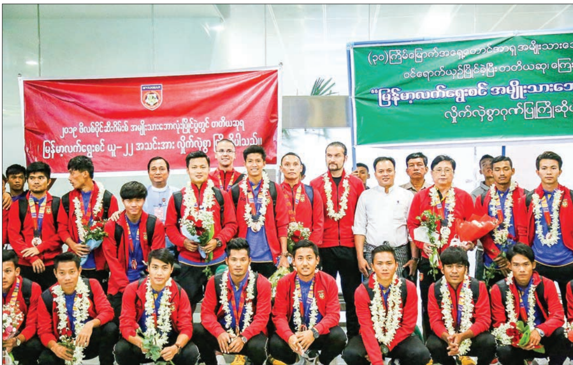
The Myanmar U-22 men's football team, coaches, and officials pose for a group photo at the Yangon International Airport yesterday.

In the SEA Games men's football history, Myanmar has won 14 medals: five gold medals, four silver medals, and five bronze medals, and stands in the third in the medal-winners ranking for the SEA Games men's football event, while Thailand is in the first place with 16 golds, 4 silvers and 5 bronzes, and Malaysia is in the second with 6 gold, 6 silver, and 7 bronze medals.—Lynn Thit (Tgi)