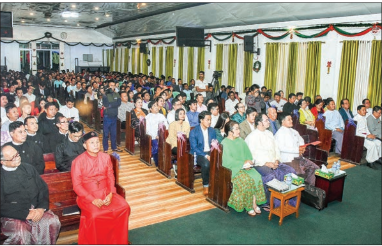
Union Minister Thura U Aung Ko addresses the ceremony to mark Christmas Eve in North Dagon Myothit Township, Yangon, yesterday.