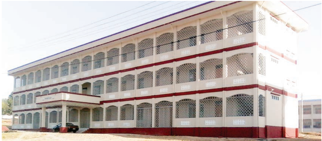
Photo shows a newly constructed education college in Katha, Sagaing Region.

“The education college was built on 32.45 acres of land near the entrance gate of Katha town on Lanmadaw road. The project was implemented with an allocation of K100 million from the Union budget for the 2015-2016 financial year. In the 2017-2018FY, the government allocated another K2.4 billion. So, they have constructed classrooms and staff housing. Now, the whole project is complete.