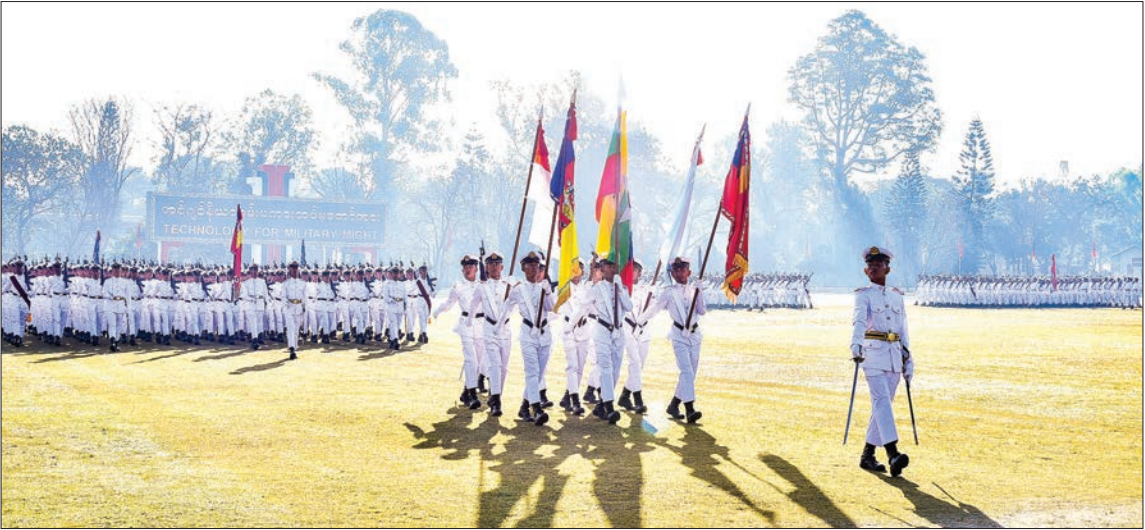
Senior General Min Aung Hlaing receives the salutes of graduation parade of the 21 st Intake of Defence Services Technological Academy (DSTA) in Pyin Oo Lwin yesterday.