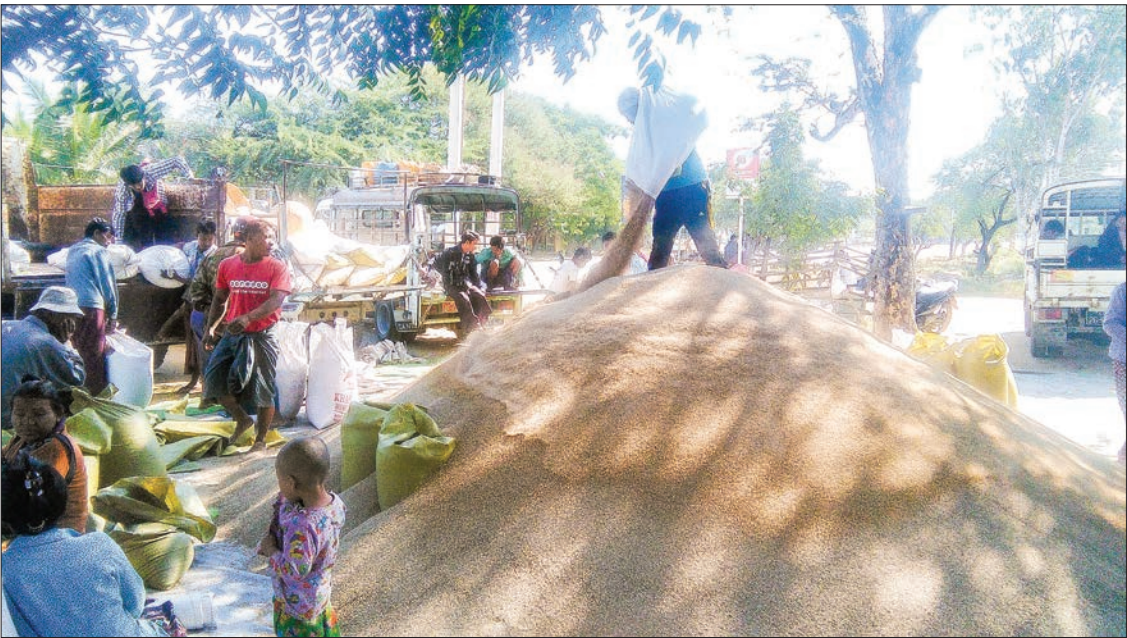
Farmers are selling their sesame seeds at a sesame trading centre in Myinmu Township, Sagaing Region.