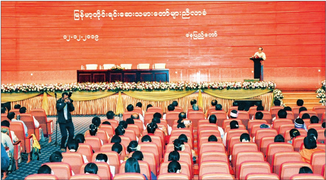
Union Minister Dr Myint Htwe addresses the 20th Myanmar Traditional Medicine Practitioners’ Conference at the Myanmar International Convention Centre-2 in Nay Pyi Taw yesterday.

BERLIN—Germany on Thursday criticised a vote by US lawmakers on a bill that would sanction contractors working on a Russian pipeline to Germany, saying Washington should mind its own business. “European energy policy is decided in Europe, not in the US,” Foreign Minister Heiko Maas said on Twitter. “We reject external interference and sanctions with extra-territorial effect as a matter of principle,” he said. The 9.5 billion euro ($10.6 billion) Nord Stream 2 pipeline will run under the Baltic Sea and is set to double shipments of Russian natural gas to Germany. The German-Russian Chamber of Commerce (AHK) said the pipeline was important for the energy security of Europe as a whole and called for retaliatory sanctions against the United States if the bill passes. “Europe should respond to sanctions that damage Europe with counter-sanctions,” Matthias Schepp, head of the AHK, said in a statement. Schepp said the sanctions would end up affecting European companies more than Russia.—AFP ■