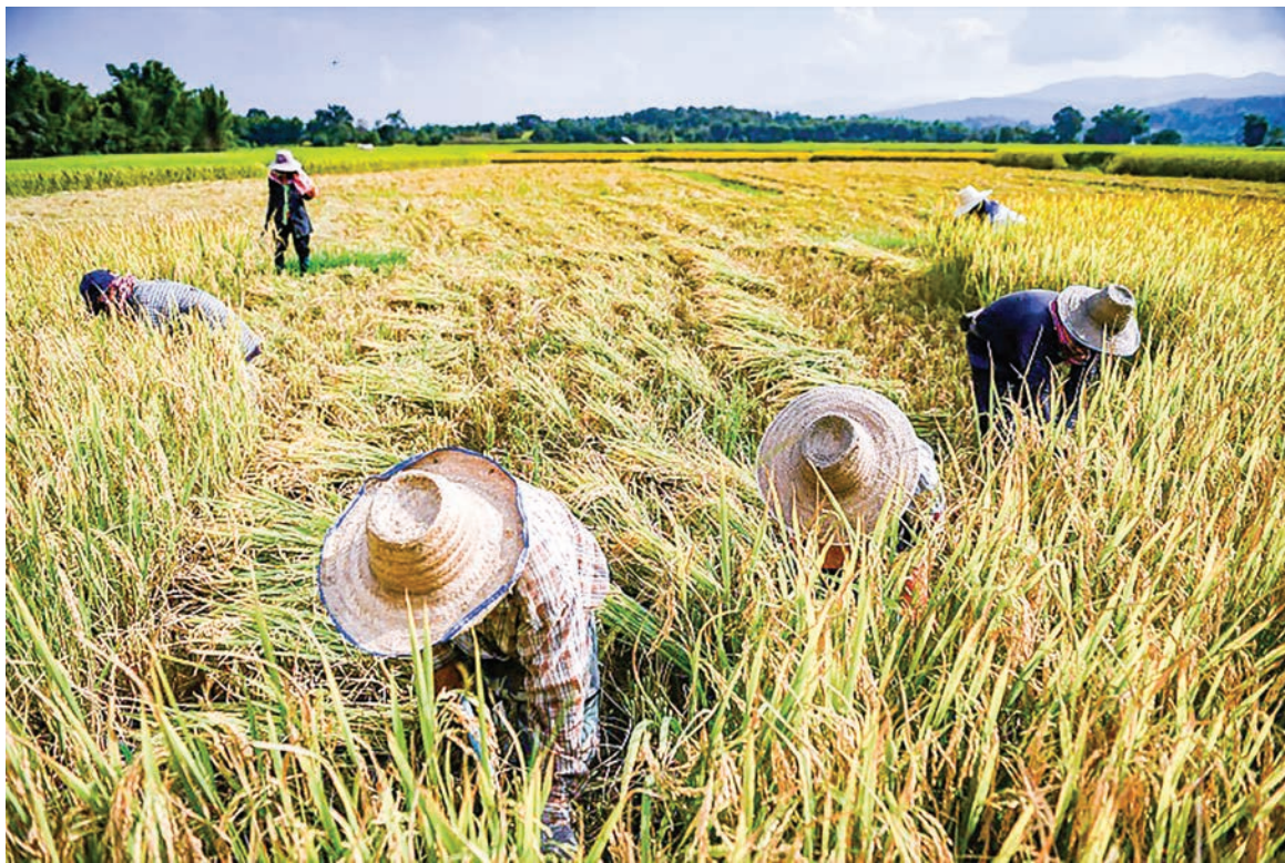
Farmers harvesting rice in the village of Mae Rim in the northern Thai province of Chiang Mai.