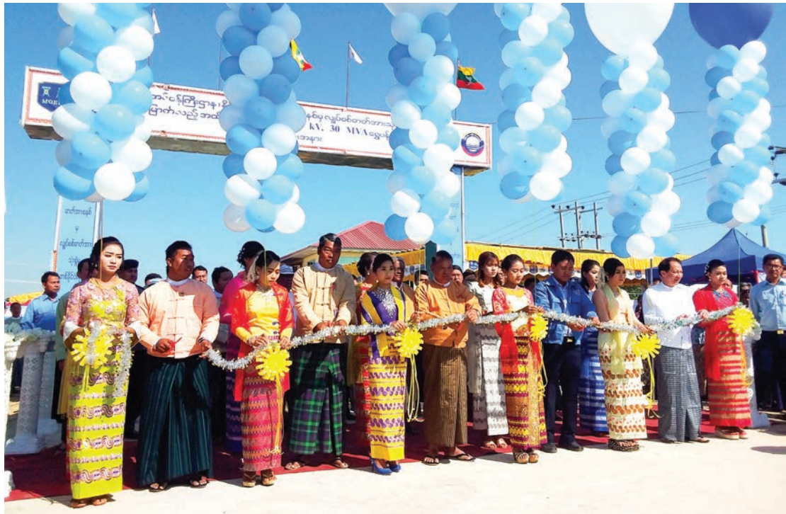
Sagaing Region Chief Minister Dr Myint Naing and officials open 66/33KV 30MVA Shwe Pan Gon power substation in Wetlet.

The new Shwe Pan Gon power substation was con-