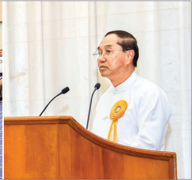
Vice President U Myint Swe gives the opening address at the 20 th Myanmar Traditional Medicine Practitioners' Conference in Nay Pyi Taw yesterday.

lecting a record of the hidden history of Myanmar traditional medicine. This achievement can be found as a significant milestone in the history of traditional medicine in Myanmar.