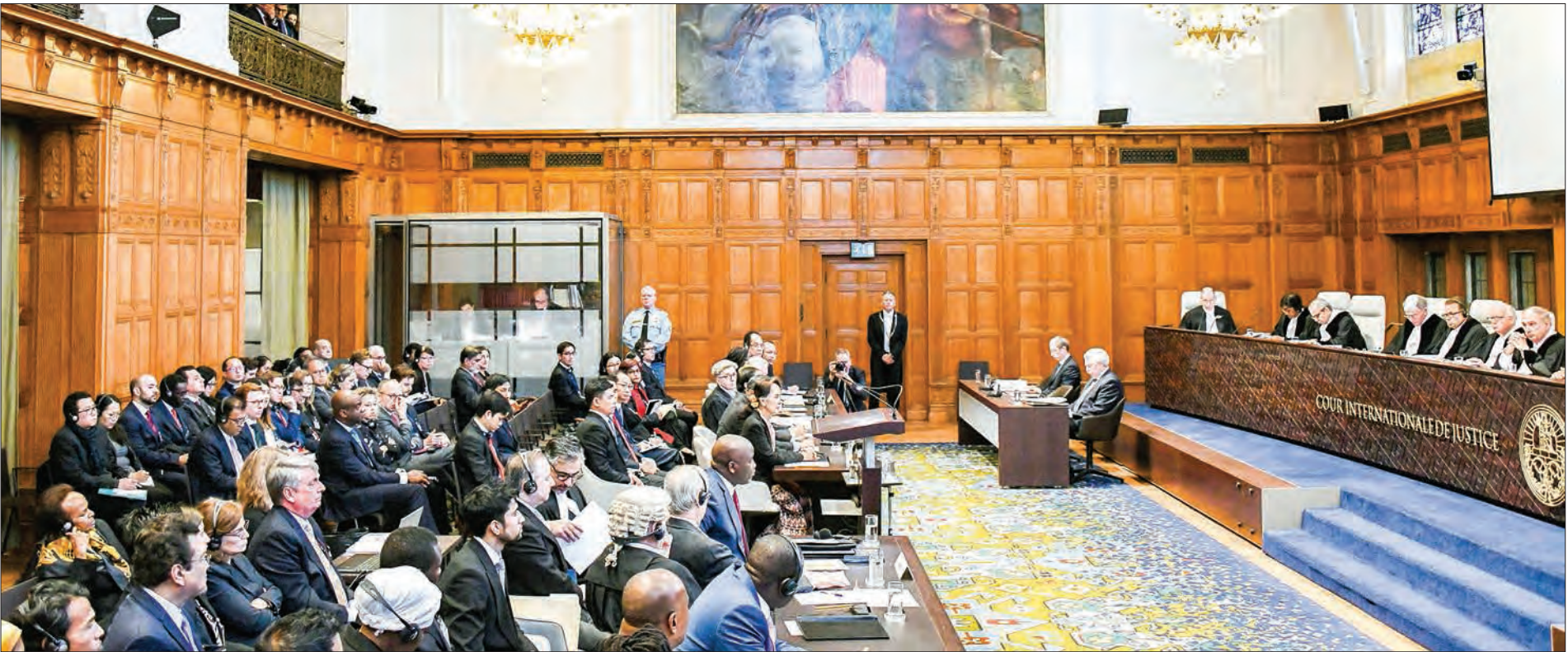
State Counsellor Daw Aung San Suu Kyi attends the first oral hearing in the International Court of Justice at The Hague, Netherlands. (NEWS ON PAGE-1)