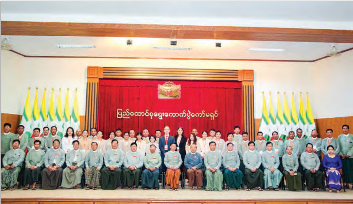
UEC Chairman U Hla Thein and officials pose for a documentary photo at the opening ceremony of the Conflict Resolution Training (Core Mediation) course in Nay Pyi Taw yesterday.

THE Union Election Commission, in corporation with the Netherlands Institute for Multiparty Democracy and Political Parties of Finland for Democracy (NIMD/Demo Finland),