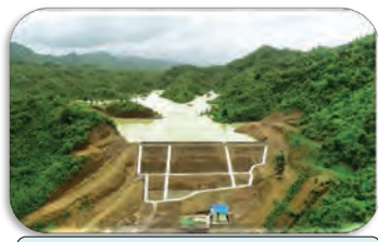
Construction of Yotayoke Hillside Dam in Ponnakyun Township

During the reporting period, 63 out of 138 projects for the construction and maintenance of dams, irrigation canals and embankments in Rakhine State were completed.