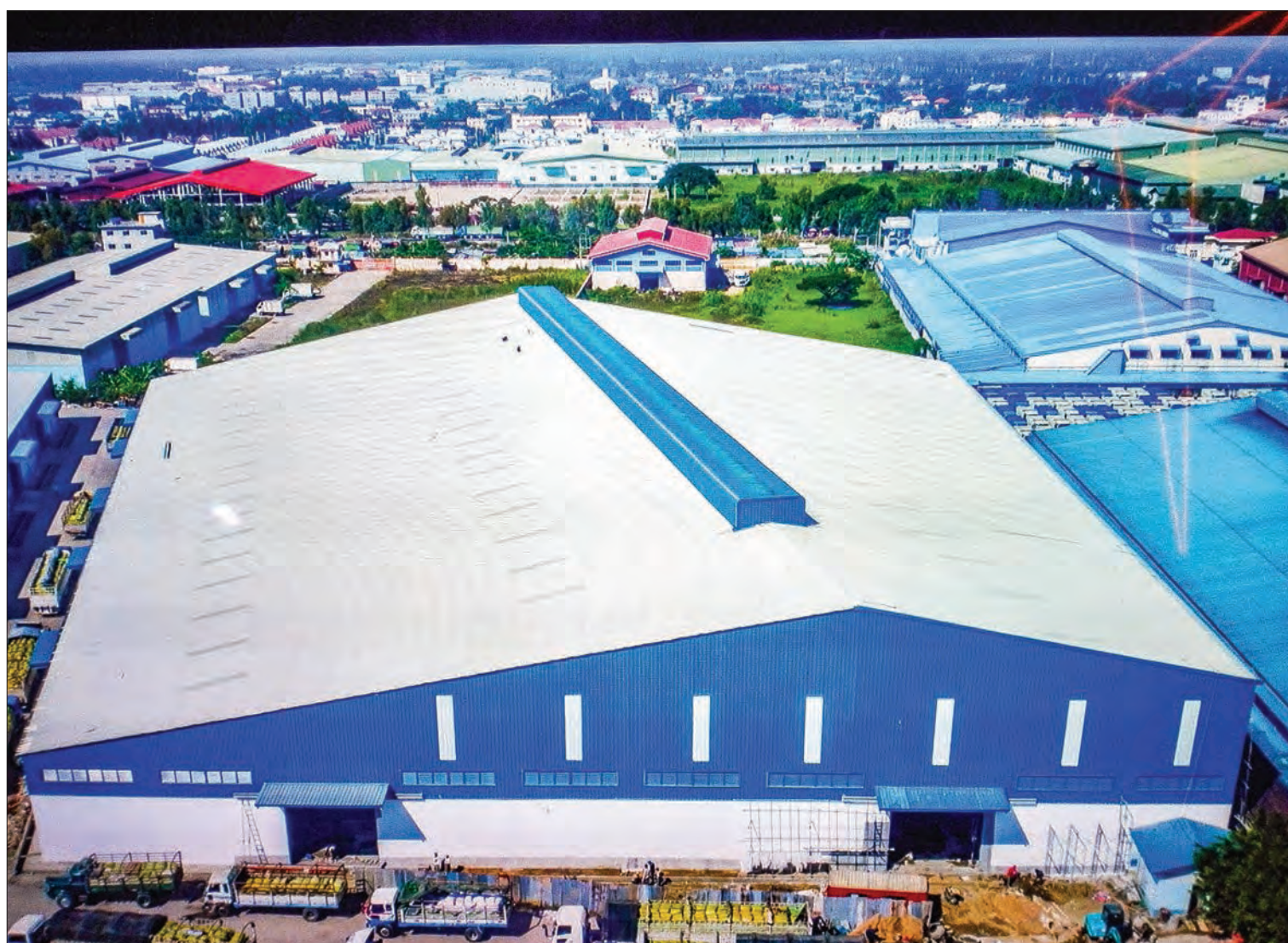
A bird's-eye view of PEB Steel Myanmar's steel plant.

The Union Minister went on to say that the government has taken a number of significant measures to ensure that it will be much easier for foreign investors to do business in Myanmar.