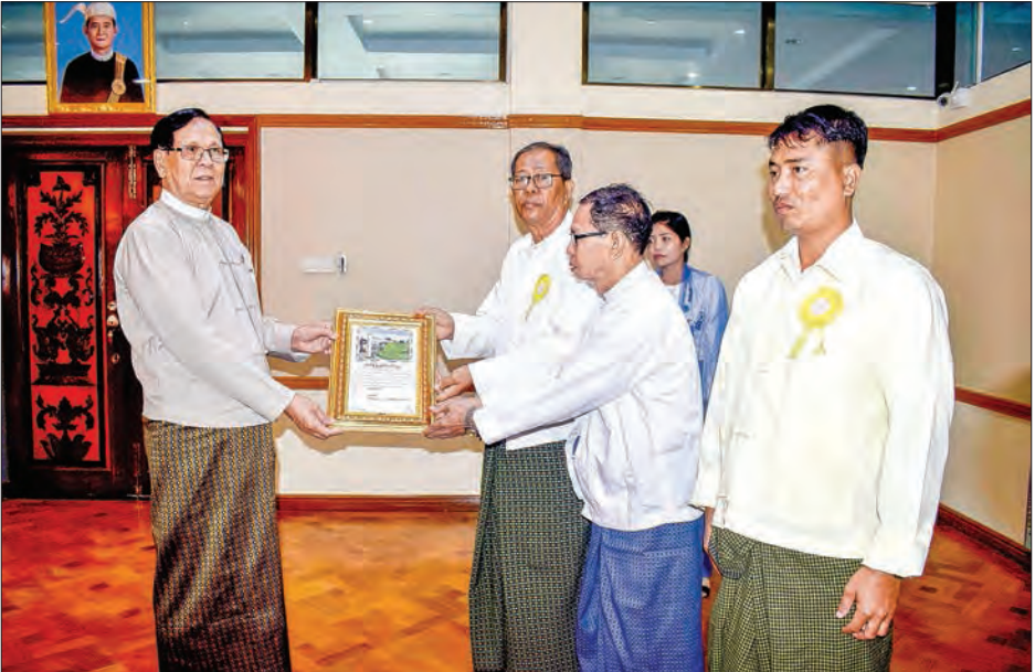
Amyotha Hluttaw Deputy Speaker U Aye Tha Aung accepts the certificate of honour for donation from Yin Yoe pagoda's board of trustee in Rakhine State.