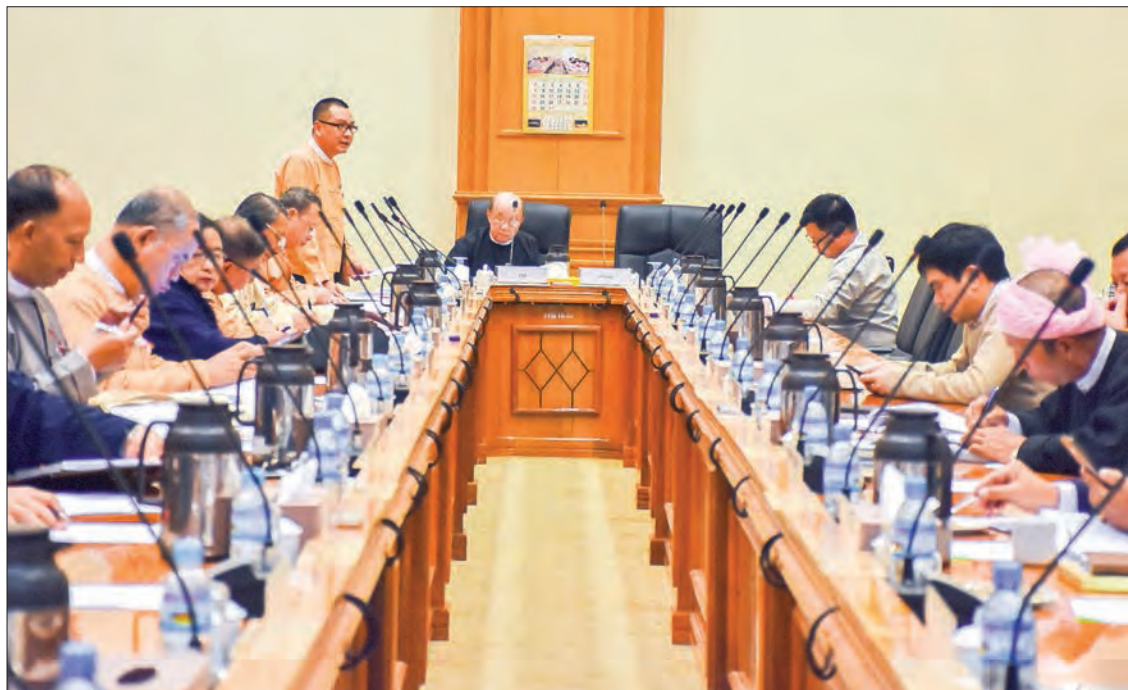
The Joint Committee on Amending 2008 Constitution holds its 67/2019 meeting at Pyidaungsu Hluttaw Building D in Nay Pyi Taw yesterday.