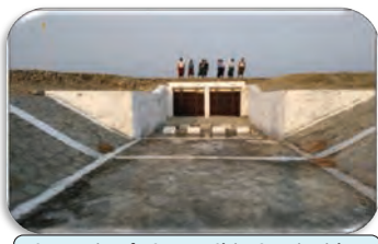
Construction of 2 Concrete Sluice Gates in Minbya Township