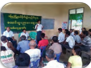
Educational Talk for Farmers in Myaybon Township