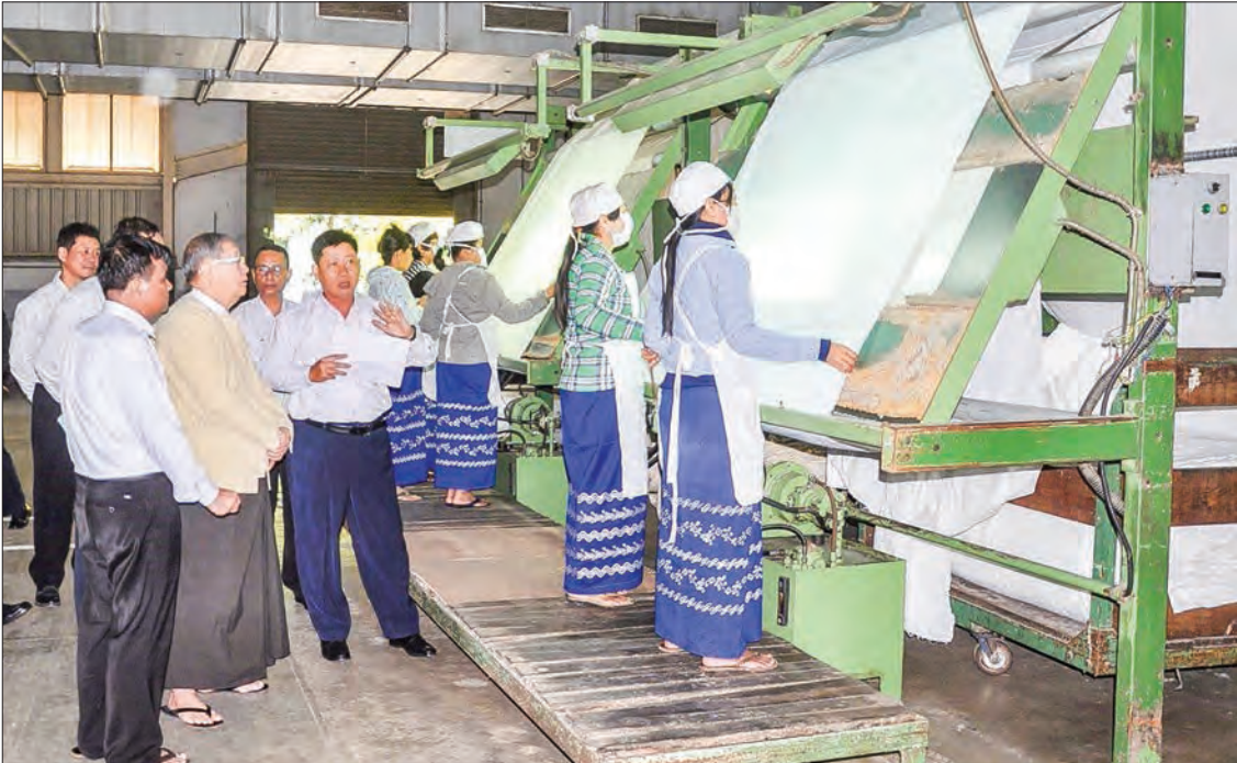
Union Minister for Planning, Finance and Industry U Soe Win and officials inspect the No.1 Garment Factory in Shwedaung Township, Bago Region, on 9 December.

UNION Minister for Planning, Finance and Industry U Soe Win inspected the No.1 Textile Factory in Shwedaung Township, Bago Region, on 9 December morning. The Union Minister heard the reports of factory officer on its history, its operation processes, joint-venture with Japanese company Tsuyatomo Co.,Ltd in dyeing and finishing processes, training programmes supported by the JICA for human resource development. The Union Minister then explained the merger of two ministries for ensuring effective production, and called for manufacturing marketable products, success of joint-venture lines, avoiding environmental damages and full-capacity of factory workers. After leaving the factory, the Union Minister and party visited the No.1 Industrial Training Centre (Sinde). The principal of the training centre briefed on the trainings and staff affairs. The Union Minister discussed generating more skilled workers for the industries, providing teaching aid equipment, conducting modern technologies and trainings of trainers. During the meeting with the trainees, the Union Minister urged them to try hard in learning for the success in their lives and to contribute their participation in state building tasks. In the afternoon, the Union Minister and party inspected No. 16 Heavy Industry (Sinde) and No.23 Heavy Industry (Nyang Chay Htauk), and coordinated the discussions of staff members.—MNA (Translated by Aung Khin)