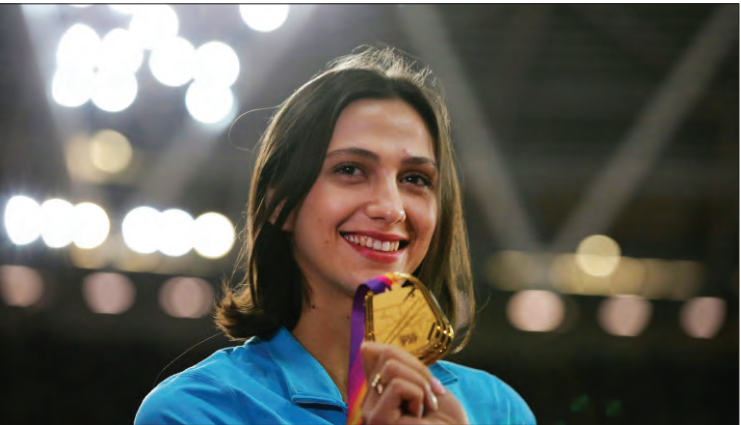
Lasitskene has won three world titles.

she cannot compete under the Russian flag. Lasitskene missed the 2016 Rio Olympics because of the doping crisis and had threatened to leave Russia so as not to miss the Tokyo Olympics in 2020. “The Russian flag was taken from me at the end of 2015,” the 26-year-old wrote, calling herself “an athlete who has a lot of questions”. “Have we done an internal investigation? Who was punished?” Lasitskene said. — AFP