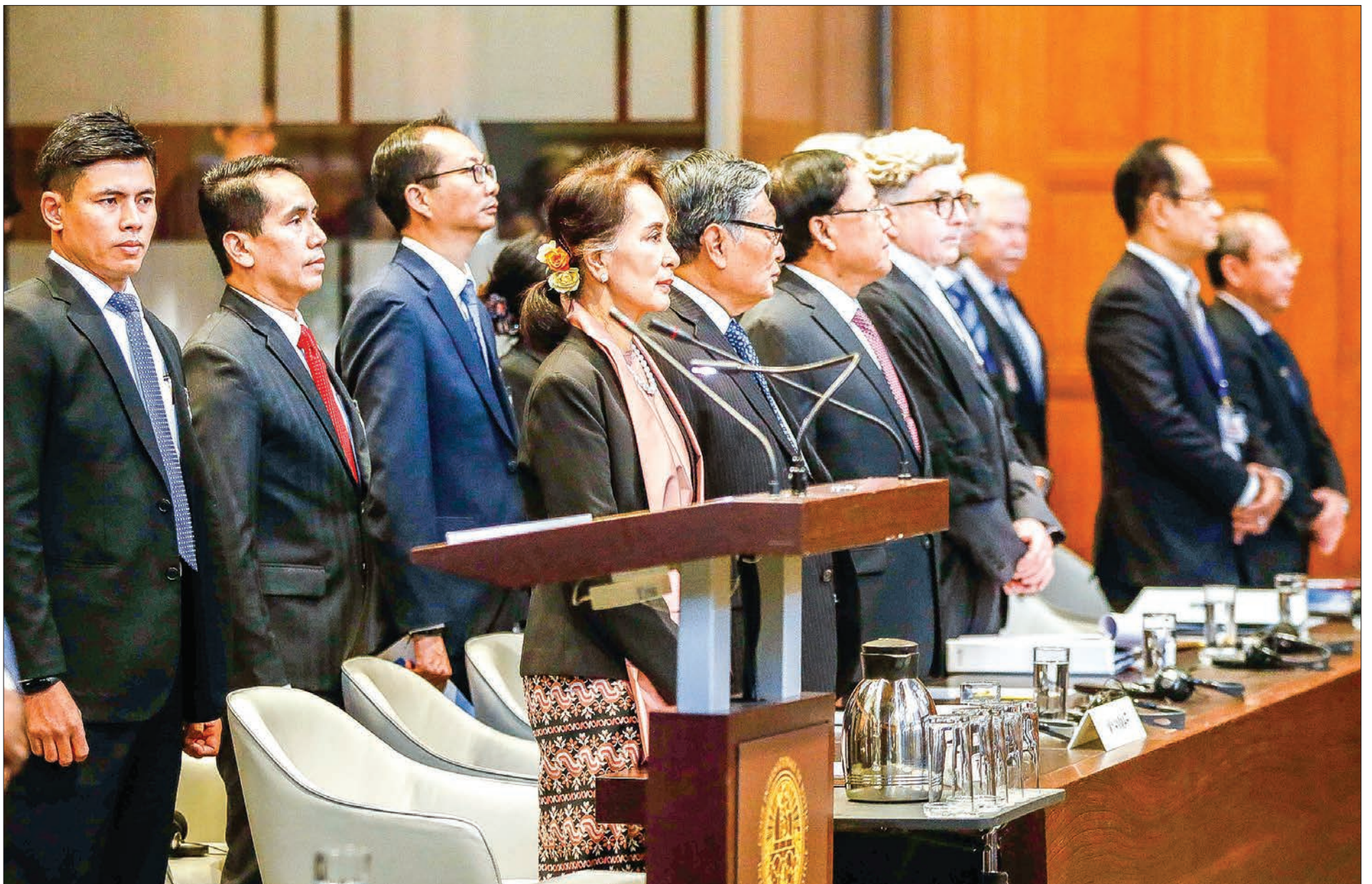
State Counsellor Daw Aung San Suu Kyi attends the first day of hearing at the UN's International Court of Justice at The Hague on 10 December.

S TATE Counsellor and Union Minister for Foreign Affairs Daw Aung San Suu Kyi, attended the International Court of Justice at The Hague, Netherlands, to hear the first oral proceeding of Gambia for