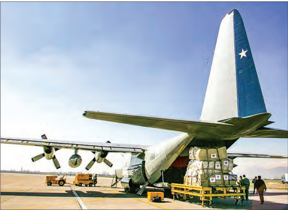
A Chilean Hercules C-130 military transport plane, the same model that has disappeared with 38 people on board.

ing in Drake Passage — a key maritime route between South America and Antarctica frequently hit by some of the world’s worst weather. However, conditions were fine for flying on Monday, Chile’s