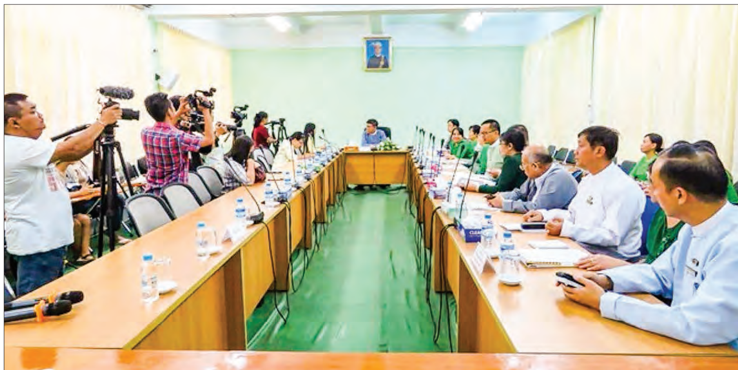
Press Conference on Permitted Enterprises according to Myanmar Investment Commission Meeting (19 / 2019) was held in 2 nd December, 2019 at the office of Directorate of Investment and Company Administration. U Thant Sin Lwin, Director General gave details the facts related to permitted enterprises and endorsement enterprises under Myanmar Investment Law and circulated the Press Statement (19/ 2019). A total of (17) reporters from (16) local and international media attended the press conference.

The permitted foreign investment projects are expected to create up to 20,000 job opportunities for Myanmar