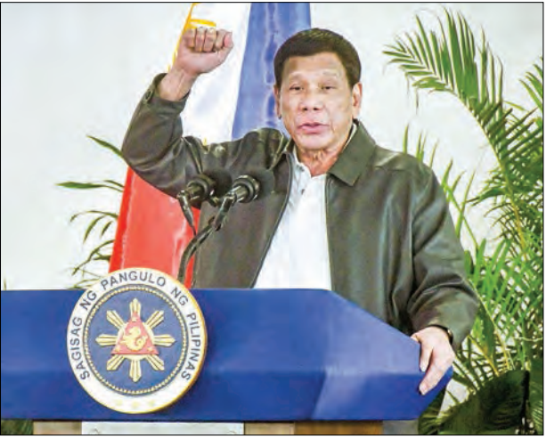
Philippine President Rodrigo Duterte speaks at a press conference in Davao on the country’s Mindanao Island on 6 October 2019.

danao are assured that any incipient major threat in the region would be nipped in the bud,” he said. Duterte declared martial law in Mindanao on 23 May, 2017, after heavily armed fighters with ties to Islamic State occupied areas within the predominantly Muslim city of Marawi. The occupation led to a protracted, six-month battle with government forces, with close to 1,500 people killed in the fighting, counting at least 165 from the government side and at least 47 civilians. Human rights groups have expressed opposition to the continued implementation of martial law in past years, its having been extended twice, citing human rights violations ranging from illegal arrests to extrajudicial killings.— Kyodo News ■