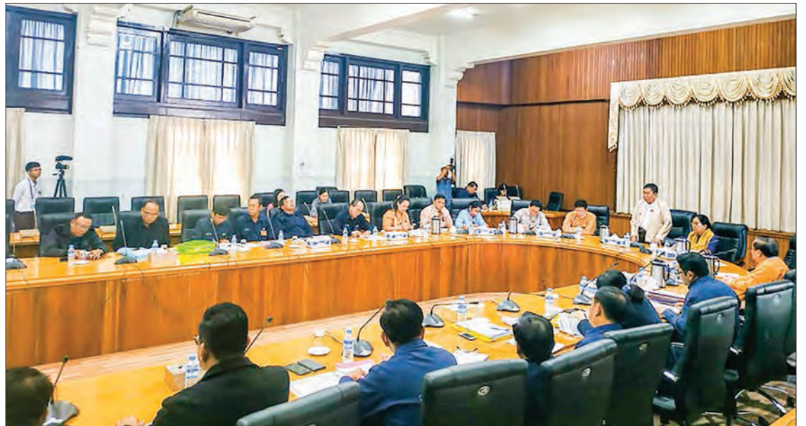
Yangon Mayor U Maung Maung Soe delivers the speech at the Yangon City Development Committee (YCDC) meeting in Yangon.

"Some heads of households perish while staying in such houses, leaving behind the problem of inheritance. The ownership of land and building are not clear in such cases. There are many similar problems. To prevent such cases, the YCDC committee lets them pay fines and apply for ownership. There are two types of fines--pre-construction penalty. But, we do not allow construction without payment of