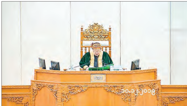
Pyithu Hluttaw Speaker U T Khun Myat.

Questions raised by U Than Lin Lin of Mesei constituency