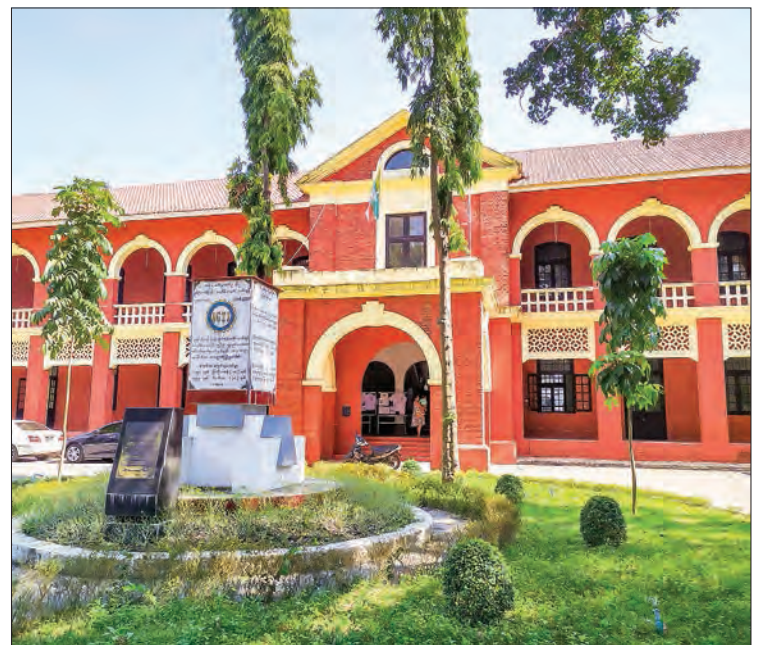
Three Government Technology Institutes (AGTIs) will be opened in this academic year.

Beginning this December, automobile engineering and agriculture farm machinery engineering courses will be opened at Kyaiklat and Wake-ma in Ayeyawady Region and in Shwebo of Sagaing Region, according to the TVET Depart-