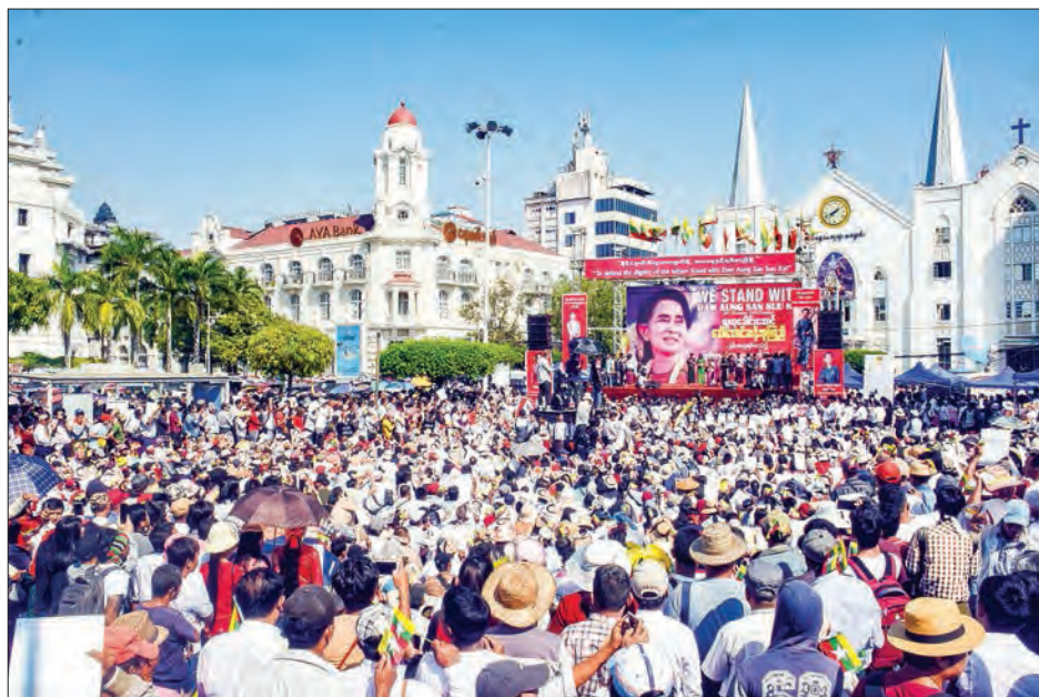
People participate in a rally in support of State Counsellor Daw Aung San Suu Kyi in downtown Yangon yesterday.

U Naing Maung Myint, chairman of the 18 ethnic groups in Mandalay, said: "Mandalay has a long history of showing national spirit, political spirit, and unity. The rally was organized with the collective strength of the