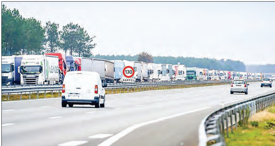
Commuters will struggle to get to work on Monday and more giant nationwide protests are planned for Tuesday.

PARIS—French President Emmanuel Macron will on Sunday meet ministers involved in his radical pension reform which has prompted a nationwide strike and brought key transport services to a standstill.