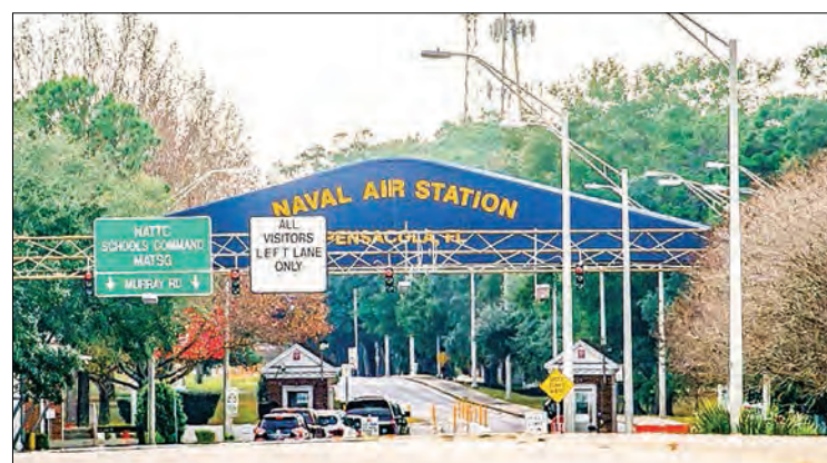
No terror group immediately claimed the deadly attack carried out by a Saudi military trainee at Naval Air Station Pensacola in Florida.

The Twitter account that posted the manifesto -- which also condemned US support for Israel and included a quote from Al-Qaeda’s deceased leader Osama bin Laden -- has been suspended.—AFP ■