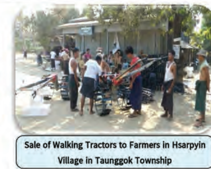
Sale of Walking Tractors to Farmers in Hsarpayin Village in Taunggok Township

During the reporting period, department-owned farm machinery was used to plough 21,887 acres of monsoon paddy and department-owned combine harvester-threshers were used to provide support and assistance in harvesting 2272 acres.