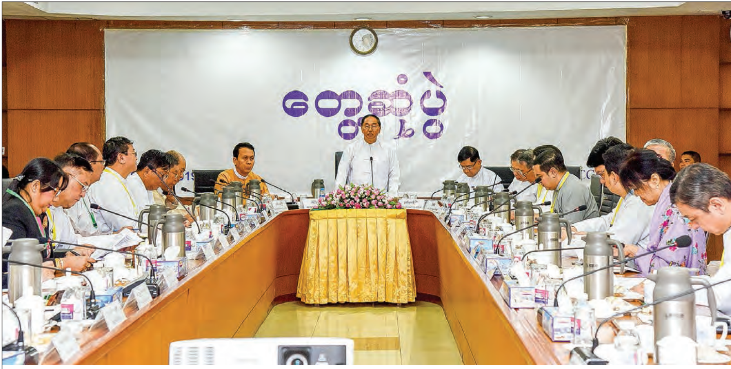
Vice President U Myint Swe addresses the 31 st meeting with Myanmar entrepreneurs at the Union of Myanmar Federation of Chambers of Commerce and Industry office in Yangon yesterday.

T he Private Sector Development Committee held the 31 st meeting with Myanmar entrepreneurs at the Union of Myanmar Federation of Chambers of Commerce and Industry (UMFCCI) office in Yangon yesterday morning.