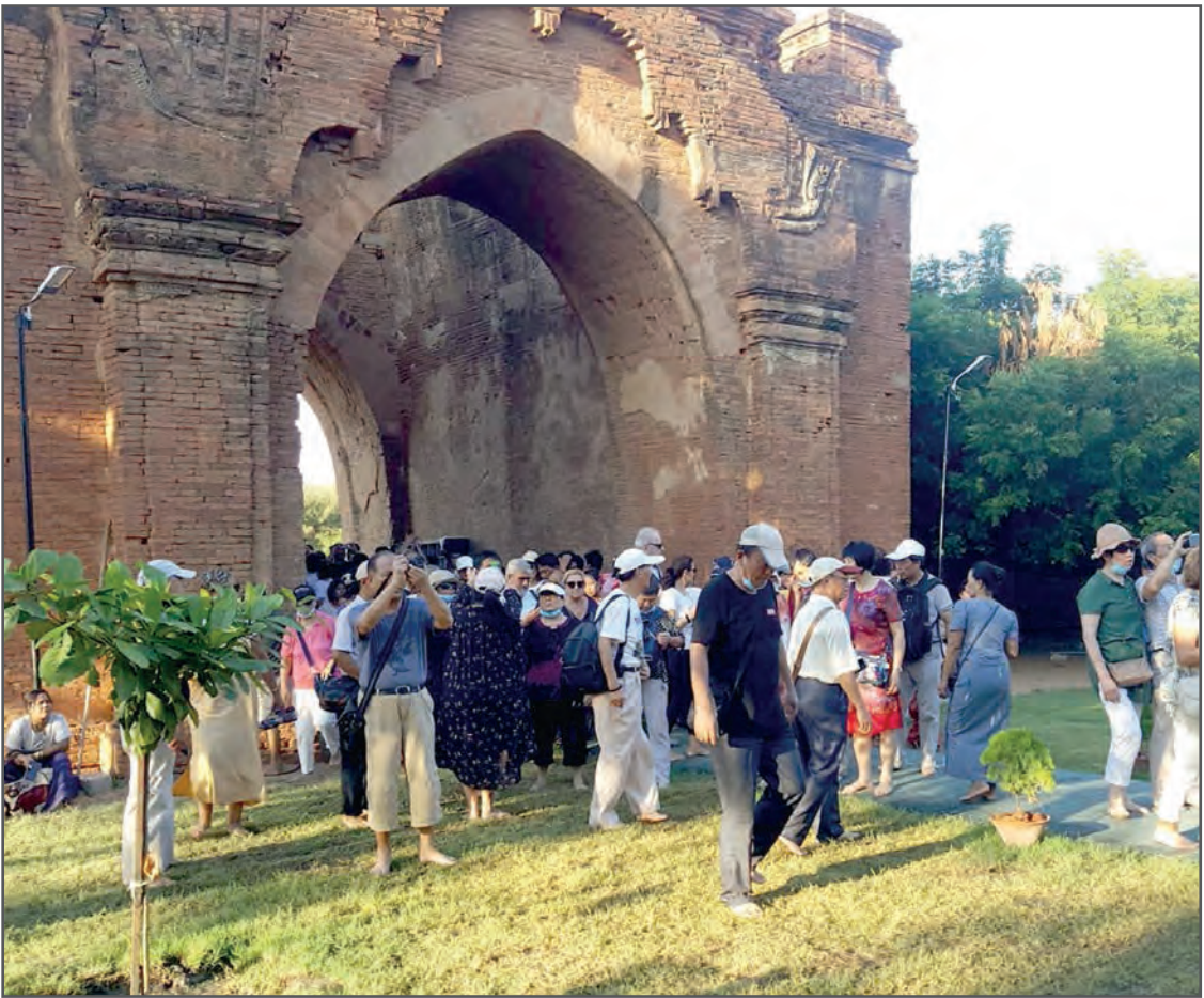
Tourists visit an ancient pagoda in Bagan.