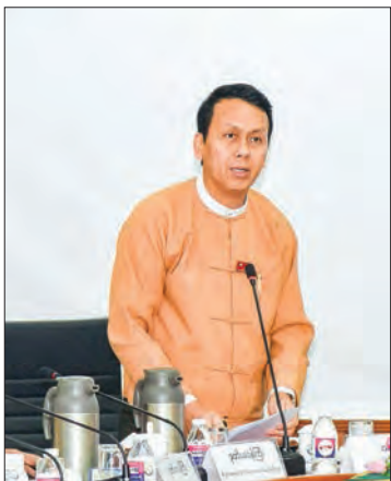
Yangon Region Chief Minister U Phyo Min Thein.