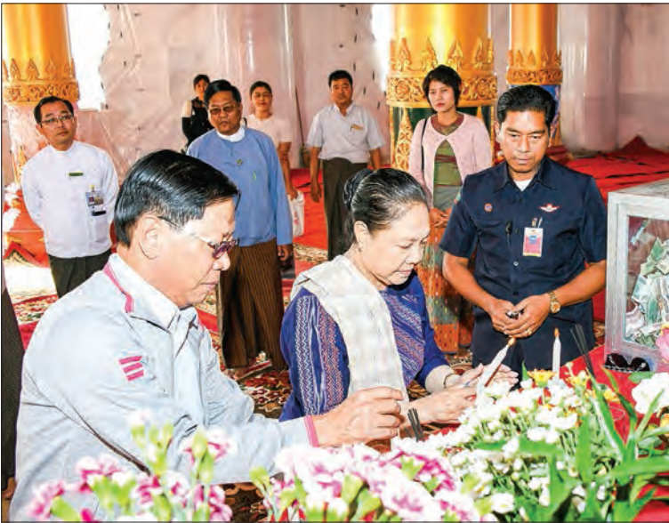
First Lady Daw Cho Cho lights candles in front of Buddha Image at the Eternal Peace Pagoda.