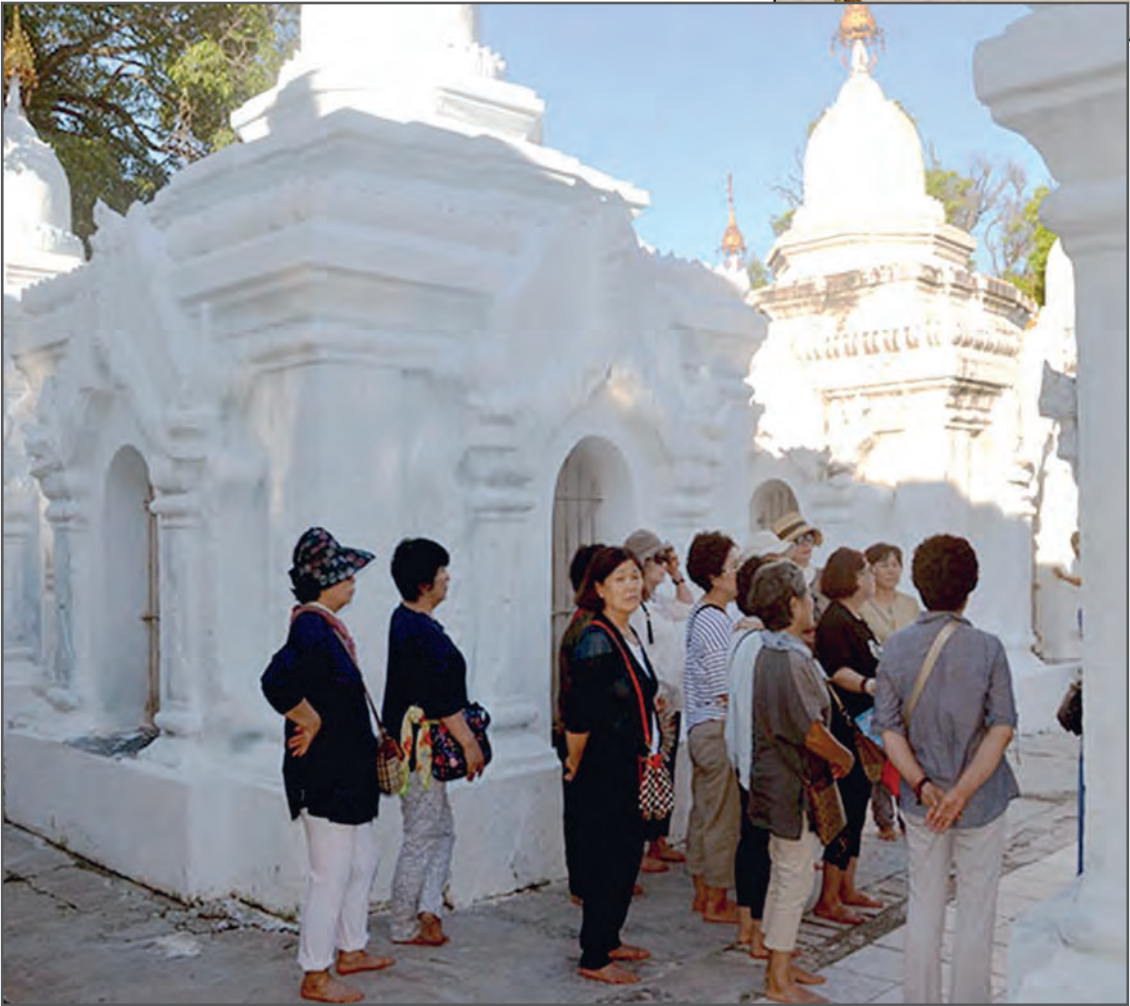
Chinese tourists seen at a pagoda in Mandalay.

ing the biggest source of visitors, according to the statistics from Directorate of Hotels and Tourism (DOHT), under the Ministry of Hotels and Tourism. The total number of international travelers rose around 50,000 when compared to the same period last year. Mandalay Region welcomed 490,000 foreigners in the same period of the previous year.