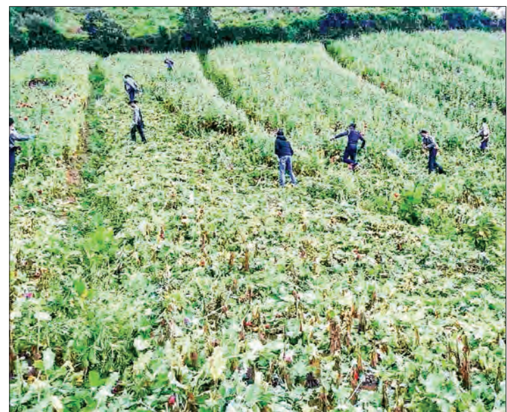
Police destroying the opium plantations in Shan State.