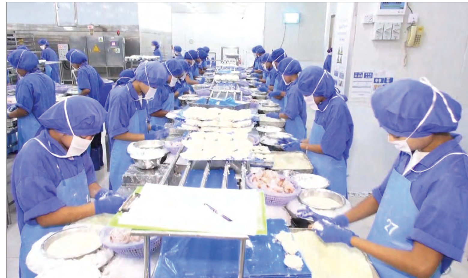
Female workers sorting fish at a cold storage factory.

Browsing the internet for further statistics on investments in Myanmar in the Agriculture, Livestock Breeding & Fishery Sectors, it was surprising to learn that up to now the total number of investments in the sectors were 17 establishments only while that in the Industry