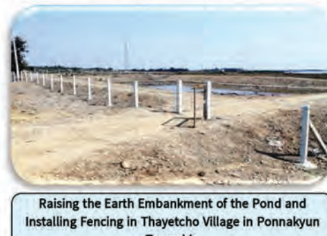
Raising the Earth Embankment of the Pond and Installing Fencing in Thayetcho Village in Ponnakyun Township