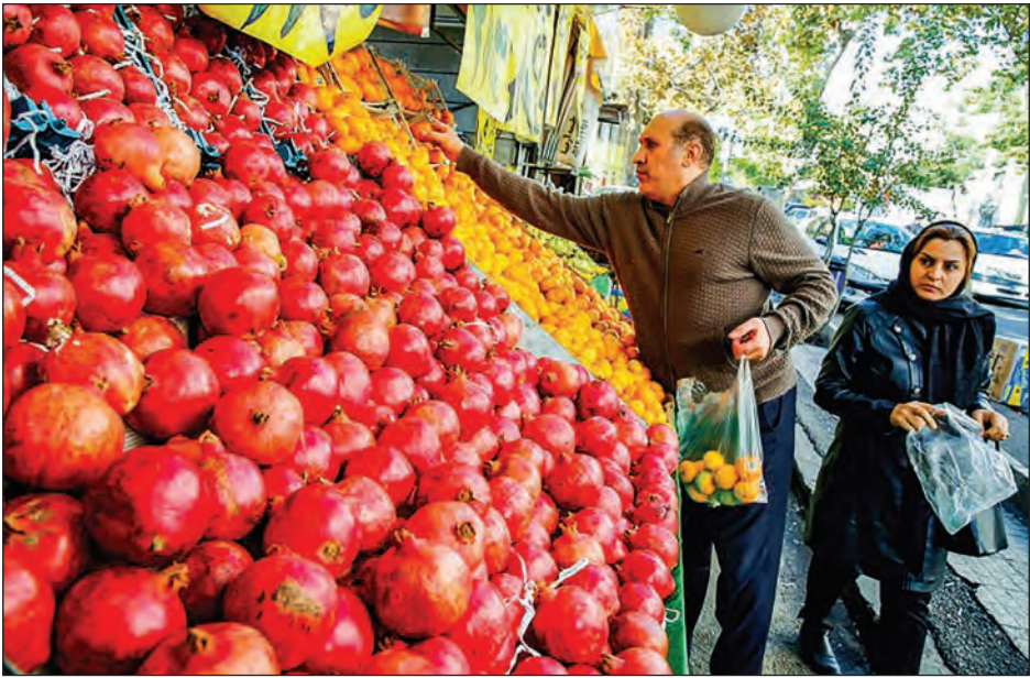
The Islamic republic has suffered a sharp economic downturn this year, with a plummeting currency sending inflation skyrocketing.

TEHRAN—Iran’s President Hassan Rouhani announced Sunday a “budget of resistance” against US sanctions targeting the country’s vital oil sector, backed by a $5 billion Russian investment. Rouhani said the aim was to reduce “hardships” in the Islamic republic where a sharp fuel price hike last month triggered nationwide demonstrations that turned deadly. The US sanctions imposed last year in a bitter dispute centred on Iran’s nuclear programme include an embargo on the oil sector whose sales Washington aims to reduce to zero in a campaign of “maximum pressure”. Iran has suffered a sharp economic downturn, with a plum-