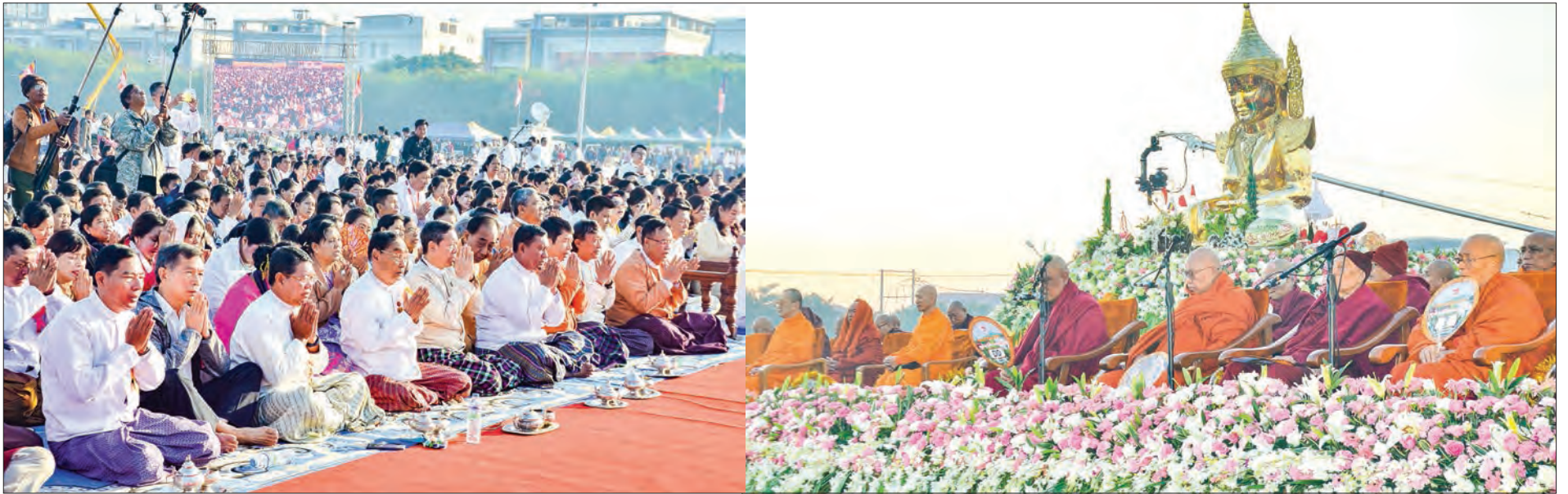
Officials, donors and well-wishers led by Union Ministers Dr Myo Thein Gyi and Nai Thet Lwin attend the third mass alms-giving ceremony for 30,000 monks at the Chanmyathazi Airport in Mandalay yesterday.

SUPERVISED by Mandalay Region Government, Myanmar well-wishers and Thailand's Dhammakaya Foundation jointly organized third mass alms-giving for 30,000 monks at the Chanmyathazi Airport in Mandalay yesterday.