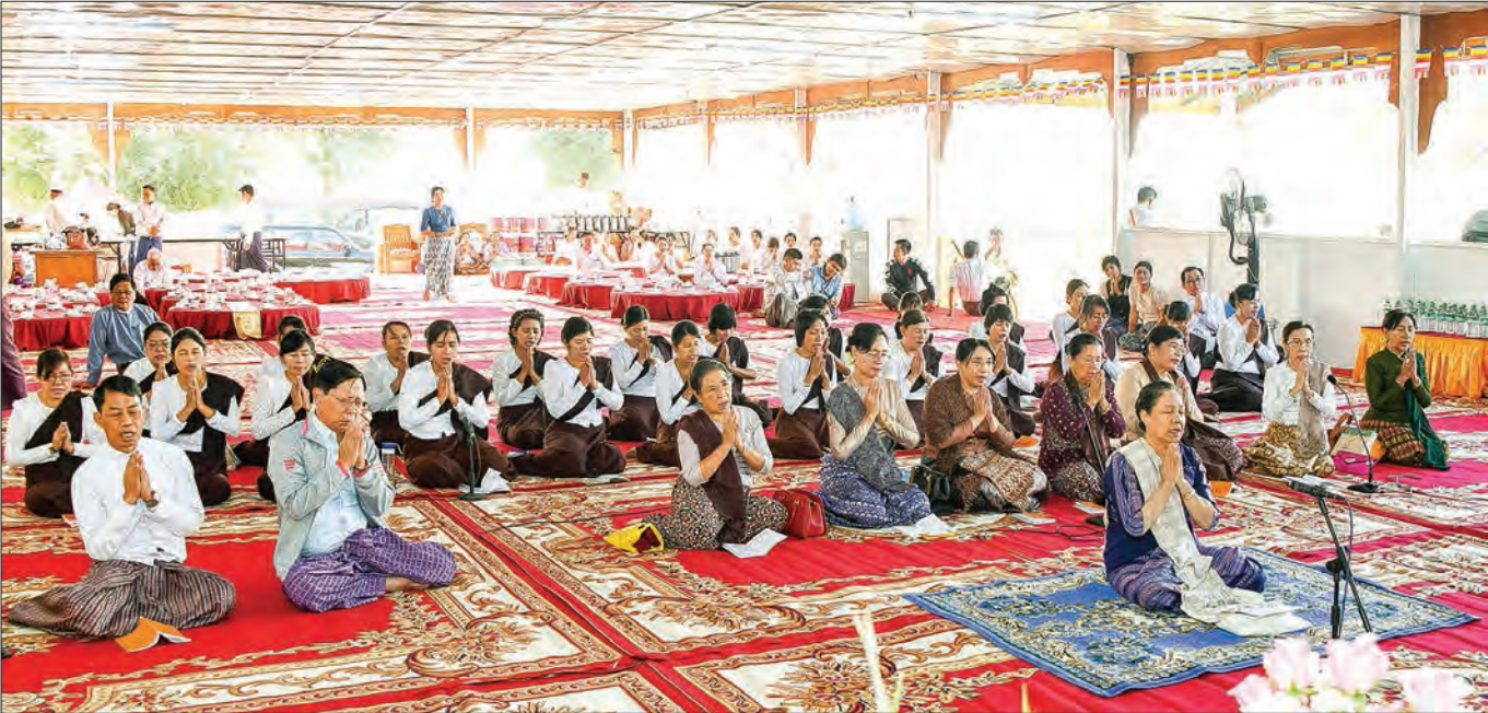
The congregation led by First Lady Daw Cho Cho hold the religious ritual at the Eternal Peace Pagoda.