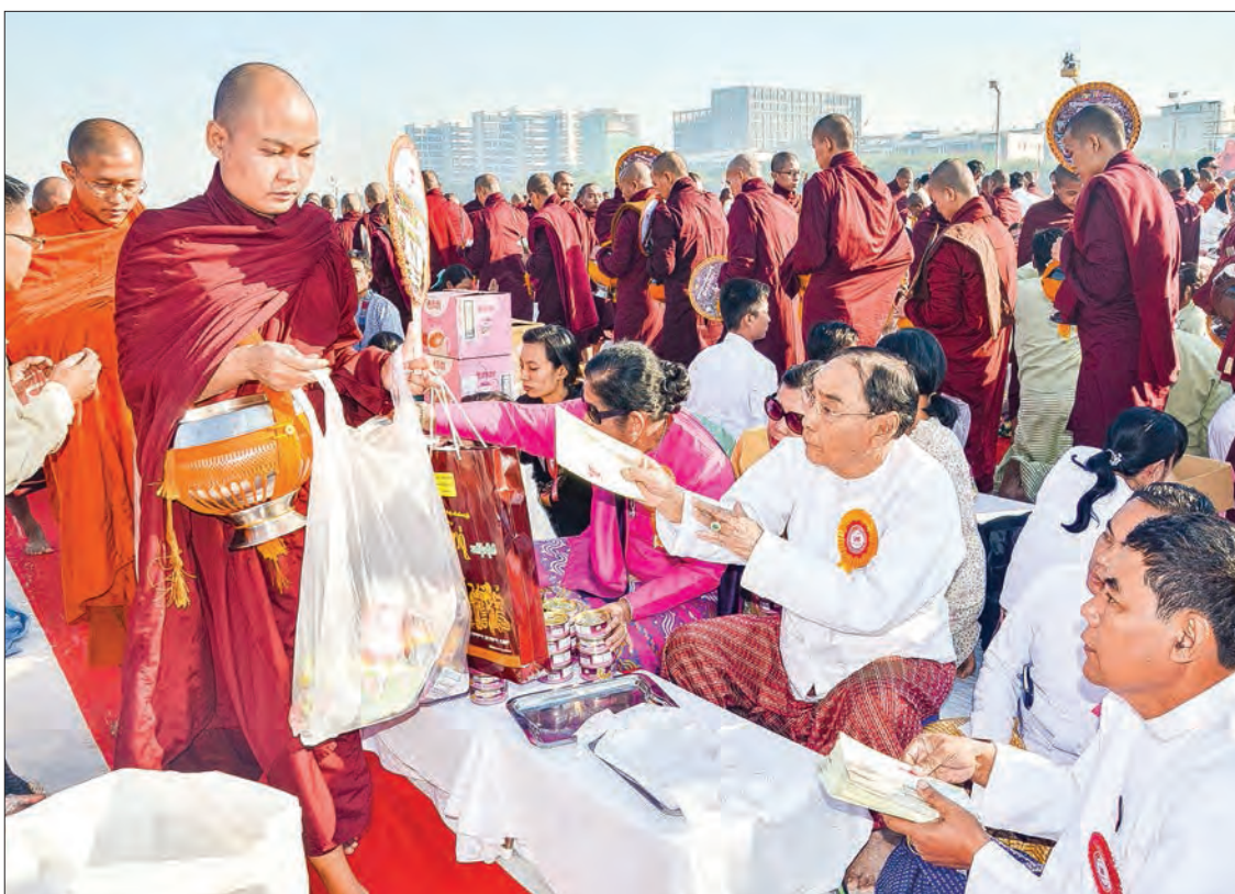
Union Minister Nai Thet Lwin and officials donate offertories to the Members of Sangha at the alms-giving ceremony.

Requisites and donated offertories to the monks.