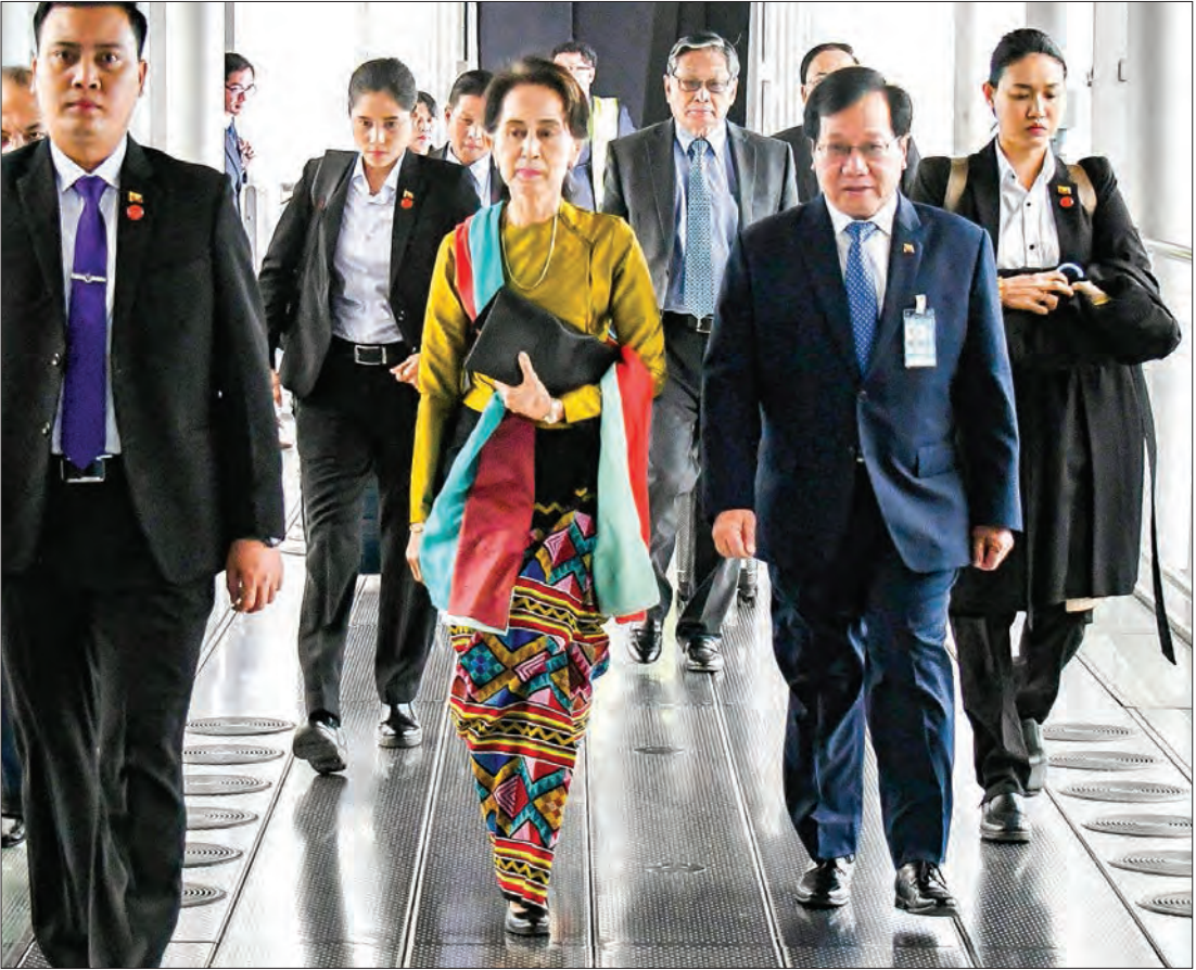
State Counsellor Daw Aung San Suu Kyi welcomed by Myanmar Ambassador to Thailand U Myo Myint Than, and officials at the Suvarnabhumi International Airport in Bangkok yesterday.

Ministry of Foreign Affairs Nay Pyi Taw Dated; 9 December 2019