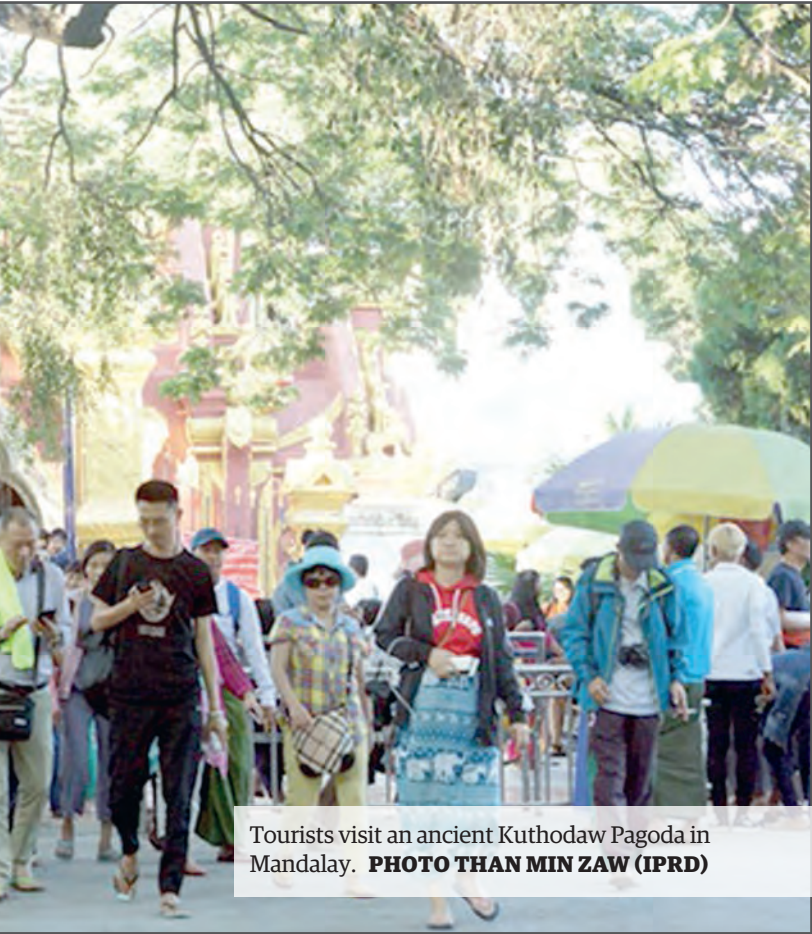
Tourists visit an ancient Kuthodaw Pagoda in Mandalay.