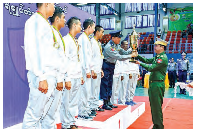
Winners are awarded with trophy at the awarding ceremony.