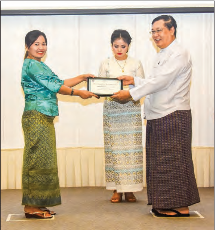
Union Minister U Thein Swe presents the Certificate of Recognition to the official from Shwe Sagar Company Limited.