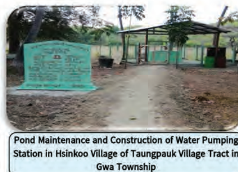
Pond Maintenance and Construction of Water Pumping Station in Hsinkoo Village of Taungpauk Village Tract in Gwa Township