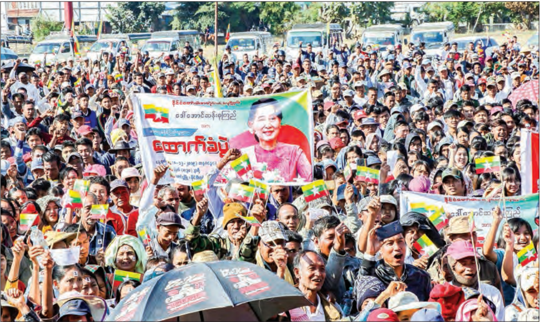
The mass rally in Toungoo supports State Counsellor Daw Aung San Suu Kyi who will contest the case filed by Gambia at the International Court of Justice. PHOTO: MNA

Myo Myint Than and wife Daw San San Maw, Military Attaché (Army, Navy, Air) Brigadier General Khin Zaw, and officials from the Myanmar embassy and the military attaché office at the Suvarnabhumi International Airport.—MNA