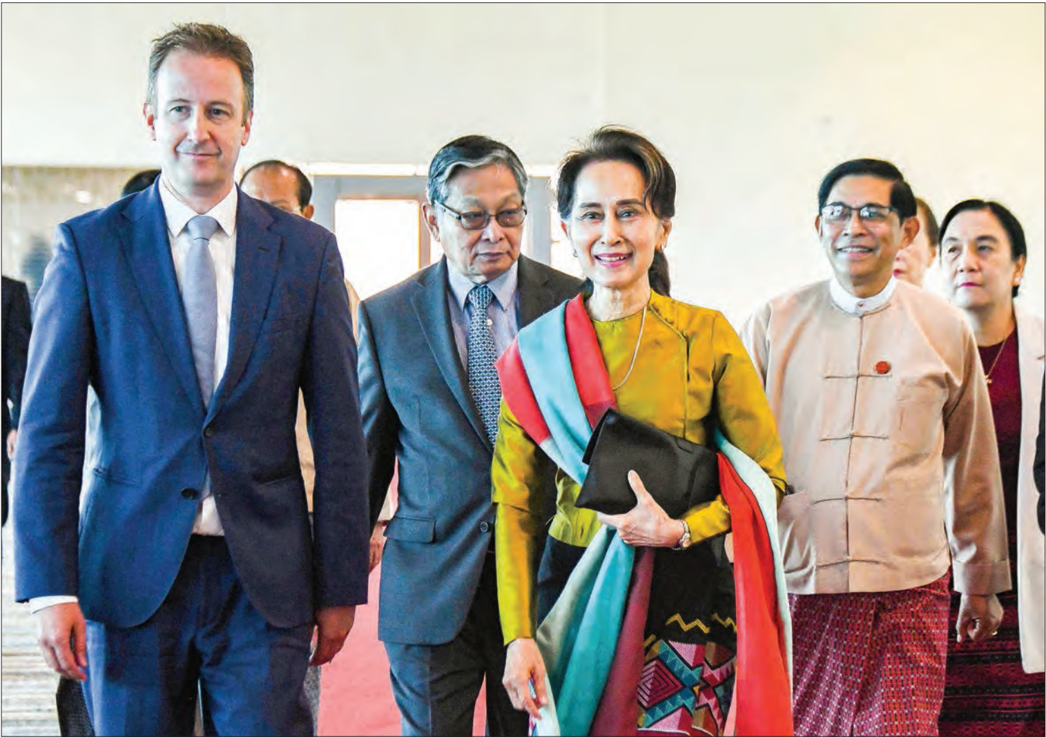
SEE PAGE-3 State Counsellor Daw Aung San Suu Kyi being seen off by Union Minister U Min Thu, officials and Ambassador of the Embassy of the Kingdom of the Netherlands in Myanmar Mr Wouter Jurgens at the Nay Pyi Taw International Airport yesterday.

THE Myanmar delegation led by the State Counsellor and Union Minister for Foreign Affairs Daw Aung San Suu Kyi left Nay Pyi Taw for The Hague, the Netherlands, by a special flight yesterday morning to contest the case filed by Gambia at the International Court of Justice (ICJ). The oral proceedings on the Gambia's report for the indication of provisional measures will take place at the ICJ on 10, 11 and 12 December 2019, respectively. The State Counsellor, in her capacity as the Union Minister for Foreign Affairs will contest this case to defend the national interest of Myanmar at the Court. The State Counsellor and her delegation were seen off at the Nay Pyi Taw international Airport by Union Minister U Min Thu, Nay Pyi Taw Council Chairman Dr Myo Aung and wife, Chief of Myanmar Police Force Police Lt-Gen Aung Win Oo, Ambassador of the Embassy of the Kingdom of the Netherlands in Myanmar Mr Wouter Jurgens and officials.