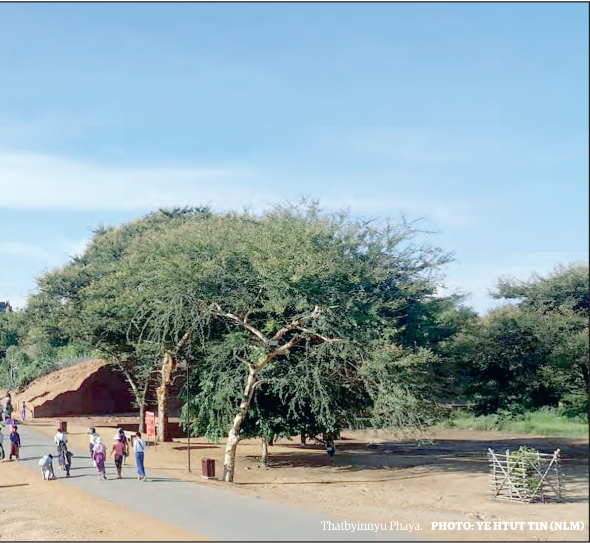
Thatbyinnyu Phaya.