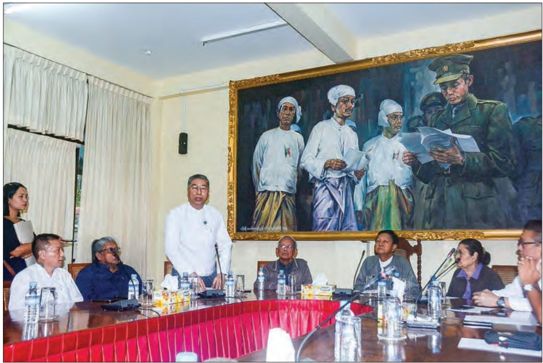
Officials hold the meeting to launch calendar with movie stars showing off fashion trends from four different eras.

The 20” x 30” calendar includes four pages and one cover page. It will be distributed at a cheap price to Myanmar movie lovers. The Myanmar Motion Picture Organization will mark its 100th anniversary on 13 October, 2020. The calendars are