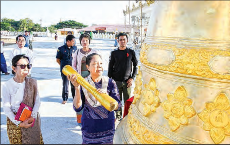
First Lady Daw Cho Cho strikes the Great Bell at the Eternal Peace Pagoda in Nay Pyi Taw yesterday.

kapavattana Sutta, chanting of Maha Pathana Pali, cultivation of Metta (Loving-kindness) and sharing merits. The ceremony was aimed for success, protection and safety of the State Counsellor in her defence at the ICJ.