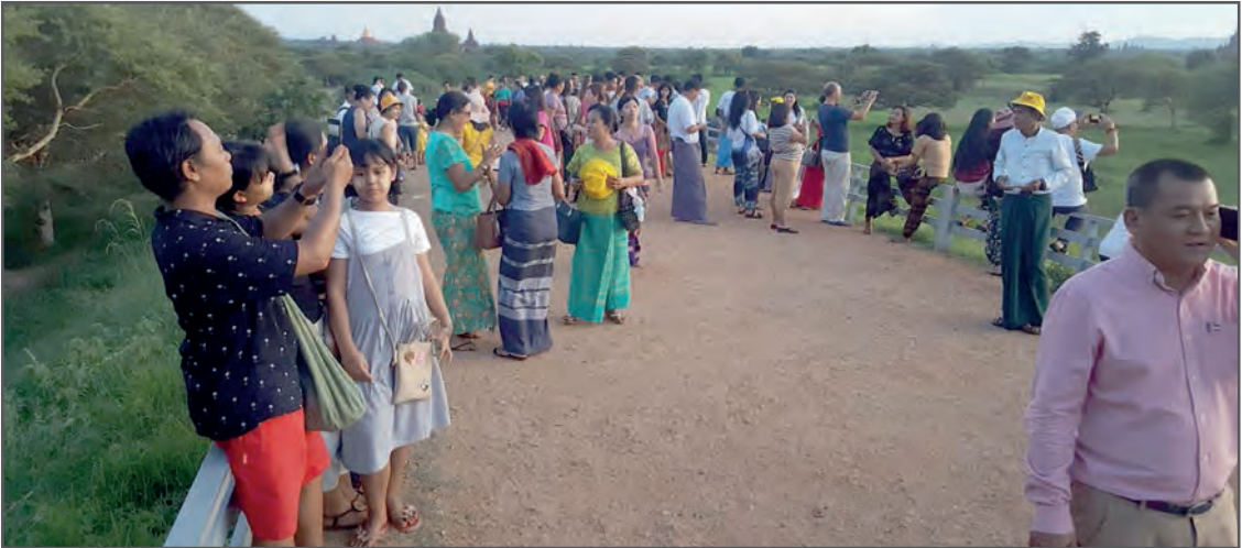
Tourists enjoy in sunset at the Bagan.