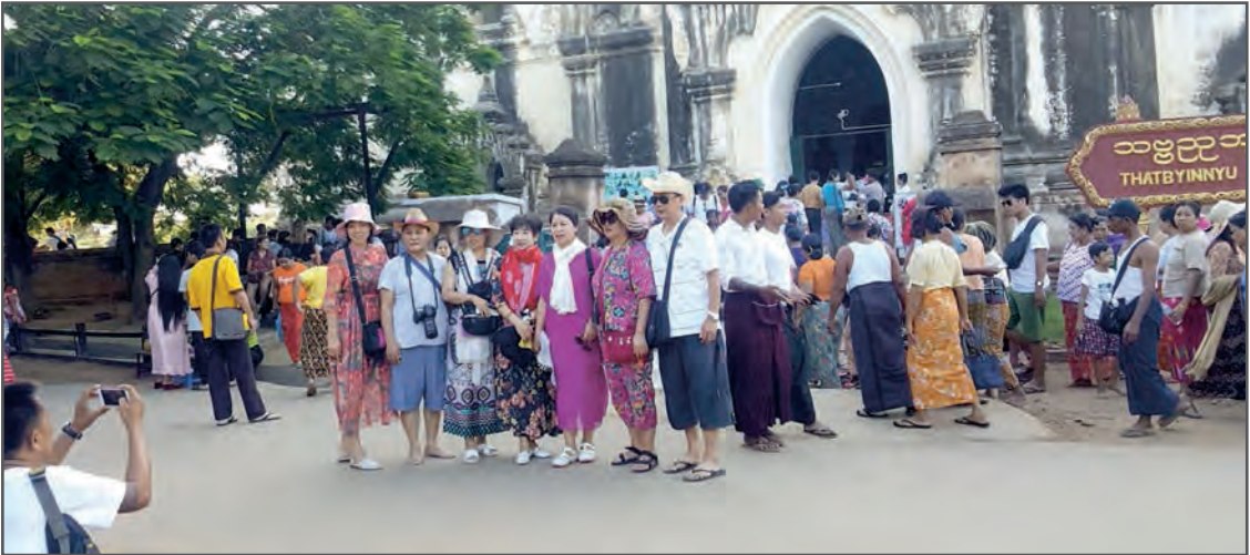
Chinese tourists pose for photo at Thatbyinnyu Pagoda.

“Arrival of Chinese visitors and travellers from some countries that Myanmar has given visa free entry saw a boost significantly,” he said. Arrival of Chinese tourists to Myanmar is up by nearly 70 per cent than previous year thanks to Myanmar’s visa-on-arrival allowance to visitors from six more countries commencing 1 October last year. Due to the sharp inflow of Chinese visitors to Myanmar this year, Myanmar authorities are exerting efforts to further expand travel routes and promote the tourism industry by attracting global airlines to the country. About 20 international airlines expanded operations in Mandalay Region with new routes. “Now the number of Chinese airlines operating in Mandalay Region has increased to 16. In addition, other domestic airlines expanded flight operations in Mandalay Region. So the number of foreign visitors to Mandalay Region via TadaU International Airport grew by 102 percent