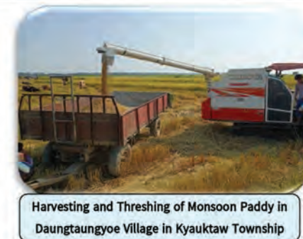
Harvesting and Threshing of Monsoon Paddy in Daungtaungyoe Village in Kyauktaw Township