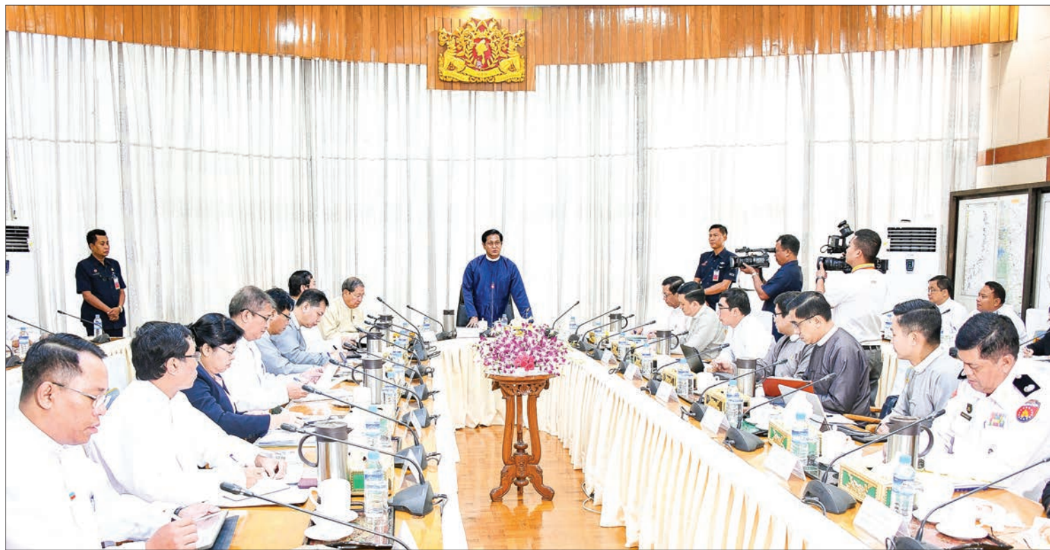
Vice President U Henry Van Thio delivers the speech at the third meeting of Digital Economy Development Committee in Nay Pyi Taw yesterday.

Developing a digital economy is more than just establishing new tech companies or producing software and hardware for sale. It involves adapting or employing digital technology to existing sectors such as agriculture, livestock, manufacturing and SMEs. It also encompasses promoting digital literacy among the public in order to facilitate better use of information and technology, said the Vice President.