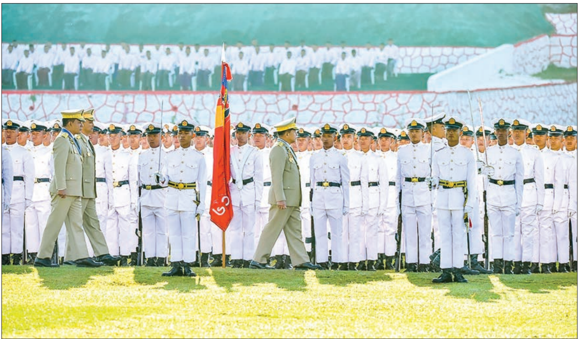
Senior General Min Aung Hlaing inspects graduation parade of the cadets of 61 st Intake of the DSA in Pyin Oo Lwin.

der their command. He said they must be physically fit, skilled in their relevant sector, brave and continually self-improving. The Senior General said that the Tatmadaw upholds the three tasks of non-disintegration of the nation, ethnic solidarity and perpetuation of sovereignty as the pinnacle of national policies, and to carry out their assigned tasks even at the cost of sacrificing one's own life. He said as the Tatmadaw was formed from among the various ethnic races of the people, they must protect the livelihood of all citizens and ensure their daily safety. The Senior General said that while the nation has all the natural resources essential for a country, it still needs resources to ensure peace and the long armed conflicts in the country have to be quelled completely to establish a modern, developed and united country. He said the Tatmadaw is working not just for immediate peace, but for everlasting peace and stability. He said the peace