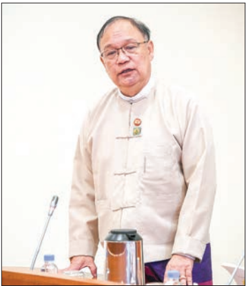
Union Minister U Thant Sin Maung.