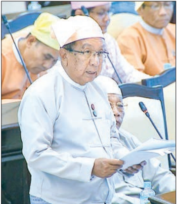
Union Minister for Construction U Han Zaw.

The meeting starts with question and answer session