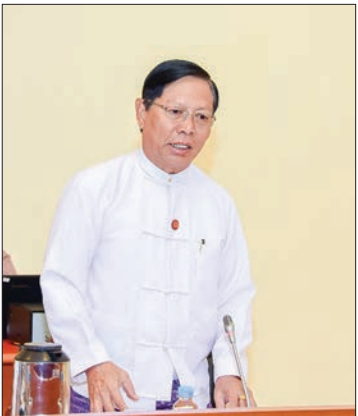
Union Minister Thura U Aung Ko.

dia in November and during the call, Mr Hun Sen expressed his willingness to operate a direct air-link between the two famous ancient cities of Bagan and Siem Reap. The new air link is not aimed at just development of tourism but also for strengthening the friendly relations between Myanmar and Cambodia, said the vice president.—MNA (Translated by Kyaw Zin Lin)