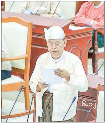
Deputy Minister for Education U Win Maw Tun.

THE 14 th regular session of Second Amyotha Hluttaw held its 12 th -day meeting yesterday and approves Myanmar Geoscience Council Bill.