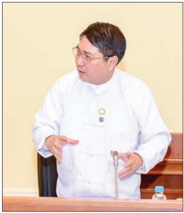
Deputy Minister U Khin Maung Win.