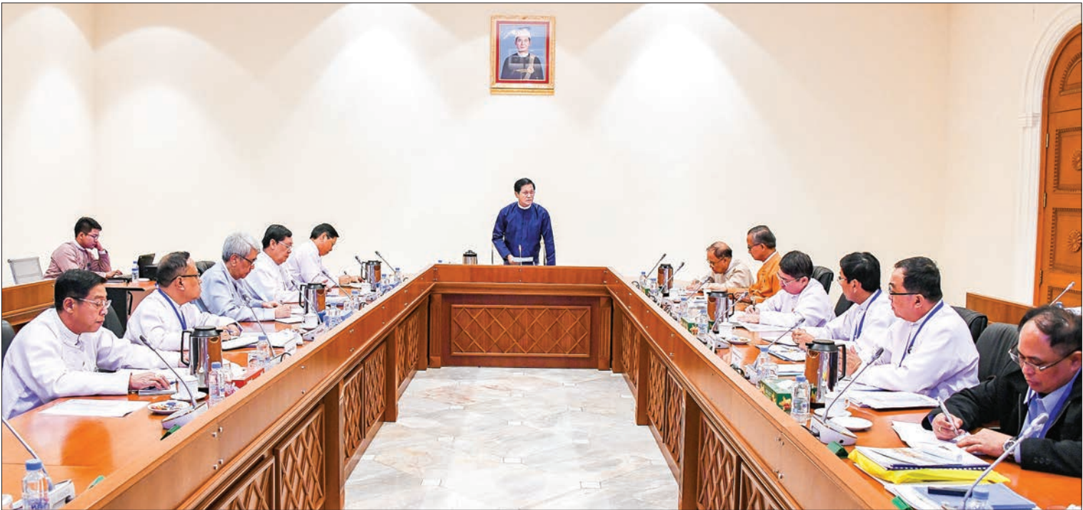
Vice President U Henry Van Thio delivers the speech during the National Tourism Development Central Committee meeting in Nay Pyi Taw yesterday.

When the Cambodian deputy prime minister visited Myanmar