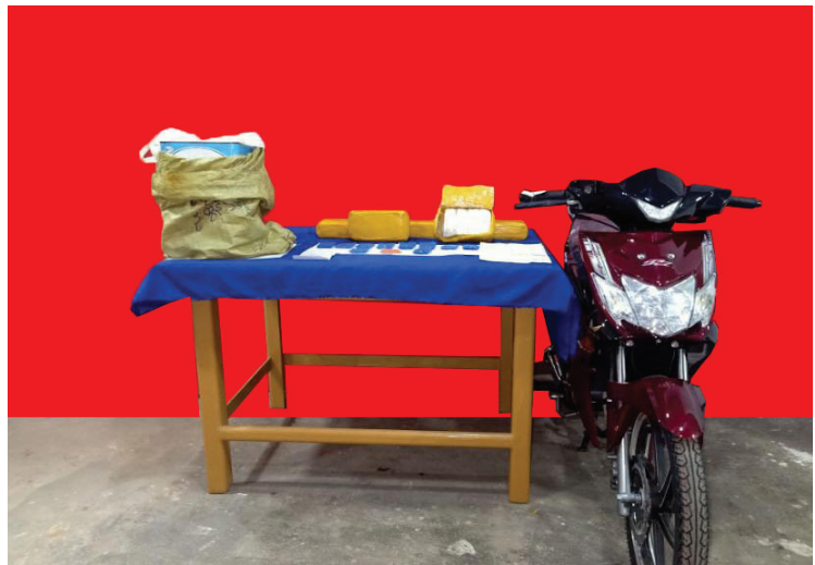
Photo shows seized stimulant tablets and a vehicle and a motorcycle in Nawngkhio.

police searched him as he was suspected of connecting with the two motorcycles with drugs found at the terminal. Similarly, a local police in Nawngkhio searched a bus and found 49,962 stimulant tablets from a bag in the bus and also seized a motorcycle which is connected with the case. Action has been taken all suspects under the Narcotic Drugs and Psychotropic Substances Law. —GNLM (Translated by Kyaw Zin Lin)