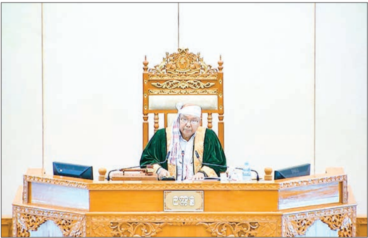
Amyotha Hluttaw Speaker Mahn Win Khaing Than.

Questions raised by U Kyaw Than of Rakhine State constituency 10 on plan to repair Sonny Khin (Kalakari) embankment in Rakhine State, Kyaukpyu Township; U Khin Maung Latt of Rakhine State constituency 3 on plan to allocate 20 per cent or appropriate percentage of tax income from fishery blocks in offshore Rakhine State toward development of fishery sector in Rakhine State and