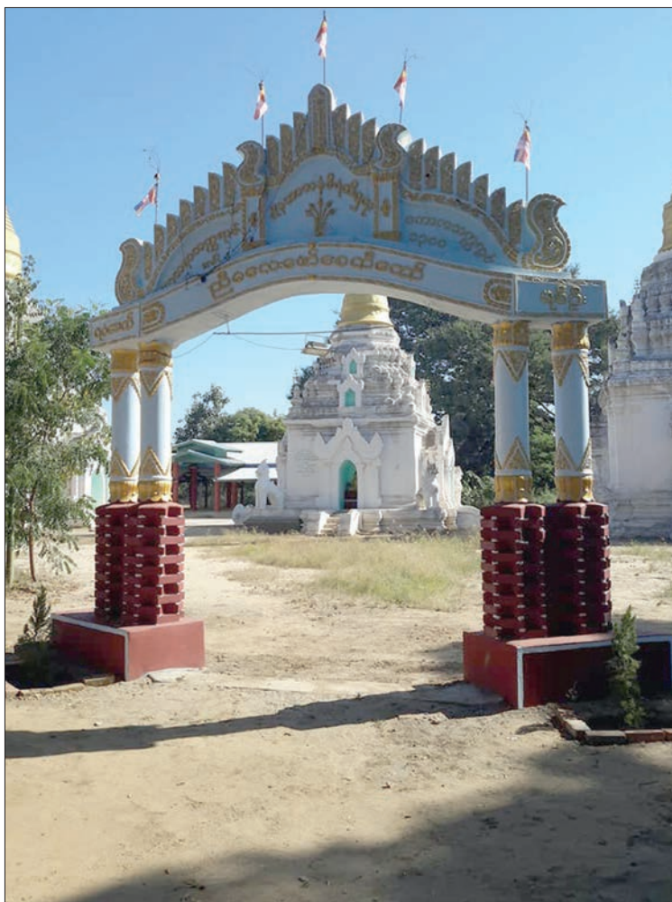
The entrance to the Four-Sister Pagoda.

King Swa Saw Ke who came onto the throne in Inwa in 1368 AD ordered his brother Pyay governor Saw Yan Naung to build seven monasteries made of magnolia, one of which was located in Myitchay. It was built in 1394 AD, and the land for religious purpose was set four square miles. Some assumed the monastery made of magnolia donated by King Swa Saw Ke was the currently damaged Tawshwe Monastery, two