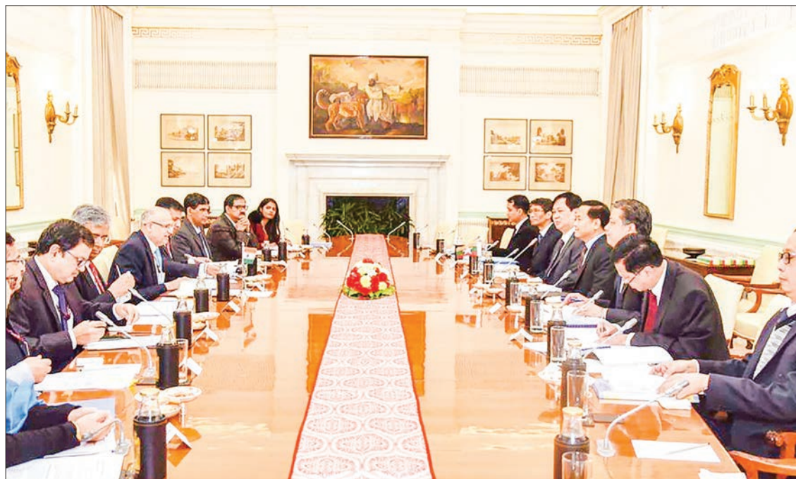
Permanent Secretary of the Ministry of Foreign Affairs U Soe Han and Foreign Secretary of the Ministry of External Affairs of India Mr Vijay Gokhale attend the 18 th round of Myanmar-India Foreign Office Consultations (FOC) at the Hyderabad House in New Delhi on 6 December 2019.

At the Foreign Office Consultations, both sides cordially discussed a wide range of matters pertaining to the promotion of bilateral relations and cooperation, exchange of high level visits, boundary matters and border cooperation, security and defence cooperation, development of ongoing projects in Myanmar, trade and commerce matters, implementation of agreements and Memoranda of Understanding signed between