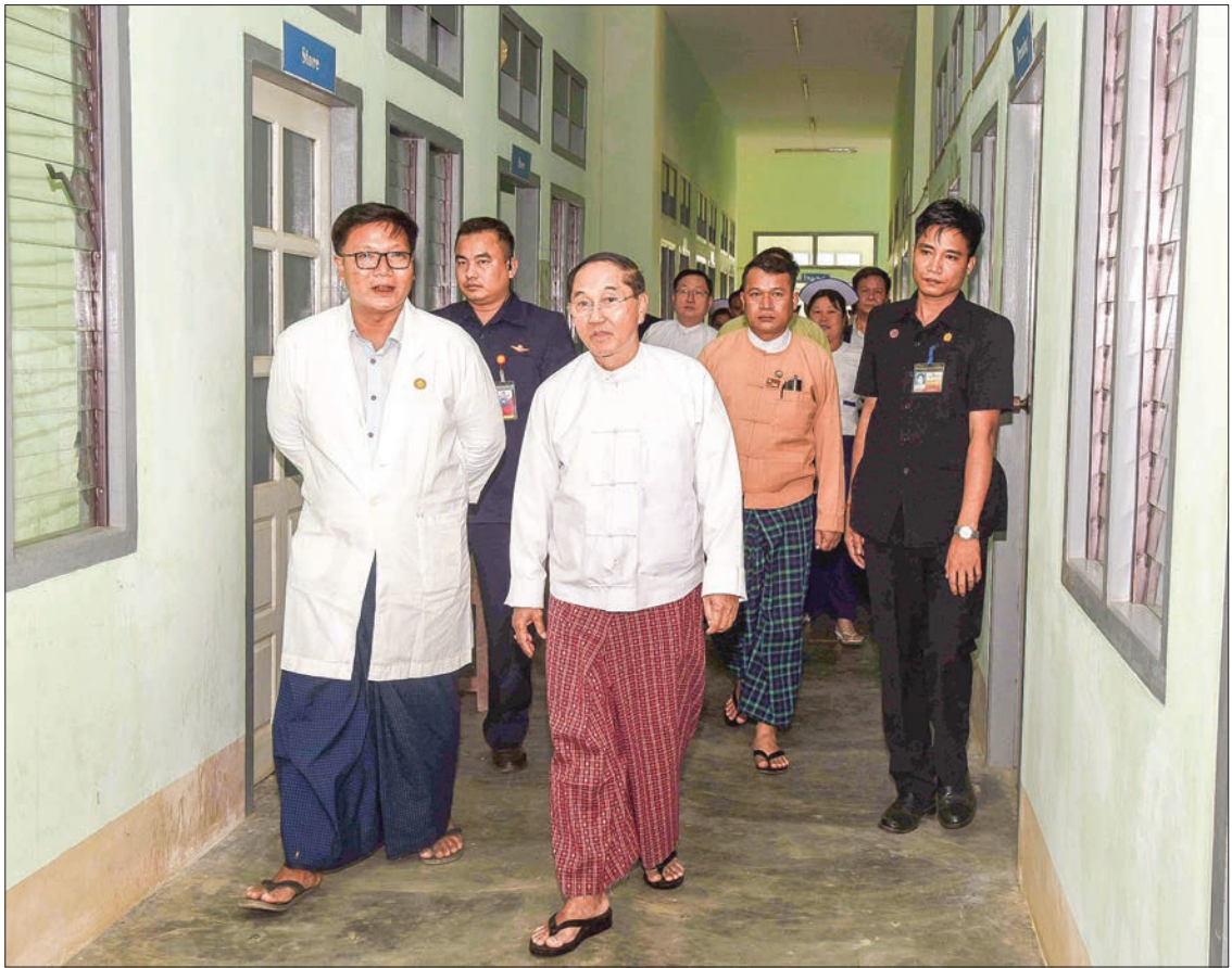
Vice President U Myint Swe visits the 16-bed Mawtaung cottage hospital in Taninthayi Township, Myeik District yesterday.