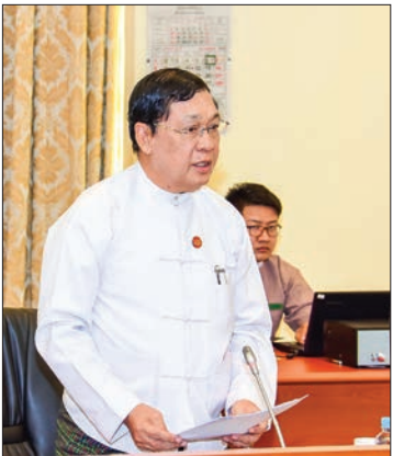
Union Minister U Thein Swe.