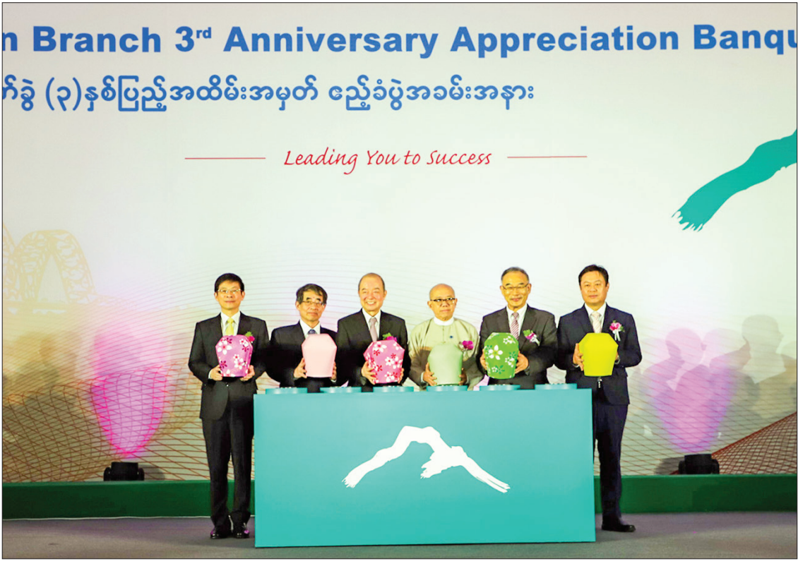
An event to mark the 3 rd anniversary of E.SUN Bank (Yangon branch) held in Yangon yesterday.

Chinese Taipei and Myanmar. After setting up a representative office in Yangon in 2013, E.SUN Bank helped local banks improve their financial management standards. E.SUN was the only Chinese Taipei bank permitted by the Central Bank of Myanmar in 2016 to establish a branch in Myanmar. As part of the third-anniversary celebrations, the Yangon branch of the bank organized a symposium on 'Anti-money laundering (AML) and countering the finance of terrorism (CFT)' to explore the latest international trends on those fronts. Currently, E.SUN Bank operates 28 overseas branches in nine countries or areas.