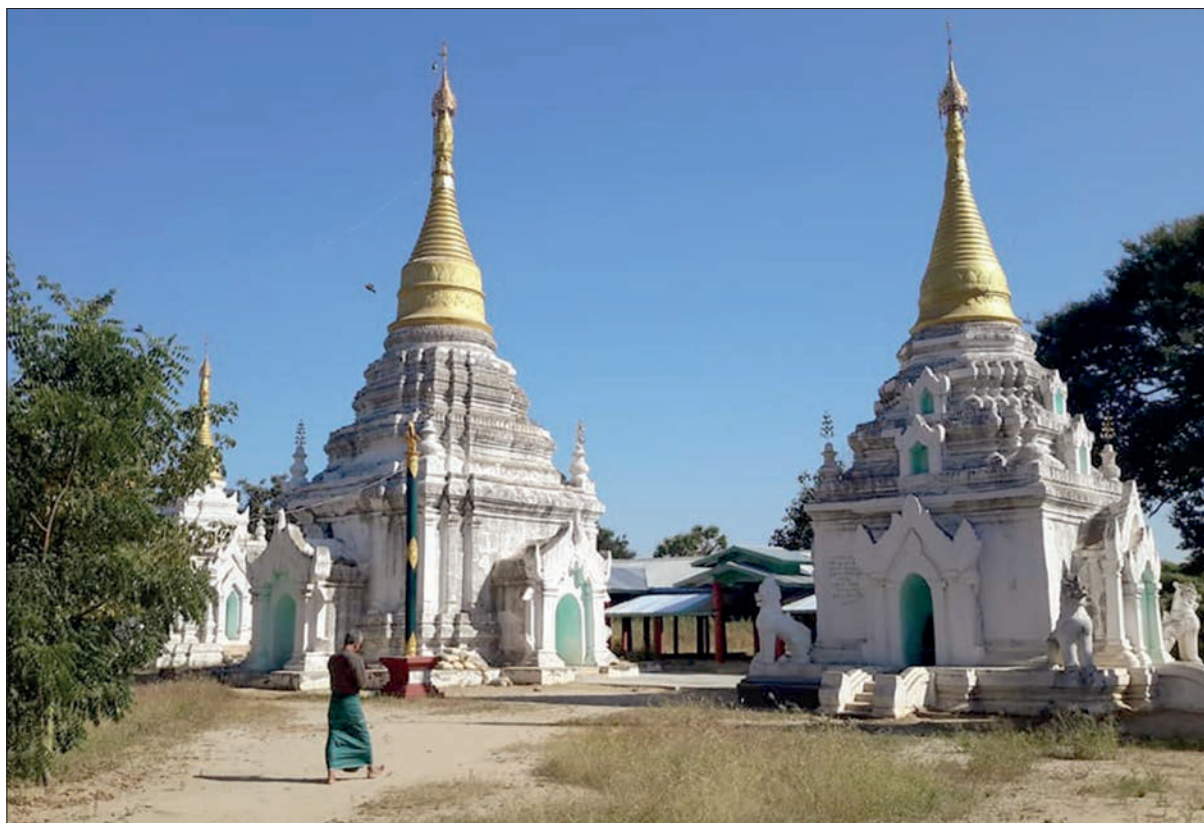
The Four-Sister Pagoda.