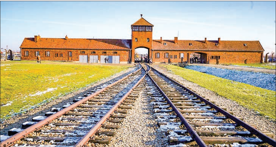
Merkel will become only the third German chancellor ever to visit Auschwitz.

She also hailed a new 60-million-euro ($66-million) donation for the