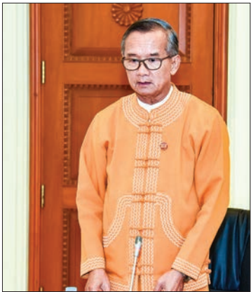
Union Minister U Ohn Maung.