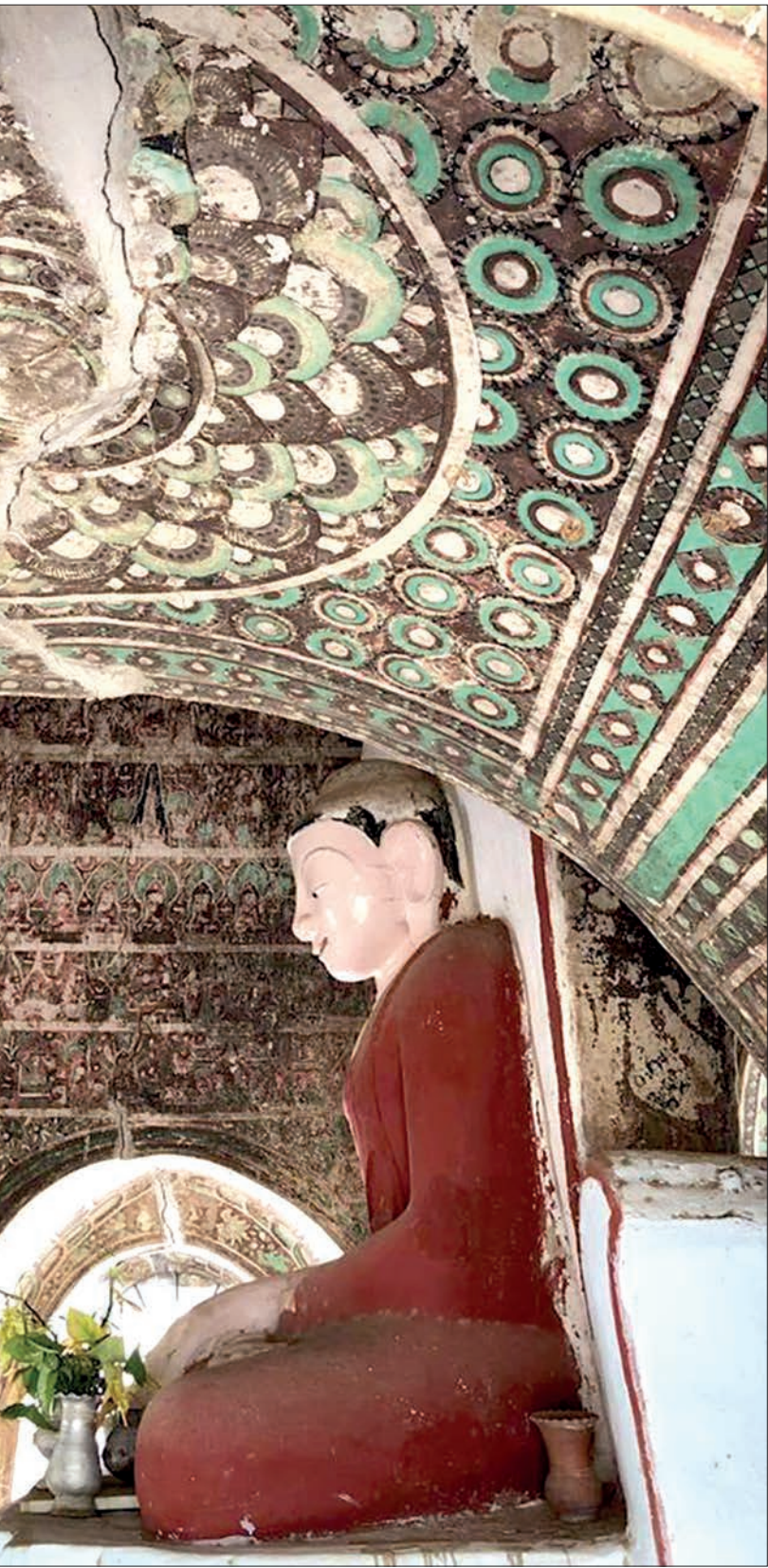
Nyaungyan era mural paintings.

Vesantara, Nemi and Temiya Jatakas. Moreover, mural paintings showed the hells related to Temiya and Nemi Jatakas.