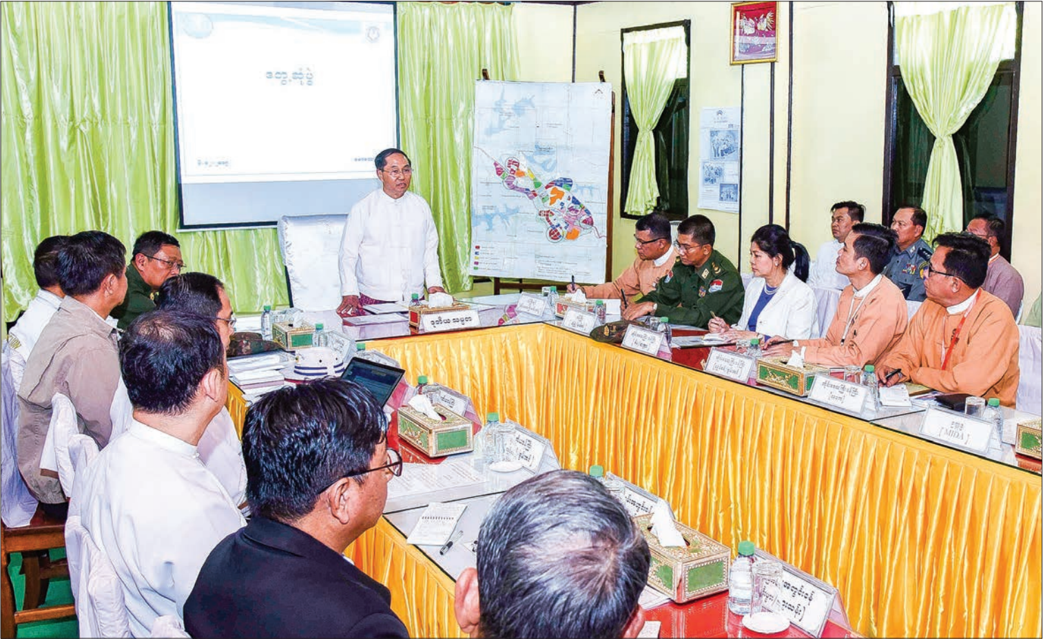
Vice President U Myint Swe delivers the speech during the meeting with the officials at the Mawtaung border trade centre in Taninthayi Township, Myeik District, yesterday.